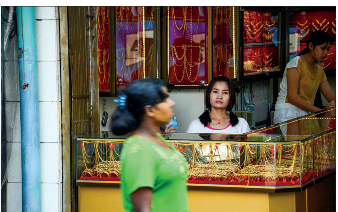
A woman walks past the gold jewellery outlet in Yangon.

preneurs Association (MGEA) sold over seven visses of pure gold at the special price within two weeks beginning 19 June to stabilize the gold price.