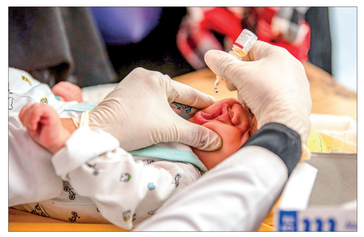
A Yemeni infant receives a polio vaccination during a home visit by health workers as part of an immunization campaign in Yemen's third city of Taez, on 19 February 2022.

WHO chief Tedros Adhanom Ghebreyesus agreed, describing the fresh data as "encouraging".