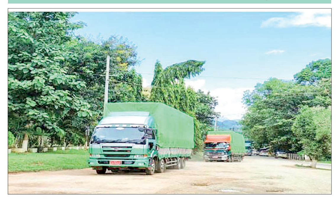
The photo shows trucks lining to pass the border checkpoint near Chinshwehaw.

MYANMAR conducted trade worth US$291.393 million with the neighbouring country China through the Chinshwehaw border between 1 April and 7 July of the current financial year 2023-2024, comprising exports worth $68.2 million and imports worth $223.182 million, the statistics released by the Ministry of Commerce