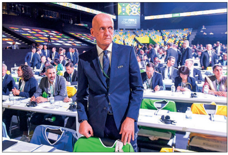
Chairman of the FIFA committee Pierluigi Collina attends the 73rd FIFA Congress in Kigali, Rwanda, on 16 March 2023.

MATCH officials explaining VAR decisions live to stadiums and television audiences for Women's World Cup games will make