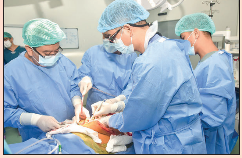
The operation of the third liver transplant in progress yesterday. \\

The liver transplant surgery for the remaining pa-