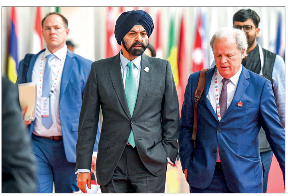
World Bank chief Ajay Banga (C) leaves after attending the G20 Finance Ministers, Central Bank Governors (FMCBG) and Finance & Central Bank Deputies (FCBD) meetings, at the Mahatma Mandir in Gandhinagar on 17 July 2023.

South African Finance Minister Enoch Godongwana