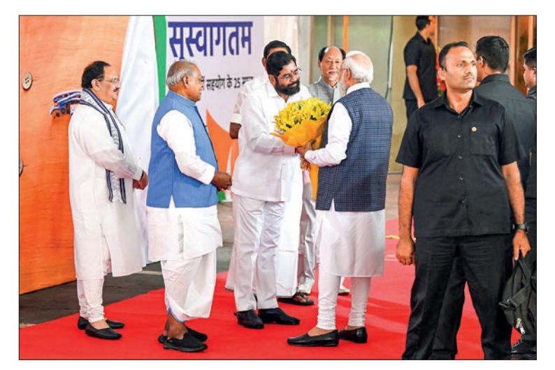
Indian Prime Minister Narendra Modi (C, right) is welcomed by Chief Minister of Maharashtra Eknath Shinde (C) and other leaders, upon his arrival for the National Democratic Alliance meeting organized to mark the completion of nine years of the government under Prime Minister Narendra Modi in New Delhi on 18 July 2023.