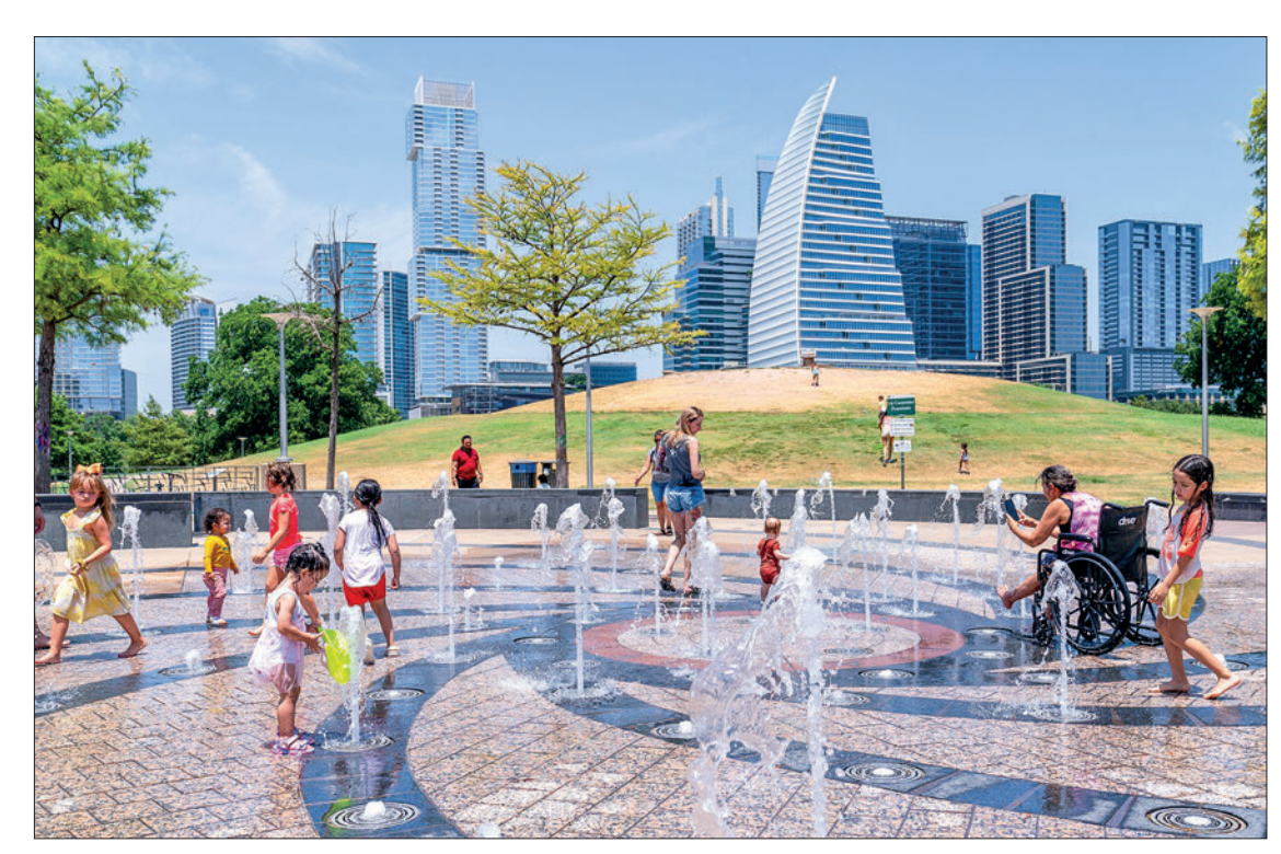
Residents cool off in the Liz Carpenter Splash Pad at Butler Park on 16 July 2023 in Austin, Texas, during a heat wave.