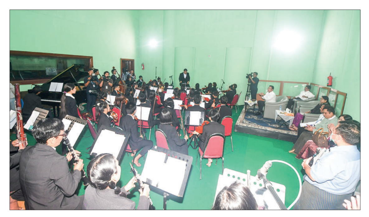
Union Minister U Maung Maung Ohn views and listens to the practice session of the orchestra at MRTV (Yangon) yesterday.

The Union minister then highlighted the needs regarding the uniforms of the band, necessary practices to be more