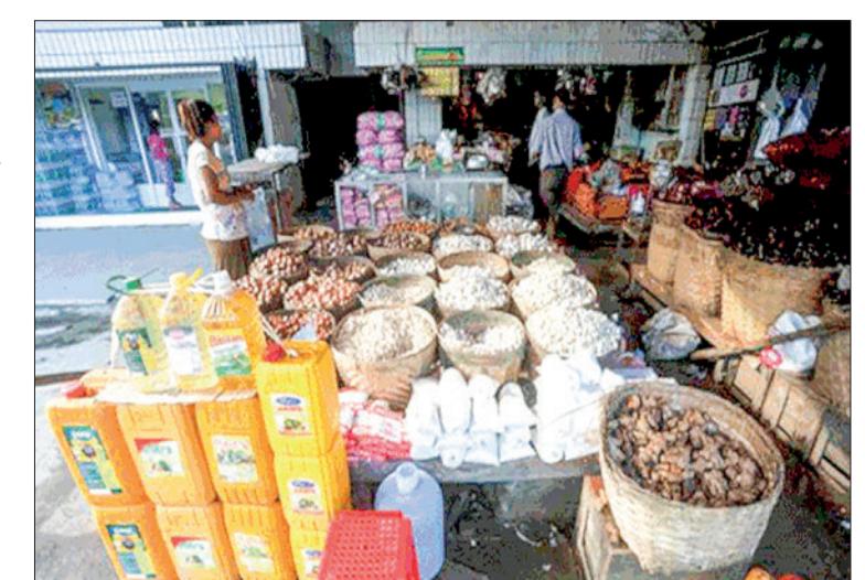
The photo shows a retail outlet for dry groceries.

For a week from 17 to 23 July 2023, the wholesale ref-