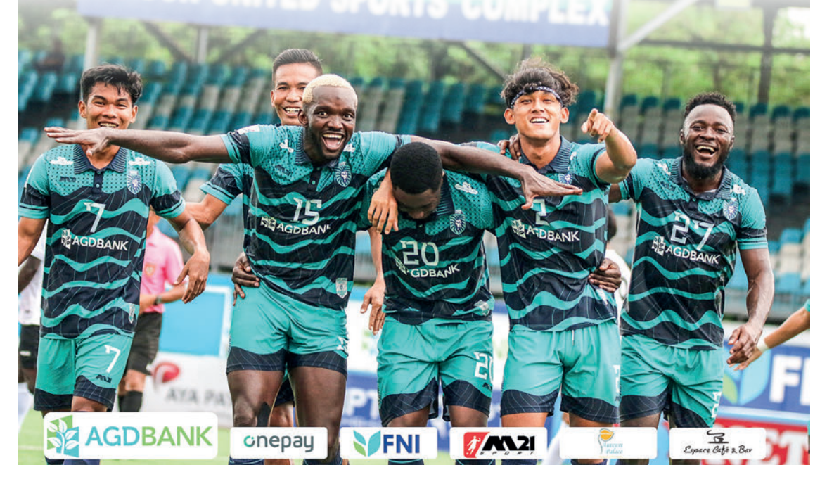
Yangon United players are seen celebrating happily after MNL match against GFA at their home stadium on 18 July 2023.

Yangon United is currently standing in second place after 12 plays, 10 wins, one draw, and one loss, with 31 points, and the team will face Myawady FC at Thuwunna Stadium on 24 July. — KZL