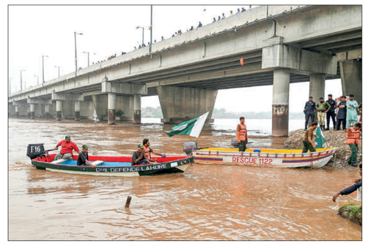
Pakistan's civil defence rescue workers monitor the flood-affected river Ravi in Lahore on 16 July 2023.

It said the floods were worsened by India's decision to release more water into downstream areas in Pakistan after torrential monsoon rains that killed more than 90 people. "We want to go home and start fixing the damage. But they keep telling us that more rains are coming," Muhammad Farooq, another villager who had been evacuated, told AFP. - AFP