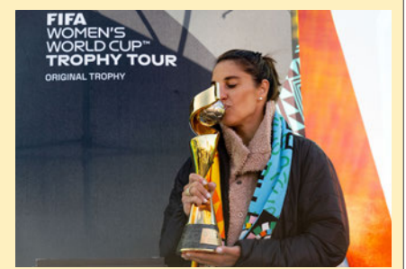
Former US football player Carli Lloyd poses with the Women's World Cup trophy during a trophy promotion event in Wellington on 14 July, 2023.