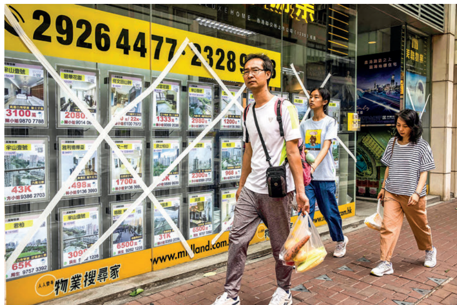
People walk past a store window marked with masking tape as a precaution as Typhoon Talim passes near Hong Kong on 17 July 2023.

The primary issue was their skill set requirements, with 74 per cent of companies saying they were unable to find people with the right skills at the right price and 64 per cent saying there are fewer qualified ready-to-hire candidates in the market, the newspaper cited a report by Talentnet Corporation and Mercer. — Xinhua