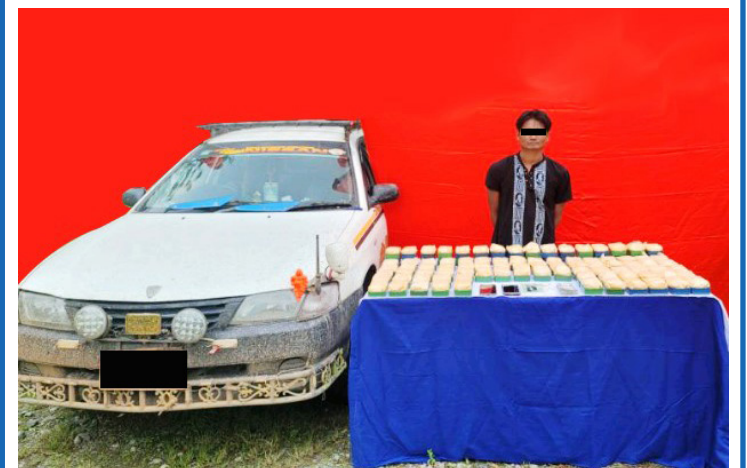
An arrestee is pictured along with seized drugs and a vehicle.

The offenders have been prosecuted under the Narcotic Drugs and Psychotropic Substances Law.