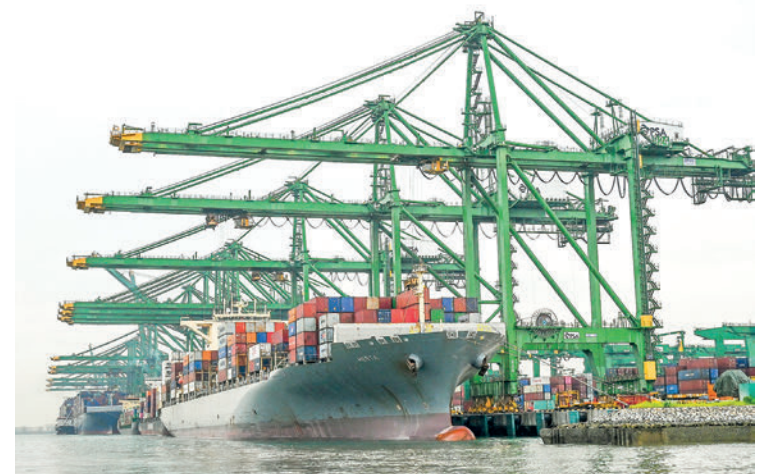
Vessels are seen berthed at Pasir Panjang container terminal port in Singapore on 26 May 2023.

NODX posted a decrease in June 2023 mainly in Malaysia, Indonesia and South Korea, but the figure for the Chinese mainland and China's Hong Kong Special Administrative Region