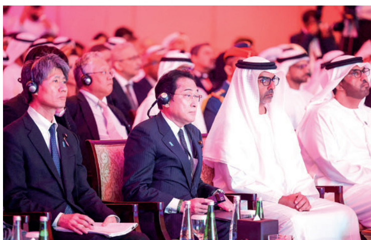
Japan's Prime Minister Fumio Kishida (C) attends the UAE - Japan Business Forum in Abu Dhabi on 17 July 2023.

Japan relies almost entirely on imports for its crude oil, with Saudi Arabia, the UAE and