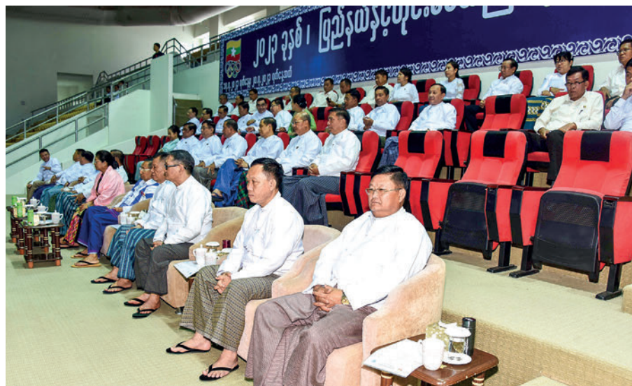
SAC members, Union ministers and dignitaries watch the Inter-State and Region Vovinam Tourney 2023 in Nay Pyi Taw yesterday.

Department of the Ministry of Sports and Youth Affairs and the Myanmar Vovinam Federation, the tournament was held to strengthen the friendship