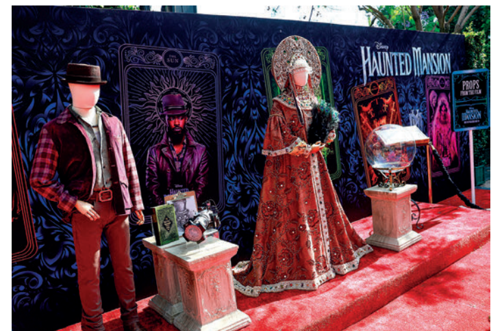
Props from the movie are displayed on the red carpet at the world premiere of Disney's "Haunted Mansion" at the Hyperion Theatre inside the Disney California Adventure Park in Anaheim, California, on 15 July 2023.