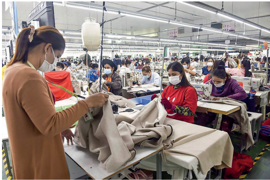
Garment workers make clothes at a factory in Phnom Penh, Cambodia on 17 December 2021.

His comments came after the kingdom recorded a drop by almost a fifth in the export of GFT