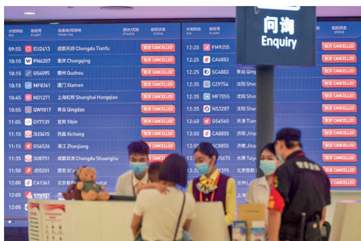
A screen shows cancelled flights at Haikou Meilan International Airport as a precaution for the approaching Typhoon Talim, in China's southern Hainan province on 17 July 2023.

The Philippine Institute of Volcanology and Seismology maintained the alert level around the Mayon volcano at 3 on a scale of 5. — Xinhua