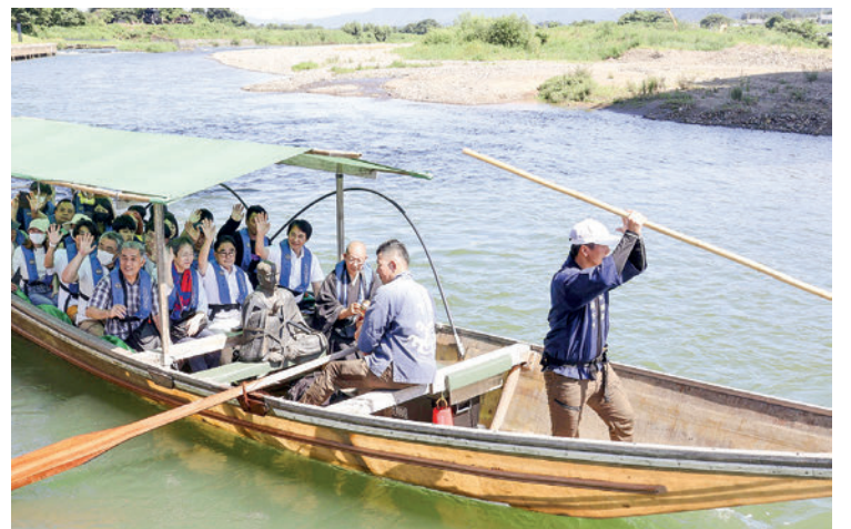
A traditional wooden vessel moves on the Hozu River in Kameoka in Kyoto Prefecture on 17 July 2023, as a popular river tour reopens following a suspension in the wake of a fatal accident in March.

It said the boats have been upgraded with equipment, including handles and footholds to prevent boatmen from falling, as well as ropes for easier steering. — Kyodo