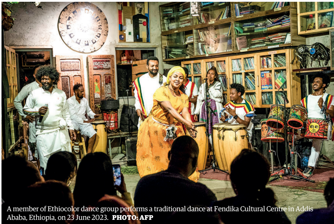
A member of Ethiocolor dance group performs a traditional dance at Fendika Cultural Centre in Addis Ababa, Ethiopia, on 23 June 2023.

A beloved monument to Ethiopia's traditional cabaret culture, the historic nightclub Fendika is running on borrowed time, having just escaped demolition.