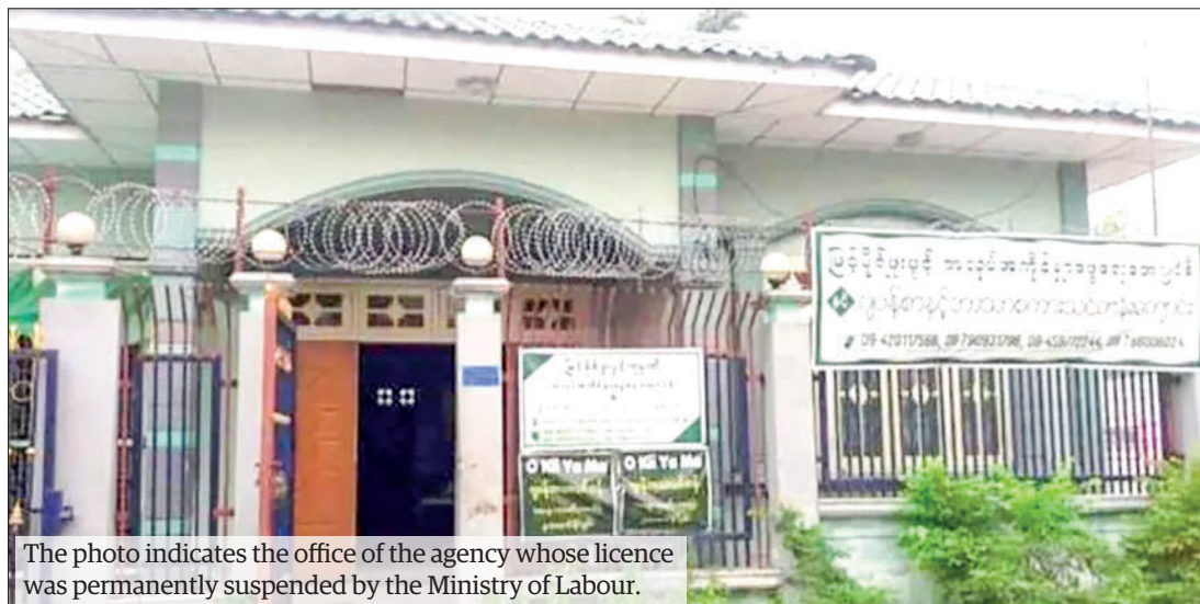
The photo indicates the office of the agency whose licence was permanently suspended by the Ministry of Labour.

THE Ministry of Labour has announced that it has permanently suspended the business licences of two overseas employment agencies — Myint Mo Phue Pwint Agency and Lu Kyaw Agency — which had collected service fees but failed to send them abroad to work.