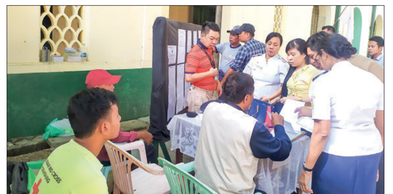
The voting in progress to elect community representatives of the Myanmar Red Cross Society in Botahtaung Township in 2019.

Application forms are available at the respective districts or townships, and anyone can apply to be a district or township community representative of the Myanmar Red Cross Society. The regional or state-level work committee will select members representing the community from the applicants. — TWA/CT