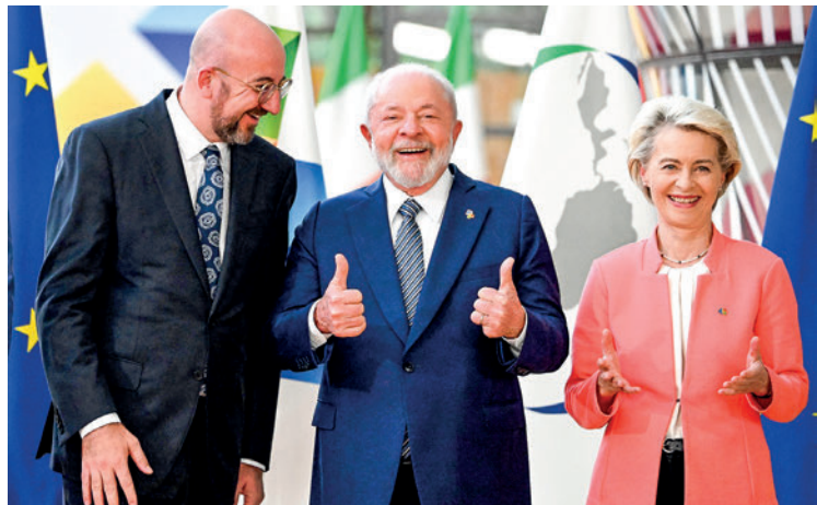
(From L) European Council President Charles Michel, Brazil's President Luiz Inacio Lula da Silva and President of the European Commission Ursula von der Leyen pose as they arrive for the first day of a summit of European Union-Community of Latin American and Caribbean States Summit (EU-CELAC) at The European Council Building in Brussels on 17 July 2023.

As EU and CELAC leaders gathered in Brussels, diplomats were struggling to agree on the wording of the final communique — with Europe pushing for a strong stance against Moscow. — AFP