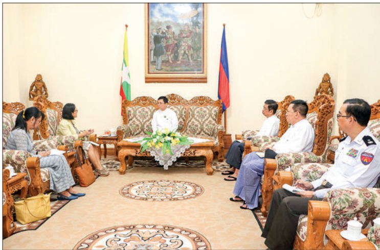
The UNHCR residential representative calls on Union Minister U Myint Kyaing yesterday.

UNION Minister for Immigration and Population U Myint Kyaing received Ms Noriko Takagi, Resident Representative of the United Nations High Commissioner for Refugees (UNHCR) and party yesterday in Nay Pyi Taw.