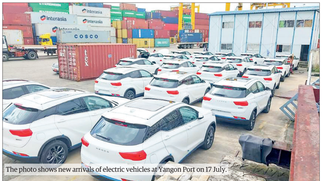
The photo shows new arrivals of electric vehicles at Yangon Port on 17 July.

WITH the approval of the Steering Committee on National-level Development of Electric Vehicles and Related Industries, a total of 40 electric vehicles (including 20 Neta U models and 20 Seres 3 models) imported by Grand Sirius Co Ltd and Asia Pacific Automaker Corporation Co Ltd arrived at Yangon Port. They were allowed to be claimed following Customs procedures on 17 July. The import of battery electric vehicles (BEVs) is exempted from Customs duties. — MNA/KZW