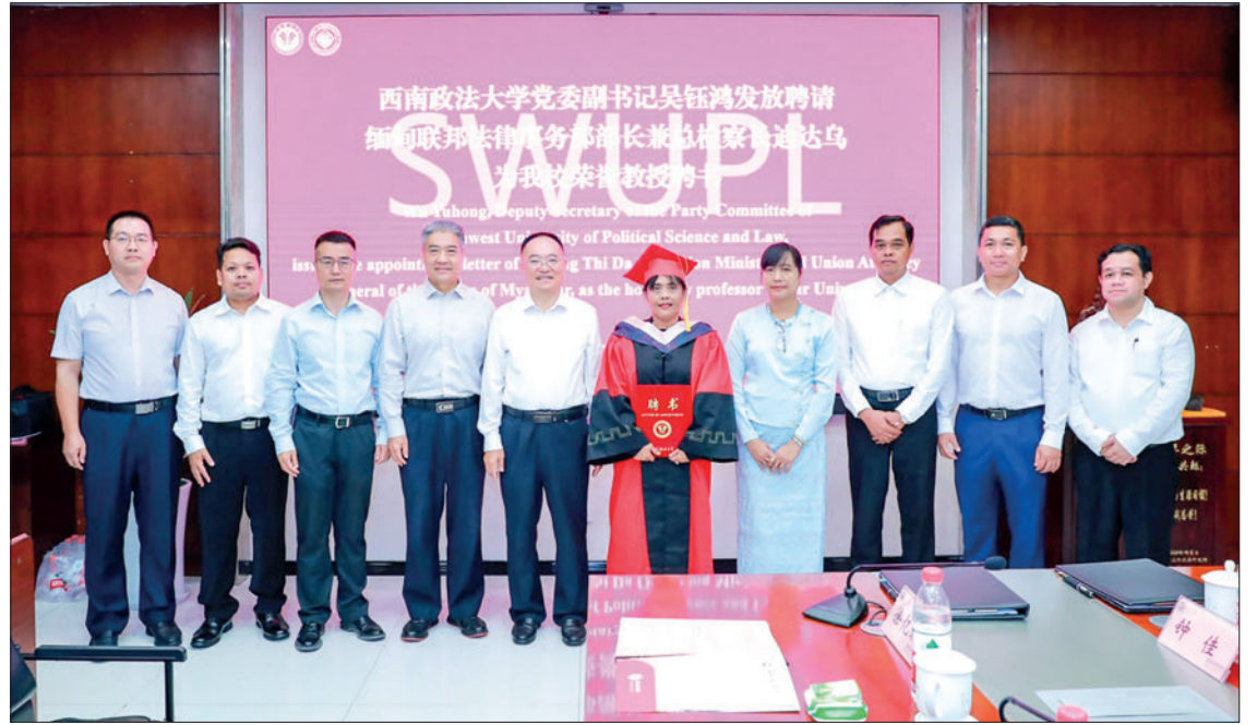
The documentary group photo of the MoU signing event held yesterday in China.

Then, the Rector of the Southwest University of Political Science and Law appointed the Union minister as an honourable professor of the university for the duration of 2023-2028.