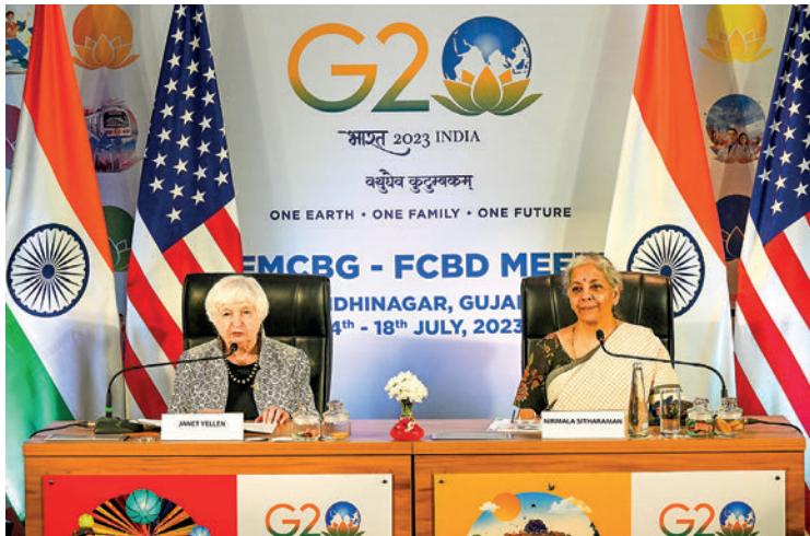
India's Finance Minister Nirmala Sitharaman (R) speaks next to US Treasury Secretary Janet Yellen during a joint statement with US as part of the G20 Finance Ministers, Central Bank Governors (FMCBG) and Finance & Central Bank Deputies (FCBD) meetings, at the Mahatma Mandir in Gandhinagar on 17 July 2023.

G20 finance ministers and central bank chiefs opened talks Monday on debt restructuring deals, multilateral bank reform and finance to tackle climate change, as they aim to bolster a sagging global economy.