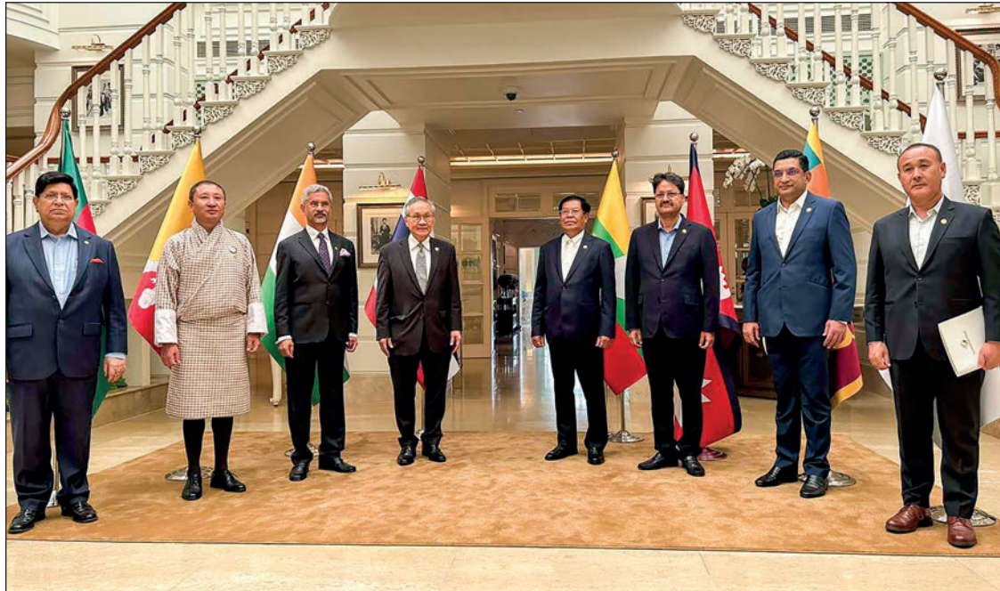
Union Minister U Than Swe poses for the documentary group photo along with foreign ministers of the BIMSTEC in Bangkok yesterday.

ation mechanism, their discussions focused on the cooperation with the external partners, the establishment of the Eminent Persons' Group (EPG) on the Future Directions of BIMSTEC and the holding of the BIMSTEC Ministerial Meetings. They also deliberated on resiliency to crisis i.e. pandemic, financial crisis and natural disasters, post-Covid-19 economic development and