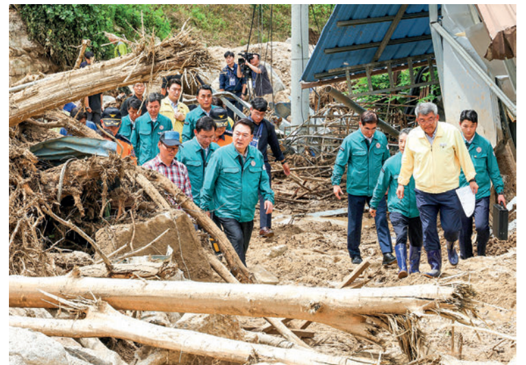
South Korea's President Yoon Suk Yeol (C) walks past piles of fallen trees at a village, where more than a third of houses were damaged in landslides and two people remain missing, in Yecheon on 17 July 2023.

South Korea is at the peak of its summer monsoon season, and days of torrential rain have caused widespread flooding and landslides, with rivers bursting their banks, and reservoirs and dams overflowing. More rain is forecast in the coming days.