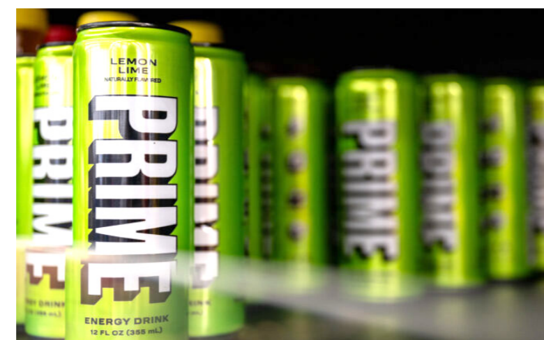
According to the American Academy for Child and Adolescent Psychiatry (AACAP), children under the age of twelve should completely avoid consuming a certain chemical. For individuals aged 12 to 18, the AACAP recommends a daily limit of 100 milligrammes, which is equivalent to half a can of Prime Energy.

W ITH its extremely high levels of caffeine, a hip new soft drink is raising fears in the United States that it might be dangerous for children, who have been snapping up the beverage since it was launched