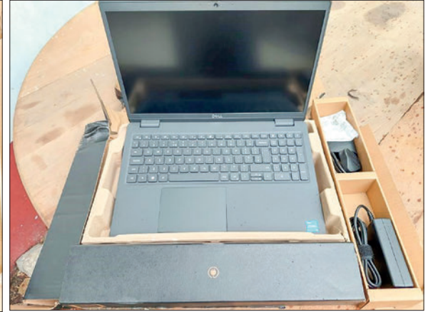
Photos indicate seized illegal goods and vehicles in Mandalay Region.

23 sets of CCTV cameras without official documents that were piled up by the side of the road over the Sinphyu checkpoint. Action is to be taken under Customs procedures.