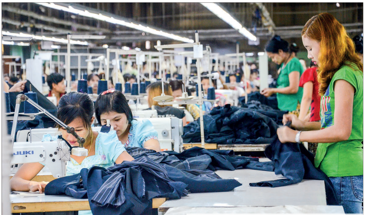
Workers are pictured being busy with sewing machines at the garment factory in Hlinethaya Township in Yangon.

The Regional Comprehensive Economic Partnership (RCEP), a free trade agreement