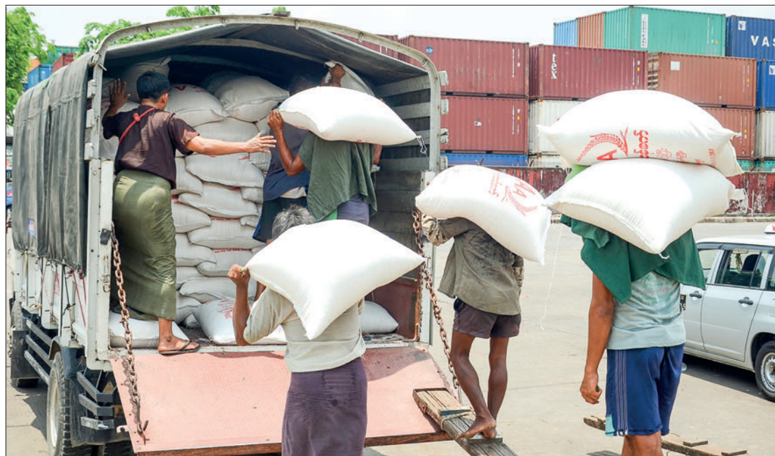
High-grade Pawsan rice variety from the Shwebo area jumped to K112,000 per bag on 17 July from K110,000 on 14 July. The photo shows workers loading rice bags onto the lorry.

the supply chain need to exert concerted efforts in this, MRF notified. — NN/EM