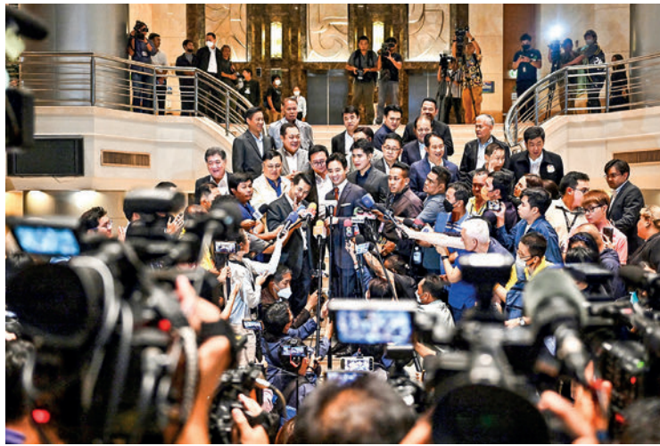
Pita Limjaroenrat (C), leader of Move Forward Party (MFP) and candidate for prime minister, speaks to the media during a presser following a meeting with the eight-party coalition in Bangkok on 17 July 2023.

Establishment lawmakers consider his party's pledge to reform the kingdom's strict royal defamation laws a red line and the Harvard-educated poli-