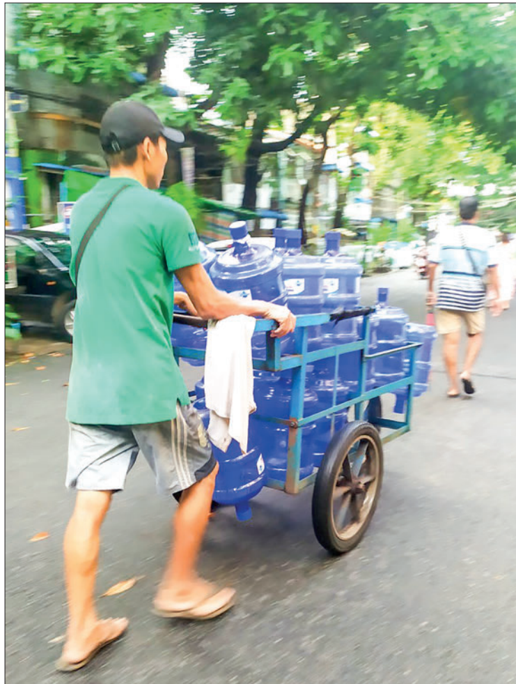
The photo shows a pushcart with water bottles on the road and a delivery man.

A household with four family members living in an apart-