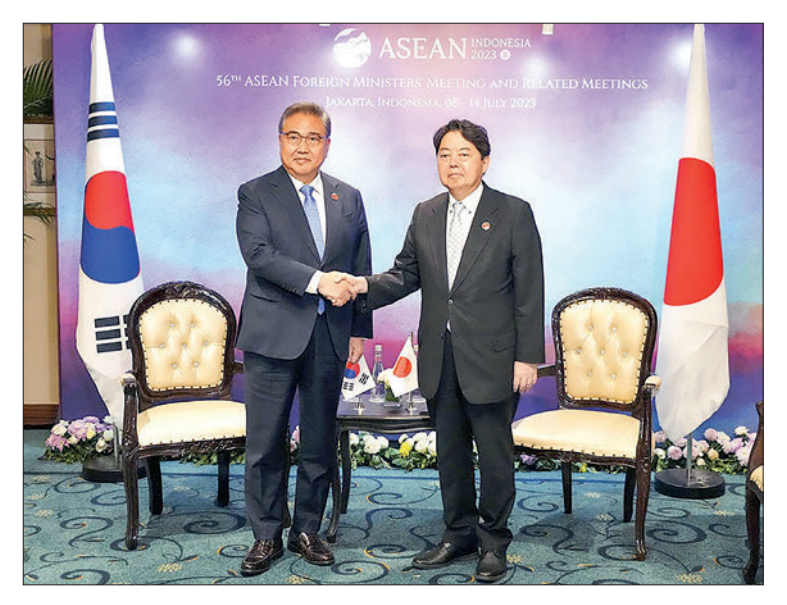
Japanese Foreign Minister Yoshimasa Hayashi (R) and his South Korean counterpart Park Jin shake hands as they meet in Jakarta, Indonesia, on 13 July 2023.

JAPANESE and South Korean listic missile the day before, the