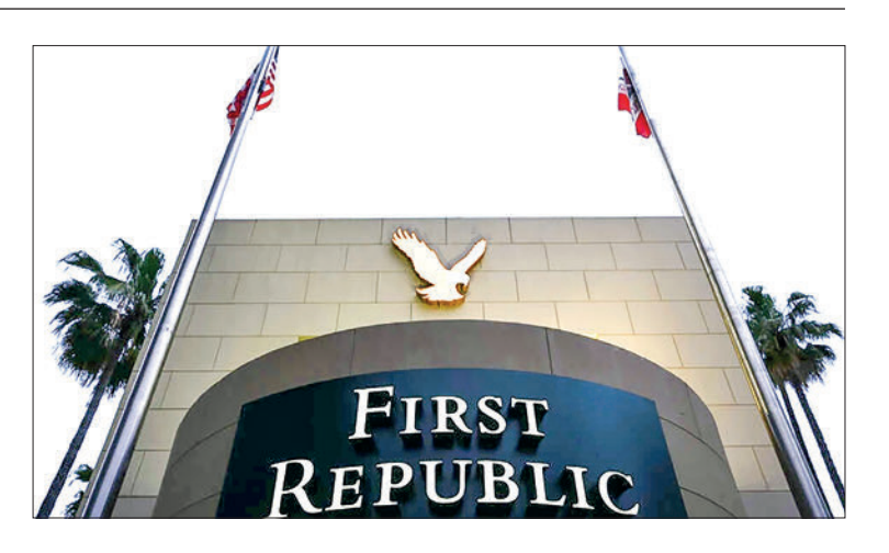
In the upcoming bank earnings, analysts aren't expecting a shock akin to First Republic's April disclosure of much lower deposits