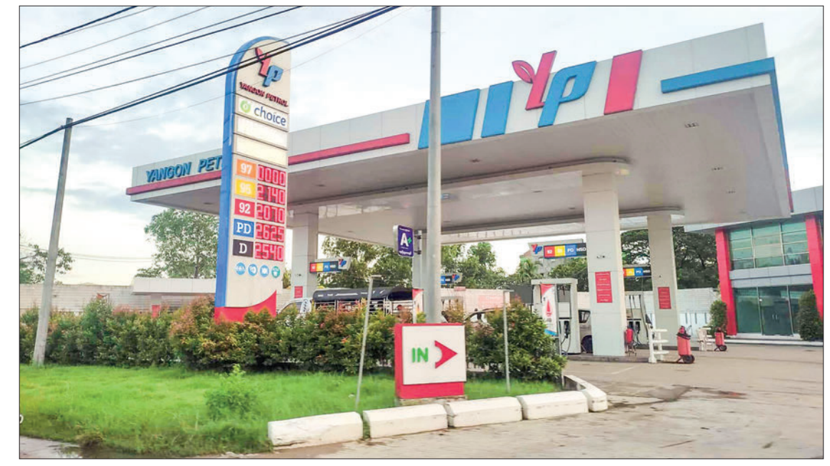
A sign displaying fuel oil prices at the petrol station in Yangon.

The committee is inspecting the fuel stations whether they are overcharging or not. The authorities are taking action against those retailers of fuel stations under the Petroleum and Petroleum Products Law 2017 if they are found overcharging rather than the set reference rate.