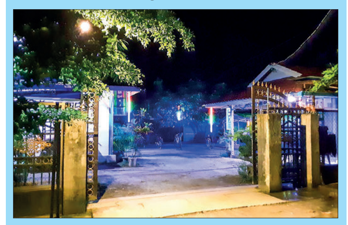
Power restored to reinvigorate communities in Rakhine State.

As a result, a total of 27 arrests were made on 11 and 12 July, with an estimated value of K622,476,067, as reported by the Illegal Trade Eradication Steering Committee. — MNA/ MKKS