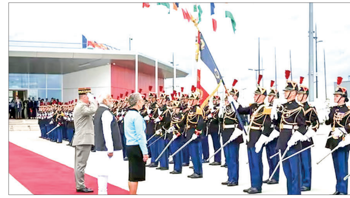
France's Prime Minister Elisabeth Borne (3L) and Prime Minister Narendra Modi (2L) stand in front of French Republican Guards at the Orly airport in Orly, Paris' suburb.

"India is one of the pillars of our Indo-Pacific strategy," an aide to Macron told reporters this week on condition of ano-