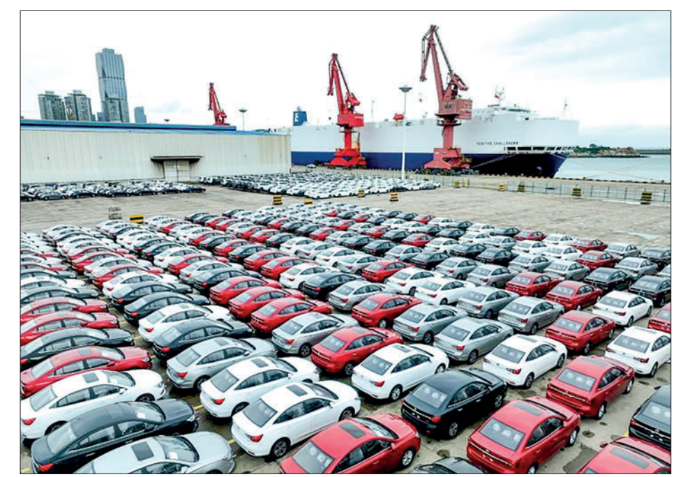
The drop in exports comes as China's economic recovery from Covid lockdowns is losing momentum.

Thursday's figures are the latest in a series of grim indicators reflecting a loss of steam in China's post-Covid recovery, with factory activity contracting and growth in the services industry slowing, while industrial production remains tepid. — AFP