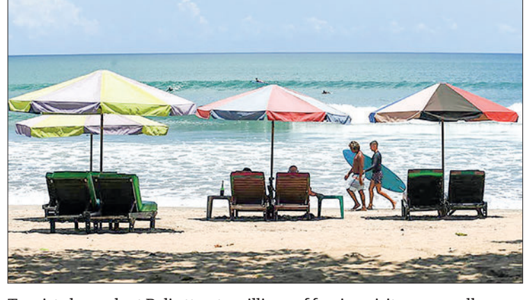
Tourist-dependent Bali attracts millions of foreign visitors annually.

would deter visitors, Koster said authorities did not believe numbers would dip.