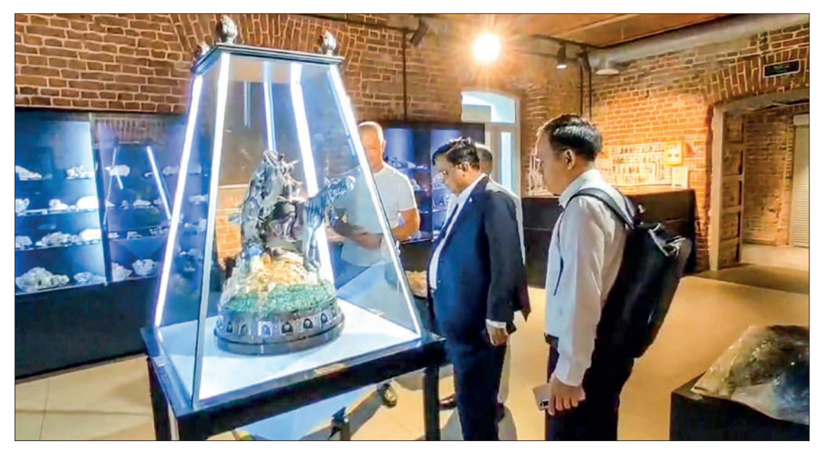
Union Minister for Industry Dr Charlie Than is seen exploring the Stone-Crafting House by Alexey Antonov in Yekaterinburg, Russian Federation.

The Union minister also visited the Stone-Crafting House by Alexey Antonov in Yekaterinburg yesterday morning and viewed the ancient animal fossils, a variety of stones collected from all over the world, carved stone sculptures in various sizes, and Russia's oldest excavated gold and stone paintings. — MNA/CT