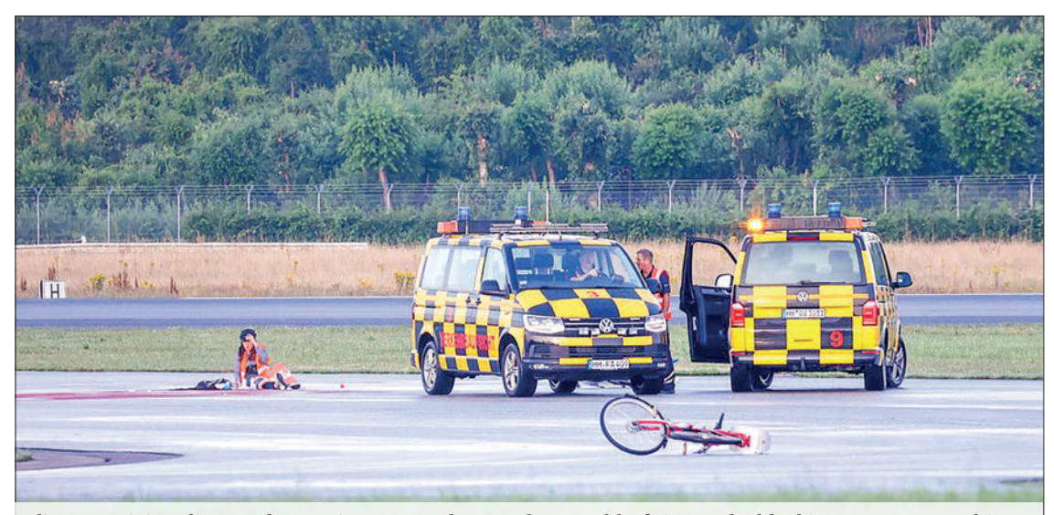
Climate activists disrupted operations at Hamburg and Duesseldorf airports by blocking runways, resulting in flight delays and cancellations for numerous holidaymakers.

CLIMATE activists blocked the runways at Hamburg and Duesseldorf airports Thursday, leading to flight delays and cancellations for thousands of holidaymakers.