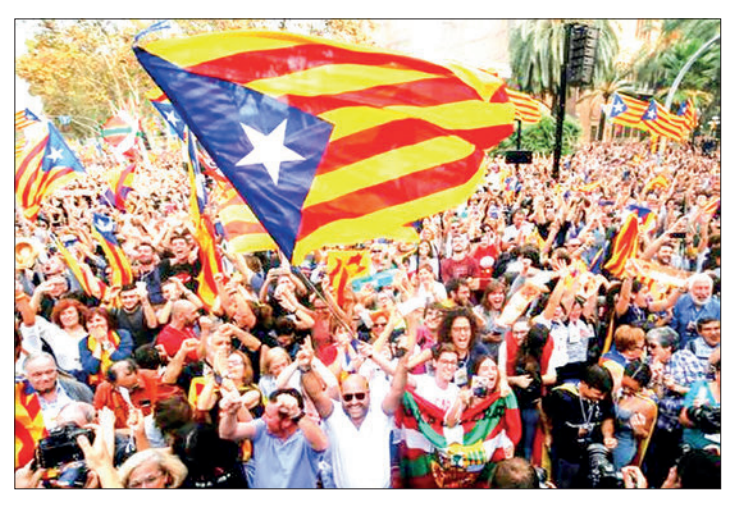
In 2017, the Catalan government pushed ahead with a banned independence referendum and then issued a short-lived independence declaration.

Feijoo vowed during an interview published in daily newspaper El Mundo on 2 July that if he becomes prime minister, he will tell the separatists still in power in Catalonia that he is "available to talk". — AFP