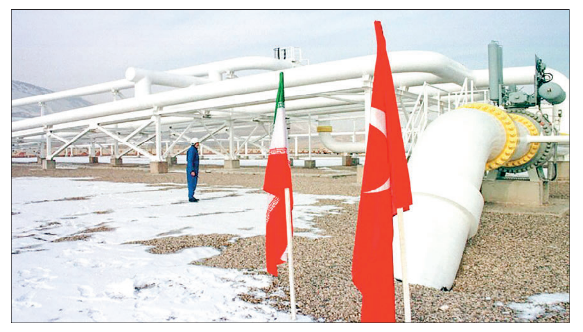
An Iranian worker stands in front of gas pipelines next to the flags of Türkiye (R) and Iran.

Ravaged by decades of conflict and international sanctions, oil-rich Iraq relies on Iranian gas imports for a third of its energy needs. It is also beset by rampant corruption, and suffers from di-