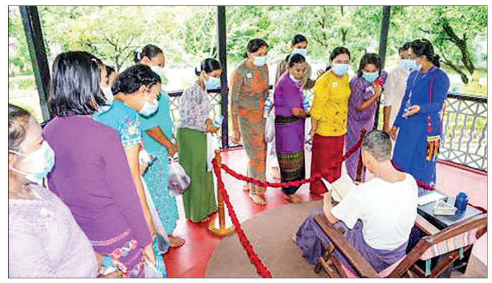
The photo shows some visitors viewing the Bogyoke Aung San Museum in Bahan township in 2022.