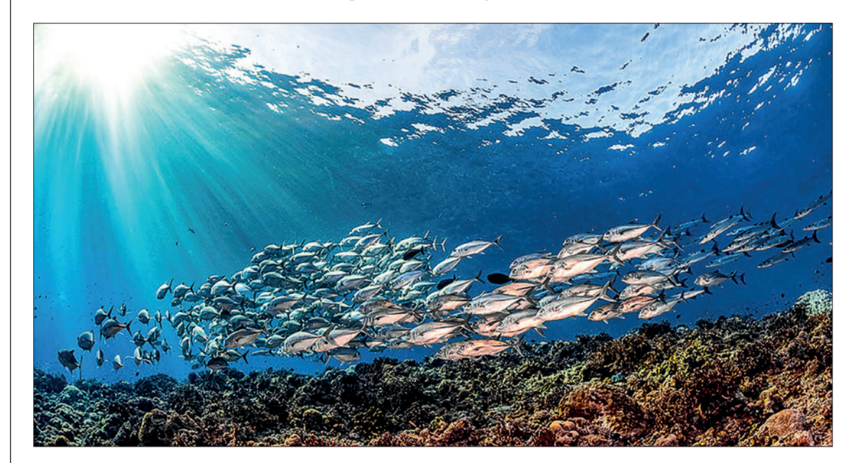
In the new research published on Wednesday, scientists said they had detected shifts in colours across more than half of the world's oceans -- an expanse bigger than Earth's total land area. A school of Travally fish in the Solomon Islands.

OVER the past 20 years huge swathes of the world's oceans have changed colour, displaying a subtle greening towards the tropics that researchers say points to the effect of climate change on life in the world's seas.