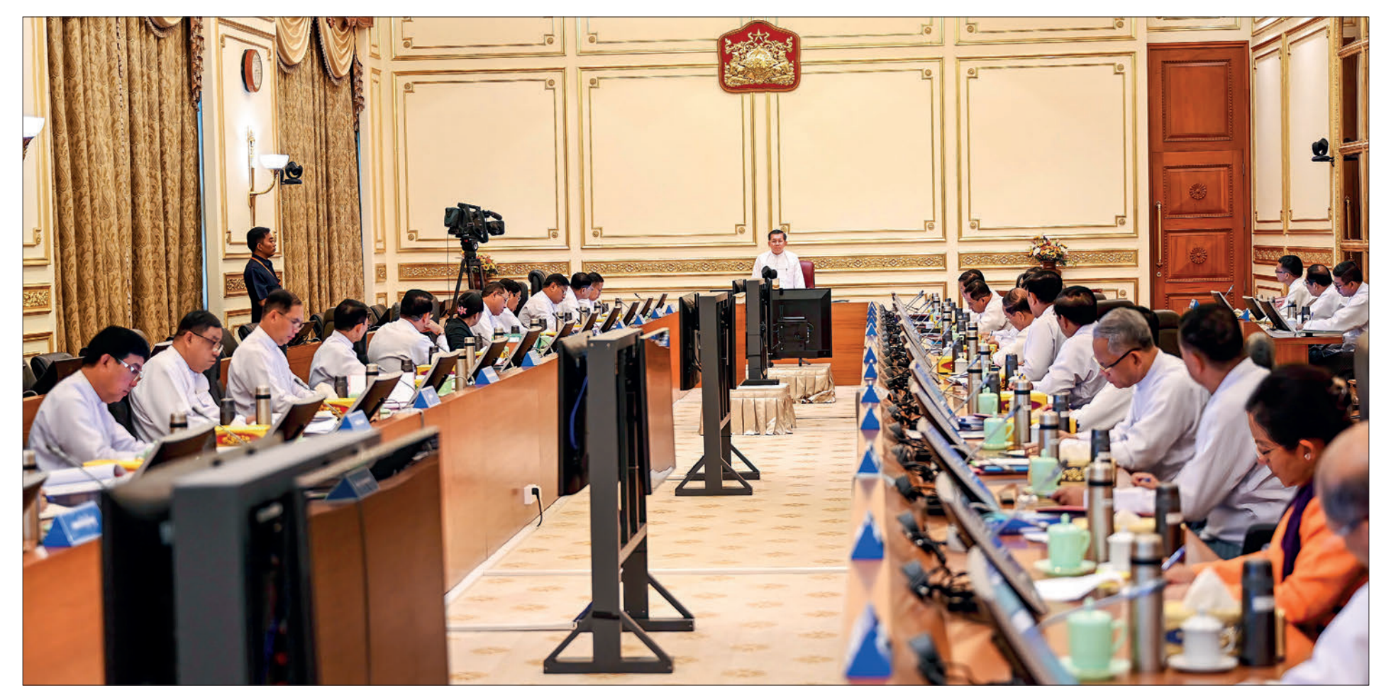
State Administration Council Chair Premier Senior General Min Aung Hlaing addresses the meeting 3/2023 of the Union government in Nay Pyi Taw on 13 July 2023.

export of products but it should Min Aung Hlaing at the meeting 3/2023 of the Union government at the SAC Chair-Chairman of the State Administration man Office in Nay Pyi Taw yesterday