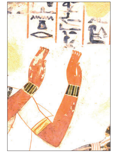
This handout photograph released by the LAMS MAFTO CNRS on 12 July 2023 shows a detail of the adoring scene showing the arms of Menna in front of Osiris, in the tomb of Menna, in Sheikh Abd el Qurnah, near Luxor, in Egypt, on 30 November 2022.

However, a small robot moving in front of the painted