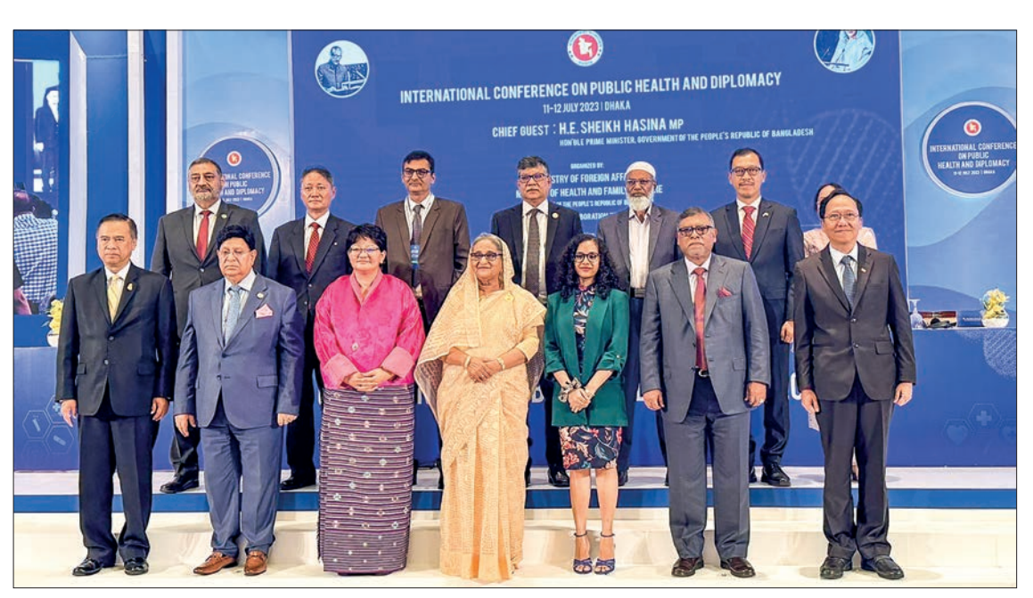
Union Minister Dr Thet Khaing Win poses for the documentary group photo at the event in Bangladesh yesterday.

Then, the Myanmar delegation led by the Union Minister attended a dinner hosted by Dr A K Abdul Momen, Foreign Affairs Minister of Bangladesh, at State Guest House-Jamuna in Dhaka.