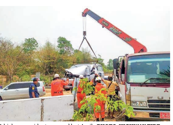
A highway accident occurred last April.

"Before the COVID-19 period, there were 16,717 vehicles made traffic violations in 2017 and 16,295 vehicles in 2018. After experiencing the period of COV-ID-19, the number of vehicles prosecuted has decreased due to less traffic and more people obeying the rules.