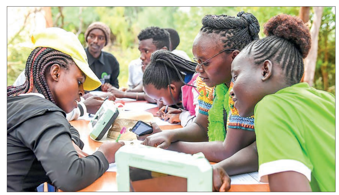
People register during a launching ceremony of a solar media project in Nthunguni village of Mtito Andei, Kenya on 1 July 2023.

THE world risks big misses across the Sustainable Development Goals (SDGs) unless actions to accelerate implementation are taken, said a UN report released on Monday.