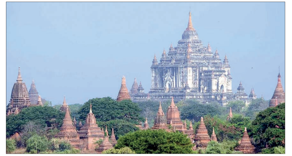
The photo shows the general view of the Thatbyinnyu Temple.

G-to-G agreement. We cannot say exactly when it will start. It is not sure whether to start in August. In addition, the experts of Myanmar, departmental experts, foreign experts and in-