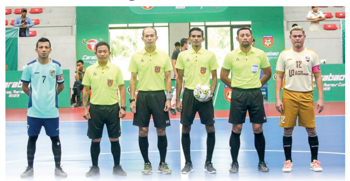
The four futsal referees (in the middle) are seen during a domestic futsal tournament.

MFF Futsal Newly Referee Course 1/2023 will be opened from 3 to 9 August in cooperation with the Myanmar Football Federation and Referee Committee.