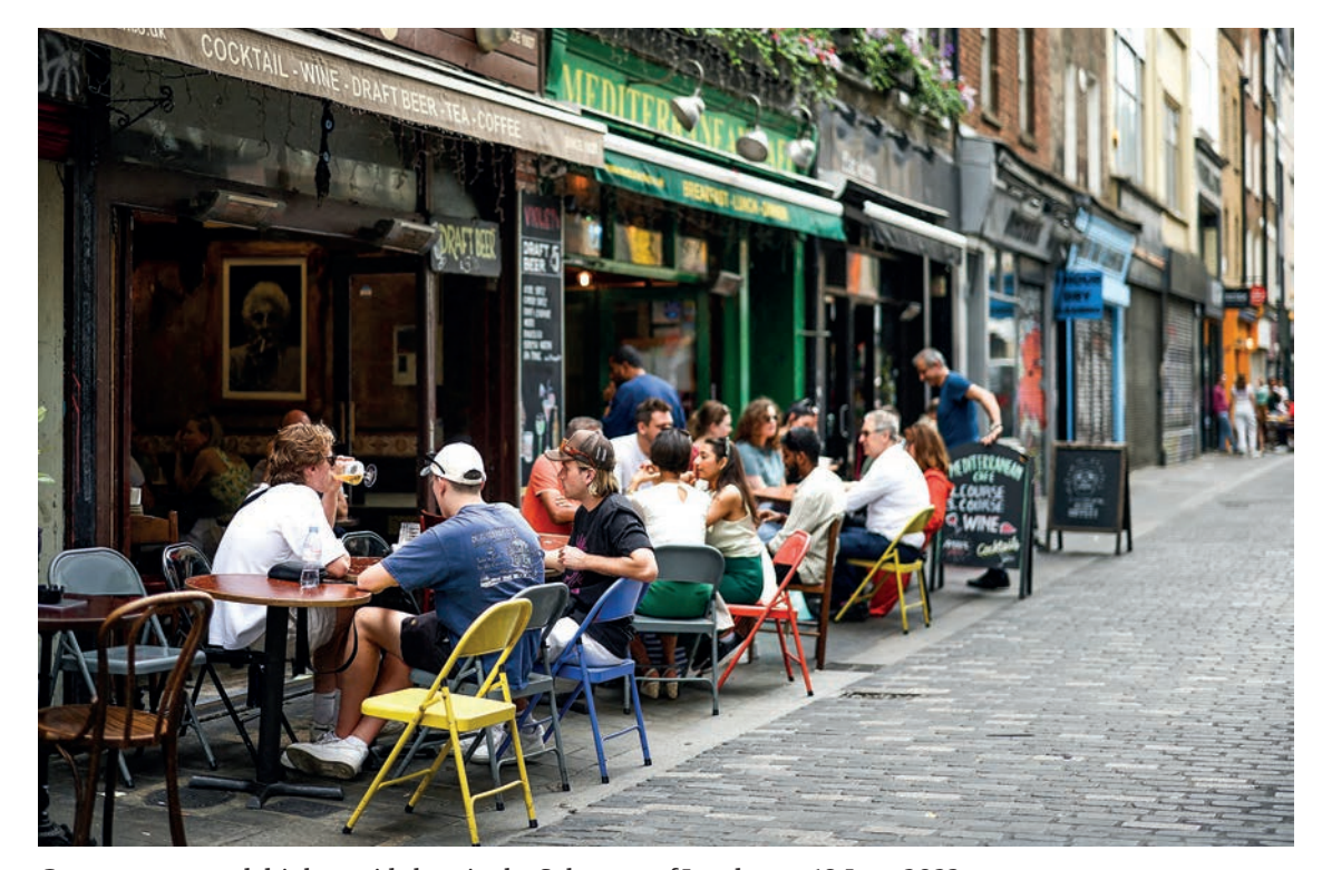
Customers eat and drink outside bars in the Soho area of London on 18 June 2023.

UK unemployment rose back to four per cent in the three months to the end of May, official data showed Tuesday, as the economy struggles with stubbornly-high inflation.