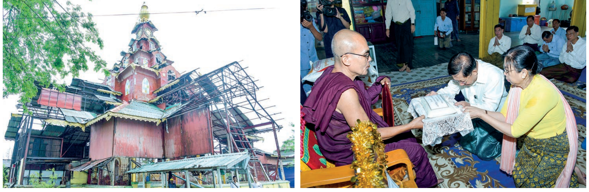
The photo shows the damage to U Ye Kyaw Thu monastery in Sittway.

as the first priority and keep the precinct neat and tidy. — MNA/TTA