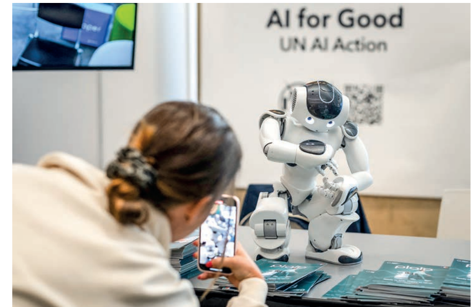
Autonomous, programmable humanoid robot "Nao" performs at the booth of Aldebaran company during the world's largest gathering of humanoid AI Robots as part of International Telecommunication Union (ITU) AI for Good Global Summit in Geneva, on 5 July 2023.

AI use is generally concentrated in large