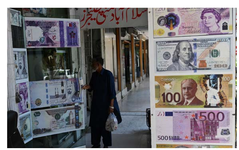
A man enters a foreign currency exchange shop in Islamabad on 11 July 2023.

balance. Faisal Shaji, a research analyst with Standard Capital Securities, told AFP that the deposit will stabilize Pakistan's foreign exchange reserves and will improve its credit rating in the international market.—AFP