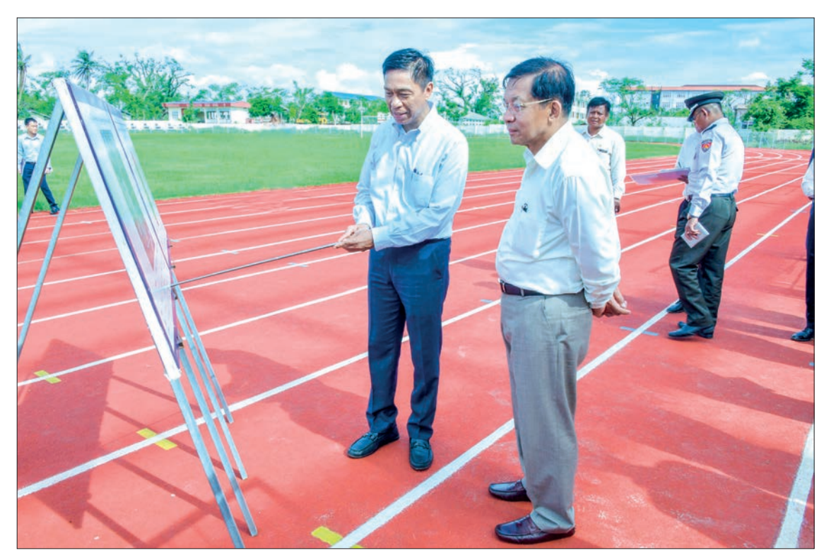
The Senior General hears the report on the work plans at the Danyawady Stadium.

In his response, the Senior General stressed the need to establish an indoor stadium, stadium with modern runway and a stand and swimming pool to hold the township-level sports competitions.