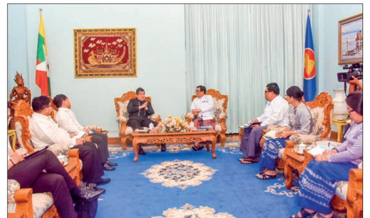
Deputy Minister for Foreign Affairs U Kyaw Myo Htut receives Mr Eduardo Jose A De Vega, Acting Undersecretary for Migrant Workers' Affairs, Department of Foreign Affairs of the Government of Philippines on 30 June.

They cordially exchanged views on enhancing the existing friendly bilateral relations and promoting cooperation between the two countries in the all arenas, as well as the matters pertaining to combatting cybercrime in regional and cooperating