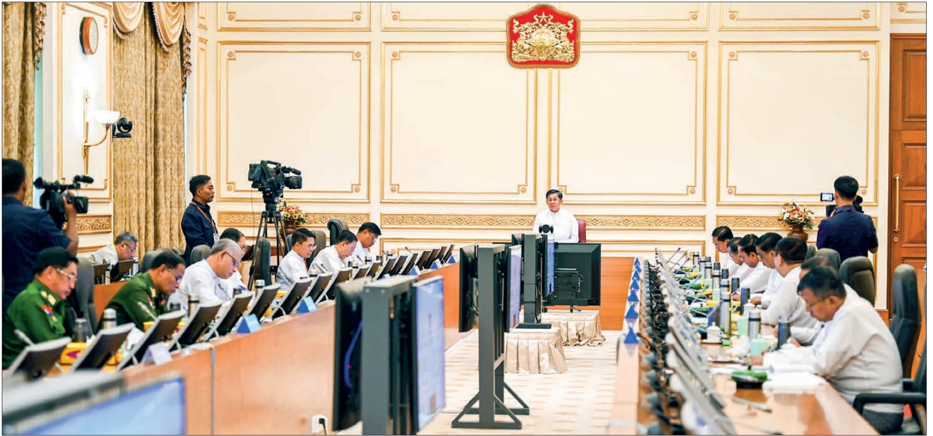
SAC Chairman Prime Minister Senior General Min Aung Hlaing delivers address at State economic promotion meeting at SAC Chairman office on 30 June.

State-owned factories must be operated with benefit, said Chairman of the State Administration Council Prime Minister Senior General Min Aung Hlaing at the State economic promotion meeting at the SAC Chairman Office in Nay Pyi Taw yesterday afternoon.