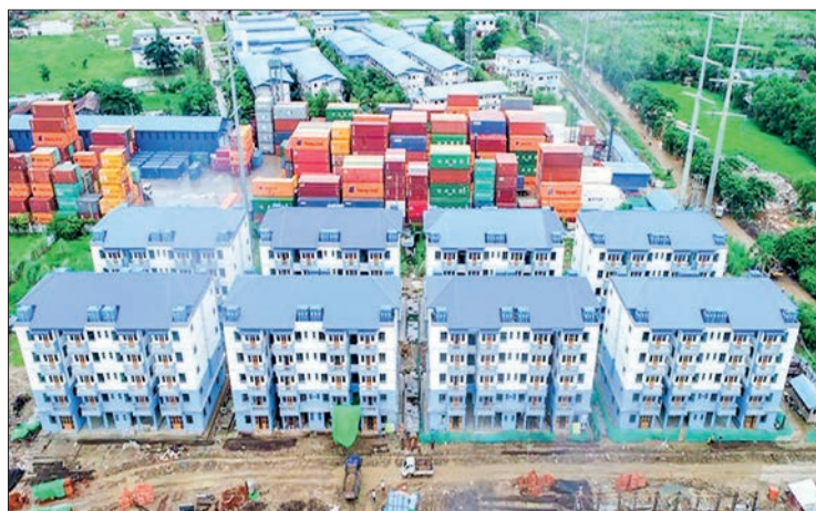
The completed apartments of Thukha Dagon Housing in Dagon Myothit (South) Township.

THE Thukha Dagon Public Rental Housing Leasing and Disciplinary Committee announced that retired employees, civil servants, and people who have difficulty living in Yangon Region can apply for a residence permit in the Thukha Dagon housing apartments built in the Dagon Myothit (South) Township.