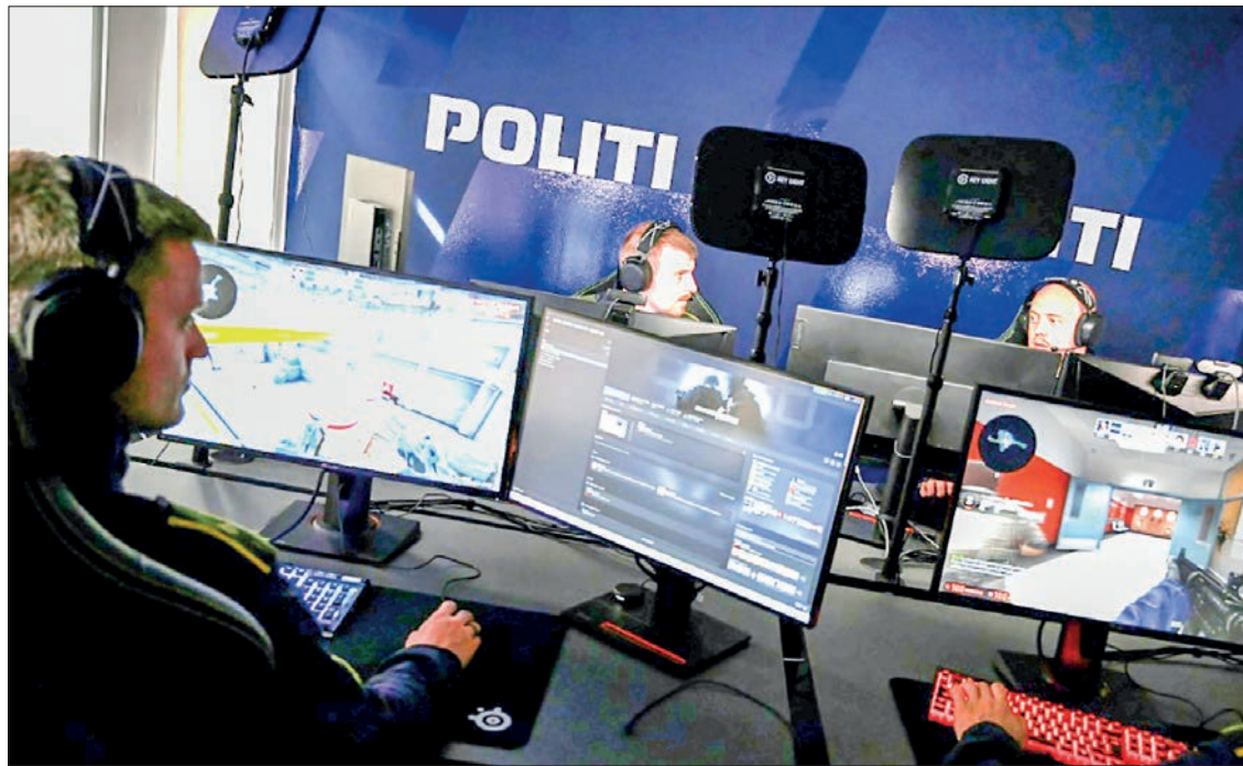
Denmark's police headquarters have implemented a unique approach to combatting online crime.

"The same way you see a police car driving around in the