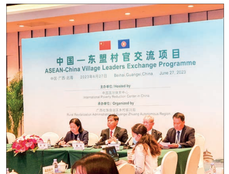
ASEAN-China Village Leaders Exchange Programme in progress in China from 26 to 29 June.

WITH the permission from the National Electric Vehicle and Related Industries Development Steering Committee, NCX Myanmar Co Ltd imported 192 Wuyang Honda (U-GO) type electric motorcycles, which arrived at Yangon Port. These motorcycles were allowed to be taken out in accordance with the procedure on 30 June, and the import was exempted from customs duties. — MNA/KZW