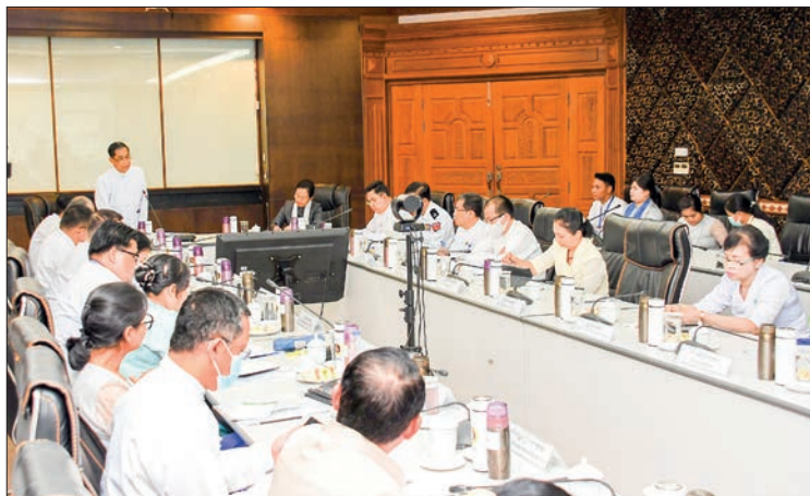
Union Minister U Ko Ko Hlaing speaking at meeting of Working Committee for International Relations 3/2023 on 30 June.

THE meeting of the Working Committee for International Relations (2/2023) under the National Disaster Management Committee was held at the Ministry of International Cooperation yesterday afternoon.