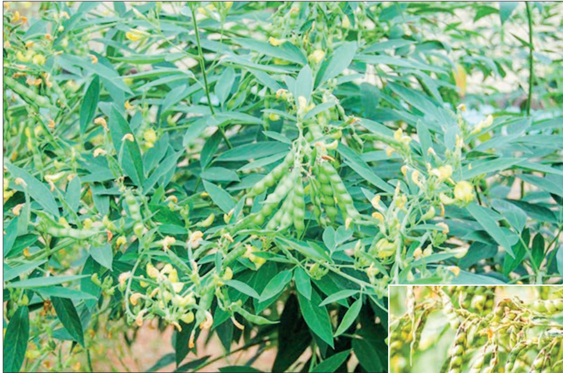
Pigeon pea plants bearing fruits in the farm.

India notified that the free import policy of black gram (urad) and pigeon pea (tur) extended up to 31 March 2024, bringing more benefits to the stockholders in the supply chain including growers and exporters. That being so, they should