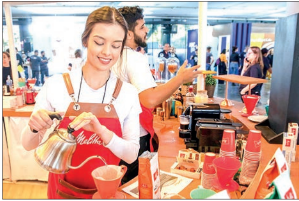
A staff member prepares coffee during the Sao Paulo Coffee Festival in Sao Paulo, Brazil, on 23 June 2023.

COFFEE industry insiders at the Sao Paulo Coffee Festival, held here from 23 to 25 June, were optimistic about the prospect of the Chinese specialty coffee market.