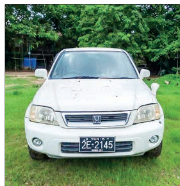
Photos show illegally imported vehicle and steel with basins.

In addition, the on-duty teams nabbed four kinds of goods worth K9.25 million including 180 ceramic tiles that were not declared in the Import Declaration (ID) from a container at the Myanmar Industrial Port, eight