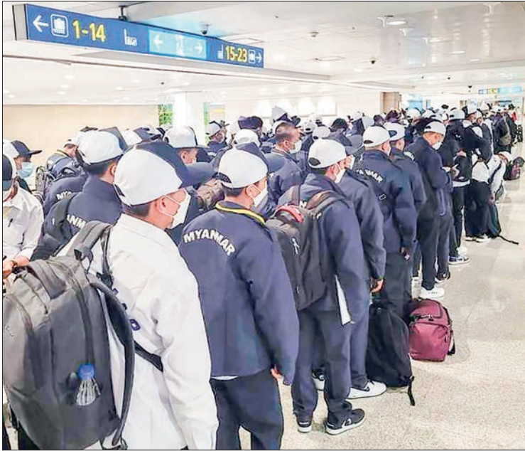
A photo shows some Myanmar workers sent to South Korea under the Employment Permit System.

A total of 331 Myanmar workers were legally sent to the Republic of Korea through the Employment Permit System (EPS) on 29 June 2023, according to a statement from Myanmar's Embassy in Seoul.