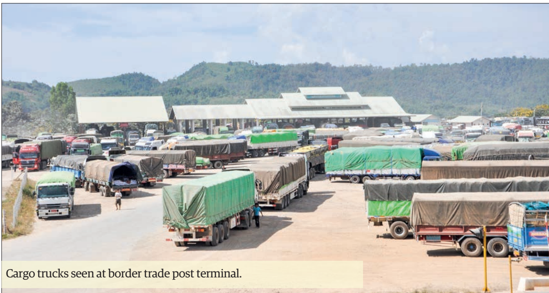
Cargo trucks seen at border trade post terminal.

THE Trade Department under the Ministry of Commerce notified on 28 June that exporters no longer need to pay export revenue in advance from 1 July