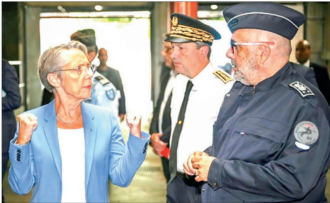
Prime Minister Elisabeth Borne, left, is attending a crisis meeting with President Emmanuel Macron.

A state of emergency would give authorities increased powers