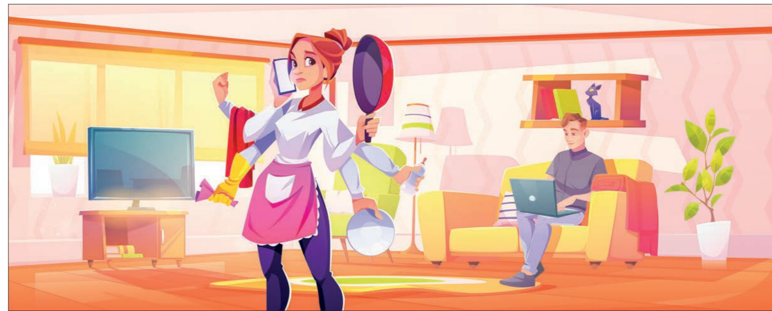
The picture illustrates a busy housemaid.

owners for disappointing them and so on. Some of the problems are committed for various reasons.