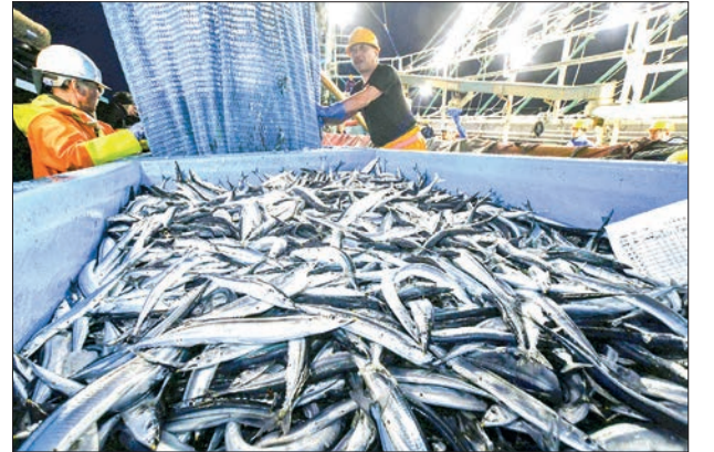
Fish are seen at Onahama port in Iwaki, Fukushima. The European Union is poised to lift its remaining import restrictions on Japanese food products imposed in the wake of the 2011 Fukushima nuclear power plant disaster.

An announcement is expected possibly at the end of July, paving the way for the removal of a requirement for radiation test certificates for seafood and mushrooms from 10 prefectures, including Fukushima. Japanese farm minister Tetsuro Nomura said Friday in Tokyo that he is "aware that there are positive moves" on the issue and will meet with EU Commissioner for Agriculture Janusz Wojciechowski