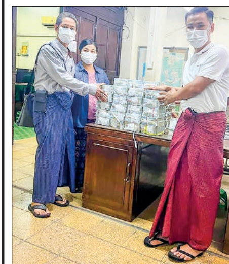
The special prize winner is awarded the prize money of K500 million in the 51 st Aung Bar Lay lottery.

For the month of June, both Aung Bar Lay lottery and the Aung Bar Lay online lottery sold tickets worth K5,176.703 million, so K3,623.692 million will be allocated as lottery prizes.