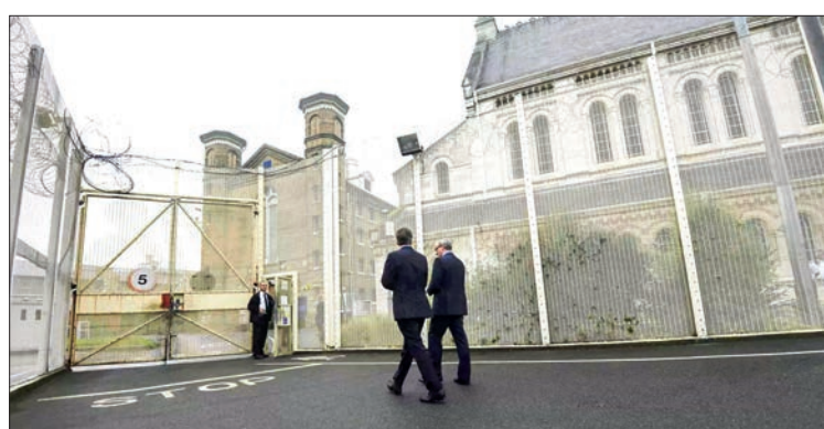
The United Kingdom is implementing a novel strategy to address re-offending and expand prison capacity. Inmates will now be involved in constructing new prisons. PHOTO: SPUTNIK

Forces this year," Sabahi-Fard said during an unannounced visit to an air defense base outside Tehran on Thursday (29/6/2023) for a quick readiness check. — SPUTNIK