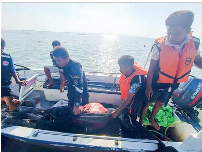
The retrieval process of the body found in the Kyaytawpikeseik River in Sittway is shown in the photo.

Township, Yangon Region, drowned while shopping groceries for the ship at the Sittway port two days ago. The body found is believed to be the body of one of the sailors, and the Myitta Yaungchi Foundation said that they requested contact with the relevant families. — TWA/CT