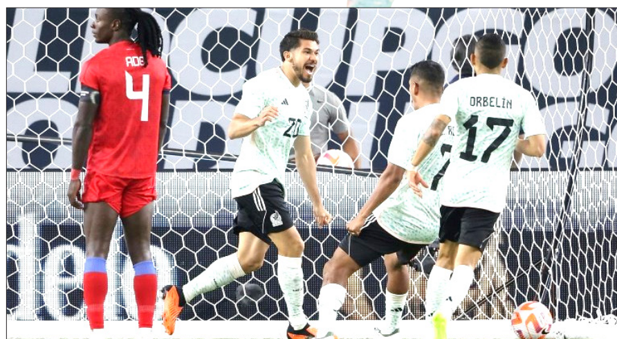
Henry Martin of Mexico celebrates after scoring the opening goal in a 3-1 win over Haiti in the CONCACAF Gold Cup Group B clash on Thursday.

MEXICO secured their spot in the CONCACAF Gold Cup knockout stage with a game to spare, after beating Haiti 3-1 in Glendale, Arizona, on Thursday.