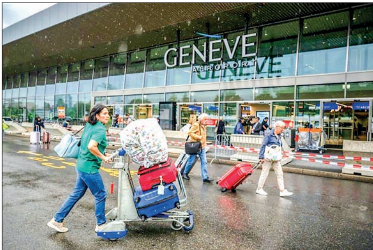
Dozens of flights were cancelled at Geneva airport on Friday due a strike by staff.

SOME 64 flights were cancelled at Geneva’s international airport on Friday, it said, after opera-