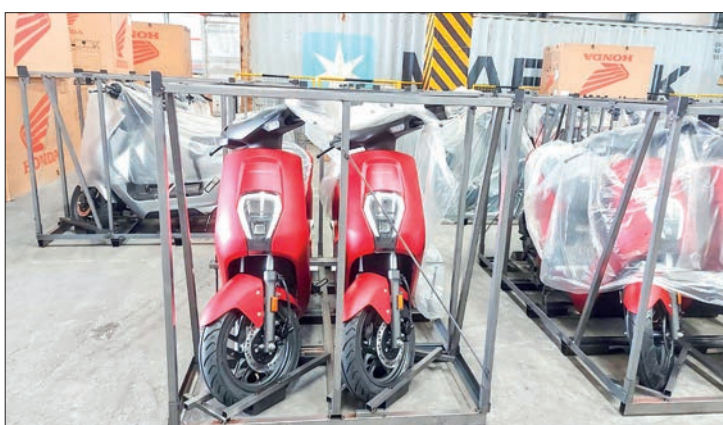
Electric motorcycles seen at Yangon Port.

WITH the permission from the National Electric Vehicle and Related Industries Development Steering Committee, NCX Myanmar Co Ltd imported 192 Wuyang Honda (U-GO) type electric motorcycles, which arrived at Yangon Port. These motorcycles were allowed to be taken out in accordance with the procedure on 30 June, and the import was exempted from customs duties. — MNA/KZW