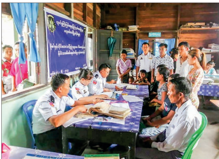
Immigration staff issue citizenship scrutiny cards and household registrations to locals.

The Ministry of Immigration and Population has issued 722 citizenship scrutiny cards