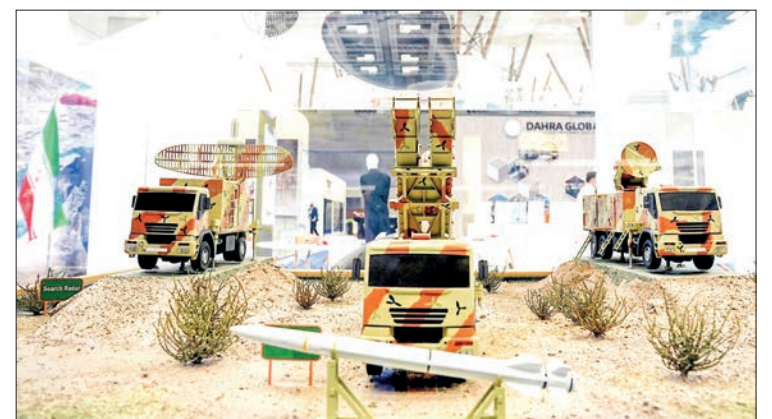
Tehran adheres to the principle of asymmetric warfare to try to deter potential aggression.

tial threats and possible challenges we face, the production of advanced long-range radar, missile and drone equipment is definitely on the agenda of the Ground Forces Air Defense