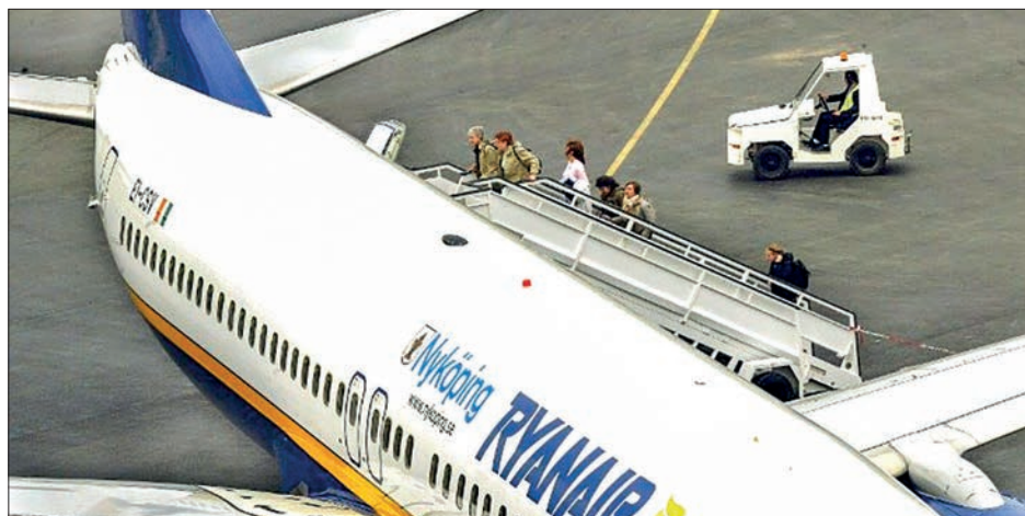
Beauvais is a favourite for low-cost airlines. PHOTO: AFP

Beauvais, some 80 kilometres (50 miles) north of Paris, is France's 10th busiest airport with 4.6 million passengers in 2022. — AFP