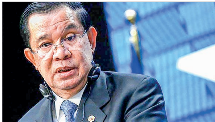
Cambodian Prime Minister Hun Sen speaks at a press conference during the EU-ASEAN (Association of Southeast Asian Nations) summit at the European Council headquarters in Brussels on 14 December 2022. Cambodian leader Hun Sen vowed on 29 June 2023 to quit posting on Facebook, days before he launches a re-election campaign.

“From now on, I will no longer post on Facebook,” Hun Sen told thousands of garment workers at an event.