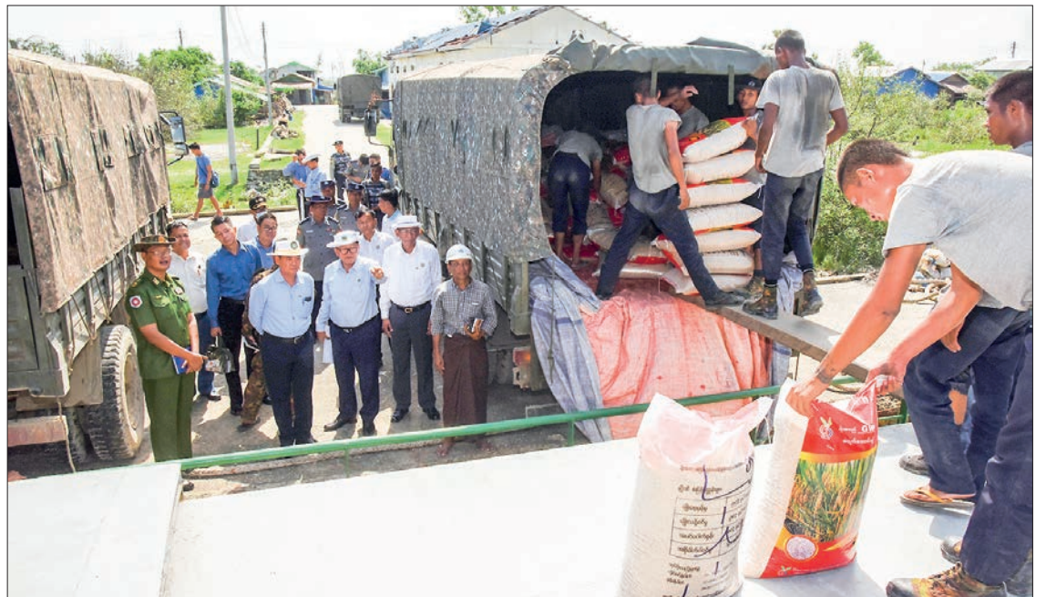
Rakhine State Chief Minister U Htein Lin views loading of supply materials aboard vessel at Mingan jetty of Sittway on 29 June.

At noon, the Chief Minister oversaw the loading of high-yielding paddy seed bags onto Kaldan-6 ship at Mingan jetty of