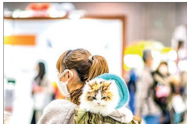
A Japanese app says it can detect with 90 per cent accuracy whether a cat is in pain.

Since its release last month, “Cat Pain Detector” has racked up 43,000 users, mostly in Japan but also in Europe and South America, said Go Sakioka, head of developer Carelogy. The app is part of a growing array of tech for pet owners concerned for their furry friends' wellbeing, including similar