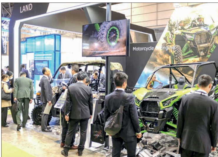
Visitors browse the displays at the Defence and Security Equipment International exhibition at Makuhari Messe in Chiba Prefecture on 18 November 2019.

THE Japanese government on Wednesday revealed guidelines for the development of its defense technology with the aim of urging private firms and research institutes to join in creating cutting-edge equipment such as insect-sized robots and