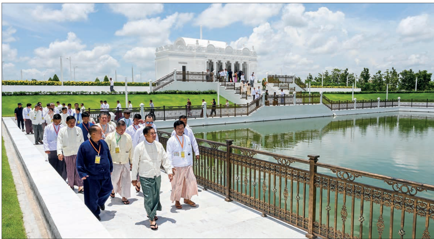
Senior General Min Aung Hlaing conducts well-wishers round Maravijaya Buddha Park in Nay Pyi Taw on 29 June.

The attendees to the ceremony paid homage to Maravi-