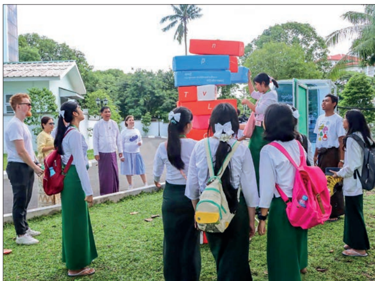
Science Festival 2023 in progress.

First, Union Minister for Science and Technology Dr Myo Thein Kyaw, Deputy Minister Dr Aung Zeya and party watched the powerpoint presentations of students from 11 groups for HackAtom competition regarding their created applications and websites to inform their findings within 24 hours in power generation using nuclear technology and knowledge on peaceful use such as Nuclear