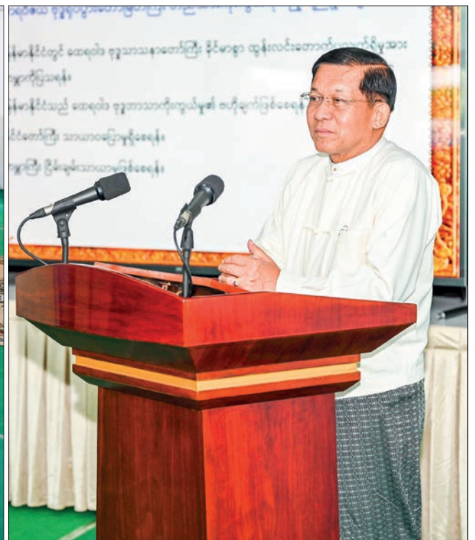
SAC Chairman Prime Minister Senior General Min Aung Hlaing explains progress of carving Maravijaya Buddha image and park in Nay Pyi Taw on 29 June.

C ONSTRUCTION of Maravijaya Buddha image has taken three years and 15 days till today, said Chairman of the State Administration Council Prime Minister Senior General Min Aung Hlaing at the clarification on progress of building Maravijaya Buddha Image which would be the highest carved sitting Buddha image throughout the world, in Dekkhinathiri Township of Union Territory Nay Pyi Taw yesterday morning.