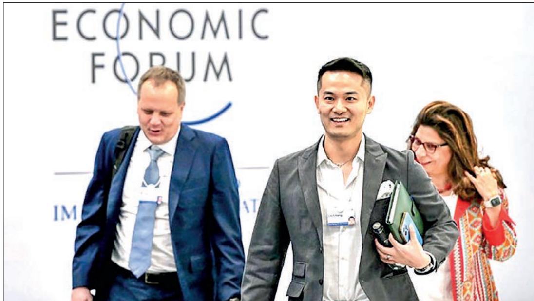
Participants walk to the venue of the 14 th Annual Meeting of the New Champions, also known as the Summer Davos, in north China's Tianjin Municipality, 27 June 2023. The 14 th Annual Meeting of the New Champions opened here on Tuesday.

computing power and intelligent technologies, including digital twins, artificial intelligence and machine learning, augmented reality, and cloud and edge computing, are bringing enormous opportunities for