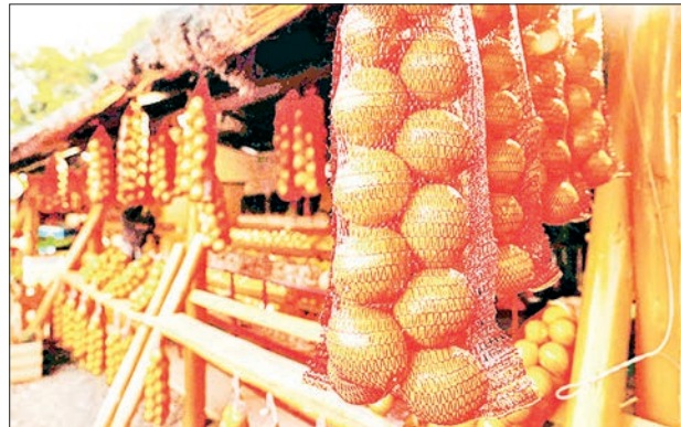
Oranges account for more than half of South Africa's total citrus exports.

“We estimate that of the normal amount we would send to the EU, that we would probably send maybe 15 or 20 per cent less oranges to the EU this year, simply because we can't treat and cool the volume of fruit that's needed,” Citrus Growers' Association CEO Justin Chadwick told AFP. If the quantity of oranges South Africa typically exports to the EU annually were cut by a fifth — around 80,800 tonnes — it would mean European supermarkets needing to make up a shortfall of 5.4 million 15 kilogrammes boxes. — AFP