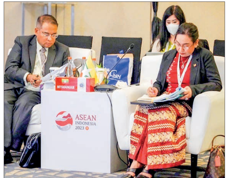
Deputy Minister Dr Wah Wah Maung attends 8 th Meeting of High-Level Task Force on ASEAN Community's Post-2025 Vision (HLTF-ACV) in Jakarta.

The Deputy Minister expressed appreciation to Co-chairs and ASEAN Secretariat for developing zero draft ASEAN Vision 2045 and stressed that the ASEAN's Community Post-2025 Vision should be guided by the Core Elements which was noted by the 40 th and 41 st ASEAN Summits. She also emphasized the importance of the spirit of