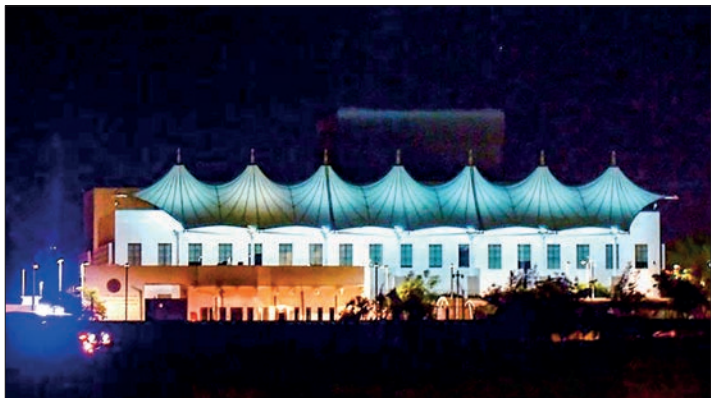
The US consulate in the Red Sea city has been the target of previous attacks, including one on 4 July 2016 — American Independence Day — when a suicide bomber blew himself up.

SAUDI authorities were investigating Thursday after an assailant and a security guard were killed in an exchange of gunfire outside the US consulate in Jeddah, the gateway city