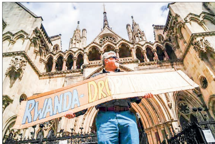
A demonstrator holds a placard during a protest against Britain’s Rwanda asylum plan outside the High Court in London on 13 June 2022.

The judges, however, said Interior Minister Suella Braverman — an immigration hardliner — had not properly considered the circumstances of the eight claimants in the case and referred their cases back to her. — AFP