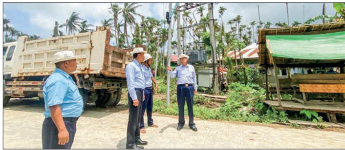
Deputy Minister U Aye Kyaw inspects repairs of power cables in Rakhine State on 29 June.

DEPUTY Minister for Electric Power U Aye Kyaw inspected progress of the restoration of Mocha-hit power lines and substations in Sittway yesterday morning.