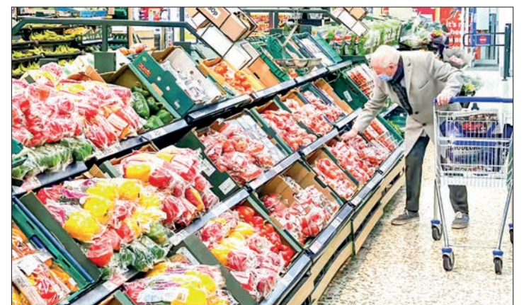
The study comes as soaring food prices are up more than 18 per cent in the year to May, according to latest official figures, despite a slight slowdown in the rate of increase.

"Access to food in the UK is very inequitable, and we believe that more attention needs to be placed on overcoming these inequities than simply focusing on increased food production through ever more industrialised agriculture," said IDS director Melissa Leach said in a statement. — AFP