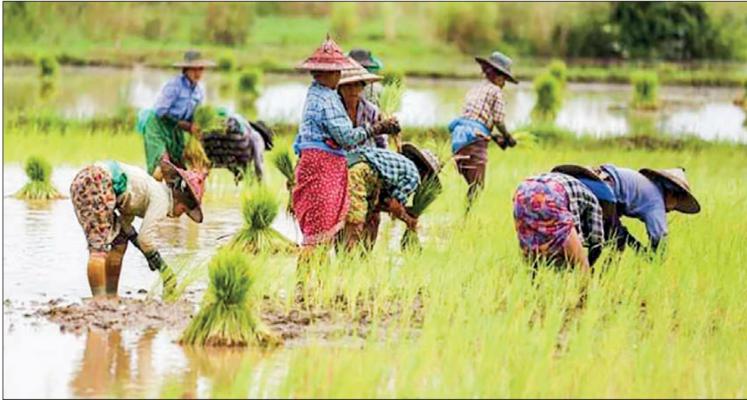
Some female farming workers are seen planting monsoon paddy saplings.