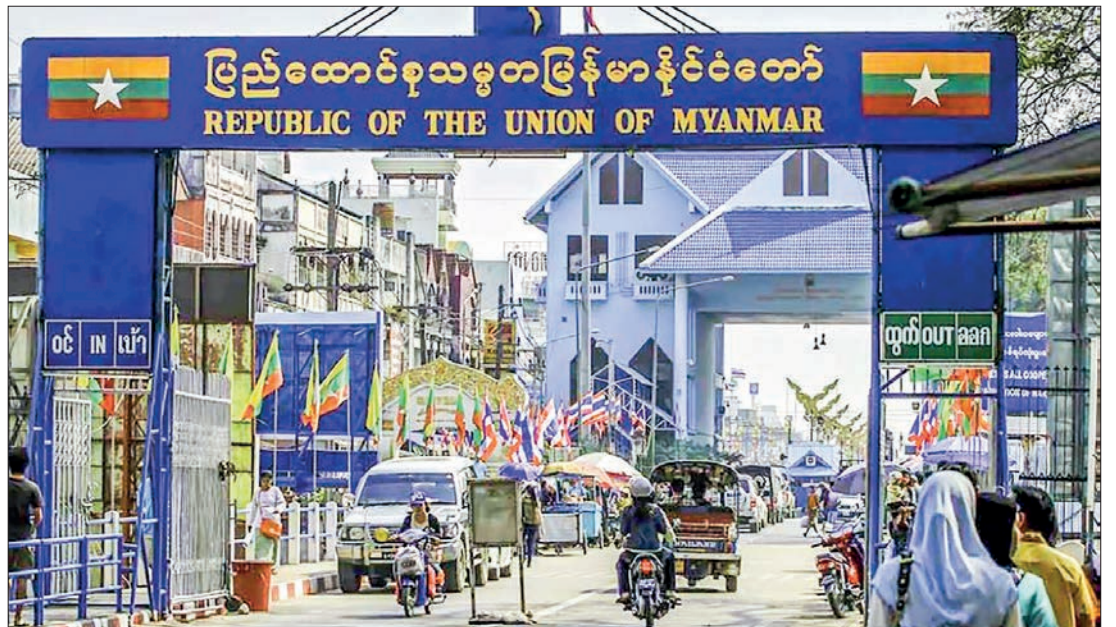
The Myanmar-Thailand border is seen being crowded with vehicles.

THE value of Myanmar's bilateral trade with the neighbouring country Thailand through the border amounted to US$1,037.665 million between 1 April and 16 June in the current financial year 2023-2024, the statistics issued by the Ministry of Commerce indicated. The figure is however down by $82.826 million compared to $1,120.491 million recorded in a year ago.