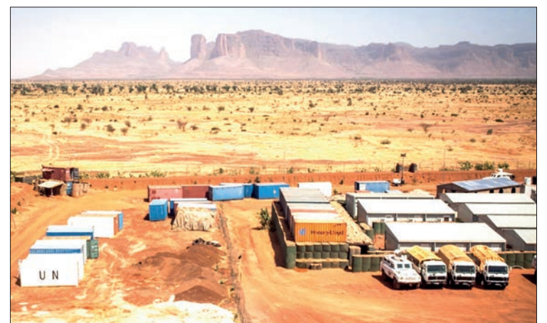
An aerial view shows the United Nations Mission in Mali (MINUSMA) camp in Douentza, Mopti region on 11.5.2021.

Therefore, the latest draft resolution from France on Wednesday, seen by AFP, suggests the Security Council will "terminate Minusma's mandate under resolution 2640 (2022) as of June 30 2023." — AFP