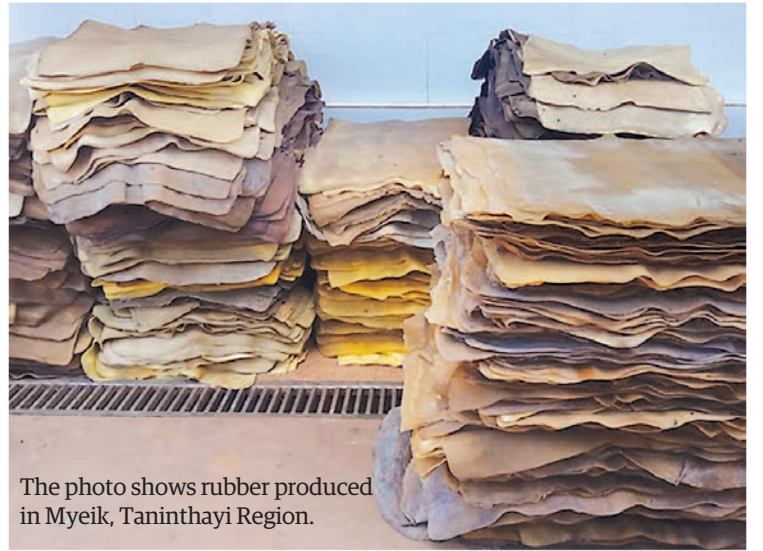
The photo shows rubber produced in Myeik, Taninthayi Region.

The rubber production in the last FY 2022-2023 reached over 360,000 tonnes and more than 200,000 tonnes of rubber were shipped to foreign trade partners. — NN/EM