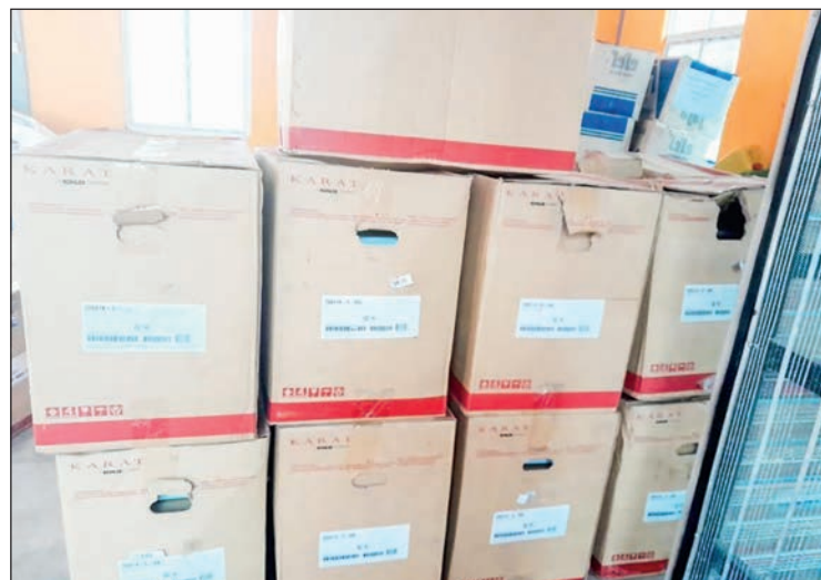
Karat toilet commodes seized at Kawkareik (Tadakyoe) checkpoint on 27 June.

On 28 June, the combined teams on duty at the Latpanhla-Singu temporary checkpoint captured two kinds of goods worth K4.9 million including 1,800 kilogrammes of pieces of wood supposed to be red sandalwood worth K20 million, China-made 3,350 umbrellas and 1,500 kilogrammes of peanut from a Nissan Diesel truck (estimated value of K35 million).