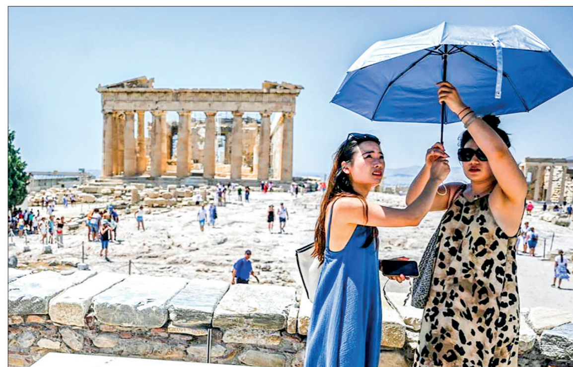
Tourists visiting the Acropolis in Athens in July, 2022.