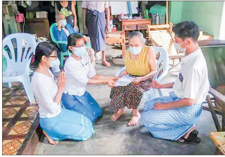
Officials present social pension to an older person through door-to-door service.