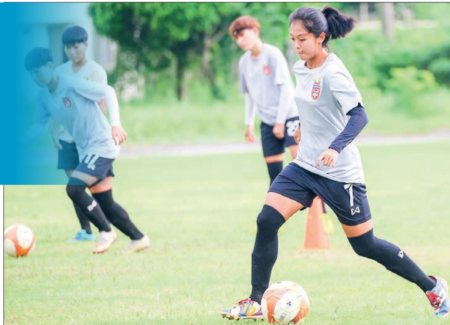
Women footballers seen in training session.

THE Myanmar U-19 Women's Team is preparing for the 2023 ASEAN U-19 Women's Football Tournament to be held in the first week of July.