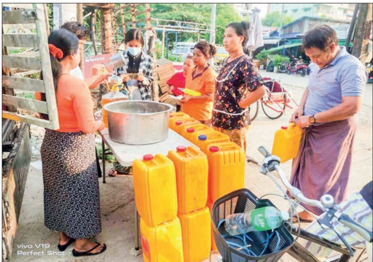
A file photo shows Myanmar Edible Oil Dealers' Association directly selling oil to the consumers in 2022.

The cloth roll, construction materials, industrial raw materials, pharmaceuticals, motorcycle parts, footwears, clothes, fruits, food products, cosmetics, gas, lubricants, household goods, feedstuff, bicycles, stationery, auto parts, tiles, feedstuff, fertilizer and electronic devices are imported.—NN/EM