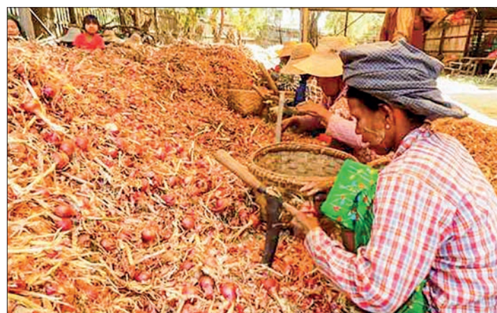
Monsoon onions are seen before sending to the market.

Onion prices rose to record highs in the last months of 2015, 2019, and 2022. As it was in 2022, the newly-harvested