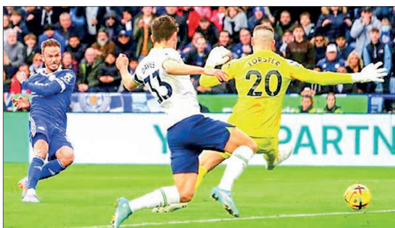
James Maddison (L) scored for Leicester against Tottenham in February.

TOTTENHAM Hotspur on Wednesday completed the signing of creative midfielder James Maddison from relegated Leicester in a deal worth 40 million pounds (46.3m euros) plus add-ons.