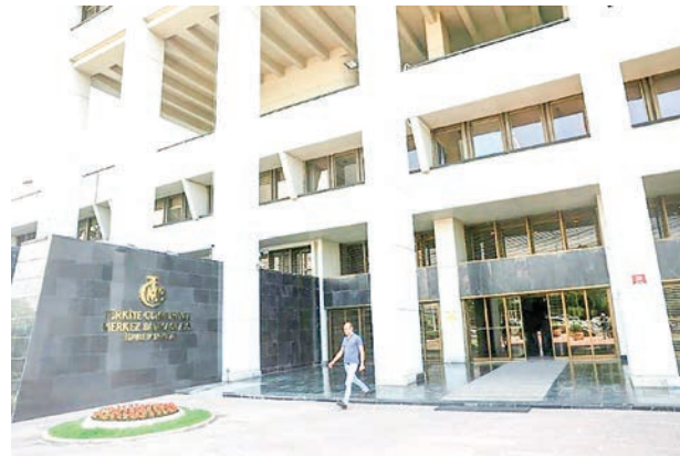
Türkiye's central bank is expected to dramatically raise interest rates on Thursday.

The central bank will hold its first policy meeting Thursday since Erdoğan