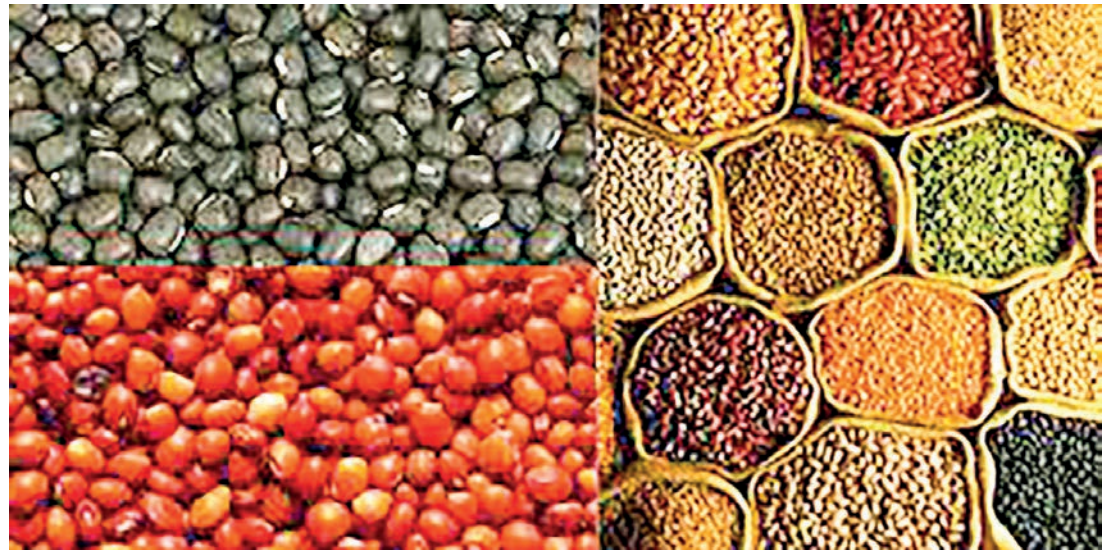
The photo shows various beans including black grams and pigeon peas being organized for sale in the market.

Monsoon pulses cultivation season has started and the newly harvested pigeon pea will enter the market at the end of the year. — TWA/EM