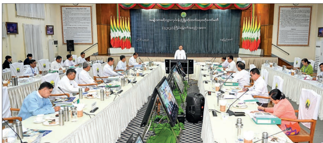
SAC Member Deputy Prime Minister Union Home Affairs Minister Lt-Gen Soe Htut chairs the meeting 1/2023 of the National Tourism Development Central Committee in Nay Pyi Taw yesterday.

Due to the outbreak of COVID-19, international airlines were suspended in 2020 and 2021 and Myanmar’s tourism industry was also totally suspended for travel restrictions like other world countries. Before 2019, there were 4.36