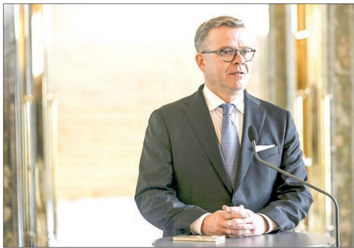
National Coalition Party chair Petteri Orpo addresses his press conference at the Finnish Parliament in Helsinki, Finland, on 20 June 2023, after the parliament elected him as a new Prime Minister.

FINLAND'S parliament on Tuesday elected conservative Petteri Orpo as prime minister at the head of a four-party coalition including the far-right Finns Party which plans a major crackdown on immigration.