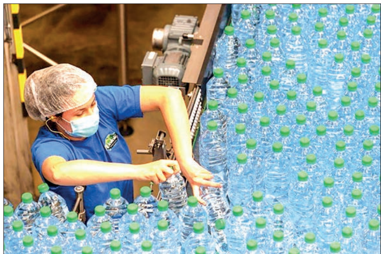
French officials say there is no proof that Volvic’s operations are causing nearby streams to dry up. PHOTO: AFP

Volvic’s public fountains were switched off and villagers fear water cuts this summer. — AFP