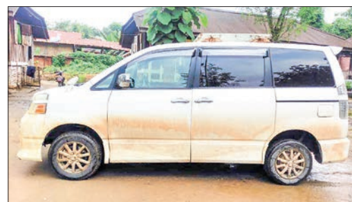
Confiscated illegal vehicle in Kachin State.

A total of six arrests were made on 19 and 20 June, with an estimated value of K81,425,000, as reported by the Illegal Trade Eradication Steering Committee. — MNA/MKKS