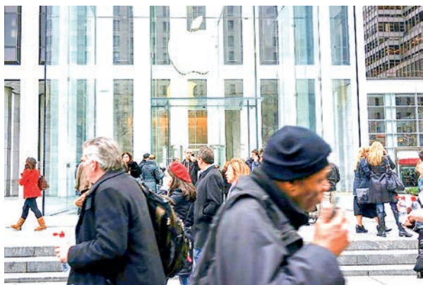
Apple unveiled its Live Speech feature in May that uses machine learning — the term Apple uses for AI — to re-create a user's voice.

The idea is to allow people who are at risk of losing the ability to speak to type messages and have them read out in their natural voices. Google, meanwhile, is testing an upgrade to its Lookout app, a programme that describes images to blind people and those with impaired vision. — AFP