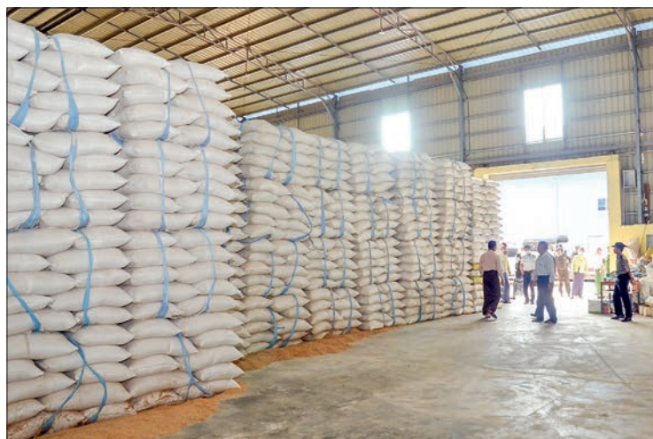
Rice bags are seen being well organized at the warehouse.

The traders must create a warehouse inventory list to track the stocks. The Department of Consumer Affairs and