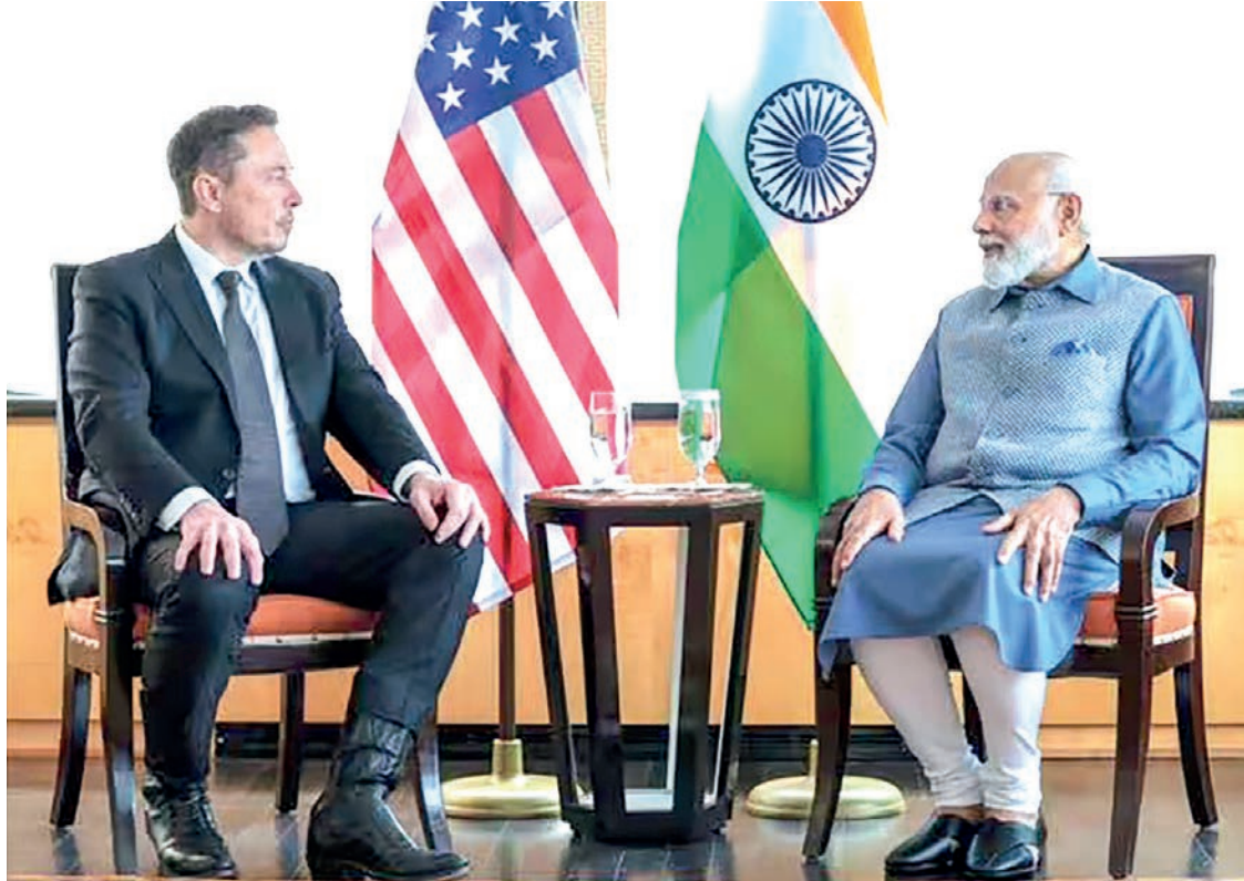
PM Modi met US health experts, academics, think tanks & entrepreneurs, invited Elon Musk to invest in India. The Tesla chief said that he is incredibly excited about the future of India.

Since the coronavirus pandemic, many companies have expanded their presence in India as a way to cut their supply-chain dependence on China and tap into the South Asian nation’s huge domestic market.