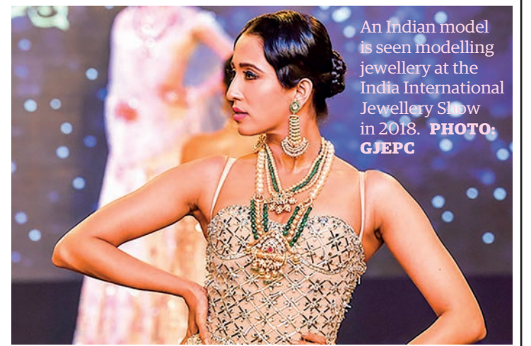
An Indian model is seen modelling jewellery at the India International Jewellery Show in 2018.

der the Ministry of Commerce via email at moctradefair@myantrade.gov.mm , by phone at 067-408622 and 067-408623. — TWA/CT