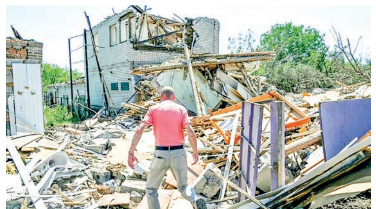
Ukraine’s Prime Minister Denys Shmygal told them rebuilding could cost at least $750 billion.

The first, in Lugano, Switzerland, in July last year saw Kyiv’s allies commit to supporting Ukraine through what is expected to be an eye-wateringly expensive and decades-long recovery. Ukraine’s Prime Minister Denys Shmygal told them rebuilding could cost at least $750 billion. — AFP