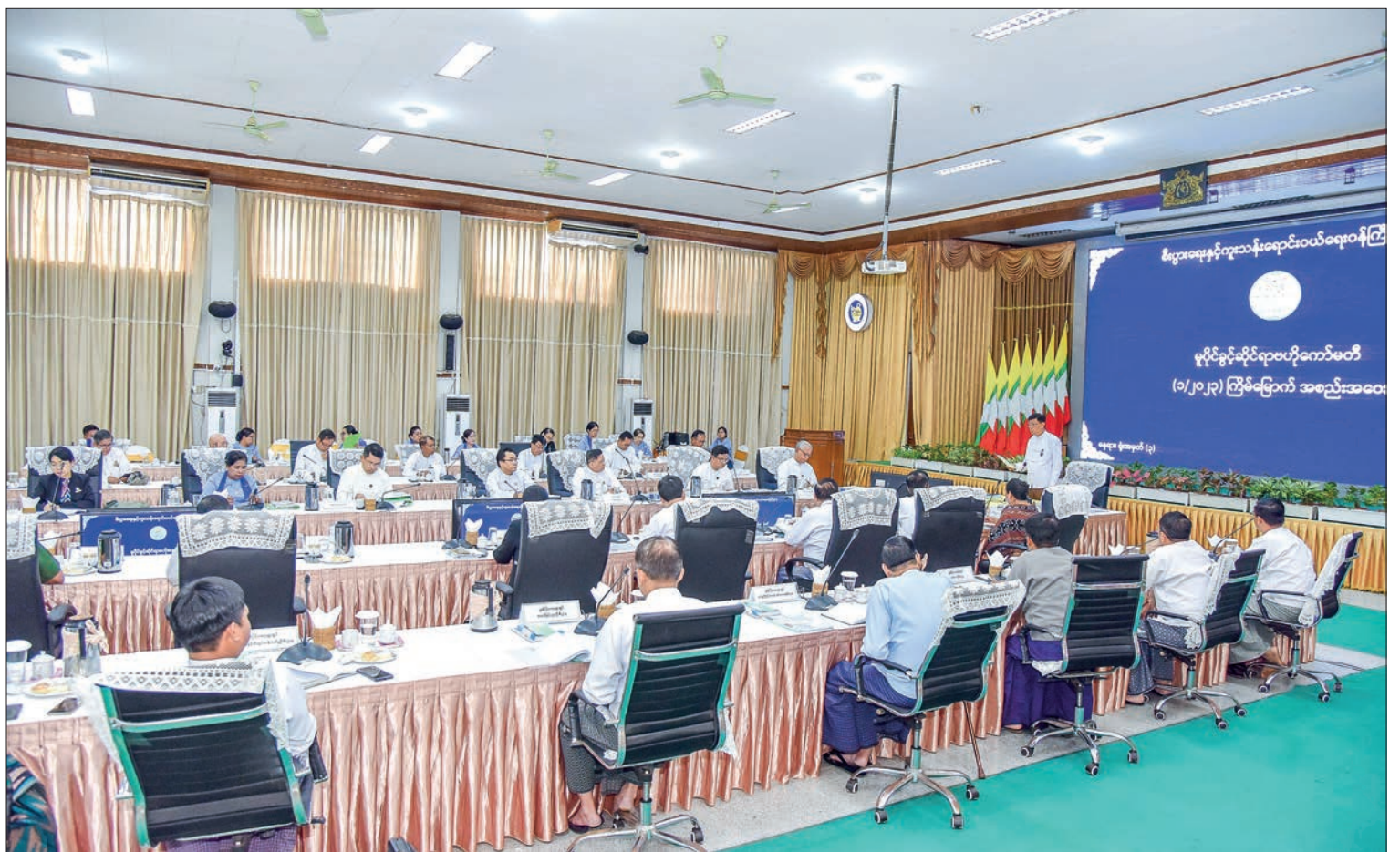
The 1/2023 meeting of the Central Committee on Intellectual Property Rights in progress yesterday in Nay Pyi Taw, presided over by Committee Chair Deputy Prime Minister Union Defence Minister General Mya Tun Oo.

The General stressed the need to form the IP Rights Central Committee with experts