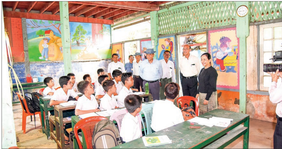
Deputy Prime Minister Admiral Tin Aung San, Union Ministers and officials view the peaceful learning of students at BEHS 4 Sittway yesterday.

Admiral Tin Aung San and party proceeded to Sittway Multipurpose Port and inspected the