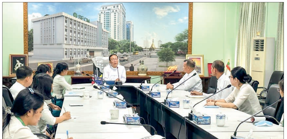
Deputy Prime Minister U Win Shein holds talks with the staff from the Myanmar Agricultural Development Bank on 20 June.

DEPUTY Prime Minister Union Minister for Planning and Finance U Win Shein met the staff of the Myanmar Agricultural Development Bank headquarters on 20 June morning.