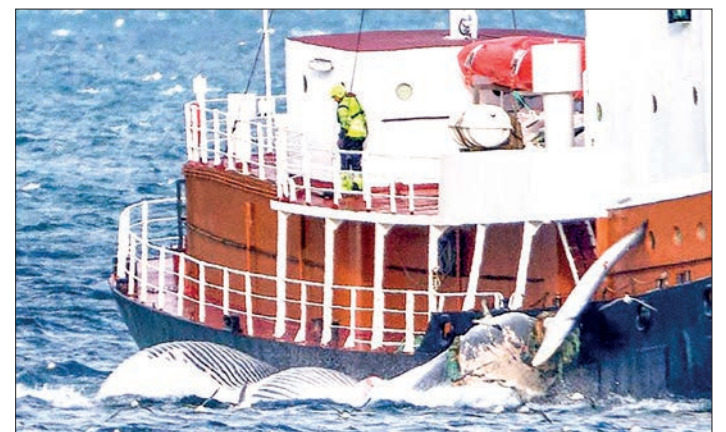
With Iceland’s whale hunt suspended until 31 August it now looks doubtful the nation’s last remaining whaling company, Hvalur, would head out to sea that late in the season.

Iceland’s whaling season runs from mid-June to mid-September, and it is doubtful Hvalur would head out to sea that late in the season. Annual quotas authorize the killing of 209 fin whales — the second-longest marine mammal after the blue whale — and 217 minke whales, one of the smallest species. But catches have gone down drastically in recent years due to a dwindling market for whale meat. Iceland, Norway and Japan are the only countries in the world that have continued whale hunting in the face of fierce criticism from environmentalists and animal rights’ defenders. — AFP