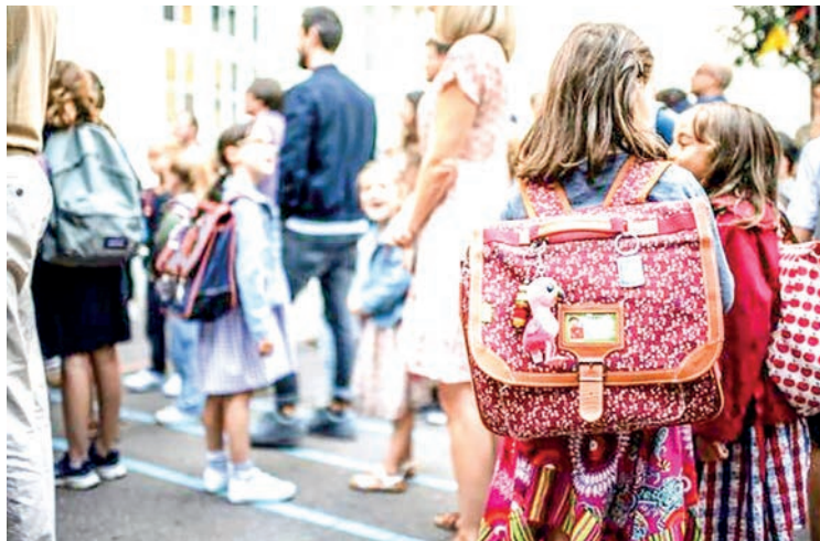
According to the Ministry of Education, incidents of violations of secularism decreased between April and May.

FRANCE’S identity has long been linked to its vision of secularism in public life.