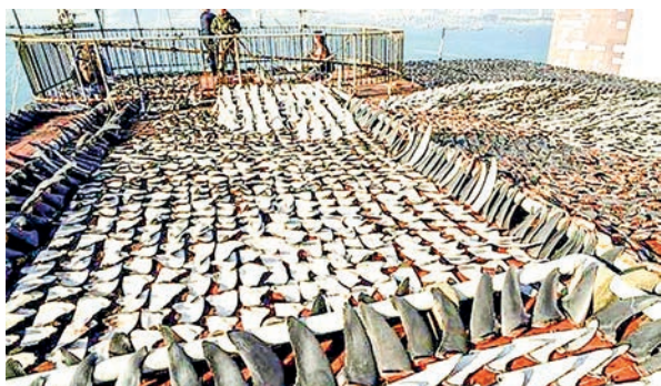
Environmental protection agency Ibama estimated around 10,000 shortfin mako and blue sharks were killed to harvest the fins, which are considered a delicacy in Asia.

in Asia. "It is possibly the largest seizure in history of this type of product," Ibama environmental protection director Jair Schmitt said in a statement. The fins were seized from two export companies, one in the southern state of Santa Catarina, the other in the southeastern state of Sao Paulo, officials said. — AFP