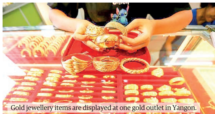
Gold jewellery items are displayed at one gold outlet in Yangon.

To lower the gold price, the Ministry of Natural Resources and Environmental Conservation has been selling gold ingots under the competitive bidding system in Yangon, Mandalay and Nay Pyi Taw. With an aim at reducing gold prices, the YGEA and Mandalay Gold Entrepreneurs Association sold gold bullion supplied by the executive members and the members as well. — NN/EM