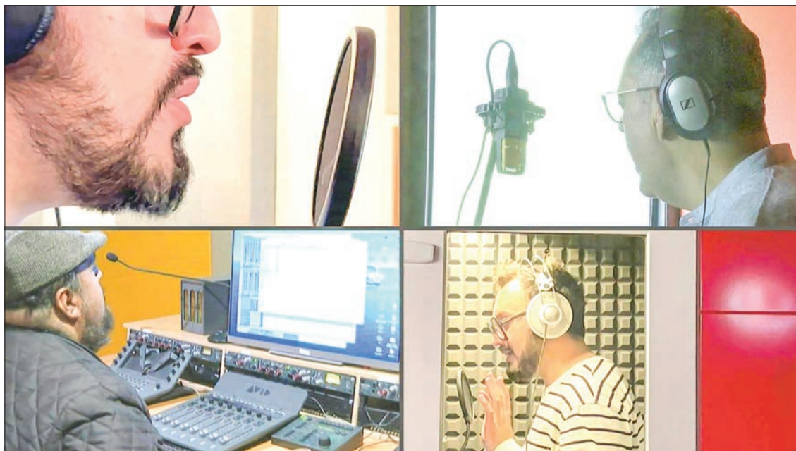
Commercial voiceover artists, voice actors, audiobook narrators and video game narrators fear that their talent will be displaced by synthetic voices, or even worse, that their own will be cloned by artificial intelligence without their consent, putting their livelihood at stake.