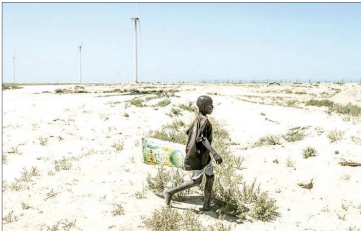
Only 10% of clean energy investment is going to emerging and developing countries other than China, according to the IEA.

Speeding the transition from dirty to clean energy, and helping the Global South cope with and prepare for devastating climate impacts are high on the summit agenda. — AFP