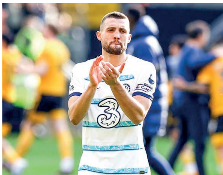
Chelsea midfielder Mateo Kovacic is reportedly on his way to Manchester City.

MANCHESTER City have agreed a £30 million ($38 million) deal with Chelsea to sign midfielder Mateo Kovacic, according to reports on Wednesday.