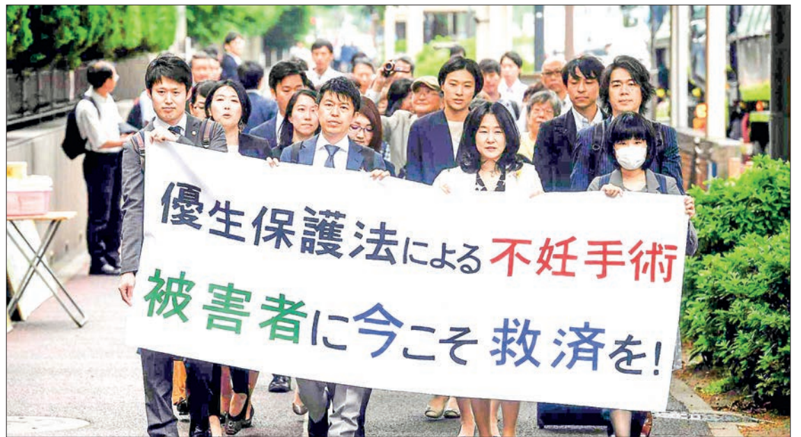
Demonstrators march in support of forced sterilization victims in May 2018.

Victims of the sterilization programme campaigned for decades seeking recognition