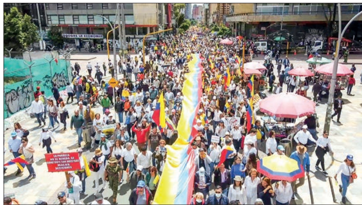
Called by the right-wing opposition under the banner "march of the majority," protesters gathered Tuesday in cities including Bogota, Medellin, Cali and Barranquilla. PHOTO: AFP

The mobilization seemed particularly large in Colombia's second-largest city, Medellin, according to images broadcast by national media. — AFP