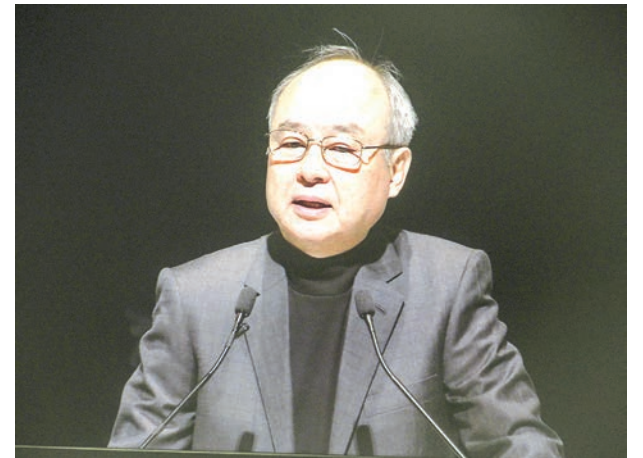
Softbank Group Corp CEO Masayoshi Son speaks at the company's annual shareholders' meeting in Tokyo on 21 June 2023.

"An artificial intelligence revolution is about to explode," Son said at the company's annual shareholders' meeting in Tokyo, citing the recent popularity of ChatGPT, a generative AI chatbot developed by US-based OpenAI. Son said Arm Ltd., SoftBank's British subsidiary that designs chips for various products