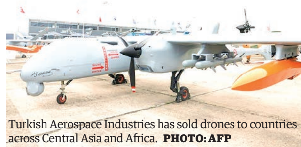
Turkish Aerospace Industries has sold drones to countries across Central Asia and Africa.

ern systems, but more neutral than buying Russian, Chinese or Iranian while guaranteeing satisfactory quality," Leo Peria-Peigne, a researcher at the French Institute of International Relations (IFRI) wrote in a recent paper. — AFP