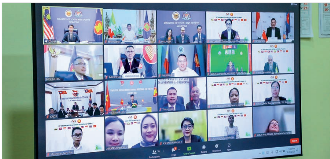
Union Minister U Min Thein Zan joins the 12 th ASEAN Ministerial Meeting on Youth and related meetings virtually yesterday.

UNION Minister for Sports and Youth Affairs U Min Thein Zan attended the 12 th ASEAN Ministerial Meeting on Youth and related meetings virtually at 7:30 am yesterday.