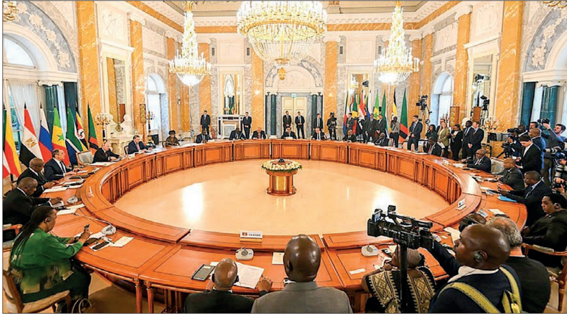
Meeting with heads of delegations of African states.

RUSSIAN President Vladimir Putin presented the African delegation with the draft of the Istanbul agreement on the Ukraine settlement, which, as the Russian president said, specifies everything from the number of armed forces to units of military equipment and personnel.