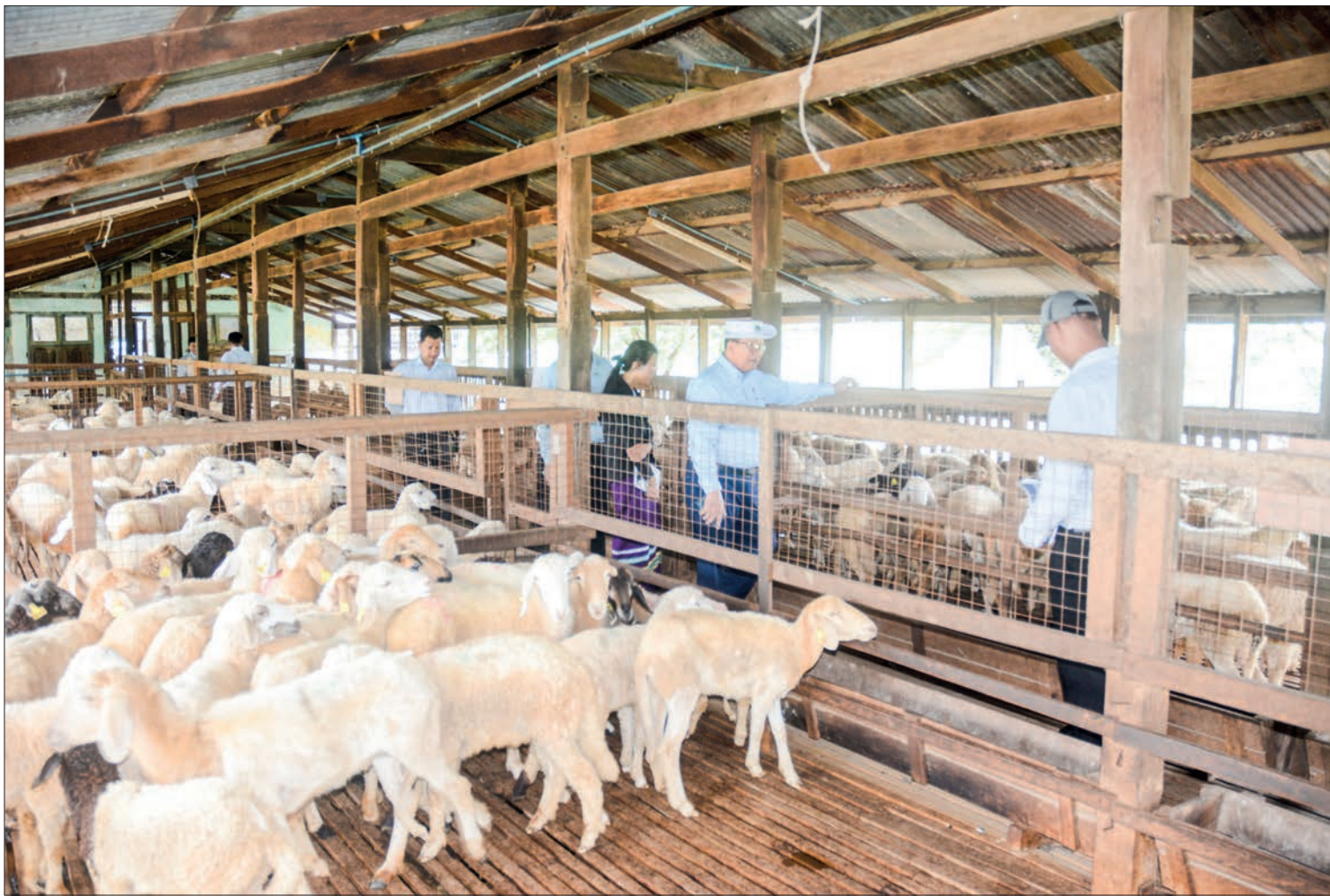
The Thaphanchan Livestock Breeding Applied Research and Regeneration Farm is seen in Kyaukse Township, Mandalay Region.

Livestock Breeding Applied Research and Regeneration Farm is located. This farm focuses on the production and distribution of new goat species, as well as the management of pedigree animal species and regeneration measures. Despite its location in a dry region, the farm has successfully secured a water supply not only for its own regeneration purposes but also for the Bowa goat farm, Hteinsan goat farm, and sheep farm. Local authorities are currently exploring options for constructing water tanks to fulfill the water needs of these animal farms.