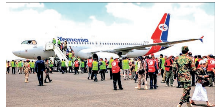
Officials gather outside a Yemenia Airways Airbus A320 aircraft carrying returned Huthi prisoners, exchanged in a deal Yemen’s internationally recognised-government, upon arrival at Sanaa International Airport on 14 April 2023.

Air traffic was largely halted by the blockade, but there have been exemptions for aid flights that are a lifeline for the population. — AFP