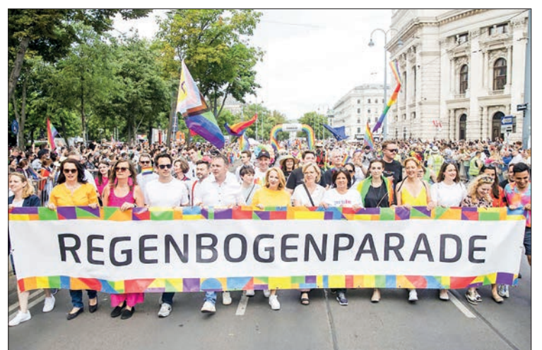
Some 300,000 took part in the parade for LGBTQ rights.

One of them was already previously known to police. They had planned to use “knives or vehicles” in the attack, police told reporters. — AFP