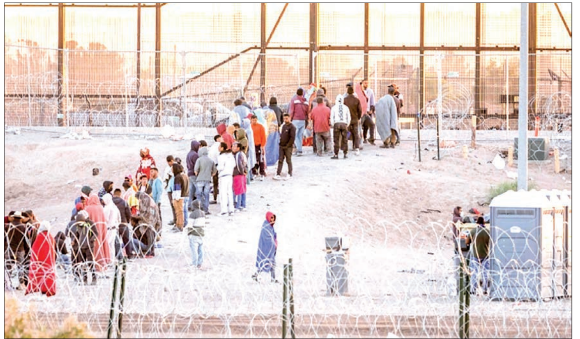
The opening of US migrant processing centres in Colombia, Costa Rica and Guatemala ensures that more than ever these countries will become waiting rooms for asylum seekers wanting American visas. PHOTO: AFP

US officials consider the new program a success. — AFP