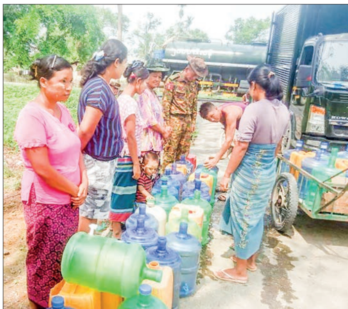
The relief teams distribute purified drinking water to locals in Kyauktaw yesterday.

Relief teams in Buthidaung cooperated with departmental staff to clean trees and bushes in the roads side of South Myothit Ward.