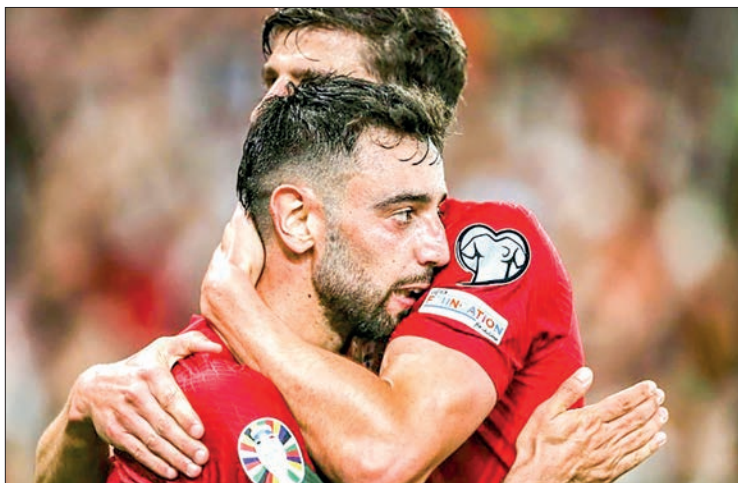
Bruno Fernandes celebrates with Ruben Dias after scoring one of his two goals as Portugal beat Bosnia and Herzegovina 3-0 in Euro 2024 qualifying.

Fernandes headed in the second from a Ruben Neves cross in the 77th minute and scored his second, and Portugal's third, in added time. Cristiano Ronaldo wore the captain's armband and played all 90 minutes as the 38-year-old men's international appearance record-holder won