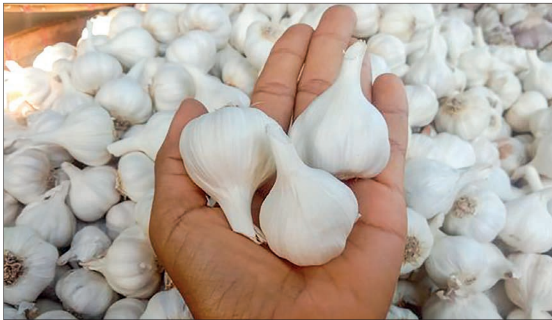
Kyukok garlic entering Yangon market.

BOTH locally produced garlic from Shan State and imported Kyukok garlic experienced price increases in mid-June. Compared to the previous year, prices have doubled at the beginning of the new crop season, according to a garlic depot seller on Yetama Street (Bayintnaung).