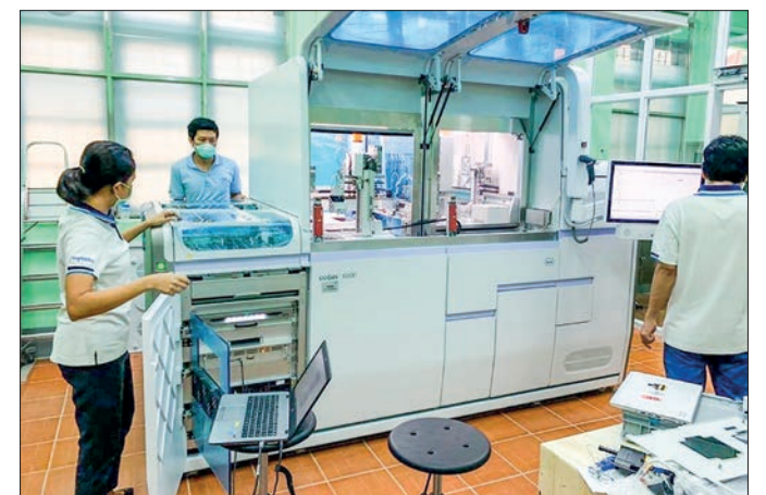
Officials examine laboratory samples of Covid-19.

ACCORDING to the Ministry of Health, there were 354 new patients infected with Covid-19 nationwide, and the rate of infection was around 1 per cent in the week from 10 to 16 June.