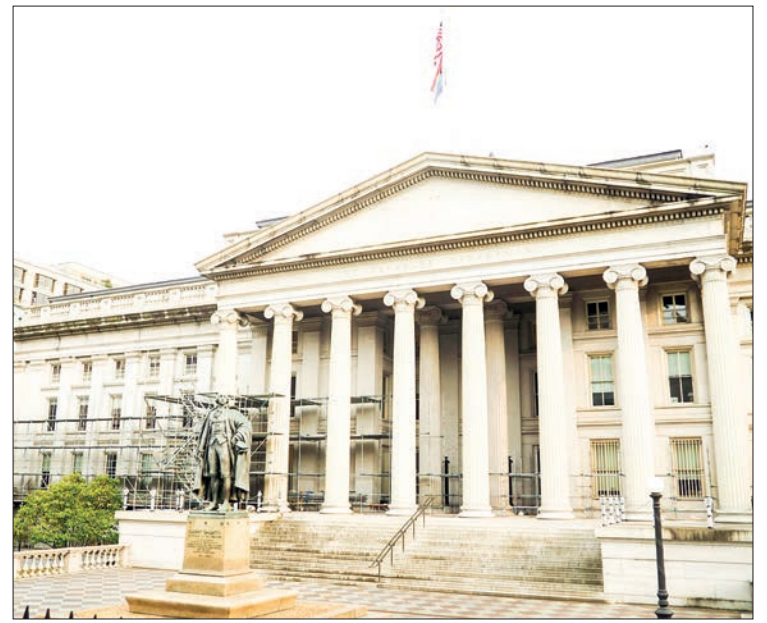
Photo taken 16 June 2023, shows the US Treasury Department in Washington. PHOTO: KYODO

For the list, the department uses three criteria to assess whether a country has manipulated its foreign exchange rates to gain an unfair trade advantage. — Kyodo