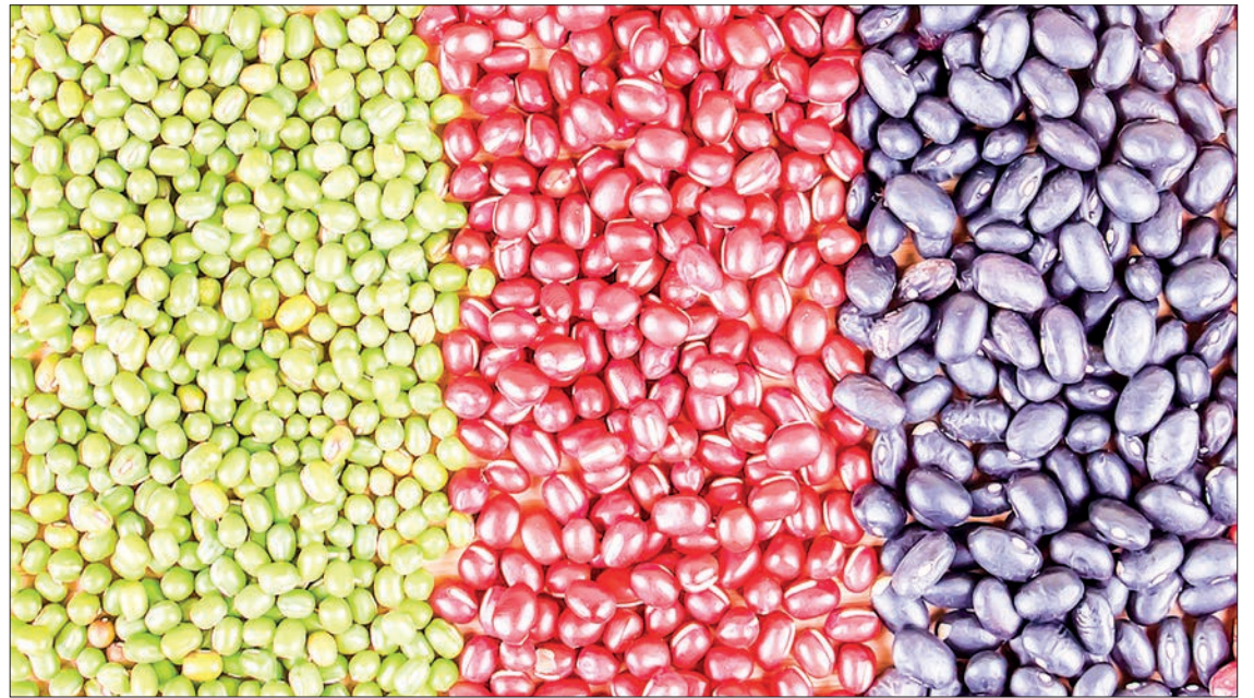
Beans and pulses displayed in the market.

The current prices for pulses stand at K2.425 million per tonne of black gram (urad) and K3.235 million per tonne of pigeon peas