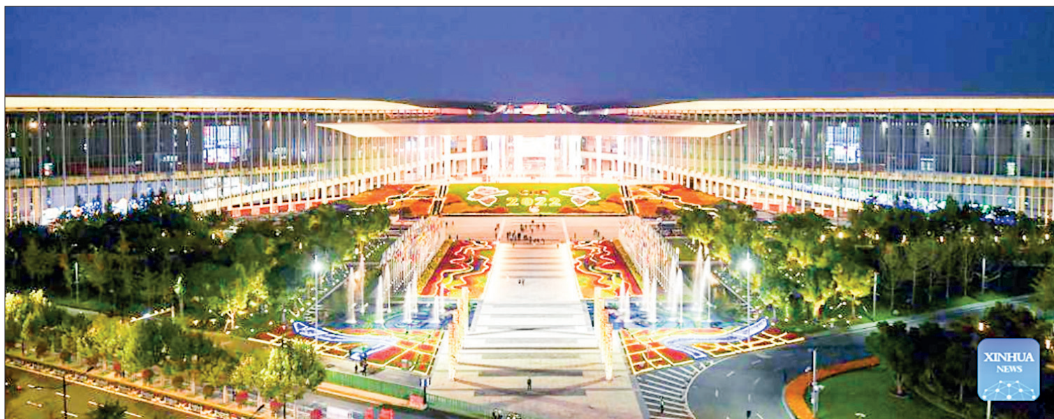
This photo taken on 5 November 2022 shows a night view of the National Exhibition and Convention Center (Shanghai), where the fifth China International Import Expo (CIIE) is taking place, in east China's Shanghai.

BUSINESSPERSONS from Myanmar are allowed to exhibit at the 6 th China International Import Expo (CIIE), to be held