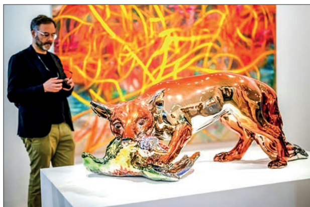
"Fox with Bird" 2016-2023 by US artist Jeff Koons, was sold within hours of Art Basel opening this week.

THE Basel contemporary art fair this week defied forecasts of a market slowdown, with wealthy collectors buying works with seven or eight-figure price tags.