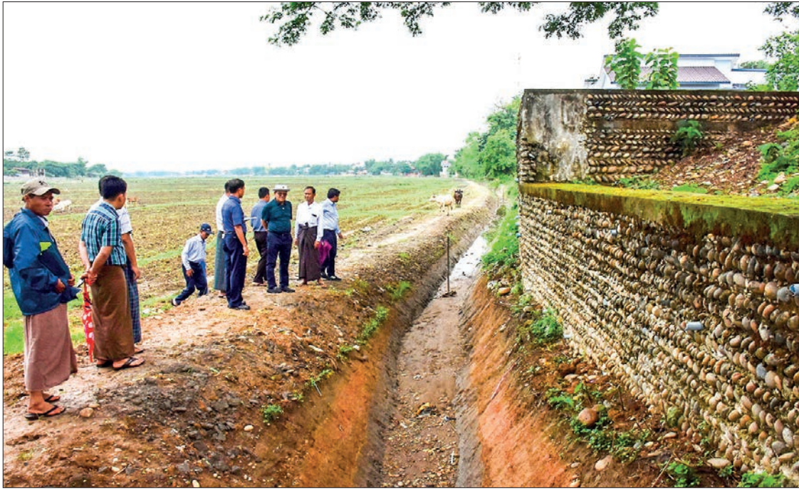
Chief Minister U Khet Htein Nan makes an inspection on the conditions of excavating the 2,000-foot-long drain around the model plot on 17 June 2023.

THE Kachin State Government has been making efforts to improve the agricultural sector in the state, increase the production of produce, and improve the socio-economic lives of the farmers. Kachin State Chief Minister U Khet Htein Nan examined the model paddy farm of 100 acres and 100 baskets per acre at the Mankhein Ward in Myitkyina at 2 pm on 17 June.