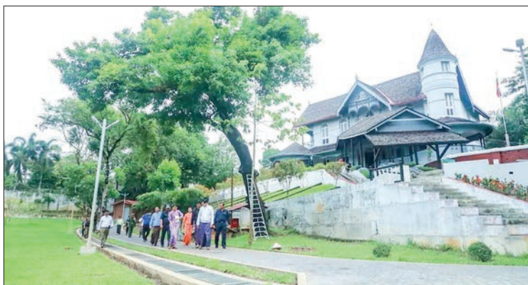
The Yangon Region Chief Minister and party inspect courtyard of Bogyoke Aung San Museum.

DURING the inspection at the Bogyoke Aung San Museum in Natmauk Street, Bahan Township on the morning of 14 June,