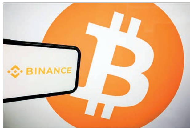
US regulators have accused crypto giant Binance of "an extensive web of deception" and "calculated evasion of the law".

The regulator did not specify how many of Binance's US customers are affected, nor the value represented by these funds. — AFP