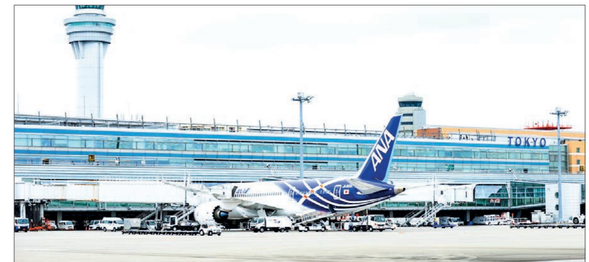
Haneda Airport handles both international and domestic flights. It serves as a hub for several major airlines and offers a wide range of domestic and international destinations.