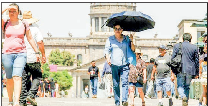
Pedestrians shield themselves from the sun in the city of Guadalajara in Mexico's Jalisco state.

The government of Nuevo Leon state, where Monterrey is located, has limited the time children attend school to two hours a day to avoid sun. — AFP