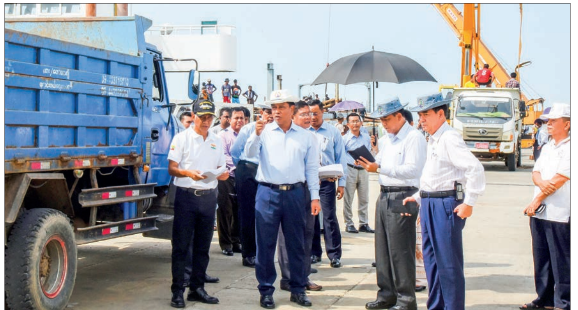
Member of the State Administration Council Deputy Prime Minister Union Minister for Transport and Communications Admiral Tin Aung San and officials inspect unloading of relief and rehabilitation materials at Sittway's multi-purpose port on 18 June 2023.

Finally, the Admiral stressed the need to manage distribution of foodstuffs to the affected people in areas through a priority plan. It is crucial to ensure that there are no delays in the loading and unloading of relief aid, and timely distribution of supplies. — MNA/KZW