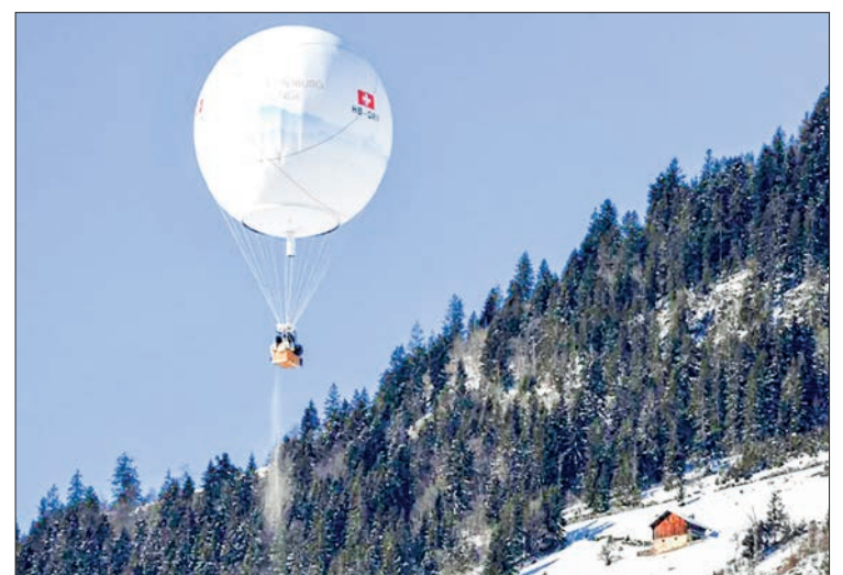
A hot-air balloon passes over the Swiss Alps at the Chateau-d'Oex ski resort. Seven people were injured on Saturday when a hot-air balloon caught fire.

The town's fire brigade was able to extinguish the fire quickly and secure the area.