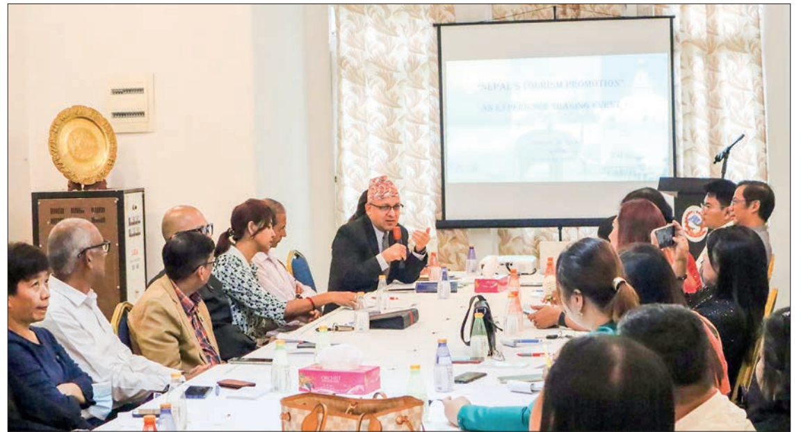
The Nepalese ambassador explains running of direct flight between Myanmar and Nepal at Nepalese embassy in Yangon recently.

Beyond the spiritual and ritual tour to the sustainable Lumbini, the birthplace of the Buddha, adventure tour such as mountaineering expeditions in the popular peak climbing regions, mountain flight, cable riding to enjoy the panoramic view, river rafting, boating, paragliding, ziplining, bungee jumping, sightseeing tour to the promi-