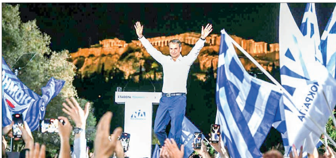
Greece is enjoying a rare respite from economic instability under Kyriakos Mitsotaki.

GREEK ex-prime minister Kyriakos Mitsotakis, who hopes to clinch an absolute majority in next week’s general election, is credited with returning his debt-ridden country to a path of growth.