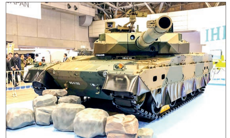
A Japanese ground self-defence force type 10 tank is displayed at a defence equipment fair called 'DSEI Japan' in Chiba, east of Tokyo, on 10 November 2019.

JAPAN'S Defence Ministry plans to set out guidelines for defense technologies that the country will prioritize for development, citing a dozen areas including innovations in miniaturized robotic technology, a source familiar with the matter said Saturday.