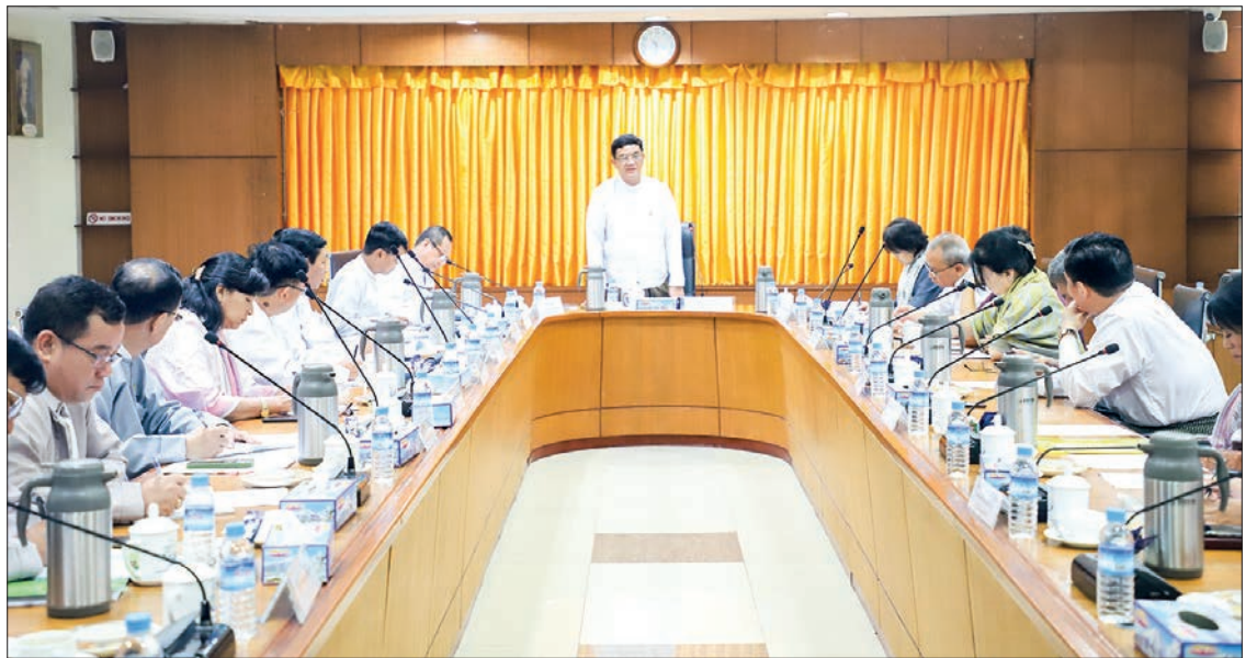
CMP Export and Import Supervision Subcommittee in progress at UMFCCI office in Yangon on 18 June.

In the meeting, they discussed issues related to the decisions of the subcommittee on the 1/2023 coordination meeting, the import and export operations of CMP companies by industrial zone, changes in the number of export and import companies for CMP, the condition of increasing export according to the lists of import and export, programmes that will be carried out to better understand the relevant processes according to the conditions of CMP operations on the ground, and issues to be done in the pharmaceutical manufacturing and export business with the CMP system. — MNA/CT