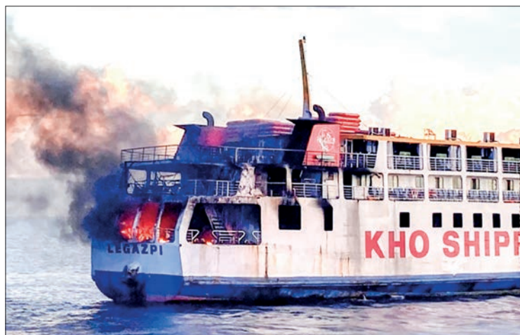
Fire engulfed the M/V Esperanza Star around 4:30 am local time off Panglao island as it approached the Tagbilaran City port.

The PCG spokesperson Armando Balilo said fire engulfed the M/V Esperanza Star around 4:30 am local time off Panglao island as it approached the Tagbilaran City port. Initially, Balilo said 55 to 65 passengers and crew were on the boat. The PCG station in Bohol said in a social media post that the boat was car-