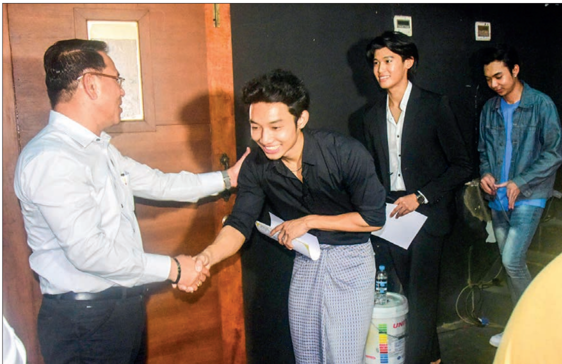
Union Minister for Information U Maung Maung Ohn warmly greets the trainees of Batch 7 New Talents Training at CMB Films Myanmar Co Ltd's studio yesterday.