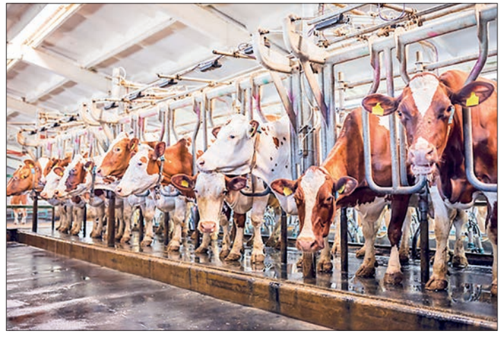
The New Zealand dairy industry is a significant sector of the country's economy and plays a vital role in its agricultural landscape. Known for its high-quality dairy products, New Zealand is one of the world's largest exporters of dairy products, particularly milk powder, butter, and cheese.

The government estimates it will cost up to NZ$15 million (US$9 million) to clean up the damage caused by the extreme weather. This is New Zealand's first recession since 2020, when the pandemic shuttered borders and choked exports. With the economy shrinking, inflation running hot at 6.7 per cent and a 14 October election approaching, the centre-right opposition was quick to blame the government. — AFP