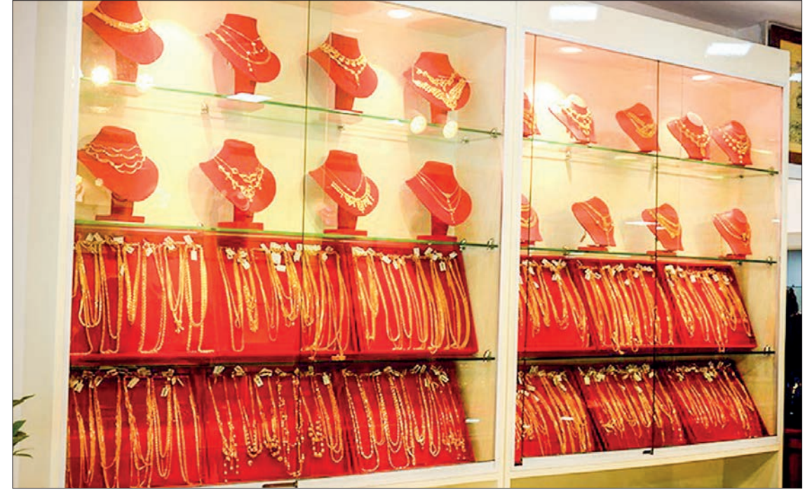
A supplied photo shows gold jewellery items being showcased at the gold outlet in Yangon.

IN a move to address the volatile gold market, the Mandalay Region Gold Entrepreneurs Association has announced the sale of gold bullion at K3,050,000 per tical (equivalent to 0.578 ounce or 0.016 kilo-