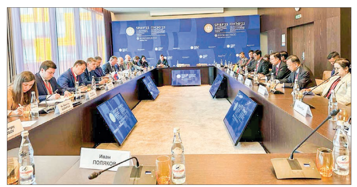
Deputy Prime Minister U Win Shein-led Myanmar delegation joins the 26<sup>th</sup> St Petersburg International Economic Forum in the Russian Federation on 14-17 June 2023.

THE Myanmar delegation, led by Deputy Prime Minister and Union Minister for Planning and Finance U Win Shein, including Union Minister for Investment and Foreign Economic Relations (MIFER) Dr Kan Zaw, Union Minister for Electric Power U Thaung Han, and Governor of the Central Bank of Myanmar Daw Than Than Swe, attended the 26th St Petersburg International Economic Forum (SPIEF'23) held from 14 to 17 June in St Petersburg, the Russian Federation.