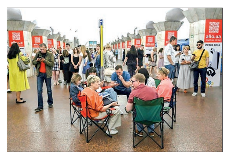
Air raid alerts sounded as African leaders were due to visit.

The African delegation arrived by train from Poland on Friday morning and began their visit in Bucha. — AFP