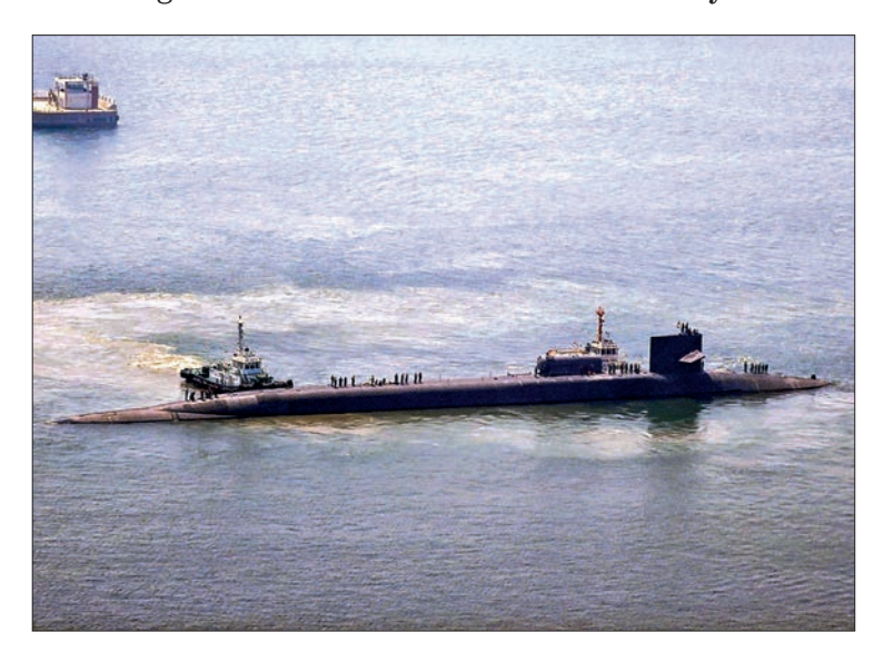
The nuclear-powered US Navy submarine Michigan makes a port call at Busan, South Korea, on 16 June 2023.

into the ocean off its east coast on Thursday night, with both projectiles landing inside Japan's exclusive economic zone, Tokyo and Seoul said. — Kyodo