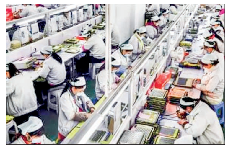
The picture depicts Myanmar workers in an electronics factory in Japan, diligently carrying out their duties.

While it is well-known that a significant number of Myanmar workers seek employment in Thailand, an increasing number are also reportedly finding work in other Asian countries such as South Korea, Japan, and the United Arab Emirates. —TWA/CT