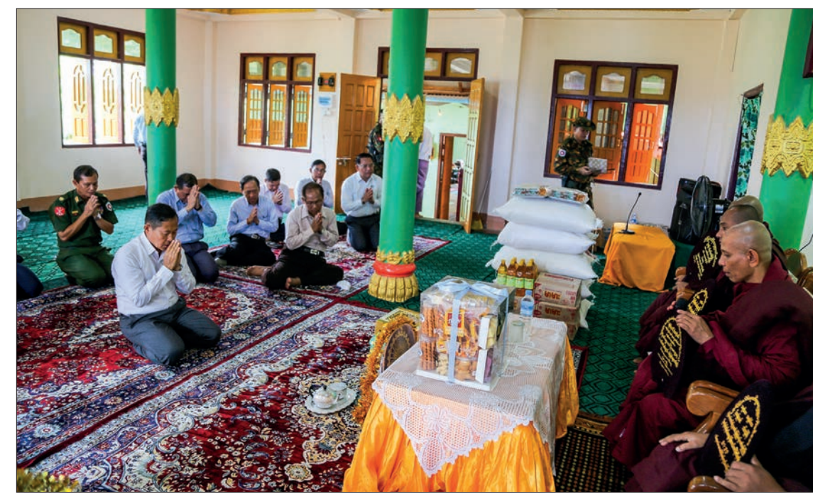
The Vice-Senior General donates rice and alms to the Minbya monastery.