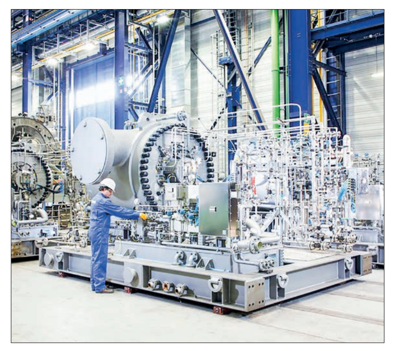
German industrial company Siemens has announced plans to invest two billion euros in expanding its manufacturing capacity. As part of this investment, Siemens will build a new high-tech factory in Singapore and expand an existing facility in China.

The group's announcement came a day after the German government published its first National Security Strategy that took aim at China for acting against Berlin's interests and values. — AFP