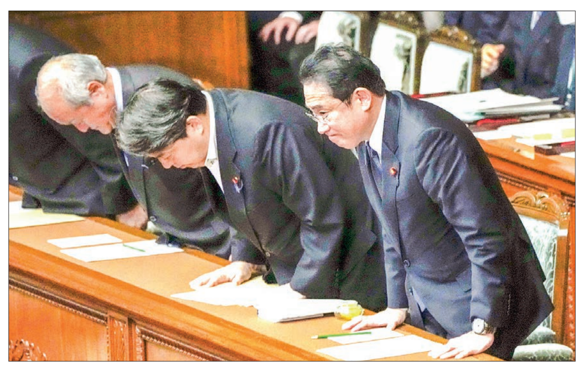
Prime Minister Fumio Kishida (far R) bows in parliament on 16 June 2023, after the House of Representatives voted down a no-confidence motion submitted by the main opposition party against his Cabinet.

was approved in the lower house, the chamber would be dissolved