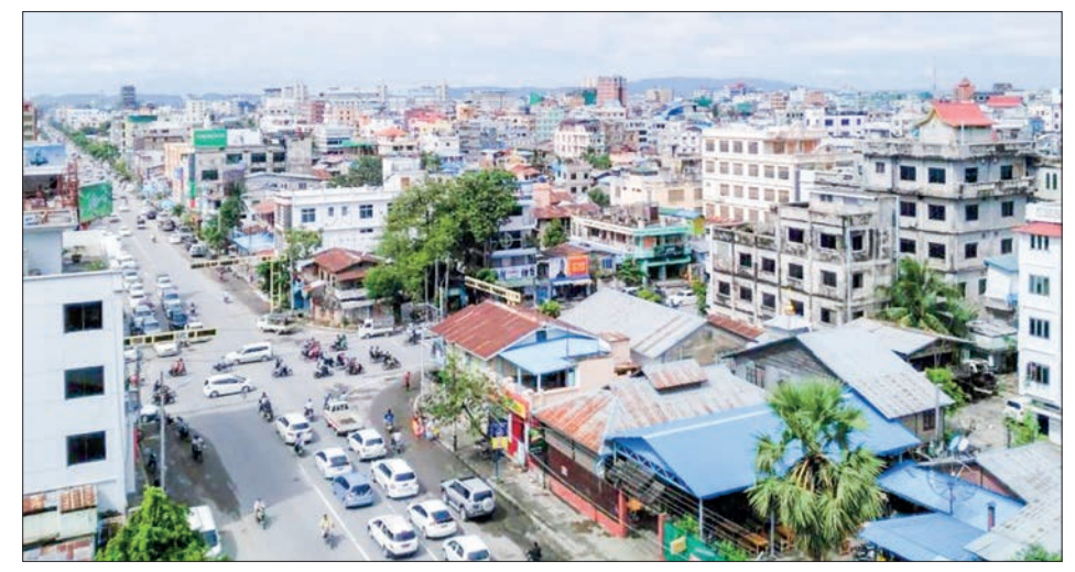
An aerial view of the landscape of buildings in Yangon.

AS the frequency of smallscale earthquakes continues to rise within the country, earthquake experts are sounding the alarm for increased vigilance regarding the movement of the Sagaing Fault, a significant fault line traversing