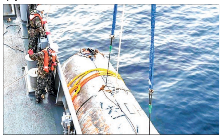
Images released by Seoul's defence ministry showed a long, white barrellike metal structure with the word "Chonma" written on it -- possibly a shorter form of the rocket's official name, Chollima-1.

the national agency for defence development," the Joint Chiefs of Staff said in a statement. -