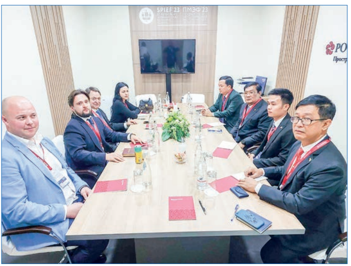
Union Minister U Thaung Han attends the second-day International Economic Forum 2023 on 15 June in the Russian Federation.

U Thaung Han, Union Minister for Electric Power, attended the second day of the International Economic Forum 2023 (SPIEF'23) on 15 June held in St Petersburg, Russia, along with U Lwin Oo, Myanmar Ambassador to the