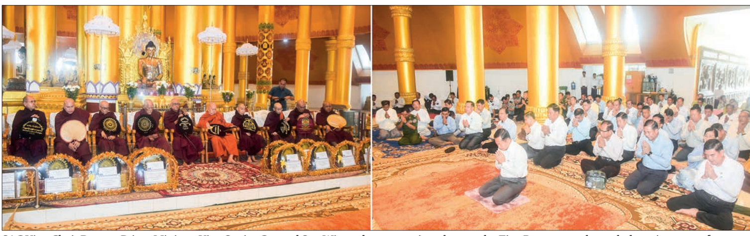
SAC Vice-Chair Deputy Prime Minister Vice-Senior General Soe Win and congregation observe the Five Precepts at the cash donation event for Mocha-hit monasteries, monastic education schools in Rakhine State yesterday.

Deputy Minister for Religious Affairs and Culture Daw Nu Mra Zan donated K106 million for Mocha-hit monasteries