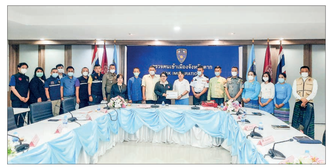
The picture depicts the handover ceremony of Myanmar victims of human trafficking who had been under the care of centres operated by the Ministry of Social Development and Human Security in Thailand on 15

NINE Myanmar nationals who had fallen victim to trafficking in Thailand were repatriated to Myanmar through the Myanmar-Thailand Friendship Bridge No 1 on 15 June.