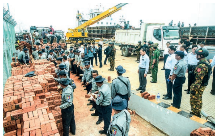
At the Kaladan Multi-Modal Port of Sittway.