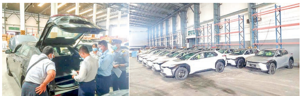
Officials check the newly-arrived battery electric vehicles (BEVs) at Yangon Port yesterday.

The import of battery electric vehicles (BEVs) is exempted from Customs duties.