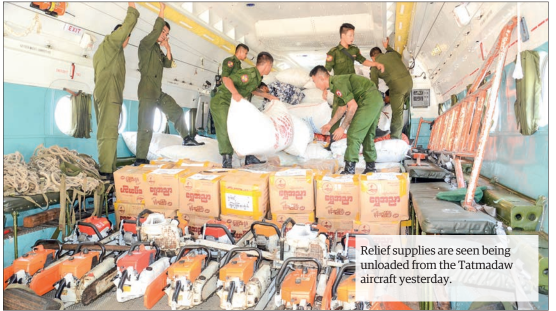
Relief supplies are seen being unloaded from the Tatmadaw aircraft yesterday.