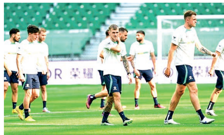
Australia's players take part in a training session ahead of the friendly against Argentina.

"Regarding Lionel Messi, how could you not respect someone who's done what he's done in football?" Australia coach Graham Arnold told reporters at the 68,000-capacity Workers' Stadium.