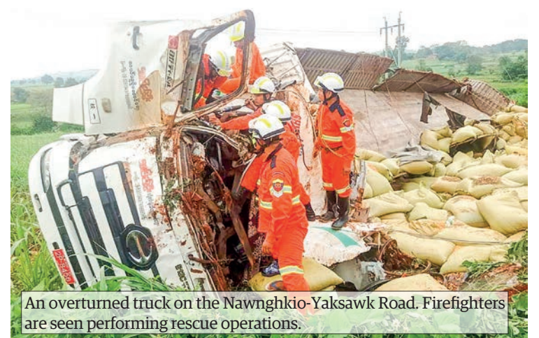
An overturned truck on the Nawngkhio-Yaksawk Road. Firefighters are seen performing rescue operations.

Search and rescue personnel from Nawngkhio Township Fire Station carried out rescue operations after receiving the report that the driver was trapped in the front seat at the scene of the accident. The ambulance of the Phusin Myitta Social Association rushed the driver (the deceased) and the conductor (not critically injured) to the Nawngkhio People's Hospital. — TWA/CT