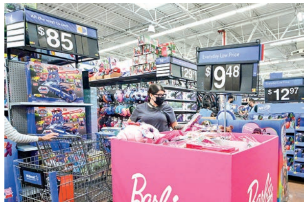
Sixty percent of the decline in final demand goods "can be traced to a 13.8-percent drop in prices for gasoline," the report added.

But most analysts expect it to skip a rate hike this time to give policymakers more time to assess the health of the US economy. — AFP