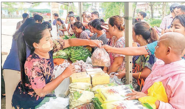
Sittway residents are seen buying foodstuffs yesterday.

partmental staff expressed their gratitude for being able to buy essential foodstuffs at affordable prices during such difficult times. — MNA/KZW