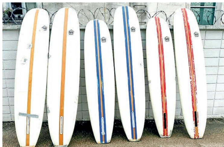
Uruguayan officials have announced the successful dismantling of a drug trafficking operation responsible for smuggling cocaine concealed within surfboards from South America to Europe.

package with the six surfboards on May 23, police said. Cocaine was found in the boards.