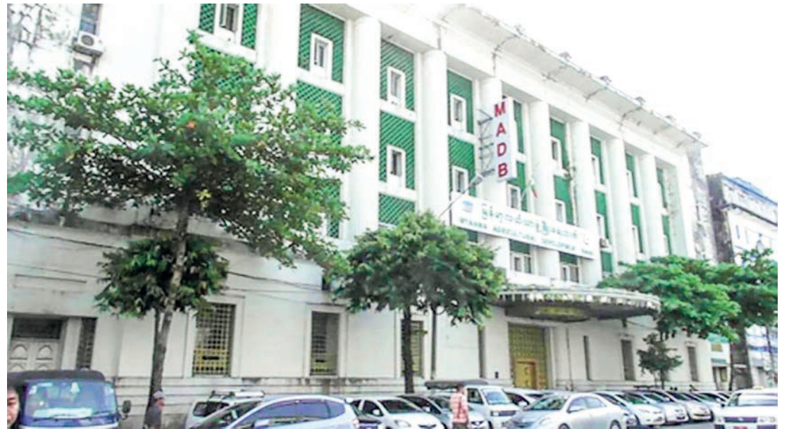
The Myanmar Agriculture Development Bank in Yangon.

THE Myanmar Agriculture Development Bank (MADB) made an announcement on 14 June stating that it will offer loans of up to K70 million to individual farmers who require financial support for agricultural and rural development purposes.