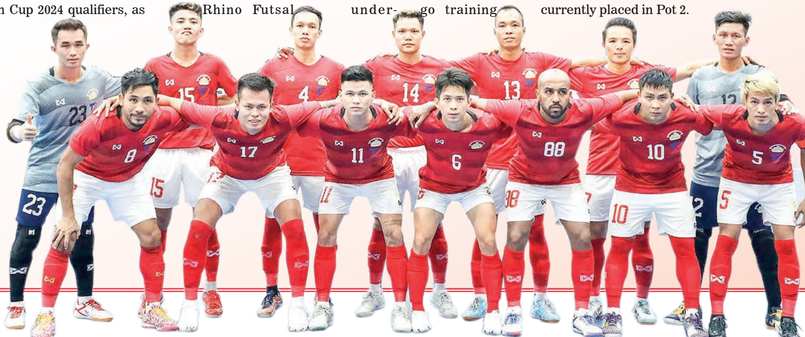
The Myanmar Football Federation select players from teams that competed in the MFF Rhino Futsal League 2022 and MFF Futsal League II 2022.