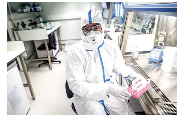
Researchers conducted a study where they analyzed proteins in the blood of individuals affected by extended COVID.

A recent study from the Allen Institute and Fred Hutchinson Cancer Centre suggested that the cause of many protracted COVID cases may be an excessive inflammatory response.