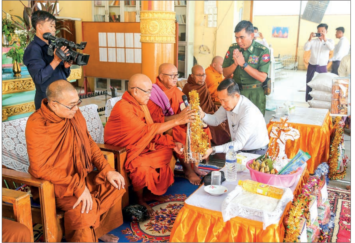
Vice-Senior General Soe Win presents alms offerings to members of the Sangha in Maungtaw yesterday.

In his speech, the Vice-Senior General clarified the functioning of the disaster management centre for rehabilitation in the aftermath of Cyclone Mocha, repairing of buildings and offices on priority, evacuation of people to shelters, distribution of seeds of crops for cultivation in monsoon, the opening of schools on 1 June, management for students to learn education in repairing period, 99 per cent completion of communication measures in townships, storage of 10,000 tonnes of reserved rice (200,000 bags) before the storm, and fine traditions for soonest rehabilitation in unison and cooperation