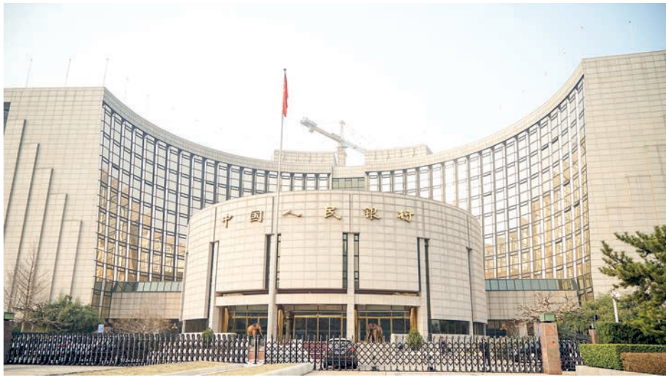
The People's Bank of China lowered interest rates for seven-day reverse repurchase agreements to 1.9 per cent from two per cent on Tuesday, after it injected two billion yuan ($279.73 million) via the short-term liquidity instrument.

CHINA'S central bank cut its short-term lending rate, the first such move since August 2022, as the country stepped up measures to consolidate economic recovery and re-