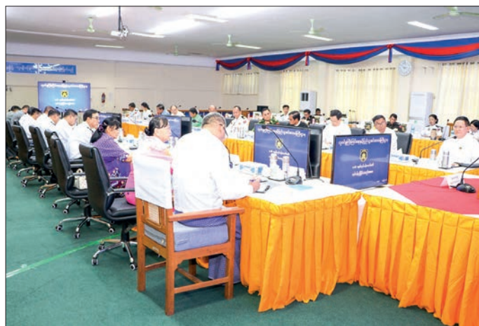
Union Minister U Myint Kyaing addresses the e-ID System Work Committee coordination meeting in Nay Pyi Taw yesterday.

In implementing the e-ID system, the biographic data and the biometric data of citizens aged 10 years and above residing in the country, associate citizens, naturalized citizens, permanent residence (PR) and permanent tax payment foreigners are collected, put in the database and then set each unique