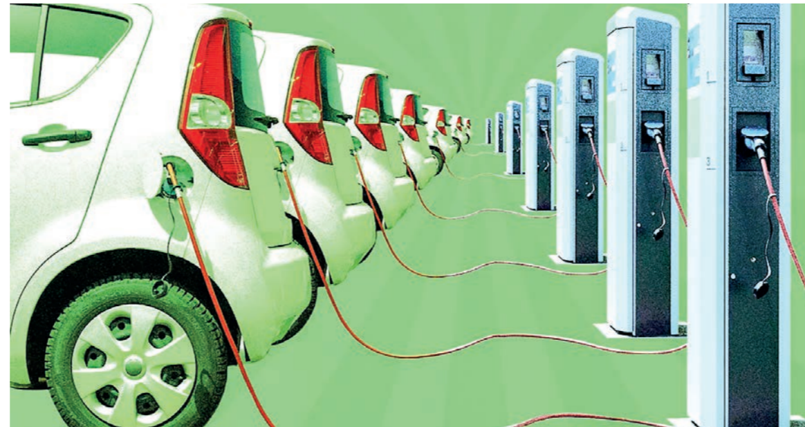
The revolution encompasses advancements in EV technology, increased EV adoption, the development of charging infrastructure, and the potential for reducing greenhouse gas emissions and dependence on fossil fuels.

Battery technology advancements, such as increased energy density, cost reduction, and improved performance, have pro-