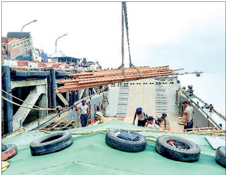
The unloading of timbers in progress yesterday.

Another landing craft shipped 716 pieces of small logs weighing 18 tonnes from Sittway Port to Buthidaung Port yesterday afternoon. — MNA/KZW