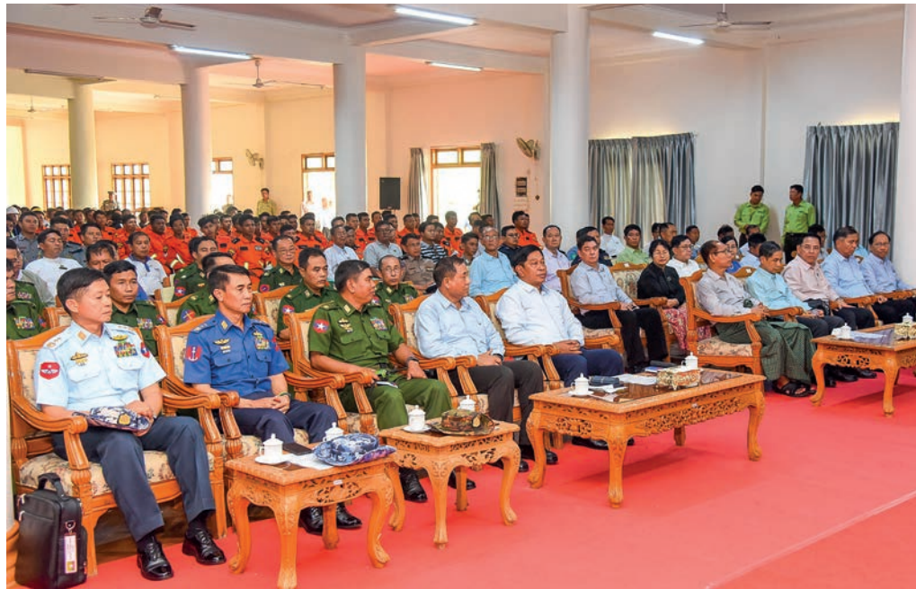
The Vice-Senior General attends the honouring ceremony for frontline personnel in Sittway yesterday.