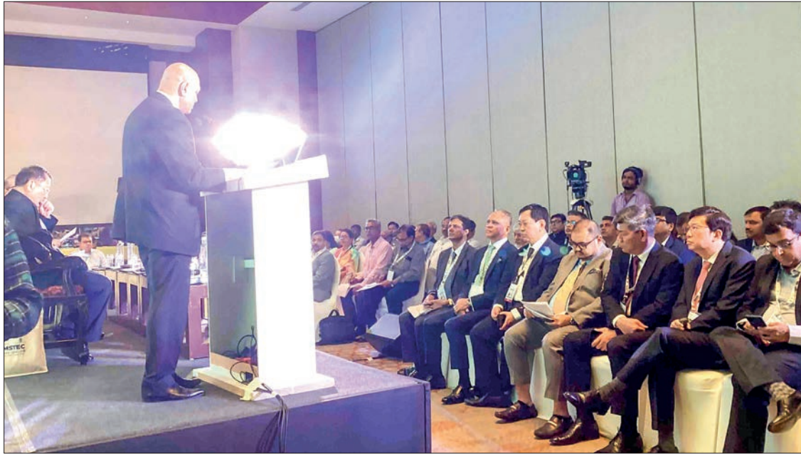
Union Minister U Aung Naing Oo and Myanmar officials seen attending the forum of the BIMSTEC Business Conclave in India yesterday.

UNION Minister for Commerce U Aung Naing Oo participated as the guest of honour in the forums organized by the BIMSTEC Business Conclave in Kolkata, Republic of India yesterday.