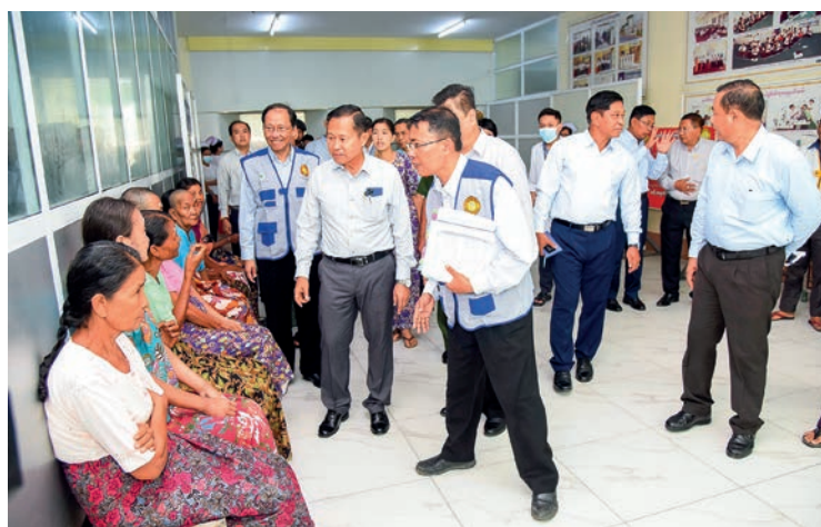
At the Sittway General Hospital.