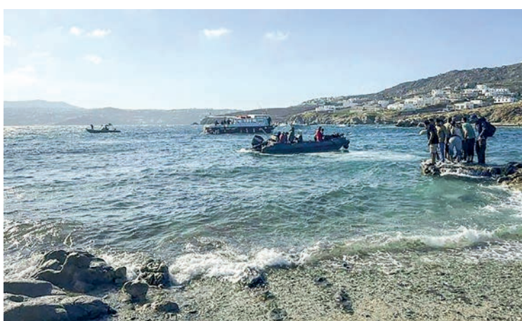
Along with navy vessels, the operation included an army plane and helicopter as well as six other boats that were in the area.

entrench a political stalemate, dimming hopes of saving the economy after three years of meltdown. — AFP