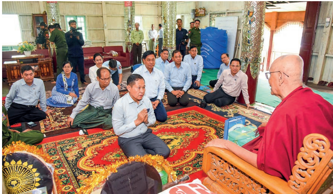
The Vice-Senior General presents alms donations to the Nanda Rama Pariyatti Buddhist Learning Centre Sayadaw.

Finally, the Vice-Senior General attended a ceremony held at Sasana Beikman of Lawkananda Pagoda to honour the depart-