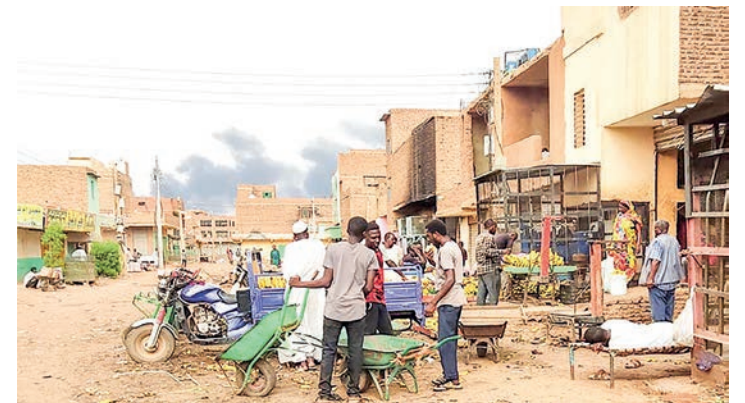
A record 25 million people — more than half the population — are in need of aid and protection, according to the UN, but as of late May, the world body's needs for $2.6 million to address the crisis were only 13 per cent funded. PHOTO: AFP

The country's western Darfur region has also been a centre of the fighting. — AFP