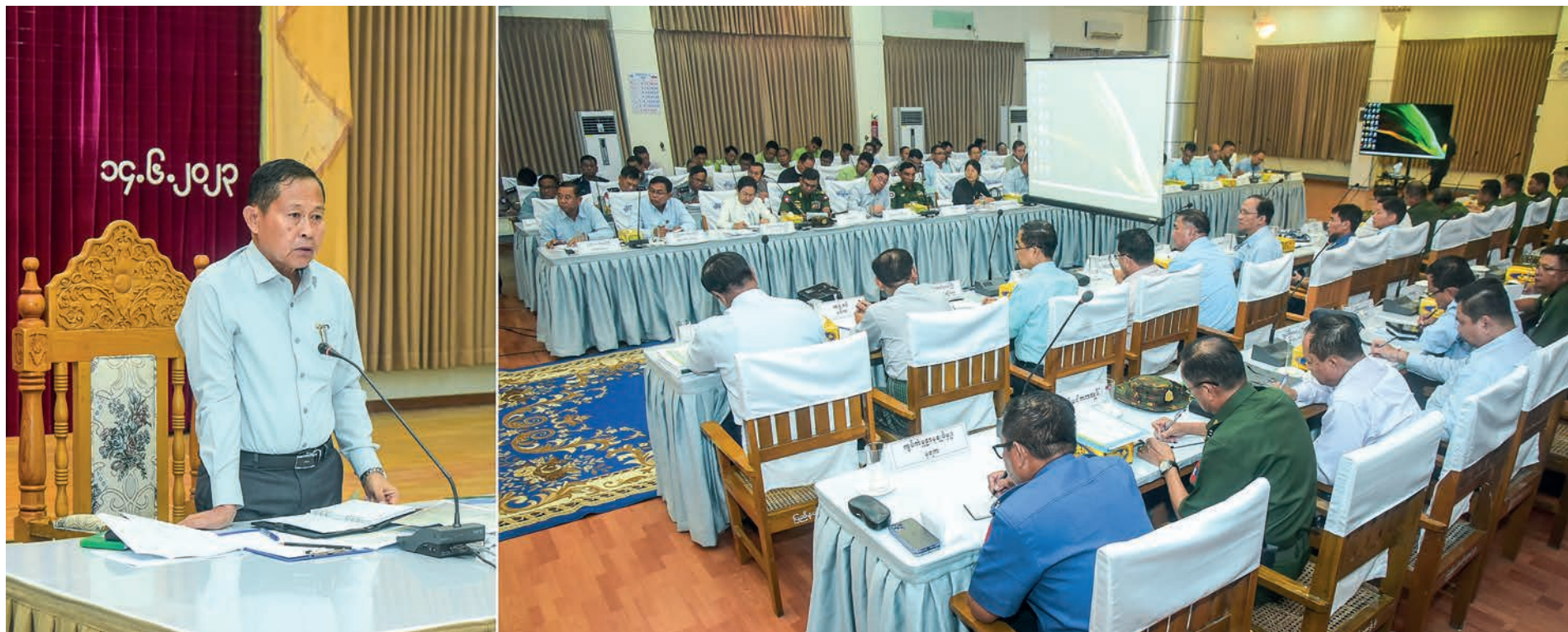
State Administration Council Vice-Chair Deputy Prime Minister Vice-Senior General Soe Win addresses the meeting on Rakhine State recovery measures in Sittway yesterday.

THE state government and the Ministry of Agriculture, Livestock and Irrigation have to join hands in manufacturing foodstuffs without raising commodity prices in the region for food sufficiency of locals, said Vice-Chairman of the State Administration Council Deputy Prime Minister Vice-Senior General Soe Win at the coordination meeting on Rakhine State rehabilitation at the Rakhine State government office yesterday afternoon.