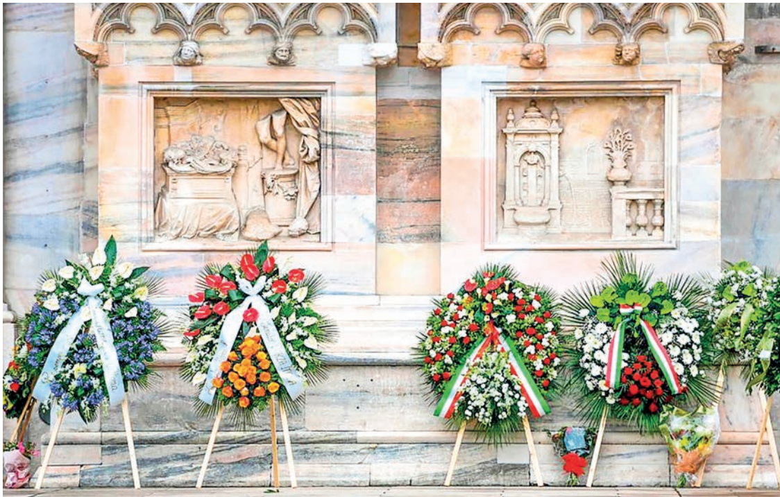
Wreaths of flowers are laid in front of the Duomo cathedral in Milan on 14 June 2023 ahead of the state funeral for Italy's former prime minister and media mogul Silvio Berlusconi.

ITALY prepared to say farewell to former prime minister Silvio Berlusconi Wednesday, with thousands of people expected at the billionaire's state funeral in Milan.