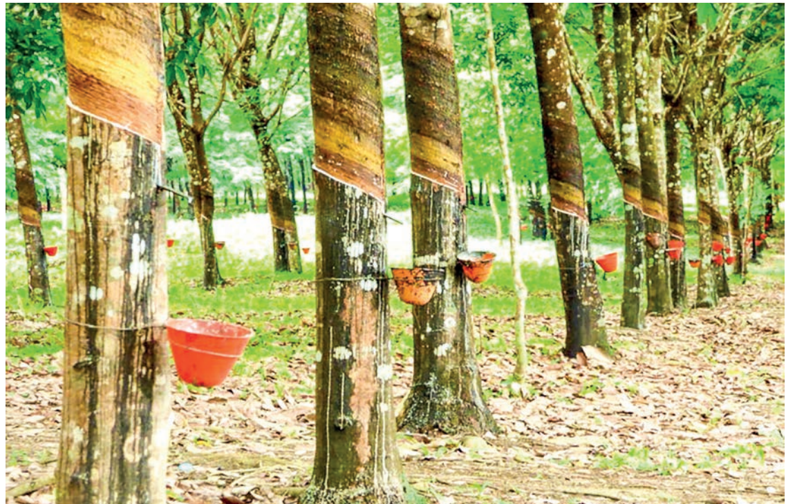
The Myanmar Rubber Planters and Producers Association aims to export approximately 300,000 tonnes of rubber to foreign markets during the current financial year 2023-2024. Photo shows the rubber plantation.

The Myanmar Rubber Planters and Producers Association aims to export approximately 300,000 tonnes of rubber to foreign markets during the current financial year 2023-2024. In the previous financial year