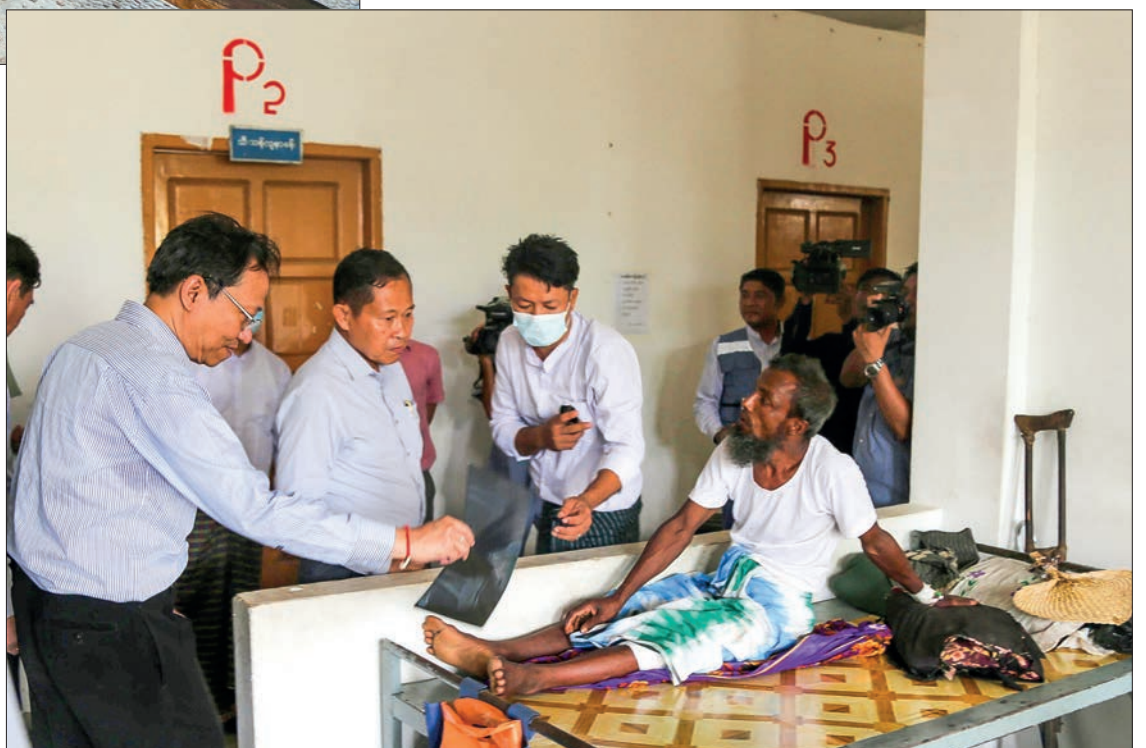
(Left & Right): The Vice-Senior General comforts patients at the hospital in Maungtaw Township yesterday.

and attended to the needs of attendees. He then presented foodstuffs to departmental personnel, relief teams and voluntary teams.