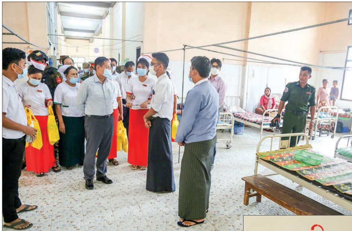
The Vice-Senior General views round the hospital in Buthidaung.