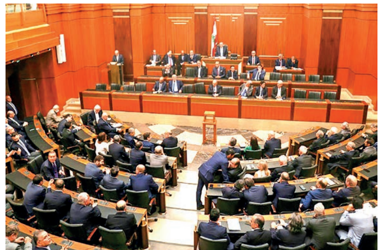
Lebanese MPs attend the 12th parliamentary session to elect a new president.

The vote for the presidency, reserved for a Maronite Christian under Lebanon's delicate sectarian power-sharing system, pits the Hezbollah-backed Sleiman Frangieh against financial official Jihad Azour, who has mainly been endorsed by Christian and independent legislators.