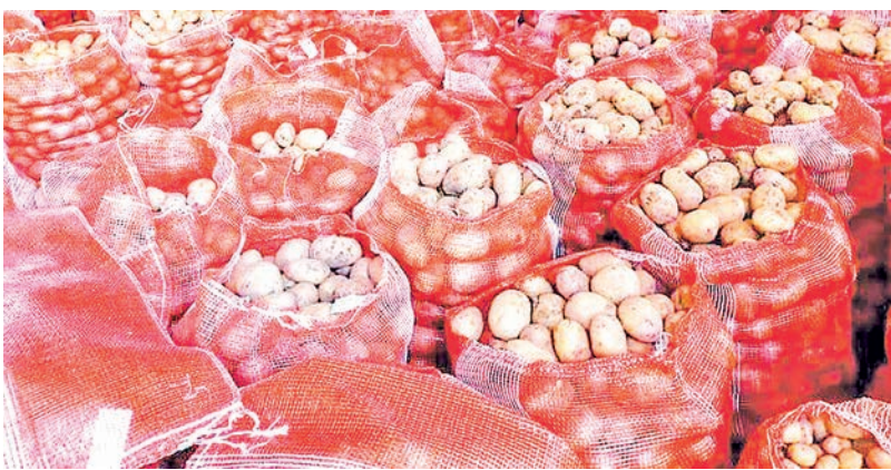
Bags of potatoes arrive at the Bayintnaung market in early June.

THE wholesale prices of Heho potatoes witnessed a significant surge this year in the Yangon market. On 13 and 14 June 2023, the prices per viss (approximately 3.6 pounds) reached K2,250 for A1 type, K2,550 for OK and S1 types, and K2,450 for S2 type.