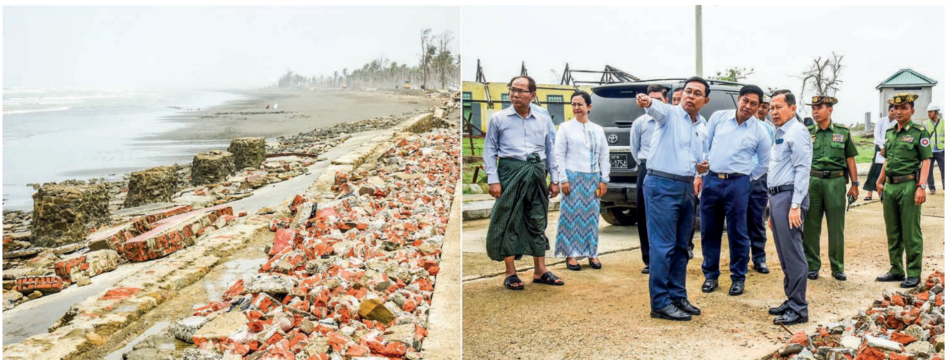
State Administration Council Vice-Chair Deputy Prime Minister Vice-Senior General Soe Win inspects the ongoing rehabilitation processes along the ring road of Sittway Beach in Rakhine State on 14 June 2023.