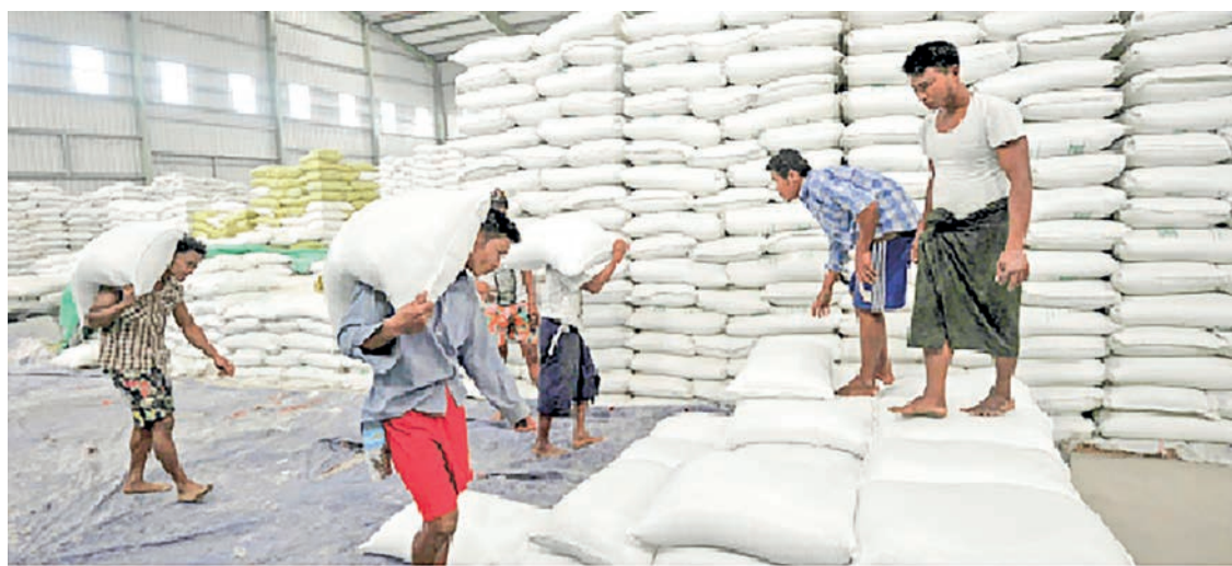
Rice bags are seen being well organized at the warehouse.

THE Myanmar Rice Wholesale Centre (Wahdan) reported a significant surge in the price of high-grade Shwebo Pawsan rice, with an increase of K7,000 per bag within a span of two weeks. On 1 June, the price of Shwebo Pawsan rice stood at K105,000 per bag, but by 14 June, it had soared to K112,000 per bag. The soaring cost of Shwebo Pawsan paddy, which exceeded K3 million per 100 baskets, is a key contributing factor to the elevated price of Shwebo Pawsan rice. Likewise, the prices of other rice varieties have also experienced an upward trend. The cost of old Pawsan rice ranged from K87,000 to K95,000 per bag, depending on the producing areas (Myaungmya, Patheingyi, Pyaw, Dedaye, and other regions). The prices of Khunni, Ngasein, short-matured