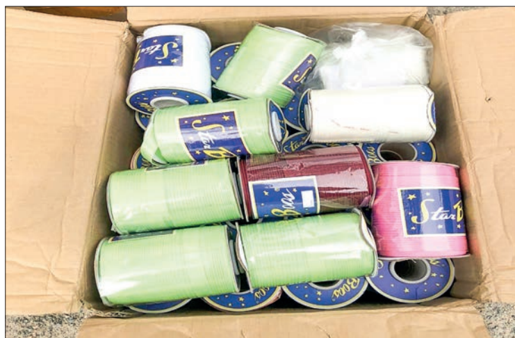
Confiscated illegal goods in Mandalay Region.

Therefore, 11 arrests (estimated value of K173,765,216) were made on 30 May, 1 and 2 June, according to the Illegal Trade Eradication Steering Committee. — MNA/MKKS