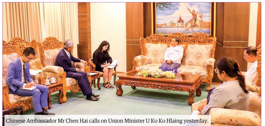
Chinese Ambassador Mr Chen Hai calls on Union Minister U Ko Ko Hlaing yesterday.

U Ko Ko Hlaing, Union Minister for International Cooperation of the Republic of the Union of Myanmar, received Mr Chen Hai, Ambassador of the People's Republic of China to Myanmar, yesterday at the Ministry of Foreign Affairs, Nay Pyi Taw.