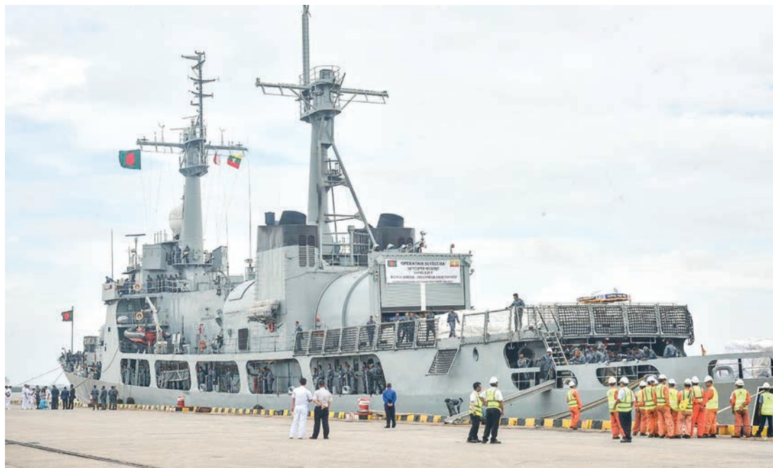
The Bangladeshi naval vessel carrying humanitarian aid arrives at Thilawa Port yesterday.

Arrangements are being made to deliver the relief aid to the storm-battered areas as soon as possible. — MNA/KZW