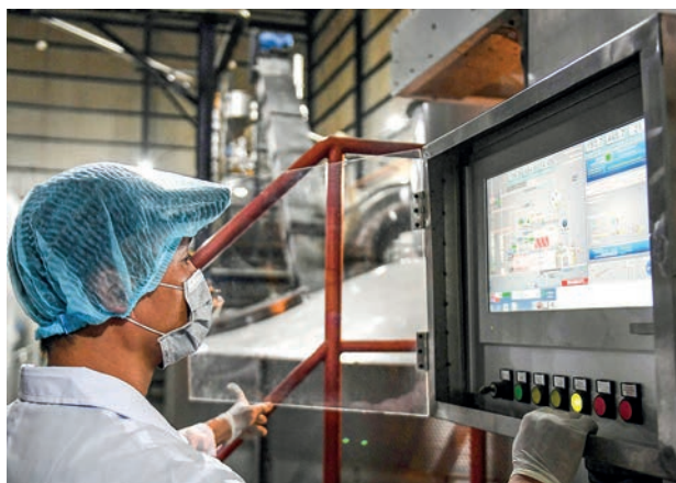
This photo taken on 14 March 2023 shows an engineer checking the control monitor at a Trung Nguyen coffee roastery facility in Viet Nam's central highlands Buon Ma Thuot city, Daklak province.

Helped by low franchising fees, Chinese Mixue, whose snowman-logo shops sell ice cream, bubble tea, and a variety of drinks, has reached 1,000 locations