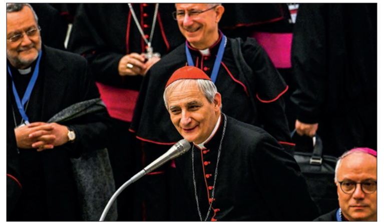
President of the Episcopal Conference of Italy, Italian Cardinal Matteo Maria Zuppi (C) attends the 77th General Assembly of the Italian Bishops' Conference (CEI) on 25 May 2023 in The Vatican.

Zuppi, 67, was elected head of the Italian Episcopal Conference last year, and hails from the Sant'Egidio Catholic Community, which specializes in diplomacy and peace efforts. — AFP