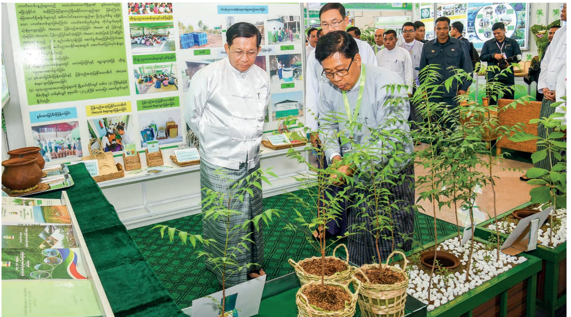
State Administration Council Chairman Prime Minister Senior General Min Aung Hlaing views round the display on the ceremonial occasion of World Environment Day 2023 yesterday in Nay Pyi Taw.

UNDISCIPLINED disposing of plastic waste can pollute freshwater sources and reduce water quality, said Chairman of the State Administration Council