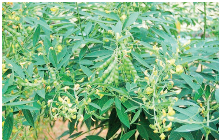
Black grams that India primarily purchases are commonly found only in Myanmar, whereas pigeon peas, green grams and chickpeas are grown in African countries and Australia,

THE price of pigeon peas hit an all-time high of over K3.3 million per tonne, according to the Yangon Region Chambers of Commerce and Industry (Bayintnaung).