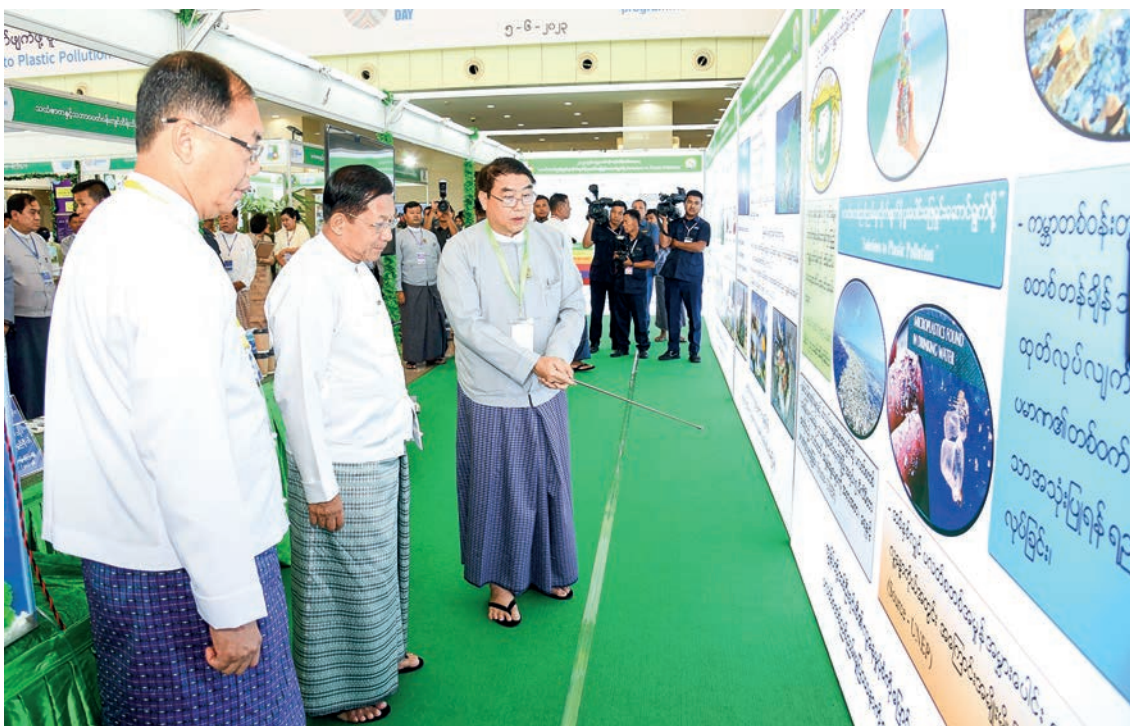
The Senior General looks into the display at the event yesterday.

The Senior General visited the booths to mark the 2023 World Environment Day. — MNA/TTA