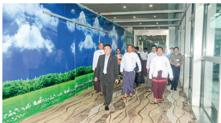
Union Minister Dr Nyunt Pe is seen leaving for the International Forum of Education Ministers in the Russian Federation yesterday.

The Forum will be held under the theme of "Shaping the Future" and the participants will exchange views on opportunities for shaping the future of education. — MNA/MKKS