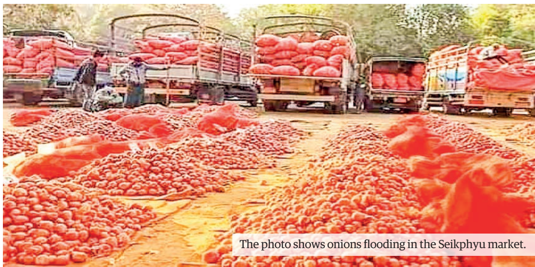
The photo shows onions flooding in the Seikphyu market.

During the harvest season of summer onion, the price was only K800 per viss. This year, it fetched K1,500 per viss. Thus, I could make a handsome profit this year, Ko Khin Maung, an onion trader from Pale township told the Global New Light of Myanmar (GNLM). — TWA/EM