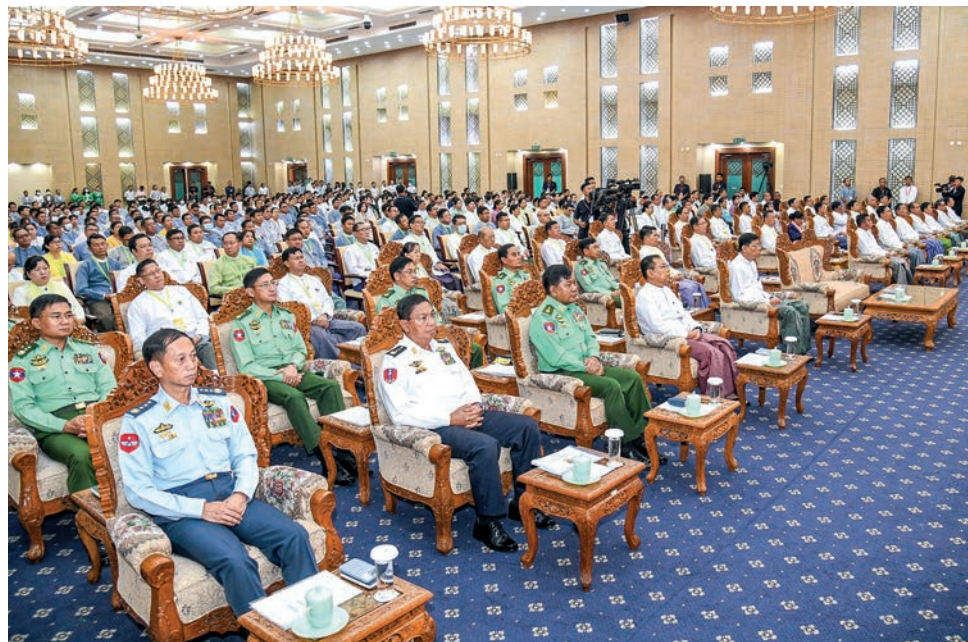
State Administration Council Chairman Prime Minister Senior General Min Aung Hlaing speaks on the commemorative occasion of World Environment Day 2023 yesterday.

The State of World Fisheries and Aquaculture 2022 released by the Food and Agriculture Organization-FAO