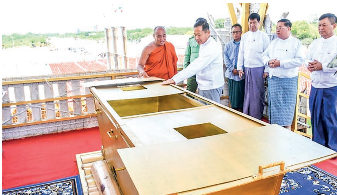
The Vice-Senior General inspects the venue for the cremation.

spected the preparations for the final rites ceremony, the route for conveying the remains of Sayadaw, the cremation process,