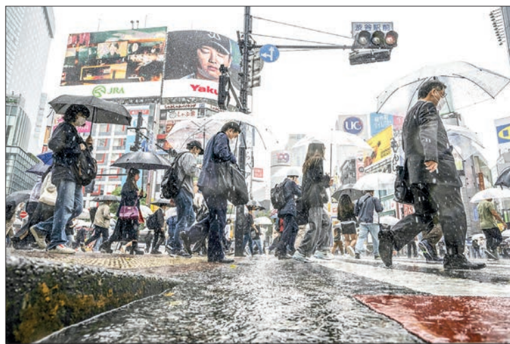
People use their umbrellas to shelter from the rain as they walk through Shibuya district in Tokyo on 2 June 2023.

FLOODS have claimed three lives and damaged about 990 houses after record torrential rains pounded a wide swath of