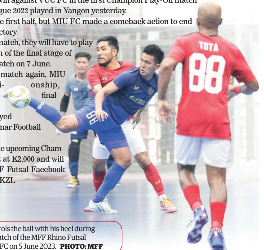
MIU FC player (blue) controls the ball with his heel during the Champion Play-Off match of the MFF Rhino Futsal League 2022 against VUC FC on 5 June 2023.

The entrance fee for the upcoming Champion Play-Off match is set at K2,000 and will be shown live on the MFF Futsal Facebook Page, the MFF stated. — KZL