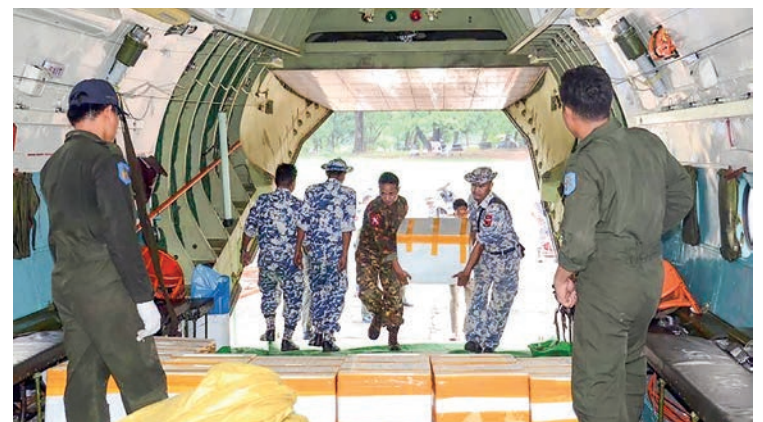
Relief goods are seen being loaded aboard the Tatmadaw aircraft yesterday.

THE relief aid and food items contributed by the families of Tatmadaw (Army, Navy and Air) and well-wishers, and relief supplies provided by the National Disaster Management Committee for local communities affected by Cyclone Mocha in Rakhine State are being transported by Tatmadaw aircraft and helicopters.