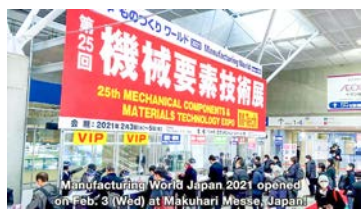
People are seen queuing at the gate to enter the 2021 Mechanical Components and Materials Technology Expo in Japan.