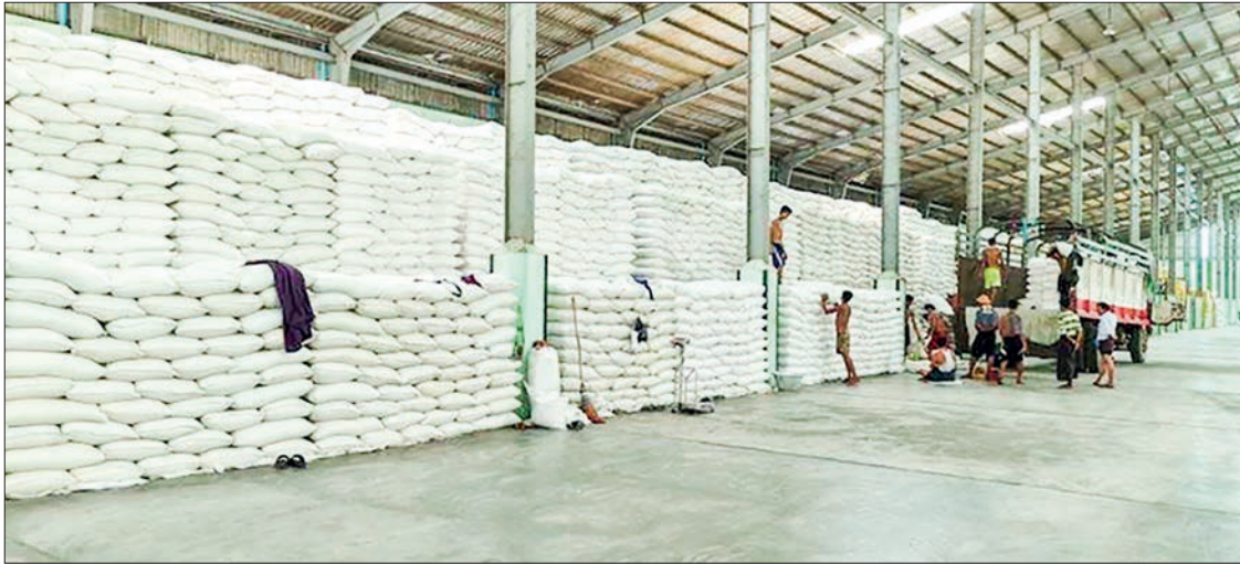
Myanmar's export earning swelled to over $809.135 million from 2,164,681 tonnes of rice export in the 2021-2022 FY. Export rice bags are seen being organized in the warehouse.

Myanmar's export earning swelled to over $809.135 million from 2,164,681 tonnes of rice export in the 2021-2022 FY. - NN/EM