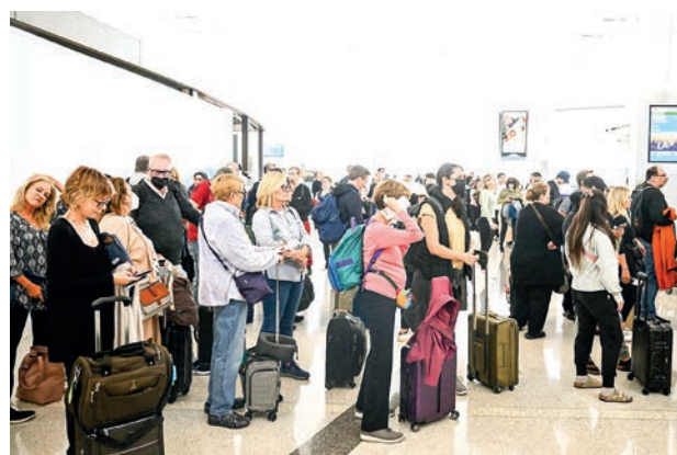
Passengers wait in line to board a KLM Royal Dutch Airlines flight during the SkyTeam Alliance 2023 Sustainable Flight Challenge at Los Angeles International Airport (LAX) in Los Angeles, California on 17 May 2023.

AIRLINES will fly 4.35 billion passengers this year, close to the 2019 record as the industry bounces back from the Covid pandemic, an industry group said on Monday.