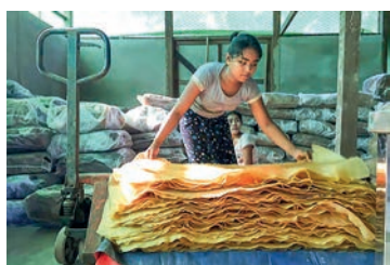
The photo shows weighing sundried rubber for packaging.

Myanmar can export only raw materials. China accounts for approximately 70 per cent