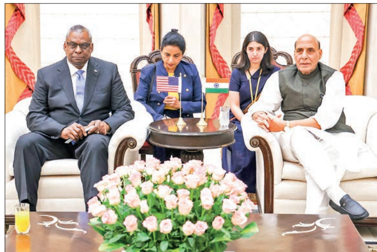
This handout photograph taken on 5 June 2023 and released by the Indian Ministry of Defence shows India’s Defence Minister Rajnath Singh (R) and US Secretary of Defence Lloyd Austin (L) during their meeting in New Delhi.

India has displaced China as the world’s most populous country this year, and relations between the Asian giants have been strained since a deadly high-altitude border clash in June 2020. — AFP