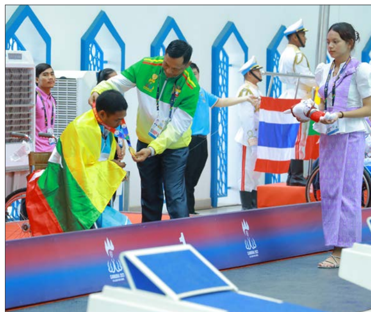
One of the Myanmar's gold medallists receives the gold medal in the XII ASEAN Paralympic Games yesterday.

Myanmar has won four gold medals, seven silver medals, and two bronze medals totalling 13 medals in the XII ASEAN Paralympic Games.