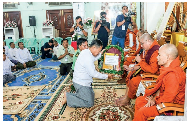
The Vice-Senior General presents donations to Sayadaws from the Bhamo Monastery.

the construction of the incineration chamber and the plan to set ashes adrift into the water and fulfilled the requirements.