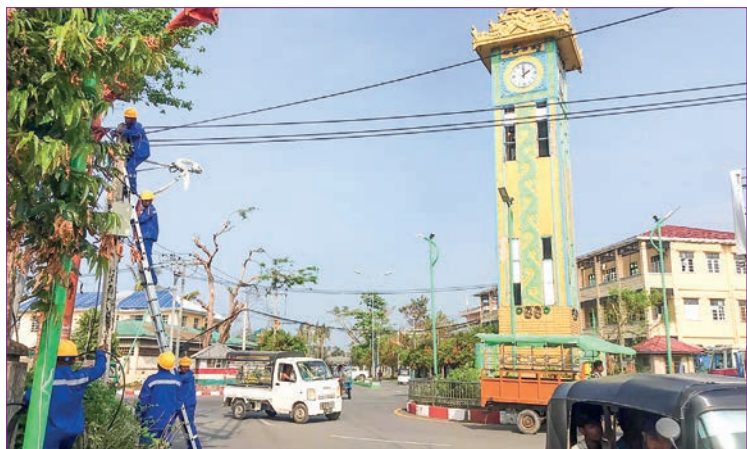
MoEP staff are seen repairing electric cables in Sittway yesterday.

Of 1,233 mobile stations of four telecom operators in Rakhine State, 904 stations failed due to Cyclone Mocha. Only 329 stations provided services and the maintenance of underground and overhead fibre cables, microwave links and mobile communication stations was conducted, and 855 mobile stations (totalling 1,184 stations and 96.03 per cent) have been repaired on 5 June and communication services resumed in Rakhine State. — MNA/KTZH