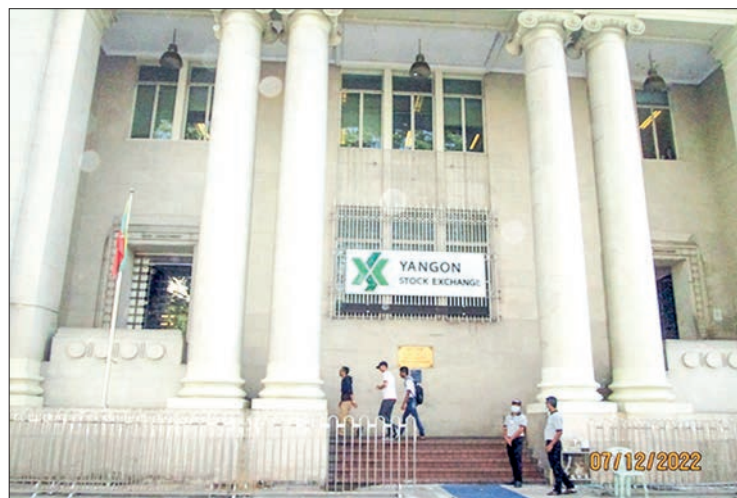
The photo taken in December 2022 shows the front view of the office building of the Yangon bourse.

The equity trading volumes were recorded 11,743 shares of FTI worth K95.302 million, 68,267 shares of MTSH worth K194.497 million, 5,888 shares of MCB worth K41.551 million, 62,241 shares of FPB worth over K90 million, 2,543 shares of TMH worth K6.34 million, 1,127 shares of EFR worth K2.8 million and