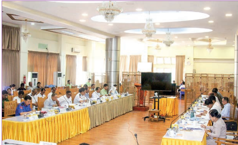
Union Minister Lt-Gen Tun Tun Naung attends the coordination meeting on relief and rehabilitation efforts in Rakhine State yesterday.

First, officials and attendees took five precepts from