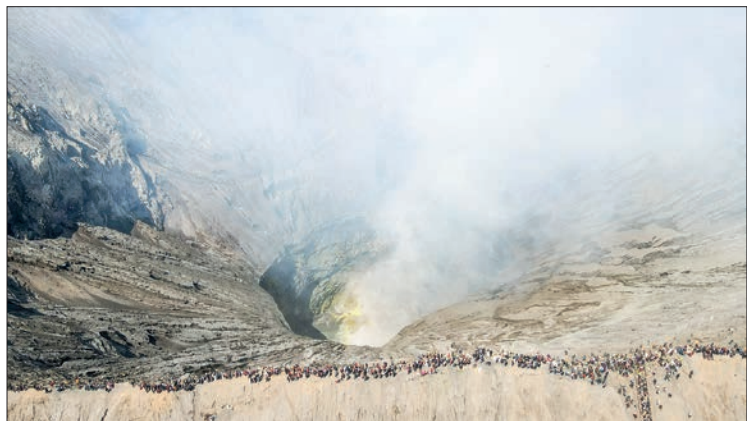
This aerial picture shows members of the Tengger sub-ethnic group gathering to present offerings at the crater’s edge of the active Mount Bromo volcano as part of the Yadnya Kasada festival in Probolinggo, East Java province on 5 June 2023.

THOUSANDS of Hindu worshippers scaled an active Indonesian volcano on Monday to toss livestock, food and other offerings into its smoking crater.