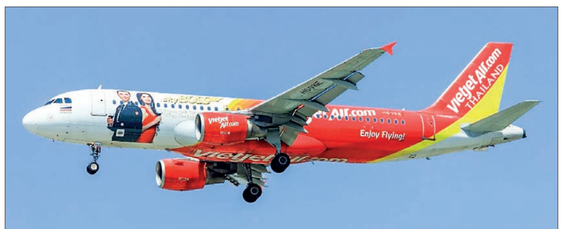
One aircraft of the Vietjet fleet.