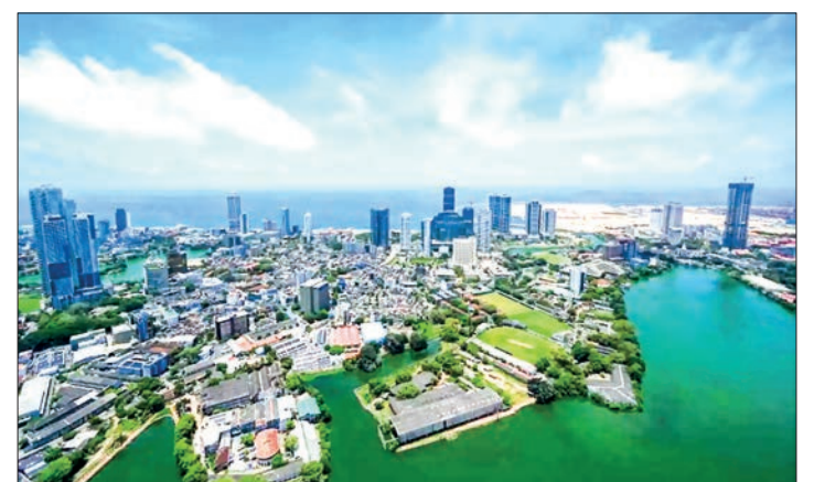
This picture taken on 12 September 2022, shows the city skyline as pictured from the observation deck of the Lotus Tower in Colombo.

"The current economic crisis has its genesis in policy missteps aggravated by external shocks," Okamura said in a statement Friday, after meeting President Ranil Wickremesinghe and other leaders on Wednesday. — AFP