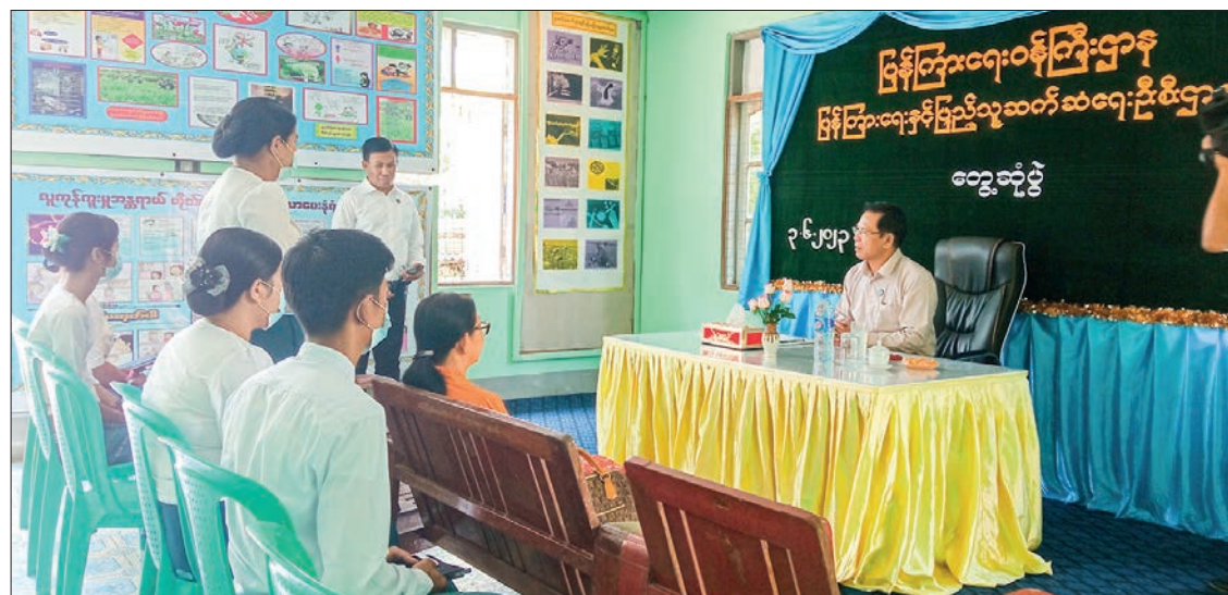
Union Minister for Information U Maung Maung Ohn meets staff of Danubyu Township Information and Public Relation Department (IPRD) office in Danubyu Township in Ayeyawady Region yesterday.

Speaking at the event, the Union minister said the media plays a key role in providing the people with information ensur-