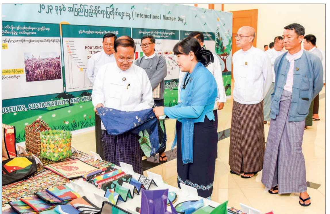
Union Minister U Ko Ko views the display at the event yesterday.