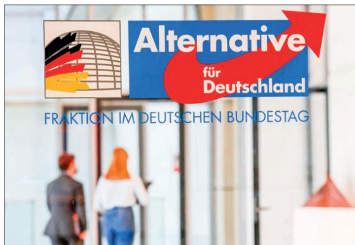
The AfD's rise has sparked debates in Germany about the limits of acceptable political discourse and concerns over the potential normalization of far-right ideologies. It has also led to increased attention on issues such as immigration, multiculturalism, and national identity within German society.

The AfD was also topping polls in the eastern regions of Saxony, Thuringia and Brandenburg. While the party continues to leverage anti-immigration sentiment, it has also increasingly sought to capitalize on dissatisfaction with Scholz's ruling coalition with the Greens and the pro-business FDP. In particular, the AfD has taken aim at the government's plans to clean up the Germany's energy system amid a painful cost of living crisis triggered by the Russian invasion of Ukraine. — AFP