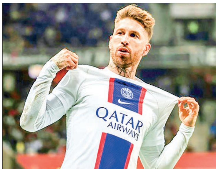
Sergio Ramos won Ligue 1 twice with Paris Saint-Germain.

FRENCH champions Paris Saint-Germain announced on Friday that veteran former Spain defender Sergio Ramos will join Lionel Messi in leaving the club at the end of the season.