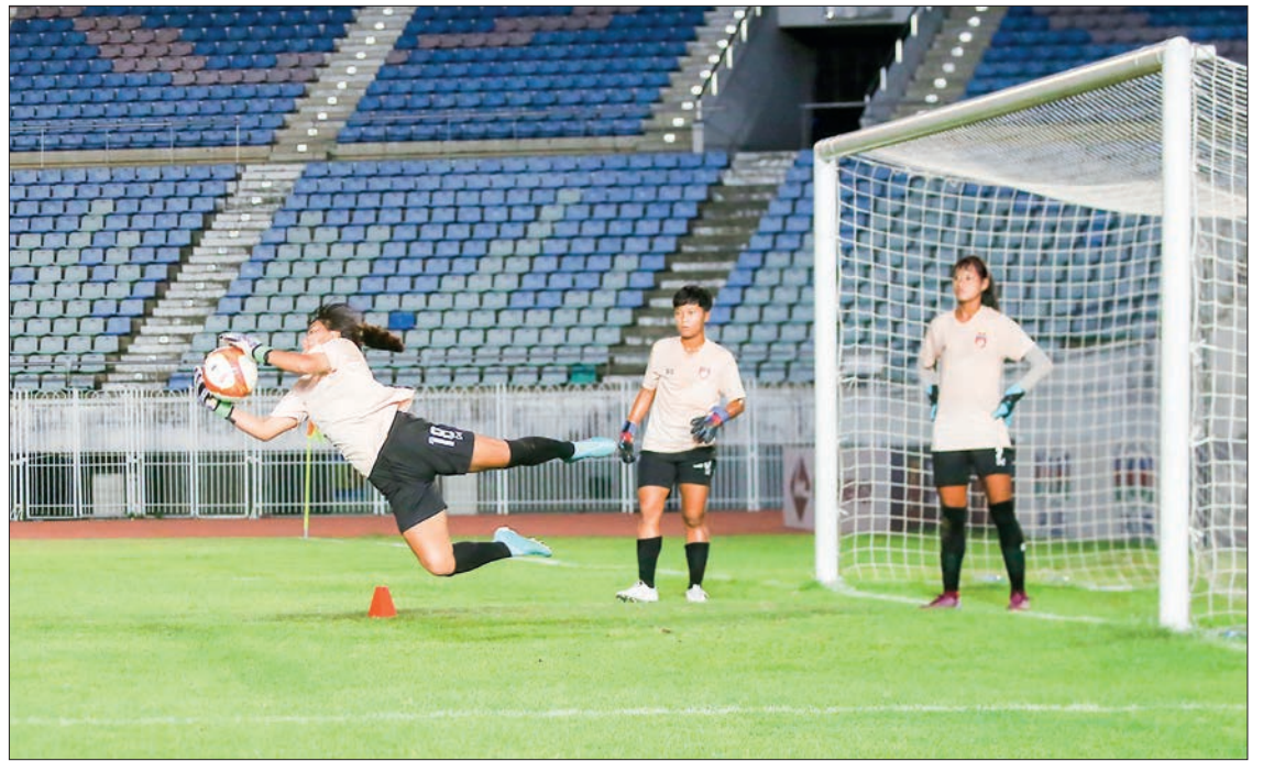
The Myanmar goalkeeper catches the ball in the air during her training session at Thuwunna Stadium in Yangon.