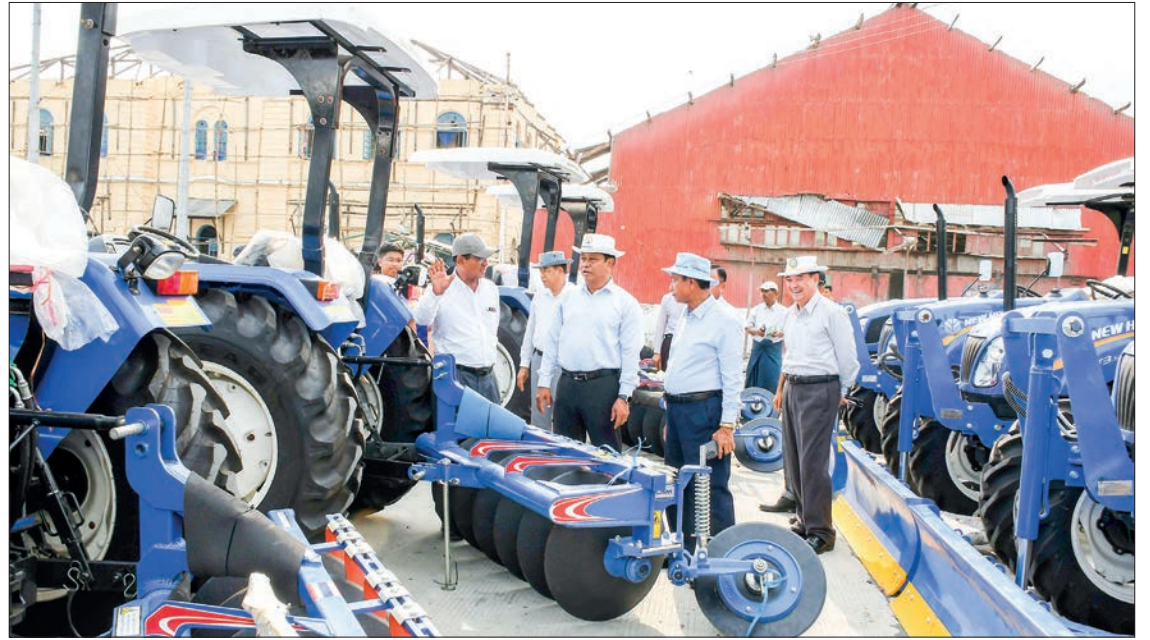
Member of State Administration Council Deputy Prime Minister Union Minister Admiral Tin Aung San inspects the multi-purpose tractors at Phaungtawgyi jetty of Myanma Port Authority on 3 June 2023.