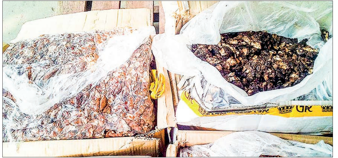
Myanmar's tamarinds are seen in the market.

The prices move in the range between K1,400 and 2,500 per viss, according to the Yangon Region Chamber of Commerce and Industry (Bayintnaung). — NN/EM