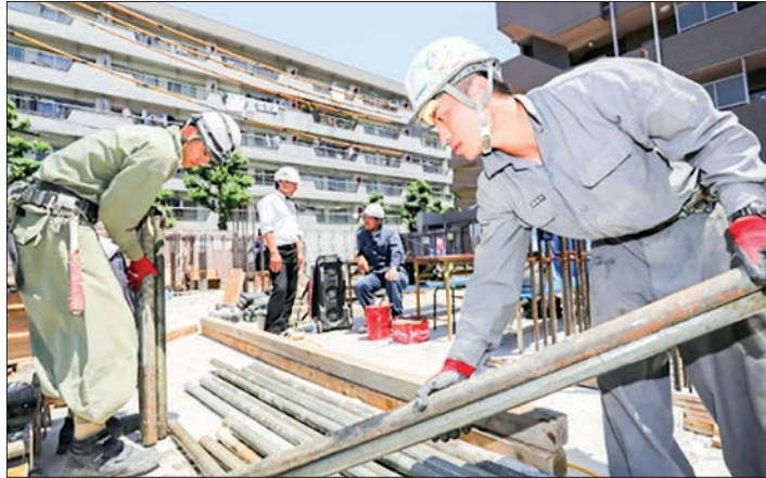
Myanmar workers are seen working at the workplace in Japan.

The embassy is verifying, with a labour inspection company, whether the companies and factories recruiting Myanmar workers are legally established. The remarks and findings on those verifications will