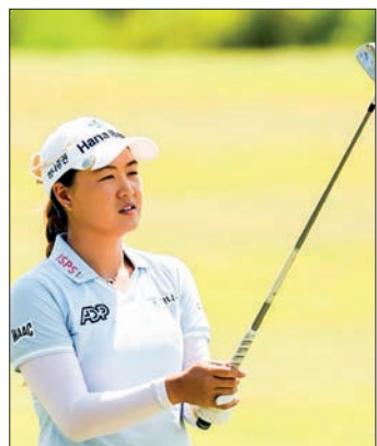
Australia's Minjee Lee lines up a shot on the way to the 36-hole lead in the LPGA Mizuho Americas Open.

AUSTRALIAN Minjee Lee fired eight birdies in an eight-under par 64 on Friday to grab a share of the lead alongside Cheyenne Knight in the LPGA Mizuho