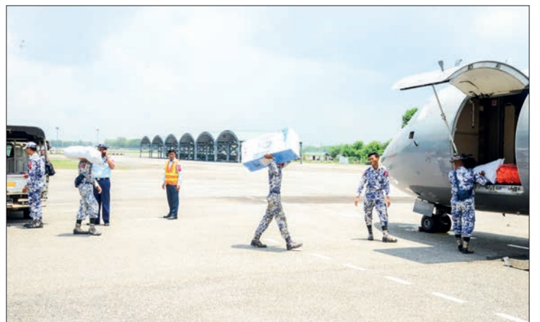
Relief goods are seen being loaded aboard the Tatmadaw aircraft to transport them to Mocha-battered areas yesterday.

Three hundred and twenty bags donated by the Ministry of Social Welfare, Relief and Resettlement were transported from Mandalay International Airport to Kalay Airport by Tatmadaw planes, and foodstuffs, textbooks, exercise books, school uniforms and backpacks donated by the