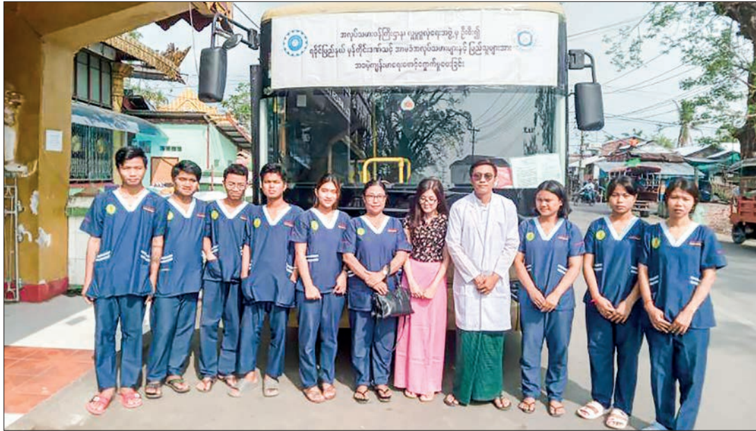
Mobile medical unit is seen ready to render healthcare services in Sittway and its surrounding yesterday.

UNDER the guidance of the National Disaster Management Committee and the Rakhine State government, a mobile medical unit-MMU including medical staff from the Social Security Board of the Ministry