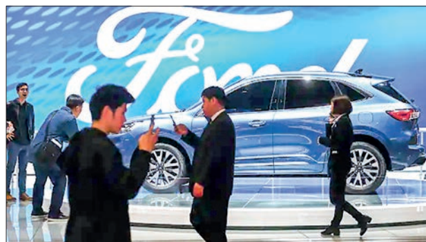
Ford Motor Company announced on Friday that it sold 170,933 vehicles in the United States in May, a 10.7-per-cent increase from 154,461 sold in May 2022.

FORD Motor Company announced on Friday that