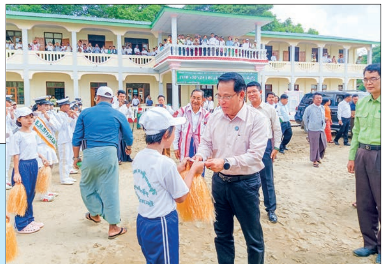
Union Minister U Maung Maung Ohn warmly greets schoolchildren at the event yesterday.

talks currently conducted by the Ministry of Information, the Ministry of Education, and the Ministry of Sports and Youth Affairs will raise awareness among youths. He also called for the need to exert all-round efforts to ensure the long-term sustainability of the new school building and the achievement of the educational objectives set by the State.