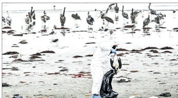
Outbreaks of avian influenza have spread to new areas and lead to mass deaths among wild birds.

The study said the virus increased in virulence, which means it causes more dangerous disease, when it arrived in North America. The researchers also infected a ferret with one of the new strains of bird flu. — AFP