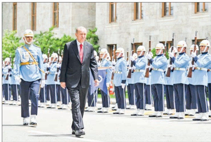
Recep Tayyip Erdogan, Türkiye's longest-serving leader, faces immediate and major challenges in his third term driven by a decelerating economy and foreign policy tensions with the West.

leader faces immediate and major challenges in his third term driven by a decelerating economy and foreign policy tensions with the West.