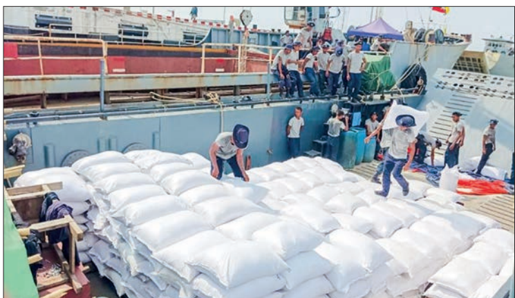
Rice bags are seen being loaded aboard the Tatmadaw landing craft to transport them to Mocha-battered areas yesterday.