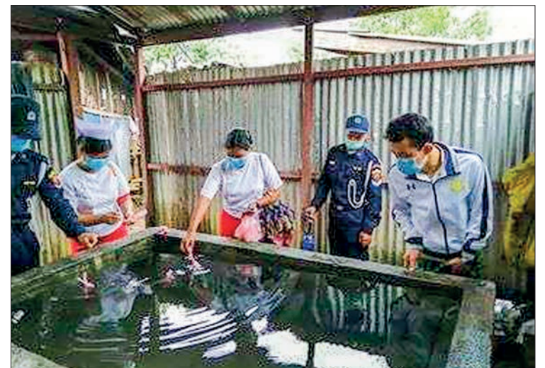
Preventive measures were underway in 2020.

It was not high compared to regional countries because the average yearly death rate of dengue fever in Myanmar was 0.4 per cent, it stated. — TWA/MKKS