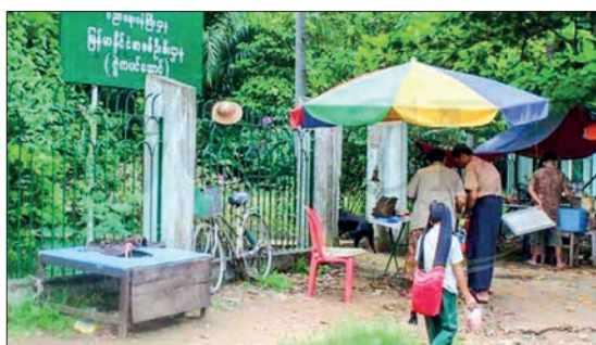
The entrance to the office of the Myanmar Examinations Department in Yangon.

The results for exam centres in remote areas and no Internet coverage areas will be announced via the MRTV radio programme on the day of results are released, according to the Myanmar Examinations Department. — TWA/MKKS