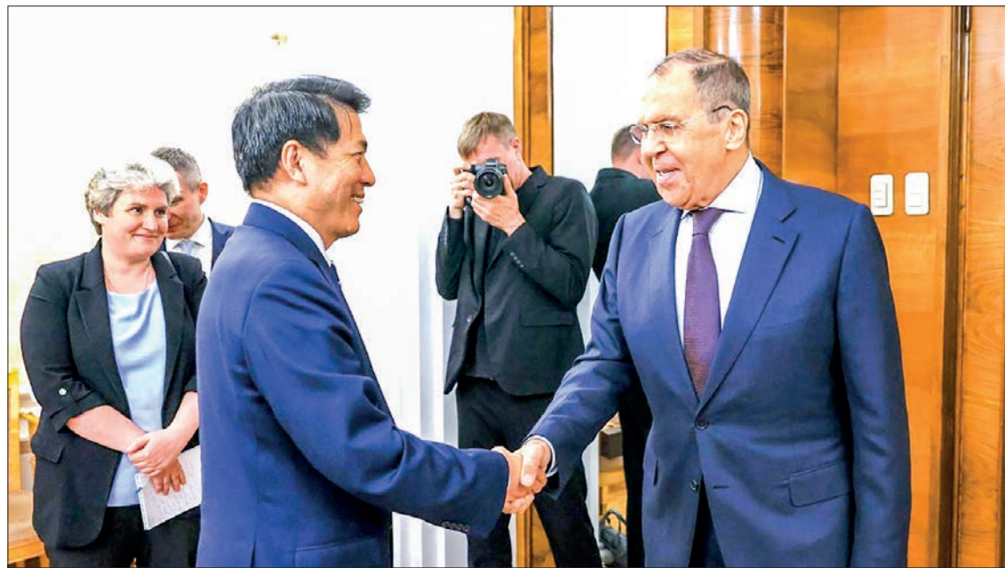
Russian Foreign Minister Sergey Lavrov welcomes Li Hui, China's special representative on Eurasian affairs, at the Russian Foreign Ministry headquarters in Moscow on 26 May 2023.

The Wall Street Journal reported last week that Li proposed to US allies in Europe that they should leave Russia in possession of the parts of Ukraine that Moscow currently occupies, quoting Western officials familiar with the talks. The envoy flatly denied the report, saying it is "not in line with the facts" and labeled it as a move to "sow discord between China and Ukraine". — Kyodo