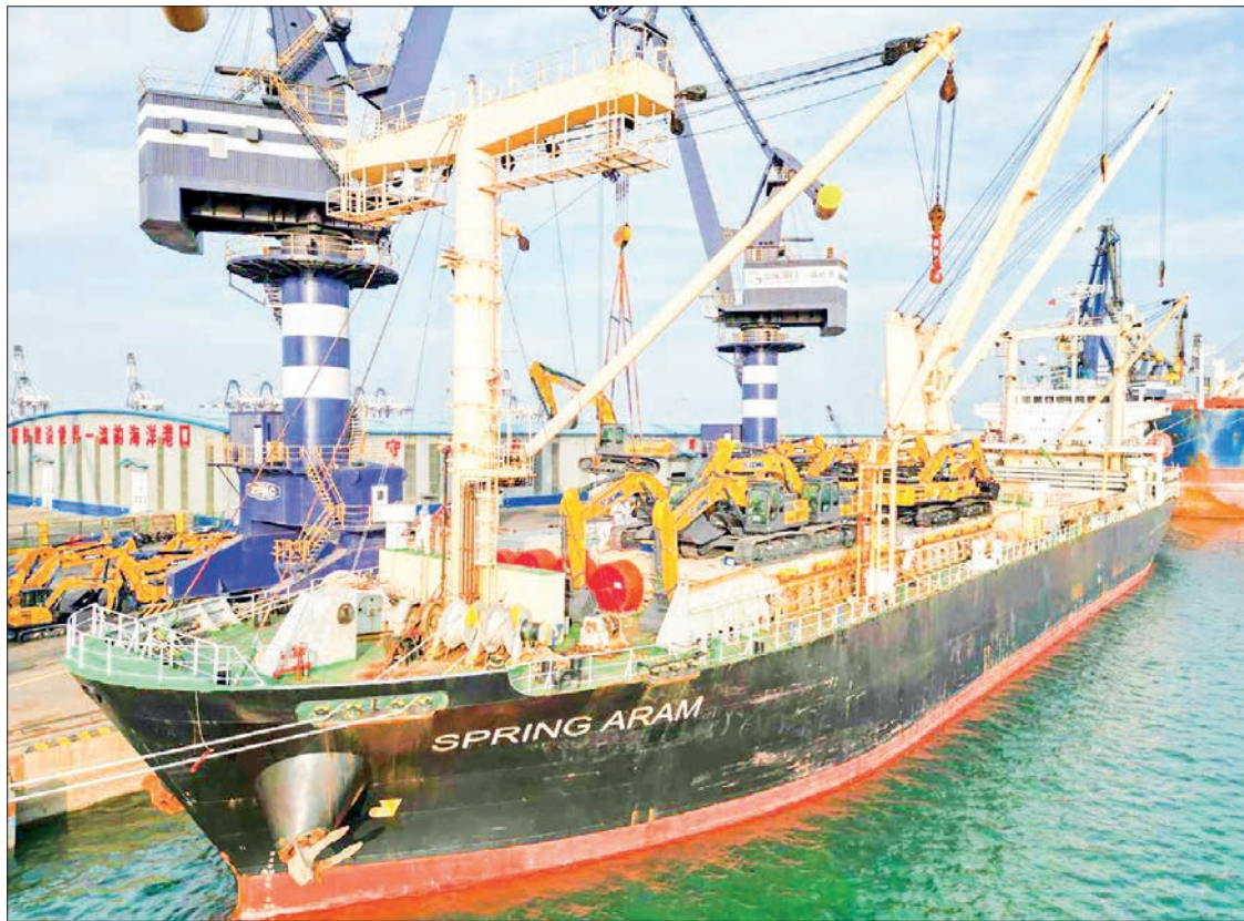
Engineering machinery is loaded at Yantai Port, Shandong province, for export to Indonesia.

The full implementation will inject strong momentum into regional economic integration, comprehensively enhance the