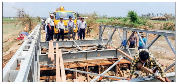
Deputy Minister for Cooperatives and Rural Development U Myint Soe inspects the construction of a 50-foot Bailey bridge on the Mingan-Hmansi village-to-village road in Sittway Township yesterday.

al school run by the Sittway Small-scale Industries Department and viewed the restoration of damaged offices, housing, dormitories, bathrooms and restrooms of the school.