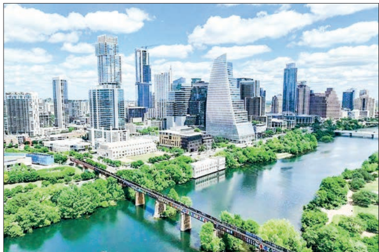
Texas has an estimated 29,800 transgender youth aged 13 to 17, according to the Williams Institute of UCLA.

TEXAS Governor Greg Abbott on 2 June signed a bill that bans transgender healthcare including puberty blockers and hormone therapy for minors, making Texas the largest of the 20 states to have outlawed gender-affirming care.