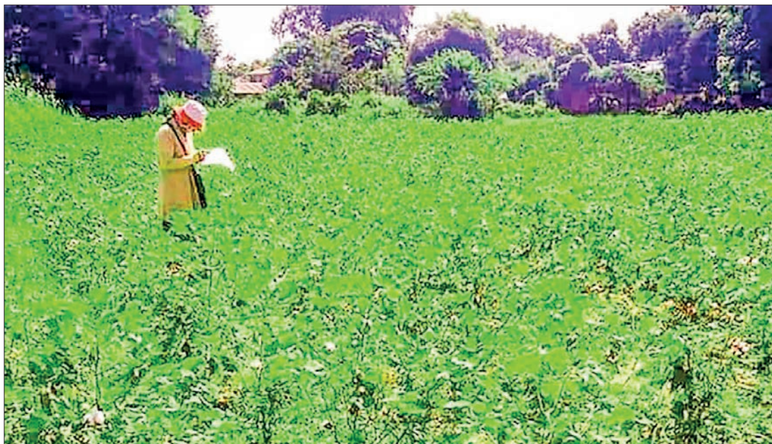
Myanmar's pigeon peas are primarily shipped to India and also exported to Singapore, the US, Canada, Pakistan, the UK, and Malaysia. But, the export volume to other countries rather than to India is extremely small.

There is a strong market share of black grams and pigeon peas in India. Most of the growers