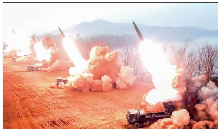
A general view of fire assault drill at an undisclosed location in North Korea 10 March 2023 in this photo released by North Korea's Korean Central News Agency (KCNA).

the three nations to detect and track projectiles fired by the North more accurately and swiftly, and will be "a major step for deterrence, peace and stability," the statement said. — Kyodo