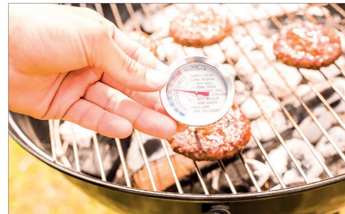
A food thermometer is a device used to measure the temperature of food. It ensures that food is cooked to the correct temperature to prevent foodborne illnesses and maintain food quality. There are different types of food thermometers available, including instant-read, probe, and infrared thermometers. ILLUSTRATION: FREEPIK

RECENTLY, I have been to the hospitals and dispensaries or clinics for my own healthcare or for those of other people. True, these are the places that ought not to be crowded. Nevertheless, be it the Yangon General Hospital or the privately owned Grand Hantha or the local clinics are all thronged with patients and their attendants these days. There is no need to say that people will not want to go to these places and spend a lot; they will definitely feel sorry to be there. Naturally, people will know the value of good health only when they fall ill. There is a saying health is wealth. In Pali, it is said "Ayogyam paramam labham."