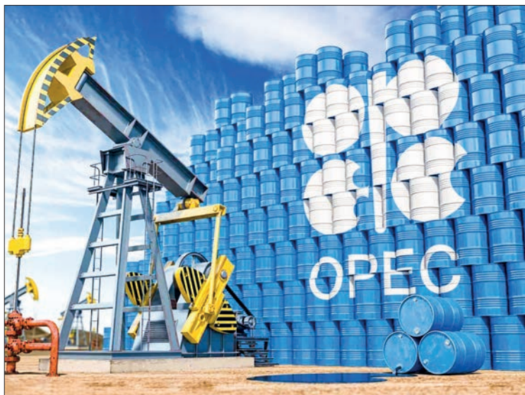
Analysts are now divided over whether Saudi Arabia and Russia will keep the group on course with its current output policy, or further curtail production in a bid to prop up prices. PHOTO: AFP

Oil producers are grappling with falling prices and high market volatility amid the Russian invasion of Ukraine, which has upended economies worldwide. — AFP