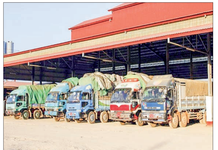
Lorries laden with export cargoes are seen at the Maungtaw border trade zone.

The freight cost from Sit-tway to Maungtaw is K70-110 per viss for up road and for down road, the freight cost is K50-80 per viss. — GNLM/EM