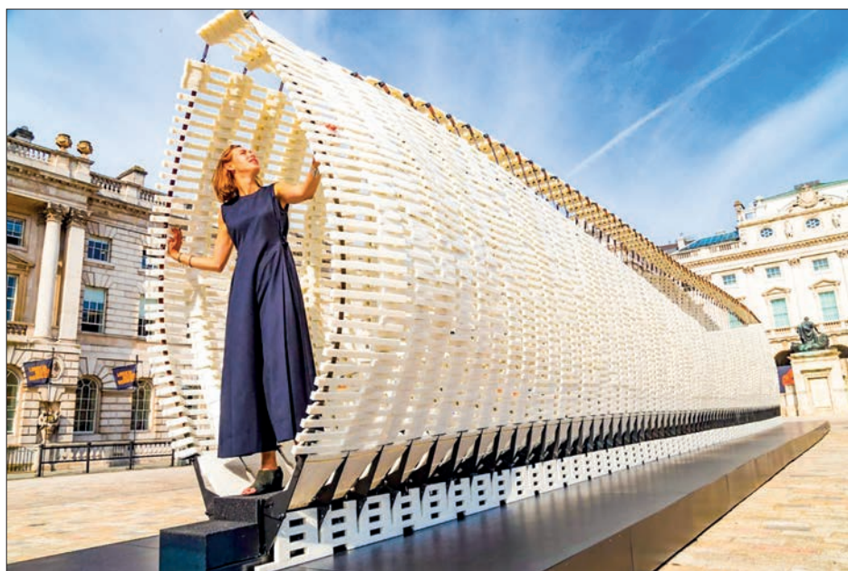
The London Design Biennale is a prestigious international event that showcases innovative and thought-provoking design installations from countries around the world. PHOTO: THE LONDON ECONOMIC/AFP

Some of the textile works are also sensory and emit the sounds of birds and running water, reminiscent of rainforests, when touched by visitors. — AFP