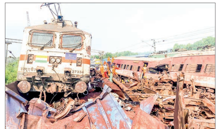
At least 288 people were killed, more than 850 more were injured and many others are feared trapped after a horrific three-train collision late Friday in eastern India's Odisha state.