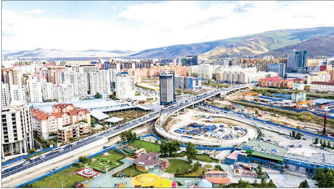
Buddhism is the largest religion in Mongolia practised by 51.7 per cent of Mongolia's population. Ulan Bator, Mongolia is the capital and largest city of Mongolia.

POPE Francis will go to Mongolia in early September in the first visit by a pontiff to the Buddhist-majority Asian nation, the Vatican announced Saturday.