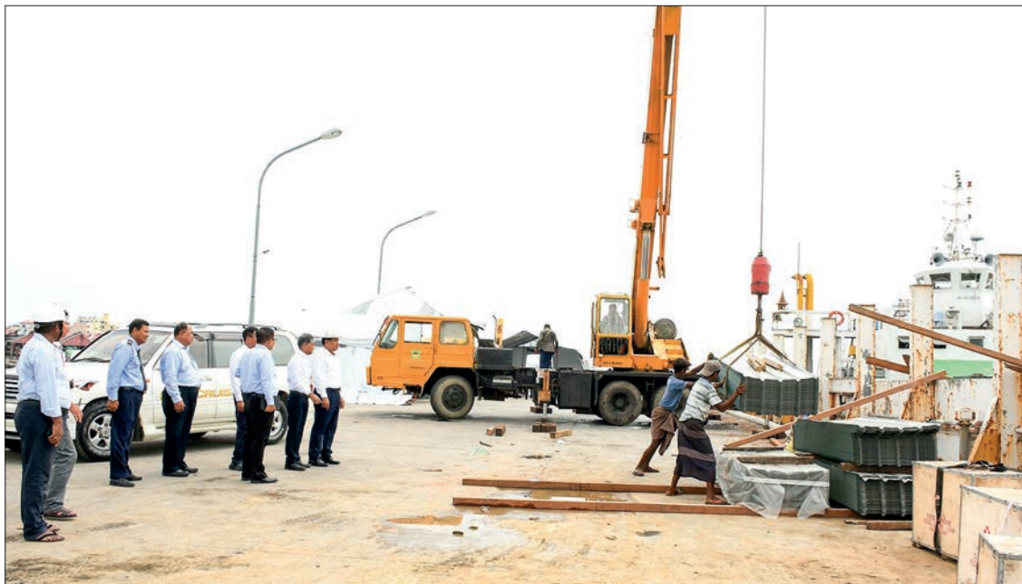
Deputy Prime Minister Admiral Tin Aung San inspects the unloading of relief supplies at the Phaungtawgyi Jetty.

On arrival at the Phaungtawgyi Jetty of Myanma Port Authority, he inspected the unloading work of materials for rehabilitation work from the