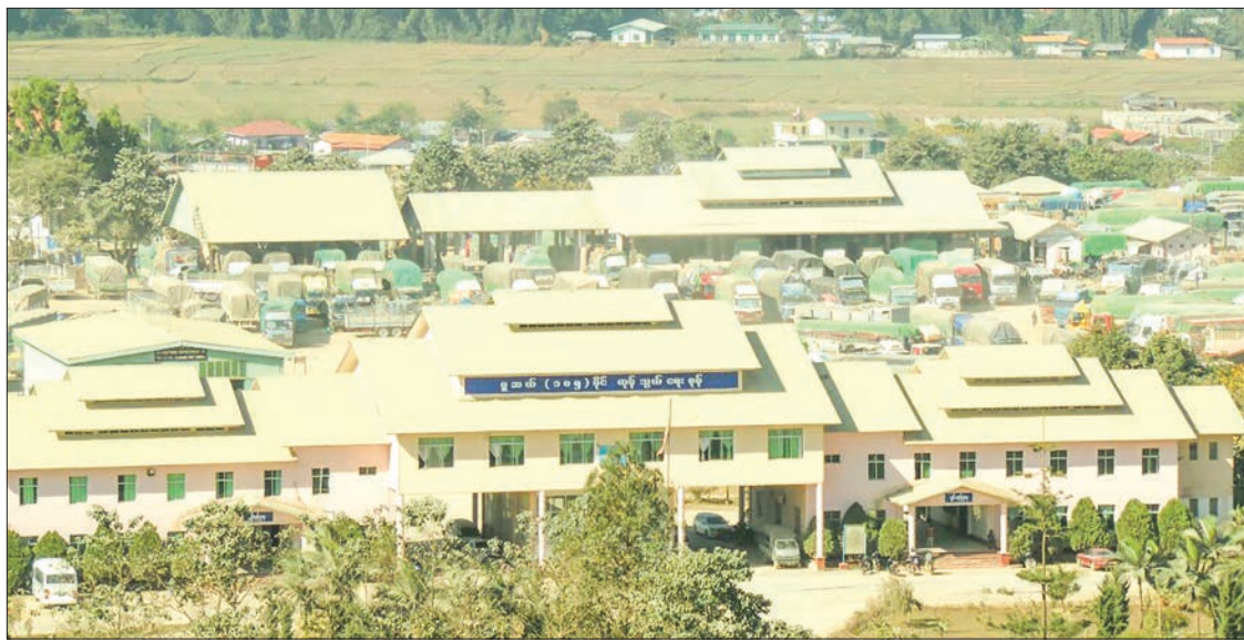
The general view of the Muse 105-Mile Trade Zone on the Myanmar-China border.

Also, the Customs duty exemption on electric vehicles