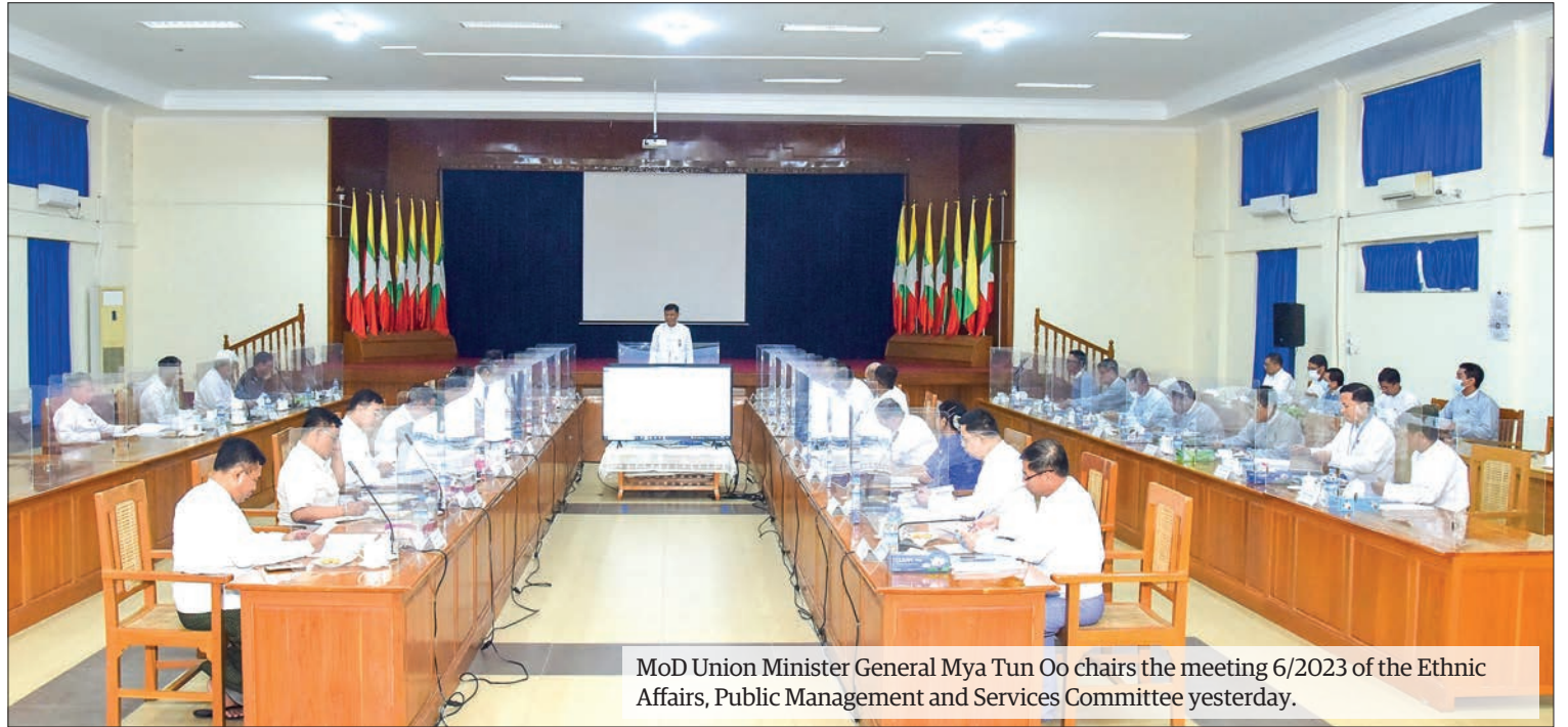
MoD Union Minister General Mya Tun Oo chairs the meeting 6/2023 of the Ethnic Affairs, Public Management and Services Committee yesterday.

Afterwards, committee members continued to present committee matters, and the committee chairman supplemented the requirements. — MNA/CT