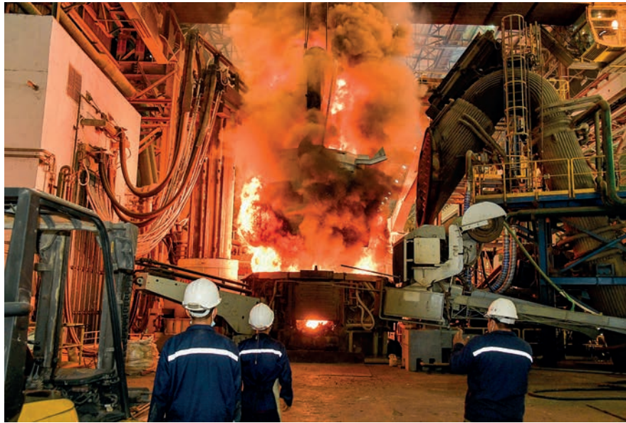
The Senior General presses the button to produce the cubic steel billet and to start the melting process.

In his speech, the Senior General said the government spent a large sum of foreign exchange on the import of iron and steelwares as the country needs some two million tonnes of iron and steelwares on a yearly basis. Manufacturing of steel needs electricity. Hence, ground surveys must be conducted and generating electricity through solar power should be considered. As the Melt Shop 1 has been built, implementation of the whole pro-