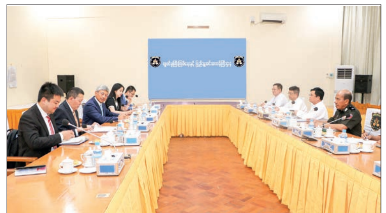
Union Minister U Myint Kyaing holds talks with the delegation led by the Chinese ambassador yesterday in Nay Pyi Taw.

UNION Minister for Immigration and Population U Myint Kyaing received Chinese Ambassador to Myanmar Mr Chen Hai and a delegation at the meeting hall of the ministry in Nay Pyi Taw yesterday afternoon.