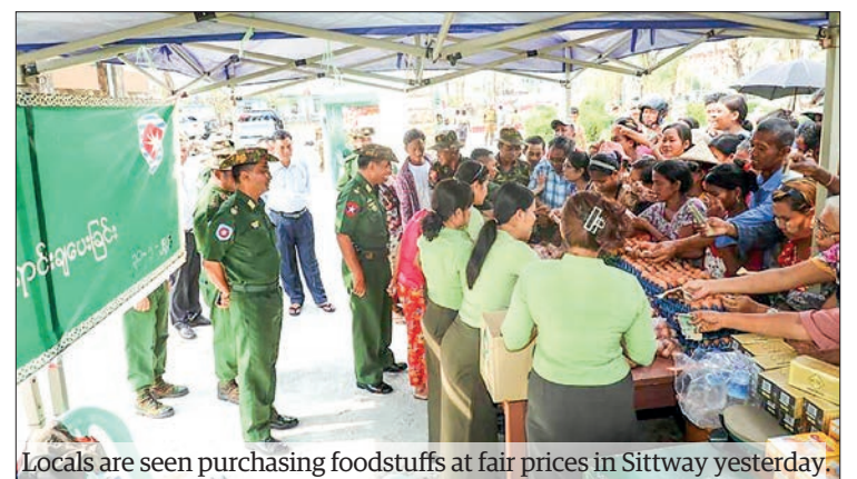
Locals are seen purchasing foodstuffs at fair prices in Sittway yesterday.

The local people and families of the departmental staff enjoyed buying foodstuffs and are very grateful to officials for selling them at low prices during difficult times. Lt-Gen Phone Myat from the Office of Commander-in-Chief (Army), and the Western Command commander and officials inspected the sale of foodstuffs and coordinated the necessary matters. — MNA/KZL