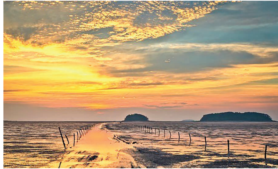
Jeonbuk West Coast UNESCO Global Geopark, The Republic of Korea

human migration and commerce. Ijen is one of the most active volcanoes in the Ijen caldera system.