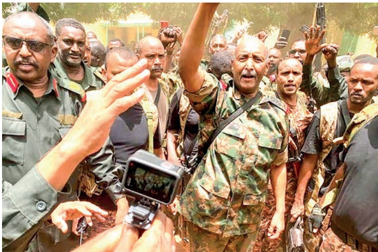
Sudanese army chief Abdel Fattah al-Burhan rallies his troops battling rival paramilitaries in the capital Khartoum on Tuesday.

THE Sudanese army suspended its participation in US- and Saudi-brokered ceasefire talks Wednesday accusing its paramilitary foes of failing to honour