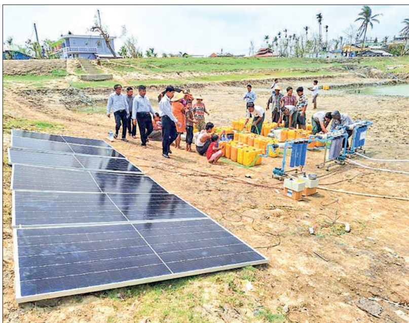
Distribution of drinking water in one of the Mocha-battered townships.

Basic education schools will be opened on 1 June for the 2023-2024 academic year. The school enrolment week is from 23 to 31 May and a total of 374,904 students have been admitted to basic education schools, private schools and monastic schools (high, middle and primary) in 17 townships of Rakhine State to date. All high, middle and primary schools in Rakhine State will be opened on the same day. — MNA/KTZH