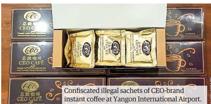
Confiscated illegal sachets of CEO-brand instant coffee at Yangon International Airport.

Therefore, 14 arrests (estimated value of K183,575,710) were made on 16, 28 and 29 May, according to the Illegal Trade Eradication Steering Committee. — MNA/MKKS