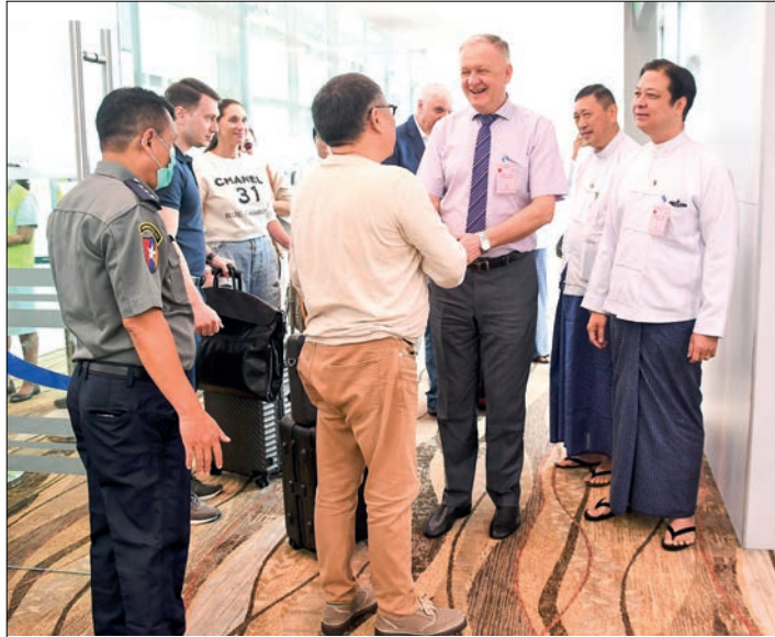
The Russian delegation was seen off at Yangon International Airport yesterday.