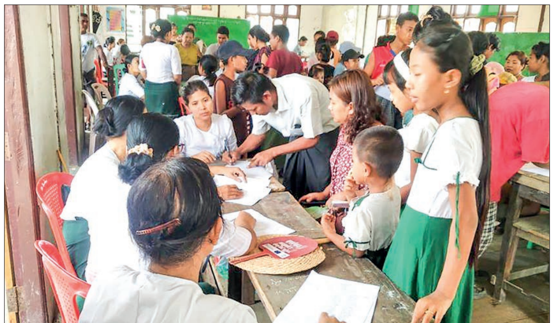
School children are seen during the school enrolment week at BEHS (Pauktaw).