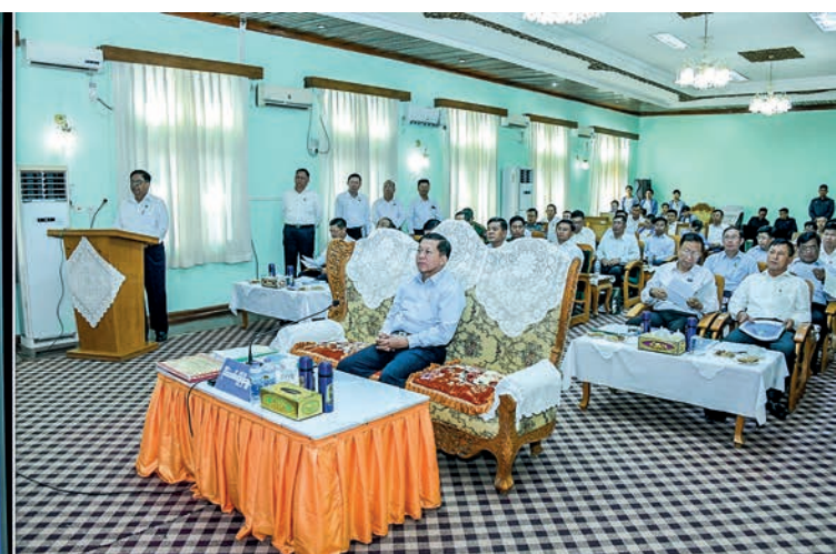
The Premier hears reports on the No 1 Steel Plant (Myingyan) and the Melt Shop.