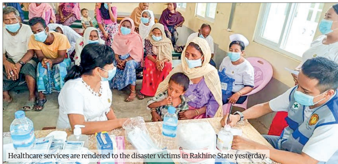
Healthcare services are rendered to the disaster victims in Rakhine State yesterday.

HEALTHCARE services for diarrhoea and other diseases are given to Cyclone victims in Rakhine State at temporary clinics of rapid response teams at the relevant public hospitals and health departments.