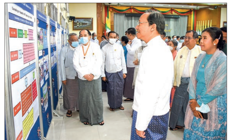
Union Minister Dr Thet Khaing Win looks round the commemorative display at the event yesterday.

Afterwards, a documentary video was shown marking World No Tobacco Day 2023, and Union minister and officials toured the small gallery commemorating the event. — MNA/KZL