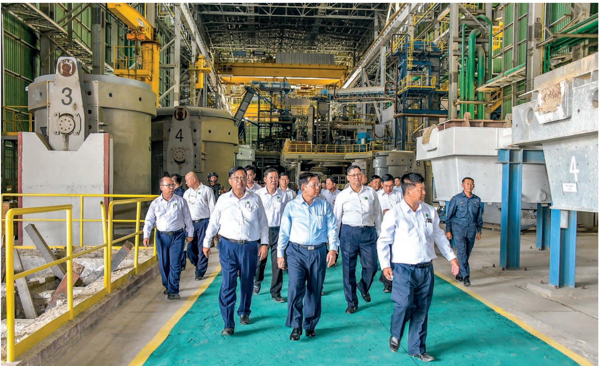
State Administration Council Chairman Prime Minister Senior General Min Aung Hlaing pays inspection tours round the No 1 Steel Plant (Myingyan) of the Ministry of Industry in Myingyan Township, Mandalay Region, on 31 May 2023.

It is necessary to calculate the transport of raw materials to plants and distribution of iron and steelwares produced by them