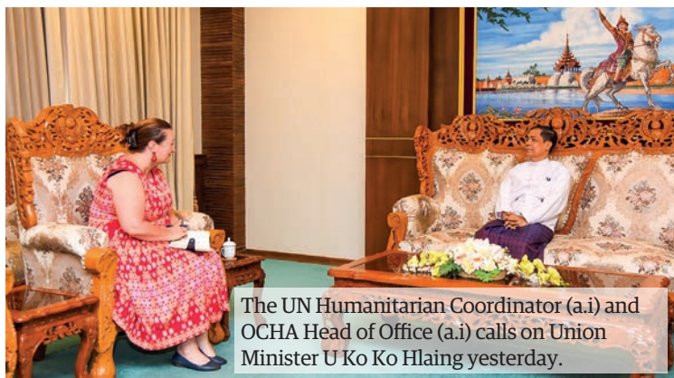
The UN Humanitarian Coordinator (a.i.) and OCHA Head of Office (a.i.) calls on Union Minister U Ko Ko Hlaing yesterday.

investment promotion agencies, local and foreign chambers of commerce and industry teams, and investors attended the forum. — MNA/KZW