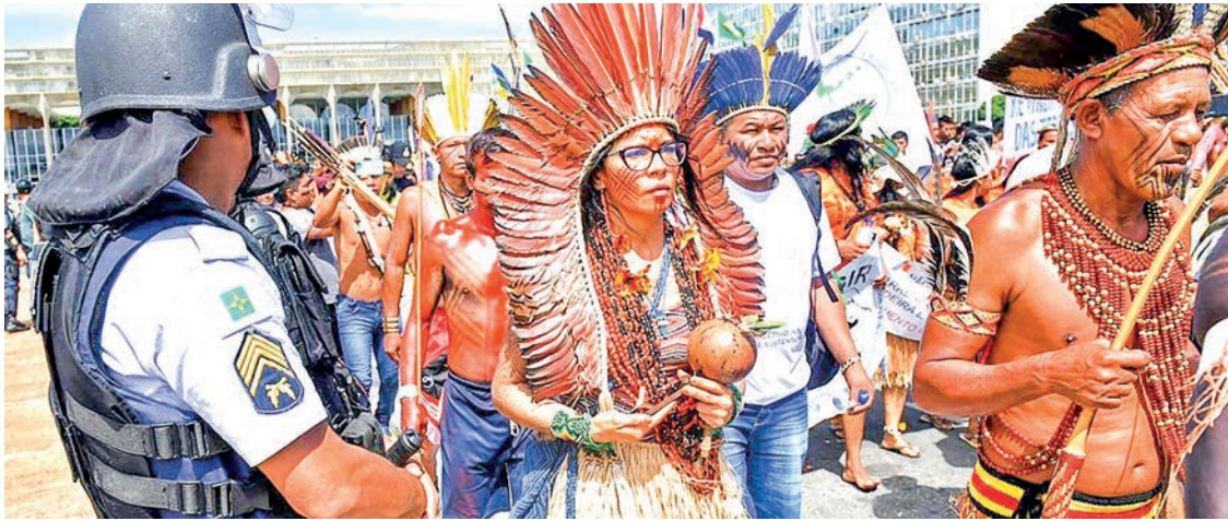
Indigenous people in Brazil own 764 different territories, but the government has not officially said where the borders of those territories are for about a third of them.

BRAZIL'S lower house of Congress approved legislation Tuesday that would limit expanded demarcations of Indigenous lands, which are considered key to protecting the Amazon and its native peoples.