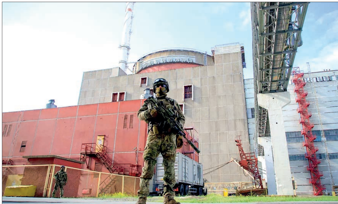
A Russian serviceman stands guard outside the second reactor of the Zaporizhzhia Nuclear Power Station in Enerhodar, Ukraine, on 1 May.

UN nuclear watchdog chief Rafael Grossi said Tuesday he was encouraged by the reaction of Ukraine and Russia to “concrete principles” laid out by the body to prevent catastrophe at Ukraine’s Zaporizhzhia nuclear plant.