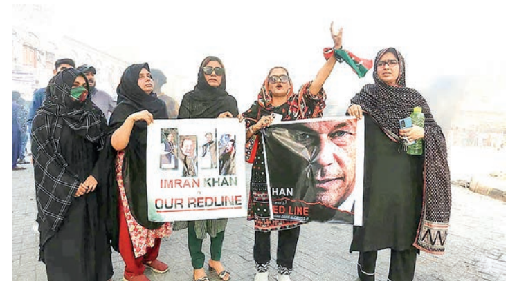
Pakistan Tehreek-e-Insaf party activists and supporters of former Pakistan's Prime Minister Imran shout slogans as they block a road during a protest against the arrest of their leader in Hyderabad on 9 May 2023.

Human Rights Watch has said that at least 4,000 people, including members of the opposition Pakistan Tehreek-e-Insaf party led by Khan, have been detained for their role in the protests.—Kyodo