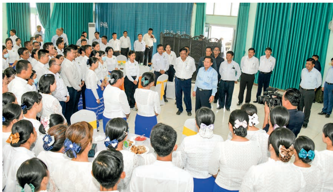
The Senior General cordially greets the employees.

ject must be undertaken phase by phase. This plant and the Pinpet plant will meet the local demand for iron and steelwares. Qualified human resources must be turned