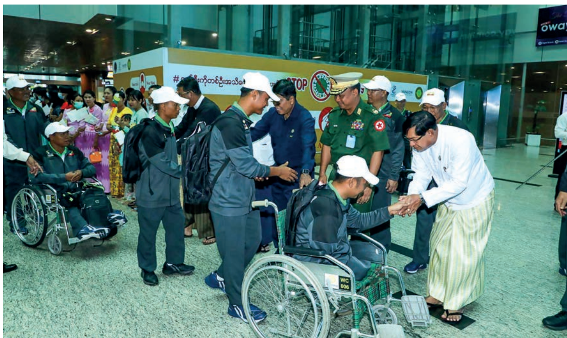
The Myanmar Paralympic Sports Team are seen at Yangon International Airport before leaving for Cambodia yesterday.

Athletes were seen off by Yangon Region Chief Minister U Soe Thein, and Yangon Region government ministers, Yangon Command Commander Maj-Gen Zaw Hein, the director-general of the Department of Sports and Physical Education, Principal U Aung Naing Swe of the Institute of Sports and Physical Education (Yangon), Yangon Region Sports and Physical Educa-