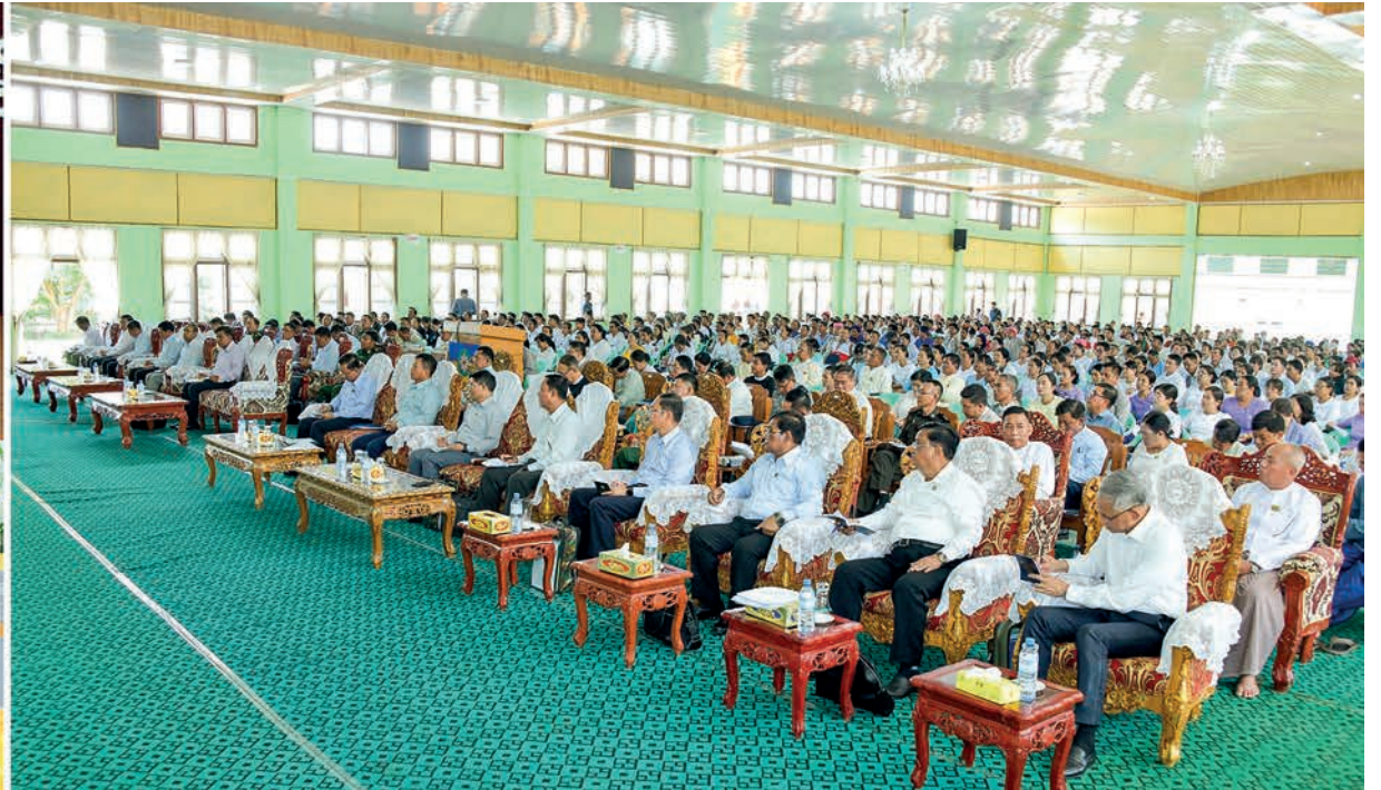
State Administration Council Chair Premier Senior General Min Aung Hlaing meets MSME business people in the Danu Self-Administered Zone yesterday.

L OCAL farmers have to strive for increasing per-acre yield rather than extending sown acreage, said Chairman of the State Administration Council Prime Minister Senior General Min Aung Hlaing at the meeting with businesspersons from micro-, small- and medium-sized enterprises in Danu Self-Administered Zone in the hall of Pindaya yesterday afternoon.