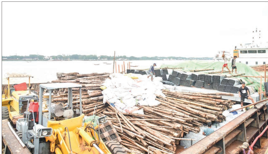
Relief supplies are loaded onto MV Charities to transport them to Rakhine State yesterday.

A 29-metre landing craft from the Tatmadaw (Navy) carrying 1,000 sacks of rice weighing 50 tonnes and a 56-metre landing craft from the Tatmadaw (Navy) carrying 1,003 planks weighing 10.07 tonnes left for Sittway via Taungup Port yesterday.