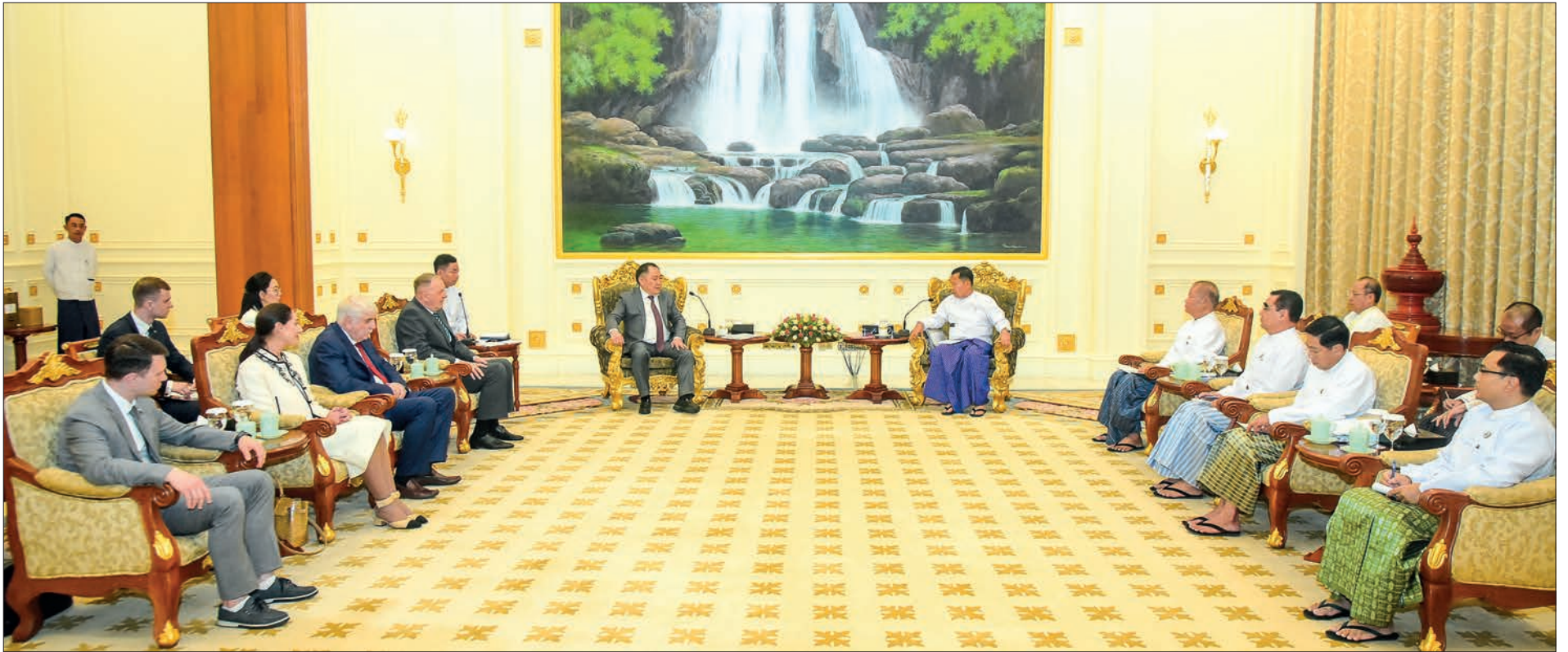
The Russian State Duma delegation calls on State Administration Council Vice-Chairman Deputy Prime Minister Vice-Senior General Soe Win in Nay Pyi Taw yesterday.

STATE Administration Council Vice-Chairman Deputy Prime Minister Vice-Senior General Soe Win received a delegation led by Mr Sholban Kara-Ool, Deputy Chairman of the State Duma, Federal Assembly of the Russian Federation, at the State Adminis-