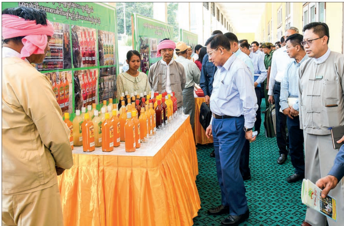
The Premier looks round the booths exhibited at the meeting yesterday.

The Senior General viewed round the booths which showcase domestic products, foodstuffs, personal goods, industrial products, traditional handiworks, and clothes and asked about grasping the market shares of these products.