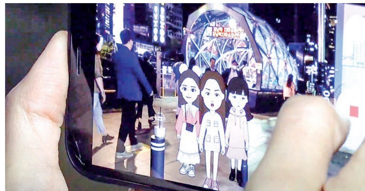
A still from “Teleporting”, by directors Kwon Ohyeon, Nam Arum, Nana Noka and Chifumi Tanzawa.