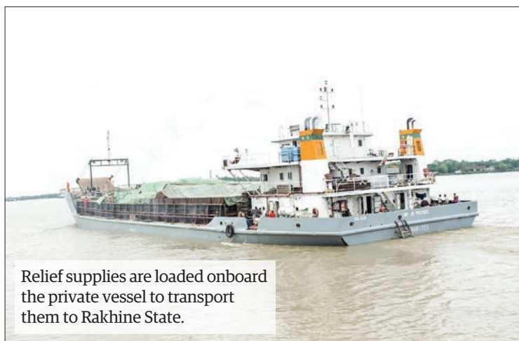
Relief supplies are loaded onboard the private vessel to transport them to Rakhine State.

FOLLOWING the guidance of the National Disaster Management Committee, the Transport and Communication Work Committee has planned and supervised the transport of aid and relief materials to Rakhine State. The materials are being transported by boats, planes and vehicles, including MV Charites. MV Charites carried zinc sheets, cement bags, trucks, teak, hollow pipes, purified water, instant noodles, ready-made foods, clothes and household utensils, medicine and rehabilitation items from the Myanmar Terminal (TMT) to Sittway yesterday morning.