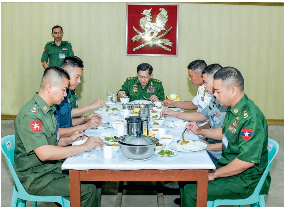
The Senior General has lunch together with senior officer instructors and trainees.

The Senior General then had lunch together with senior officer instructors and senior officer trainees at the Command and General Staff College.