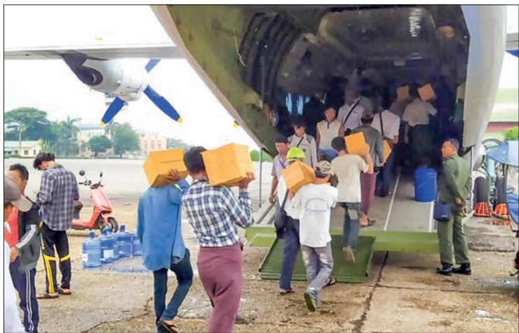
Relief items are loaded aboard the Tatmadaw aircraft to transport them to Rakhine State.

Officials in the respective areas received relief supplies and will distribute them to storm victims.