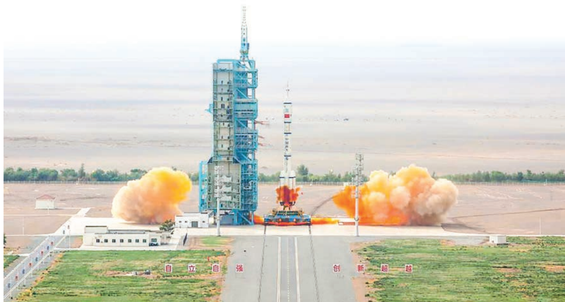
The Shenzhou-16 manned spaceship, atop a Long March-2F carrier rocket, blasts off from the Jiuquan Satellite Launch Center in northwest China 30 May 2023.

The launch was a "complete success" and the "astronauts are in good condition",