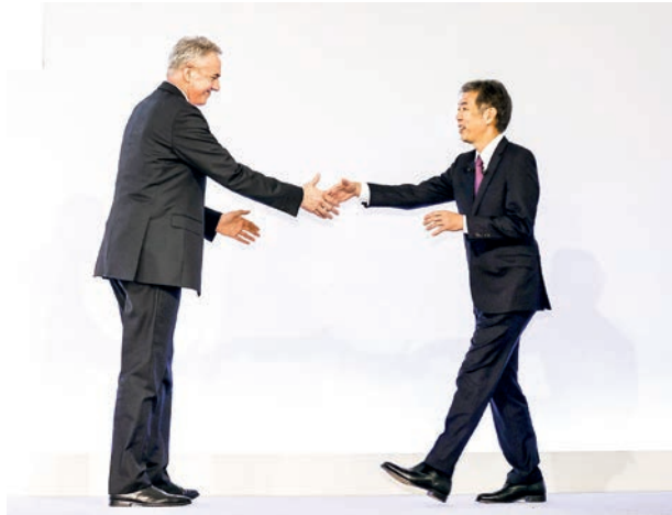
The presidents of Hino Motors Ltd and Mitsubishi Fuso Truck and Bus Corp are pictured at a press conference in Tokyo on 30 May 2023.

ingly difficult for a commercial vehicle maker, which sells fewer vehicles than traditional automakers, to keep up with such a trend on their own, Hino said.