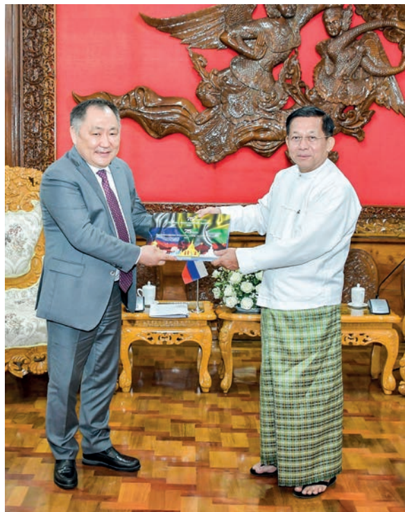
Exchange of gifts.