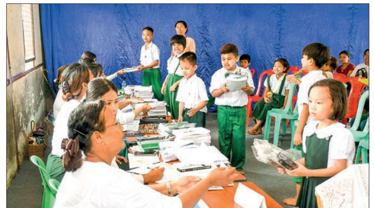
School supplies are provided for school children in Sittway yesterday.

Sittway Township said, "I am worried as the children have to go to school in the post-cyclone era. Now, I am glad that I see the maintenance of school buildings is completed. The arrangements are being made to open the schools on 1 June and it is ready for the students. Currently,