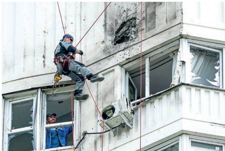
A specialist inspects the damaged facade of a multi-storey apartment building after a reported drone attack in Moscow on 30 May 2023.

A swarm of drones hit Moscow on Tuesday in an unprecedented attack and Russian drones struck Kyiv for a third straight day as Ukraine gears up for a major of-