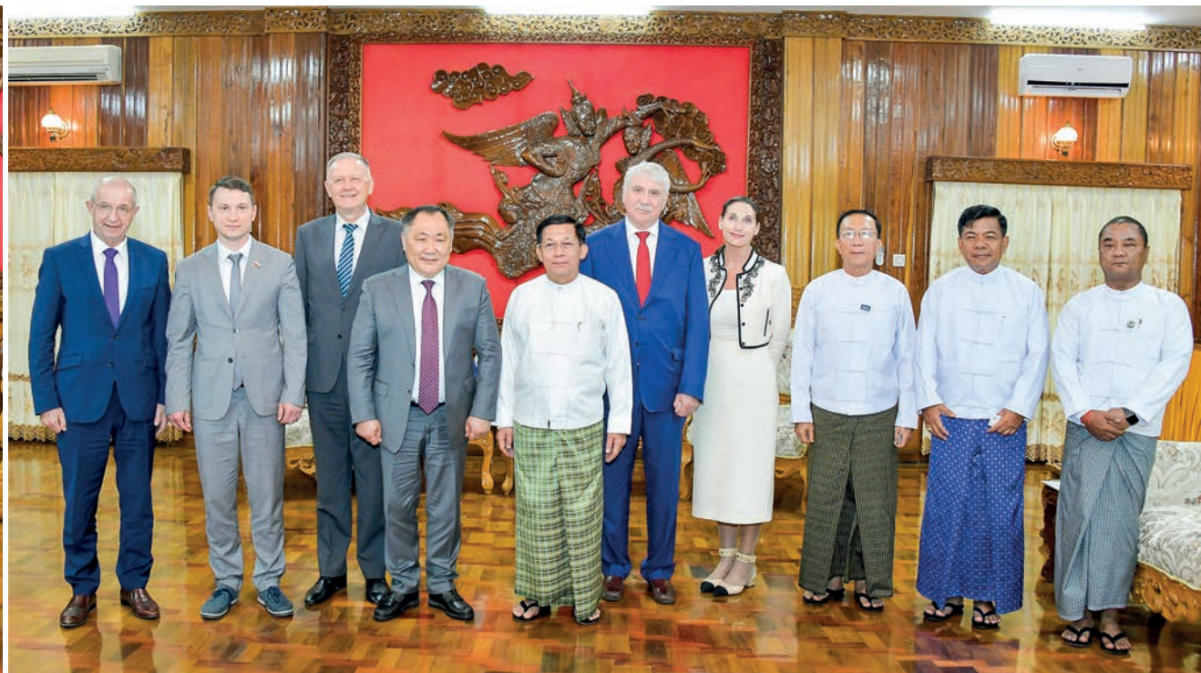
The Senior General poses for the documentary group photo at the courtesy call yesterday.