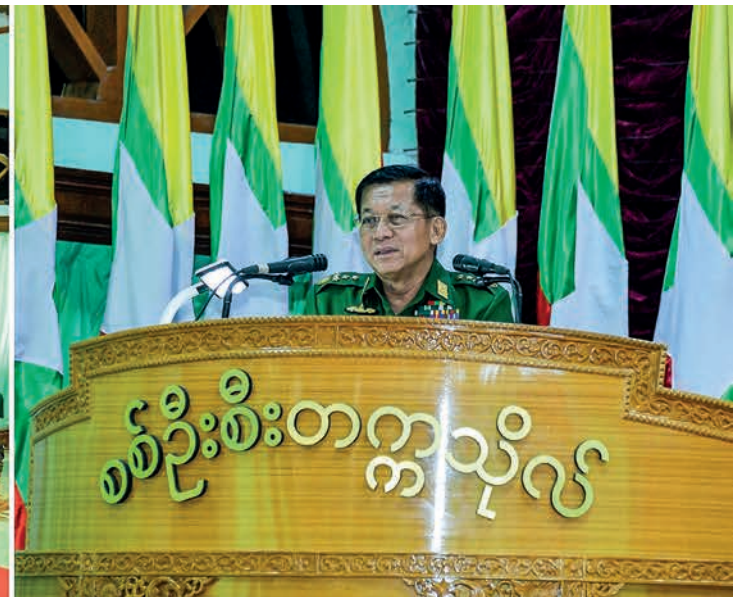
State Administration Council Chairman Commander-in-Chief of Defence Services Senior General Min Aung Hlaing meets senior officer instructors and senior officer trainees at the Command and General Staff College in Kalaw yesterday.

A LL senior military officers have to serve their duties with the least mistakes, said Chairman of the State Administration Council Com-