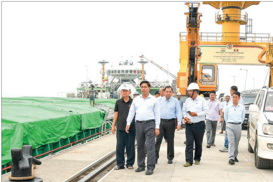
Deputy Prime Minister Admiral Tin Aung San inspects the arrival of relief items at Sittway Port yesterday.

Then, he paid homage to Pyilochantha Pagoda and looked round the consecration hall of the pagoda which was demolished by Mocha and donated cash to