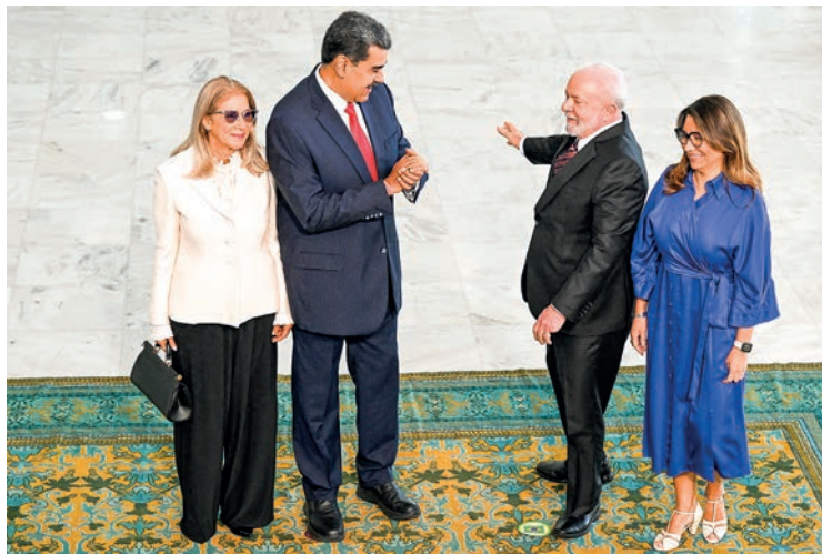
Brazilian President Luiz Inacio Lula da Silva (2-R) and First Lady Rosangela "Janja" da Silva (R) welcome Venezuela's President Nicolas Maduro (2-L) and First Lady Cilia Flores during a ceremony at Planalto Palace in Brasilia on 29 May 2023.

Veteran leftist Lula kicked things off Monday by meeting with Venezuelan President Nicolas Maduro, hailing the "historic" restoration of a relationship that was severed under his predecessor, far-right ex-president Jair Bolsonaro.