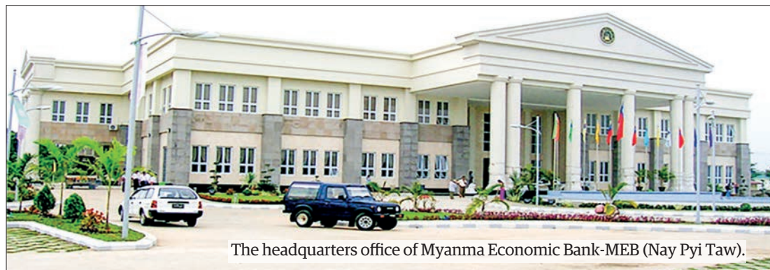
The headquarters office of Myanmar Economic Bank-MEB (Nay Pyi Taw).

MYANMA Economic Bank-MEB will increase the interest rates for savings accounts, certificate of deposit (CD) and fixed deposits starting from 1 June.