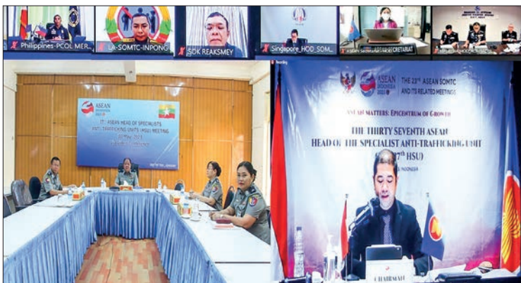
The 37 th ASEAN Heads of Specialist Anti-Trafficking Units-HSU Meeting in progress online.

THE 37 th ASEAN Heads of Specialist Anti-Trafficking Units – HSU Meeting was held virtually at the meeting hall of Anti-Human Trafficking Police Force Office No.38 yesterday.