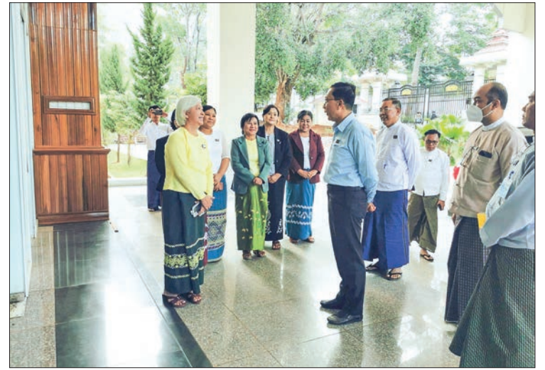
Deputy Prime Minister U Win Shein is pictured (C) at the meeting with MoPF departmental personnel in Taunggyi, Shan State.

Then, the personnel affairs, welfare issues, and operational conditions presented by the respective departments were coordinated.