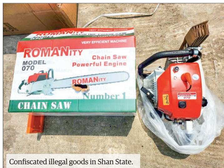
Confiscated illegal goods in Shan State.

An on-duty team at the Kawkareik (Tadakyoe) combined checkpoint captured 30 JFresh infrared cookers (worth K1.95 million) and 60 Nest generation lady bags (worth K2.1 million) that were not declared in the ID from two vehicles (approximately K4.05 million) heading from Myawady to Yangon. The action was taken under Customs Procedures. Therefore, six arrests (estimated value of K244,543,000) were made on three consecutive days from 26 to 28 May, according to the Illegal Trade Eradication Steering Committee. — MNA/MKKS