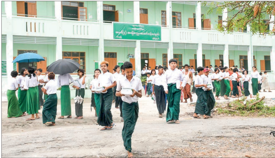
Students are seen after enrolment at the BEHS No 4 Sittway yesterday.