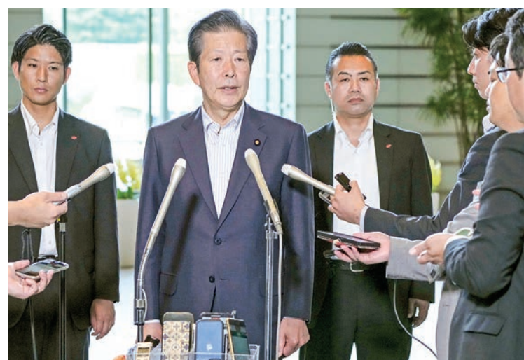
Natsuo Yamaguchi (2nd from L), leader of the Komeito party, speaks to reporters at the prime minister's office on 30 May 2023.

After meeting with Kishida at the prime minister's office, Yamaguchi said, "We have confirmed we will sustain our collaboration by cherishing the significance and broad perspective of the coalition," adding that