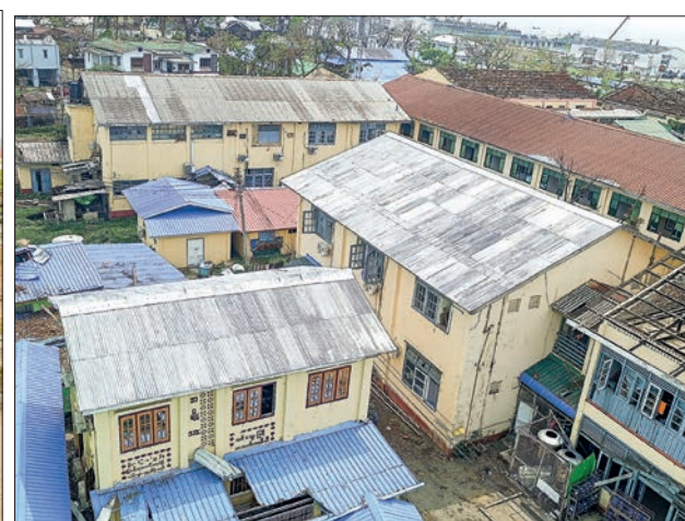
Wards and buildings of the Sittway General Hospital are under repair and restoration. Some are completed (above photos).