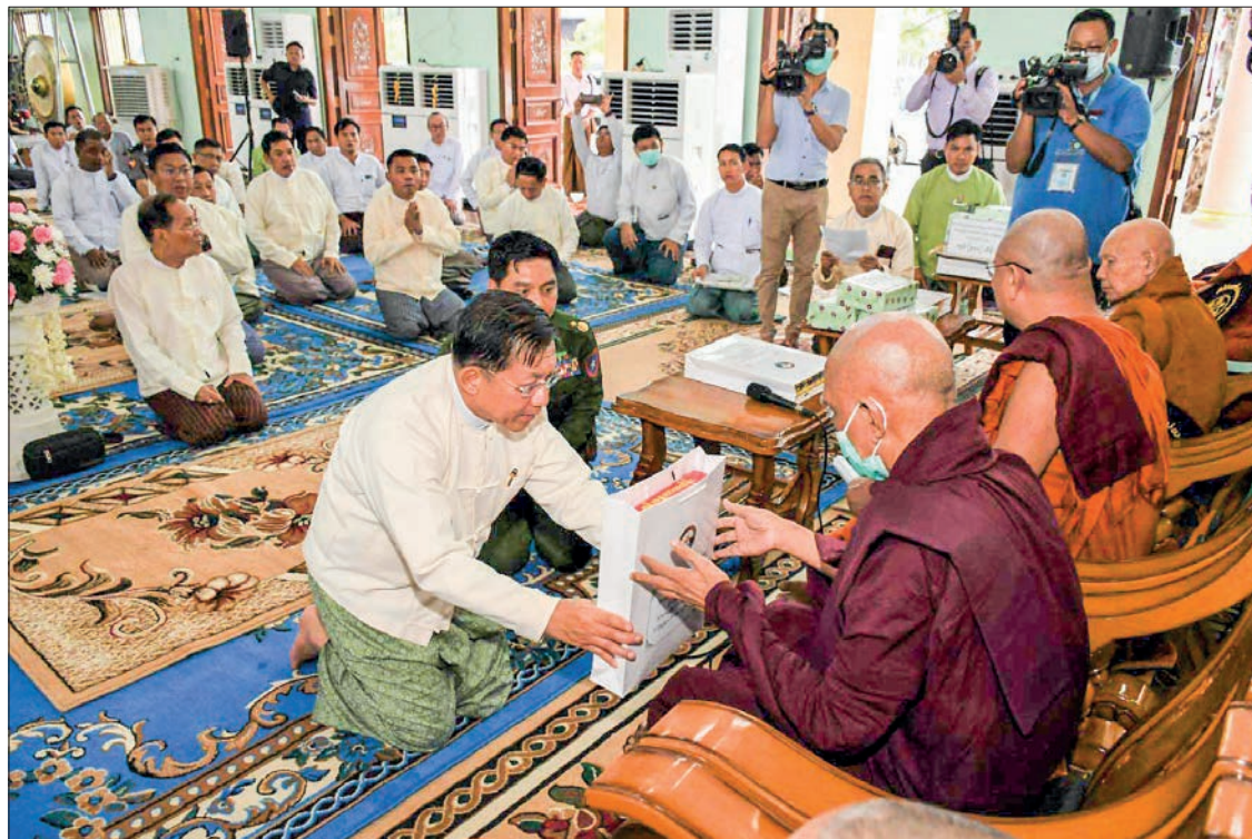
The Senior General offers donations to Sayadaws.

The Senior General presented supplication to Secretary Sayadaw, saying that