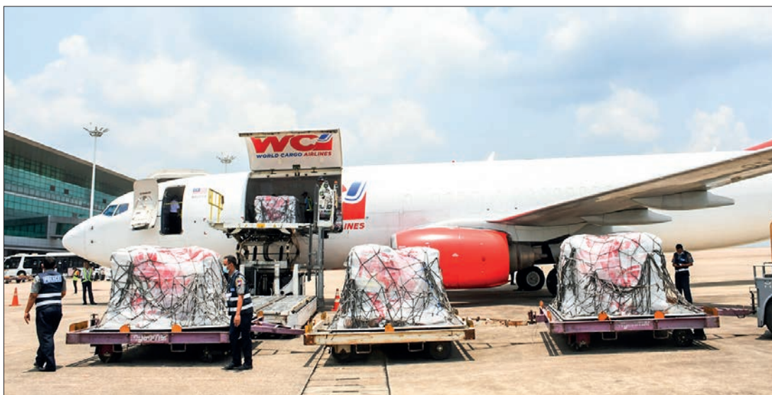
The photo shows the arrival of the third batch of humanitarian aid donated by ASEAN countries yesterday.

A Malaysian Airlines plane carrying a total of 16 and a half tonnes of emergency supplies worth about US$53,000 arrived at Yangon International Airport yesterday afternoon. The relief items were sent from ASEAN countries to assist those affected by Cyclone Mocha.