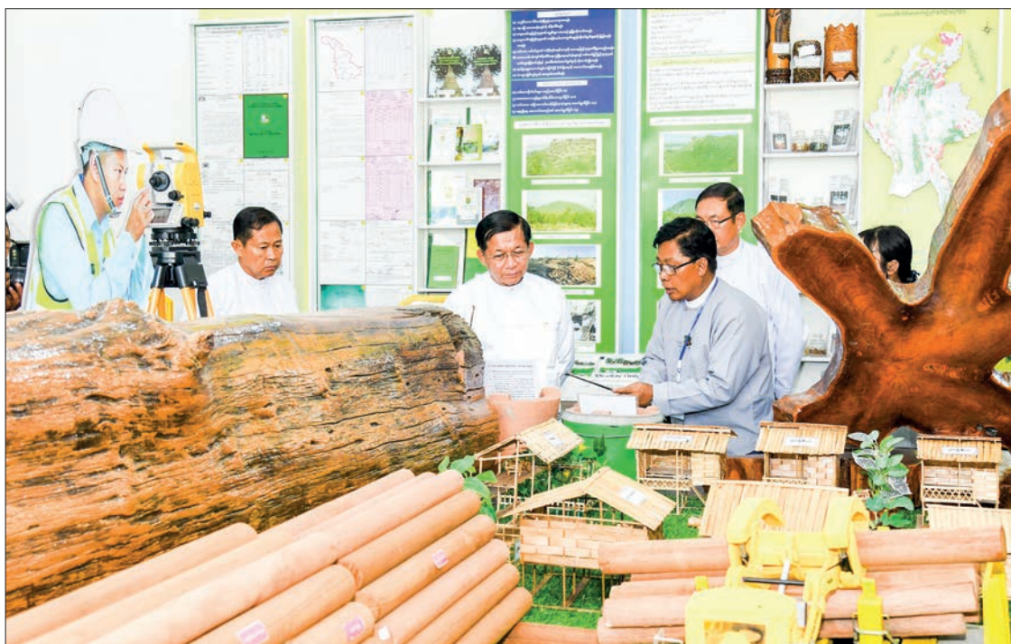
The Premier views the display of the Ministry of Natural Resources and Environmental Conservation at the event.

The Senior General presented prizes to first-prize winners in the university and high