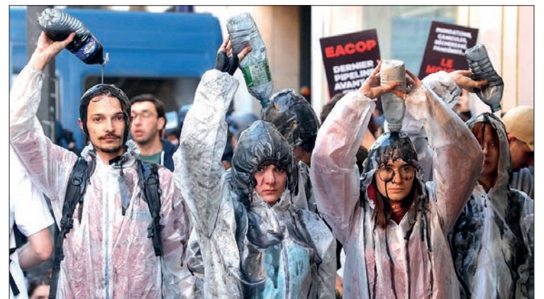
Activists are stepping up pressure on companies to reduce their carbon footprints.