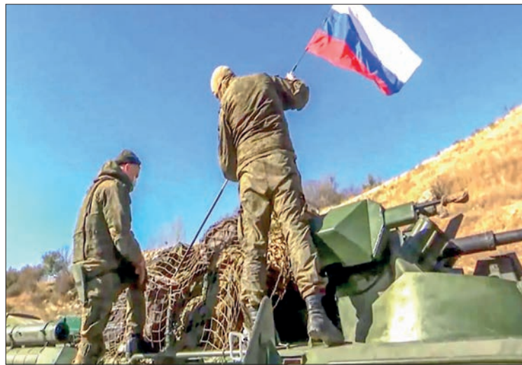
Two soldiers attach a flag on a Russian peacekeeping force military vehicle as they move on the road towards Martuni, Armenia, on 13 November 2020.