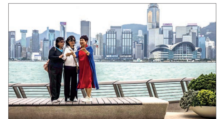
Executives say China's free-spending tourists will play a key role in the revival of the travel industry.