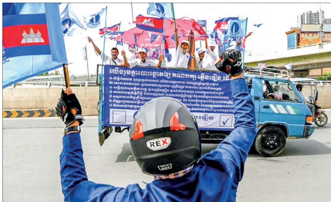
Supporters of Candlelight Party shout slogans during a rally on the last day of campaigning for the commune elections in Phnom Penh, Cambodia, 3 June 2022.

CAMBODIA'S main opposition party on Thursday lost a bid to overturn its ban from the upcoming elections, paving the way for long-serving leader Hun Sen to run a one-horse race.