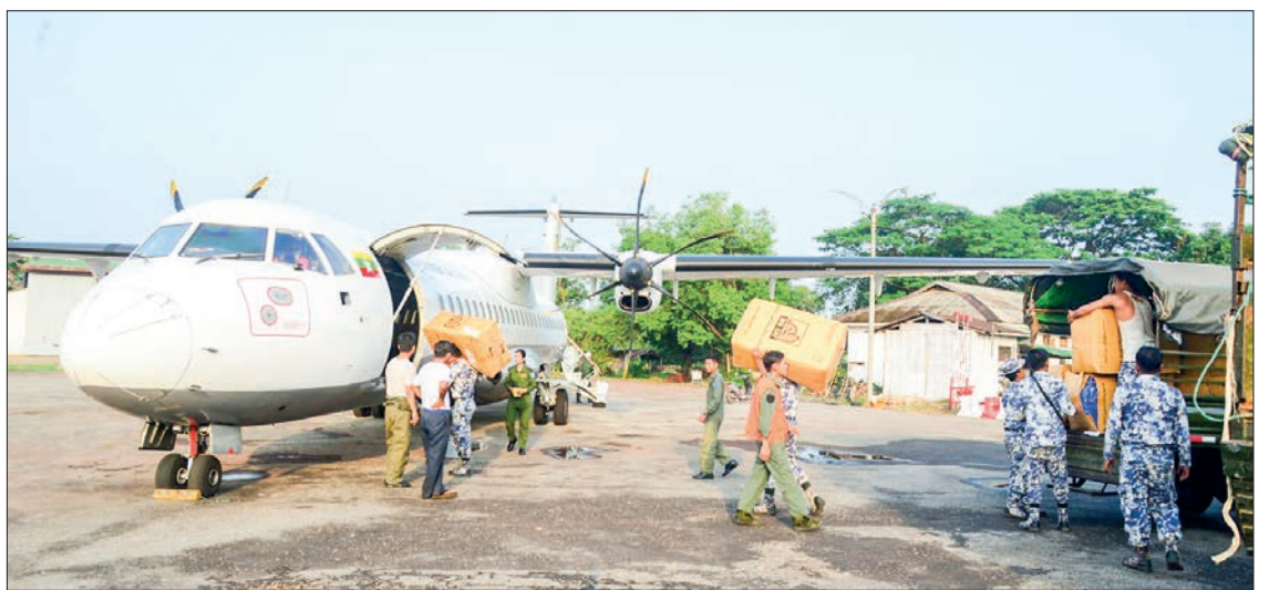
Relief items are loaded aboard the Tatmadaw aircraft to deliver them to Rakhine State.

Officials in the respective areas received relief supplies and will distribute them to storm victims.