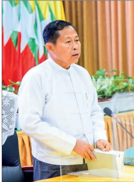
State Administration Council Vice-Chair Deputy Prime Minister Vice-Senior General Soe Win presides over the meeting 3/2023 the Illegal Trade Eradication Steering Committee yesterday.

The Vice-Senior General recounted that the Prime Minister has given guidance that efforts must be made for manufacturing the basic personal goods to meet the domestic demand and export the surplus to foreign markets. Only when necessary