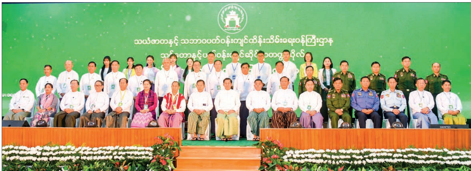
The Senior General poses for the documentary group photo at the centennial celebration yesterday.

Artists from the Fine Arts Department and students of the University of Forestry and Environmental Science entertained the Senior General and party with dances and songs. The Senior General presented the flower basket to the artistes and students. Then, the Senior General and party visited the booths of the Ministry of Natural Resources and Environmental Conservation.