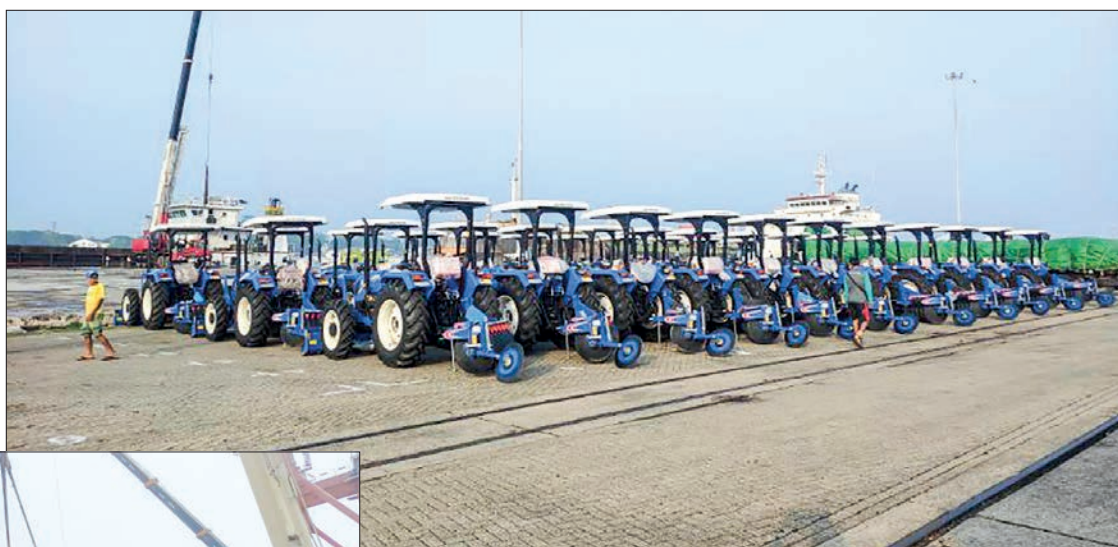
The photos show the arrival of tractors in a bid to support recovery efforts in agriculture in Rakhine State yesterday.

TO contribute to land improvement works performed to restore the livelihoods of farmers in Rakhine State which were destroyed by a very severe Cyclone Mocha, the Agricultural Mechanization Department of the Ministry of Agriculture, Livestock and Irrigation (MoALI) sent out 33 (50 horse-powered) New Holland tractors, 33 six-share ploughs, and 33 blade