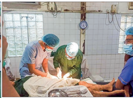
Healthcare services are provided for disaster-battered people.

The charging points are designated at near bus terminal, Meesetkyi roundabout, airport junction, in front of Lawkananda pagoda, in front of the state government office, cultural museum, Biluma bridge and in front of township revenue office for the people to charge phones, electric bulbs and batteries. — MNA/KTZH