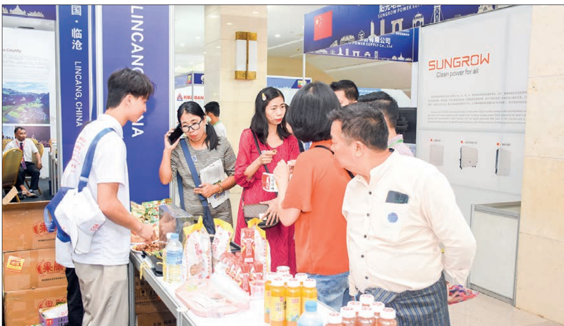
The second day of the Myanmar (Nay Pyi Taw)-China (Lancang) Trade Fair in progress yesterday.