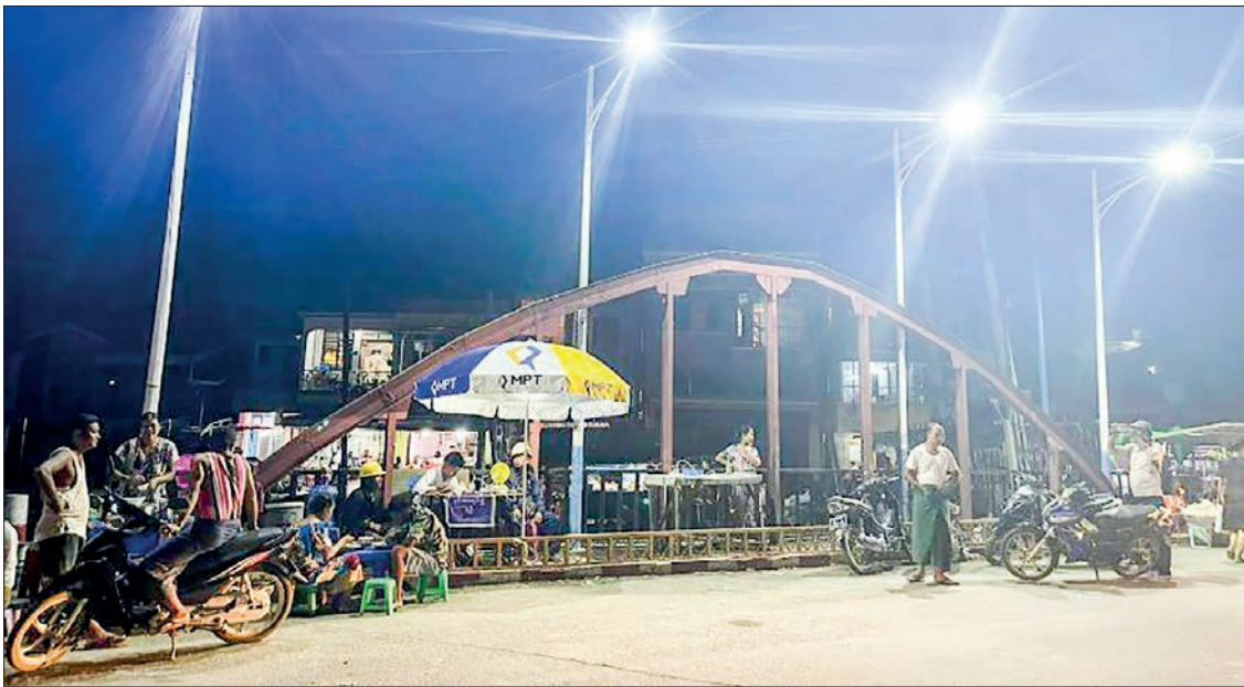
Telephone recharging counters are seen for the public in Sittway yesterday.