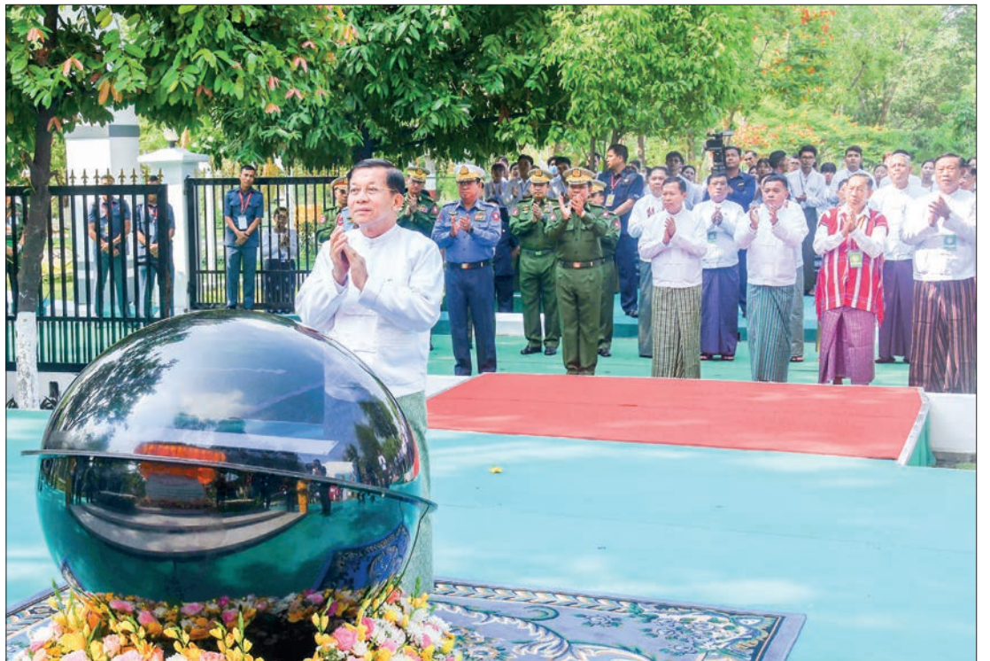
State Administration Council Chairman Prime Minister Senior General Min Aung Hlaing unveils the plaque of the centennial celebration at the Forestry and Environmental Science (Yezin) in Nay Pyi Taw on 26 May 2023.

IT is necessary to conduct the forestry undergraduate and post-graduate courses as well as turn out BSc forestry professionals, said Chairman of the State Administration Council Prime Minister Senior General Min Aung Hlaing at the centenary of forestry at the University of Forestry and Environmental Science (Yezin) in Zeyathiri Township of Nay Pyi Taw Council Area yesterday morning.