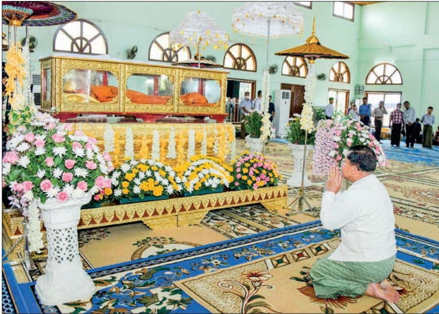
The Senior General pays homage to the remains of Bhamo Sayadaw.