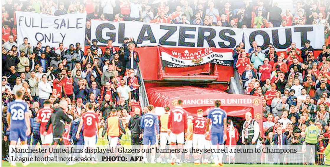
Manchester United fans displayed "Glazers out" banners as they secured a return to Champions League football next season.

"He's proved that he's got the seriousness, the confidence and the authority to be able to make big decisions," said former United captain Gary Neville on Ten Hag's man-management. — AFP