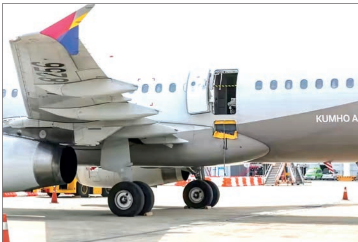
The Asiana Airlines plane landed at Daegu with its door open.

The incident caused some passengers to have breathing difficulties, and several people were taken to a hospital after the landing, Asiana said, adding that there were no major injuries or damage. — AFP