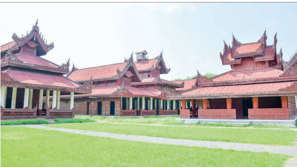
State Administration Council Chairman Prime Minister Senior General Min Aung Hlaing views round the Myanansankyaw Golden Palace in Mandalay yesterday (top and above photos).