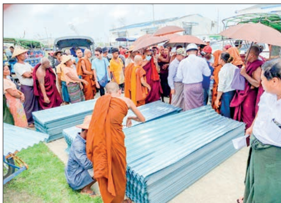
CI sheets are provided for monasteries in Sittway.