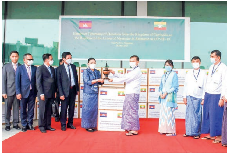
The handover ceremony of the Cambodia-donated Sinovac vaccines and syringes in progress yesterday.