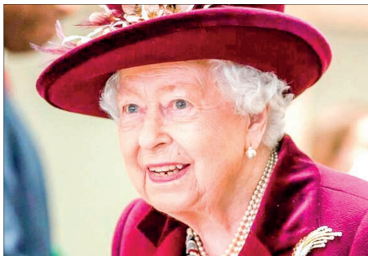
Files show how the FBI, which helped secure the monarch's safety during her visits, was worried about IRA threats.

Four years earlier in 1979, IRA paramilitaries opposed to British rule in Northern Ireland killed Louis Mountbatten, the last colonial governor of India and an uncle of Philip, in a