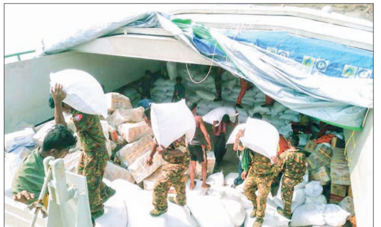
The photo shows the discharging of relief items in Minbya.

He urged responsible officials to put foodstuffs brought in by the Kelantan 6 vessel under shelter without being damaged and distribute them to displaced people as soon as possible.