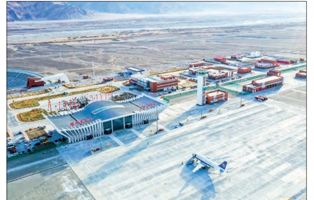
The first flight arrives at the Taxkorgan airport in Taxkorgan Tajik Autonomous County, northwest China's Xinjiang Uygur Autonomous Region, 23 December 2022.

Air routes that were in regular use amounted to 4,670 by the end of 2022, with 336 reaching global destinations, it added.