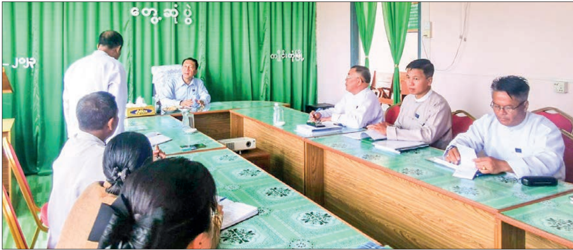
Deputy Prime Minister MoPF Union Minister U Win Shein meets departmental personnel in Shan State (East) on 12 May.

DEPUTY Prime Minister Union Minister for Planning and Finance U Win Shein met staff from the State Planning and Finance (Branch Office), Central Statistical Organization, Myanmar Economic Bank, Myanmar Agricultural Development Bank, Myanmar Insurance, Customs Department and Pension Department in Kengtung Township of Shan State (East) on 12 May.