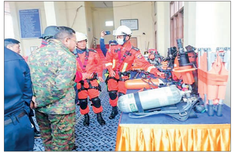
Role-playing exercises for rescue and rehabilitation operations are being conducted.

The chief minister delivered a speech and coordinated the necessary actions based on the presentations of those who attended the meeting. — MNA/KZL