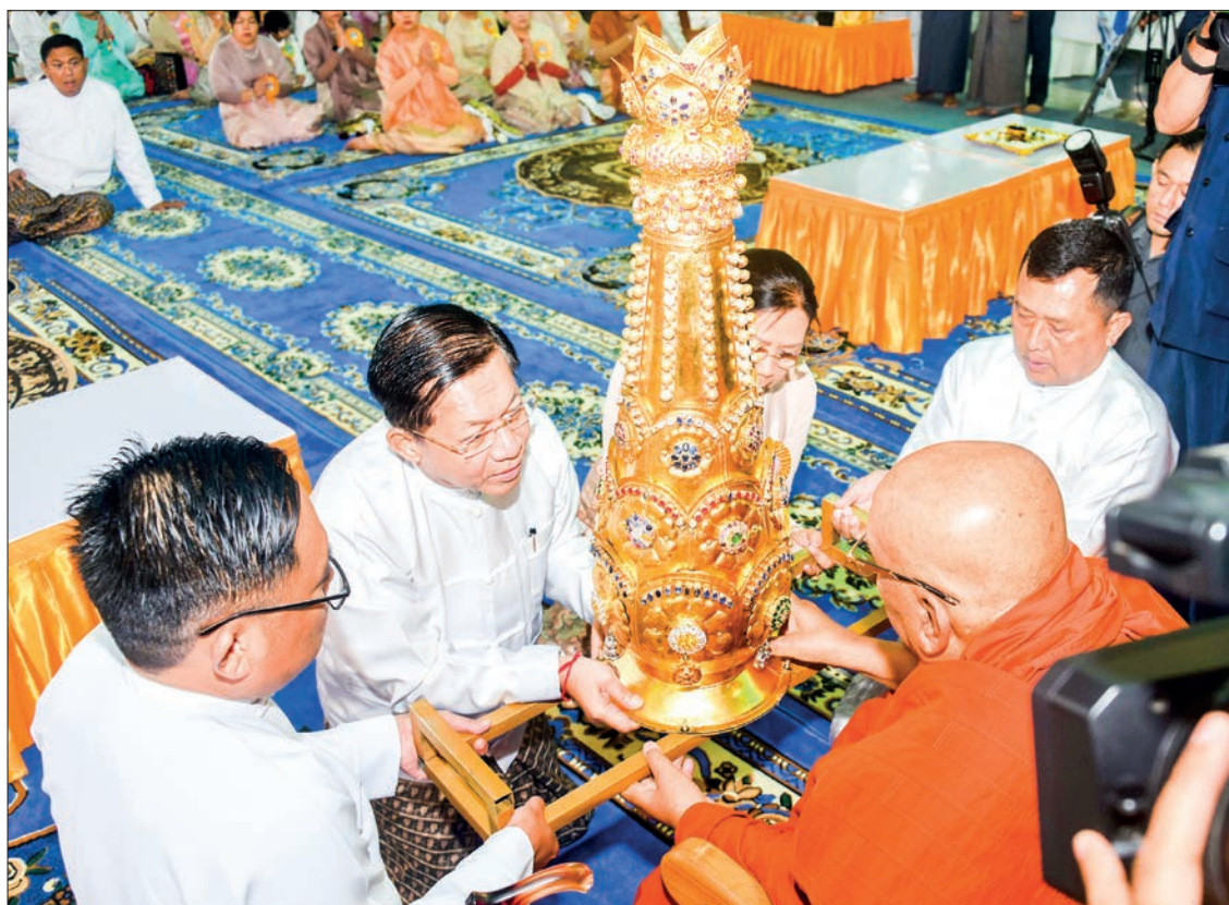
Ceremonies to enshrine religious objects at the upper reliquary and hoist a golden umbrella atop the Thatta Thattaha Maha Bawdi Pagoda in progress yesterday.

offered the day meal to members of the Sangha and served the guests lunch.