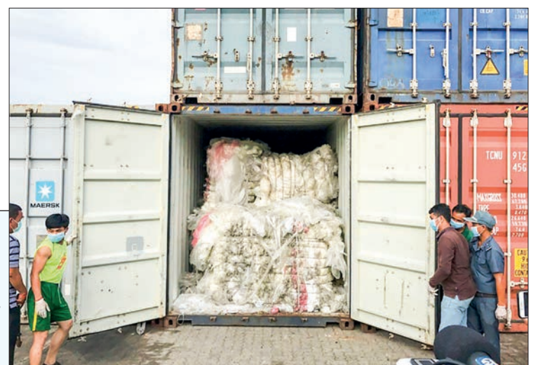
Photo taken on 16 July 2019 shows containers filled with plastic waste at the Sihanoukville Autonomous Port in Preah Sihanouk Province, Cambodia.

2030,” Cambodian Deputy Prime Minister and Interior Minister Sar Kheng said in the statement. — Xinhua