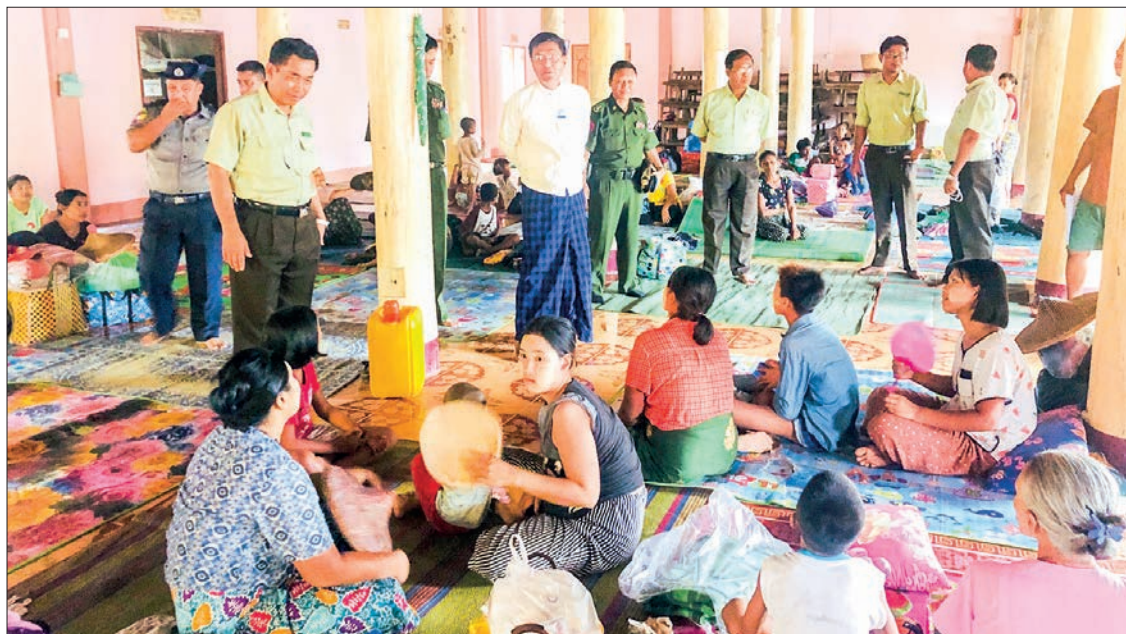
Deputy Minister U Ye Tint views round the temporary cyclone shelter in Thandwe on 12 May.

DEPUTY Minister for Information and Public Relations Department U Ye Tint met the director of the Ayeyawady Region Informa-