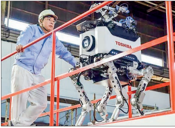
Toshiba Machine offers robot models. Toshiba unveiled a remote-controlled robot resembling a headless dog.

JAPANESE conglomerate Toshiba on Friday said full-year net profit fell by more than a third due partly to weak sales in electronic devices and other one-off factors.