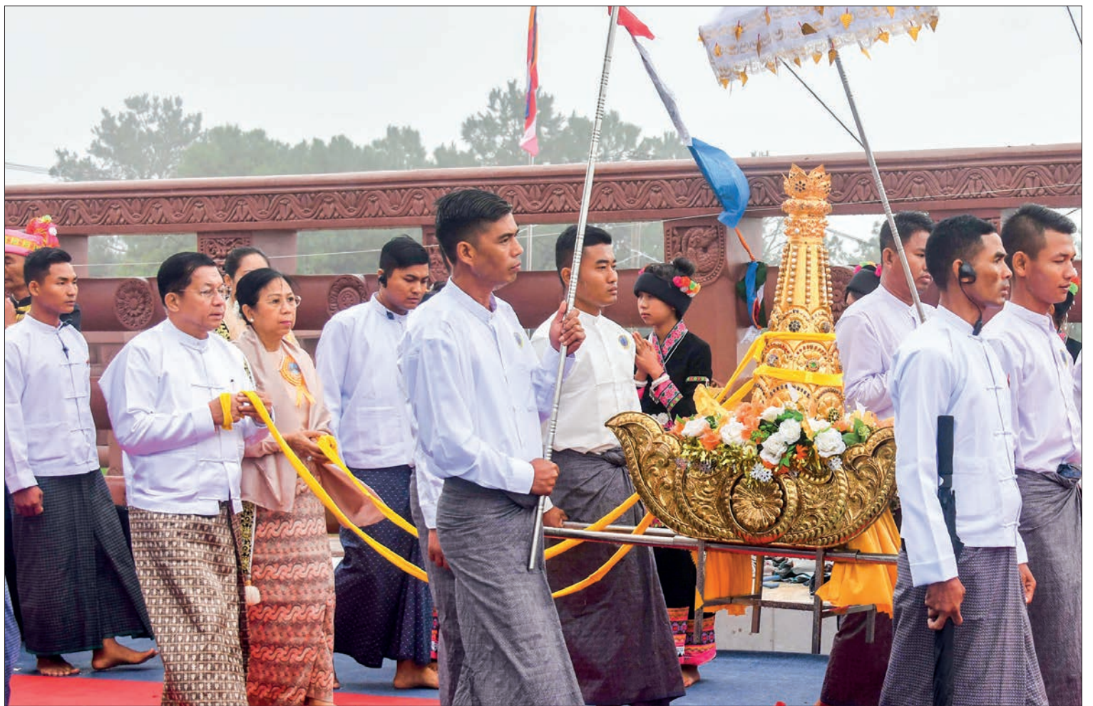
Chairman of the State Administration Council Prime Minister Senior General Min Aung Hlaing and wife Daw Kyu Kyu Hla convey the diamond orb, religious objects and tiers of the umbrella by the decorated float to the temporary venue in front of the pavilion on 13 May 2023.

The Senior General and wife, and members conveyed the diamond orb, religious objects and tiers of the umbrella by the decorated float to the temporary venue in front of the pavilion.