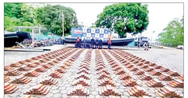
The semi-submersible vessel was intercepted Tuesday on its way to Central America.

This was the highest figure since monitoring began 21 years earlier, and went hand-in-hand with a rise in cocaine production from 1,010 tonnes in 2020 to 1,400 tonnes. — AFP