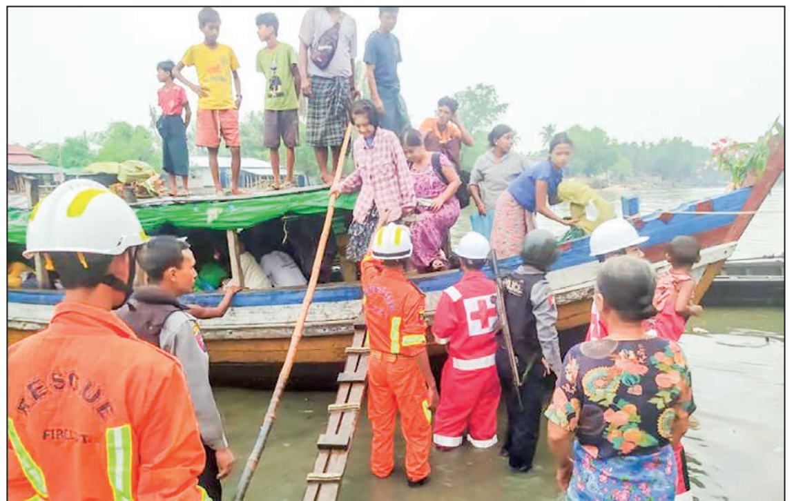
Precautionary measures are underway in Rakhine State, Kachin State, Mandalay Region, Bago Region, and Ayeyawady Region (above, left and below photos).

ing the people to safe places in advance, and saving the rescue items, rations and drinking water in respective regions and states.