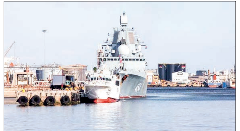
The Russian fleet sent to South Africa for naval exercises was led by the Admiral Gorshkov warship, seen here in Cape Town in February.

The country has strong economic and trade relations with the United States and Europe. Trade with Russia is much smaller, but Pretoria has ties with Moscow dating back decades, to when the Kremlin supported the ruling African National Congress (ANC) party in its struggle against apartheid. The announcement of a probe was welcomed by the United States but met with ridicule and bewilderment at home. — AFP