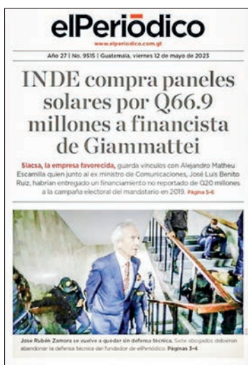
A screenshot showing Guatemalan El Periodico newspaper's online edition of 12 May 2023.

In March, a judge also opened a criminal proceeding