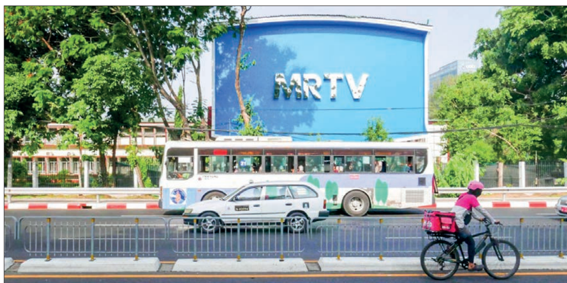
The building of Myanmar Radio and Television in Pyay Road, Yangon.

With the aim of further developing private media businesses, the installation and broadcasting of standard definition (SD) and high definition (HD) television channels on a wider scale through the MRTV DTH Platform (Direct to Home) system will be allowed. It is necessary for those wishing to join the broadcasting business