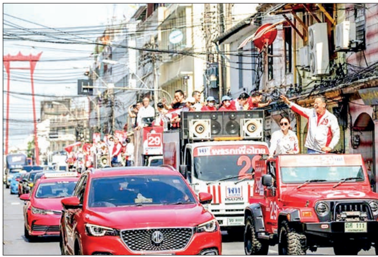
The Pheu Thai party's prime ministerial candidates Paetongtarn Shinawatra (2 nd R) and Srettha Thavisin (R) ride an open-top jeep during campaigning in Bangkok.

But in a country where coups and court rulings have often overturned election results, there are fears the military could seek to cling on -- despite the army chief insisting there would