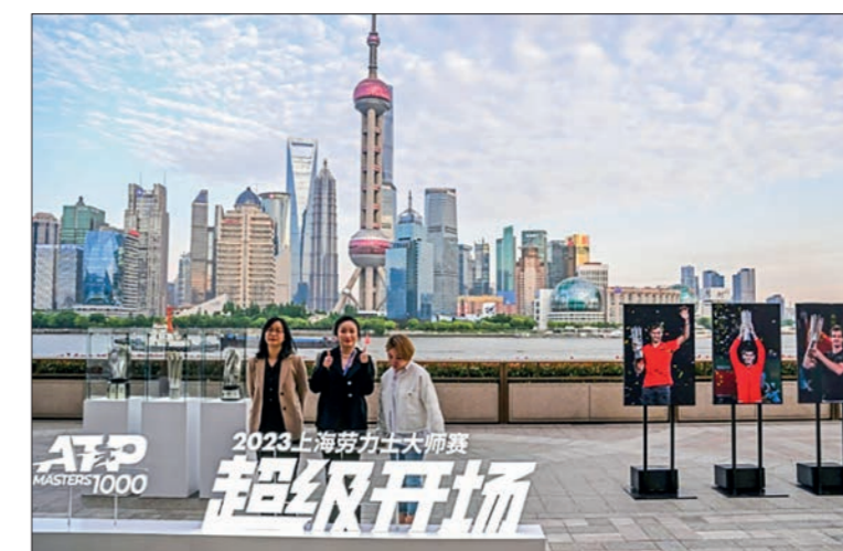
People pose for a picture next to an ATP sign before the Shanghai Masters launch ceremony in Shanghai this week. ment to be held in China after the pandemic and we are hoping that we can play a great game." China will face off against

European champions Denmark, African champions Egypt and Singapore in Group A.