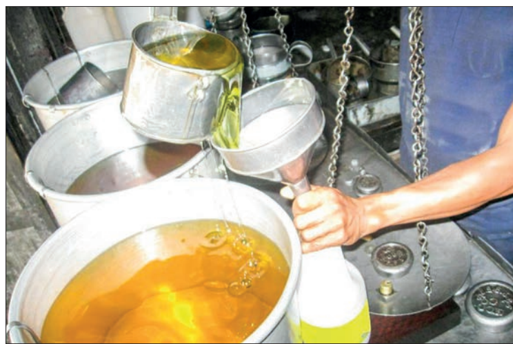
A vendor is pictured siphoning the palm oil into a plastic bottle.

At present, mobile market trucks operated by oil importing companies, in coordination with Myanmar Edible Oil Dealers' Association, were back to busi-