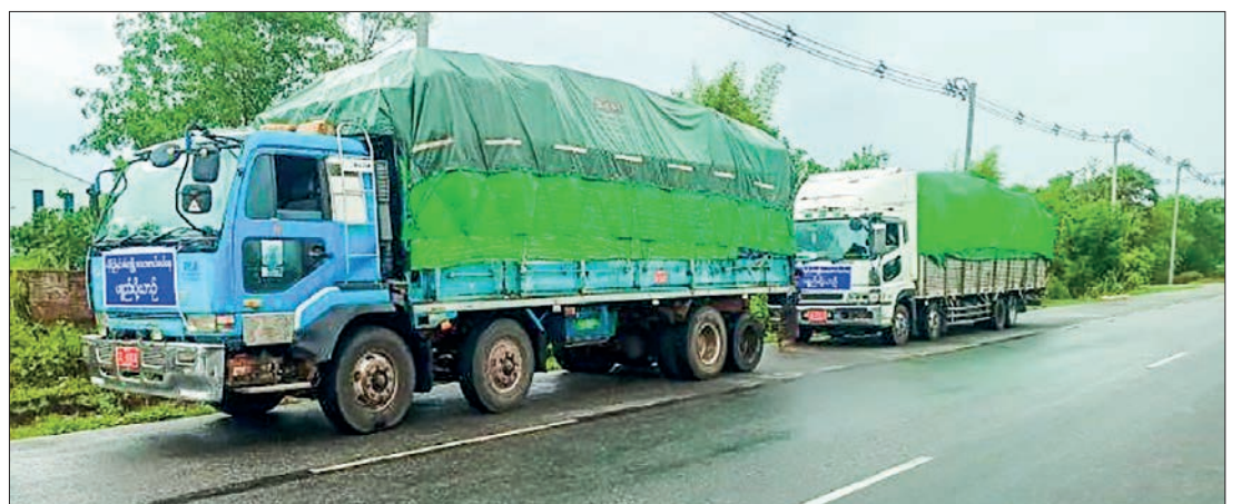
Lorries laden with relief and rehabilitation supplies are seen being delivered to Cyclone Mocha-prone areas.

THE Transport and Communications Working Committee under the National Disaster Management Committee has been sending medicines, medical supplies, foodstuffs, and rescue and rehabilitation equipment to storm-prone areas by aircraft and vehicles since Cyclone Mocha brewed. The Freight Transport Division of Road Transport under the Ministry of Transport and Communications despatched two truckloads of consumer goods and rescue supplies to Sittway in Rakhine State yesterday. — MNA/KZW