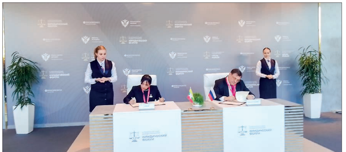
Union Minister for Legal Affairs Union Attorney-General Dr Thida Oo signs MoCs with the Russian Prosecutor-General Office and the Ministry of Justice.

Under the topic of Interaction between Ministries of Justice: New Trends and Approaches, the Union minister said the ministry conducted training sessions for legal officers and their qualifications and skills are recorded in the digital system. Only one country cannot prevent cybercrime, digital crimes and human trafficking but with cooperation with other countries. Therefore, international cooper-