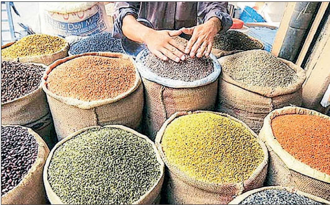
A grocery is seen displaying baskets of various pulses in the Yangon market

THE pigeon pea price surged to K2.52 million per tonne when the black gram price touched the highest of K2.215 million per tonne, reaching an eight-month high in mid-May 2023.