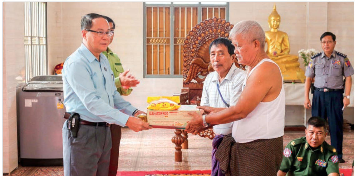
Kayin State Chief Minister U Saw Myint Oo presents foodstuffs and relief items to Kyondo residents.

They then went to Kyondo General Hospital and com-