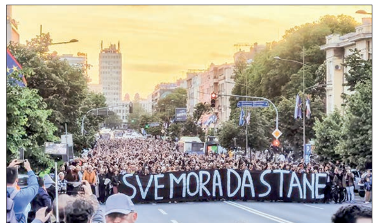
Thousands march during an anti-violent protest after mass shootings killed at least 17 people in Novi Sad, Serbia, 8 May 2023. PHOTO: AFP

"They scheduled their political rallies during national mourning days, with a sole purpose of violence and violent seizure of power," Vucic said in a televised interview. — AFP