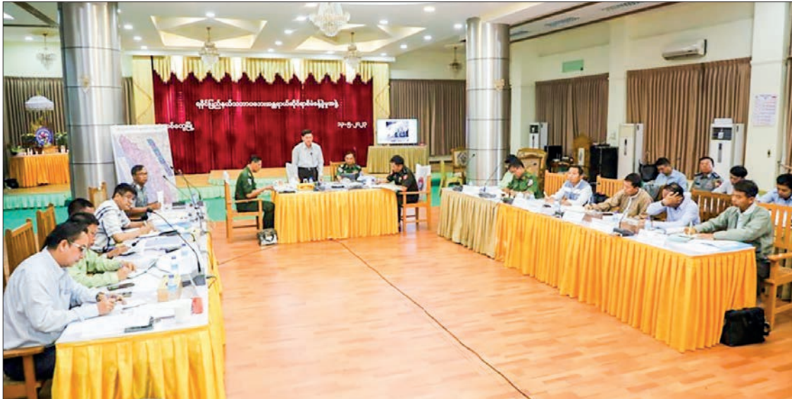
Natural Disaster Management Committee work coordination meeting in progress at the meeting hall of the state government office in Sittway, Rakhine State, on 13 May 2023.

THE low-pressure area that is occurring in the southeast of the Bay of Bengal and the adjacent Andaman Sea is gradually strengthening and may become a cyclone, and according to the forecasts, it may enter the Myanmar side.