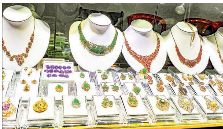
Gold jewellery is seen at one gold outlet in Yangon.

Following the bankruptcy of the US bank, the gold price soared. Despite the gold gain in the global market, Myanmar's forex market sees no movement at all. Consequently, YGEA requested its members not to buy them competitively, tracking the