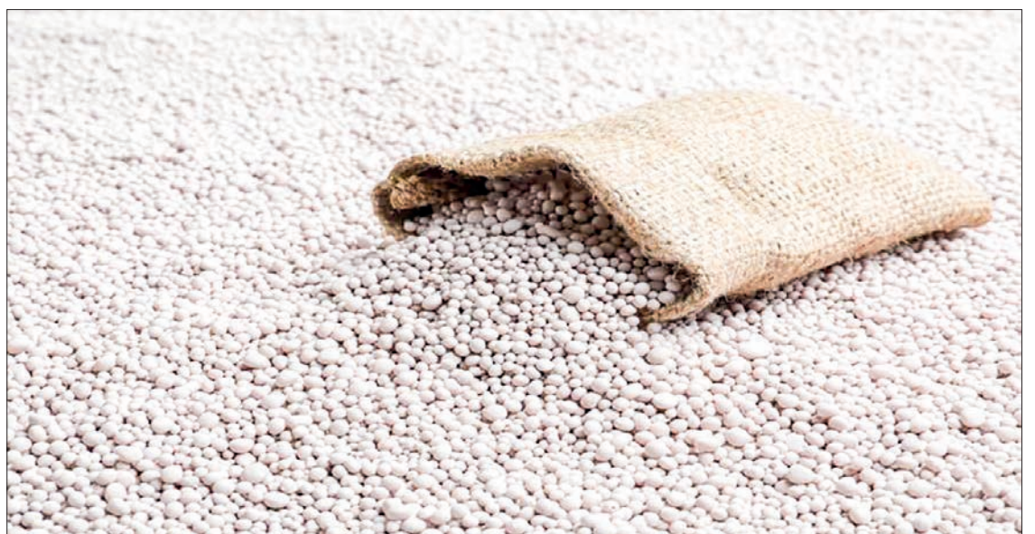
One of the fertilizers farmers are using for high per acre yields.

MYANMAR Fertilizer, Seed and Pesticide Entrepreneurs Association have proposed the initial approval of around 1.2 million tonnes of fertilizer and 38,850 tonnes of pesticide this rainy season, according to the Urea Fertilizer Distribution and Sale Steering Committee.