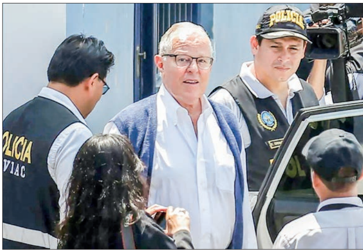
Former Peruvian President Pedro Pablo Kuczynski (2016-2018) is detained by police in Lima on 10 April 2019.

PROSECUTORS in Peru on Friday requested that former president Pedro Pablo Kuczynski be sentenced to 35 years in prison on charges of corruption related to the massive Odebrecht scandal.