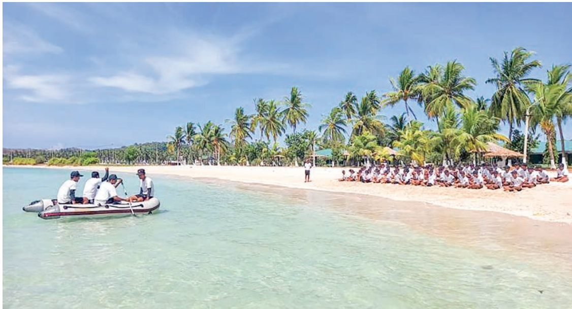
Student trainees are seen being trained for maritime and aviation youth courses 2023 (above and below right photos).

FOR the new generation of youth to develop knowledge, make the most of holidays, and follow their hobbies during the summer vacation, and to turn out the future generation of maritime and aviation experts for the state, basic and ad-