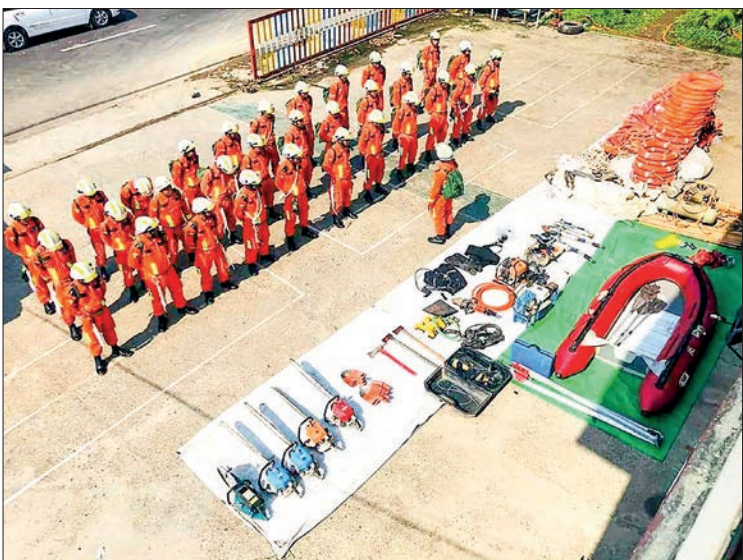
At Sittway Township Fire Brigade.

THE Department of Fire Services under the Ministry of Home Affairs is accelerating its preparedness activities for relief, rescue and first-aid operations in the event of a storm in various states and regions.