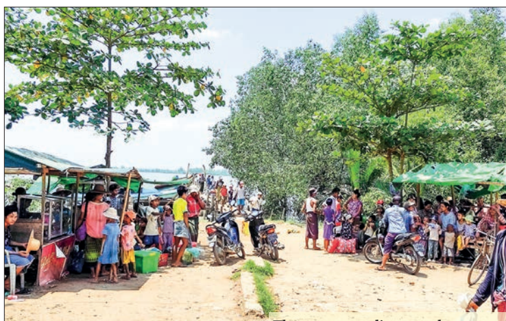
The storm-evading people are seen arriving at the monasteries in Laputta.

According to the forecast of the Department of Meteorology and Hydrology at 5:30 pm MST yesterday, the well-marked low-pressure area over the South-east Bay of Bengal and adjoining South Andaman Sea persist. It is