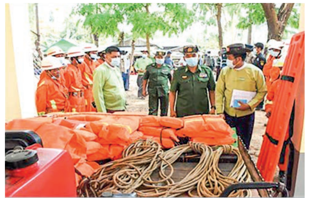
Military officers and responsible officials inspect preparedness measures in Nay Pyi Taw Council Area, Shan State, Yangon Region, Ayeyawady Region and Mandalay Region (top and above photos).