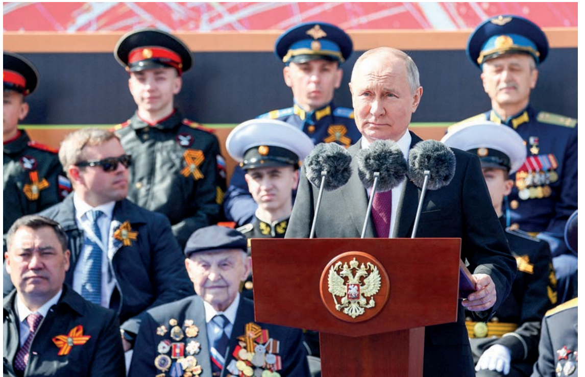
Russian President Vladimir Putin gives a speech during the Victory Day military parade at Red Square in central Moscow on 9 May 2023. Russia celebrates the 78th anniversary of the victory over Nazi Germany during World War II.

"The security of the country rests on you today, the future of our statehood and our people depend on you." Putin also railed against "Western globalist elites", accusing them of sowing conflicts and "coups" around the world.—AFP