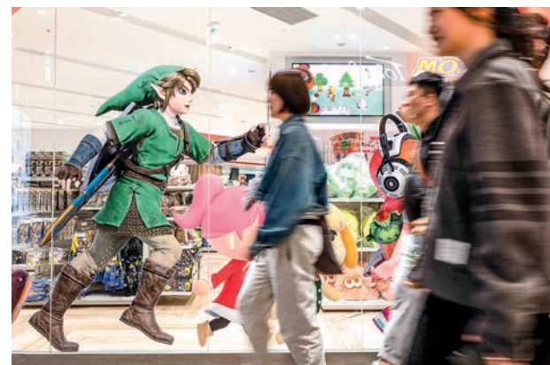
This photo taken on 8 May 2023 shows people walking past an illustration (L) for Japanese gaming giant Nintendo's long-running "Legend of Zelda" game series, in the window of the company's official store in Tokyo's Shibuya district.

Strong software sales were a positive factor, with 35 game titles selling more than a million copies during the year. — AFP