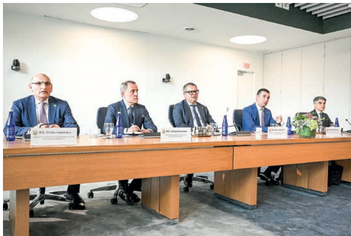
Azerbaijani Foreign Minister Jeyhun Bayramov looks on during the bilateral peace negotiation closing session with US Secretary of State Antony Blinken at the George Shultz National Foreign Affairs Training Centre in Arlington, Virginia, on 4 May 2023.

THE leaders of Armenia and Azerbaijan will hold talks in Brussels on Sunday, the European Union said, amid efforts to reach a peace deal over their three-decade territorial dispute.