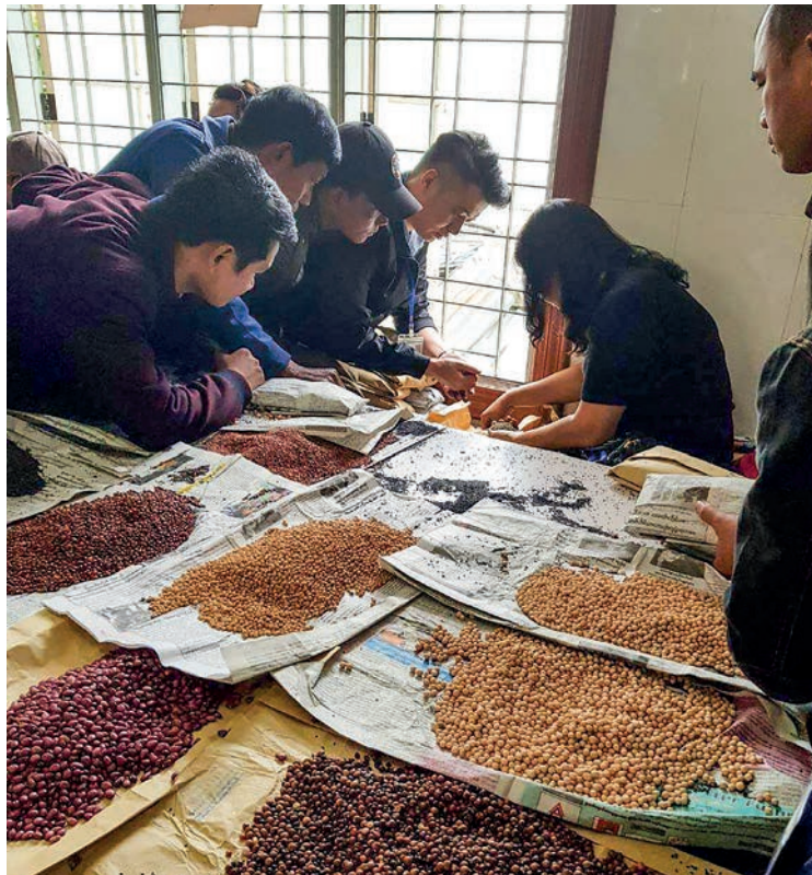
Traders are seen evaluating various beans and pulses in the Mandalay market.

Myanmar yearly produces approximately 400,000 tonnes of black gram and about 50,000 tonnes of pigeon peas. Myanmar is the top producer of the black gram that is primarily demanded by India, while pigeon peas, green grams and chickpeas are cultivated in Australia and African countries besides Myanmar. — NN/EM