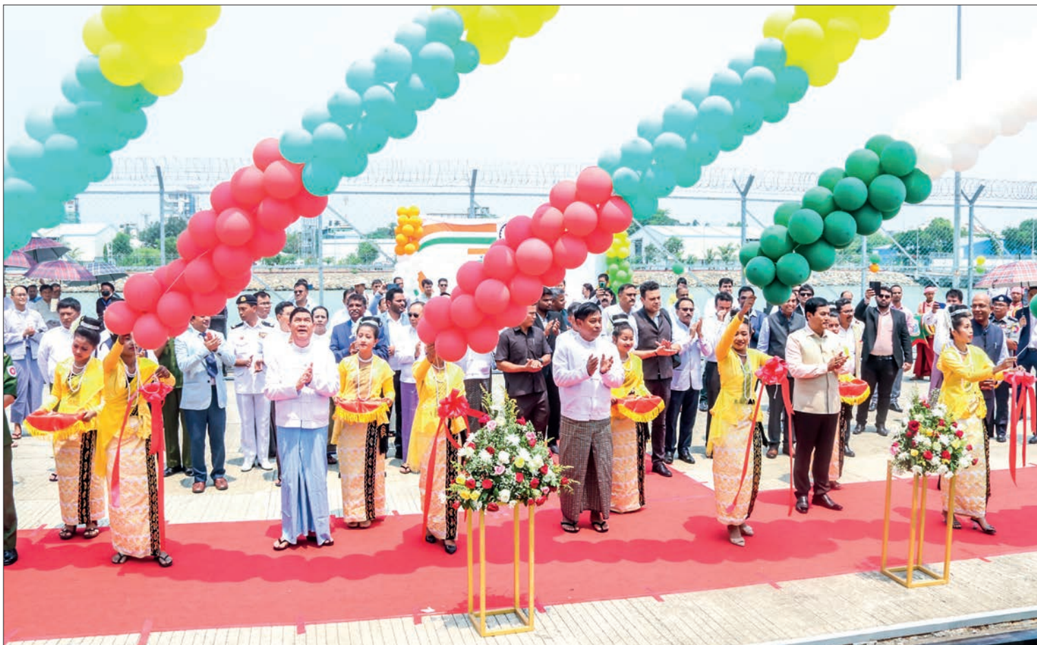
The inauguration ceremony of the Sittway-Kaladan international jetty in progress in Sittway, Rakhine State on 9 May 2023.

THE opening ceremony of the Sittway-Kaladan international jetty under the India-funded Kaladan Multimodal Transit Transport Project was held in