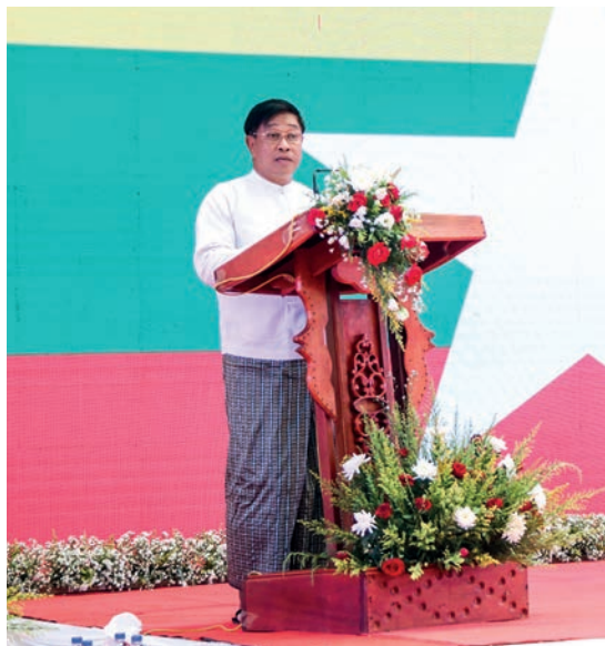
Deputy Prime Minister MoTC Union Minister Admiral Tin Aung San speaks on the inaugural occasion yesterday.

Speaking at the event, the Deputy Prime Minister said the opening of the Sittway-Kaladan international port, part of the India-funded Kaladan Multimodal Transit Transport Project, is an achievement that brings benefits not only to India but also to Rakhine and Chin states. As it is a multimodal transport system by linking the sea route, inland waterways and roads, the flow of transport and goods between Rakhine and Chin states will be better and it can develop the socioeconomic status of residents. It will create more job opportunities. It is thankful for the efforts