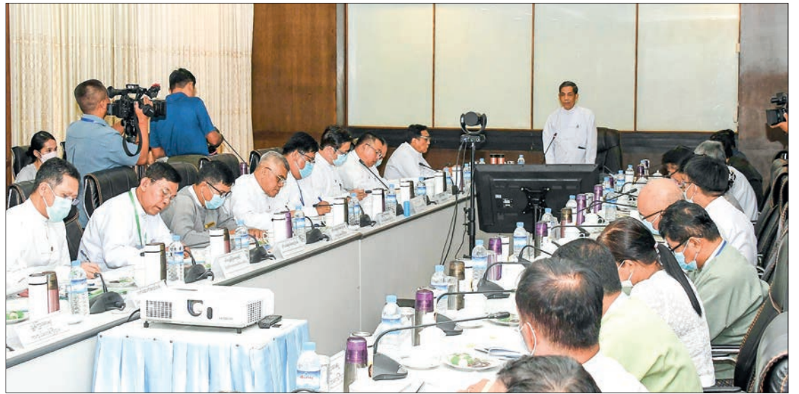
Union Minister U Ko Ko Hlaing chairs the meeting 1/2023 of the Working Committee on International Relations in Nay Pyi Taw yesterday.

the Working Committee deliberated on the smooth facilitation of flight clearance and