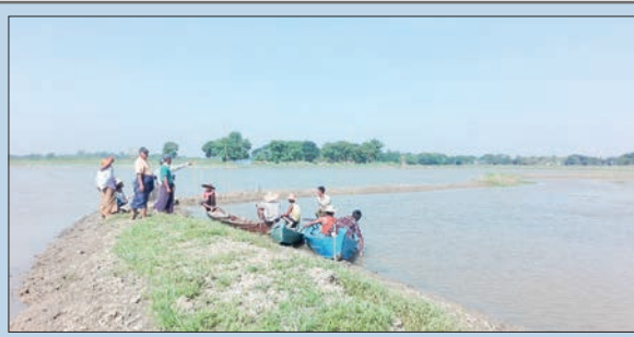
Fish farms in Wakema Township, Ayeyawady Region.