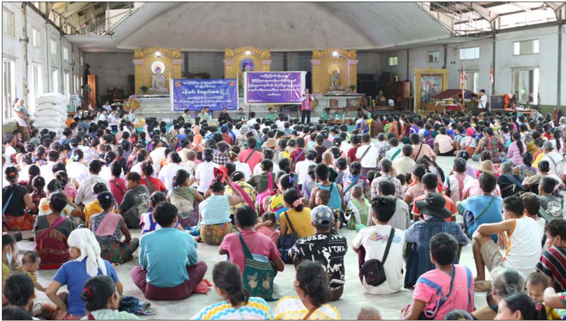
The provision ceremony of foodstuffs and school supplies in progress (above) and Kayin State Chief Minister U Saw Myint Oo presents the aid (right below).

KAYIN State Chief Minister U Saw Myint Oo, accompanied by the South-East Command commander and deputy commander, state cabinet members and local military officers, provided foodstuffs and school supplies to temporarily displaced people in Hlaingbwe Township of Hpa-an District and Myinegyingu Special Region in Kayin State on 8 May.