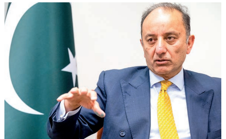
Pakistani Petroleum Minister Musadik Malik speaks during an interview with AFP at the Embassy of Pakistan in Washington DC on 8 May 2023.

Malik confirmed that a first order was placed for Russian oil and would arrive within a month in Pakistan, which will then assess how much to import in the future. "Based upon the