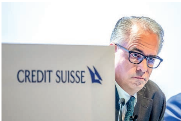
(FILES) Credit Suisse CEO Ulrich Komer looks on during the annual general meeting of Credit Suisse bank in Zurich on 4 April 2023, following the takeover by UBS of Credit Suisse hastily arranged by the Swiss government on 19 March to prevent a financial meltdown.

Still, while a much-anticipated Federal Reserve survey of banks showed