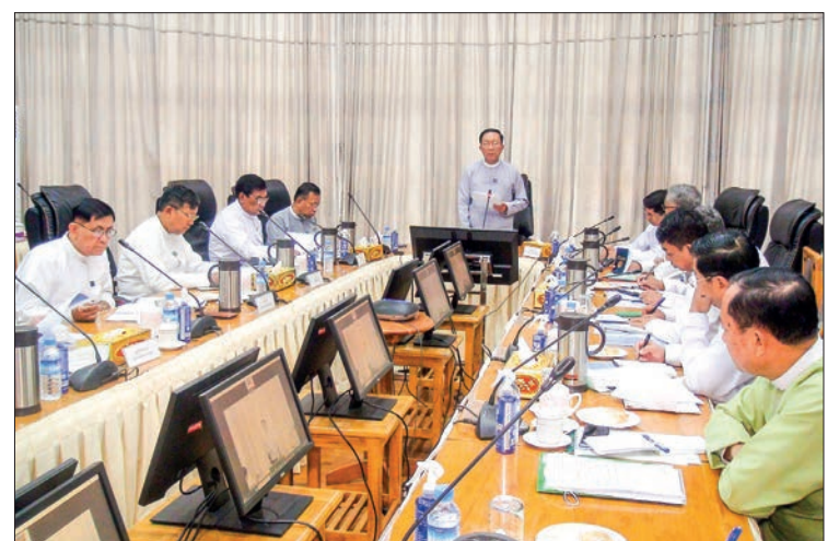
Deputy Prime Minister U Win Shein chairs the coordination meeting on tax collection yesterday.

Then, the Union ministers, the deputy ministers and the heads of relevant departments discussed the issues of collecting taxes to meet the targets and effective spending of expenditure. — MNA//MKKS