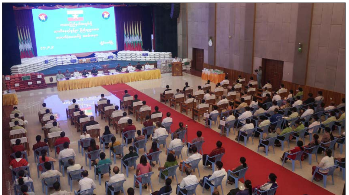
The ceremony to provide foodstuffs and school supplies to temporarily displaced persons in progress yesterday in Kayah State.

THE Kayah State government provided foodstuffs and school supplies to temporarily displaced people in Kayah State at a ceremony held at the State Hall in Loikaw Township yesterday.