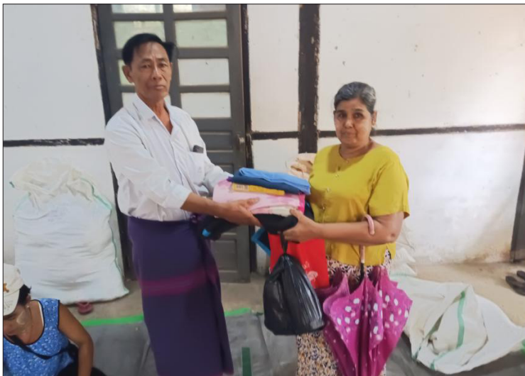
One temporarily displaced person receives the provision of basic items.

Essential supplies such as mosquito nets, blankets, bars of soap and nether garments for men and women were delivered to 778 households, according to the No 2 ward administrator U Aung Win Tun. — Kamamaung IPRD/KZW