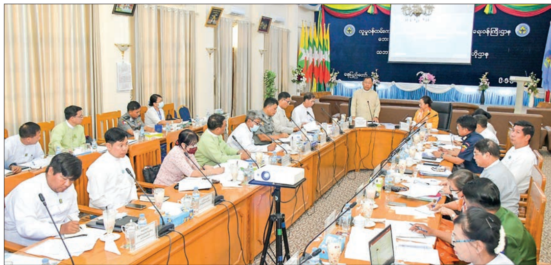
The work process meeting of the Disaster Management Centre in progress at the Ministry of Social Welfare, Relief and Resettlement in Nay Pyi Taw yesterday.

Then, NDMC Vice-Chair 2 Union Minister Dr Thet Thet Khine talked about the opening