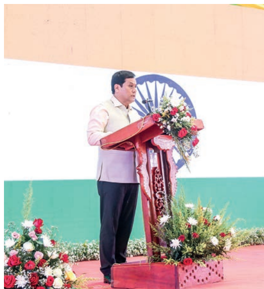
Indian Union Minister for Ports, Shipping and Waterways Mr Shri Sarbananda Sonowal speaks on the inauguration event yesterday.

The Deputy Prime Minister and party then inspected the digging sandbank for 1,262 metres long waterway of Sateyoekya Creek conducted by the Rakhine State budget in 2022-2023 and 2023-2024FYs, nine wells in the Sittway agricultural farm and well-digging processes at Sittway General Hospital. — MNA/KTZH