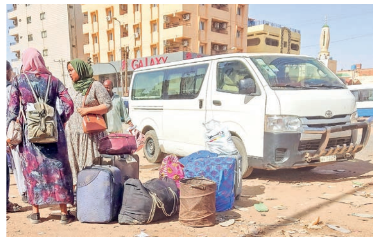
People wait with their luggage at a bus stop in southern Khartoum on 8 May 2023 as fighting continues between Sudan's army and the paramilitary forces. As Sudan's warring generals have repeatedly failed to honour multiple agreed ceasefires, experts warn of protracted fighting, despite both sides preparing to meet in Saudi Arabia for direct talks.

fled the country since the beginning of the conflict, according to numbers released by the UN refugee agency on Monday. — AFP