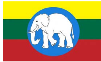
The Flag of the Myanmar People's Democratic Party (MPD)

Therefore, those who want to object to the mentioned party flag and emblem that will be changed by the Myanmar People's Democratic Party (MPD) can object to the Union Election Commission with valid evidence within seven days from the date of this announcement. It is announced to the public under Rule 14 (d) of the Registration of Political Parties.