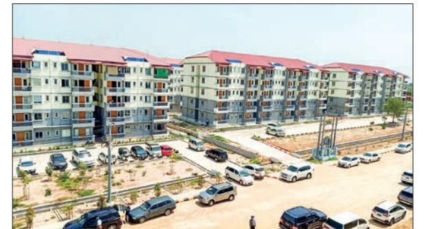
Apartments in Thukha Waddy Public Rental Housing in Dekkhinathiri Township, Nay Pyi Taw Union Territory.

Likewise, applications can also be made for apartments in Mingala Yankin Public Rental Housing, Mandalay Region, the MoC announced. — TWA/CT