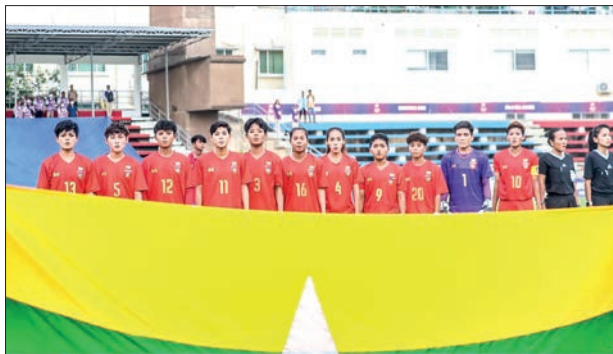
The Myanmar Women's Football Team is seen before the SEA Games Group A match against Malaysia on 9 March.