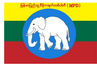
The emblem of the Myanmar People's Democratic Party (MPD)