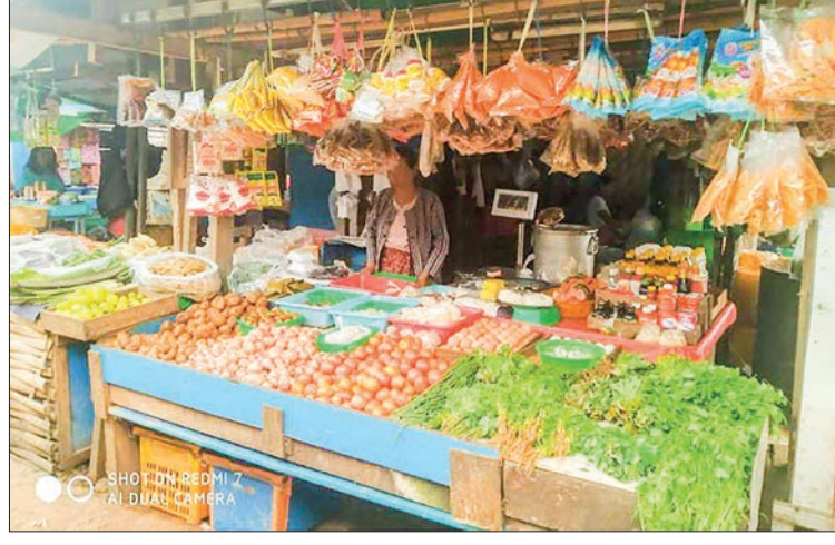
The photo shows a retail shop of dry groceries.

onions were supplied to the Myingyan market and the price touched a high of K1,800 per viss, according to the market data.