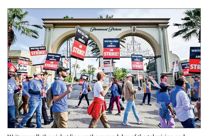
Writers walk the picket line on the second day of the television and movie writers' strike outside of Paramount Studios in Los Angeles, California on 3 May 2023.

that mistreats the source of its stories, are fed up with seeing their profession become more