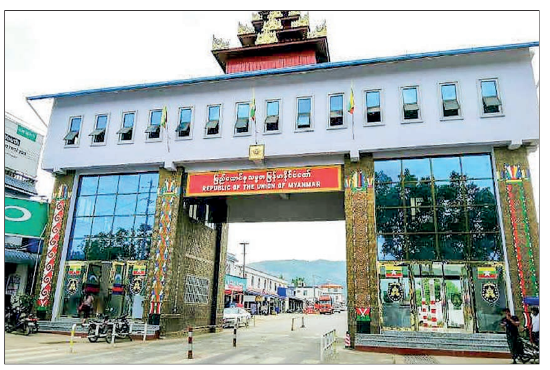
The Lweje border trade post.