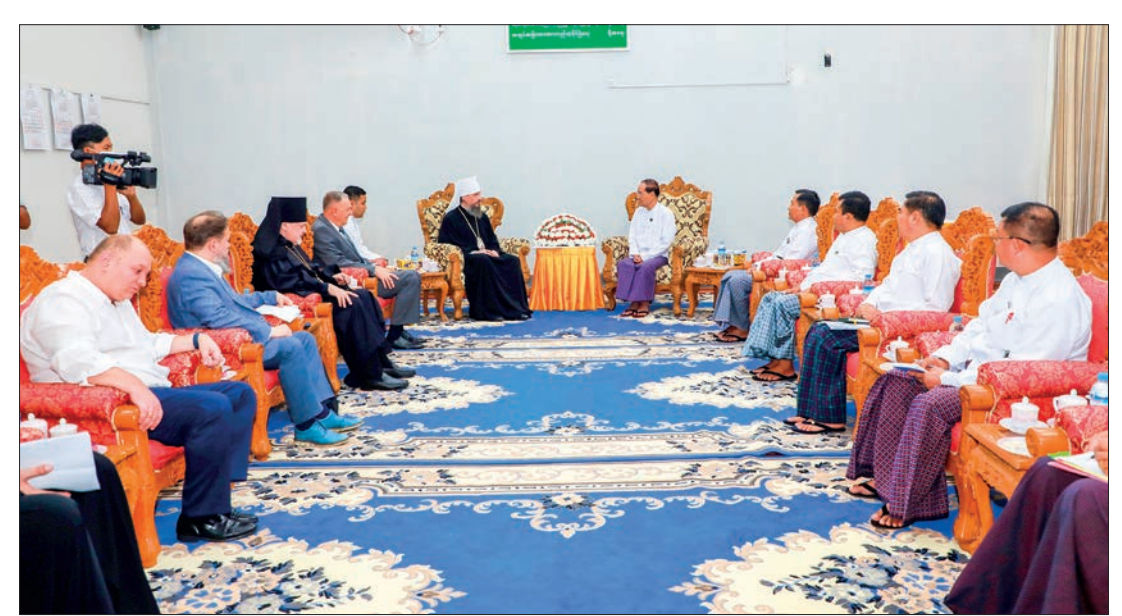
Union Minister U Ko Ko receives Russian Orthodox Archbishop Sergiy yesterday in Nay Pyi Taw.

UNION Minister for Religious Affairs and Culture U Ko Ko met a delegation led by His Eminence Sergiy, Russian Orthodox Archbishop for Metropolitan of Singapore and South-East Asia, yesterday afternoon in Nay Pyi Taw.