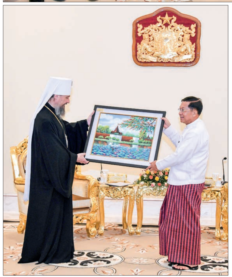
The Senior General poses for the documentary group photo (top) and presents the gift to the Archbishop (above) at the event yesterday.