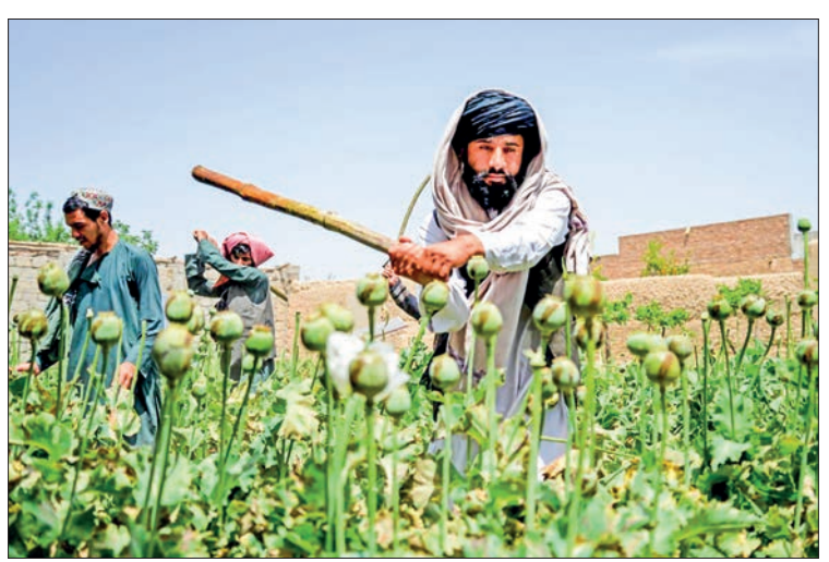
A Taliban security force member slashes at a field of poppies, used in the production of heroin, which have been banned by the government.

In Hazrato's spartan home with tarpaulin sheet windows in Sher Surkh village of Kandahar province, Afghanistan's dilemma plays out in brief as an illicit-yet-vital source of revenue is extinguished in the midst of a humanitarian crisis. — AFP