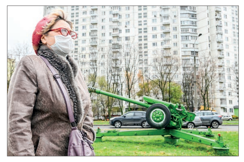
The Russia-Ukraine conflict highlights weaknesses in the world's global health network.

RUSSIA'S offensive in Ukraine has aggravated a long-simmering demographic crisis that President Vladimir Putin has struggled to tackle, which could further damage its sanctions-hit economy.