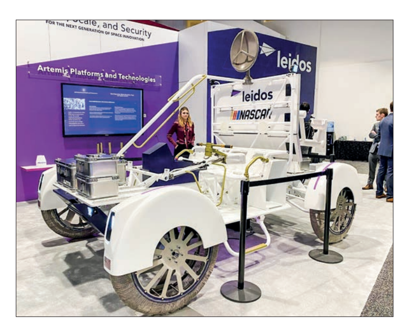
A prototype of a Moon rover developed by Leidos and Nascar is revealed at the Space Symposium in Colorado Springs.

Despite this distant timeline, companies are already chomping at the bit. — AFP