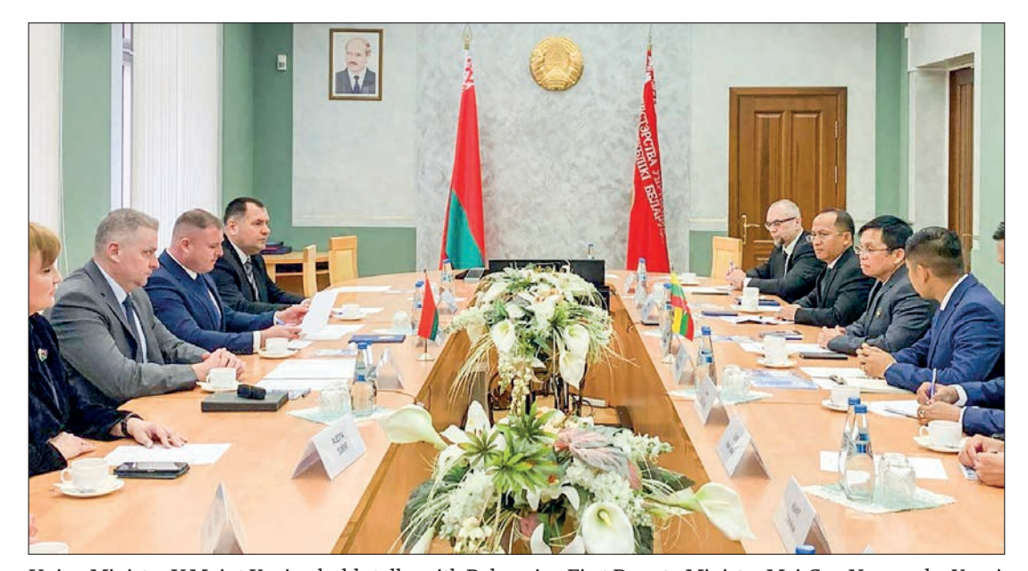
Union Minister U Myint Kyaing holds talks with Belarusian First Deputy Minister Maj-Gen Nazarenko Yuryi Genadievich of Internal Affairs in Minsk on 3 May.

AT the invitation of the Minister of Internal Affairs of the Republic of Belarus, Lt-Gen Ivan Kubrakob, Union Minister for Immigration and Population U Myint Kyaing made a tour to Minsk of Belarus.