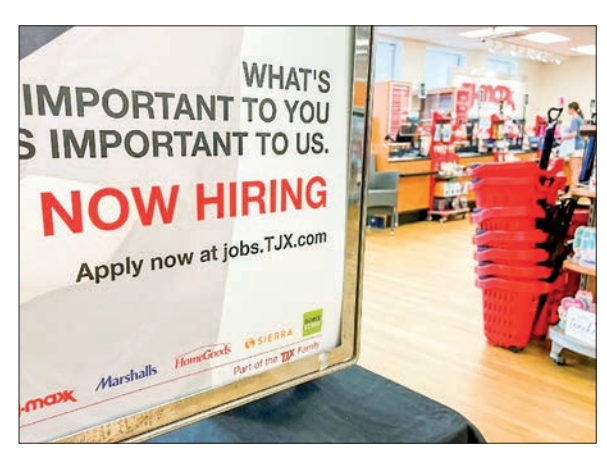
US private hiring picked up unexpectedly in April, according to payroll firm ADP.

Meanwhile, small and medium establishments added more jobs than large ones. — AFP