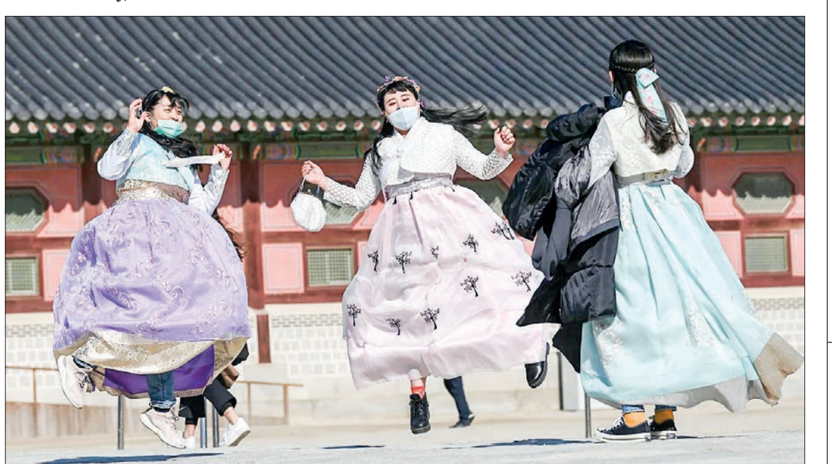
People in traditional Korean hanbok wear face masks as they jump for a souvenir picture at Gyeongbokgung Palace in Seoul on 3 February 2020. PHOTO: REPRESENTATIVE IMAGE/ JUNG YEON-JE/AFP /FILE

be greater if we fail to build on ence and public health." Tedros SOURCE: AFP