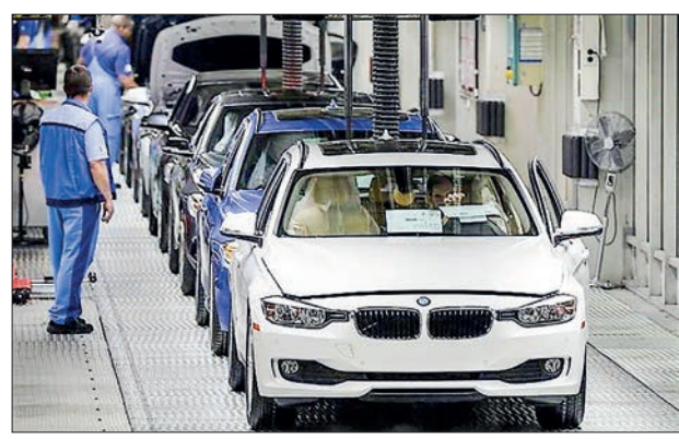
German automaker BMW reported Thursday a sharp drop in first-quarter profits due to an accounting effect, while sales also slipped in Europe and China.

In Europe, "the environment was characterised by persistent inflation and high interest rates," BMW said. In Asia meanwhile, the "after-effects of