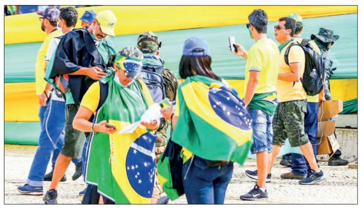
Protesters outside Brazil's Congress in January after rioters vandalized government offices. Many of the attackers had repeated falsehoods spread in far-right chat groups. PHOTO: MARCELO CAMARGO/XINHUA

Addressing the same conference, consumer protection secretary Wadih Damous announced a series of measures against what he called Google's "deceitful and abusive propaganda". — AFP