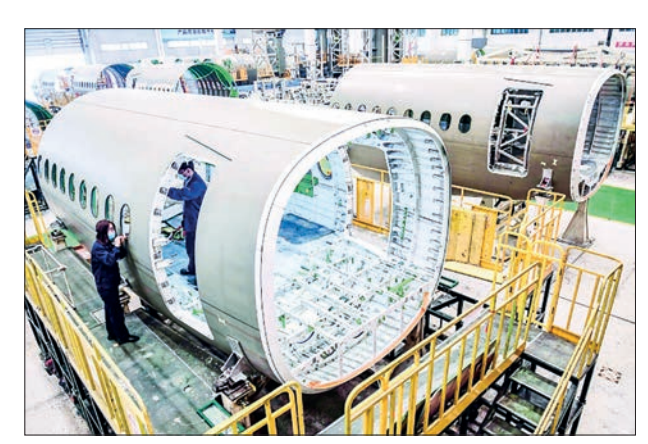
Employees working on the fuselage of Airbus A220 aircraft at a factory in Shenyang, China.

customers continue to express a strong appetite for our products as highlighted by some of our recent commercial announcements such as Air India."