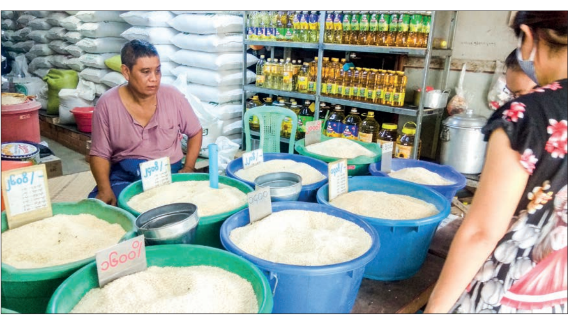
In early May, the prices of Pawsan rice were still high at K85,000-105,000 per bag. The prices of various rice varieties were up by K1,000-13,000 per bag within a few days. Shoppers are pictured buying rice from the rice retail outtel in Yangon.

Starting from 3 August 2022, Myanmar Rice Federation, Myanmar Rice Producers and Plant-