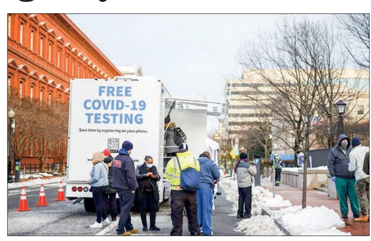
People line up for COVID-19 testing in Washington, DC, the United States, 5 January 2022.

Since January 2021, COV-ID-19 deaths in the country have declined by 95 per cent, and hospitalizations are down nearly 91 per cent, according to the White House. — Xinhua