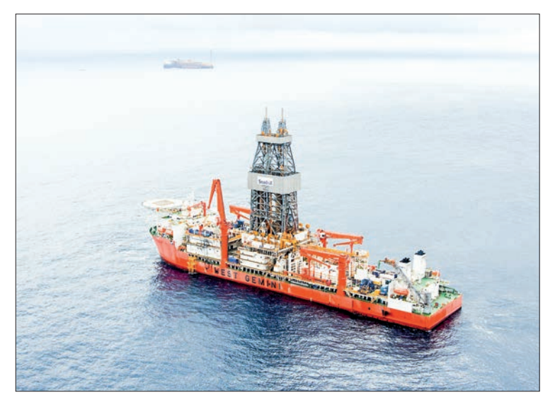
French firm TotalEnergies has signed a contract to begin drilling and exploring for gas this year in waters off crisis-hit Lebanon.

"Just as food and cars are not released into the market without proper assurance of safety, so too AI systems should provide assurance to the public, government, and businesses that they are fit for purpose," the Commerce Department said in a statement at the time. — AFP