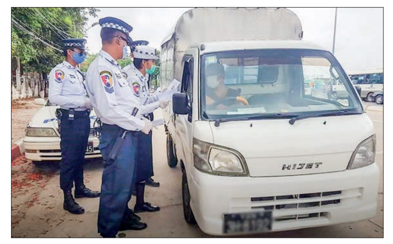
Traffic police members check the vehicles in Yangon.

the second week of May, the owners will be fined K5,000 and if they are found out in the third week, wheel tax cards will be confiscated. Will new wheel tax cards be issued only when the vehicles have been installed with new number plates. — TWA/MKKS