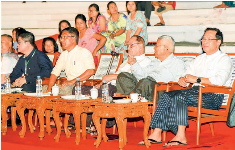
Rehearsals for the Myanmar Film Academy Award Event in progress, watched by Union Minister U Maung Maung Ohn in Nay Pyi Taw yesterday.

UNION Minister for Information U Maung Maung Ohn inspected the rehearsals of the Myanmar Film Academy Award ceremony yesterday evening.