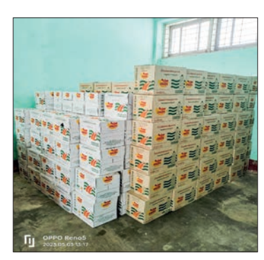
Confiscated illegal commodities.

Similarly, a combined on-duty team nabbed four kinds of palm oil, including 960 litres of high-quality palm oil (Thaimade Two-Shrimp brand),