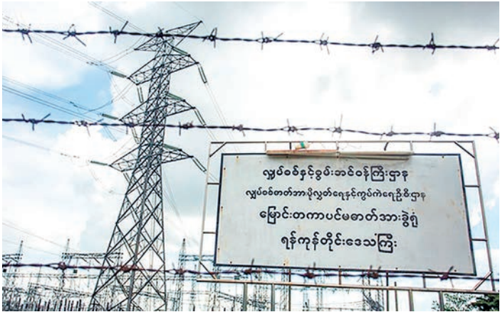
The Myaungtaga main station.

THE Yangon Electric Power Corporation has announced power outages will occur in some townships from 28 to 30 April for maintenance work of the 230-kV Myaungtaga main station.