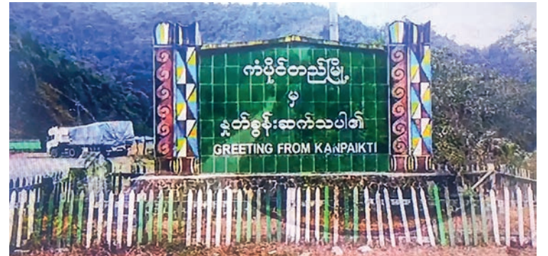
The photo shows the Kampaiti sign where the Kampaiti (Kanpaikti) border post is located.

The border post witnessed an outflow of 2,685 trucks of tissue-cultured bananas, three trucks of fresh chilli pepper, nine trucks of pumpkins, 94 trucks of water-