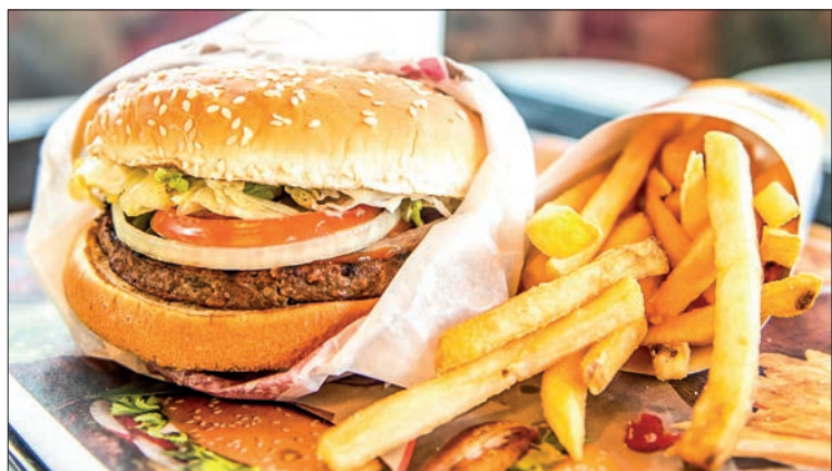
Western diet is characterized by high fat and refined sugar, low fibre content and containing a large proportion of processed food.

ACCORDING to a study by UC Davis Health researchers, inflammatory skin conditions like