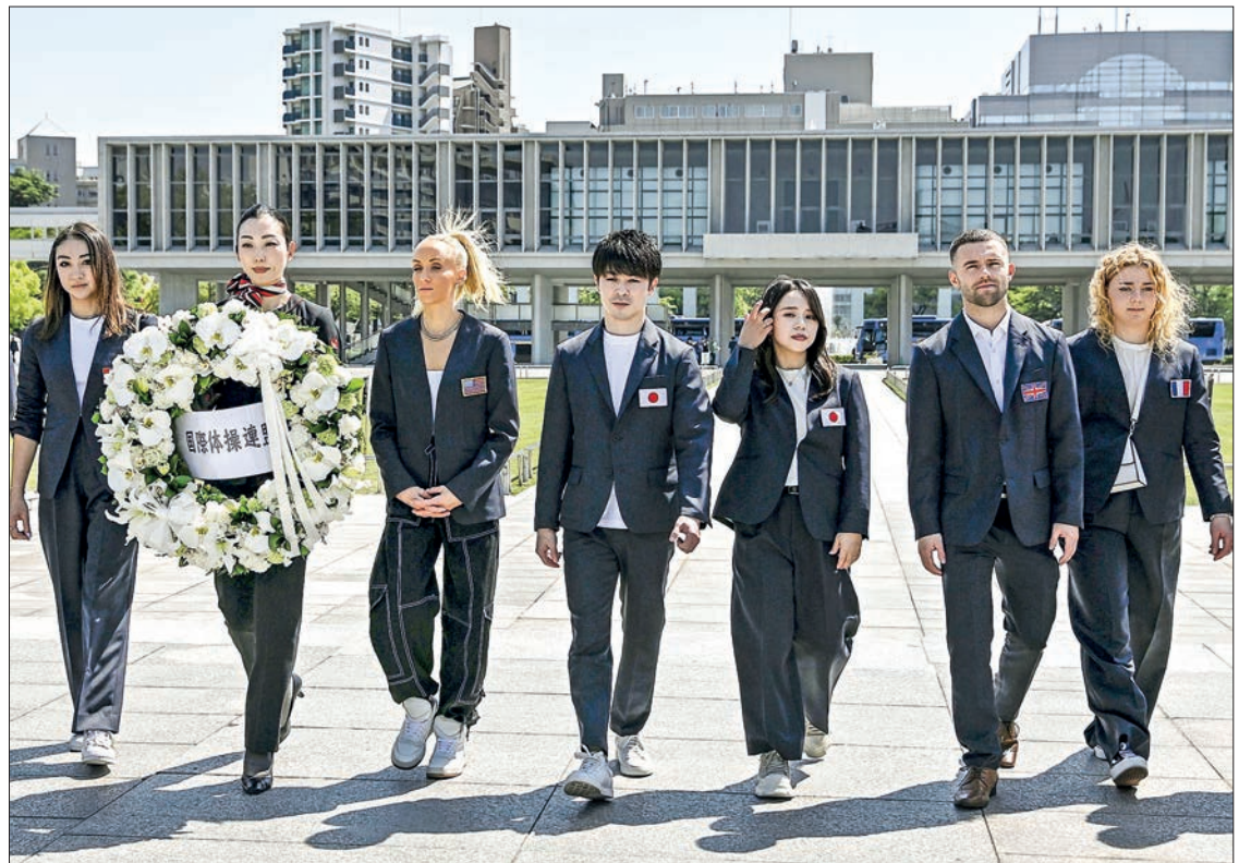
Current and former gymnasts from the Group of Seven nations, led by Japan's two-time Olympic men's gymnastics all-around champion Kohei Uchimura (C), visit the Hiroshima Peace Memorial Park on 28 April 2023.

"I hope this will be an opportunity for people to also turn their attention to Nagasaki, which was also hit by an atomic bomb," said Uchimura, who won all-around gold at the 2012 and 2016 Olympics.—Kyodo