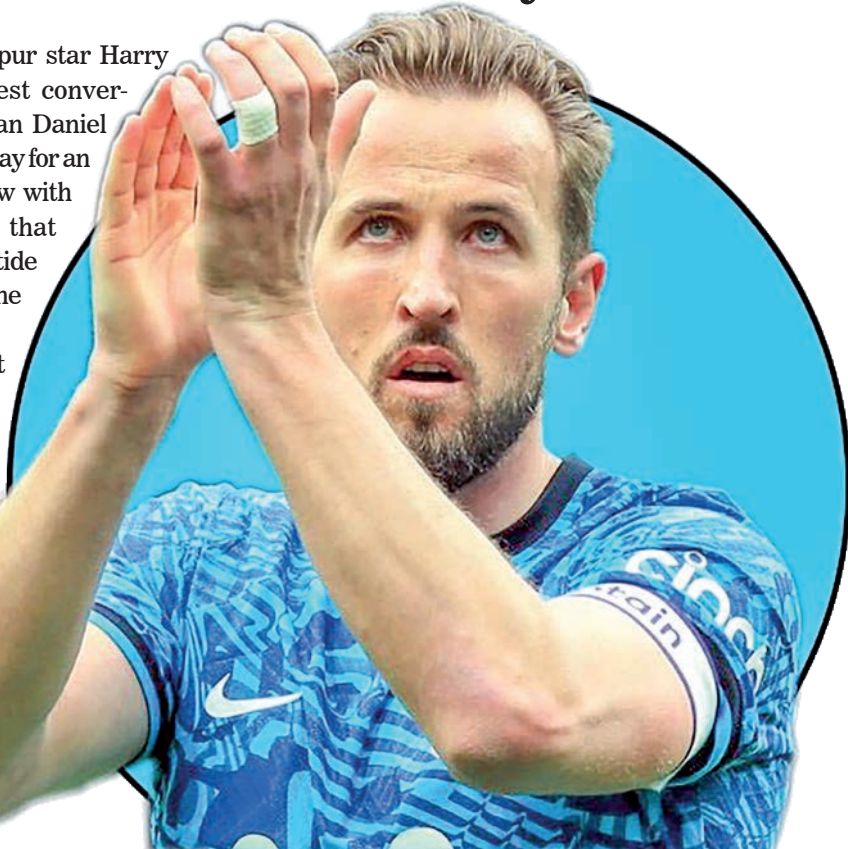
Tottenham Hotspur's poor run of results has raised fresh questions over the future of Harry Kane.

An open revolt by Spurs fans intensified following last weekend's humiliating 6-1 loss away to Newcastle, with the hosts scoring five times the open minutes of feat that inter-head coach Cristian Stellini his job. —AFP