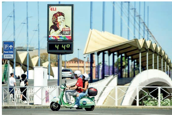
The number of days with summer temperatures in Spain has increased from 90 to 145 between 1971 and 2022, according to a study by the Polytechnic University of Catalonia.

On Thursday, the mercury rose above 34 degrees Celsius (93 degrees Fahrenheit) in most of the southern Andalusia region, hitting 38.7C in Cordoba, it said. Scorching temperatures have prompted warnings about the high risk of wildfires. Spain has already seen fire ravage 54,000 hectares (133,400 acres) of land so far this year, compared with 17,000 hectares in the same period last year. —AFP