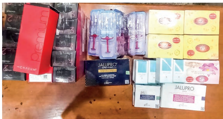
Seized illegal goods.