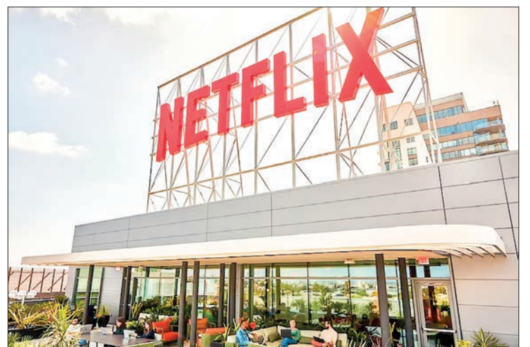
Netflix is a subscription-based streaming service that allows the members to watch TV shows and movies on an internet-connected device.

try said in a statement. The new measure received Royal Assent in the evening, the last step required to be enacted.—AFP