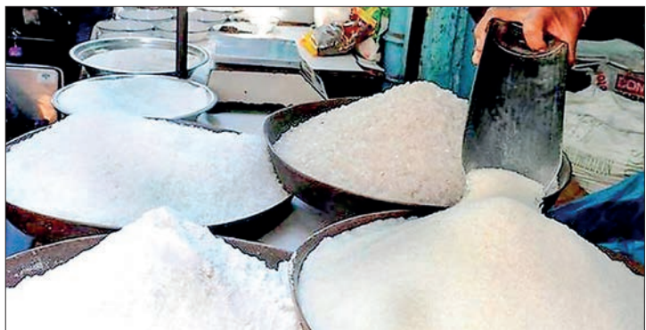
The photo shows a retail shop of sugar.

THE price of sugar climbed up to K3,110-K3,130 per viss in April 2023 at the end of sugar mill operations.