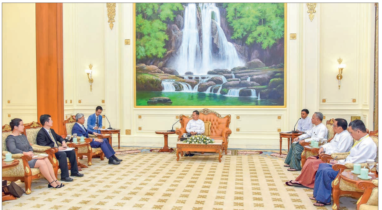
State Administration Council Vice-Chair Deputy Prime Minister Vice-Senior General Soe Win receives Mr Chen Hai, Ambassador of China to Myanmar in Nay Pyi Taw on 28 April 2023.

At the meeting, they openly discussed measures on Kyaukpadaung Special Economic Zone, exchange of information on border affairs to ensure peace and stability in border regions, acceleration in eradicating narcotic drugs, gambling, online gaming and trafficking in person, and enhancement of cooperation in all sectors between the two countries. After the meeting, the Vice-Senior General and the Chinese Ambassador exchanged commemorative gifts and had documentary photos taken together with those attendees.