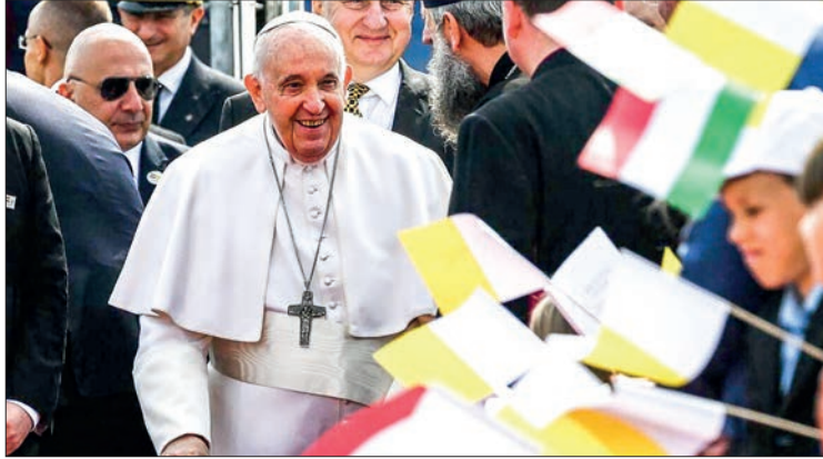
Pope Francis landed in the Hungarian capital of Budapest on Friday morning, where he is due to meet nationalist Prime Minister Viktor Orban during his three-day visit.

POPE Francis arrived in Hungary Friday for a three-day visit likely to be dominated by the war in Ukraine and his meeting with nationalist Prime Minister Viktor Orban, whose views often clash with his own.