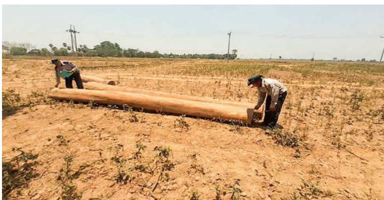
Officials check confiscated illegal teak.

THE Customs on-duty team confiscated 200 submersible pumps worth K6.3 million that exceeded the Import Declaration (ID) from a container at the Asia World Port container checkpoint on 26 April. The action was taken under Customs procedures.