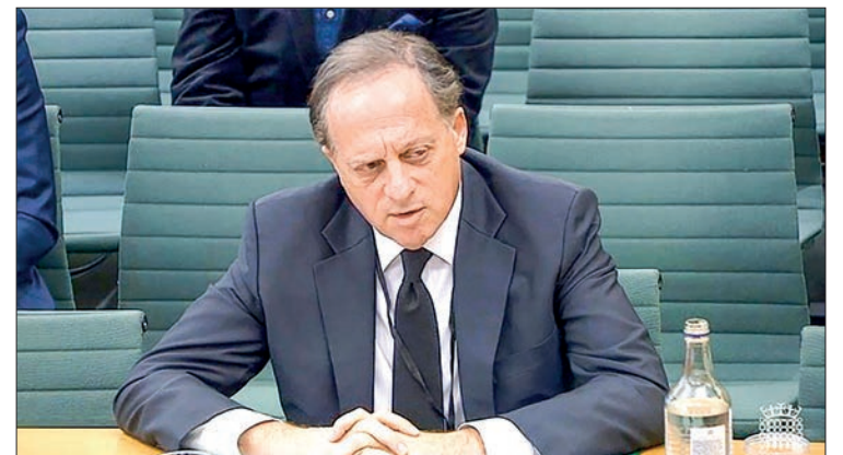
Richard Sharp was found to have failed to declare a potential conflict of interest when he was appointed BBC chairman.

The chairman of the British Broadcasting Corporation is appointed by the UK monarch on the advice of the government.