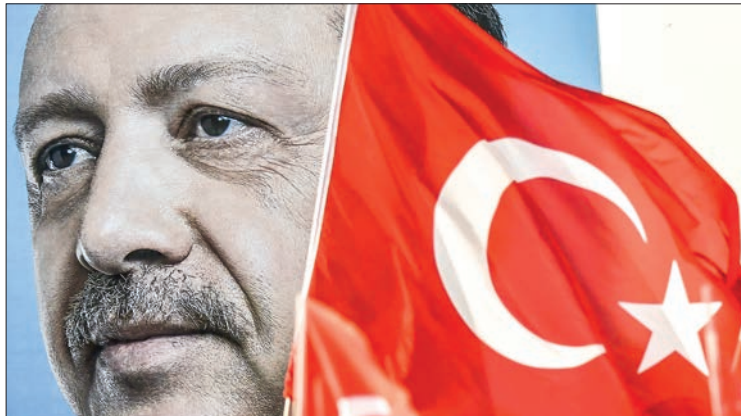
Turkish flags next to a portrait of Turkish President Recep Tayyip Erdogan as he gives a speech during a pre-election rally in Istanbul on 17 June 2018.

The dominant 69-year-old leader has laid low since getting sick while conducting a live television interview on Tuesday evening. Erdogan had been campaigning tirelessly to pull out one