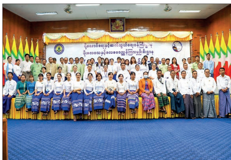
The documentary group photo of the 30 th Monsoon Forum.