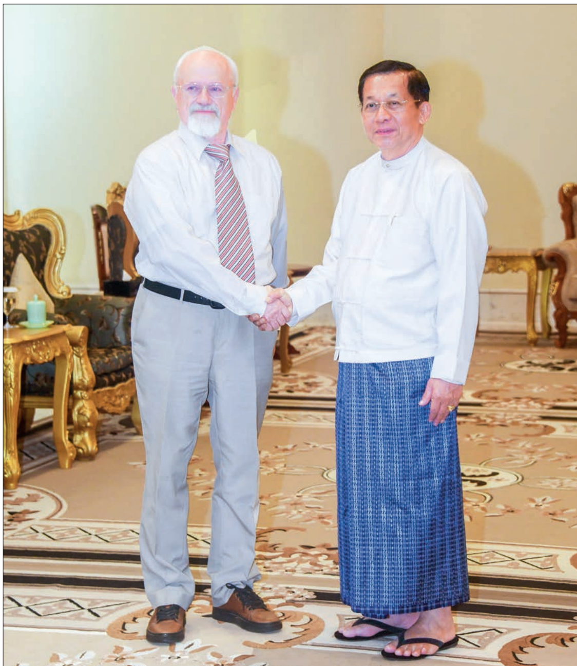
State Administration Council Chair Prime Minister Senior General Min Aung Hlaing offers a handshake with the RMAFC Senior Vice-President yesterday.

After the ceremony, the Senior General and the Senior Vice-President of the association exchanged gifts and had documentary photos taken.