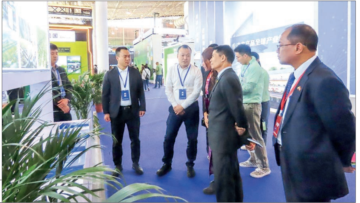
Union Minister U Min Naung pays observation tours at the fair in Shandong Province on 26-27 April.

The Myanmar delegation also joined the 24 th China International Vegetable Sci-Tech Fair in Shouguang on 27 April. During the tour, the Union minister and party observed over 7,000 varieties of vegetables exhibited at the fair, online sales of quality vegetables and Yanjiabu Folk Cultural Village in Shandong Province. — MNA/KTZH