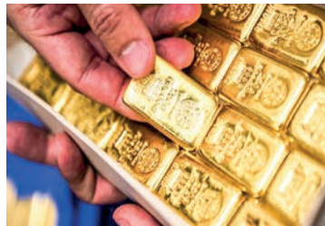
Gold bars are seen in the gold market.

Moreover, the Central Bank of Myanmar will inspect those manipulators to interfere with market stability through digital platforms, according to the notification dated 20 March.