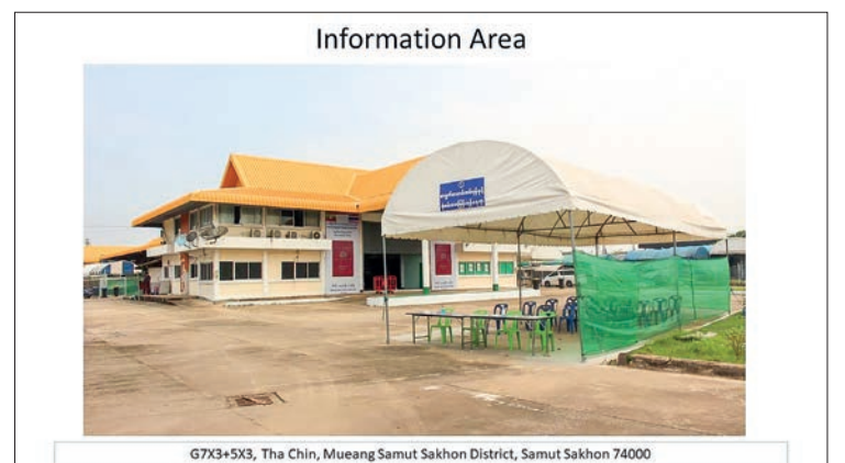
The branch of the Mahachai Temporary Data Collection Centre.

Although representatives from factories, workshops, and construction companies came to take out the cards at the TDCC branch, individual applicants (appointments and walk-ins) rarely stopped by the branch. Therefore, it is declared that deposited OWICs must be taken out by 19 May, and inquiries can be made to the TDCC branch at 081 4590914 and 082 4451648 for further information. — TWA/CT