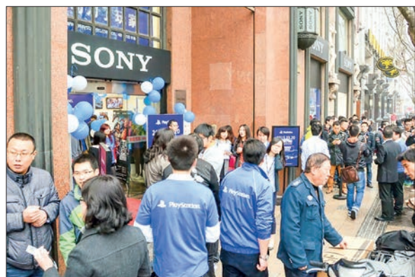
The revenue figure was the largest ever for the Japanese conglomerate, beating the last financial year's record of 9.9 trillion yen ($73 billion).

For the current financial year, which began in April, Sony predicts a lower net profit of 840 billion yen, partly for technical reasons related to tax expenses. — AFP