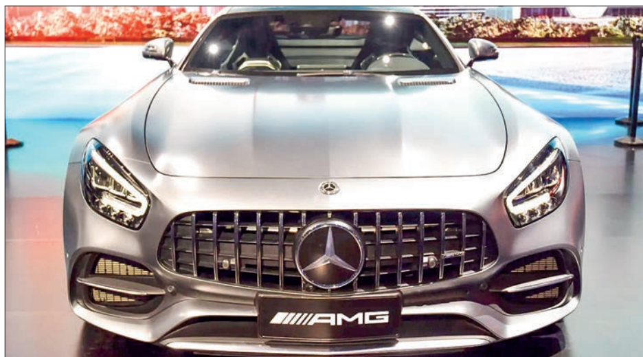
The German automaker said its revenues were up eight per cent compared to the same period last year, reaching 37.5 billion euros, despite supply chain disruptions.

Its vans division also reported a jump of 25 per cent in revenues. "Our focus on top-end cars and