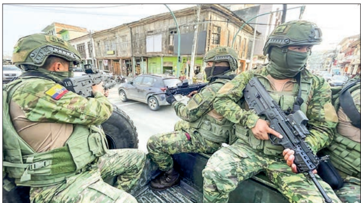
Ecuadoran soldiers patrol the streets of the port city of Esmeraldas, on the border with Colombia, on 21 April 2023.

Clashes between inmates have left more than 420 prisoners dead since 2021, while outside penitentiaries, the murder rate has doubled, official figures show. Bravo, a retired army general who assumed his security post on Wednesday, said after the council meeting that the state is ready "to declare that the terrorist threat is going to be confronted in a firm way". —AFP