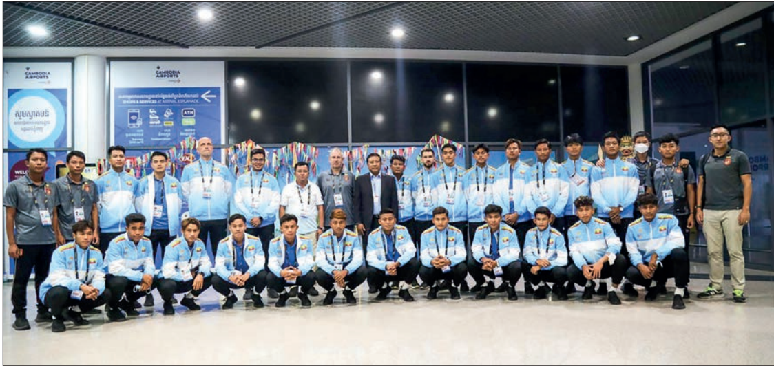
The Myanmar U-22 men's football team pose for the group photo with the coaching staff at Phnom Penh International Airport on 27 April 2023.