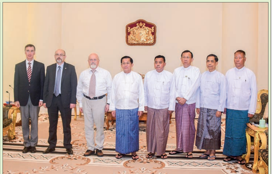
(Left and Right) : The Senior General receives the RMAFC Senior Vice-President and poses for the documentary group photo at the call event yesterday.