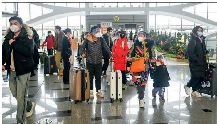
While COVID has not totally subsided across the world, there are less restrictions to air travel. Air travelers at Daxing International Airport in Beijing, China, in January.

They have an increase in growth advantage and are also showing immune escape, meaning people can be reinfected de-