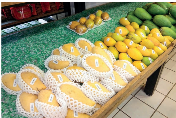
Seintalone mangoes are seen at one outlet.

Ayeyawady Region possesses the largest mango plantation