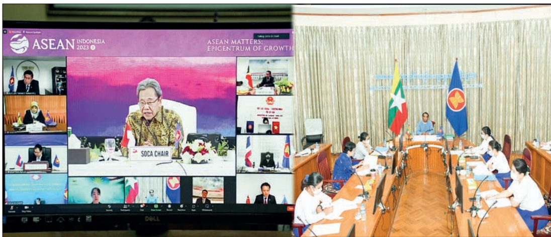
The 34 th meeting of the ASEAN Socio-Cultural Community High-Level Officials in progress online.

THE 34 th meeting of the ASEAN Socio-Cultural Community High-Level Officials for the year 2023 was convened online yesterday. The meeting was hosted by Indonesia, the current chairperson of ASEAN in rotation.