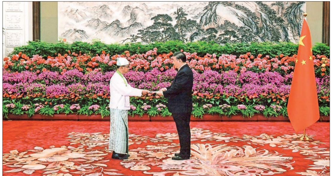
Chinese President Mr Xi Jinping accepts the credentials of the newly-appointed ambassador of Myanmar to China on 24 April in Beijing.