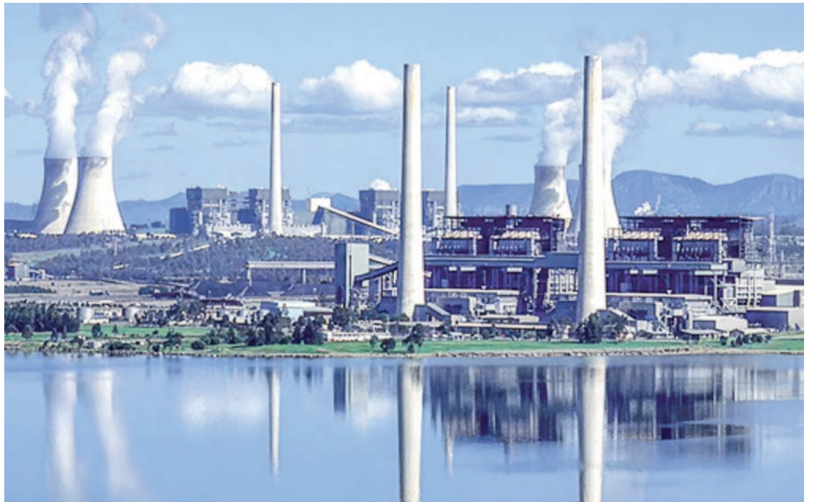
Steam rises from the cooling towers of the Liddell power station in the town of Singleton, New South Wales. PHOTO: IPA.ORG/AFP/FILE

For decades, coal has provided the bulk of Australia's electricity, but University of New South Wales renewable energy expert Mark Diesendorf told AFP that stations such as Liddell were fast becoming unreliable "clunkers". Besides being inefficient, highly polluting and expensive to repair, the continued widespread use of coal-fired power plants would make Australia's climate targets almost impossible to meet. — AFP