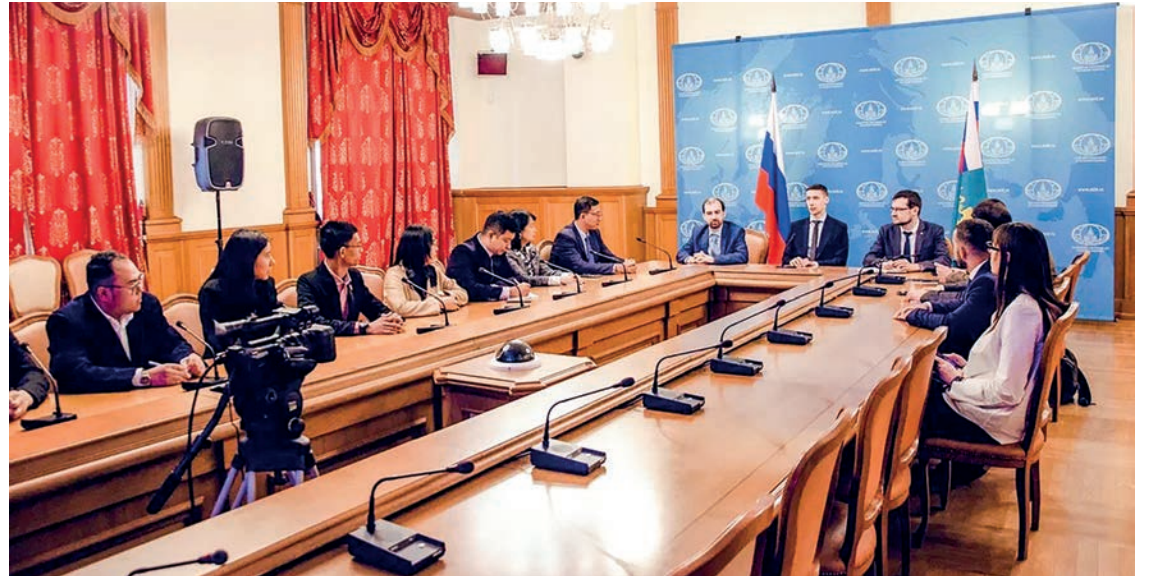
Myanmar delegation are pictured in the meeting in Moscow.

The Myanmar delegation met employees of the Third Department of Asia of the Ministry of Foreign Affairs of Russia acquainted the forum participants with the activities of the Council of Young Diplomats and present-