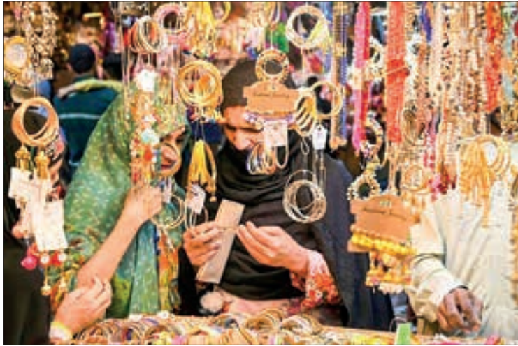
With inflation soaring and political uncertainty leaving the country in turmoil, many Pakistanis are worried about meeting their monthly rent.

THE holiday that marks the end of the Muslim fasting month of Ramadan used to be a guaranteed earner for Pakistan's