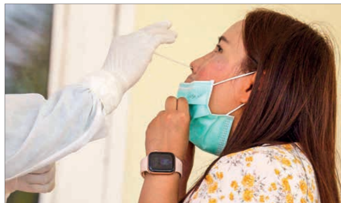
Brain fog, shortness of breath, loss of taste and smell are well-known long COVID symptoms.

Despite the Russian proposal for the investigation by the UN Security Council, nothing would come out, even if the Council would like to condemn the US as the culprit with nine aye votes because the US itself and its allies UK and France have the veto power to annul the Council's resolution.