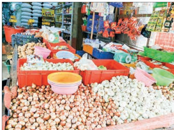
The photo shows a retail shop of dry groceries.

The prices of local potatoes from Shan State moved in the range between K1,300 and 1,800 per viss. The potatoes from Heho and Aungban areas entered the