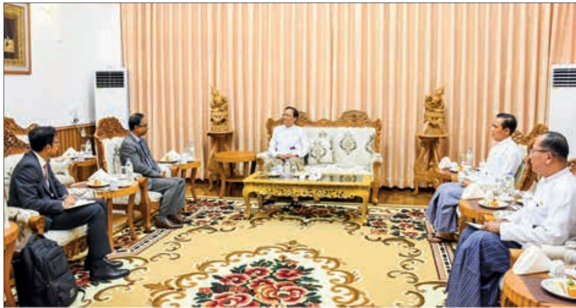
The Bangladeshi ambassador calls on Union Minister Dr Thet Khaing Win yesterday.