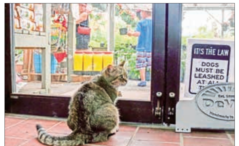
Organizers of an annual hunting competition caused an uproar when they announced a new category for children under 14 to hunt feral cats.

New Zealand Society for the Prevention of Cruelty to Animals said it was "both pleased and