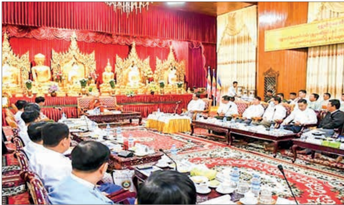
The coordination meeting on holding consecration and alms donation ceremonies in progress yesterday.