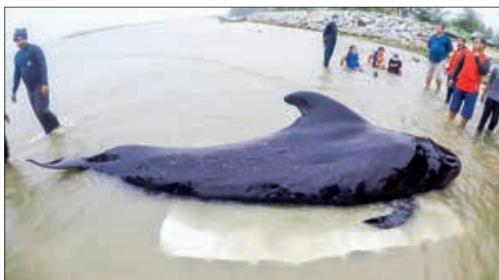
Some 80 pieces of plastic rubbish weighing 17 pounds were found in the stomach of a whale that died in Thailand after a five-day effort to save it, a marine official said on 3 June 2018.

More than two-thirds of the items examined had coastal species on them, including crustaceans, sea anemones and moss-like creatures called bryozoans.—AFP