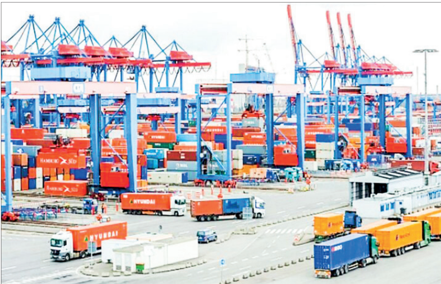
General view of the container yard at Yangon Port. Containers arriving at the port are being loaded by vehicles.

MYANMAR'S seaborne trade with international trade partners amounted to US$25.35 billion in the previous financial year 2022-2023 (April-March), comprising exports worth $10.489 billion and imports worth $14.865 billion, the Min-