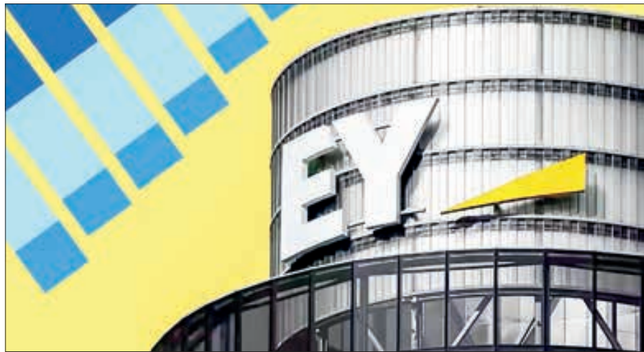
EY said the job cuts "are part of the ongoing management of our business and not a result of the recently concluded strategic review", the spokesperson said.

BRITISH financial services giant EY, which last week dropped a plan to split its audit and advisory units, said Monday it will cut 3,000 US jobs, citing overcapacity at the firm. "After assessing the impact of current economic conditions, strong employee retention rates and overcapacity in parts of our firm, we have made the difficult business decision to separate approximately 3,000 US employees, representing less than five per cent of our US workforce," said an EY spokesperson.