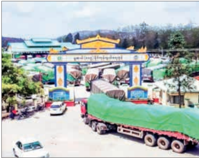
The photo shows trucks entering the Muse border trade zone.

Transactions for cross-border trade are done in Yuan and dollars. Bean, corn, sesame and peanuts are allowed to make payments in Yuan as well as dollars. For transactions of rice, broken rice, agricultural products and fisheries products (eel, crab) are available in Yuan payment. — TWA/EM