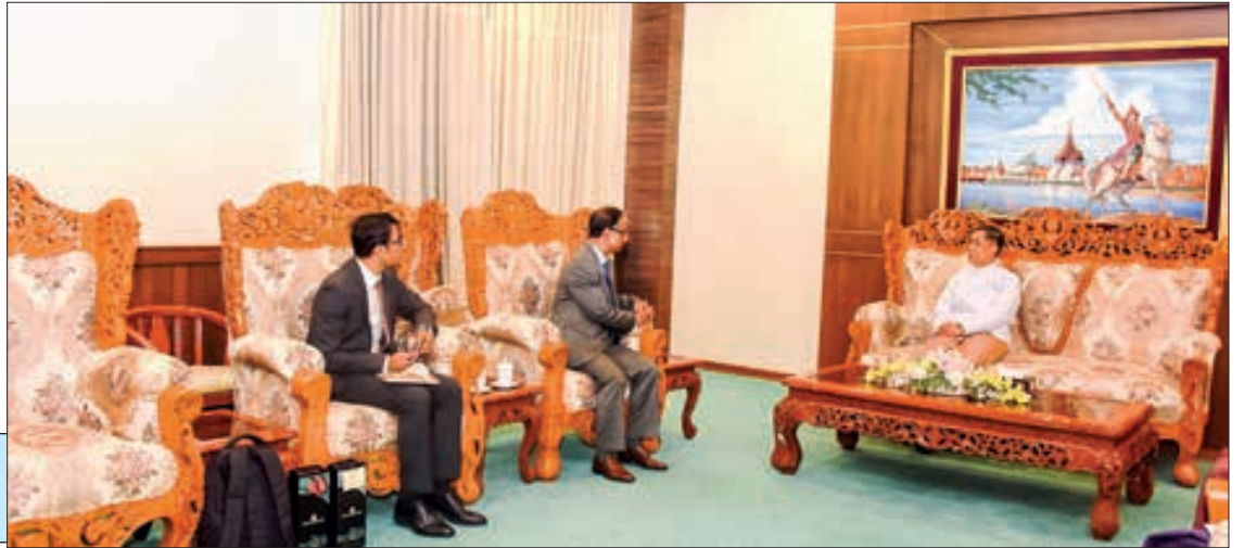
The Bangladeshi ambassador calls on Union Minister U Ko Ko Hlaing yesterday.

During the call, they cordially exchanged views on the promotion of bilateral relations, expansion of cooperation particularly in the areas of trade and investment as well as closer collaboration in regional and multilateral fora. — MNA