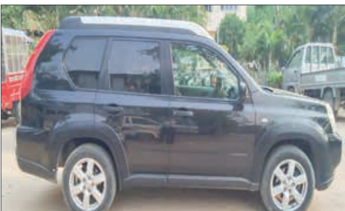
Seized car in Sagaing Region.

In addition, a combined on-duty team seized an unregistered Nissan X-Trail vehicle (approximately K10 million) at the combined checkpoint in Shwebo township and the action was taken under the Export and Import Law.