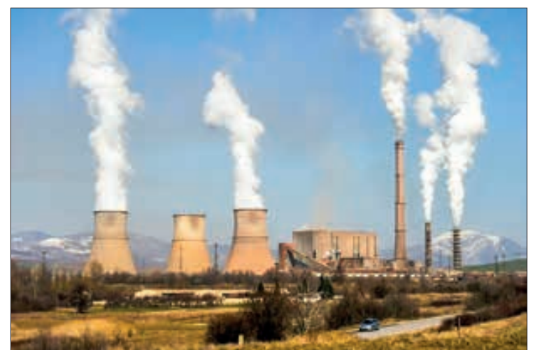
The EU is broadening an emissions trading scheme to more industries and lowering quotas of allowable polluting gases.

THE European Parliament adopted sweeping climate measures on Tuesday aimed at massively cutting EU greenhouse emissions, and including the introduction of a carbon border tax on imports.