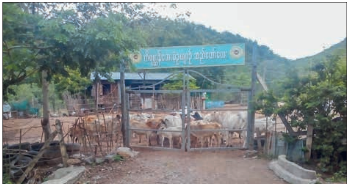
Left and Above: Photos show carers are feeding geese, cattle among others at the animal sanctuaries.

There are 11 sanctuaries — Setawlay sanctuary in Patheingyi Township, Setawgyi sanctuary in Madaya Township, Marle Nat-taung sanctuary in Singu Township and Zayetkwin sanctuary in Thabeikkyin Township of Mandalay Region, Ywathitkalay sanctuary in Sagaing Kaunghmudaw, three sanctuaries in Dabayin,