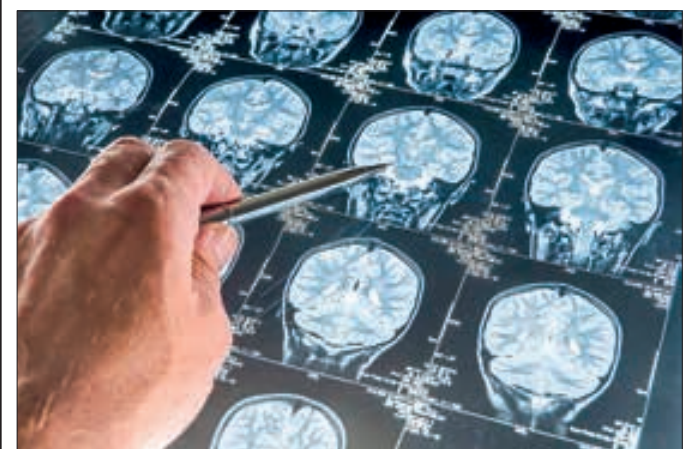
Parkinson's disease is a degenerative condition of the brain associated with motor symptoms such as slow movement, tremors, rigidity and other complications.

To build the sensor, the researchers used a commercial filament made basically of polylactic acid (PLA), a biodegradable polymer, associated with a conductive material (graphene) and other additives.— ANI