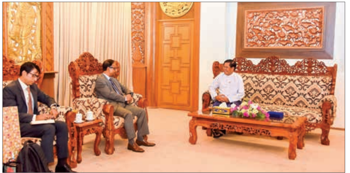
Union Minister U Than Swe receives Mr Manjurul Karim Khan Chowdhury, Ambassador of Bangladesh to Myanmar yesterday.