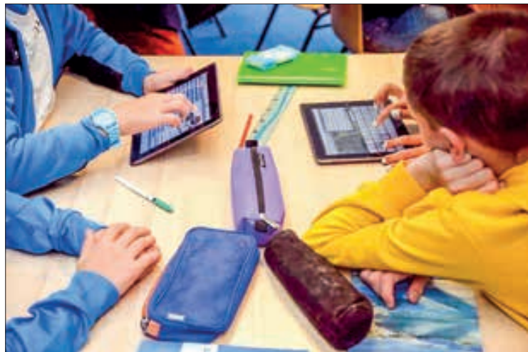
This file photo shows pupils using tablets during courses in a classroom at the Leonard de Vinci 'connected' middle school in Saint-Brieuc, western France.