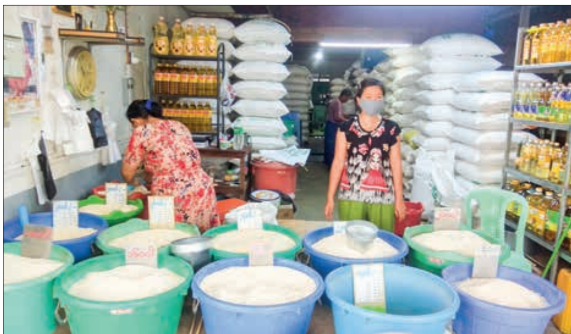
The rice supply to the market is declining for now. The market is quite sluggish, Varieties of rice are seen at rice retail outlet in Yangon.

After Myanmar's New Year holidays, the prices of Pawsan rice climbed up to K75,000-K97,000 per bag on 18 April. The prices of various rice varieties were up by