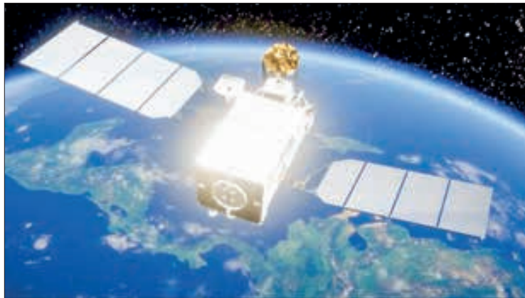
With a lifespan of six years, FY-3G is the country's first satellite allowing scientists to monitor the Earth's precipitation from space, one of only three such satellites in the world.

With a lifespan of six years, FY-3G is the country's first satellite allowing scientists to monitor the Earth's precipitation from space, one of only three such satellites in the world. It was developed by an institute of China Aerospace Science and Technology Corporation, and its ground system will be built and operated by the China Meteorological Administration.