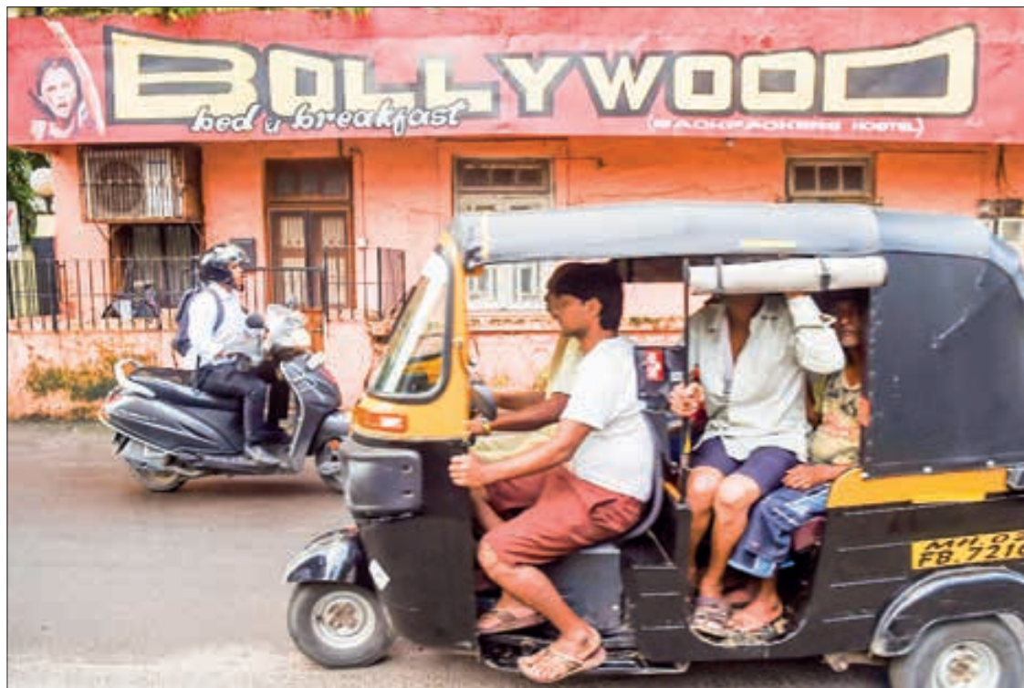
Commuters go past a hostel named 'Bollywood' in Mumbai on 16 September 2019.

Beijing ended its strict "one-child policy", imposed