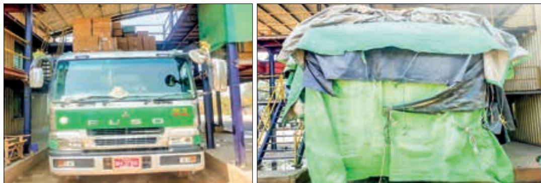
Confiscated illegal commodities and vehicles at the Yepu permanent checkpoint.

AN on-duty team under the management of the Customs Department at the Yepu permanent checkpoint in Shan State made inspections on 18 April.