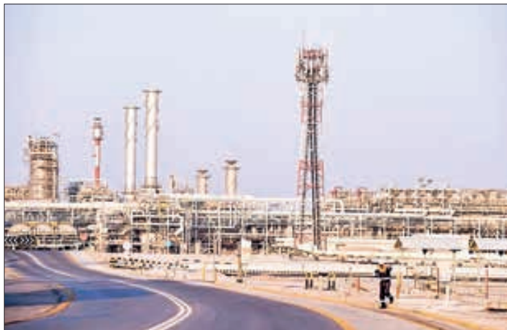
Aramco and its assets were once kept under vice-like government control, off-limits to outside investment.

The official Saudi Press Agency said the shares had been transferred to Sanabil Investments, a firm controlled by the kingdom's Public Investment Fund (PIF), one of the world's biggest sovereign wealth funds