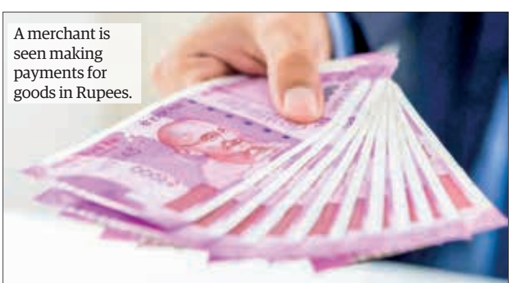
A merchant is seen making payments for goods in Rupees.

The announcement was made for the export declarations (ED) that were issued in the period before the issuance of Notification No 36/2022 of the Central Bank of Myanmar dated 5 August 2022, according to the decision of the Foreign Exchange Supervisory Committee (FESC) meeting 27/2023.