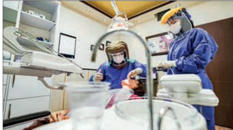
If make it harder oral bacteria are getting in and repeatedly triggering immune responses relevant to rheumatoid arthritis, that could to treat.

The Darnell lab had been following a small group of arthritis patients over the course of several years, collecting weekly blood samples and looking for