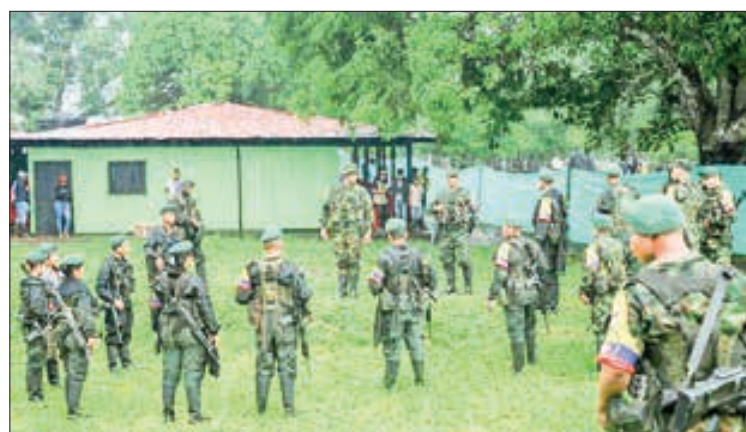
Armed FARC dissidents produced a show of force in their fiefdom in southern Colombia. PHOTO: AFP

When FARC, which was the most powerful guerrilla group in the Americas and is now a communist political party, decided to disarm, most of its 13,000 members did so. — AFP