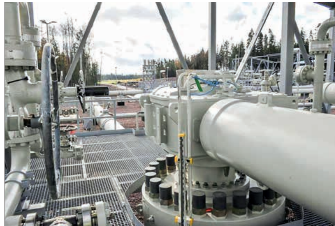
Picture taken on 8 October 2012 shows Nord Stream pipeline equipments before the opening ceremony of the North Stream second gas link in Portovaya bay, some 60 kilometers from the town of Vyborg in northwestern Russia.

As it almost wholly relied on Russia before the outbreak of the Russian-Ukrainian conflict for its supply of natural gas and petroleum, it is very unlikely to destruct the pipelines which used to carry the gas to it, even though just before the sabotage no gas was sent through them. Despite no