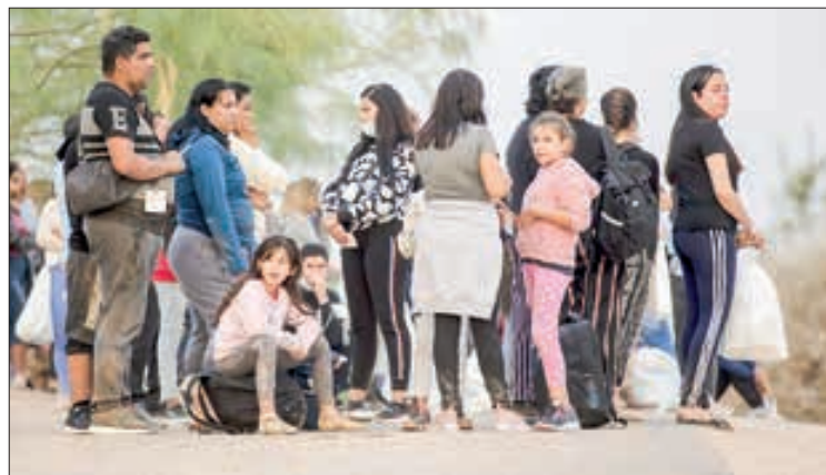
Migrants seeking asylum wait to board a bus at a checkpoint in Eagle Pass, Texas, the United States, on 10 October 2022.

But given such efforts have been blocked by vetoes from China and Russia, approval is likely to be voted down again, even if a potential launch of the reconnaissance satellite increases calls for stronger sanctions. Photos carried by state media showed Kim was accompanied by his daughter during the visit to the space agency. — Kyodo