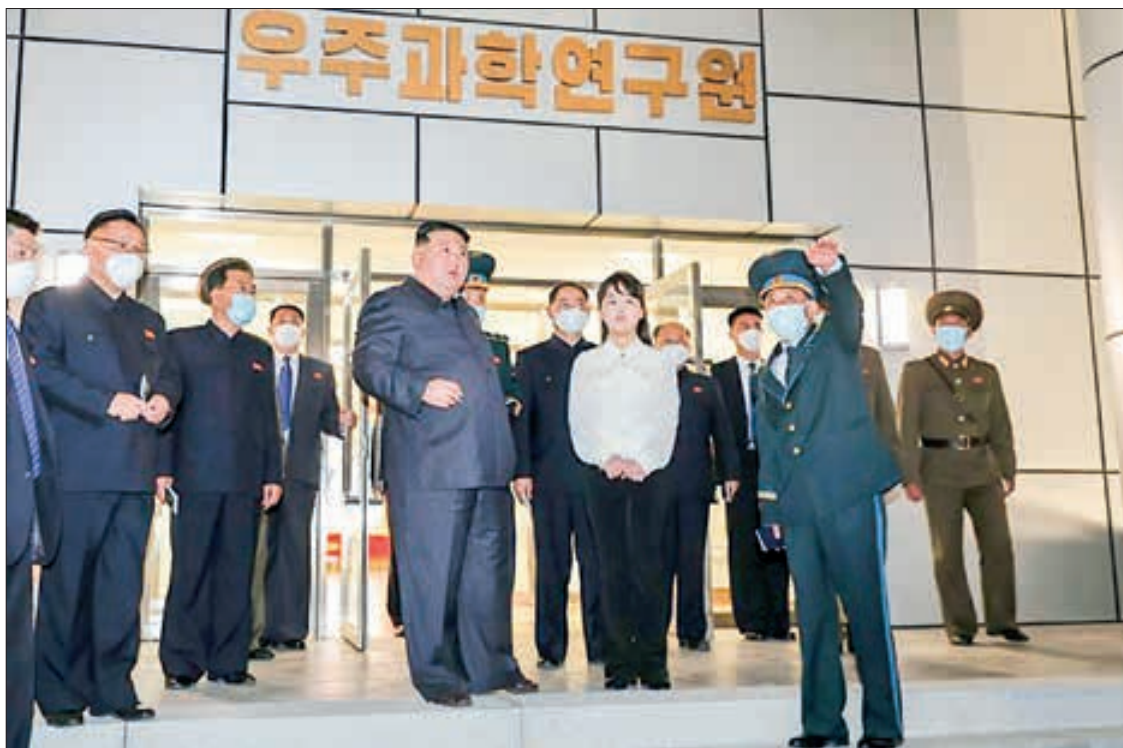
North Korean leader Kim Jong Un (center L) visits the National Aerospace Development Administration on 18 April 2023.

"Possessing and operating military reconnaissance means is the most crucial primary task for increasing the