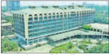
An aerial view of the office building of the Central Bank of Myanmar