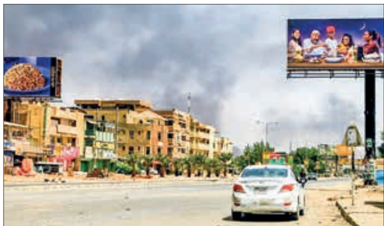
Smoke rises in the background as a car drives along an almost deserted street in Khartoum on April 16.

It followed a bitter dispute between Burhan and Daglo over the planned integration of the RSF into the regular army — a key condition for a final deal aimed at resuming Sudan's democratic transition. — AFP