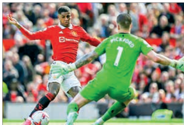
Marcus Rashford has returned to training for Manchester United.

MARCUS Rashford has returned to training for Manchester United, giving the club