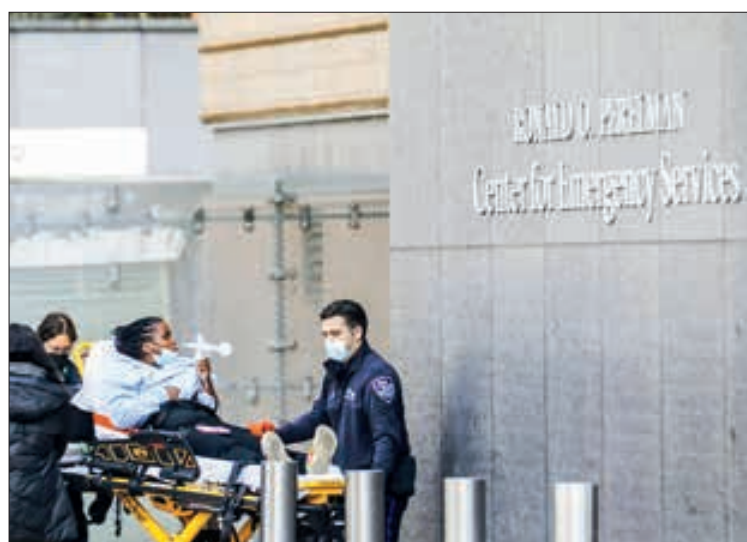
Medical workers carry a patient into a hospital in New York, the United States, 13 December 2021.

In the past week, the Southeast Asian country recorded more than 2,600 new COVID-19 cases, an average of nearly 400 new cases per day. For more than three and a half months, it has not recorded any fatalities related to COVID-19, according to the newspaper. — Xinhua