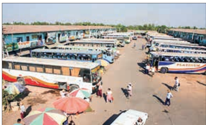
A view of the Aungmyingala Express Bus Terminal.