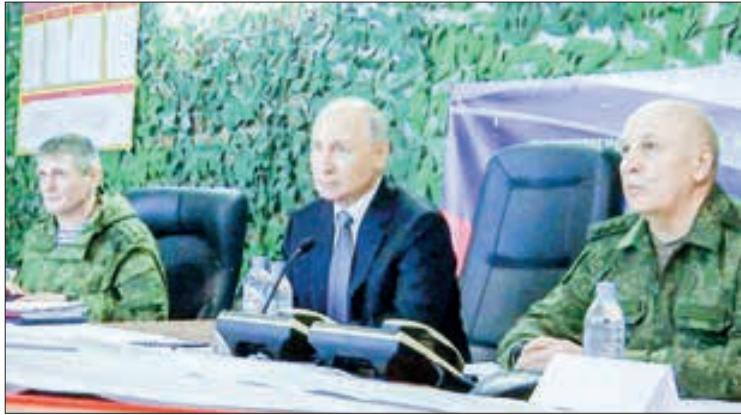
This screen grab taken from a footage released by the Russian presidential press office on 18 April 2023 shows Russian President Vladimir Putin visiting the headquarters of the Dniepr military grouping in the Kherson region of Ukraine, which is partly controlled by Russian troops.