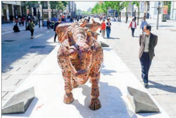
A man walks past a bronze bull statue by Chinese artist Zhu Bingren along a business street in Beijing on 18 April 2023.

After years of travel restrictions and quarantines, Chinese people in recent months have finally returned to restaurants