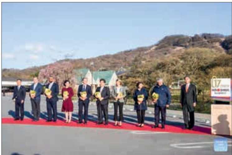
Deputy Secretary-General of the European External Action Service Enrique Mora (2nd L), British Foreign Secretary James Cleverly (3rd L), German Foreign Minister Annalena Baerbock (4th L), US Secretary of State Antony Blinken (5th L), Japanese Foreign Minister Yoshimasa Hayashi (5th R), Canadian Foreign Minister Melanie Joly (4th R), French Foreign Minister Catherine Colonna (3rd R), Italian Deputy Prime Minister and Minister of Foreign Affairs Antonio Tajani (2nd R) and two Japanese local officials (1st L, 1st R) pose for a group photo during a welcome ceremony at the Karuizawa station of shinkansen train in Nagano Prefecture, Japan, on 16 April 2023.

Japanese Foreign Minister Yoshimasa Hayashi and his G7 counterparts arrived in Karuizawa on Sunday afternoon for the foreign ministerial meeting, in advance of a G7 summit to be held in Hiroshima in May.