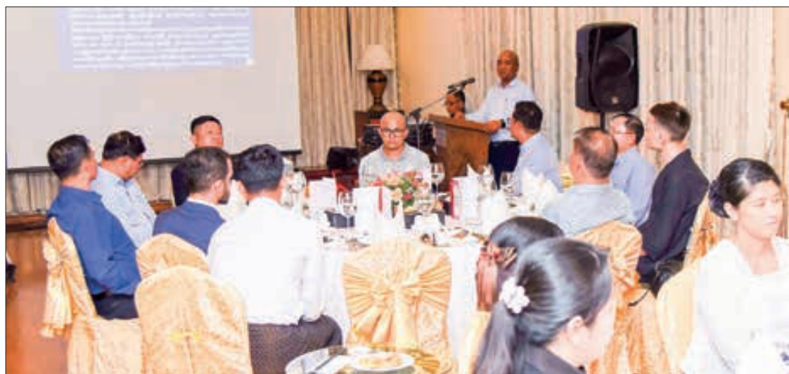
The Russian Bloggers team attending the dinner hosted by SAC Information Team Leader Maj-Gen Zaw Min Tun yesterday.

Tun greeted the guests and an official of the Russian Bloggers said words of thanks. Then,