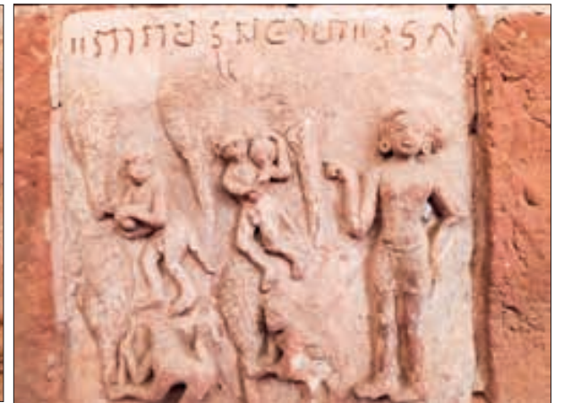
It is reported that the ancient unglazed clay-fired Jataka tablets were found during the clearing and repair of the broken brick ruins in the lower part of these two pagodas around 1905.