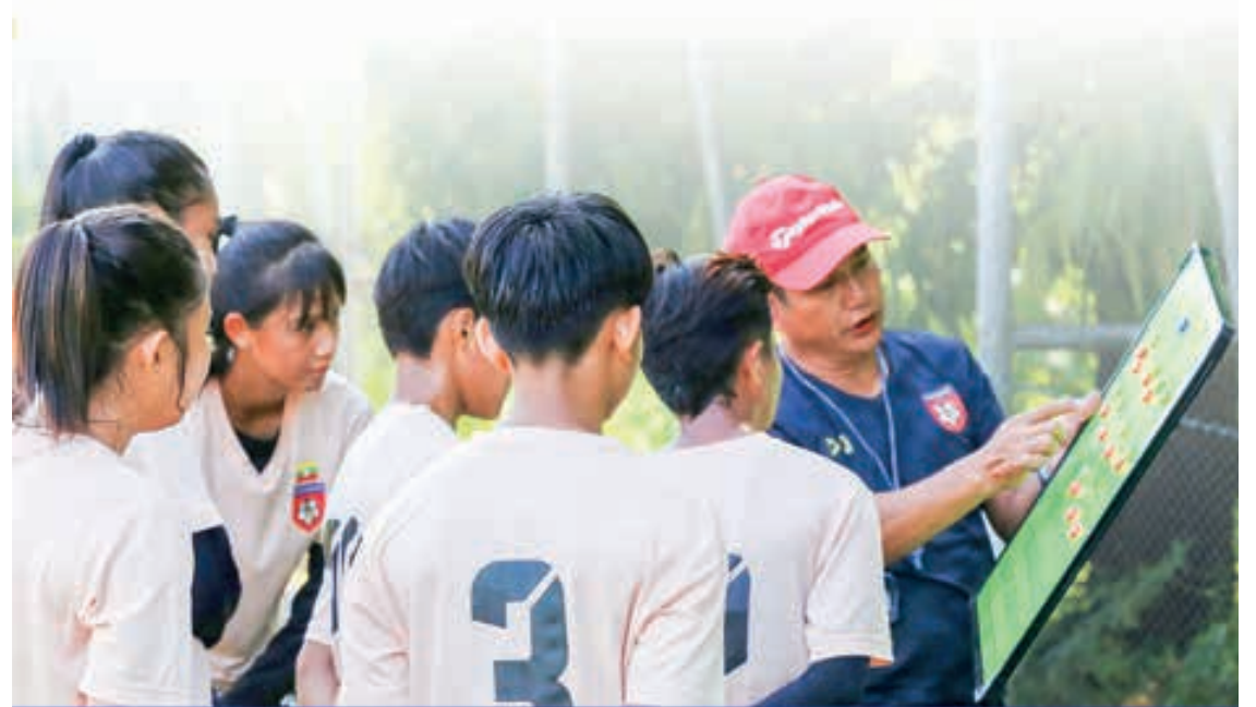
The Myanmar U-17 women's footballers learn with interest the head coach's strategy presentation ahead of the AFC U-17 Women's Asian Cup Qualifiers.

THE Myanmar national women's U-17 team has released the final 23-player list for the 2024 Asian Women's U-17 Championship first-round qualifiers, according to yesterday's statement with the Myanmar Football Federation.