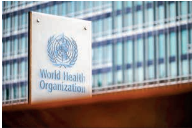
This photograph taken on 7 December 2021 shows a sign of the World Health Organization (WHO) at their headquarters in Geneva.

The campaign urges the most vulnerable groups and the sexually active who will attend the events and festivals