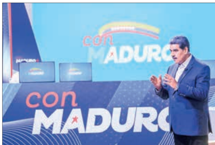
This handout picture released by Miraflores Presidential Palace shows Venezuelan President Nicolas Maduro speaking during the broadcast of the first edition of his new television programme called "Con Maduro" in Caracas on 17 April 2023.

Maduro is following in the footsteps of his populist pre-