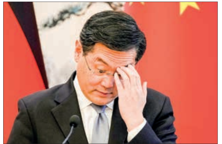
Chinese Foreign Minister Qin Gang attends a joint press conference with Germany's Foreign Minister Annalena Baerbock at the Diaoyutai State Guesthouse in Beijing on 14 April 2023.

China has no selfish interests on the Israel-Palestine issue, and only hopes that Israel and Palestine can coexist peacefully and safeguard regional peace and stability. — Xinhua