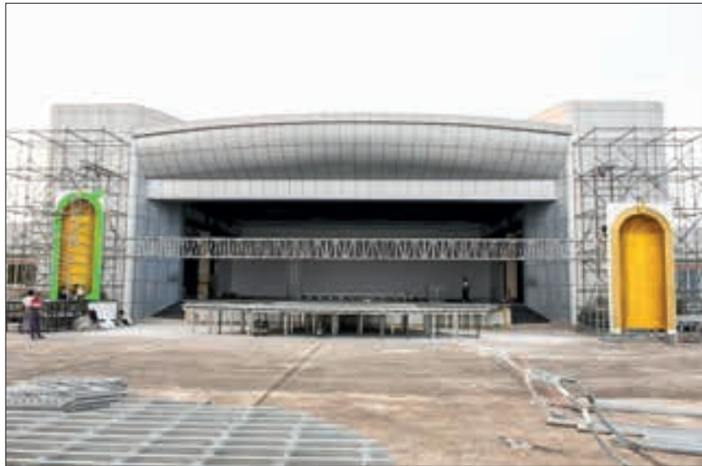
Union Minister U Maung Maung Ohn and officials inspect preparations for the Myanmar Motion Picture Academy Award Event in Nay Pyi Taw yesterday.

The Union minister heard reports and explanations from departmental and company officials on the placement of the MRTV National Orchestra and Myanmar Hsaingwaing (Myanmar traditional orchestra), the selection of songs to be performed, roles of masters of cer-