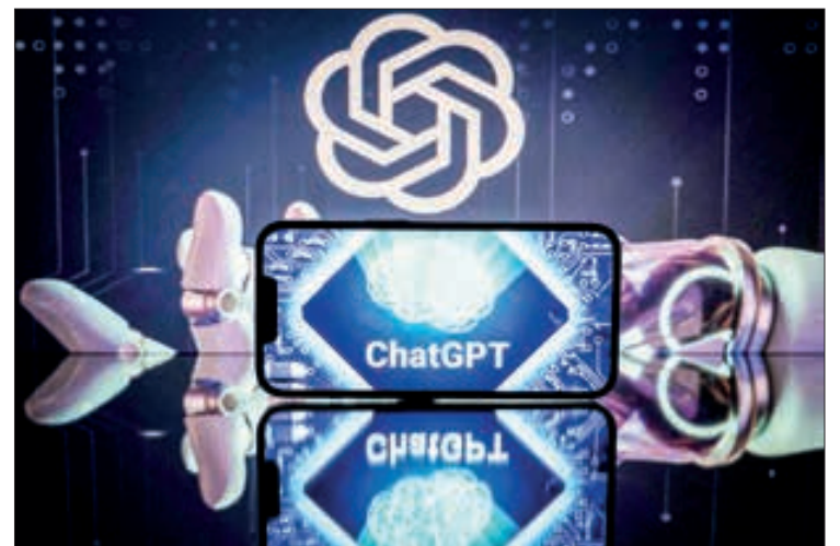
This picture taken on 23 January 2023 in Toulouse, southwestern France, shows screens displaying the logos of OpenAI and ChatGPT.

people as an interesting part of the universe and decide not to "annihilate humans".