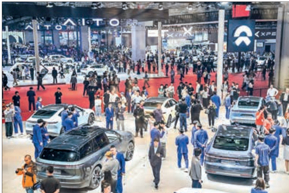
People visit a Nio booth during the 20 th Shanghai International Automobile Industry Exhibition in Shanghai on 18 April 2023.

Local brands command 81 per cent of the EV market in China, according to analysts at Counterpoint Research, and industry titans such as BMW were at pains to