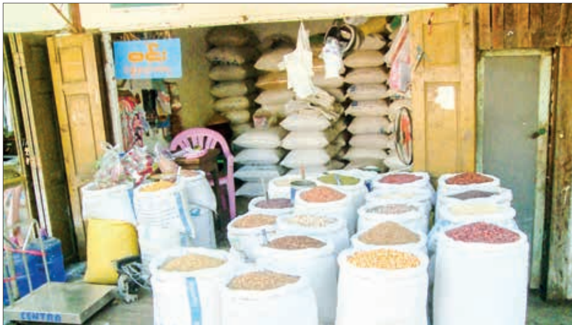
Myanmar yearly produces approximately 400,000 tonnes of black grams and about 50,000 tonnes of pigeon peas. The photo shows the pulses retail outlet.

(urad in India) increased slightly in India as well. The price of black gram (urad in India) is expected to be around Rs 8,500-9,000 per quintal in Chennai until August, Agri World Mumbai forecast.