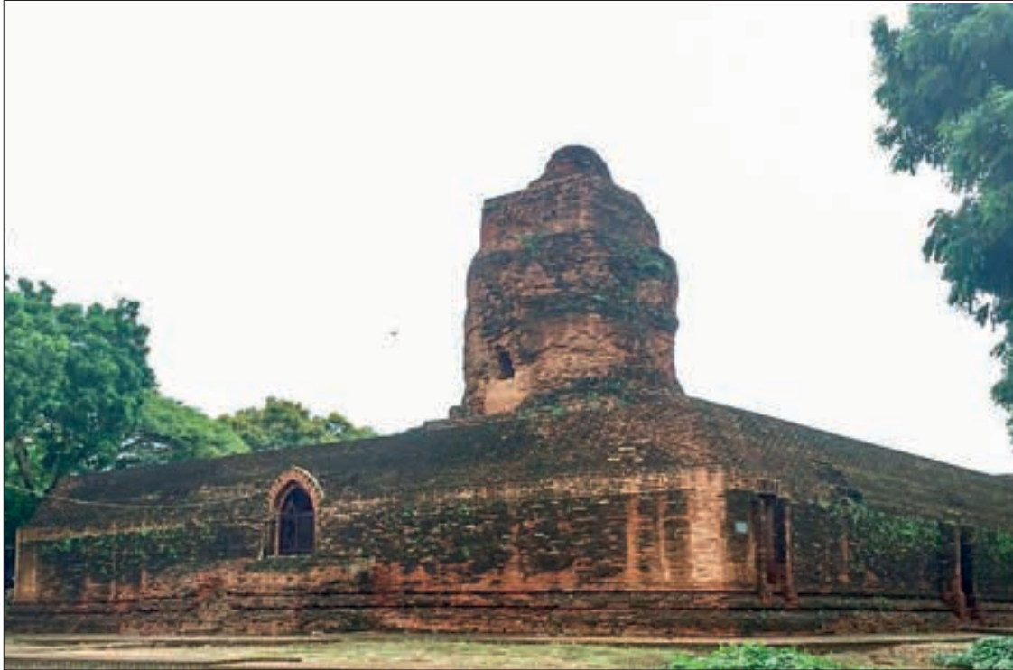
The Ashayphatleik Pagoda and Anoutphatleik Pagoda are works of the 11 th century AD.