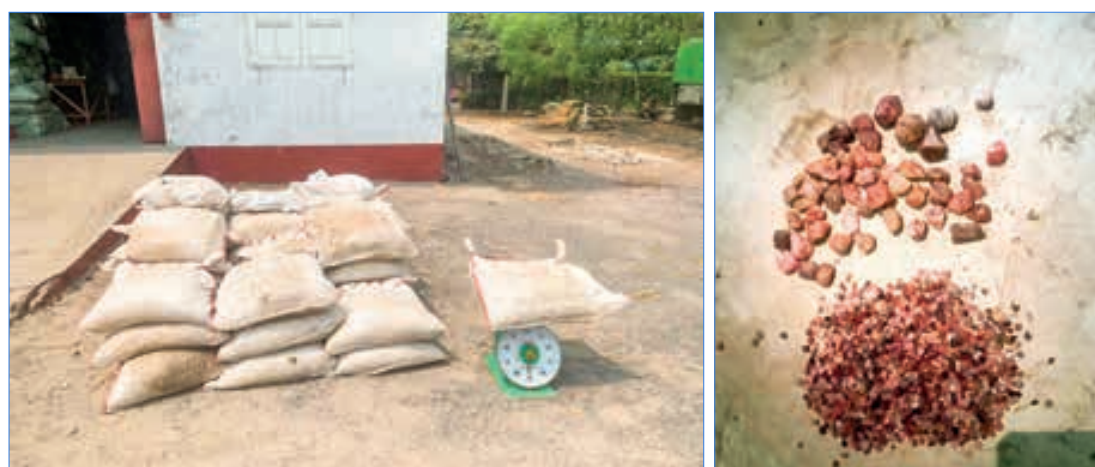
Confiscated illegal commodities in Mandalay Region.

Therefore, 16 arrests (estimated value of K48,557,873) were made on 16 and 17 April, according to the Illegal Trade Eradication Steering Committee. — MNA/MKKS