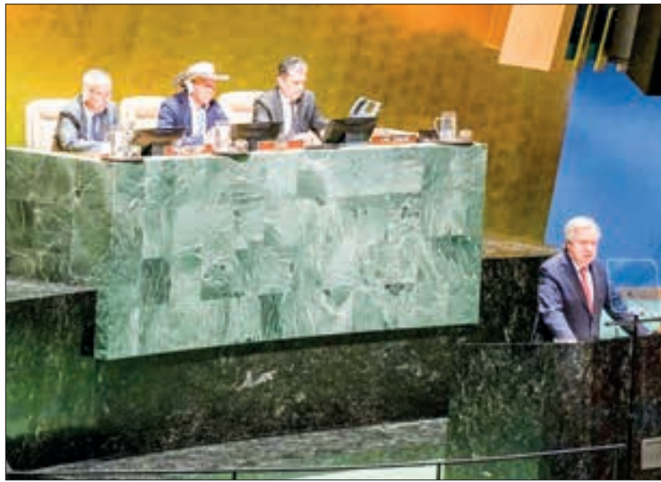
UN Secretary-General Antonio Guterres (at podium) addresses the opening of the 22nd session of the UN Permanent Forum on Indigenous Issues at the UN headquarters in New York on 17 April 2023.

Living on the frontlines of the climate emergency, indigenous peoples have done nothing