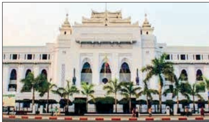
The Yangon City Hall where the office of YCDC's Tax Department.

The private-run hailing service owners can directly pay the tax by transferring them to the Revenue Department's banking account MD 001473 at the Myanma Economic Bank Branch-5. —TWA/EM