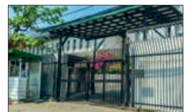
The Japanese Embassy in Yangon.

The Japanese Embassy stated the notification that COE applicants have to not only prepare, check and confirm the required documents by themselves without brokers but also check carefully the original COE through the brokers. —TWA/MKKS