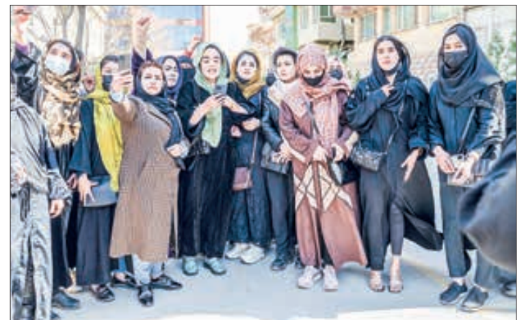
Afghan women stage a protest for their rights to mark International Women's Day in Kabul on 8 March 2023.

In December, they banned women from working for domestic and foreign non-governmental organizations. On 4 April, the curb was extended to UN offices across the country, triggering international outrage.