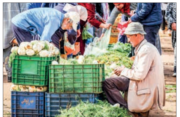
In this picture taken on 23 February 2023, vendors organize their stalls of fresh produce at the Sidi Moussa market in Morocco's Atlantic coastal city of Sale, north of the capital. PHOTO: AFP

In an attempt to stem the price rises, Rabat suspended exports of some products in early February, including tomatoes, to ensure supplies for the local market. — AFP