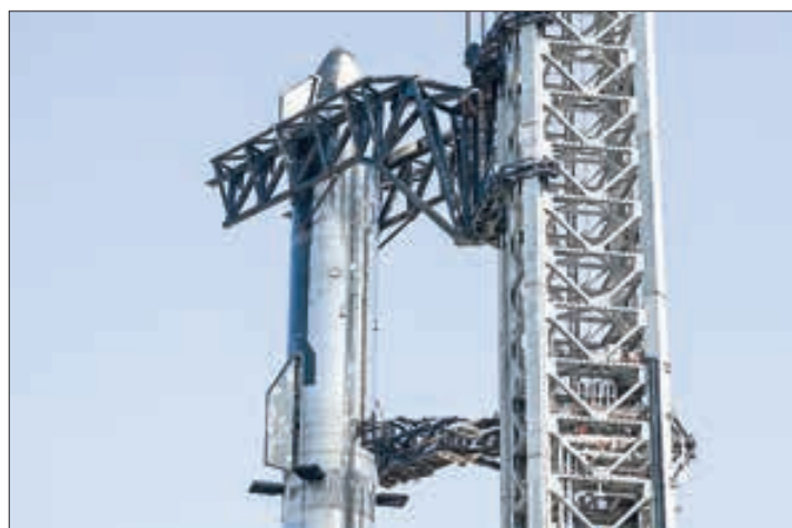
The SpaceX Starship stands on the launchpad following a launch delay of the SpaceX Starship flight test from Starbase in Boca Chica, Texas, on 17 April 2023.

artificial intelligence corporation based in the US state of Nevada, according to business documents. — AFP