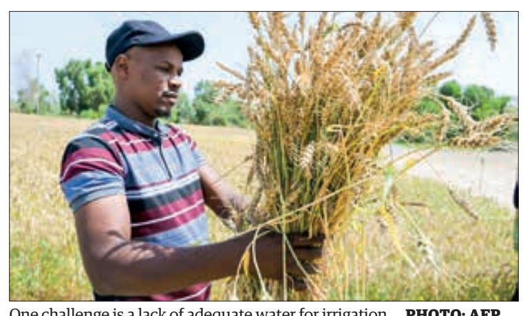
One challenge is a lack of adequate water for irrigation.

caused by the war in Ukraine have added urgency to the country's efforts to achieve self-sufficiency. Since late last week, researchers from the Senegalese Institute for