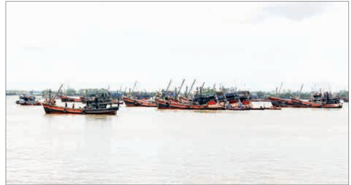
Myanmar ships fishery products to over 40 countries, mostly to Thailand and China. A fleet of fishing vessels and one of the thriving fishery markets are pictured (above and left photos.)

neighbouring countries through Muse, Myawady, Kawthoung, Sittway, Myeik and Maungtaw borders.