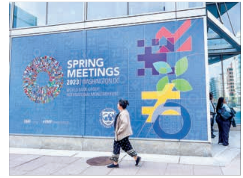
A woman walks past a sign for the 2023 Spring Meetings of the World Bank/International Monetary Fund on the IMF building in Washington, DC, on 5 April 2023. The Spring meetings will take place in person from 10 April to 16 April.

Close to 90 per cent of the world's advanced economies will experience slowing growth