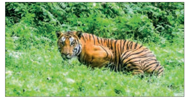
The largest of all cats, tigers once roamed throughout central, eastern and southern Asia.

Once released into the natural environment, the nurdles circulate on ocean currents and often wash up on beaches and other shores.