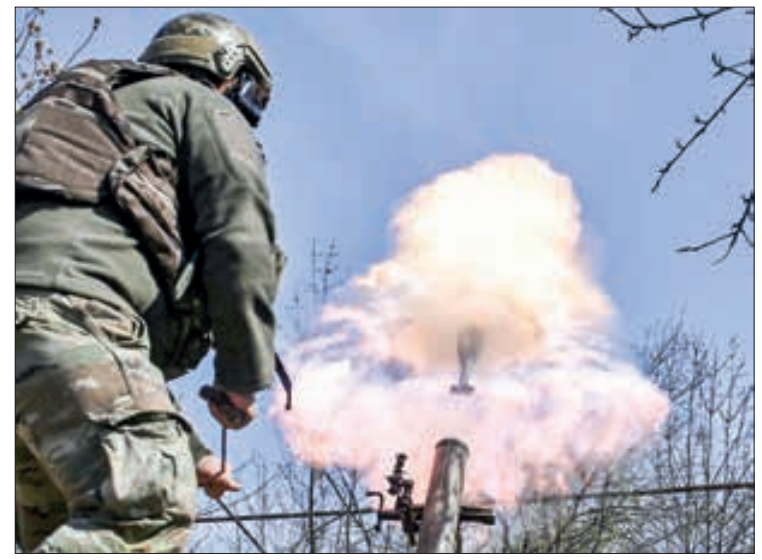
A Belarusian volunteer soldier from the Kastus Kalinouski regiment, a regiment made up of Belarusian opposition volunteers formed to defend Ukraine, fires a 120mm mortar round at a front line position near Bakhmut in the Donetsk region, on 9 April 2023, amid the Russian invasion of Ukraine.