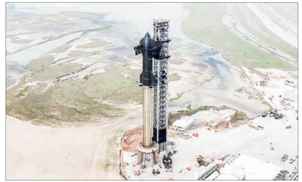
SpaceX conducted a successful test-firing of the 33 Raptor engines on the first-stage booster of Starship in February.

SPACEX plans to carry out a launch rehearsal next week of Starship, the most powerful