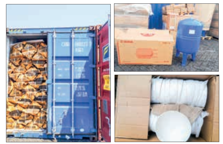
Seized illegal items at the Myanmar Industrial Terminal.

Therefore, 17 arrests (estimated value of K408,442,216) were made on four consecutive days from 6 to 9 April, according to the Illegal Trade Eradication Steering Committee. — MNA/ MKKS