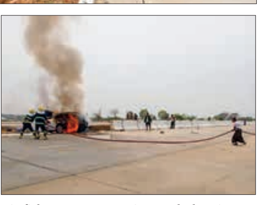
Firefighters are seen putting out the burning vehicle.

A fire engine, a water bowser and the fire brigade members from Pyinsi Expressway Fire Station rushed to the scene and put out the fire at about 11:40 am. In the incident, three men in the vehicle died on the spot and were taken to the Natogyi Public Hospital in the police vehicle. — MNA/CT