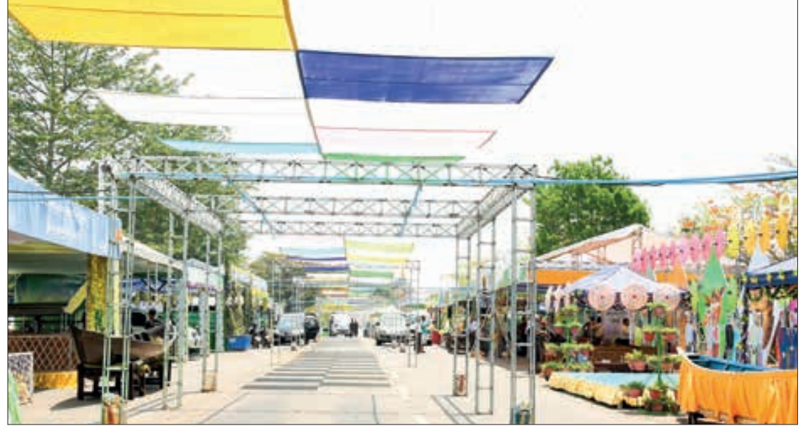
Preparations are underway for the Nay Pyi Taw Walking Thingyan including the Thanaka Thingyan, the Ethnic Thingyan, the ministries' pandals, fun programmes for adults and youths, the soft play area for children, food stalls, water skiing, and entertainment programmes among others (above and below photos).

"Starting Thingyan Akya Day, we will launch Walking Thingyan at 9 am. After a break at noon, there will be entertainment programmes and other programmes from 3 pm to 7 pm. Visitors will also play games. In addition, we must be able to enjoy our favourite foods in the