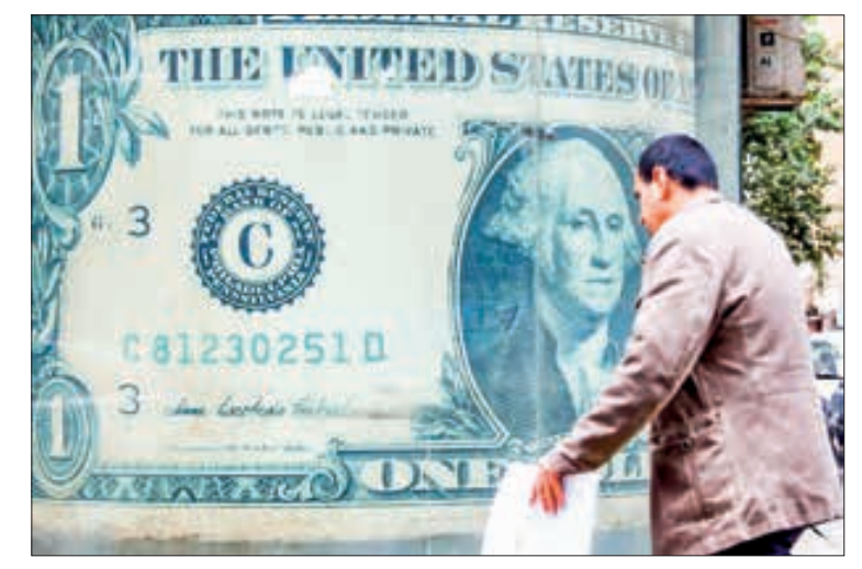
A man passes a foreign exchange office in Cairo, Egypt, 25 December 2022.

For his part, Levitin said Moscow is ready to make investments in different Iranian economic sectors, including those pertaining to the steel, oil and petrochemical industries. — Xinhua