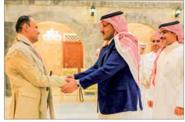
A handout picture released by the Huthi-affiliated branch of the Yemeni News Agency SABA on 9 April 2023 shows the Huthi group's political leader Mahdi al-Mashat (L) welcoming the Saudi ambassador to Yemen Mohammed Al Jaber and a delegation in Sanaa.

The Saudi officials are "in Sanaa to discuss moving forward to create peace in Yemen," said a Yemeni diplomat based in the Gulf region, information that was confirmed by a second dip-