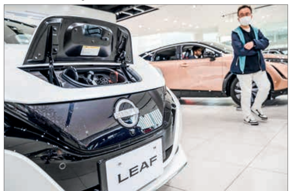
This photo taken on 30 March 2023 shows a man walking past one of Nissan's electric vehicles (EV), the Leaf, at the global headquarters of Japanese automaker Nissan Motor in Yokohama, Kanagawa prefecture. Last year, 59,000 new EVs were sold in Japan, a record and a three-fold annual increase, but still less than two per cent of sales of all cars in the country in 2022.

"I like high-performance cars," he told AFP, describing the few Japanese options on the market when he bought in 2016 as small and unattractive. — AFP