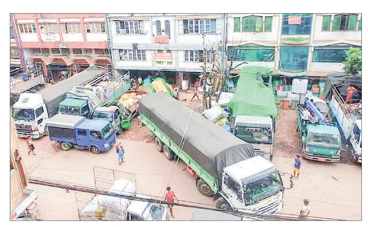
The photo shows some commodity depots at the Bayintnaung Wholesale Market.

The commodities prices are usually inflated when the Thingyan holidays approach. This year, the prices of some commodities including rice and edible oil climbed. The authorities concerned made the imports of edible oil double for food security. Nonetheless, there is a high price difference of around K2,000 per viss between the market price and the wholesale reference price. – TWA/EM