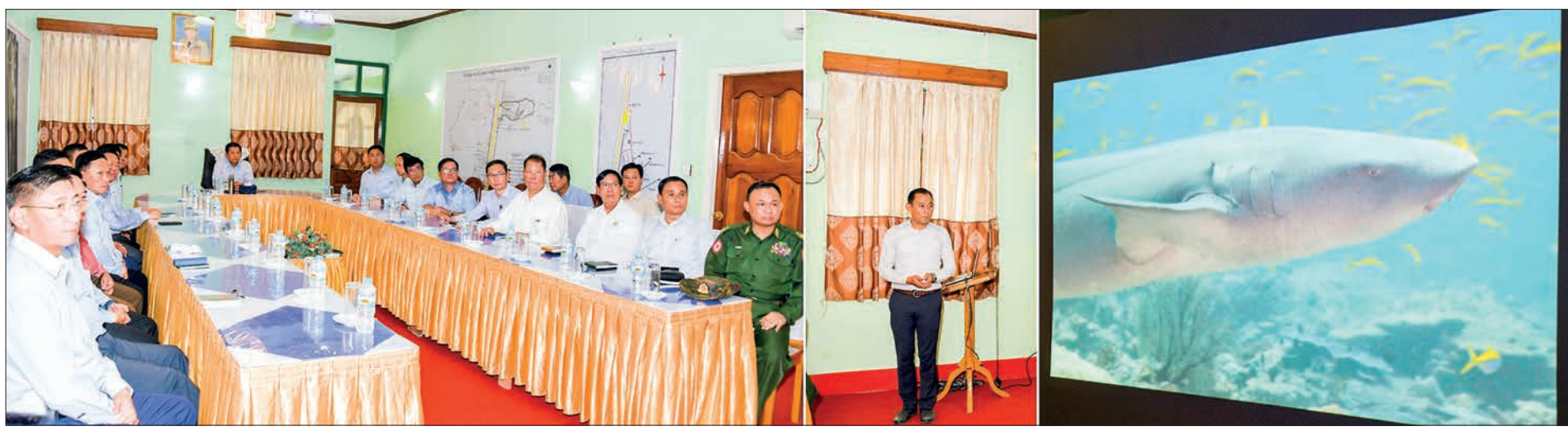
Chairman of the State Administration Council Prime Minister Senior General Min Aung Hlaing views the documentary video clip on underwater natural scenes and water creatures cast in the Myanmar seas at the local naval base yesterday.