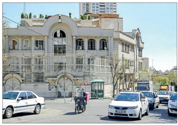
The now shuttered Saudi embassy in Tehran will soon be reopened.

The Saudi diplomatic delegation arrived in Iran to discuss the reopening of its missions after a seven-year absence,