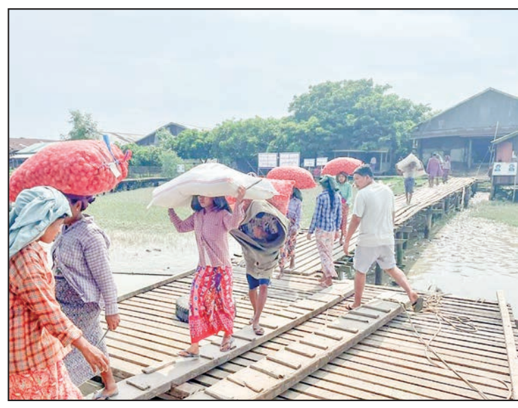
Some freight workers are seen at a port.

In the current National Planning Law, the participation ratio of the agricultural sector, the industrial sector and the service sector in the total value of gross domestic product and services in annual prices are expected to reach 2.5 per cent, 4.8 per cent and 6.7 per cent respec-