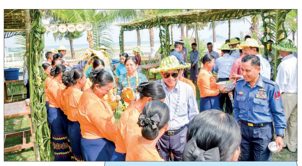
The Senior General and wife enjoy traditional Maha Thingyan festival together with Tatmadaw members and families in Cocogyun on 9 April.

The Senior General called for happily enjoying the Myanmar traditional Thingyan period and maintaining traditional culture in a systematic manner. Cocogyun region sees much progress due to concerted efforts of local people and local military units rather than assistance of the State leaders. Hence, they all have to continue further development of Cocogyun region through united strength of the