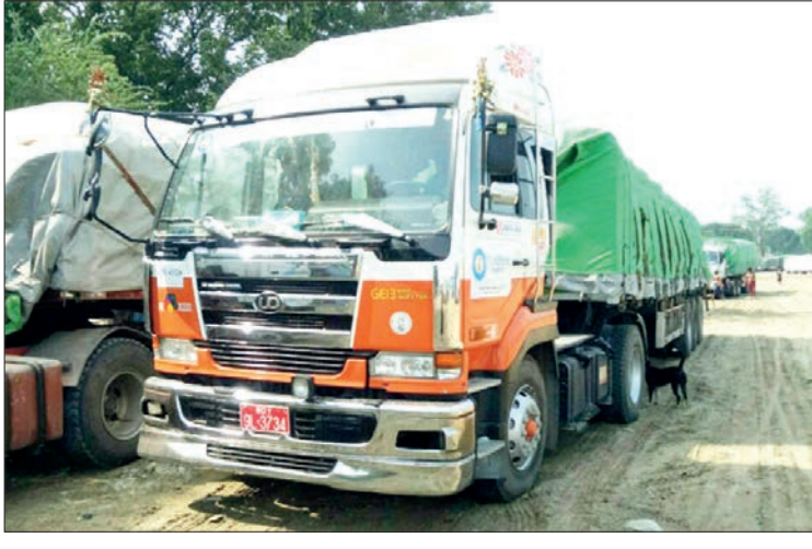
Some highway trucks are seen running to Yangon.

Although traders in Yangon have offered to pay higher fares than usual to deliver goods to