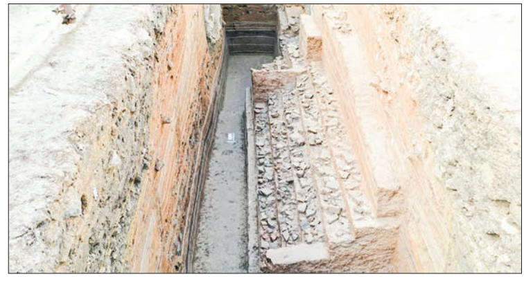
This undated file photo shows a section of the city wall foundation of the ancient Tianjin's east city wall site in Nankai District of north China's Tianjin.

OVER 2,000 porcelain, pottery, metalware, and other relics dating back to the Yuan Dynasty (1271-1368) have been uncovered in an ancient city wall site of north China's Tianjin Municipality.