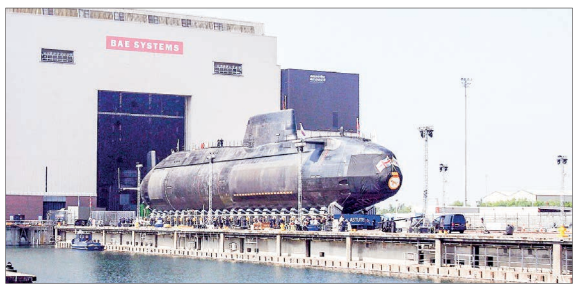
BAE Systems Submarines, is a wholly owned subsidiary of BAE Systems, based in Barrow-in-Furness, Cumbria, England, and is responsible for the development and production of submarines.

In response to a question concerning the trilateral Australia-UK-US (AUKUS) cooperation on nuclear submarines, the embassy said on Friday that such cooperation will exacerbate the resurgence of the Cold War mentality, trigger a new round of arms race, and further provoke