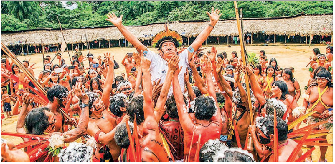
The Yanomami are a group of approximately 35,000 indigenous people who live in some 200–250 villages in the Amazon rainforest on the border between Venezuela and Brazil.

Combined analysis of 10 years of data on disease, forest cover and pollution found that each hectare of forest burned generates health costs of $2 million (1.8 million euros) a year