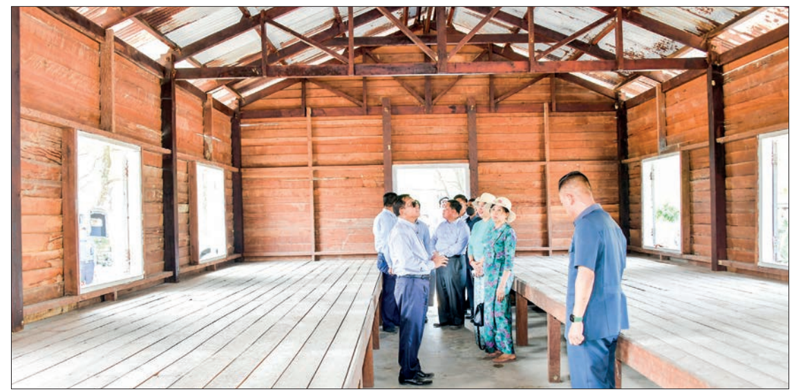
The Senior General views renovation of the old detention centre in Cocogyun in its original works yesterday.

party also viewed renovation of the old detention centre in Cocogyun in its original works.