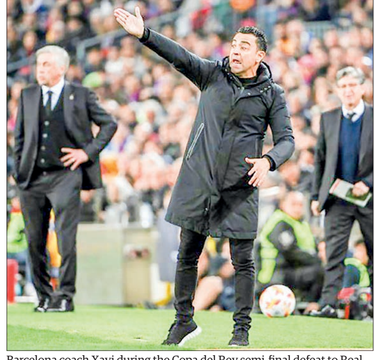
Barcelona coach Xavi during the Copa del Rey semi-final defeat to Real Madrid.

Madrid are in the Copa del Rey final and face Chelsea on