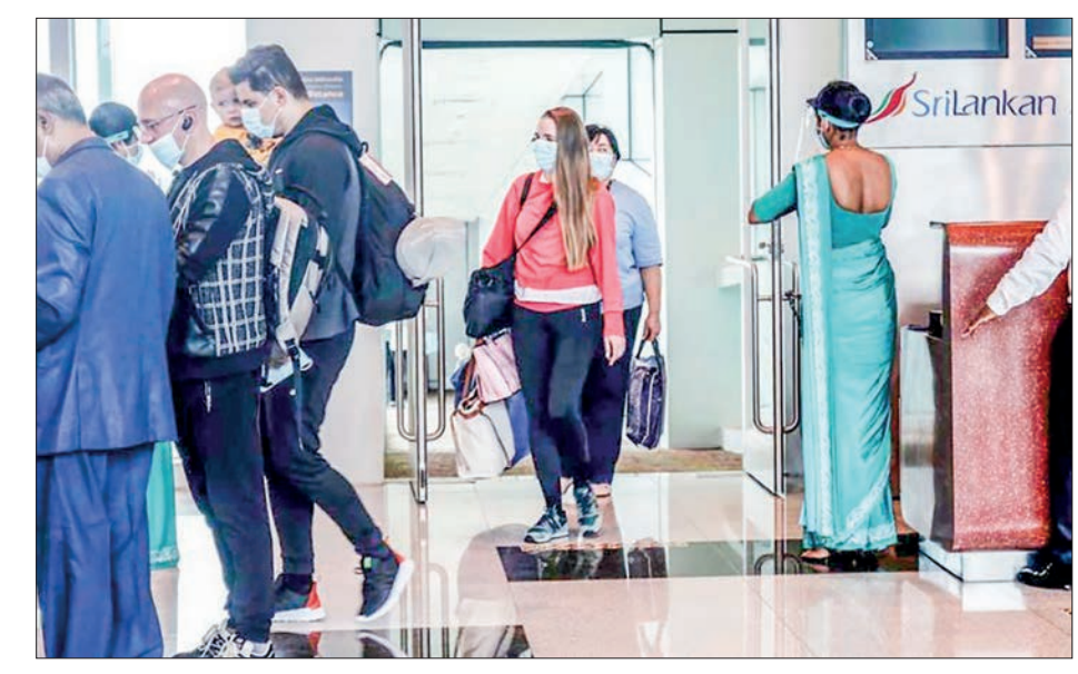
Sri Lanka earned 198.1 million dollars in March, bringing tourism earnings in the first quarter to 529.8 million dollars.

A tourism official said earlier this month that Sri Lanka's tourism industry is aiming to attract 2 million visitors in 2023, compared to the previous target of 1.5