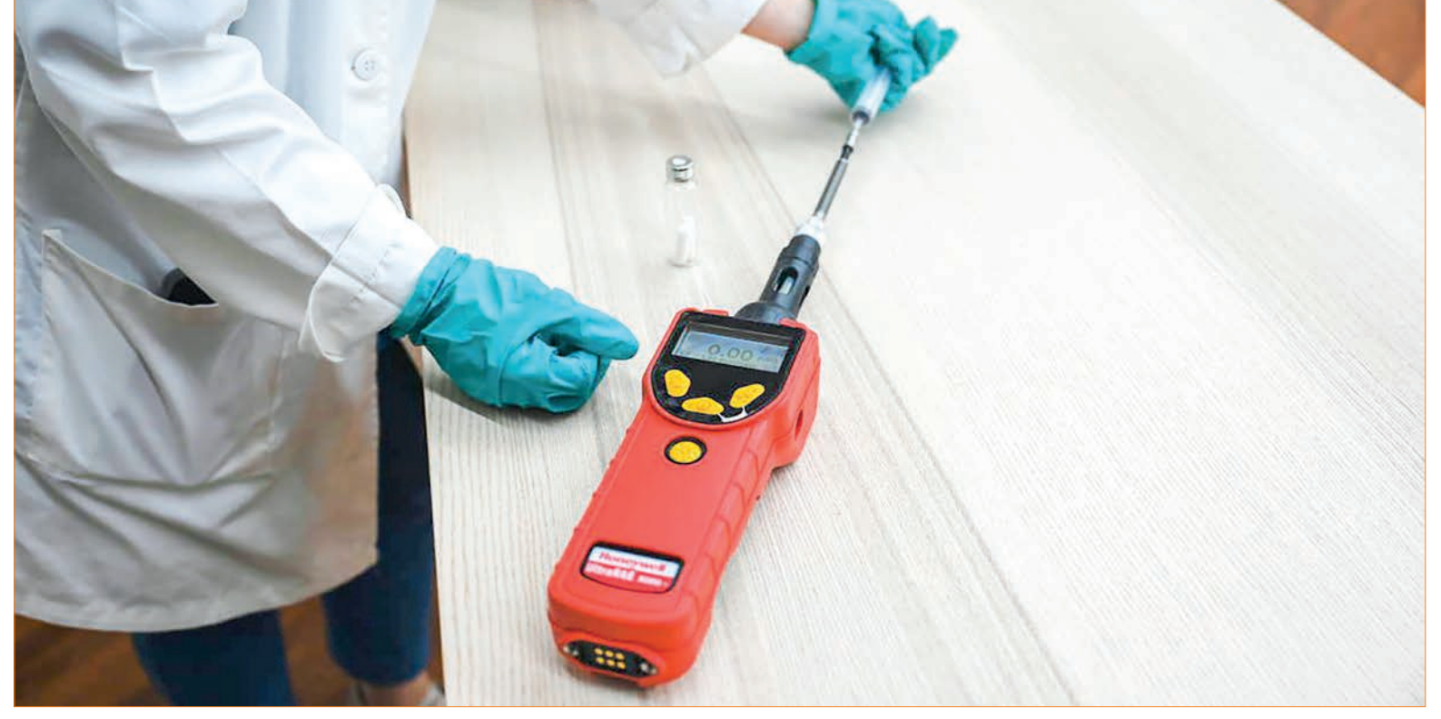
This photo taken on 1 September, 2021, shows how sweat samples are tested using a novel device that detects the COVID-19 coronavirus through specific odours, as it is being developed by Chulalongkorn University's chemistry department in Bangkok. PHOTO: FOR REPRESENTATIONAL PURPOSE