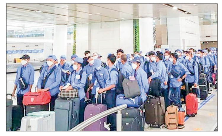
Some Myanmar workers who worked in South Korea under EPS system last year seen at Yangon International Airport.

ABOUT 280 Myanmar workers will be sent to South Korea in the last week of April, according to the Public Overseas Employment Agency (POEA).