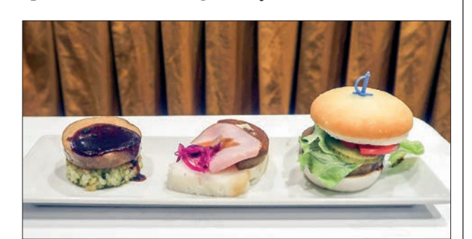
NH Foods proposes various recipes for its newly launched foie gras food alternative, made mainly from chicken liver, as seen in this photo taken 29 March 2023, in Tokyo.

Production of foie gras has recently been in decline and has been banned in several countries, including Britain, Germany and Italy, due to welfare concerns about geese and ducks, which must be force-fed to make foie gras, the French term for "fatty liver." — Kyodo