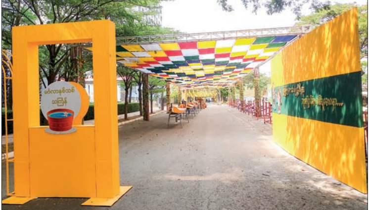
Preparations being made for holding Mingalar Mandalay Walking Thingyan festival along 26th Street between 66th and 78th Street in Mandalay.

Thingyan is held on the 73<sup>rd</sup> Street during Thingyan festival ance. The main pavilion and six to preserve Myanmar tradition-