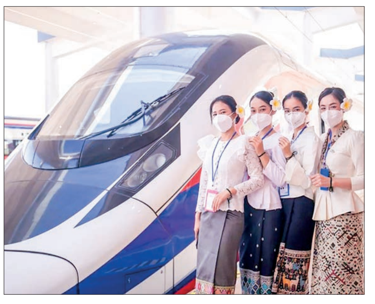
The cross-border passenger train is a great advantage for Laos because it facilitates tourist travel.

senger service between the Lao capital Vientiane and Kunming, the capital city of southwest China's Yunnan province, will be operational on 13 April ahead of the Lao New Year holiday, which falls on 14-16 April.