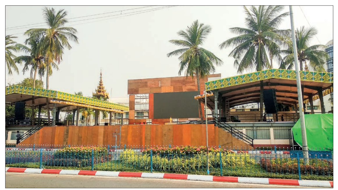
Mandalay Maha Thingyan Pavilion.

The Mingala Mandalay Myanmar Traditional Walking