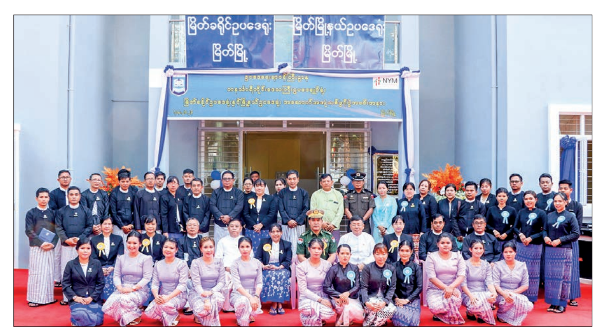
The opening ceremony of Myeik District and Township Law Office in progress on 7 April.

The Union Minister met law officers and staff in Taninthayi region, while the Regional Advocate-General explained the operations of the region. The Union Minister stressed the need for law officers to serve their duties without corruption. — MNA/KZL