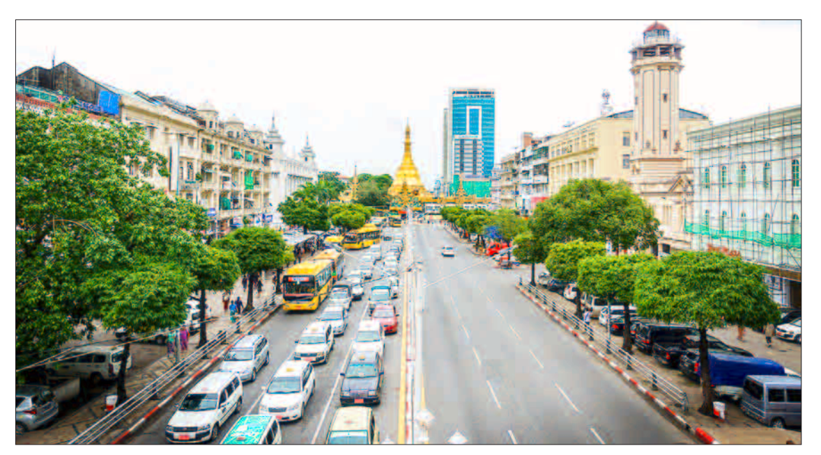
Sule Pagoda Road traffic seen on normal days.