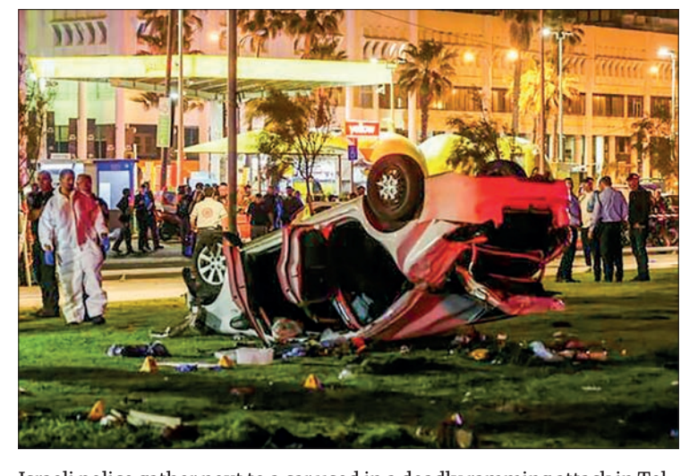
Israeli police gather next to a car used in a deadly ramming attack in Tel Aviv.

Six rockets were launched towards Israel Saturday night, with two landing in the Golan