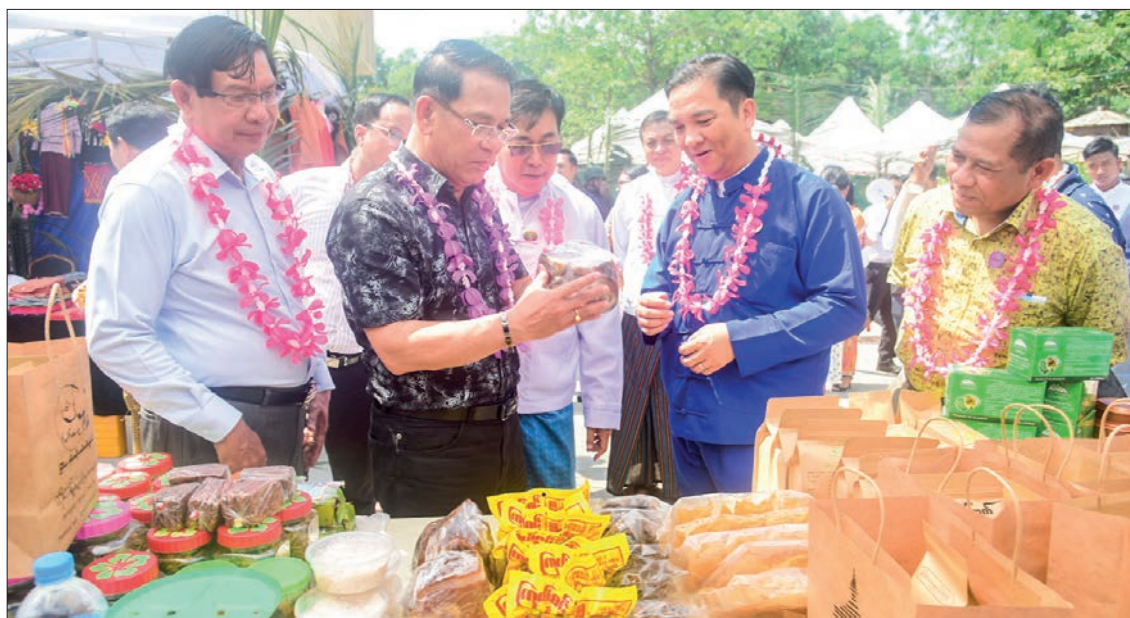
Union Minister U Maung Maung Ohn and party view round the exhibition at the event yesterday.

an achievement as the country exported rice by cooperating with 47 rice-related business persons.