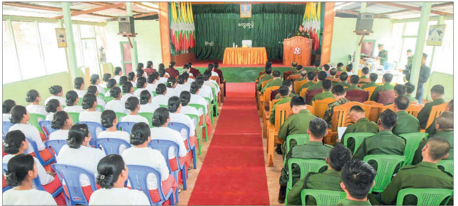
Vice-Chairman of the State Administration Council Deputy Commander-in-Chief of Defence Services Commander-in-Chief (Army) Vice-Senior General Soe Win meets Tatmadaw members and families in Mongpyin Station yesterday.

Currently, attempts are being made to break up the Tatmadaw with political, economic, social and military attacks. To emerge misunderstanding and pressures in the international