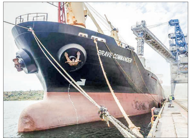
On 22 July 2022, an agreement was brokered by the United Nations and Türkiye to open a safe maritime humanitarian corridor in the Black Sea (the Black Sea Grain Initiative). Since then, over 900 ships full of grain and other foodstuffs have left three Ukrainian ports: Chornomorsk, Odesa and Yuzhny/Pivdennyi.

But in releasing its latest data tracking monthly changes in international prices of a basket of food commodities, the FAO said food remained expensive notably for developing countries highly dependent on imports. — AFP