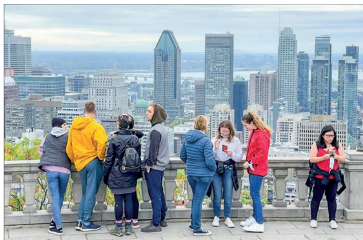
All regions of Quebec, except Centre-du-Québec, recorded employment gains between February 2022 and February 2023.