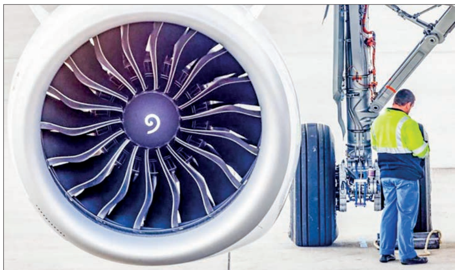
A technician works on an Airbus A321XLR. The single-aisle, narrow-body aircraft is equipped with fuel-efficient engines that allow an extra-large range of up to 4,700 nautical miles (around 8,700 kilometres).

ICELANDAIR is to buy 13 Airbus A321XLR aircraft with purchase rights for additional 12 jets as it renews its fleet, the company said.