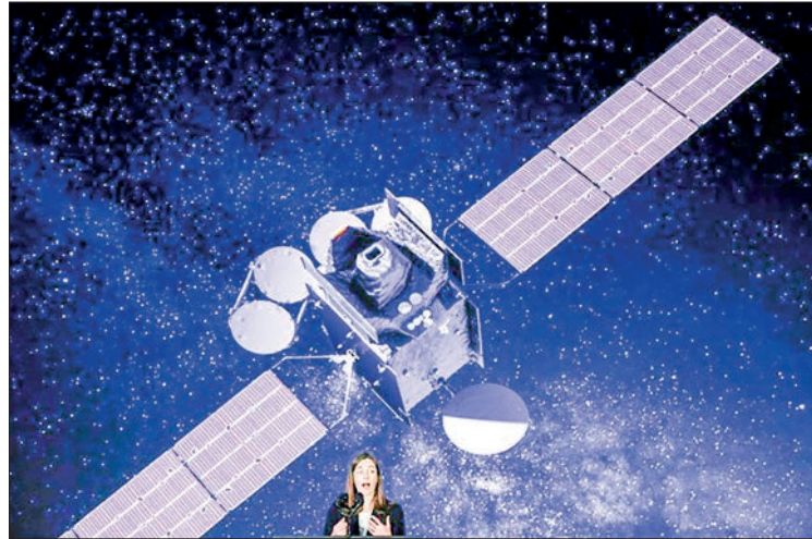
The Tropospheric Emissions Monitoring of Pollution instrument, TEMPO for short, will allow scientists to monitor air pollutants and their emission sources more extensively than ever before.

NASA device that can track air pollution over North America down to the neighbourhood level.