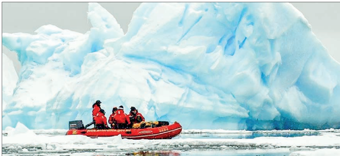
Global warming due to human-caused carbon emissions is reducing ice, raising warnings that dangerous “tipping points” could be reached, with sudden major melting driving sharp rises in sea level.

“These values far exceed all previously reported rates of grounding-line retreat across