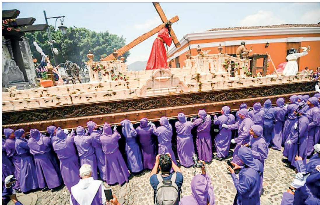
Guatemalan Catholic devotees take part in a procession in the tourist city of Antigua during Easter celebrations.

THOUSANDS of Guatemalan worshippers wearing black hoods and purple tunics funnel slowly through the streets of Antigua carrying images of Jesus over a multicolored carpet of flowers and scented sawdust as somber music rings out.