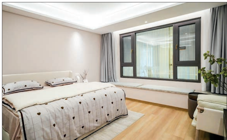
Photo shows a bedroom in a Panasonic "wellness smart town" in Yixing, Jiangsu Province, equipped with a "smart sleep" system, which moderates lighting and air conditioning to optimize sleeping conditions and facilitate natural waking on 26 February 2023.

IN a scenic eastern Chinese city some two hours from Shanghai by high-speed train, well-heeled retirees are beginning to move into a "wellness smart town" that Japan's Panasonic Holdings Corp has built with a local partner to cater to the demands of China's aging population.