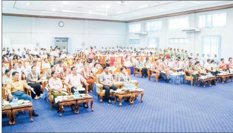
Deputy Prime Minister MoTC Union Minister Admiral Tin Aung San attends the ministry's Thingyan festival, watching Thingyan dances at the event on 7 April.

Deputy Prime Minister MoTC Union Minister Admiral Tin Aung San and his wife, the deputy ministers, permanent secretaries, senior officials, their wives, and ministry personnel participated in the festival and watched the Thingyan songs and choral dances of the ministry's family members.