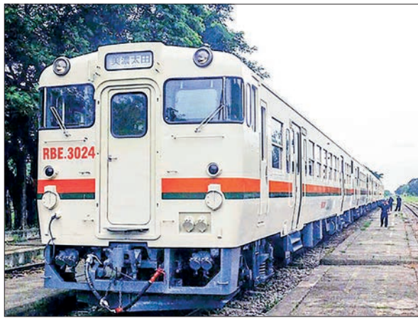
A new circular train is seen running in Yangon.

ACCORDING to Yangon Railways Station, Yangon circular trains will stop running during the Thingyan period.