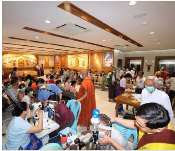
Eye patients are under treatment.

Currently, the Sitagu International Buddhist Missionary Association (SIBMA) opened 45 Sitagu Sakkudana eye hospitals in states and regions and provided eye surgical treatment for 250,000 patients. – TWA/MKKS