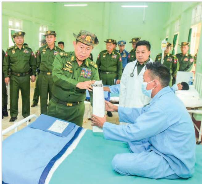
The Vice-Senior General provides foodstuff to patients.