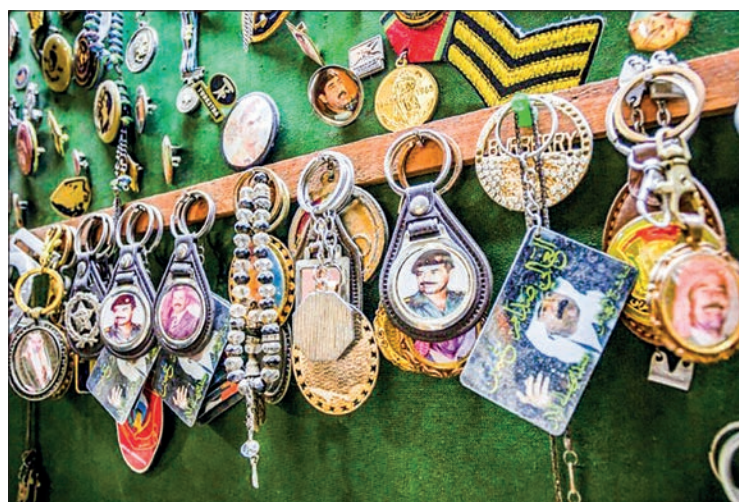
The instantly recognizable face peers out from everything from bumper stickers to mobile phone cases in Jordan, despite symbols and images associated with his rule being widely considered taboo in Iraq itself.