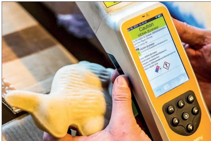
A Belgian customs officer at Brussels Airport using a Raman scanner to show that what appears to be a chocolate bunny is actually ecstasy.