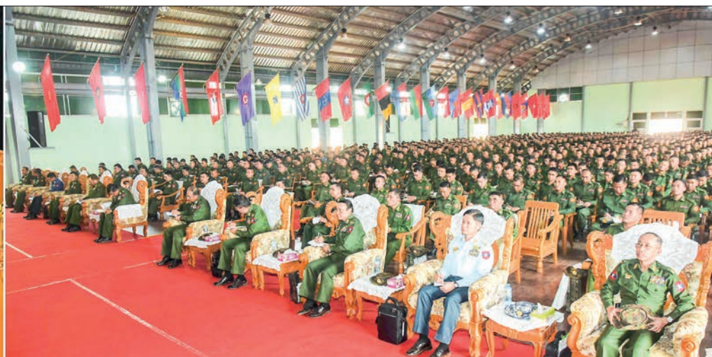
Vice-Chairman of the State Administration Council Deputy Commander-in-Chief of Defence Services Commander-in-Chief (Army) Vice-Senior General Soe Win meets instructors and trainees at the Military Computer and Technology Institute in Hopong Station yesterday.

ALL Tatmadaw members need to adjust their income and spending and they have to avoid gambling, said Vice-Chairman of the State Administration Council Deputy Commander-in-Chief of Defence Services Commander-in-Chief (Army) Vice-Senior General Soe Win at the meeting with instructors and trainees at the Military Computer and Technology Institute in Hopong Station yesterday afternoon.