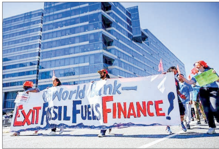
Climate activists protest outside the World Bank headquarters against fossil fuel projects during the IMF and World Bank annual meetings in Washington, DC on 14 October 2022.

particular pressure, in the wake of the resignation of chief David Malpass amid questions over his stance on climate change.