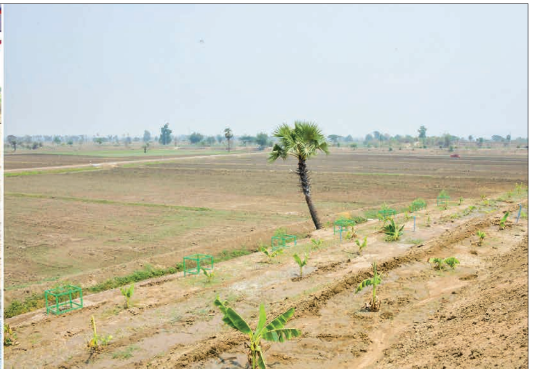
State Administration Council Chairman Prime Minister Senior General Min Aung Hlaing views the reclamation process of farmlands in Gwaybin smart village of Tatkon Township yesterday.

TATKON area can grow sunflower for Nay Pyi Taw to become an oil pot of the nation, said Chairman of the State Administration Council Prime Minister Senior General Min Aung Hlaing on his trips to inspect the temporary dam at Hsinthe Creek in Shadaw Village of Tatkon Township and solar-powered water pumping