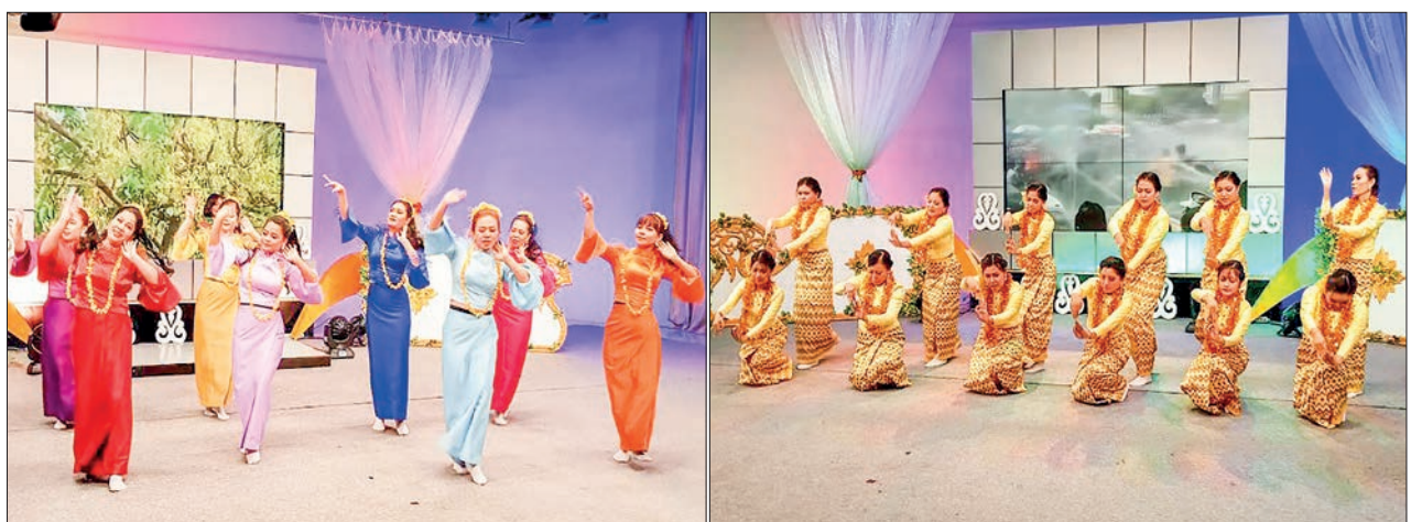
Shootings of Thingyan dance troupes are underway at MRTV in Yangon yesterday.