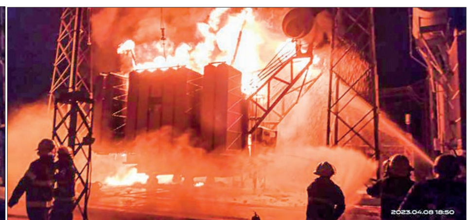
Fire Brigade members are seen struggling to extinguish the fire.