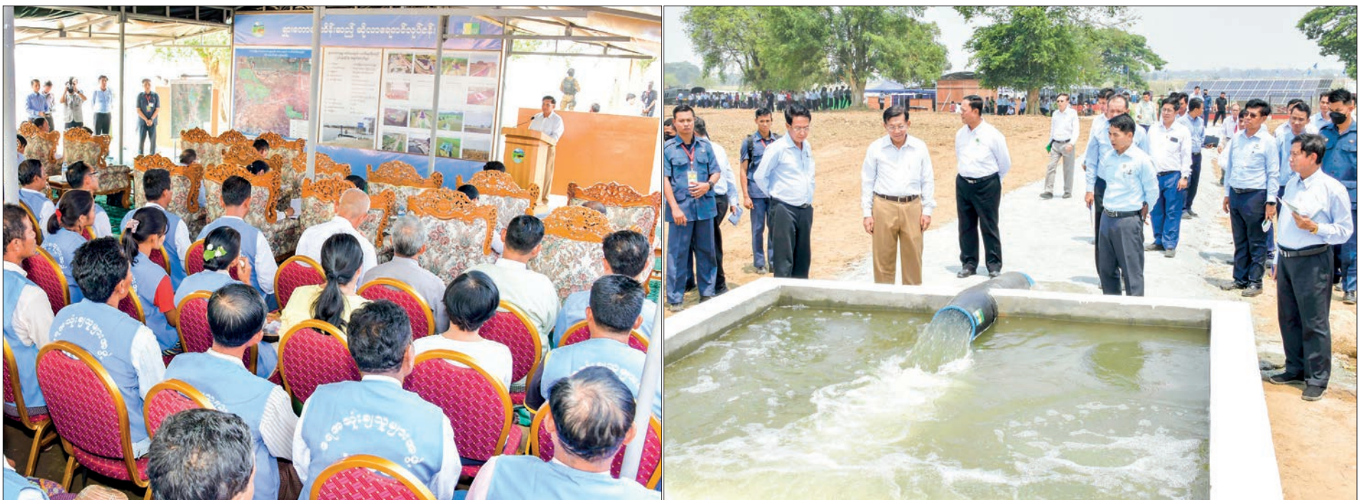
State Administration Council Chairman Prime Minister Senior General Min Aung Hlaing inspects the Shadaw solar-powered water pumping process yesterday.