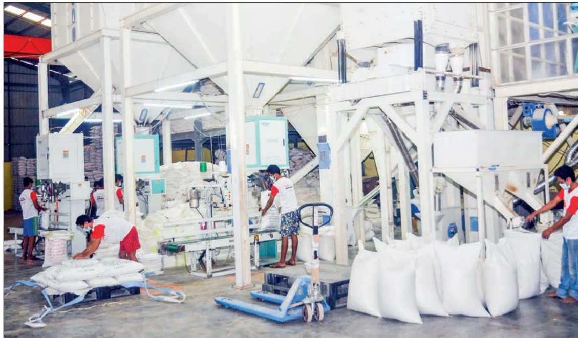
Export rice bags are seen at the rice mill.

The MITS shall submit a report once every three months to the ministry. The MITS must report unusual cases while serving the duties to the ministry to seek a decision in a timely manner and carry out the duties as per the instructions of the ministry.