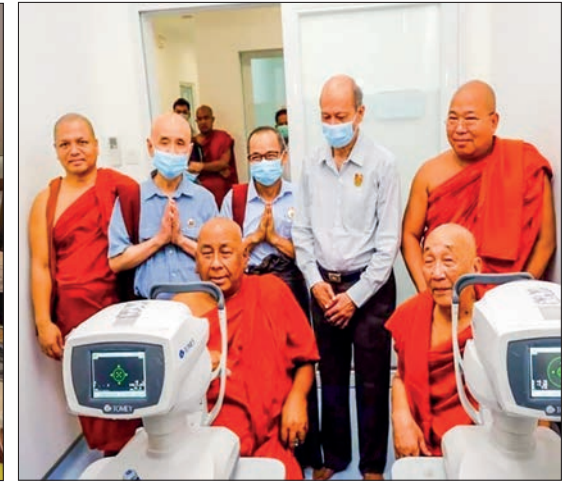
Sitagu Sayadaw seen at the Sitagu eye hospital in Yangon.