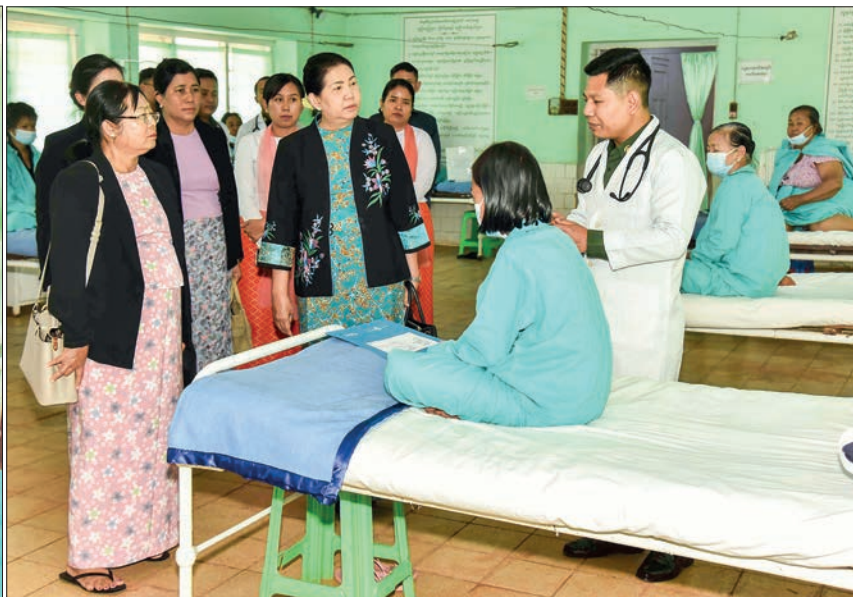
The wife of the Vice-Senior General encourages the patients.

First, the Vice-Senior General and party went to the military hospital in Bahtoo and comforted the monks, officers and other ranks, families and locals and provided them with foodstuffs.