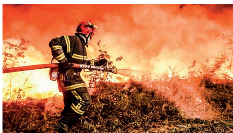
Wildfires, which are fires that occur in wildlands such as forests and grasslands, play an important role in the global carbon cycle.

day” glacier could retreat at a similarly quick rate under current climate conditions. — AFP