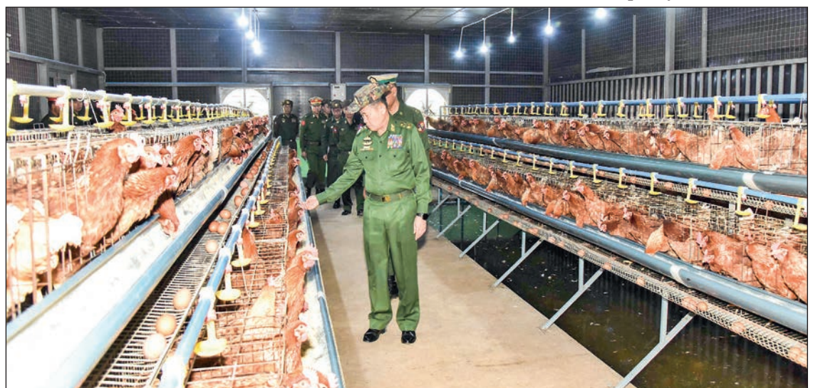
The Vice-Senior General views round the Paungsee Farm.

During the inspection, he instructed them to carry out agriculture and livestock farming successfully, to sell the products at fairer prices to the military units, government employees