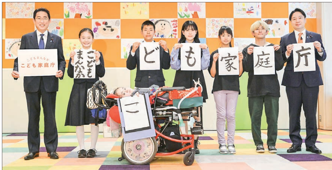
Japanese Prime Minister Fumio Kishida (far L) and others hold signs and letters spelling out "The Children and Families Agency" to commemorate its launch in Tokyo on 3 April 2023.

To reverse the trend of the declining birthrate in the rapidly aging country, the government in April launched the Children and Families Agency to oversee child policies, also including child abuse and poverty. — Kyodo