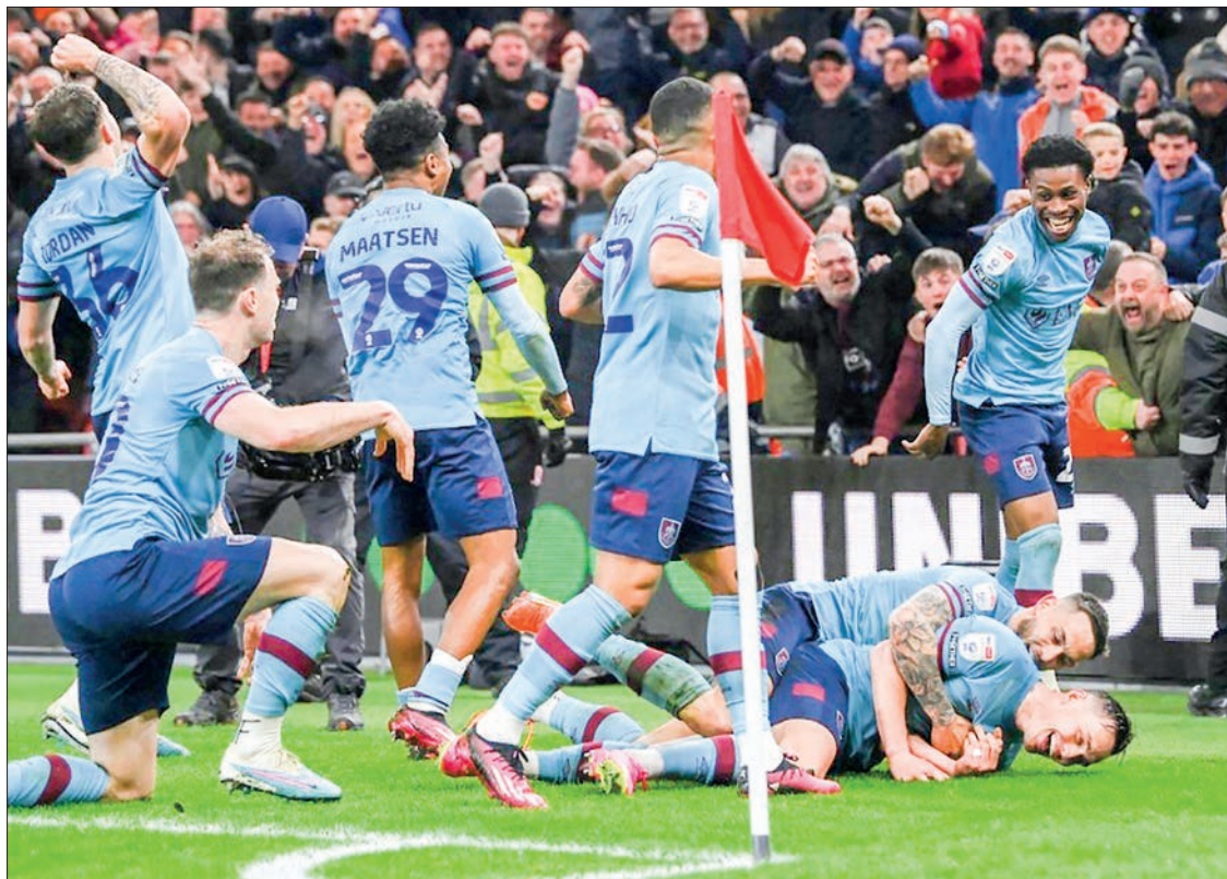
Burnley celebrate their second goal in front of the Boro crowd.

BURNLEY secured promotion back to the Premier League at the first time of asking after Vincent Kompany's men won 2-1 at Middlesbrough on Friday.