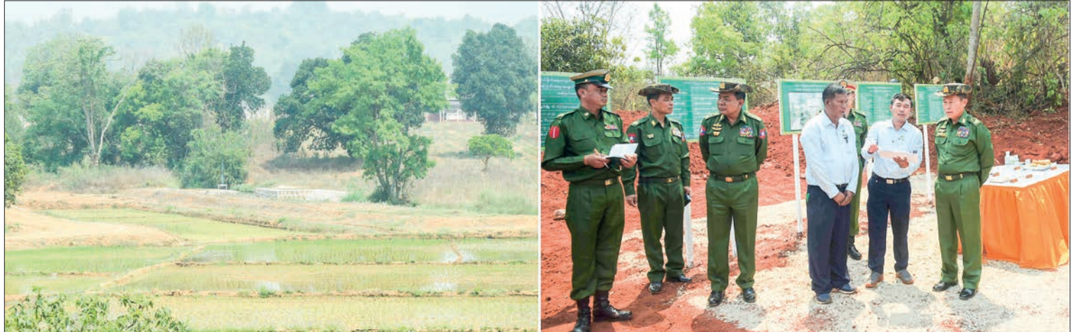
State Administration Council Vice-Chair Deputy Commander-in-Chief of Defence Services C-in-C (Army) Vice-Senior General Soe Win views the irrigation and potato cultivation in Bahtoo yesterday.