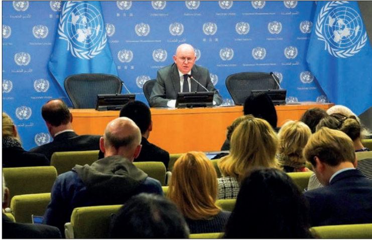
Russian Ambassador to the United Nations Vassily Nebenzia, president of the Security Council for the month of April, speaks at a press conference on 3 April 2023 at the United Nations in New York.

RUSSIAN ambassador to the United Nations Vassily Nebenzia on Monday defended his country's rotating presidency of the Security Council for the month of April.