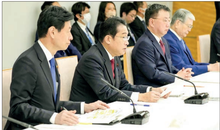
Prime Minister Fumio Kishida (2nd from L) attends a meeting with relevant ministers at his office in Tokyo on 4 April 2023 to discuss revisions to the country's Basic Hydrogen Strategy.

JAPAN plans to increase its supply of hydrogen sixfold from the current level to around 12 million tonnes by 2040 in an effort to spur use of renewable energy, a draft revision to its resource