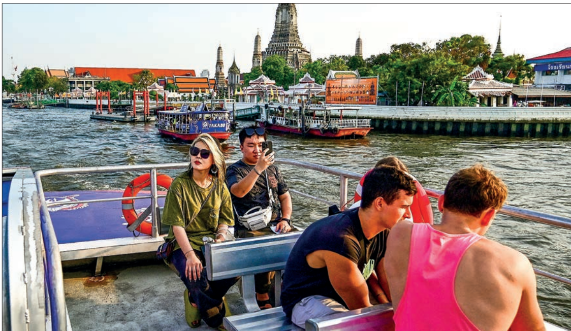
This photo taken on 17 March 2023 shows the Wat Arun Buddhist temple in the background as tourists ride a Hop-on Hop-off cruise boat along the Chao Phraya river in Bangkok. PHOTO: AFP

China, the world’s second-largest economy, accounts for about half of the region’s growth. It began to emerge in December from a strict zero-Covid strategy that hampered economic activity. — AFP