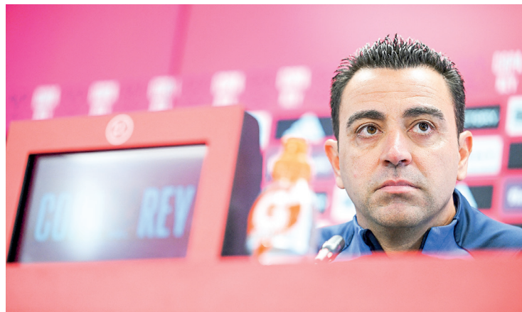
Barcelona's Spanish coach Xavi addresses a press conference following a training session at the Joan Gamper training ground in Sant Joan Despi, on 4 April 2023, on the eve of the Spanish Cup semi-final football match against Real Madrid.

"We were better in the league game and in the Super