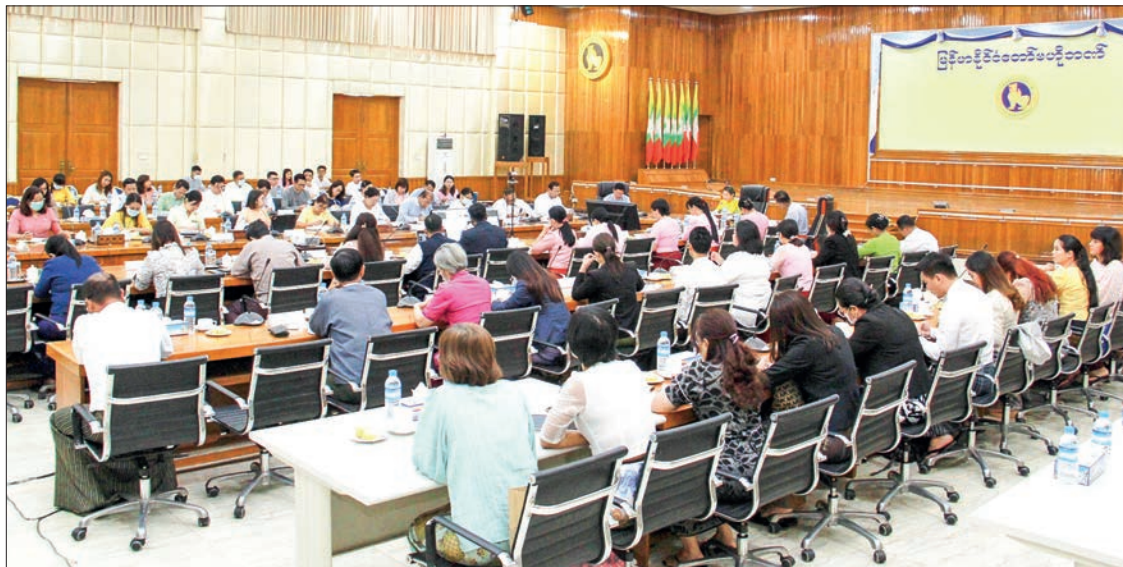
The meeting on procedures to implement Rupee-Kyat direct payments for India-Myanmar trade in Progress.

Then, CBM Governor Daw Than Than Swe said it will take into account the fact of the Rupee/Kyat direct payment system for normal trade in addition to border trade and the importers and exporters will be informed as soon as the instructions and approval of banking system are received, and she concluded the meeting.—MNA/KTZH