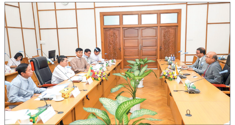
Union Minister U Min Naung receives the Indian ambassador in Nay Pyi Taw yesterday.

The meeting was attended by Deputy Minister Dr Tin Htut and responsible officials.—MNA/TS