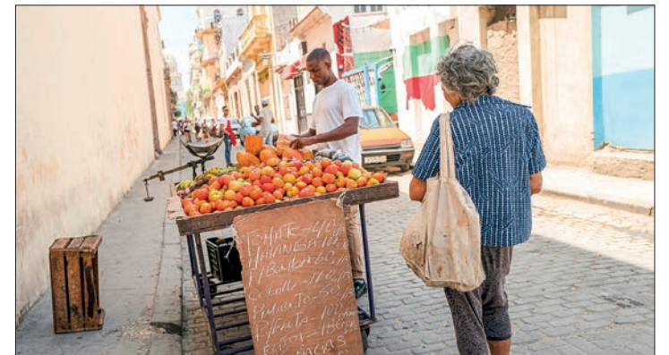
An elderly woman check prices of food products, 31 March 2023, in Havana, Cuba, one of the Latin American countries facing the highest inflation, will participate in a teleconference next week with the presidents of Mexico, Colombia, Brazil, and Argentina to adopt common strategies. PHOTO: AFP

“Real inflation in 2022 exceeded 200 per cent, one of the highest in the world,” Vidal said, citing his own calculations. — AFP