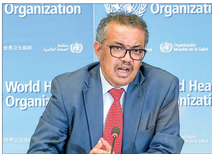
A TV grab taken from a video released by the World Health Organization (WHO) shows WHO Chief Tedros Adhanom Ghebreyesus attending a virtual news briefing on COVID-19 (novel coronavirus) from the WHO headquarters in Geneva on 6 April 2020.

AROUND one in every six adults experiences infertility, the World Health Organization estimated Tuesday as it called for an urgent increase in access to fertility care.