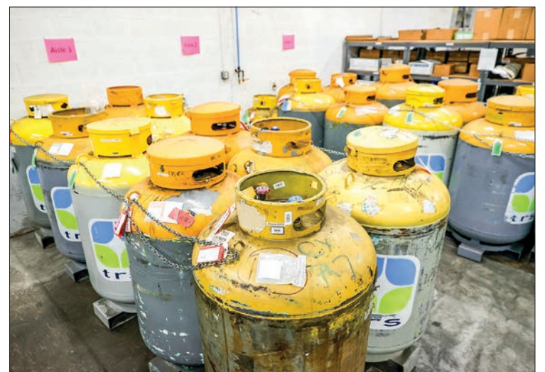
Refrigerant tanks sit at the Tradewater Refrigerant Solutions Warehouse in Elk Grove Village, Illinois, on 11 August 2021.

The study analysed five CFCs with no or few current uses, beginning at the point of their total global phase-out in 2010. In 2020 all five gases were at their highest abundance since direct measurements began.—AFP