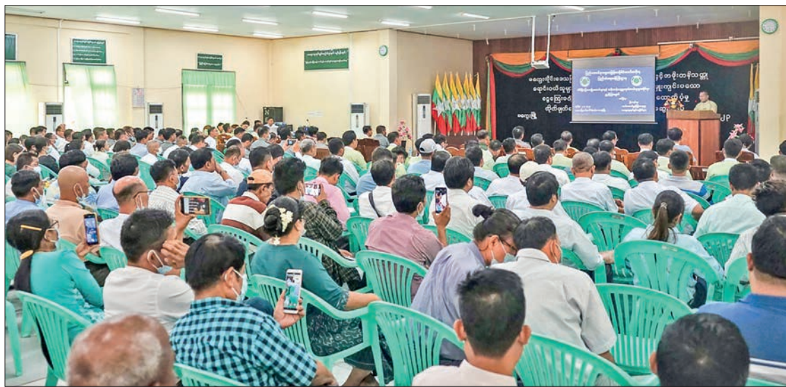
The Anti-Money Laundering and Counter-Financing of Terrorism workshop in progress.

UNDER the sponsorship of the supervisory group of regional real estate agents and precious metal dealers, an awareness-raising workshop on Anti-Money Laundering and Counter-Financing of Terrorism was held at the meeting hall of the Magway Region General Administration Department yesterday morning.