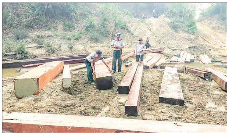
Officials check confiscated illegal timbers in Bago Region.

THE Mon State Illegal Trade Eradication Task Force made inspections at the Mawlamyine railway station on 23 March and confiscated various sizes of car tyres worth K32,848,000 without official documents from freight trains. The action was taken under Customs procedures.