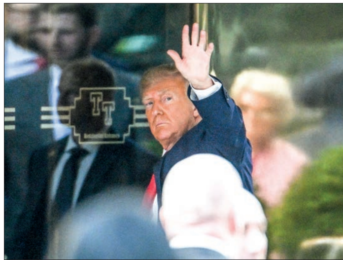
Former US president Donald Trump arrives at Trump Tower in New York on 3 April 2023.

"I can't get a fair trial in New York!" fumed Donald Trump when he learned he was being indicted by a Manhattan grand jury, as though he knew his