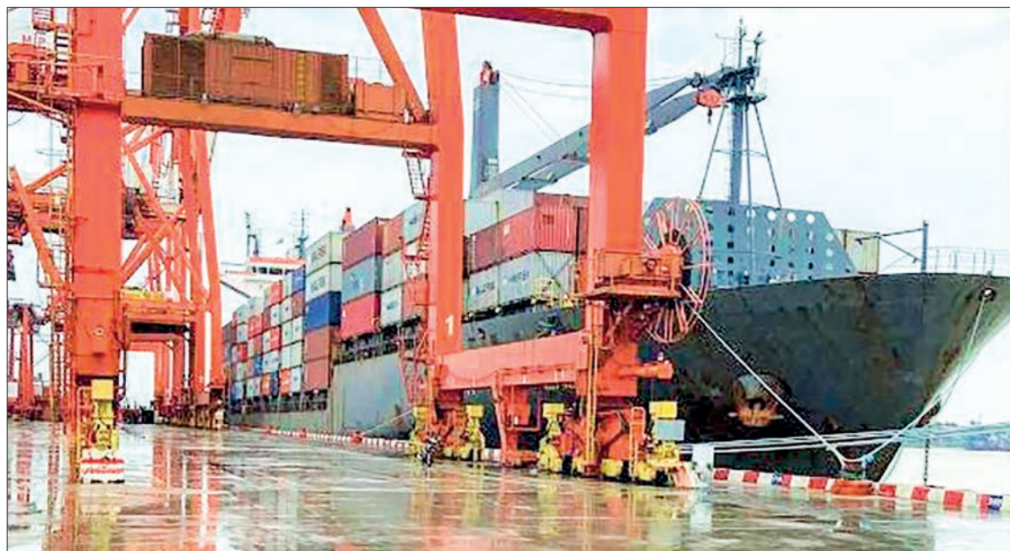
One container vessel is seen berthing alongside the Yangon Port.

fect starting on 1 April. It is an amendment of directive 51/2020 dated 8 July 2020. Similarly, directive 32/2022 dated 2 May 2022 was cancelled with this amendment incorporated.