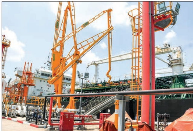
Overseas-going tankers with fuel oils onboard are seen berthing alongside Thilawa Port.