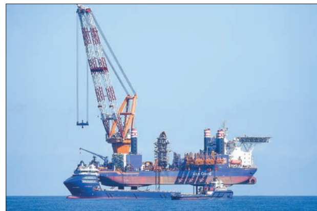
A photograph taken on 17 March 2022 in the Bay of Saint-Brieuc, western France, shows the drilling platform ship "Aeolus", on the sidelines of a protest of fishermen against the planned construction of 62 wind turbines offshore the bay.

The rally marked the biggest daily gain for WTI since 12 April 2022, and the best daily performance for Brent since 21 March 2022, according to Dow Jones