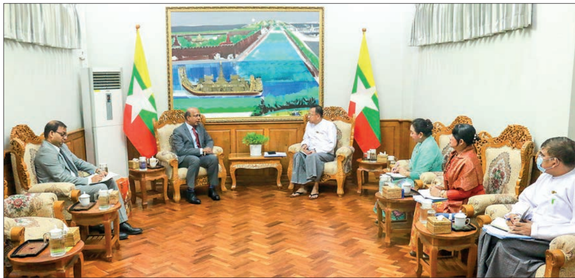
The Indian ambassador calls on MIFER Union Minister Dr Kan Zaw yesterday.

The deputy minister for Investment and Foreign Economic Relations and senior officials were also present at the meeting.—MNA