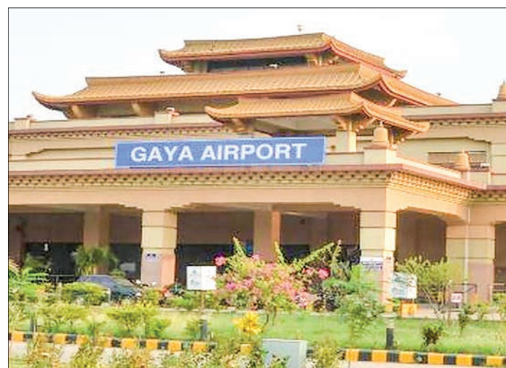
The Gaya Airport in Bihar, India.

ON 3 April, the Myanmar Embassy in New Delhi urged those visiting India for various reasons to officially declare the amount of US dollars on arrival.