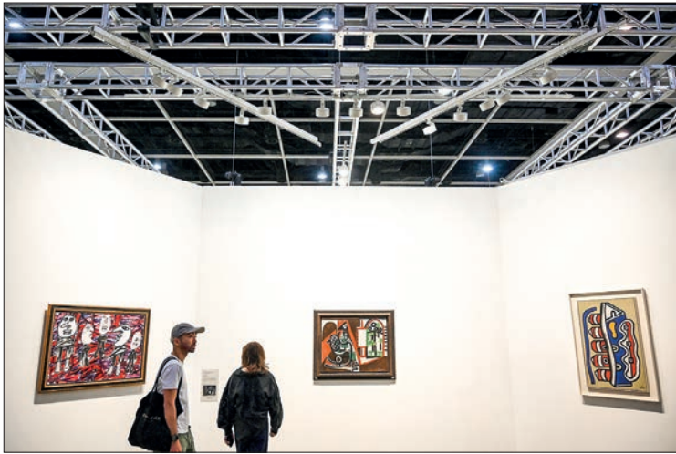
Visitors look at artwork at Art Basel in Hong Kong on 23 March 2023.

THE art market rose slightly to $67.8 billion last year despite an uncertain global climate, thanks to high-end and digital sales, an annual report said on Tuesday.