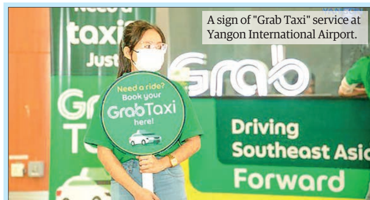
A sign of "Grab Taxi" service at Yangon International Airport.

It is stated in the notice that Myanmar pilgrims to Bodh Gaya and those coming to India for medical treatment should use the money they brought only after making an official declaration since there are investigations about the possession of US dollars, seizure of foreign currency and arrest proceedings by immigration authorities at the Gaya Airport. — TWA/CT