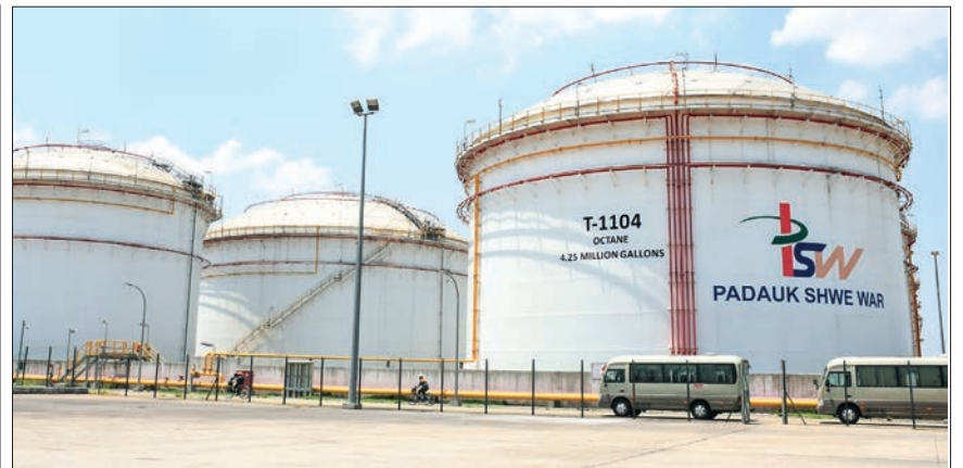
Fuel oil storage silos are pictured at Thilawa Port.

and 2,978,945 gallons of premium. We have enough fuel for 30 days except for 97. Another 13 ships will arrive here within 15 days of April. It will be 218,014 tonnes and 60,837,308 gallons. It will arrive here within 15 days. On 5 April, we will have 16,000 tonnes which is 4,793,920 gallons and three ships will dock within the next five days.