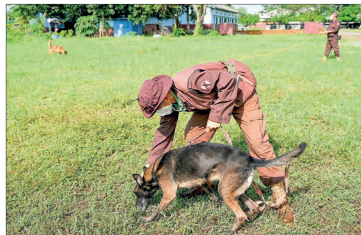
This photo taken on 27 September 2021 shows trainers training dogs at the Cambodian Mine Action Centre (CMAC) in Kampong Chhnang province, where Cambodia's anti-landmine authorities are training dogs to detect the Covid-19 coronavirus in people carrying the virus.