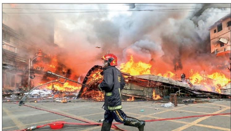
A firefighter runs to extinguish a fire that broke out in a clothing market in Dhaka on 4 April 2023.

HUNDREDS of Bangladeshi firefighters battled an inferno that raged through a popular clothing market in the capital Dhaka on Tuesday and blanketed the city's oldest neighbourhoods in black smoke.