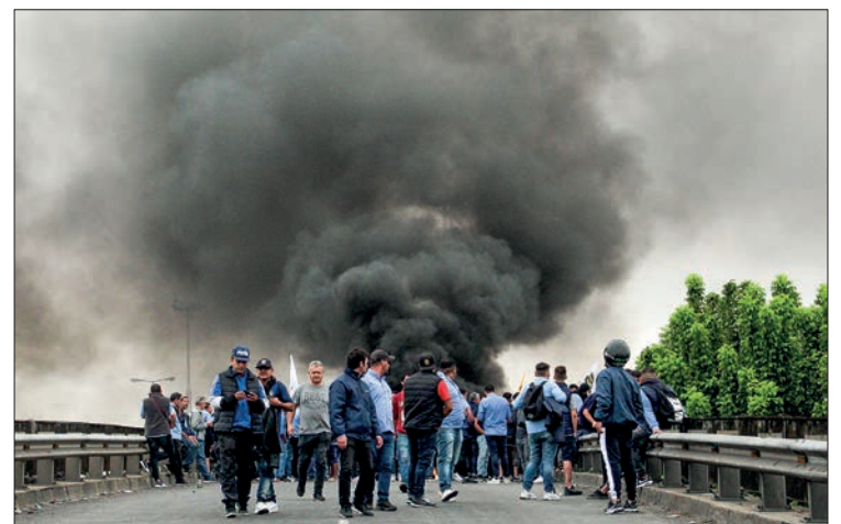
A group of bus drivers protest the murder of a colleague in La Matanza, on the western outskirts of Buenos Aires on 3 April 2023.