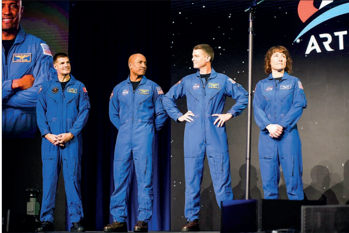
(L-R) Astronauts Jeremy Hansen, Victor Glover, Reid Wiseman and Christina Hammock Koch stand onstage after being selected for the Artemis II mission who will venture around the Moon during a news conference held by NASA and CSA at Ellington airport in Houston, Texas, on 3 April 2023. Travelling aboard NASA's Orion spacecraft during Artemis II, the mission is the first crewed flight test on the agency's path to establishing a long-term scientific and human presence on the lunar surface.

NASA unveiled the crew on Monday for its first human mission to the Moon in more than 50 years – including the first woman and Black man to voyage into deep space.