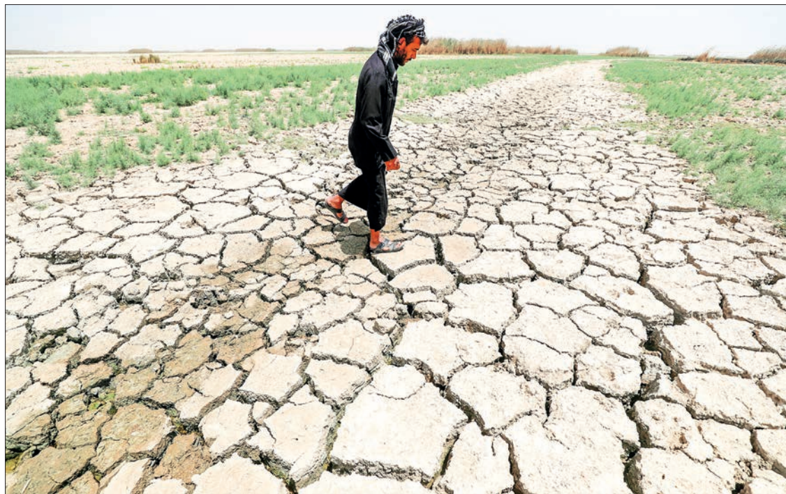
A man walks on cracked and dried up soil in the Hawiza marsh near the city of al-Amarah in southern Iraq on 27 July 2022.

In the highest-emissions scenario without cuts, around 123 people per 100,000 in the region would die per year from