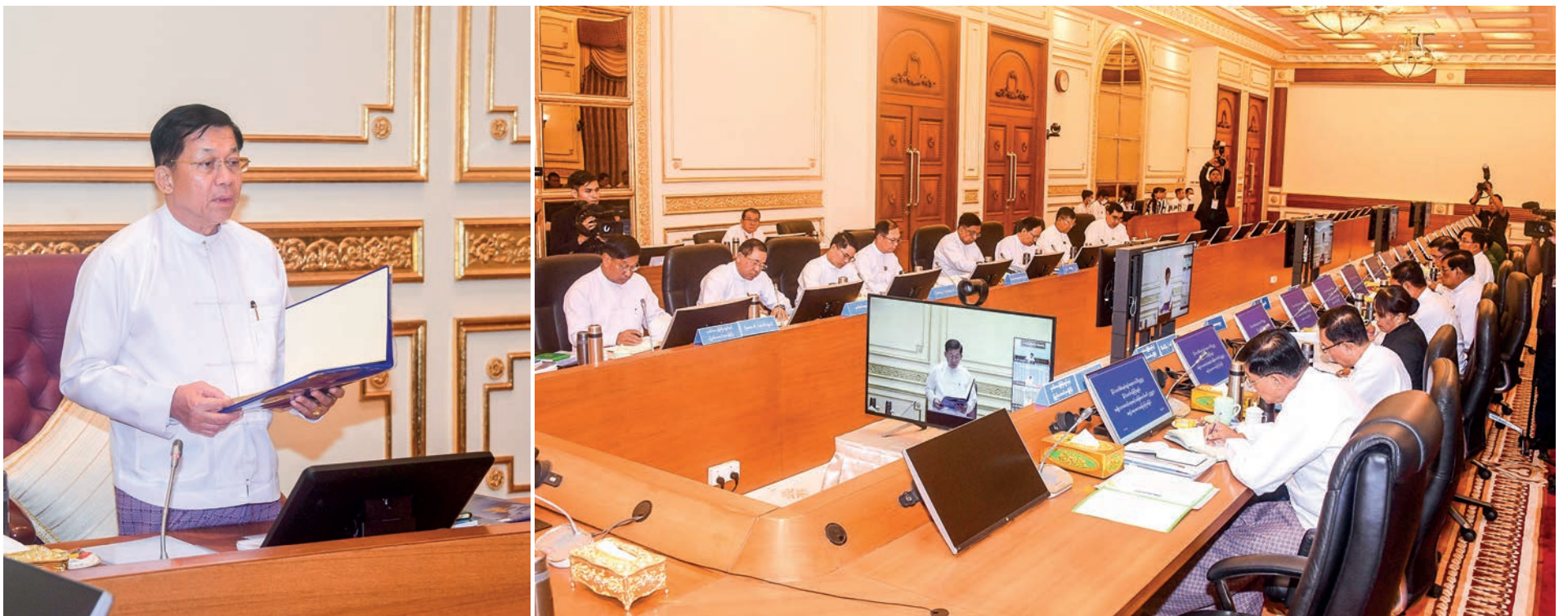
State Administration Council Chairman Prime Minister Senior General Min Aung Hlaing addresses the meeting 1/2023 of the National Water Resource Committee in Nay Pyi Taw on 4 April 2023.

M YANMAR still uses five per cent of fresh-water although four main arteries flow along the country with more than 800 million acre-feet of freshwater yearly, said Chairman of National Water Resource Committee Chairman of the State Administration Council Prime Minister Senior General Min Aung