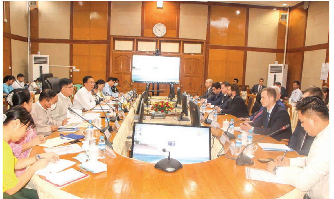
Deputy Prime Minister Union Minister U Win Shein holds talks with the delegation of the Fund RC-Investments from the Russian Federation yesterday.

The meeting was also attended by Deputy Ministers U Maung Maung Win and Daw Than Than Lin, departmental heads and officials from the Ministry of Planning and Finance. — MNA/TS