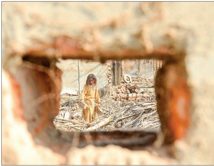
A flood-affected girl collects bricks from the debris of her damaged house in the flood-hit area of Dera Allah Yar in Jaffarabad district of Balochistan province on 9 January 2023.

DIPLOMATS from nearly 200 nations and top climate scientists began a week-long huddle in Switzerland on Monday to distil nearly a decade of published science into a 20-odd-page warning about the existential danger of global warming and what to do about it.