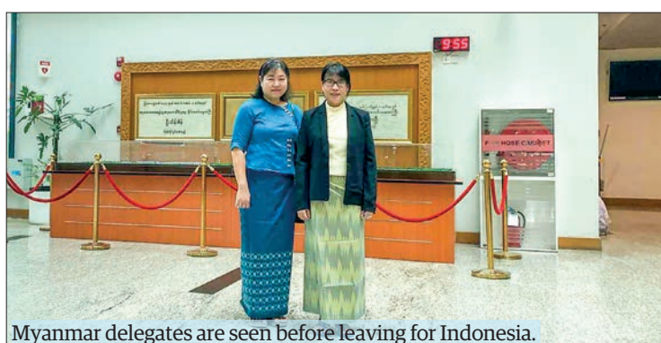
Myanmar delegates are seen before leaving for Indonesia.

In the meeting, they will exchange experiences on the integration of public health, animal health and environmental health with a one health approach, and