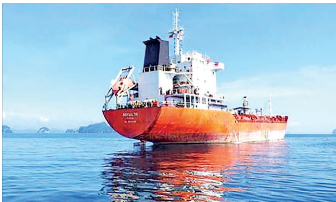
A vessel is seen carrying palm oil to Thilawa port.

On 8 March, 10,326 tonnes of oil entered the Thilawa port and 5,500 tonnes of oil entered the Hteedan port in Kyimyindine Township. According to the information that the wholesale price will drop from over K7,000 to K6,000 per viss, the palm oil was sold at K6,050 per viss in the Yangon oil market. However, it is reported that only a few outlets sell at the above price. — TWA/CT