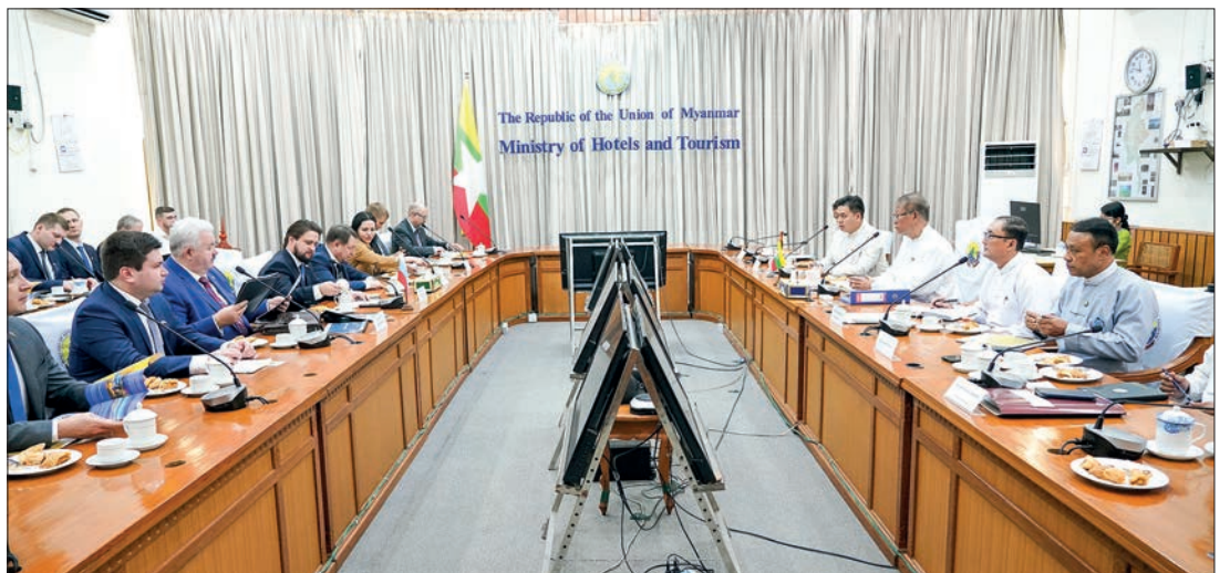
Union Minister U Aung Thaw meets the Russian delegation of Fund RC-Investments yesterday.