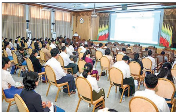
The picture shows a hybrid meeting regarding coming into effect of the Trademark Law at the Ministry of Commerce on 28 February 2023.

Myanmar is a member of the World Trade Organization and World Intellectual Property Organization. — TWA/EM