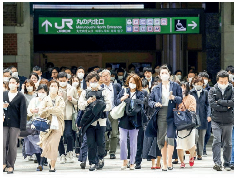
People walk in front of JR Tokyo Station on 13 March 2023 with many still wearing masks even after the government eased its guidelines on mask-wearing the same day. PHOTO: KYODO

Although mask-wearing has never been legally mandated in Japan, the government had recommended wearing masks indoors while not suggesting doing so outdoors. But most of the Japanese public wore them regardless of whether they were indoors or outdoors. — Kyodo