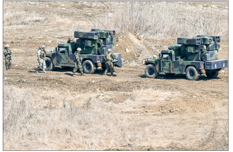
US soldiers walk past military vehicles at a military training field in the border city of Yeoncheon on 13 March 2023.