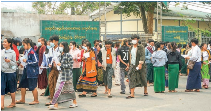
Taunggyi Township in southern Shan State.

There are five foreign exam centres and 838 local exam centres. Of 135,592 applicants, a total of 122,568 students took the Chemistry subject exam, accounting for 90.39 per cent. — MNA/MKKS