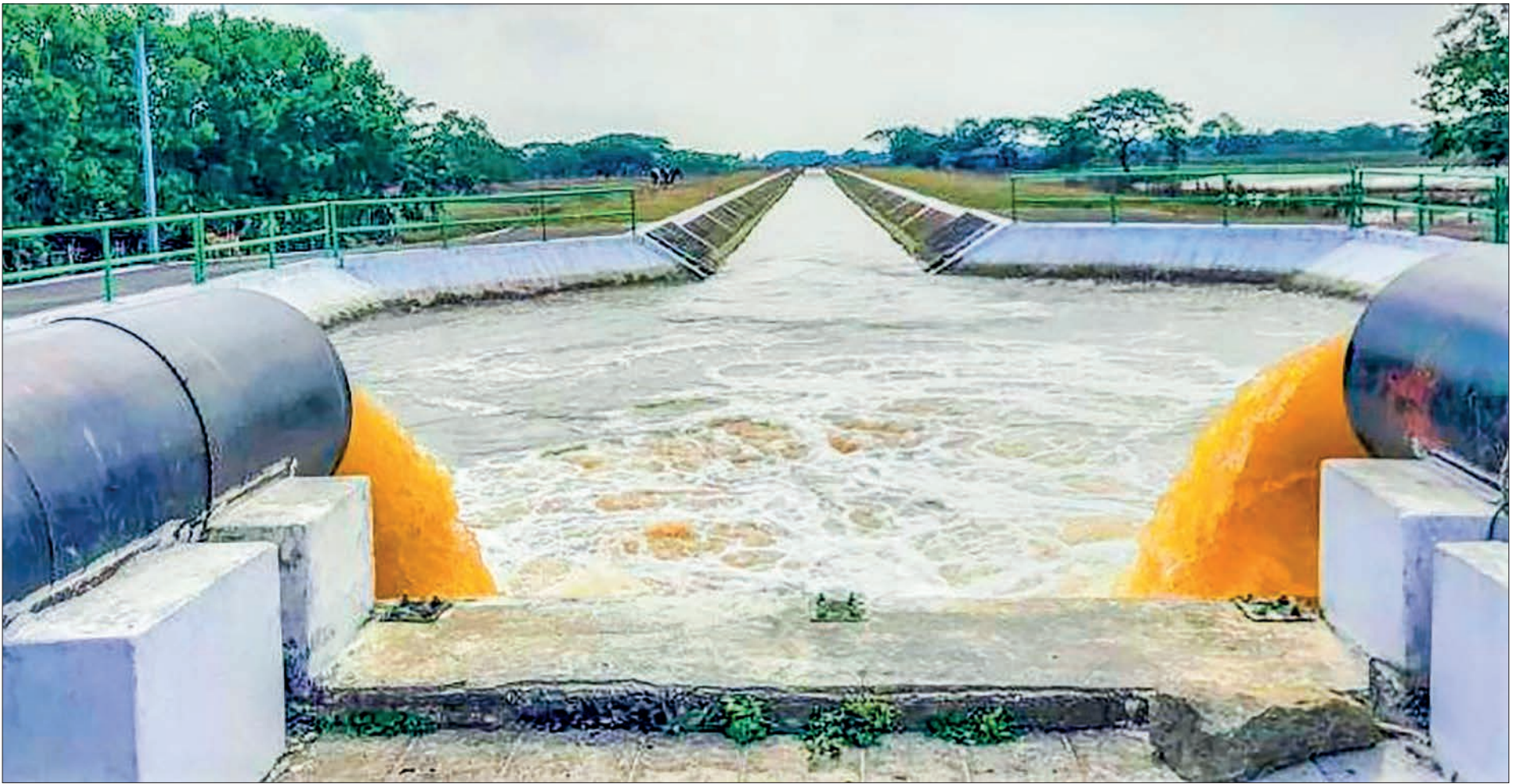
General view of the river water pumping project in Yangon Region.

T HE Irrigation and Water Utilization Management Department (Water Resource) provides water to the agricultural sector of Yangon Region with the river water pumping projects under the guidance of the Prime Minister.