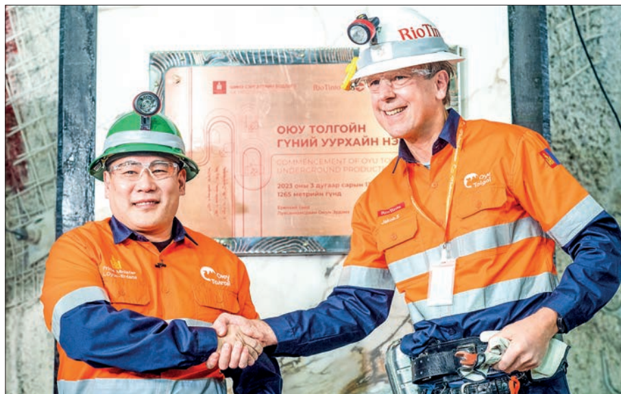
Mongolia's Prime Minister Luvsannamsrai Oyun-Erdene (L) shakes hands with CEO of Rio Tinto Group Jakob Stausholm at the Oyu Tolgoi copper mine in Khanbogd, Ömnögovı Province, in southern Mongolia.

THE underground production of the Oyu Tolgoi copper-gold mining project in the southern Mongolian province of Umnugovi started Monday.