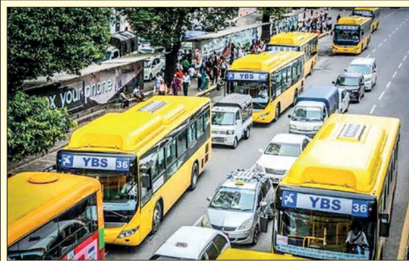
YBS buses are pictured in the centre of Yangon city.