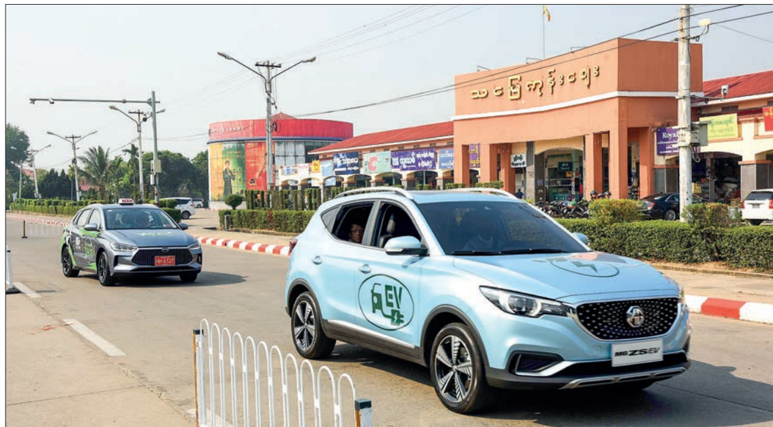
Imported battery electric vehicles are seen in front of the Thabyaygon Market in Nay Pyi Taw.

On 3 March, a fleet of 30 Dongfeng EVs imported by Asia Pacific Automaker Corporation Co Ltd arrived at the Muse 105th Mile trade zone in northern Shan State. They are allowed to be withdrawn as per rules and regulations. Furthermore, 19 EVs (BYD) imported by Earth Renewable Energy Co Ltd also arrived at the Hteedan