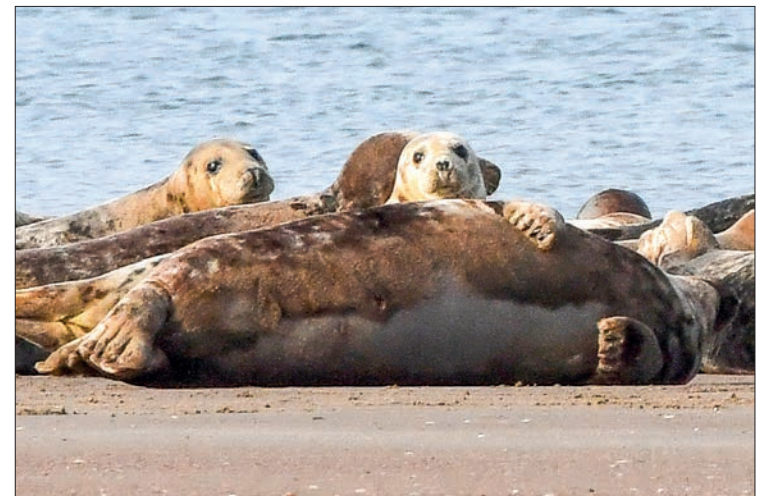
This picture taken on 21 February 2021 shows gray seals and sea calves lying on a beach near Calais, northern France.

Pete and Jan Bevington — who run the sanctuary at Hillswick, a village north of Shetland's main town, Lerwick