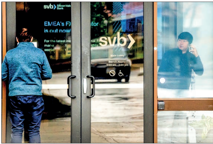
(FILES) In this file photo taken on 10 March 2023, a customer (L) reads a notice about Silicon Valley Bank's closure at the bank's headquarters in Santa Clara, California.