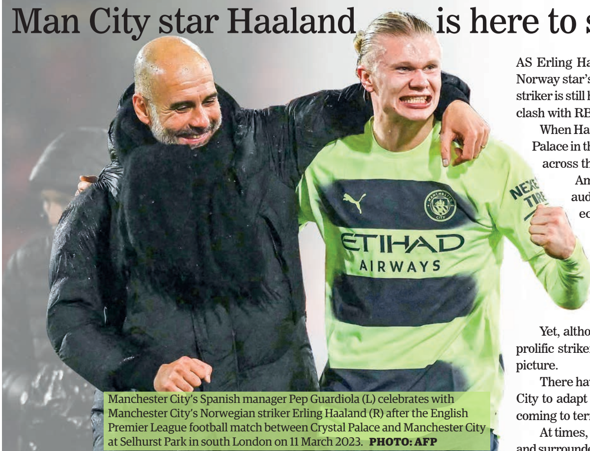
Manchester City's Spanish manager Pep Guardiola (L) celebrates with Manchester City's Norwegian striker Erling Haaland (R) after the English Premier League football match between Crystal Palace and Manchester City at Selhurst Park in south London on 11 March 2023.

AS Erling Haaland was mobbed by his Manchester City team-mates, the Norway star's broad grin gave Pep Guardiola renewed belief that his coveted striker is still happy at the club ahead of Tuesday's decisive Champions League clash with RB Leipzig.