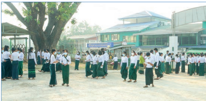
Loikaw, Kayah State.