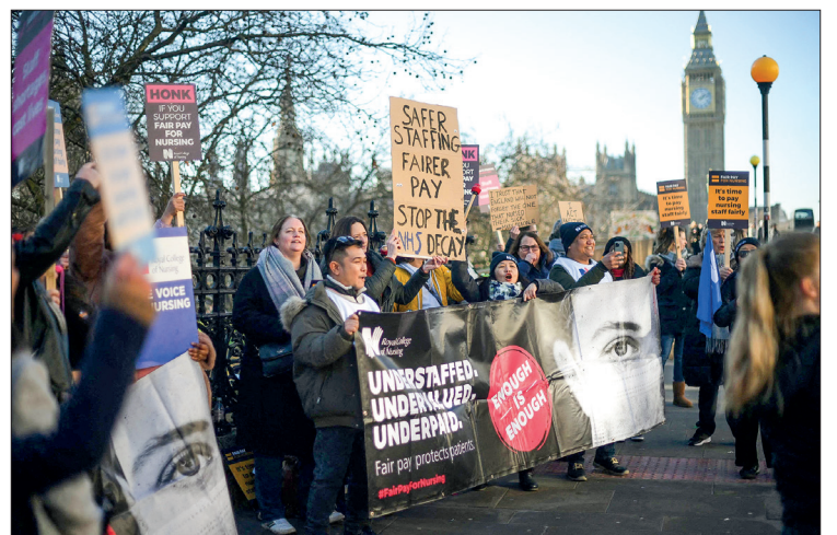
Healthcare workers hold placards at a picket line outside St Thomas' Hospital in London on 6 February 2023 as the UK faced the biggest round of health service strikes. PHOTO: AFP

They have all clashed with the government, which insists the country cannot afford inflation-busting pay hikes. — AFP