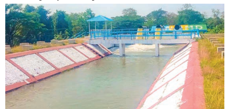
One of the river water pumping projects in Yangon Region.

For drinking water for Yangon, the Hlaing River-Hlawga water supply project and the Kankalay river water pumping project in Hmawby Township distributes 40 million gallons of water to the water pumping plant of Yangon City Development Committee. Currently, a total of 26 river water pumping projects supply water to 27,818 acres of farmlands in Yangon Region. — Nyein Thu (MNA)/KTZH