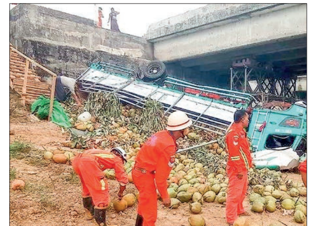
A scene of the accident is seen in the picture.

The truck driver and an extra hand sustained injuries and were taken to Bago People's Hospital. — TWA/CT