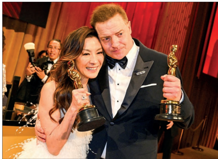
Malaysian actress Michelle Yeoh (L), winner of the Oscar for Best Actress in a Leading Role for “Everything Everywhere All at Once” and US actor Brendan Fraser (R), winner of the Oscar for Best Actor in a Leading Role for “The Whale”, attend the 95 th Annual Academy Awards Governors Ball in Hollywood, California on 12 March 2023.

Best supporting actress Jamie Lee Curtis paid tribute to her parents Tony Curtis and Janet Leigh, both Oscar-nominated actors who never won.