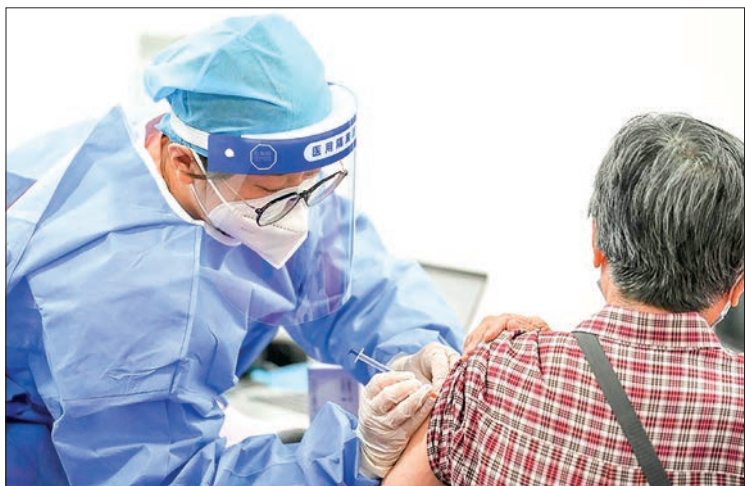
A medical worker injects a booster shot of COVID-19 vaccine for a resident at Aoyuncun Subdistrict in Chaoyang District, Beijing, capital of China, 13 July 2022.

CHINESE Premier Li Qiang said Monday that China's COVID-19 response strategies and meas-