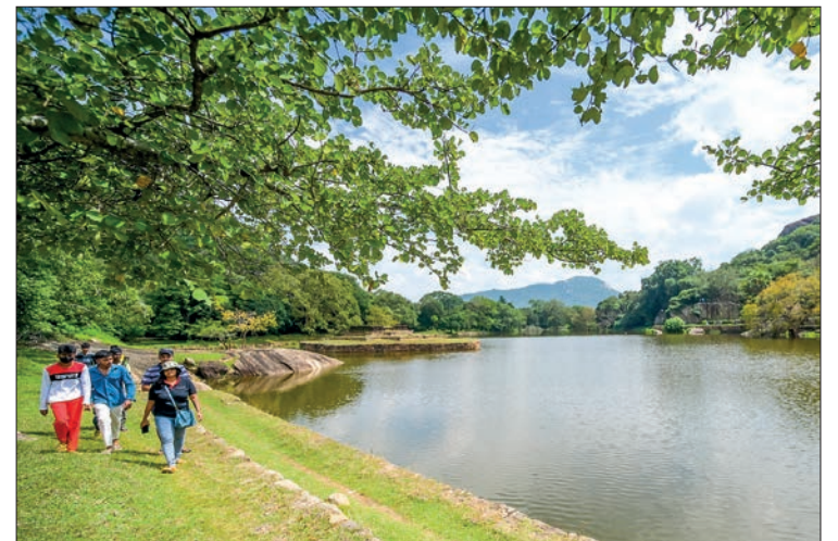
Tourists visit the Blackwater pond in Mihintale near Anuradhapura on 11 February 2023.

Russia, India and Germany were Sri Lanka's top three