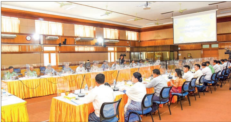
Union Information Minister U Maung Maung Ohn chairs the coordination meeting to hold the Walking Thingyan in Nay Pyi Taw during the 2023 Myanmar Traditional Thingyan Festival, yesterday.

THE coordinating meeting for organizing Walking Thingyan in Nay Pyi Taw for the 2023 Myanmar Traditional Thingyan Festival took place at the meeting hall of the Ministry of Information yesterday.