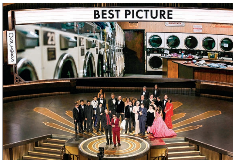
US director Daniel Scheinert (L) and US director Daniel Kwan (R) speak after winning the Oscar for Best Picture for “Everything Everywhere All at Once” onstage during the 95 th Annual Academy Awards at the Dolby Theatre in Hollywood, California on 12 March 2023.

fingers — also won best director, best actress, best original screenplay, best editing, and both the best supporting actor and actress prizes.