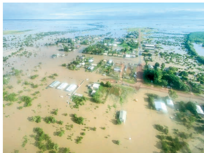
This handout photo taken on 10 March, 2023 and received on 11 March 2023 from the Queensland Police Service shows an aerial view of the flooded northern Queensland town of Burketown.

“So hopefully, there won’t be no any further rises and we’ll keep it positive.” — Xinhua