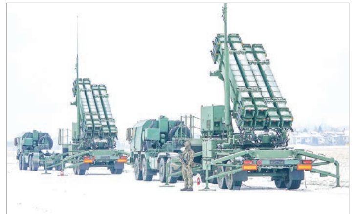
A soldier stands in front of PATRIOT (Phased Array Tracking Radar to Intercept on Target) surface-to-air missile systems during a military exercise at Warsaw Babice Airport, Poland on 7 February 2023.