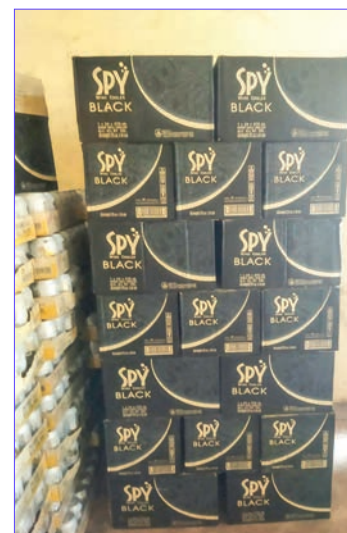
Confiscated items in Kayin State.

On 10 March, an on-duty team at the Naungnon combined checkpoint in Kengtung township seized two kinds of goods (including 60 cartons of shower cream) without official documents worth K3.6