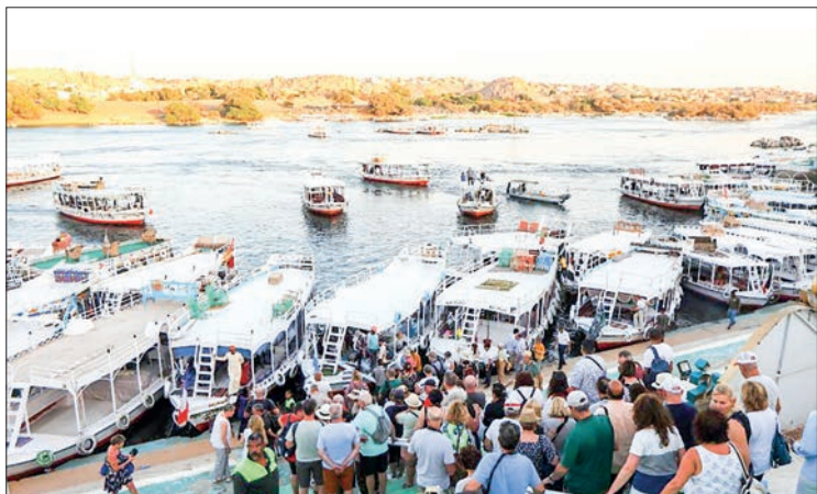
Tourists take boats at a dock after visiting the Nubian village of Gharb Soheil in Aswan, Egypt, on 9 March 2023.

Groups of Chinese tourists led by Egyptian guides were seen visiting the Philae temples, taking photos and listening to the guide's introduction of the ancient structures. — Xinhua