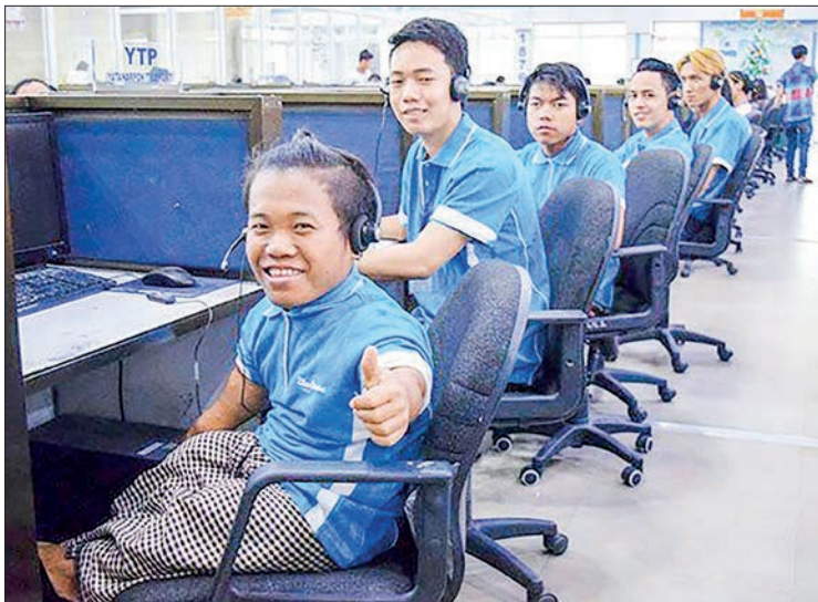
Some people with disabilities who are ready to start a business are seen in the picture in 2019.

Documents can be applied in person at the Rehabilitation Department of the Ministry of Social Welfare, Relief and Resettlement, Office No 23 in Nay Pyi Taw by 24 March 2023, stated by the Department of Rehabilitation.— TWA/CT