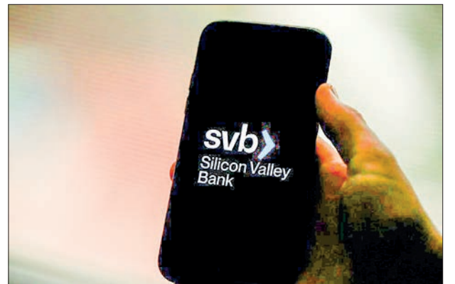
US regulators pulled the plug on Silicon Valley Bank in a spectacular move that sent global banking shares into turmoil.

"Secretary Yellen expressed full confidence in banking regulators to take appropriate actions in response and noted that the