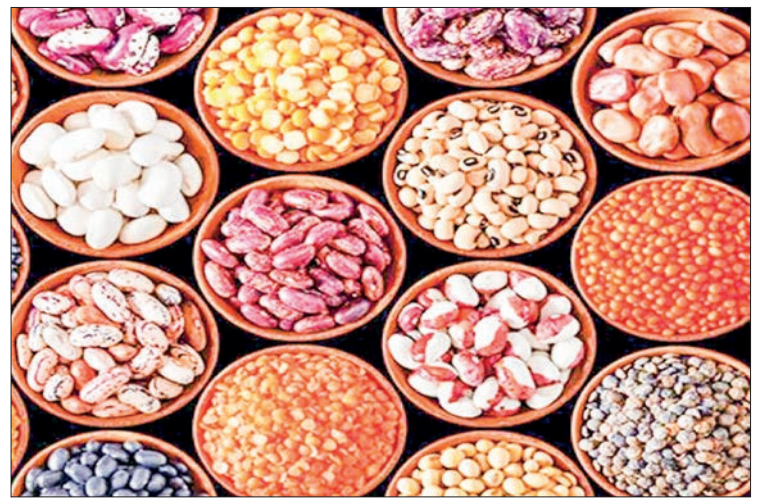
Multiple beans and pulses in the market.

approximately 400,000 tonnes of black gram and about 50,000 tonnes of pigeon peas.