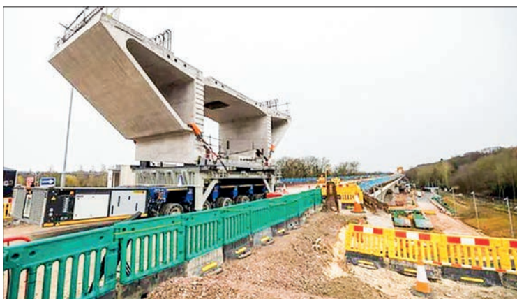
UK announces HS2 cost-saving measures with 2-year delay.

According to Harper, construction of the Birmingham to Crewe leg of HS2 in central England would now be put back by two years. That part of the line had been due to be extended between 2030 and 2034. — AFP