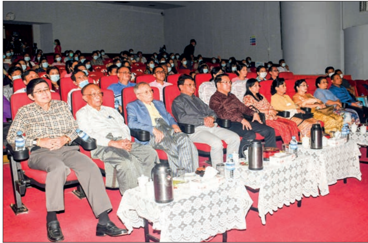
Union Minister U Maung Maung Ohn views the live broadcasting programme of MRTV-HD's music concert 3 in marking the 78 th Anniversary Armed Forces Day.

The development of literature can create a community with well-educated and polite people and produce perfect human resources for the country. All citizens should read to promote their lives, families, and communities