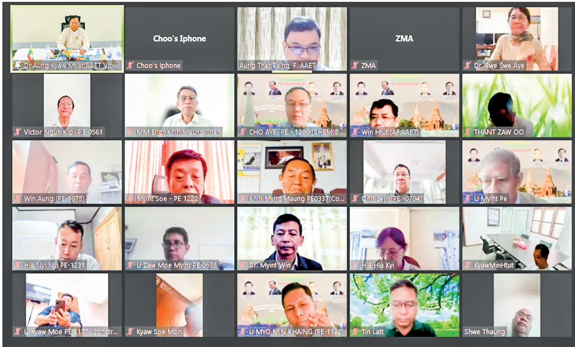
The online Zoom meeting in commemorating World Engineering Day 2023 is in progress yesterday.

THE AAET Country Operation Unit of Myanmar organized an Online Zoom Meeting on AAET Distinguished Lecture for the Commemoration of World Engineering Day 2023 under the permission of AAET (ASEAN Academy of Engineering and Technology) marking World Engineering Day 2023 yesterday.