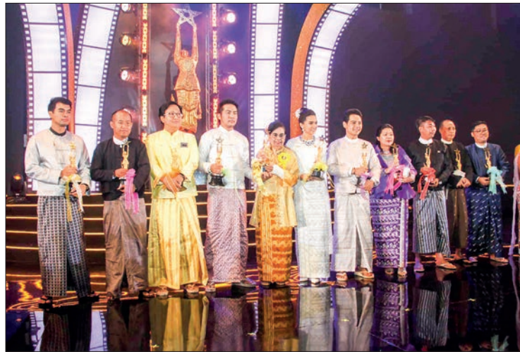
The 2018 Academy award winners were seen in 2019.

THE Myanmar Motion Picture Academy Awards for 2019, 2020 and 2022 will be presented in Nay Pyi Taw this year and the officials review the 16 movies currently.