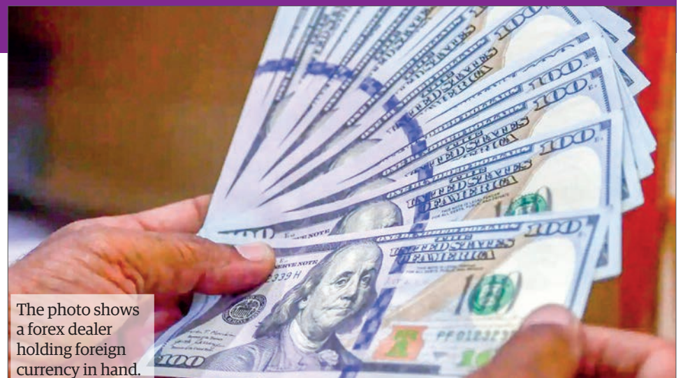
The photo shows a forex dealer holding foreign currency in hand.

When the authorized dealers (private banks and foreign bank branches) transfer those tax liabilities to the MEB, MFTB and MICB, the taxpayers must bear the conversion fee for the SWIFT transactions. If they do not want to bear the extra banking charges, they are advised to open foreign currency accounts at the MEB, MFTB and MICB respectively. — TWA/EM