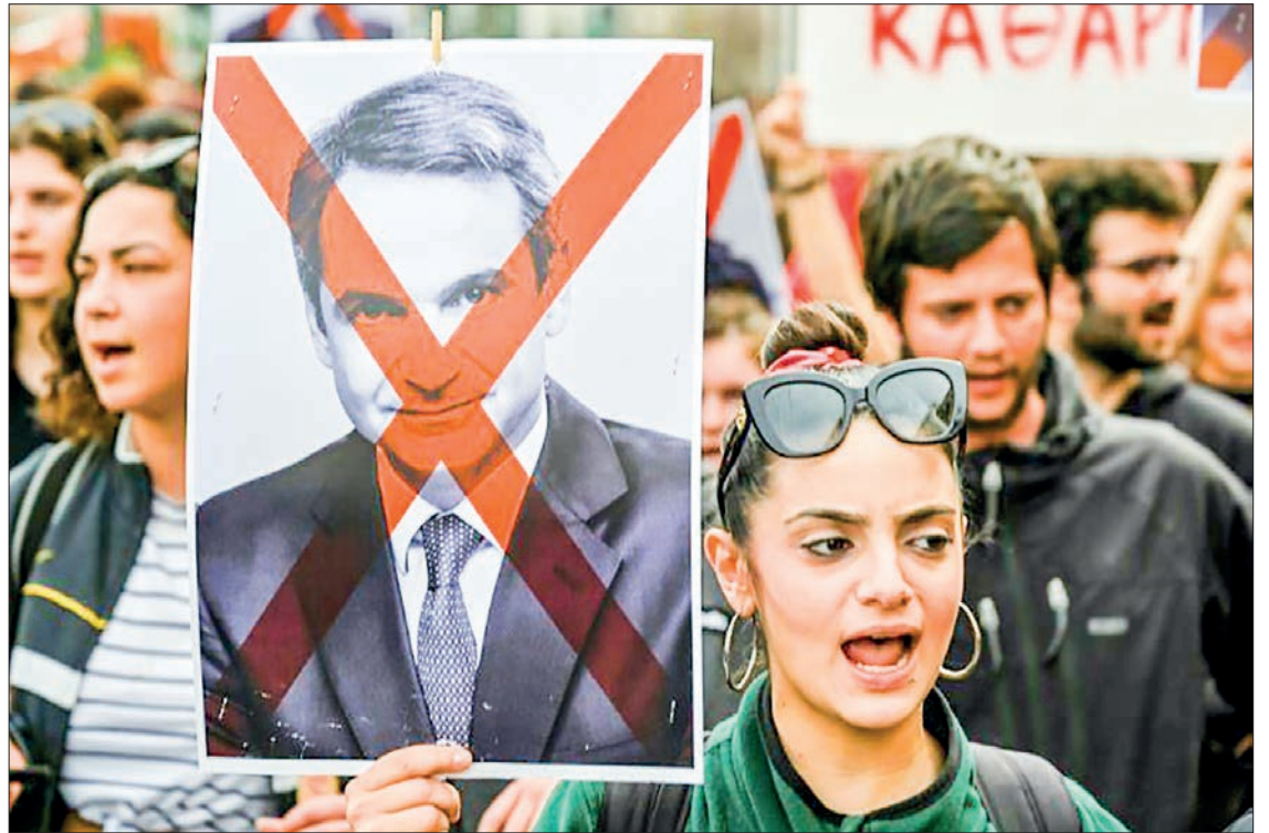
Calls are growing for PM Mitsotakis to quit after Greece's deadliest train crash.

THE Greek prime minister's bid for re-election at forthcoming polls may be thwarted by the country's deadliest train crash, which has sparked mass protests and calls for him to quit.