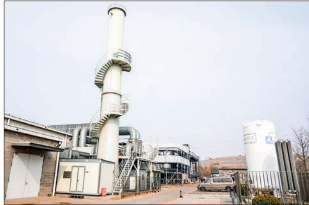
This photo taken on 27 February 2023 shows the plant area of Bitzer Refrigeration Technology (China) Co, Ltd in Beijing, capital of China.

Part of the investment will be spent on a 4,800-square-metre building for the research and development (R&D) department, and the foundation-laying ceremony is