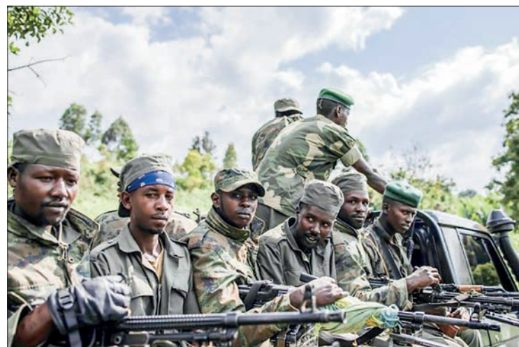
M23 rebels, pictured in January at a meeting in Rumangabo with the East African regional force in DR Congo.

The Democratic Republic of Congo accuses its neighbour Rwanda of supporting the group, something that Kigali denies, and regional countries have deployed a joint force aimed at stabilizing the region.— AFP