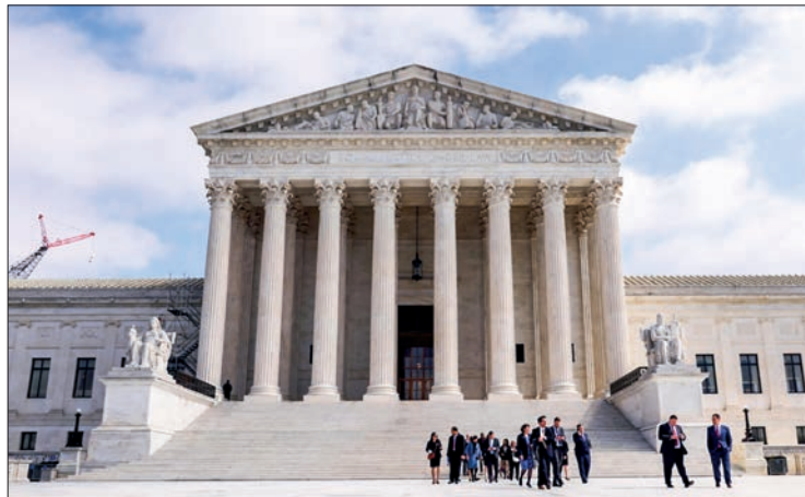
The US Supreme Court has been asked to weigh in for the first time on the controversial topic of transgender girls and women in school sports.

Her case argued that the state law violates guarantees of equal rights under the US Con-