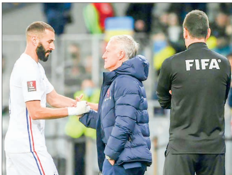
Karim Benzema (L) has called France head coach Didier Deschamps (C) a 'liar' after claims made about his fitness for the World Cup.

he wouldn't have been ready," Deschamps told the Parisien newspaper in an interview published on Saturday.