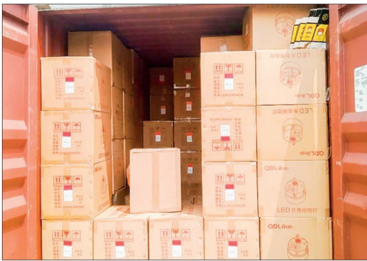
Confiscated illegal commodities.

THE on-duty team under the supervision of the Customs Department made inspections.