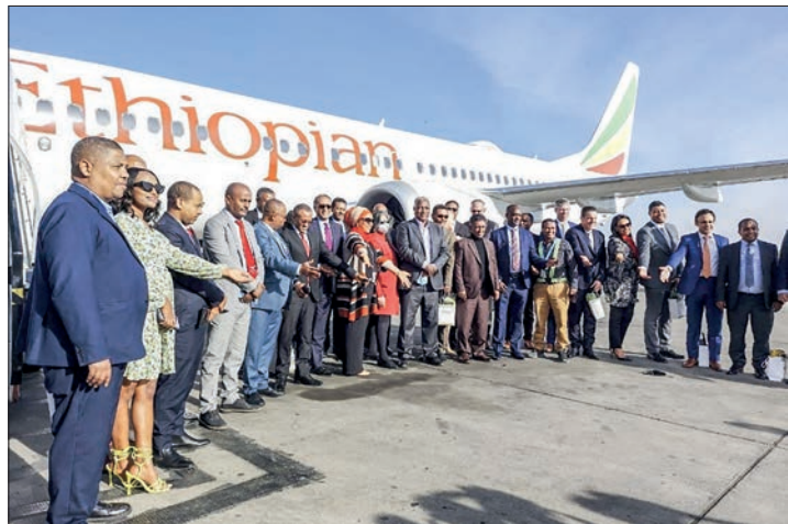
Ethiopian Airlines employees pose for a group photo in front of a Boeing 737 MAX on the tarmac of the Bole International Airport in Addis Ababa on 1 February 2022. Ethiopian Airlines is set Tuesday to operate the Boeing 737 MAX for the first time since a crash nearly three years ago killed all 157 people on board and triggered the global grounding of the aircraft.

The accident came barely five months after a similar tragedy in which a 737 MAX operated by Lion Air crashed into the Java Sea off Indonesia, killing 189 people. — AFP