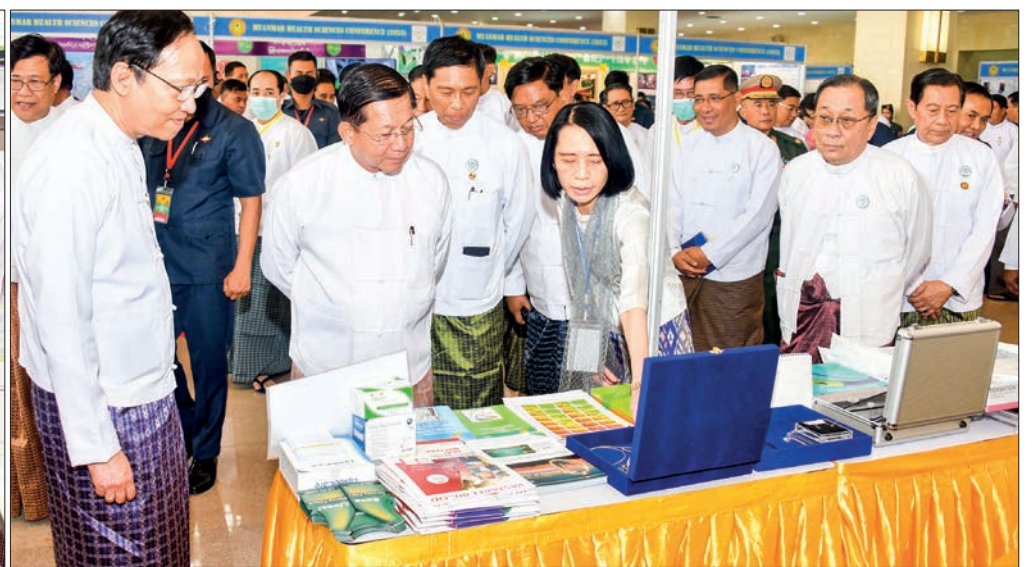
State Administration Council Chairman Prime Minister Senior General Min Aung Hlaing views round the exhibitions at the opening event yesterday.

serving duties in the health arena and giving health care services to people with goodwill and compassion, as of the 2022 academic year.