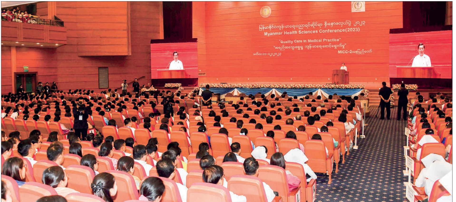
State Administration Council Chairman Prime Minister Senior General Min Aung Hlaing addresses the opening ceremony of the Myanmar Health Sciences Conference in Nay Pyi Taw on 11 March 2023.

A LL medical professionals are to uplift the health sector through collaborative efforts of medical professionals from the Ministry of Health, Ministry of Defence and relevant ministries as well as private healthcare institutions, said Chairman of the State Administration Council Prime Minister Senior General Min Aung Hlaing