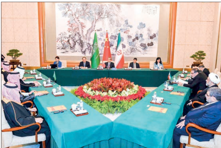
Wang Yi, a member of the Political Bureau of the Communist Party of China (CPC) Central Committee and director of the Office of the Foreign Affairs Commission of the CPC Central Committee, presides over the closing meeting of the talks between a Saudi delegation and an Iranian delegation in Beijing, capital of China, 10 March 2023.

"Following talks, the Islamic Republic of Iran and the Kingdom of Saudi Arabia have agreed to resume diplomatic relations and reopen embassies and missions within two months," said the joint statement, which was published by both countries' official media.— AFP