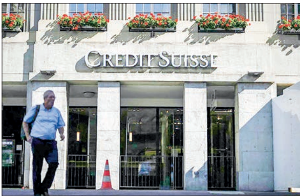
A branch of Swiss banking giant Credit Suisse in Bern.

But when the bank issued its annual results last month, the outflows in the fourth quarter had surged to 110.5 billion Swiss francs (nearly $120 billion) amid large client withdrawals, which was far higher than market expectations. Based on information from the bank, one analyst estimated in late November that these stood at 84 billion Swiss francs. — AFP