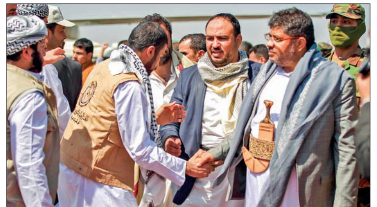
Freed Yemeni Houthi prisoners are welcomed at Sanaa airport upon their arrival on 15 October 2020 as Yemen's warring sides began swapping about 1,000 prisoners in an operation overseen by the International Committee of the Red Cross.

— including 16 Saudis and three Sudanese nationals. — AFP