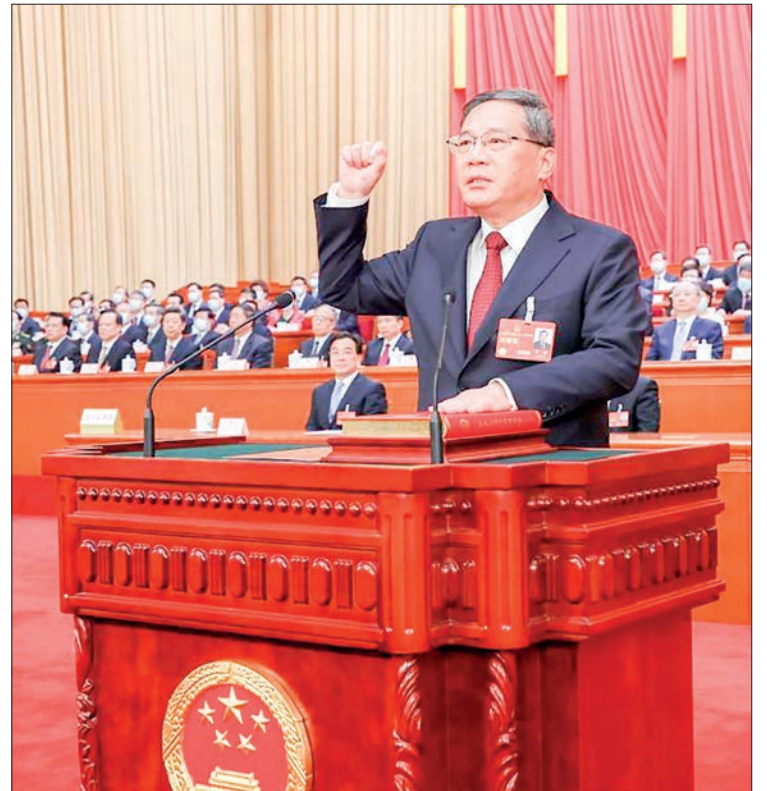
Newly appointed Chinese Premier Li Qiang makes a public pledge of allegiance to the Constitution at the Great Hall of the People in Beijing, capital of China, 11 March 2023. Li was endorsed as Chinese premier at a plenary meeting of the first session of the 14 th National People's Congress, the country's national legislature.

A resolution on the work report of the Standing Commit-