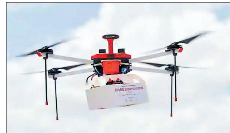
Greater use of drones could be a game-changer for medical services in India's hard-to-reach rural areas where healthcare is limited and roads often poor. Technicians flies a drone belonging to the Throttle Aerospace Systems (TAS) which flies Beyond Visual Line of Sight (BVLOS) to deliver life saving medical supplies.