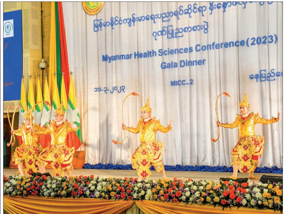
State Administration Council Vice-Chairman Deputy Prime Minister Vice-Senior General Soe Win enjoys the gala dinner and entertainment performed by the Fine Arts Department yesterday.

THE gala dinner of the Myanmar Health Sciences Conference 2023 was held at the Myanmar International Convention Centre-II in Nay Pyi Taw yesterday evening, at-