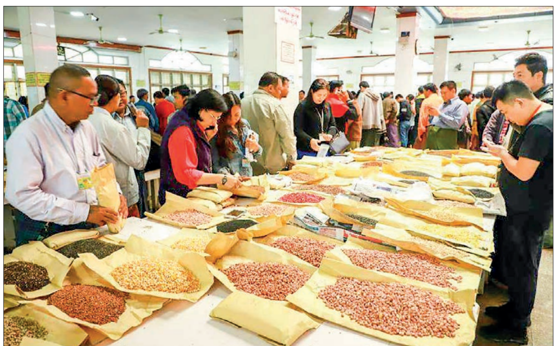
Traders are pictured evaluating various beans and pulses in the Mandalay market.

It is a winter crop. It cannot be grown in any place as it is not well adapted to high temperatures and heavy rain. It is primarily produced in Htigyaingt, Katha, Bhamo, and Shwegu areas along Ayeyawady River Basin and Kalay, Kalewa and Gangaw areas along Chindwin River Basin. — Min Htet Aung (Mandalay Sub-Printing House)/EM