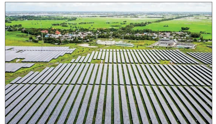
Viet Nam boasts the highest installed capacity of solar power in Southeast Asia, generating 16,500MW at the end of 2020. Viet Nam unconditionally committed to reducing its greenhouse gas emissions by nine per cent by 2030.

By the end of 2022, Viet Nam's total installed capacity was almost 77,800 megawatts, an increase of 1,400 MW against 2021. Renewable energy accounted for 26.4 per cent, or 20,165 MW, according to the ministry. — Xinhua