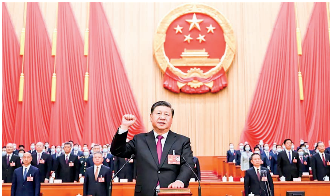
Xi Jinping, newly elected president of the People's Republic of China (PRC) and chairman of the Central Military Commission of the PRC, makes a public pledge of allegiance to the Constitution at the Great Hall of the People in Beijing, capital of China, 10 March 2023.

Xi Jinping was unanimously elected president of the People's Republic of China (PRC) and chairman of the Central Military Commission (CMC) of the PRC on Friday at the ongoing session of the 14th National People's Congress.