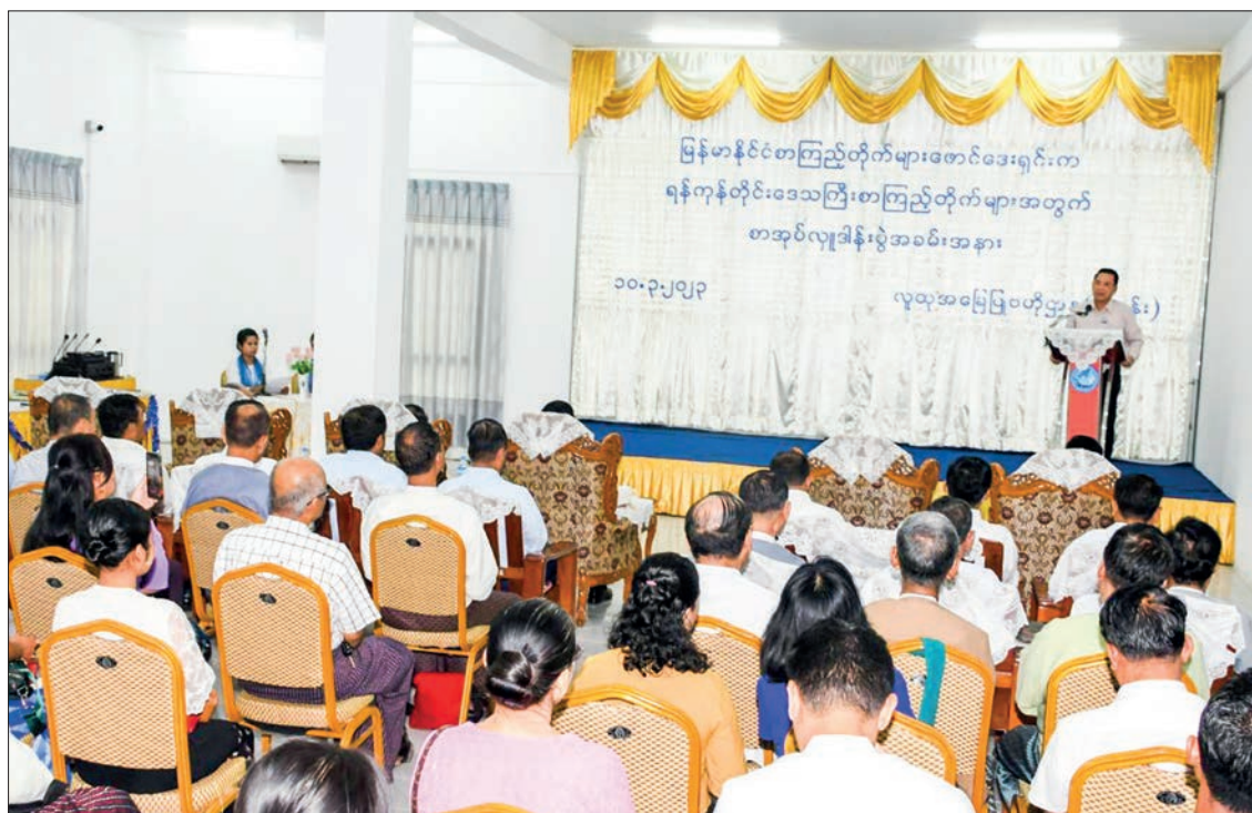
Union Minister U Maung Maung Ohn speaks on the occasion of books donation from the Myanmar Libraries Foundation to libraries in Yangon yesterday.

Union Minister U Maung Maung Ohn then presided over