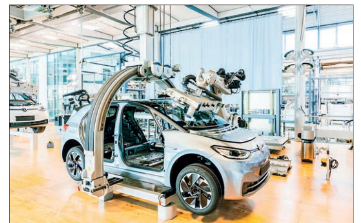
Assembly of the ID 3 in the Transparent Factory Dresden. PHOTO: REPRESENTATIVE IMAGE/ VOLKSWAGEN AG

Americans make the trip for everything from dental work to cosmetic surgery to treatment for cancer. — AFP