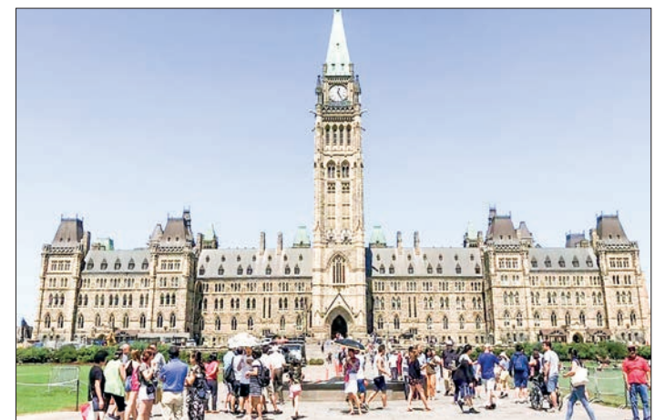
Parliament Hill, colloquially known as The Hill, is an area of Crown land on the southern banks of the Ottawa River in downtown Ottawa, Ontario, Canada.

The bill must still be passed by parliament.—AFP