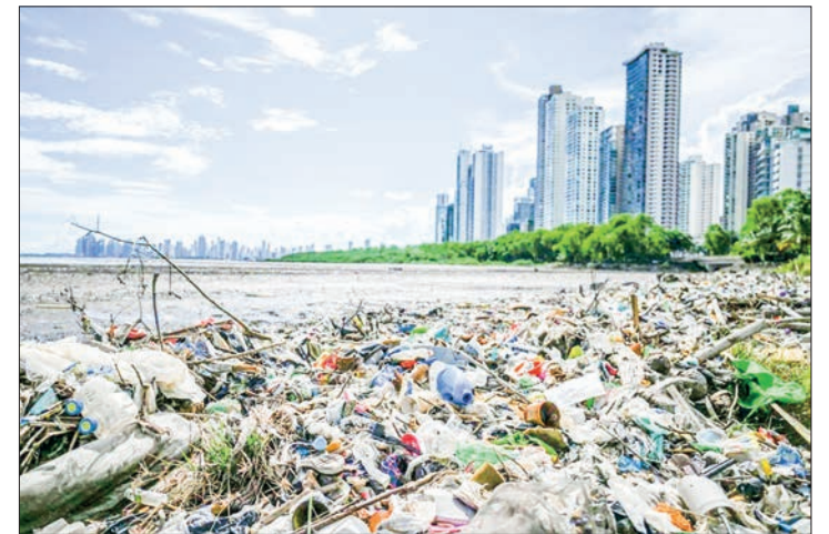
Plastic waste and garbage is seen at the beach in Costa del Este, Panama City, on 21 September 2022. PHOTO: AFP

They found no trends until 1990, then a fluctuation in trends between 1990 and 2005. After that, the samples skyrocket. "We see a really rapid increase since 2005 because there is a rapid increase in production and also a limited number of policies that are controlling the release of plastic into the ocean," contributing author Lisa Erdle told AFP.—AFP