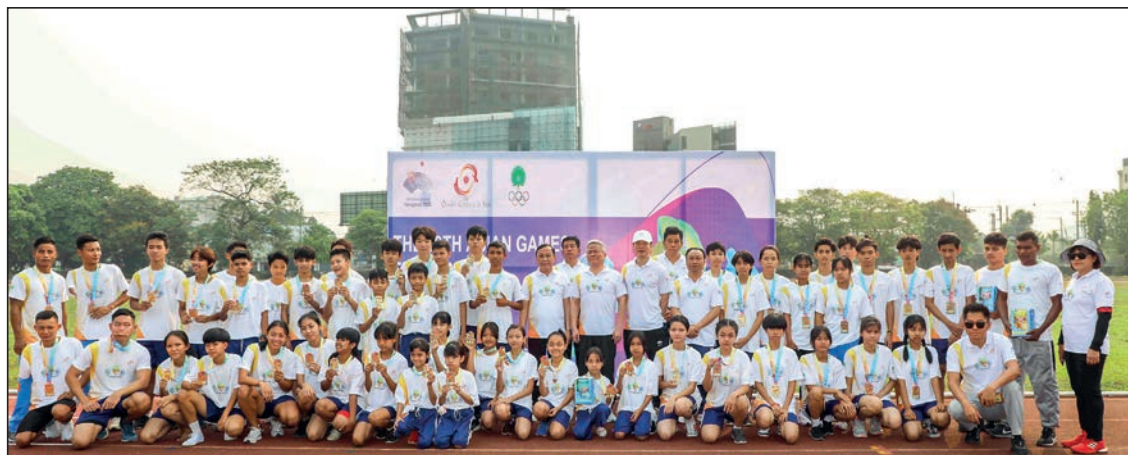
The documentary group photo of the deputy minister, the Chinese cultural attaché, officials and runners aged above 13 and under 13 at the event yesterday.

AN ASIAN Games Fun Run was held at the athletics ground in Kyaikkasan Grounds under the Institute of Sports and Physical Education, Yangon, yesterday morning.