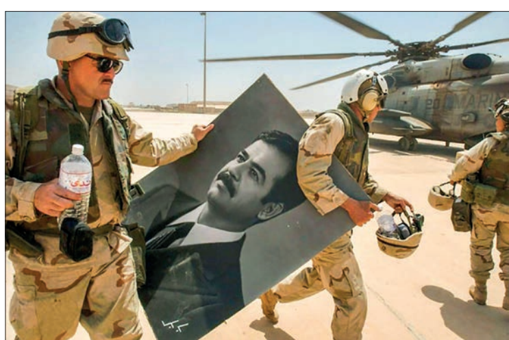
US Marines carry a portrait of toppled Iraqi president Saddam Hussein at the international airport in Baghdad, in this file photo from 14 April 2003.

The decision after the 20 March 2003 ground invasion to dismantle Iraq's state, party and military apparatus deepened the chaos that fuelled years of bloodletting, from which the jihadist Islamic State