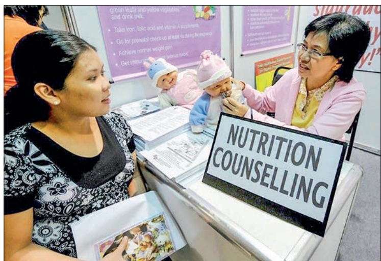
A nutritious and healthy diet during pregnancy is essential for the health of both mother and baby.

Malnutrition increases the risk of neonatal death, but can also "impair fetal development, with lifelong consequences for children's nutrition, growth, learning and future earning capacity". "Globally, 51 million children under two years are stunted. We estimate that about half of these children become stunted during pregnancy and the first six months of life when a child is fully dependent on the mother for nutrition," the UNICEF report said.—AFP