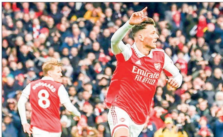
Arsenal are aiming to take another step towards the Premier League title away at Fulham.

ARSENAL travel to Fulham in the latest test of the Gunners' Premier League title credentials this weekend as Manchester City aim to ramp up the pressure on Mikel Arteta's men by winning at Crystal Palace.