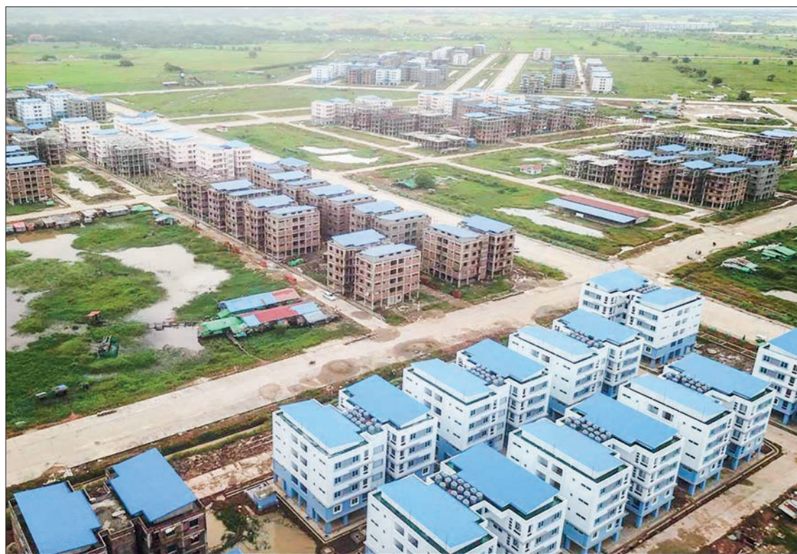
An aerial view of the Public Rental Housing Project in Dagon Myothit (South) Township, Yangon Region.

“Being a public rental system, the government develops the housing using its fund for the public to save their rental fees. Therefore, government employees and people can apply for apartments. We complete 97 buildings and return 27 buildings to the Department of Urban and