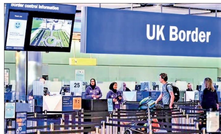
Qataris will apply in advance for an ETA, which authorises an individual to travel to the UK and which the government says will make border crossings more efficient and secure.

"ETAs will enhance our border security by increasing our knowledge about those seeking to come to the UK and preventing the arrival of those who pose a threat. —AFP