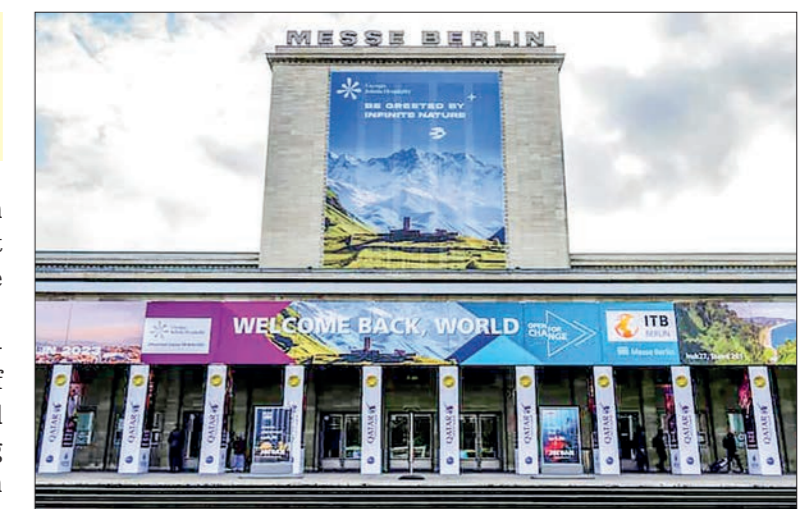
The tourism industry is recovering from the pandemic but now faces risks from inflation eroding the purchasing power of consumers.