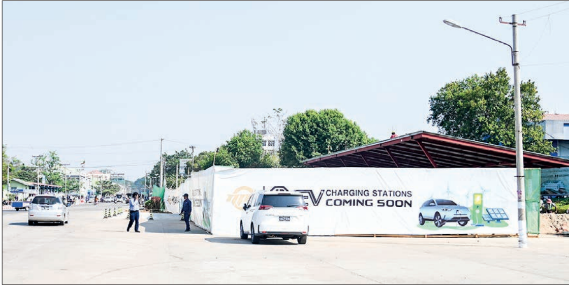
EV charging stations are under construction.

DEPUTY Minister for Construction U Win Pe recently said plans to construct EV charging stations within the next three months at 38 designated petrol stations in Yangon, Yangon-Mandalay Expressway and Nay Pyi Taw.