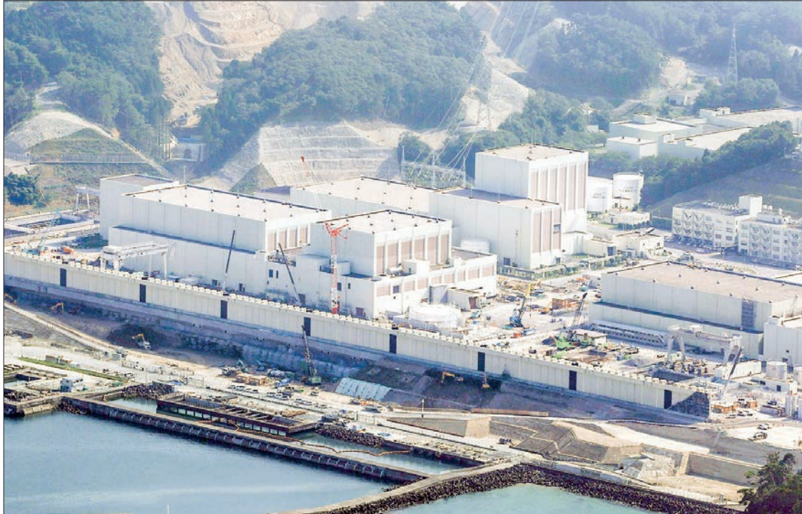
File photo shows Tohoku Electric Power Co's Onagawa nuclear plant, as pictured in August 2020.

COSTS for safety measures necessary to restart Japan's idle nuclear reactors following the 2011 Fukushima nuclear disaster ballooned to over 6.09 trillion yen ($44.3 billion) in January, according to 11 major power companies in the country.