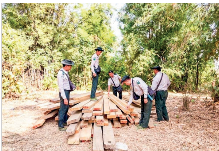
Officials check confiscated timbers.

In addition, an on-duty combined team seized 1,800 kilogrammes of multi-vita plus sugar-coated tablets worth K35 million from a Dagon Tawwin truck (estimated value of K35 million) heading to Yangon