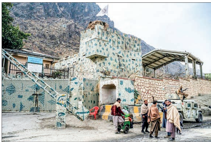
There are signs the country's coffers have benefitted from a crackdown on corruption, which sucked the US-backed government dry for 20 years.

one trucker told AFP that under the old regime he would pay 25,000 Afghani ($280) at illegal checkpoints along a 620 kilometre (380 mile) trip to Mazar-