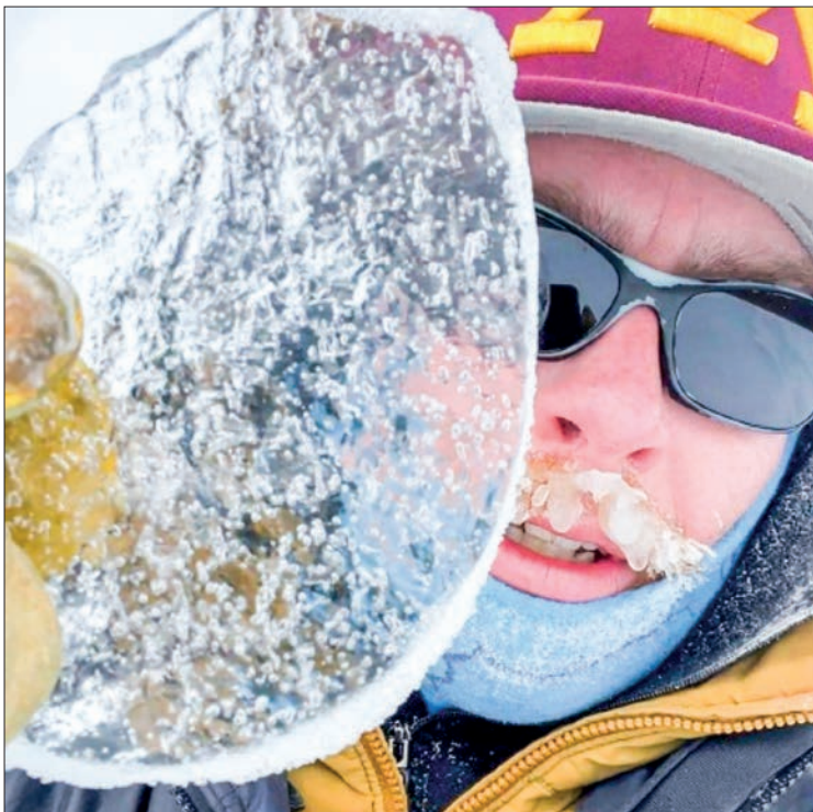
A growing number of scientists are leveraging the short-form video app TikTok to boost literacy on climate change. Glaciologist Peter Neff holds a fragment of Antarctic ice containing 100,000-year-old air bubbles.

Neff is one of 17 tiktokers and instagrammers listed in the 2023 Climate Creators to Watch, a collaboration between startup media Pique Action and the Harvard School of Public Health. — AFP