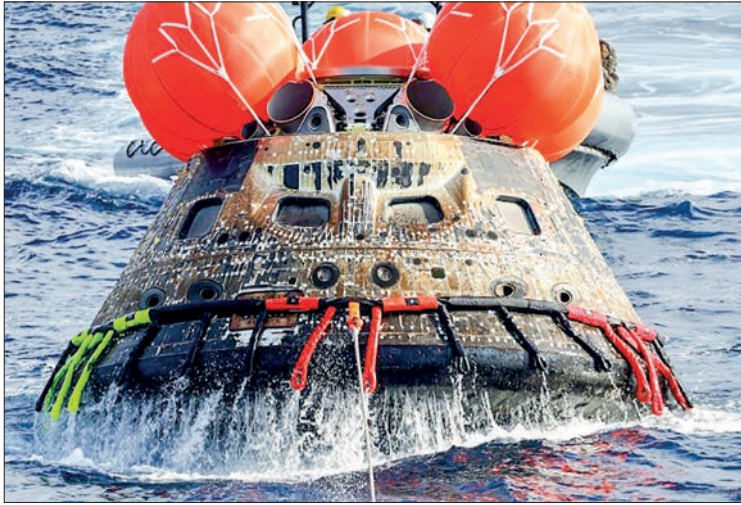
NASA's Orion space capsule being retrieved after splashing down in the Pacific Ocean.

NASA will announce the names next month of the four astronauts -- three Americans and one Canadian -- who will fly around the Moon next year, the head of the US space agency said Thursday.