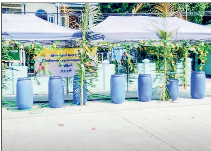
A Thingyan pavilion in Tamway Township is pictured in 2022.