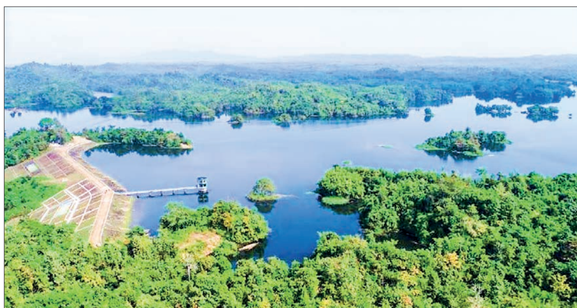
A bird's-eye view of the Tabu Hla Dam and its vicinity.

The Tabu Hla Dam about 19 miles from east Okkan town