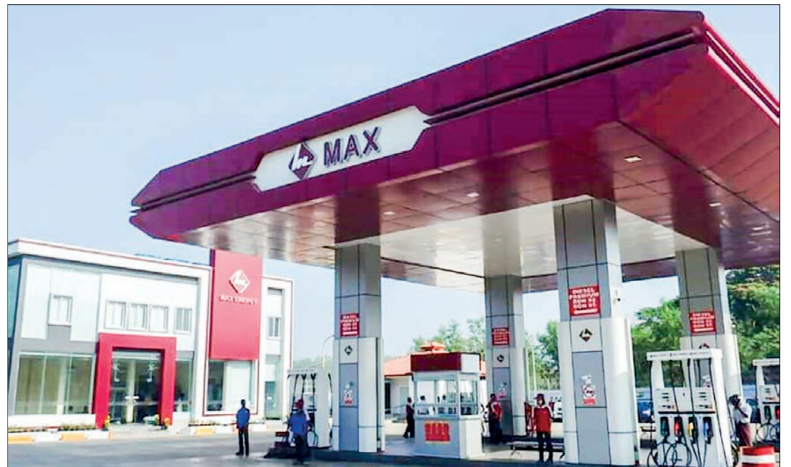
On 10 March, the prices touched a high of K2,150 per litre of Octane 92, K2,235 for Octane 95, K2,175 for diesel and K2,255 for premium diesel.

As per the statement, 90 per cent of fuel oil in Myanmar is imported, while the remaining 10