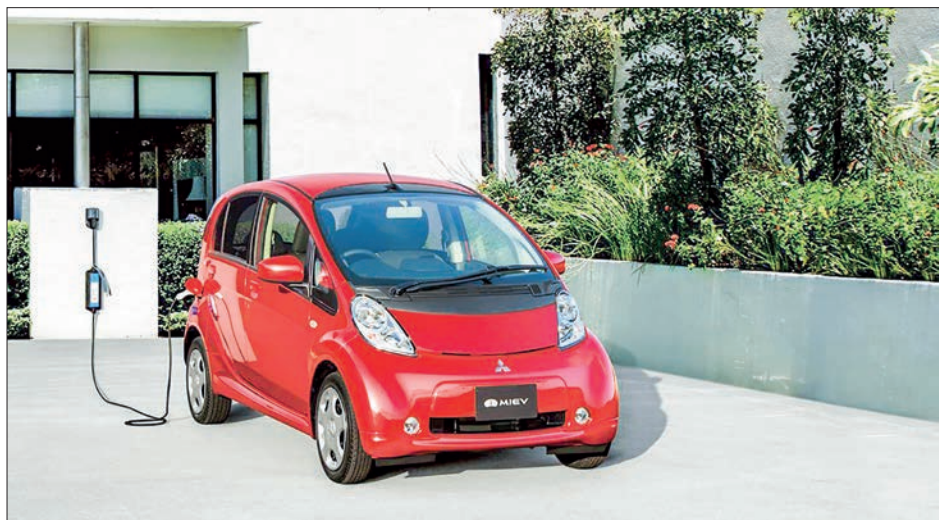
From late 2006, "MiEV" encompasses all of Mitsubishi Motors's electric drive systems work, including lithium-ion batteries, in-wheel motors and other technologies related to electric vehicle (EV), hybrid-electric vehicle and fuel-cell vehicles.

MITSUBISHI Motors Corp said Friday it aims to electrify all of the cars it sells globally by fiscal 2035, expecting related investment to total more than 1.4 trillion yen ($10 billion) through fiscal 2030.