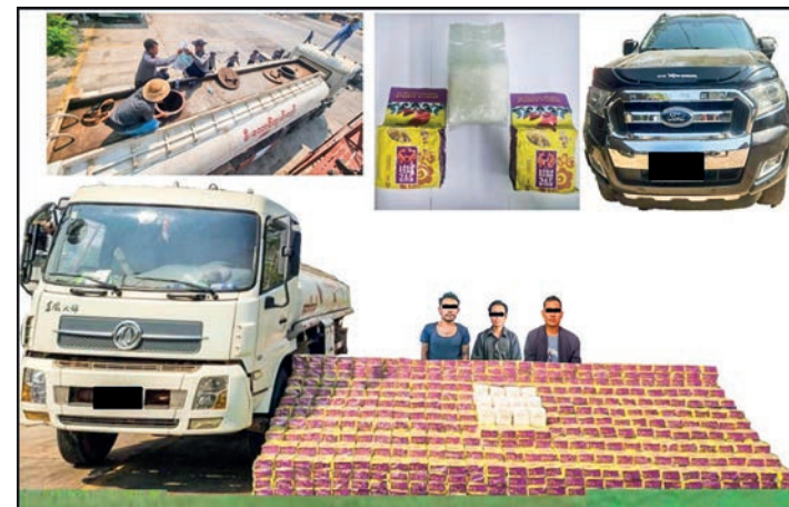
Three offenders are seen along with seized drugs, vehicles and related items.