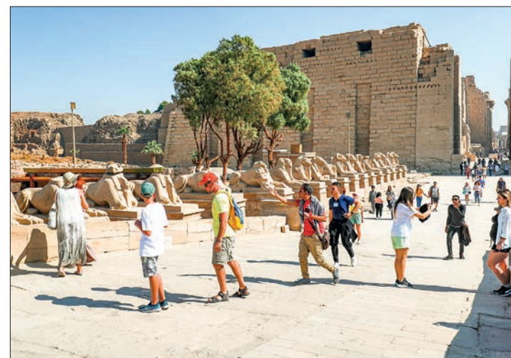
Visitors walk past the ram-headed sphinxes along the Avenue of the Sphinxes (Sphinx dromos) near the Temple of Karnak (background) in Egypt's southern city of Luxor on 26 November 2021.

The statute was found inside a two-level compartment that also contained a Byzantine-era sink for preserving water, it added. — Xinhua