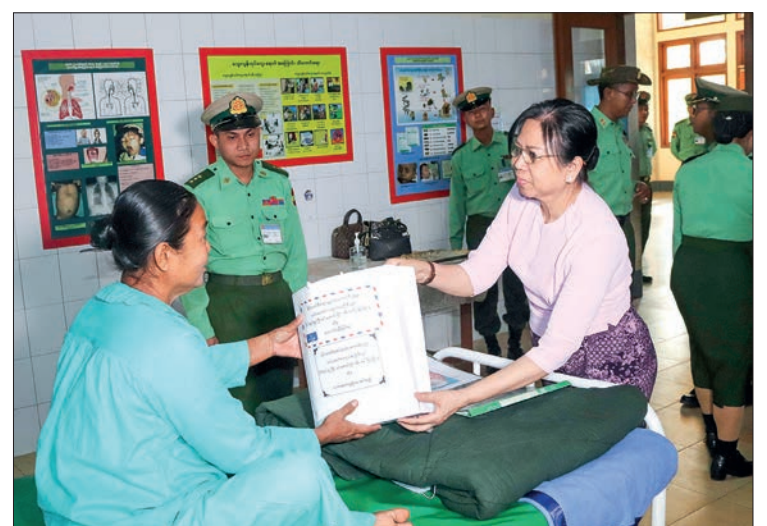
The wife of the Senior General provides foodstuffs to the patients at the local military hospital in Aungban.

The Senior General visited the radiation medical ward and cancer surgery ward and gave the necessary instructions. — MNA/TTA