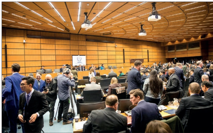
General view of the Board of Governors' meeting of the International Atomic Energy Agency (IAEA) at the agency's headquarters in Vienna, Austria on 6 March 2023. IAEA has been seeking greater cooperation with Iran over its nuclear activities.

However, no agreement was reached between IAEA and AEOI regarding the installation of new surveillance cameras at Iranian nuclear sites, Kamalvandi noted. — Xinhua