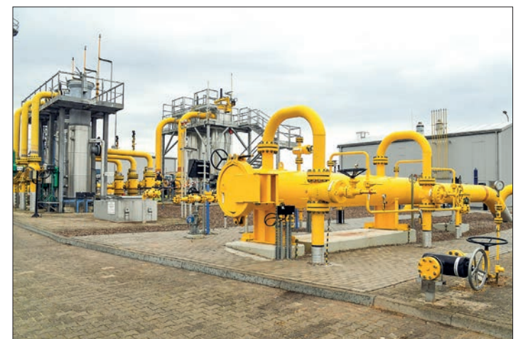
A gas compressor station is pictured on the grounds of the Baltic Pipe gas pipeline prior to its opening ceremony in Budno near Goleniow, Poland. A new pipeline to carry Norwegian gas via Denmark was opened in Poland in a move to strengthen Europe's energy security after Russia cut off Warsaw's supplies. The project is part of years-long efforts by Poland to wean itself off its dependence on Russian gas, which once represented two-thirds of its annual consumption.

The Norwegian state earns revenues from the country's oil and gas reserves through taxes imposed on oil companies, its direct holdings in oil and gas fields and infrastructure and dividends paid by the energy giant Equinor, in which it holds a 67 per cent stake. — AFP