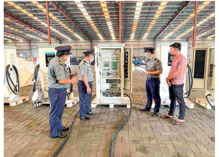
Officials check the new arrival of EV chargers at Yangon Thilawa Port on 6 March 2023.

The chargers were imported from China through Earth Renewable Energy Co Ltd. The import of these chargers is exempted from Customs duties.