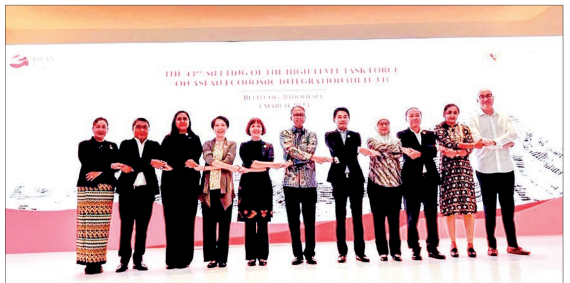
Deputy Minister Dr Wah Wah Maung takes the documentary group photo at the event in Indonesia, 1-3 March 2023.

The deputy minister discussed to consider the development gap of socioeconomy among ASEAN Member States to consider in developing of ASEAN Economic Community Post 2025 Vision, to strengthen the digital technology transformation which is important for regional development and connecting in the global value chain. She also expressed that investment in the digital sector is important for MSMEs to use broadly in this sector. She also stated that human resource development plays a vital role in the