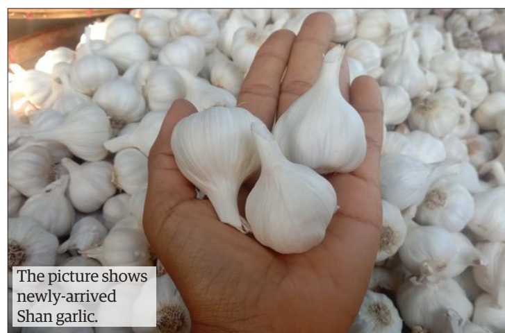
The picture shows newly-arrived Shan garlic.

NEW Shan garlic entered the Yangon market at the beginning of March and the price has decreased.