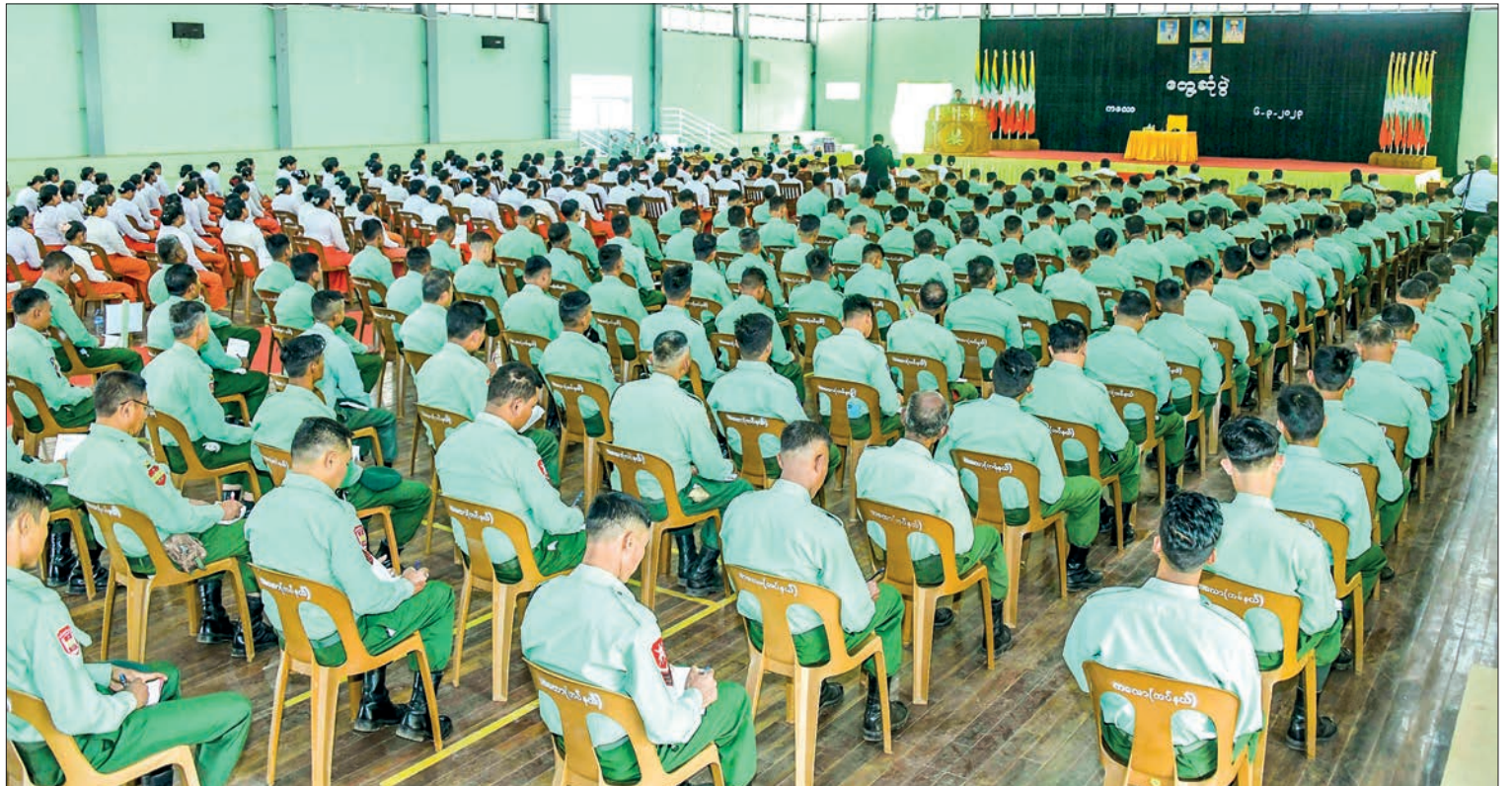
State Administration Council Chairman Commander-in-Chief of Defence Services Senior General Min Aung Hlaing meets Tatmadaw members and families from Kalaw station yesterday.

In his speech, the Senior General said that the Tatmadaw is to discharge duties of State security and defence and protection of life and property of the people. To do so, all Tatmadaw members at different levels are required to have physical and mental health and fitness.