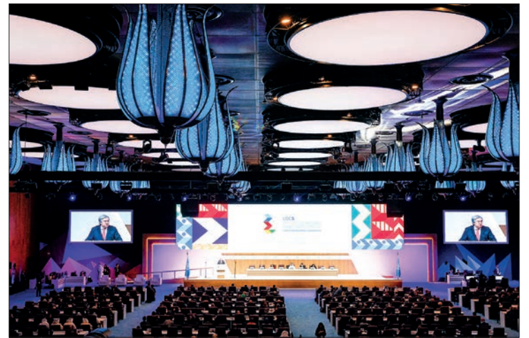
Secretary-General of the United Nations (UN) Antonio Guterres speaks during the 5th Conference on the Least Developed Countries (LDC5) in Doha on 5 March 2023.

Leaders also used the first day of public debate to renew demands that industrialized governments hand over a promised $100 billion a year to support their efforts to counter global warming. — AFP