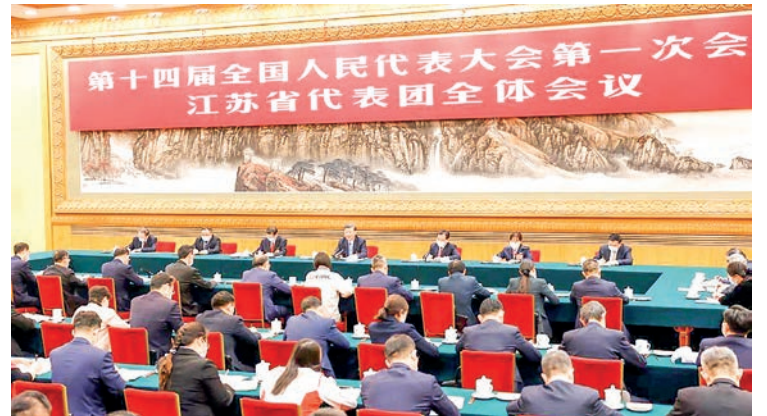
Chinese President Xi Jinping, also general secretary of the Communist Party of China Central Committee and chairman of the Central Military Commission, takes part in a deliberation with his fellow deputies from the delegation of Jiangsu Province, at the first session of the 14th National People's Congress (NPC) in Beijing, capital of China, 5 March 2023.

Speeding up efforts to achieve greater self-reliance and strength in science and technology is the path China must take to advance high-quality development, said Xi. — Xinhua