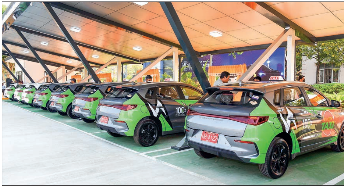
Electric vehicles (EVs) imported from China are pictured being transformed into taxis for passengers in Nay Pyi Taw and Yangon.

conferred by Sections 43 and 100 (B) of the Myanmar Investment Law, the MIC issued this statement with the approval of the Union government.