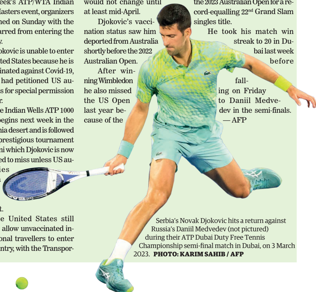
Serbia's Novak Djokovic hits a return against Russia's Daniil Medvedev (not pictured) during their ATP Dubai Duty Free Tennis Championship semi-final match in Dubai, on 3 March 2023.

falling on Friday to Daniil Medvedev in the semi-finals. — AFP