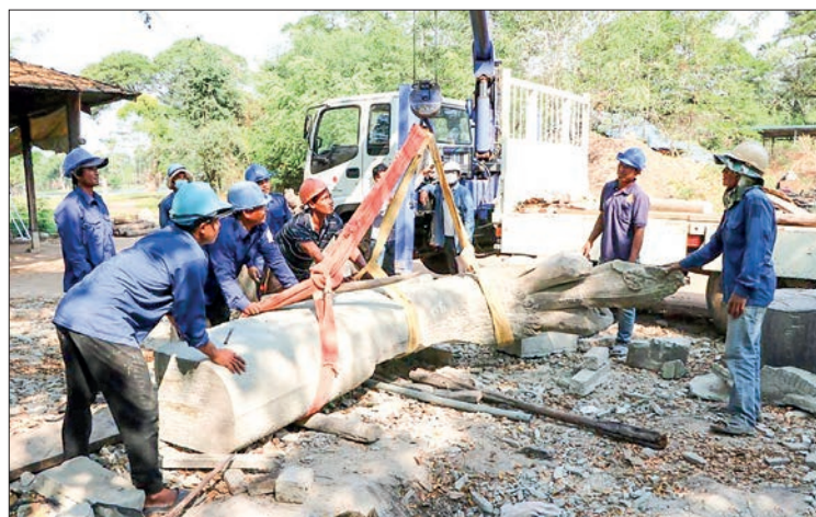
This undated photo shows staff members working at the restoration site of the Naga balustrades in Angkor Archaeological Park in Siem Reap province, Cambodia. A Cambodian authority has recently begun to restore two 50-metre-long sandstone Naga balustrades on the north side of Angkor Wat's causeway in the famed Angkor Archaeological Park in northwest Cambodia, the authority said in a news release on Monday.

Currently, as the Angkor Wat's causeway restoration project has been completed, the team has to take those Naga balustrades to restore to their original places, he added. — Xinhua