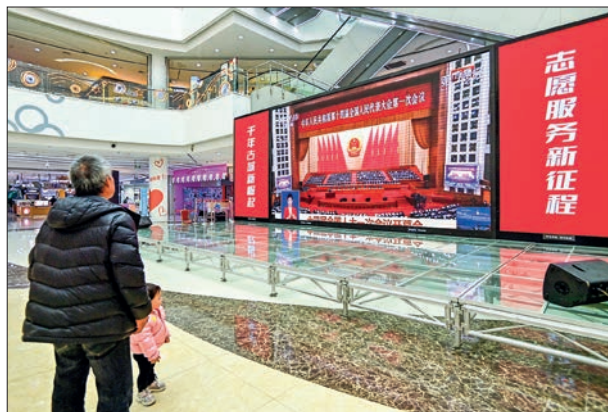
This photo taken on 5 March 2023 shows people watching live coverage of the opening session of the National People's Congress (NPC) at a shopping mall in Qingzhou, in China's eastern Shandong province.

The Nikkei 225 jumped more than one per cent, with similar gains posted in Taipei, Seoul and Sydney.