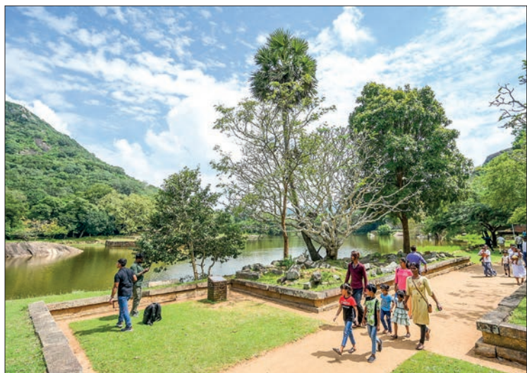
Tourists visit the Blackwater pond in Mihintale near Anuradhapura on 11 February 2023.

SRI Lanka's Mattala Rajapaksa International Airport (MRIA) provided service to over 11,000 tourists in February, the Airport and Aviation Services of Sri Lanka (AASL)