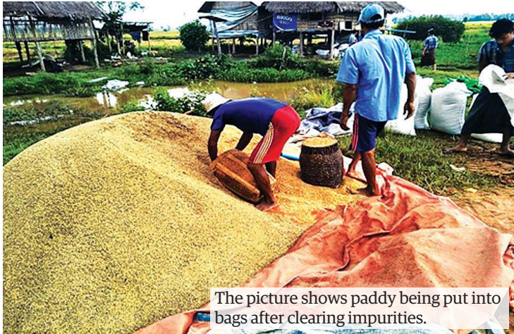
The picture shows paddy being put into bags after clearing impurities.

THE prices of some low-grade new summer rice and some Pawsan rice dipped in March 2023. Similarly, the prices of Pawsan paddy (Ayeya Padetha variety) and short-mature paddy (90 days) declined.