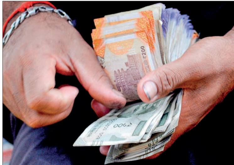
A fruit vendor counts a wad of Indian Rupee currency notes for payment at his roadside stall in Mumbai on 19 July 2022.

THE per capita income in India has doubled to 172,000 Indian Rupees (around 2,105 US dollars) over the past nine years, according to the latest figures released by the National Statistical Office (NSO) under the Ministry of Statistics and Programme Im-