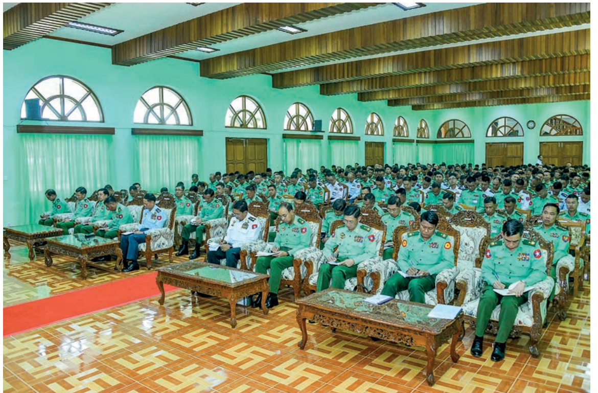
State Administration Council Chairman Commander-in-Chief of Defence Services Senior General Min Aung Hlaing meets senior officer instructors and senior officer trainees from the Command and General Staff College at Kalaw Station on 6 March 2023.

COMMANDERS are required to consider ways and means for fulfilling the needs of subordinates, said Chairman of the State Administration Council Commander-in-Chief of Defence Services Senior General Min Aung Hlaing at the meeting with senior officer instructors and senior officer trainees at the Command and General Staff College at the hall of Kalaw Station yesterday afternoon.