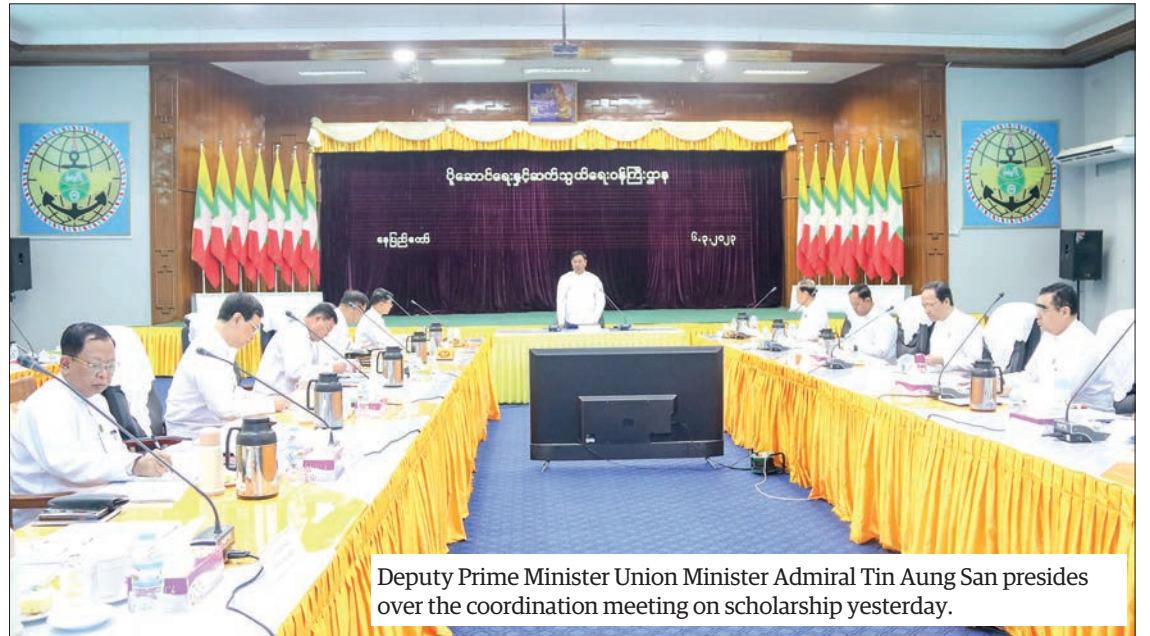
Deputy Prime Minister Union Minister Admiral Tin Aung San presides over the coordination meeting on scholarship yesterday.

Afterwards, there was a round of discussions among the attendees. — MNA/TS