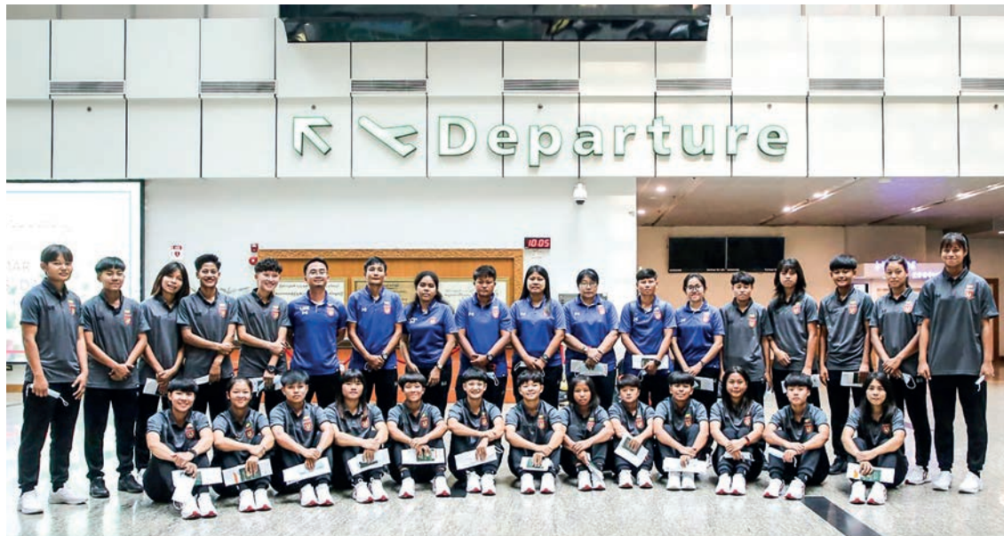
Myanmar women's team is seen at the Yangon International Airport on 6 March 2023 as they are leaving for Cambodia for Asian Women's U-20 qualifiers.