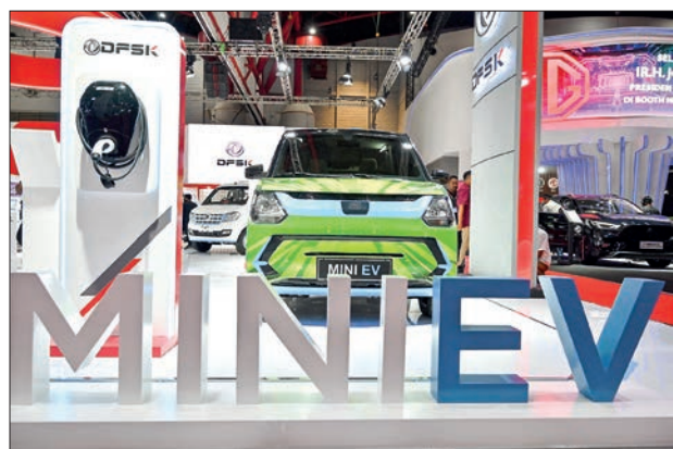
Mini EV electric car from DFSK (Dongfeng Sokon) is displayed at Indonesia International Motor Show exhibition in Jakarta on 16 February 2023.

Pandjaitan stressed his optimism for this programme due to the nation's population dominated by young people, and its rich reserves of nickel, the metal widely used in producing electric batteries. — Xinhua