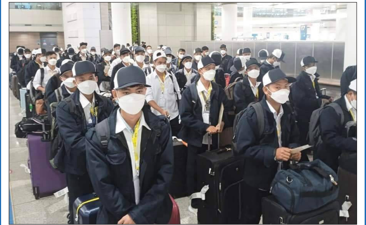
Myanmar workers are seen being despatched to S Korea under EPS in 2022.

An overseas employment recruitment agency saw off Myanmar workers at the Yangon International Airport and the labour attaché of the Myanmar Embassy in Seoul welcomed them at Incheon Airport. — TWA/MKKS