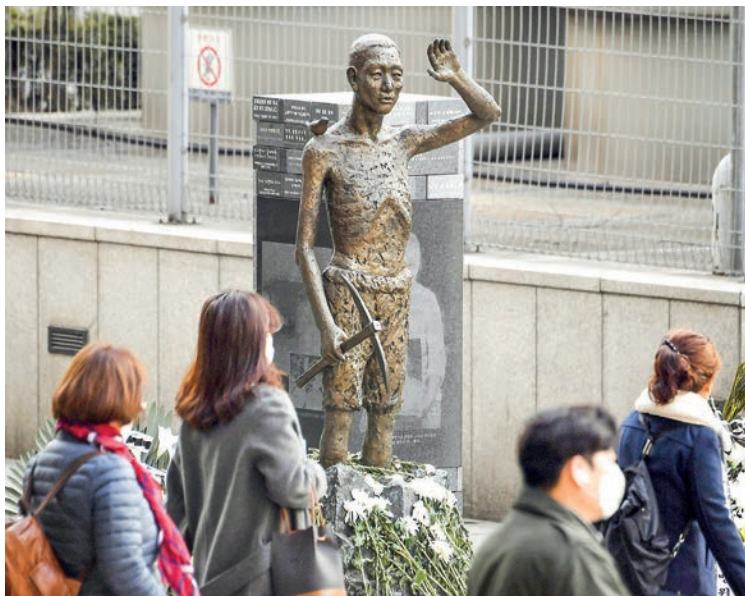
A statue symbolizing Korean labourers forcibly taken to Japan during wartime is pictured on 6 March 2023, in Seoul.

JAPAN and South Korea announced steps Monday to resolve a wartime labour row that has been a major sticking point in bilateral ties, with Seoul offer-