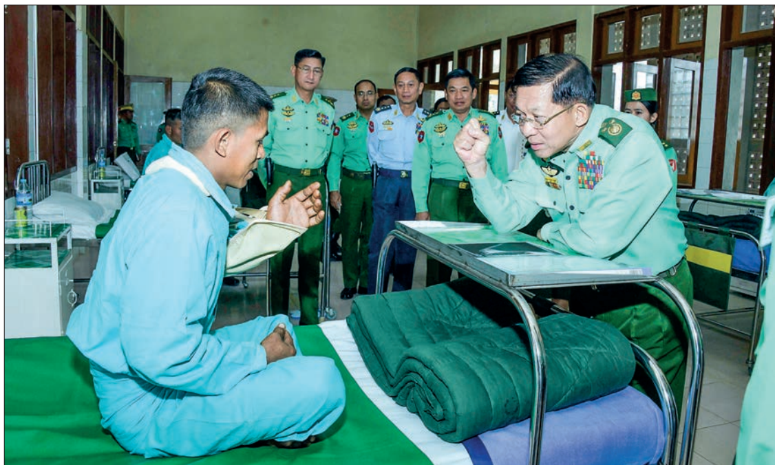
The Senior General comforts the patients at the local military hospital in Aungban.

Actively serving the duties will contribute much to the improvement of their lives. They have to emphasize proper lifestyle to have good health conditions. Tatmadaw successfully produces agricultural and livestock products including tissue bananas for Tatmadaw members and their families to eat nutritionally.