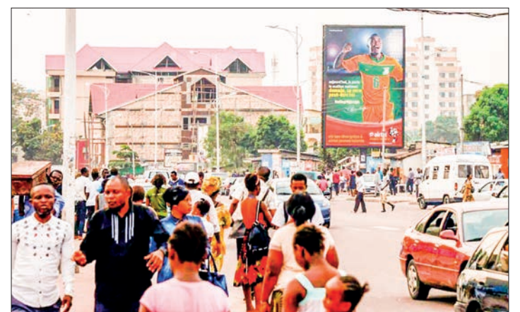
People and vehicles along a Kinshasa street.

In the Angolan capital Luanda, Macron held talks with his counterpart Joao Lourenco, calling the oil-rich country a “strategic partner in the region”. — AFP