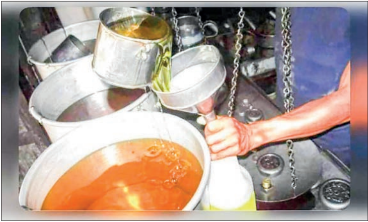
Palm oil is pictured being sold at a grocery shop.

However, the demand is still low. On 3 March, the price stayed below K7,000 per viss, a seller Ko Swe Myint told the GNLM. The market price of palm oil is positively related to the exchange rate and supply from the importing countries.