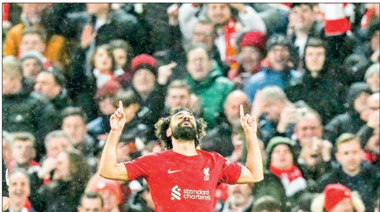
Liverpool's Egyptian striker Mohamed Salah celebrates after scoring their sixth goal during the English Premier League football match between Liverpool and Manchester United at Anfield in Liverpool, north west England on 5 March 2023.

Liverpool close to within three points of fourth-placed Tottenham with a game in hand