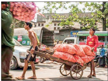
Freight workers seen at Bayintnaung brokerage in Yangon.