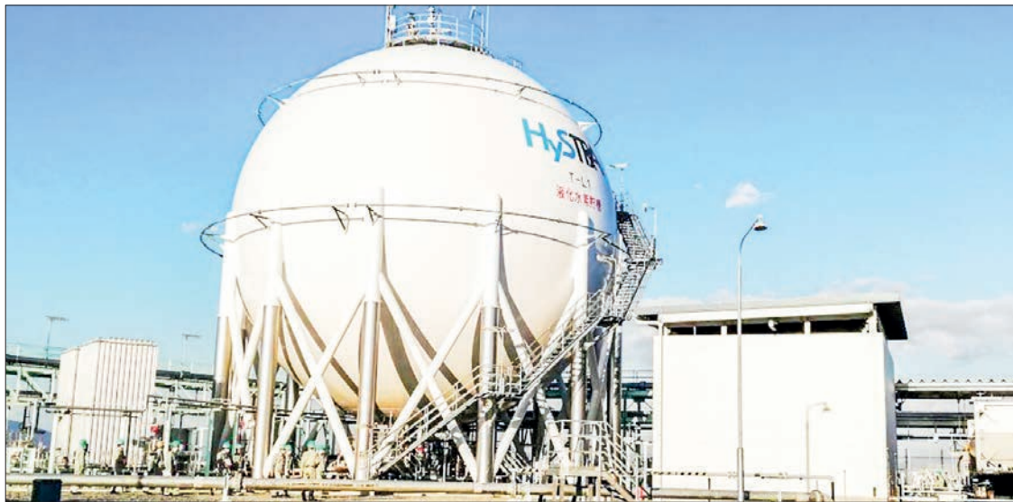
A 2,500 cubic-meter tank containing liquid hydrogen at Kobe Port Island plant in Kobe, Hyogo Prefecture.

“In Asia, we should hold as many energy options as possible, and hydrogen and ammonia are options,” he said, underscoring hydrogen could be a valuable source of energy in making clean energy transitions, especially in a region prone to natural disasters.