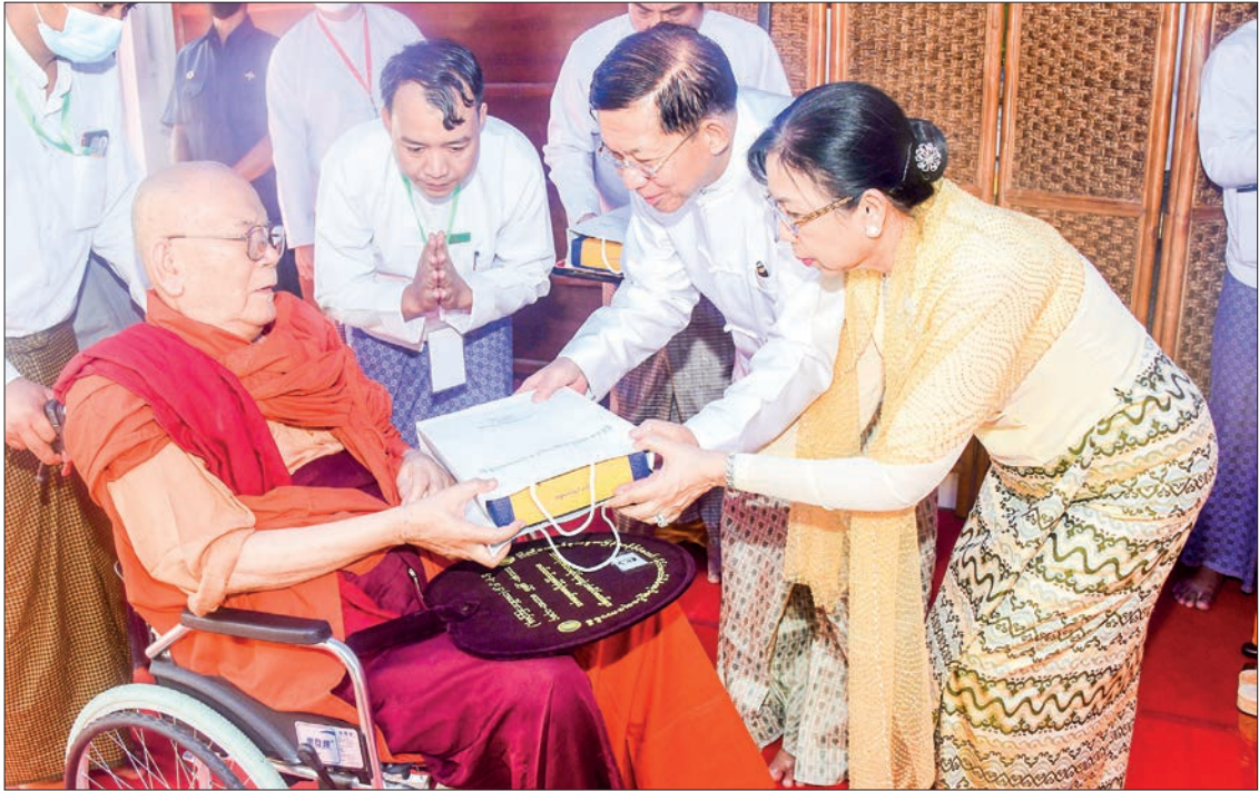
The Senior General and wife offer alms to a title recipient Sayadaw.

SAC members, Union level officials, Union ministers, senior military officers from the Office of the Commander-in-Chief and