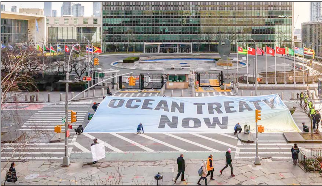
Activists from Greenpeace display a banner outside the United Nations headquarters during negotiations on a treaty to protect the high seas.