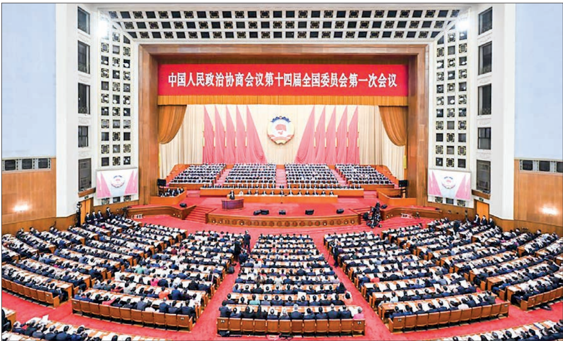
The opening meeting of the first session of the 14 th National Committee of the Chinese People's Political Consultative Conference (CPPCC) is held at the Great Hall of the People in Beijing, capital of China, 4 March 2023.

CHINA'S top political advisory body kicked off its annual session on Saturday, marking the start of the "two sessions" in a crucial year as China gathers steam for building a great modern socialist country. President Xi Jinping and other Chinese leaders attended the opening meeting of the first session of the 14 th National Committee of the Chinese People's Political Consultative Conference (CPPCC) at the Great Hall of the People in Beijing. Wang Yang, chairman of the 13 th CPPCC National Committee, delivered a work report to the CPPCC National Committee session, in which he said the political advisory body has built broad consensus and contributed wisdom and strength to achieving the two centenary goals. The "two sessions" refer to the annual meetings of the