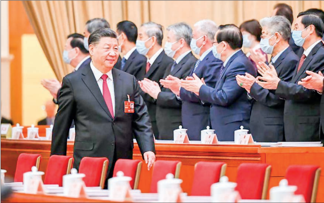
Xi Jinping arrives for the opening meeting of the first session of the 14 th National People's Congress (NPC) at the Great Hall of the People in Beijing, capital of China, 5 March 2023.

Xi Jinping attended the opening meeting of the first session of the 14 th National People's Congress (NPC) on Sunday morning in Beijing. The first session of the 14 th National People's Congress (NPC), China's national legis-