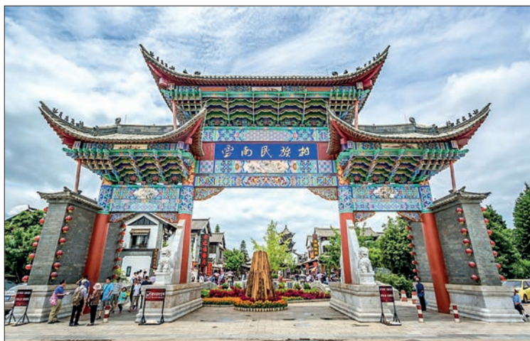
Yunnan Ethnic Village entrance in Kunming, southwest China’s Yunnan Province.

TOURISTS taking selfies have lined the roads of Fengyangyi Village in southwest China’s Yunnan Province since the soap opera Meet Yourself was filmed there, garnering more than 3.8 billion views.