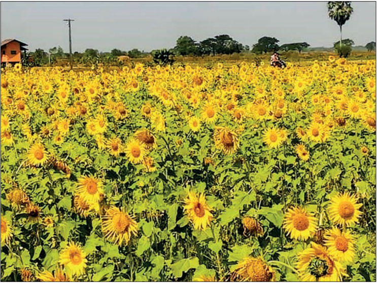
Sunflower plants bearing flowers thriving in the farm.

acres. Summer paddy of 6,112 acres were harvested, yielding 76.32 baskets (holds 16 visses) per acre. In oil crops, 81 acres of monsoon peanuts and 2,799 acres of winter peanuts were planted, and monsoon peanuts yielded 27.89 baskets per acre while winter peanuts produced 50.23 baskets per acre from 115 acres of harvested areas. It has been grown 4,931 acres of winter sesame, 14 acres of summer sesame, six acres of monsoon sunflower and 8,963 acres of winter sunflower. In harvesting four acres of monsoon sunflower, 10.75 baskets were produced