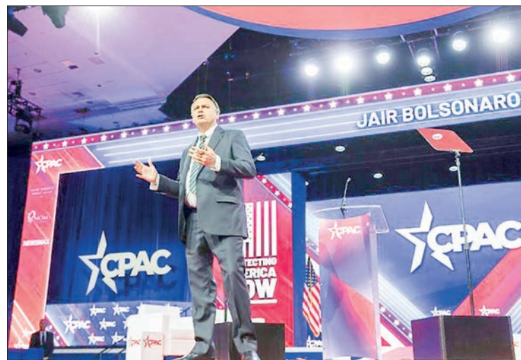
Former Brazilian president Jair Bolsonaro speaks during the 2023 Conservative Political Action Coalition (CPAC) Conference.

The 67-year-old Bolsonaro — effectively a warm-up act for Trump's keynote address at the convention later Saturday —