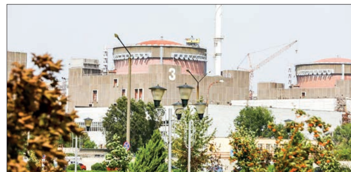
Photo taken on 22 August 2022 shows the Zaporizhzhia nuclear power plant.