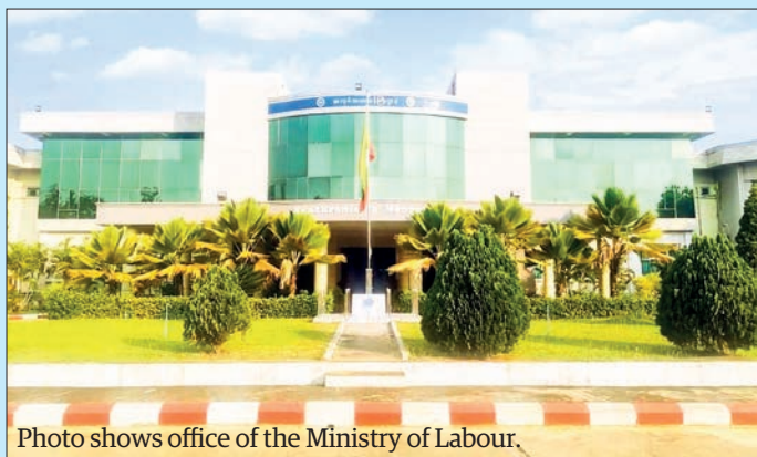
Photo shows office of the Ministry of Labour.

THE Ministry of Labour announced on 3 March that the licence of eight overseas employment agencies was temporarily suspended.