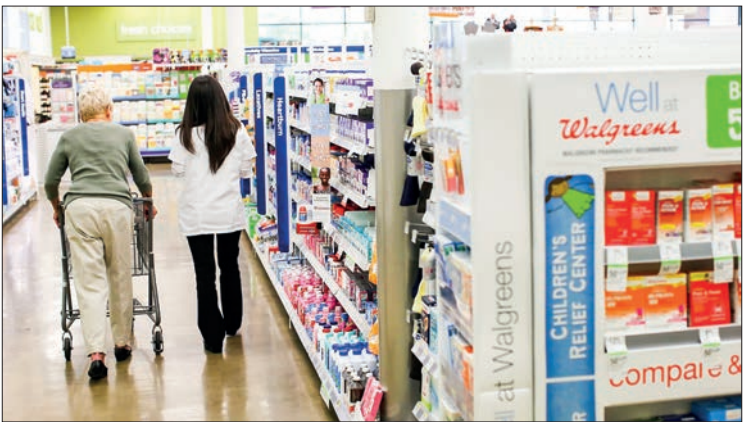
The White House on Friday expressed regret at US pharmacy giant Walgreens' decision to not distribute abortion pills in some 20 states after "dangerous" pressure from anti-abortion officials. A pharmacist helps a customer at a Walgreens pharmacy in Wheeling, Illinois.