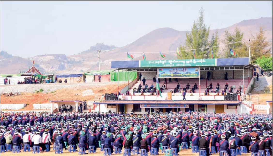
The 76 th Anniversary of Pa-O National Day ceremony in progress in Taunggyi on 5 March.

and the Pa-O ethnic people are enjoying the fruits of peace and development, he continued.