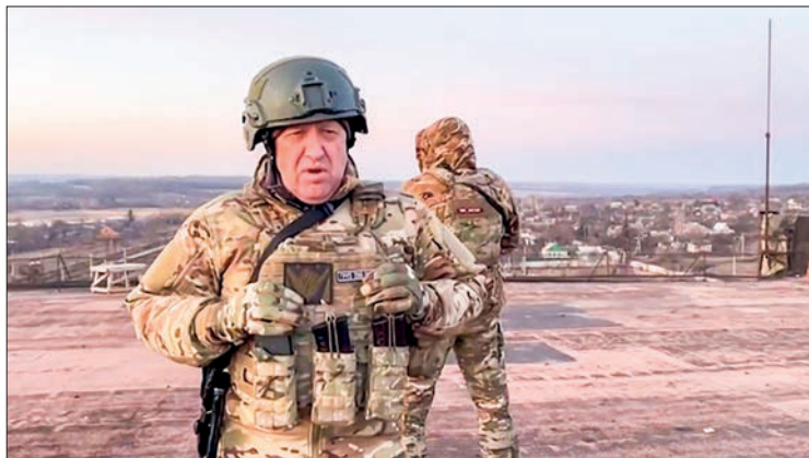
In his latest video, Prigozhin called on Ukrainian President Volodymyr Zelensky to abandon Bakhmut.

fighting ongoing around Bakhmut, the longest battle of the conflict, which has further exposed rivalries between the conventional army and the Wagner paramilitary group.