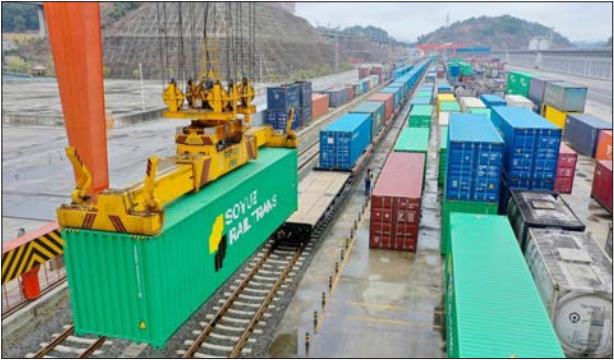
A China-Europe freight train loading containers at Dulaying Station in Guiyang, southwest China’s Guizhou Province, 9 February 2023.

Addressing thousands of amassed delegates, Li will say China will aim to add “around 12 million new urban jobs” this year and bring the urban unemployment rate to around 5.5 per