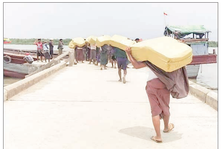
Photo shows Maungtaw border trade camp.

Marine products such as rohu fish, fresh and dried fishes, dried shrimp, plum jam, shoes, Thanakha, coffee mix and rice vermicelli were also exported. — TWA/KZW