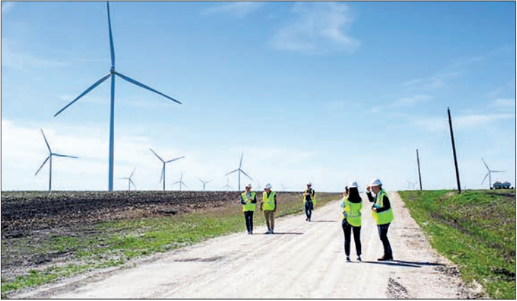
Employees of the French energy company Engie inspect wind turbines in a new project in Dawson, Texas, on 28 February 2023.

Two counties south of Dallas, Navarro and Limestone, symbolize this surprising shift. Inextricably part of the Texas petroleum