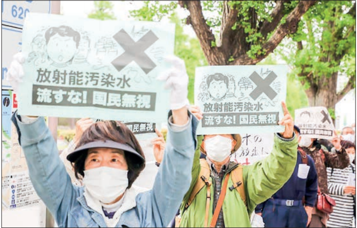
People rally to protest against the Japanese government’s decision to discharge contaminated radioactive wastewater in Fukushima Prefecture into the sea, in Tokyo, capital of Japan, 13 April 2021.

The spillage of contaminated material could largely affect fisheries and marine life, the scholar said. “In the globalized world, people eat fish caught in the Atlantic and Pacific oceans. —Xinhua