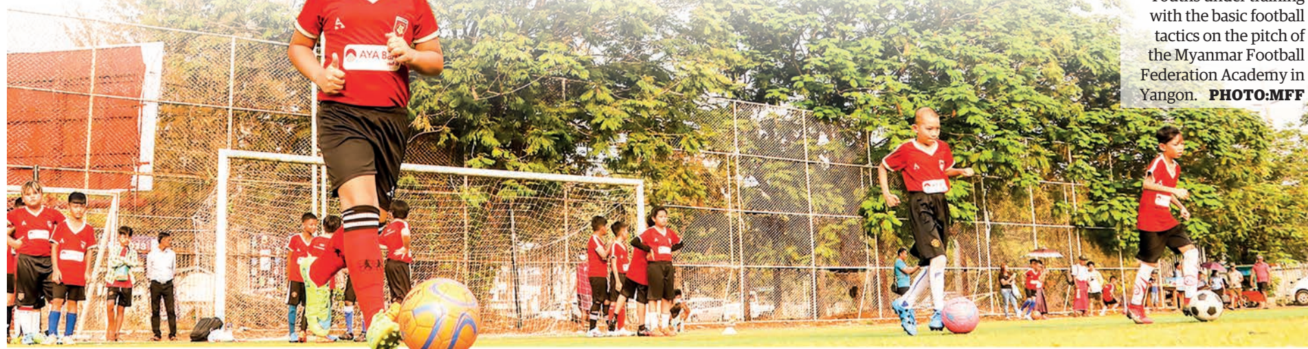
Youths under training with the basic football tactics on the pitch of the Myanmar Football Federation Academy in Yangon.

pervised and trained by Myanmar Football Federation trainers licensed by the Asian Football Confederation. — KZL