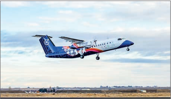
Universal Hydrogen successfully completes first regional airliner using hydrogen fuel.

Twenty-four people applied, including six men and three people in their 40s and 50s. Three were selected in September 2022. —Kyodo