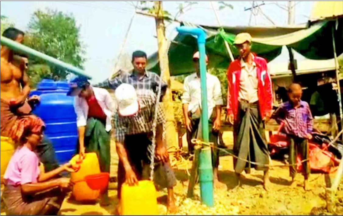
Kyaukpon villagers are happy in successful sinking of tube-well in Sedoktara Township.

DURING summers, local people of Kyaukpon Village in Sedoktara Township, Minbu District, Magway Region, en-