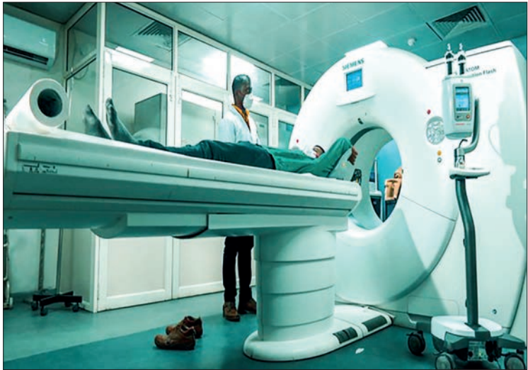
India, already implementing changes to make the nation healthier, has doubled down on its efforts to create a robust healthcare infrastructure after the pandemic took a massive toll.

THE World Bank will provide a 1 billion US dollar loan to India to support the country's health sector for pandemic preparedness and enhanced health service delivery, a finance ministry