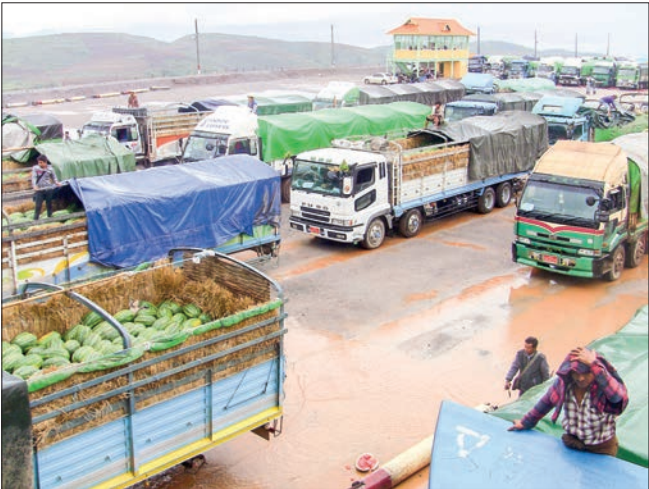
Cargo trucks seen in Mawtaung trade camp compound.

The main export items were various fishes, shrimps, crabs, banana, chilli, onion, betel leaves, Nipa leave, oil palm paste and brooms, and the main import items were fruits, empty canned fish, fish meals, brick tiles, and shrimp hatchlings. – TWA/KZL