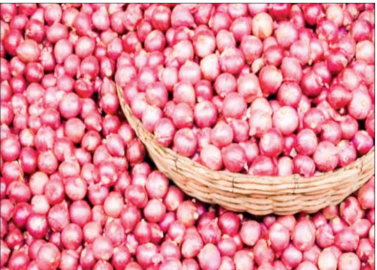
Monsoon onions which flow into Yangon market.

Among the monsoon onions exported to Bayintnaung market, Myittha onions are the most, fetching K300/400 per viss higher than other onions. The