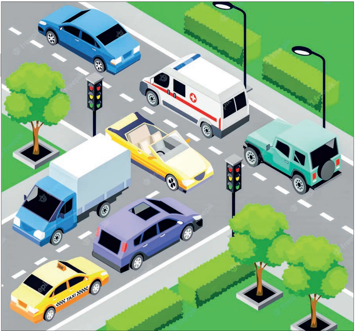
Traffic congestion is a condition on road networks that occurs as use increases, and is characterised by slower speeds, longer trip times, and increased vehicular queuing.

Encourage active transportation: Encouraging walking, cycling, and other forms of active transportation can reduce the number of cars on the road and ease congestion. This can be done through infrastructure improvements such as bike lanes and pedestrian paths, as well as through education and aware-