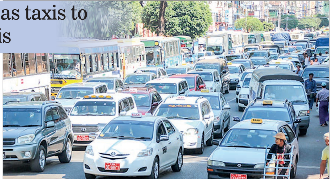
City taxis are seen in the hub of Yangon city.

At present, there are more than 3,000 cars newly registered as City Taxis, and around 300 cars are being registered every day. There are more than 60,000 vehicles previously registered City Taxis in Yangon Region, according to the YRTC. — TWA/KZW