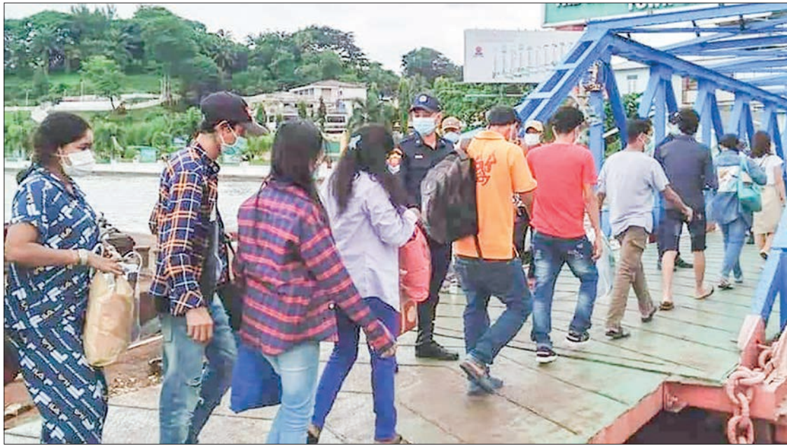
Migrant workers are pictured on the Myanmar-Thai border.

THE Department of Labour stated that the application for overseas employment training courses and overseas worker identification cards (OWICs) are reviewed and permitted within two or three days.