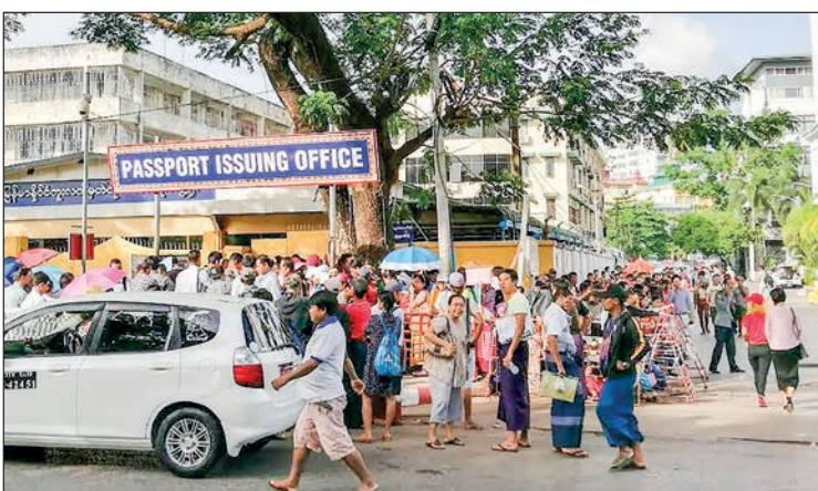
The photo shows the Myanmar Passport Issuing Office in 2018.