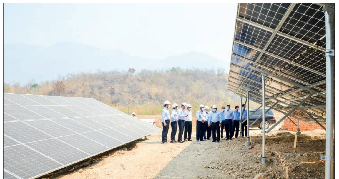
Union Minister U Thaung Han inspects the Kinda 30-megawatt Solar Power Plant project in Myittha Township yesterday.

The Union minister and party then arrived at the 500 kV Kanaung Power Sub-Station