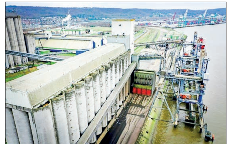
Silos at the port of Rouen in northwest France, where grain exports have surged since the Ukraine war. PHOTO: AFP

It now houses six grain terminals capable of storing 900,000 tonnes, and up to 110,000 tonnes can be loaded onto ships in a day.—AFP