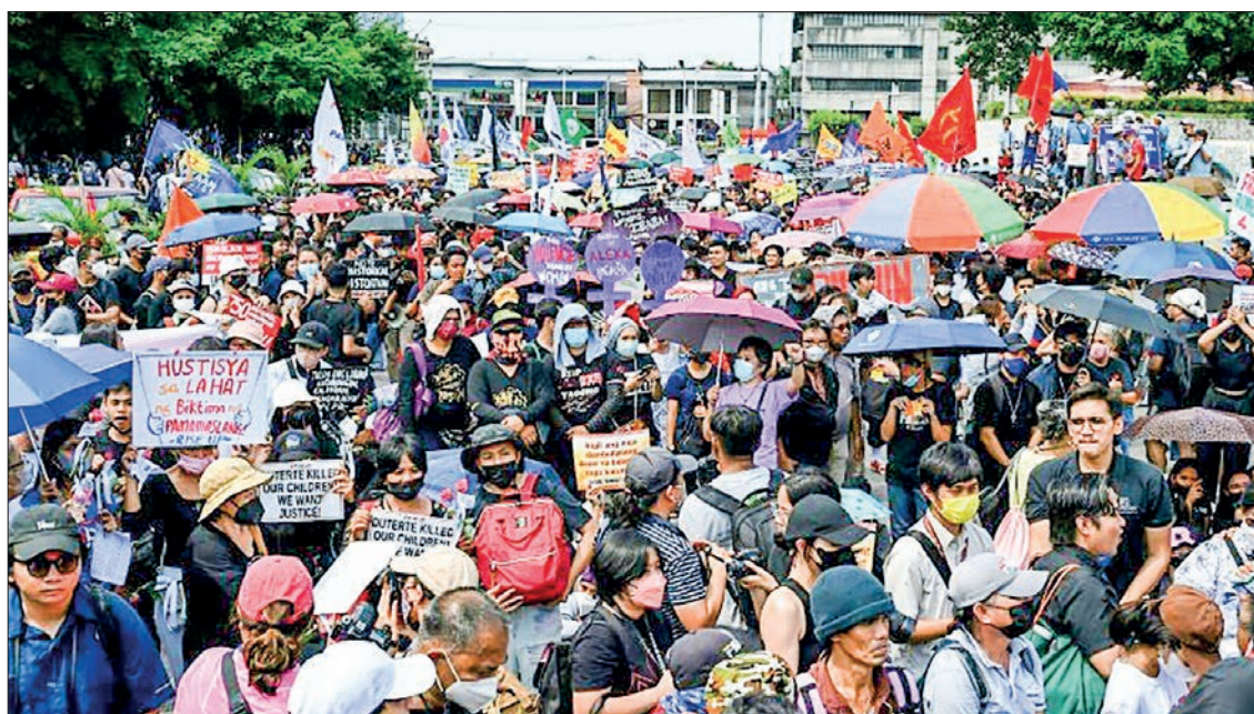
Protesters mark the anniversary of the 1986 'People Power' revolution that ousted dictator Ferdinand Marcos Sr.