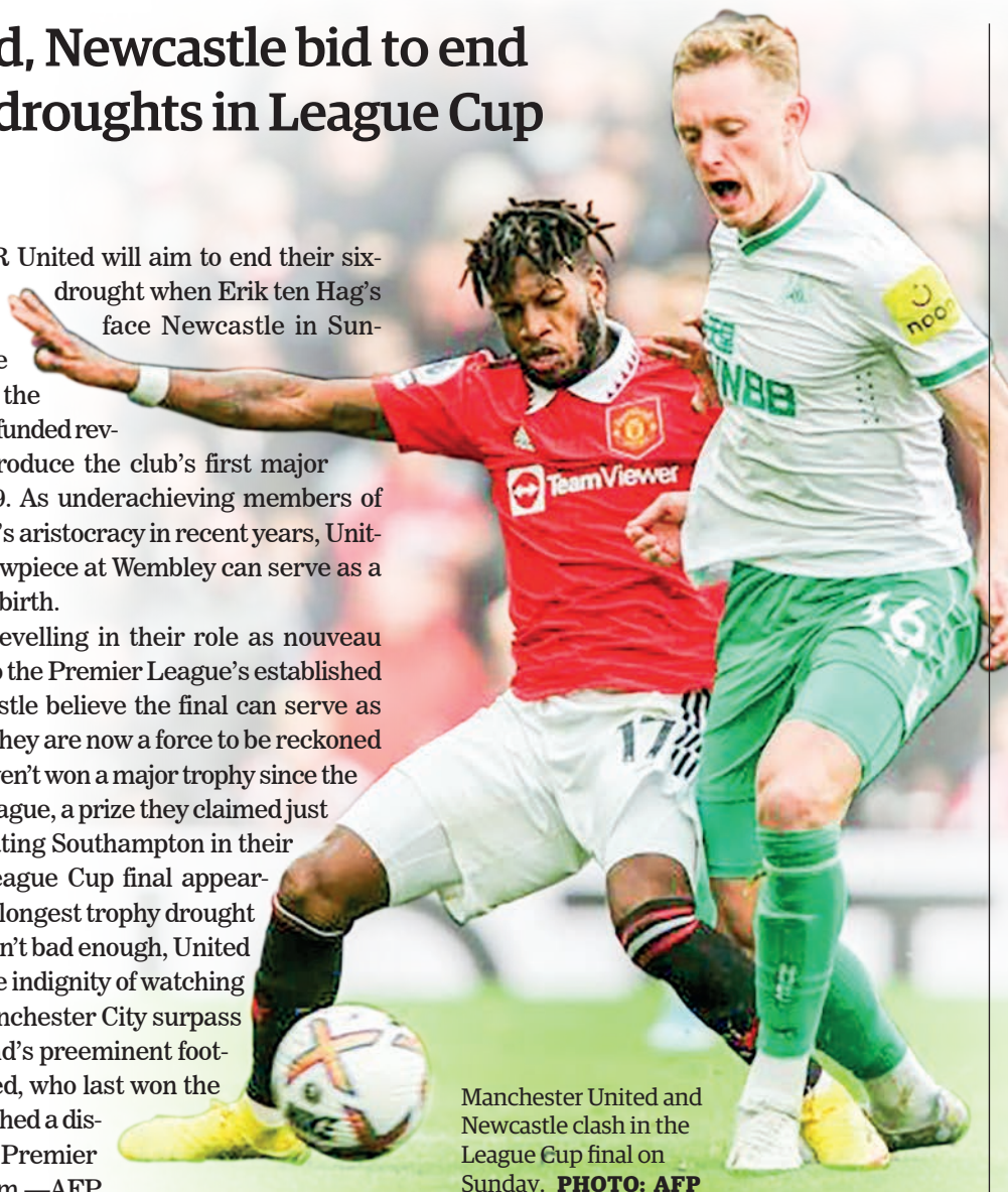
Manchester United and Newcastle clash in the League Cup final on Sunday.

However, revelling in their role as nouveau riche irritants to the Premier League's established powers, Newcastle believe the final can serve as concrete proof they are now a force to be reckoned with. United haven't won a major trophy since the 2017 Europa League, a prize they claimed just weeks after beating Southampton in their most recent League Cup final appearance. As if their longest trophy drought for 40 years wasn't bad enough, United also suffered the indignity of watching bitter rivals Manchester City surpass them as England's preeminent football force. United, who last won the title in 2013, finished a dismal sixth in the Premier League last term.—AFP