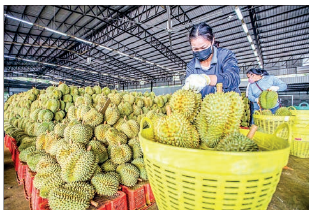
A worker arranges durians at a durian processing factory in the Chanthaburi province, Thailand, 5 May 2022.

"The two countries enjoy practical cooperations under mechanisms including the Regional Comprehensive Economic Partnership (RCEP) and mini FTAs between Thailand and provinces of China like Hainan and