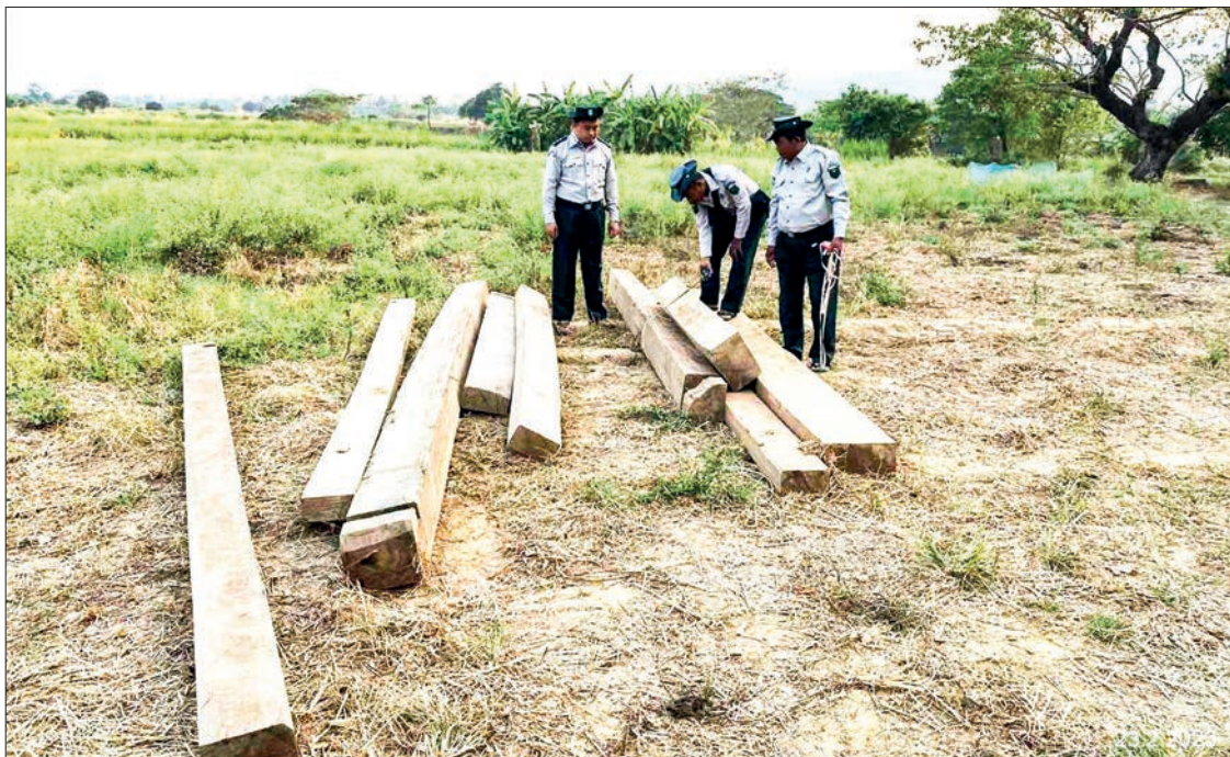
Officials check the confiscated illegal timbers.

A mobile team of the Customs Department inspected vehicles on the Myawady-Hpa-an-Yangon Road on 23 February and confiscated 8,500 kilogrammes of PVC resin worth K13,056,085 that were not declared in the Import Declaration (ID) from a