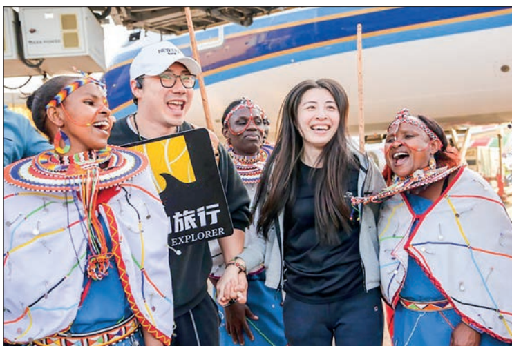
Chinese tourists interact with Maasai performers at Jomo Kenyatta International Airport in Nairobi, Kenya, 11 February 2023. A flight carrying 40 Chinese group tourists arrived at Jomo Kenyatta International Airport in Nairobi on Saturday.

THE World Tourism Organization (UNWTO) on Thursday hailed the importance of the reopening of China for tourism, given the country’s huge impor-