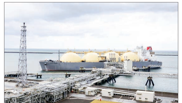
LNG inventories in Japan stood at 5.9 million tonnes as of the end of August, up 17.6 per cent from a year earlier and the largest since comparable data became available in 2008.

Nine major Japanese utilities ramped up their combined LNG stockpiles 56 per cent from a year earlier to 2.63 million tons as of 19 February. The volume is above their average stockpiles in the previous five years, according to data from the Natural Resources and Energy Agency. Concerns over LNG supplies increased after Russia reduced supplies to the European Union, prompting LNG importing countries to scramble to look for other suppliers and intensifying global competition.—Kyodo