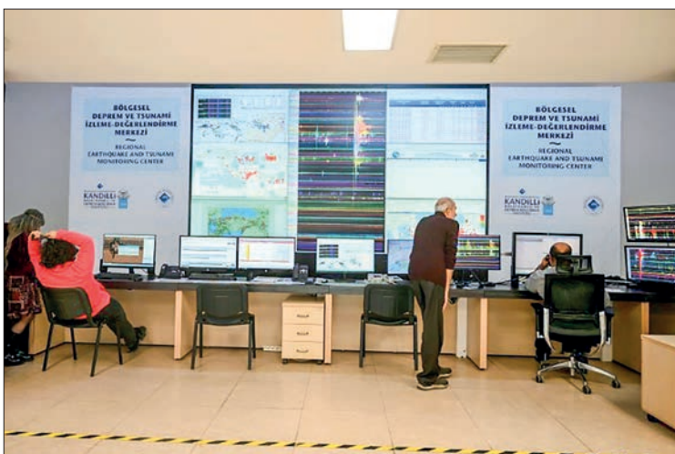
Seismologists at Türkiye's Kandilli Observatory have been monitoring aftershocks since the 6 February quake.

FEARS of another major earthquake have been rekindled in Istanbul since the 6 February disaster that hit Türkiye and Syria, but a prominent Turkish