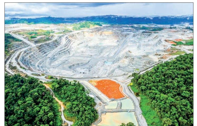
Cobre Panama mine, operated by Canada's First Quantum Minerals, is the largest open-pit copper mine in Central America.

Negotiations on a new contract at the huge open pit mine have been underway for more than a year but have deadlocked on the issue of how much the company would pay to Panama.—AFP