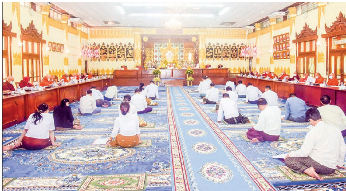
The first day of the eighth 47-member State Sangha Maha Nayaka Committee's 13 th plenary meeting is in progress.