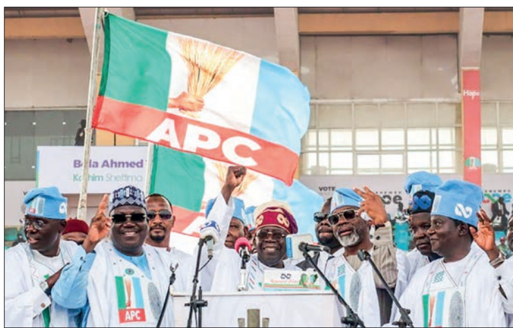
For the first time in Nigeria's modern history, a third candidate has emerged to challenge the ruling All Progressives Congress (APC) and main opposition Peoples Democratic Party (PDP).