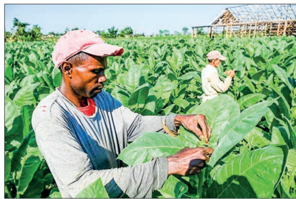
The 23rd edition of The Habano Festival opens in Havana next week after a two-year hiatus due to the Covid-19 pandemic.

For 2022, the group posted a 17 per cent drop in net profit to 19.1 billion kronor ($1.8 billion).—AFP