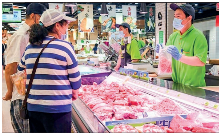
Customers buy meat at a Chaoshifa supermarket branch in Haidian District of Beijing, capital of China, 14 June 2020.

BRAZIL, the world’s biggest beef producer, suspended exports to China Thursday after detecting a case of mad cow disease, though experts believe it is the less-dangerous “atypical” variant, said Agriculture Minister Carlos Favaro.