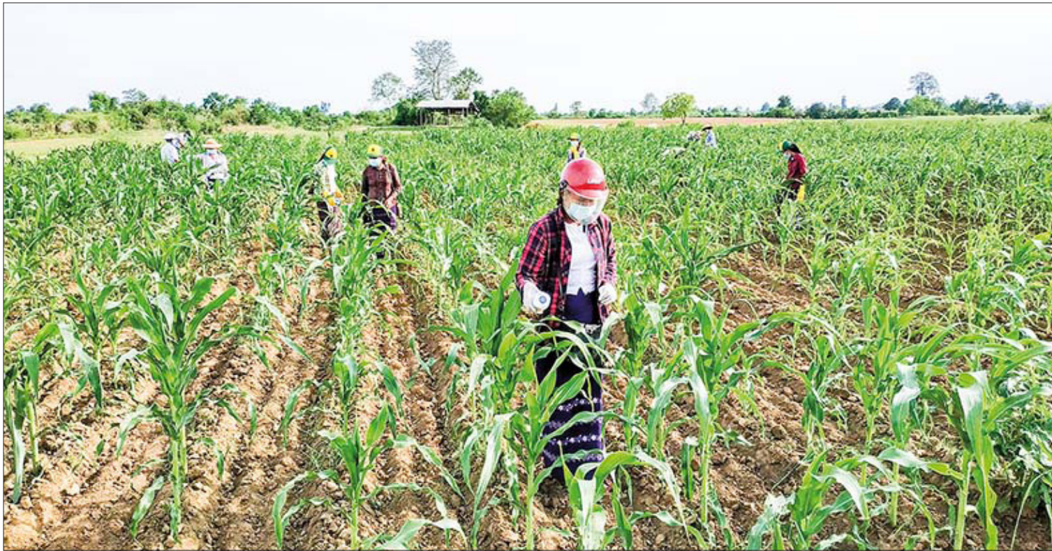
Myanmar exported 2.3 million tonnes of corn to foreign trade partners in the 2020-2021 financial year. The majority of them were sent to Thailand and the remaining went to China, India and Viet Nam. Growers are pictured working on the corn plantation.

T HE price of corn declined amid weak demand from foreign trade partners, according to Yangon Region Chambers of Commerce (Bayintnaung Wholesale Centre).