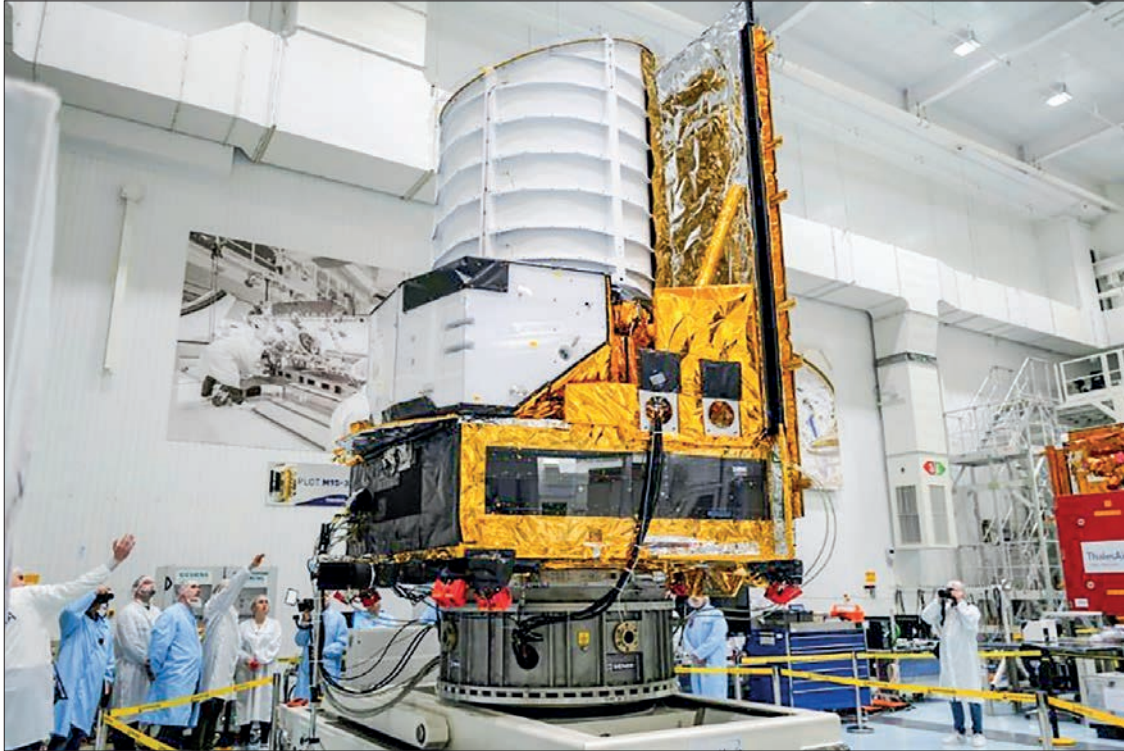
The European Space Agency's Euclid spacecraft, which launches in July on a mission to probe dark matter and dark energy.

FOR now, Europe's Euclid spacecraft sits quietly in a sterilized room in the south of France, its golden trim gleaming under the fluorescent light.