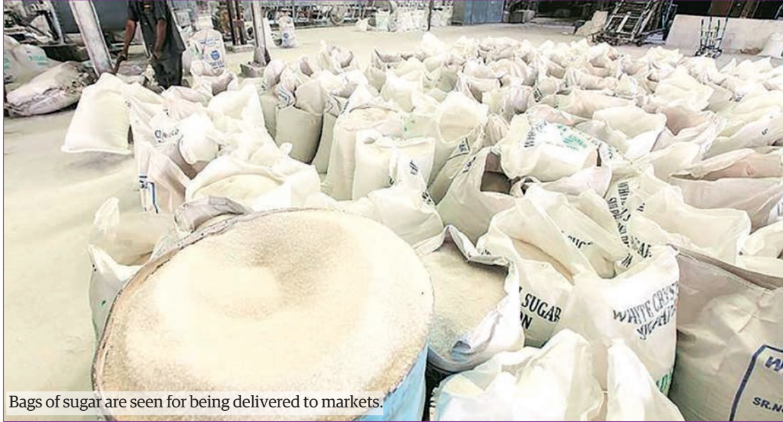
Bags of sugar are seen for being delivered to markets.

THE price of sugar spiked at the end of February and hit a new peak of K3,080 per viss in the wholesale market, Ko Kyaw Tun, a trader who sends the goods to the regions outside Yangon, told the Global New Light of Myanmar (GNLM). The prices soared to K2,370 from K2,260 per viss on 7 September 2022, showing an increase of K800 per viss.