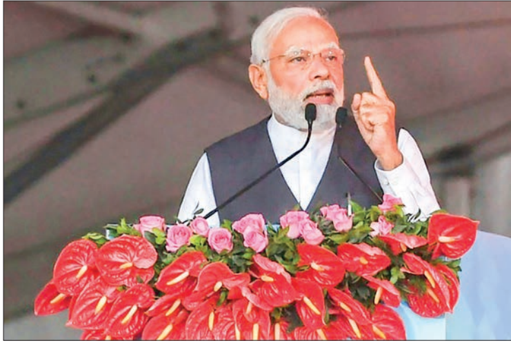
Prime Minister Narendra Modi joined others in calling for the World Bank to widen its remit beyond tackling poverty.

INDIAN Prime Minister Narendra Modi added his voice Friday to calls for reform of global lenders such as the World Bank, as G20 finance ministers and central bank heads met.