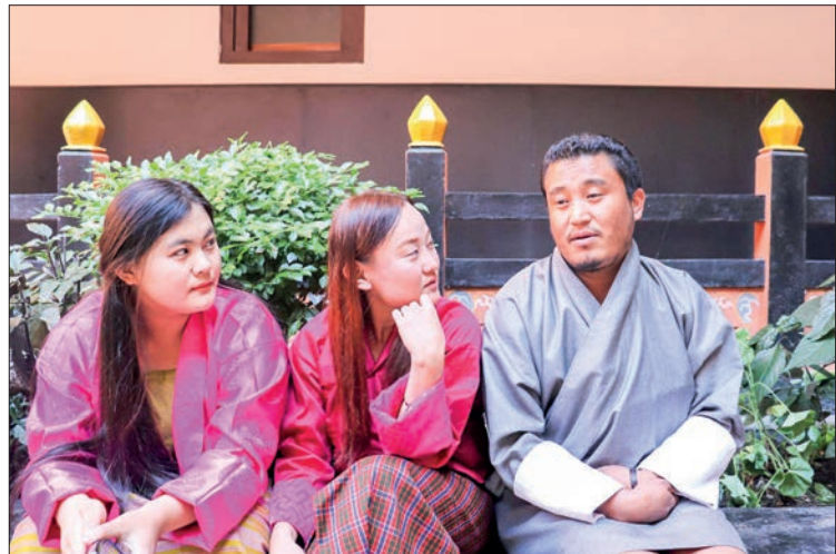
As per the report by Bhutan Live, for a country to ensure the well-being of its people, it requires a whole-of-society approach.

We had a huge governance transformation whereby now responsibility and, mandates have all been clarified. Now I think it’s a fertile ground to work with agencies to embed in all policies,” he added. —ANI