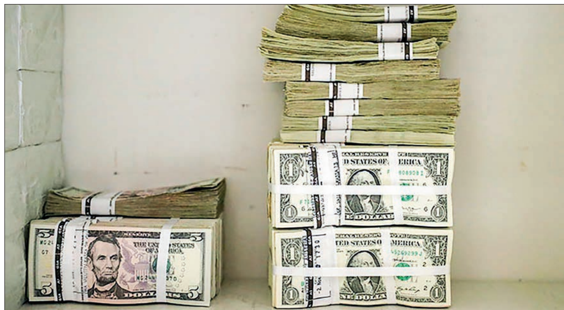
Kyat depreciation against greenbacks persists at K2,860 in the grey market although the Central Bank of Myanmar set the reference exchange rate at K2,100.

The CBM released a notice that the exporters, importers and banking institutions are asked not to elevate the exchange rate. Those banking