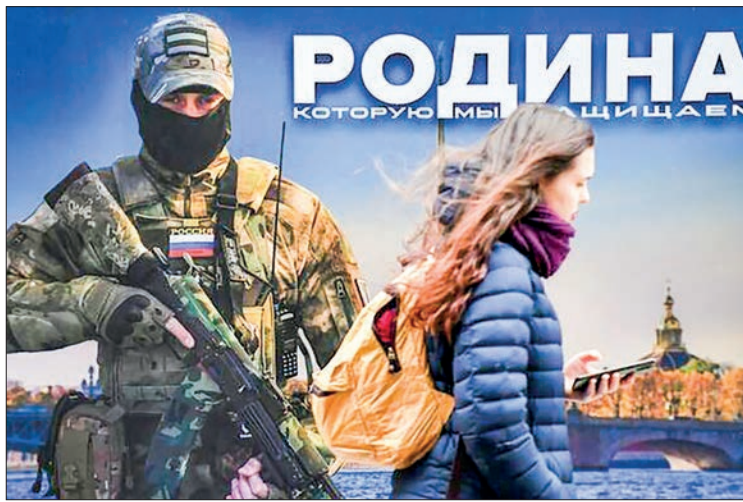
Patriotic posters such as this, saying "The motherland that we defend", attempt to stir up patriotic fervour for the war.

THE Russian Foreign Ministry on Friday praised a paper released by China stating its position on the political settlement of