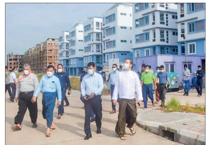
Officials inspect the Public Rental Housing Project in Dagon Myothit (South) Township in 2022.

The 10,000 public rental housing project is being implemented in Nay Pyi Taw, Yangon and Mandalay, aiming for the accommodation of civil servants who have difficulties in living, retired employees and low-income people. A total of 194 buildings and 3,104 apartments are being built in Yangon as the first phase and now about 74 per cent have been completed. — TWA/CT