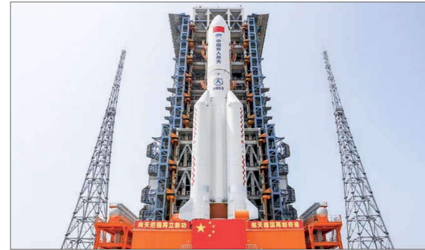
The COVID-19 pandemic brought challenges to China's space industry, making it difficult to guarantee human resources for research and testing activities.

by the CASC, China achieved 39, 55 and 64 space launches in 2020, 2021 and 2022 respectively, up significantly compared to the pre-pandemic period. In 2019, China managed 34 space launches.