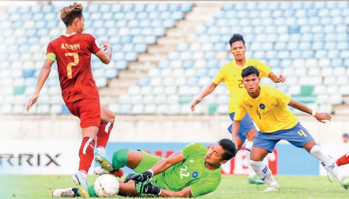
An Ayeyawady United striker (jersey No 7) tries to net a goal in yesterday match.