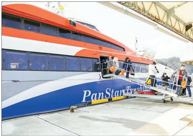
A high-speed boat carrying passengers from Busan, South Korea, is pictured after its arrival at Hitakatsu Port in Tsushima, Nagasaki Prefecture, on 25 February 2023.

"I used to go fishing at least five times a month before the pandemic," said a 63-year-old from Daejeon in the central part of South Korea who boarded a boat from Busan on Saturday morning. "I'm excited about being back for the first time in a long while." A regular boat service between the two ports began in 1999. With jetfoils entering into use in 2011, linking them by a roughly 70-minute ride, Tsushima's popularity soared.—Kyodo