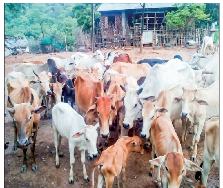
Out of more than 1,000 animals, over 600 cattle are also protected in the sanctuaries. PHOTO: AUNG KAUNG KHA (MANDALAY)

Those who want to make donations can contact 09 975 764 323, 09 402 692 522 and 09 660 850 399. — Aung Kyaw Kha (Mandalay)/KTZH