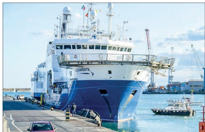
The Geo Barents rescue ship brought 48 rescued migrants to shore in Italy on 17 February.

"It's unacceptable to be punished for saving lives," MSF said, adding that it was considering a possible legal challenge.—AFP