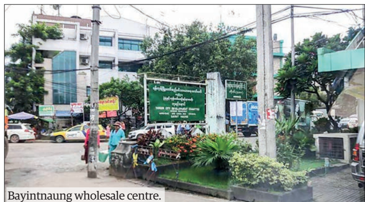
Bayintnaung wholesale centre.