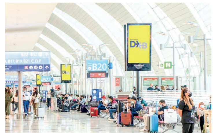
The main business hub of the oil-rich United Arab Emirates is home to one of the world's busiest airports.

The UAE has maintained a neutral stance towards Russia's war in Ukraine, which is nearing its one-year anniversary.—AFP