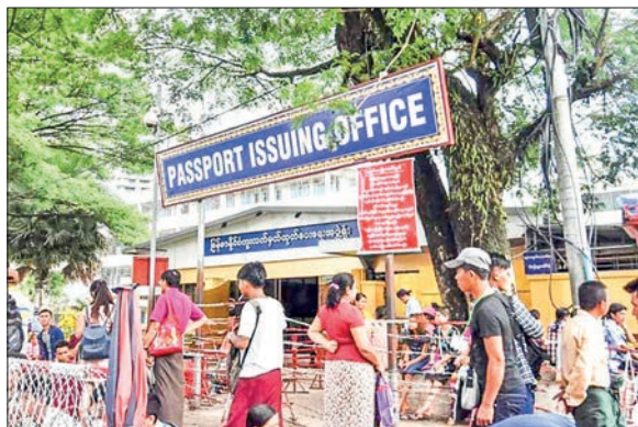
Those who come to apply for passports are seen in front of the passport issuing office.

QR code applications through the online booking system for passport application and the issuance of passports were suspended from 5 December 2022 and from 2 January 2023 respectively. —TWA/KZW