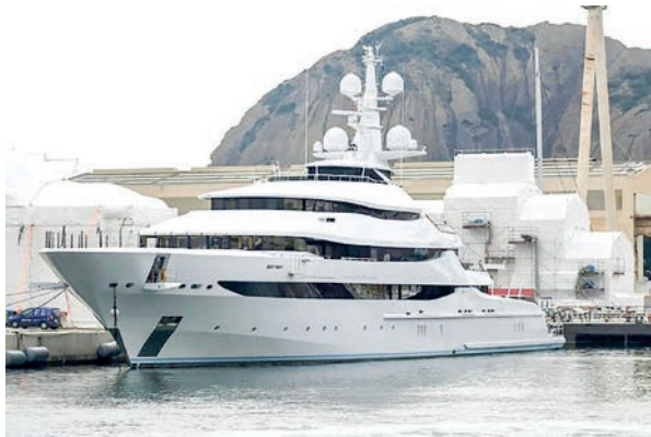
The French government seized the Amore Vero, a superyacht owned by a company linked to Igor Sechin, chief of Russian energy giant Rosneft.

"People were very interested because... it really is a visual symbol of what was happening," Finley told AFP—AFP