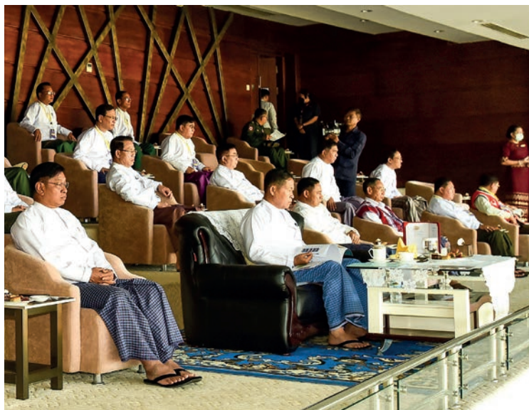
The Vice-Senior General and dignitaries watch the final match between the Meiktila Education Degree College team and the Hpa-an Education Degree College team in Nay Pyi Taw yesterday.