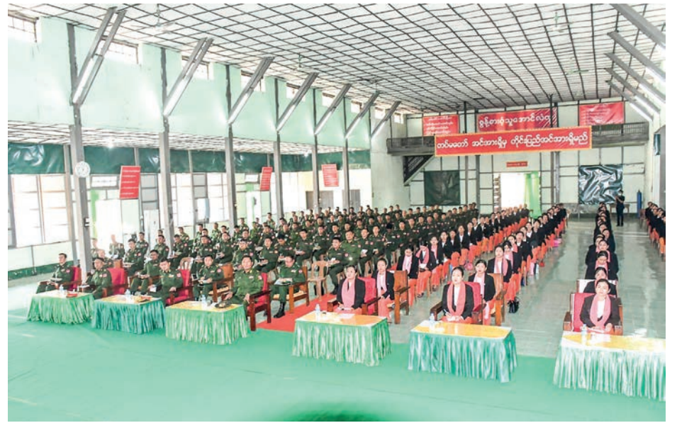
State Administration Council Member Deputy Prime Minister Union Defence Minister General Mya Tun Oo meets officers, other ranks and family members in Chin State yesterday.

greeted officers, other ranks and their family members who were present at the meeting.