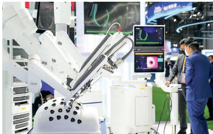
This photo taken on 6 November, 2022 shows a surgical robot exhibited at the Fosun Health booth in the medical equipment and healthcare products exhibition area of the fifth China International Import Expo (CIIE) at the National Exhibition and Convention Centre (Shanghai) in east China’s Shanghai.

“Inspired by sensory functions and performance of real human skin, we have been devoted to making the new e-skin both flexible and transparent to meet aesthetic as well as functional requirements,” Lan said. The all-in-one system of the new e-skin is composed of a transparent supercapacitor, stretchable strain sensors and snakelike electrical resistance.—Xinhua