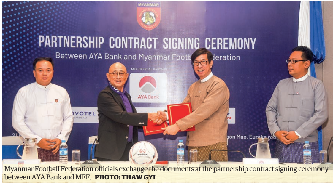
Myanmar Football Federation officials exchange the documents at the partnership contract signing ceremony between AYA Bank and MFF.

THE Myanmar Football Federation and Ayeyarwady Bank held a Partnership Contract ceremony on 21 February at Yangon Novotel Hotel Max to cooperate in the development of Myanmar football sports.