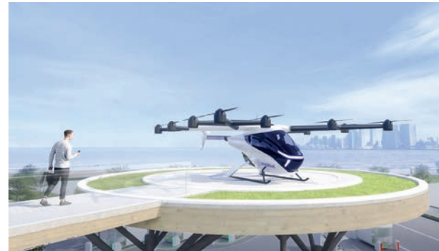
An image of a flying car by SkyDrive Inc.

ANA Holdings Inc., Japan Airlines Co and three other companies have been selected to operate air taxi services during the 2025 World Exposition to be held in Osaka in western Japan, the event's organizer said Tuesday.