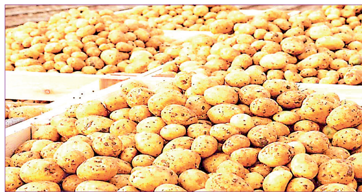
Potatoes from Bangladesh are seen in the market.

potatoes from various regions arrived at the market on 18 February and 66,000 visses entered the market on 20 February. Po-