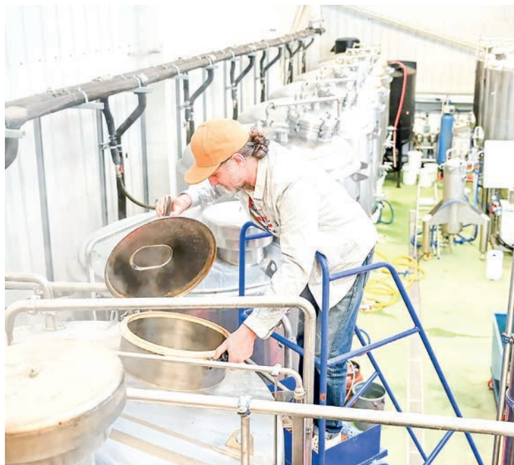
A worker seen at London's Pressure Drop Brewery, north London.

The study found more than nine out of ten firms will continue with the shortened working week