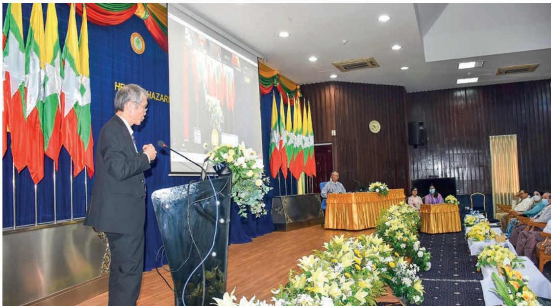
The third-day session of the 51 st Myanmar Health Research Congress is in progress yesterday in Yangon.

THE third day of the 51 st Myanmar Health Research Congress organized by the Ministry of Health was held