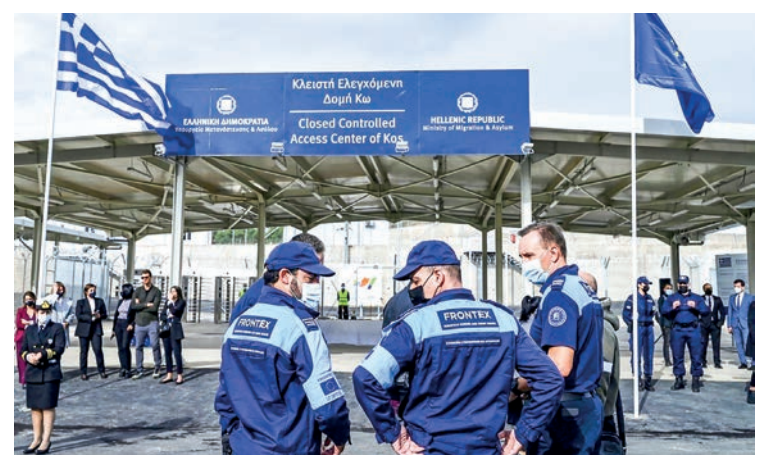
Members of Frontex stand outside the newly closed migrant camp on the Greek island of Kos, 27 November 2021.

According to the EU statistics agency Eurostat, four million Ukrainians took up protected status and only two percent applied for asylum.—AFP