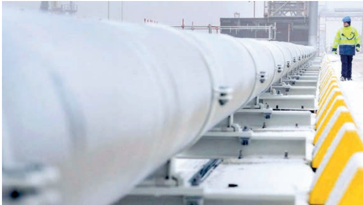
A worker walks past gas pipes that connect a Floating Storage and Regasification Unit ship with the main land in Wilhelmshaven, northern Germany on 17 December 2022.

ONE year into the Russia-Ukraine conflict, France and the rest of Europe are finding themselves in a delicate position, teetering under the impact of inflation, an energy crisis, and slowing economic growth.