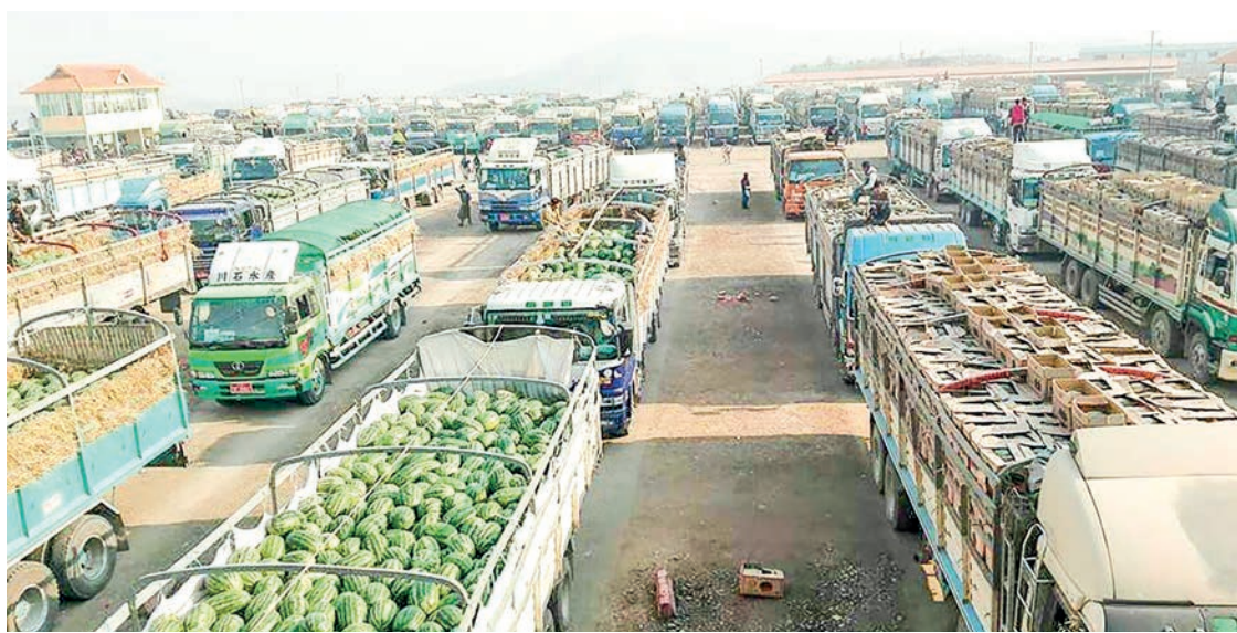
Lorries loaded with watermelons are seen on the Sino-Myanmar border.

Consequently, watermelon was sold out at the depots on the China side and more than 500 trucks queued in line on the Myanmar side.