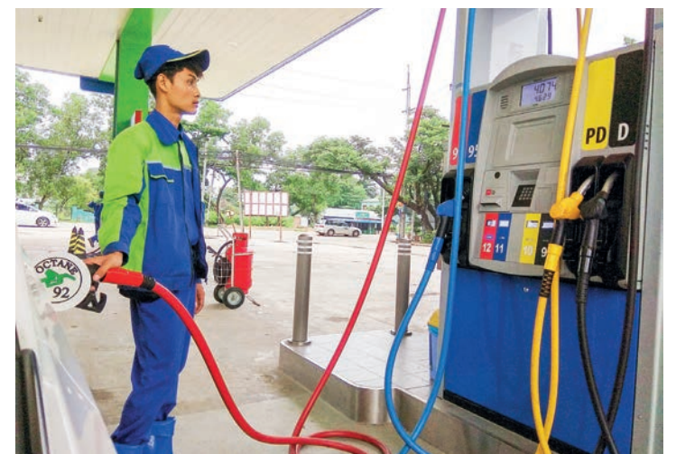
A fuel attendant is seen filling the car with oil.

This month, crude oil prices plunged. Consequently, diesel prices are relatively low compared to gasoline prices. This could contribute to the farming and transportation businesses as it is time to harvest the summer paddy this month. —TWA/EM