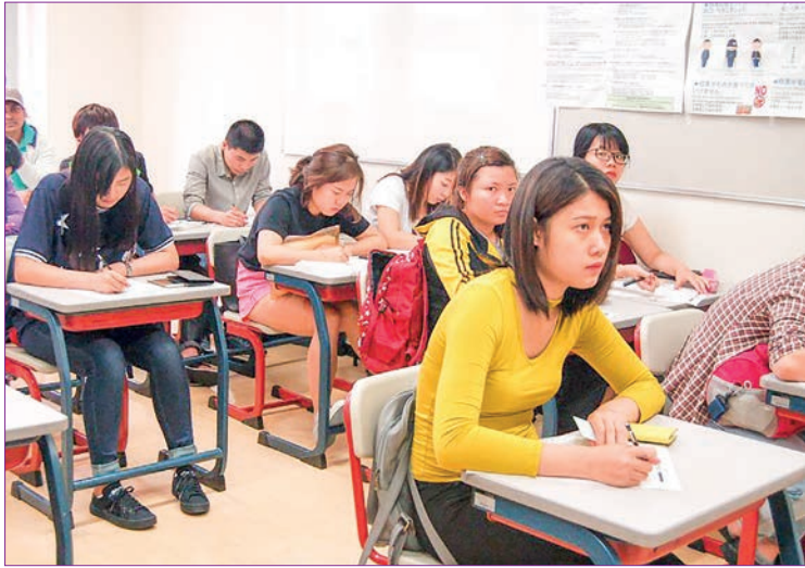
Language learners are seen at one Japanese Language school.

ONLY 150 JLPT forms per school at the most will be sold to Japanese language schools in Yangon and Mandalay, the Myanmar Association of Japan Alumni (MAJA) has announced.