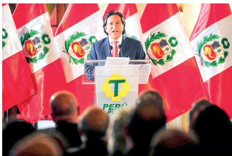
Former Peruvian President Alejandro Toledo speaks during a press conference in Lima on 10 November 2010. Toledo was arrested 16 July in Menlo Park and faces extradition to Peru to answer to corruption charges.

THE United States has authorized the extradition of former Peruvian president Alejandro Toledo, who served from 2001 to 2006, to face charges of corruption in his home country, Peru's prosecutor's office said Tuesday.