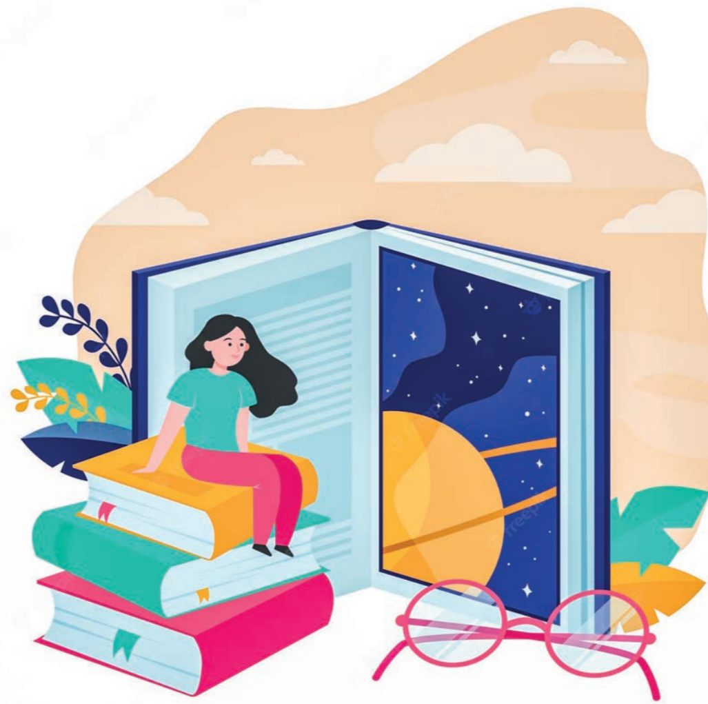
Not only must a reader have a good grasp of the subject matter but also, he should have known vocabulary usage, grammatical rules, modern expressions, and stylistics after a fashion. ILLUSTRATION: REPRESENTATIVE IMAGE / FREEPIK

An article is significantly different from an essay concerning the subject matter and essays can be divided up into a great many varieties: lead-