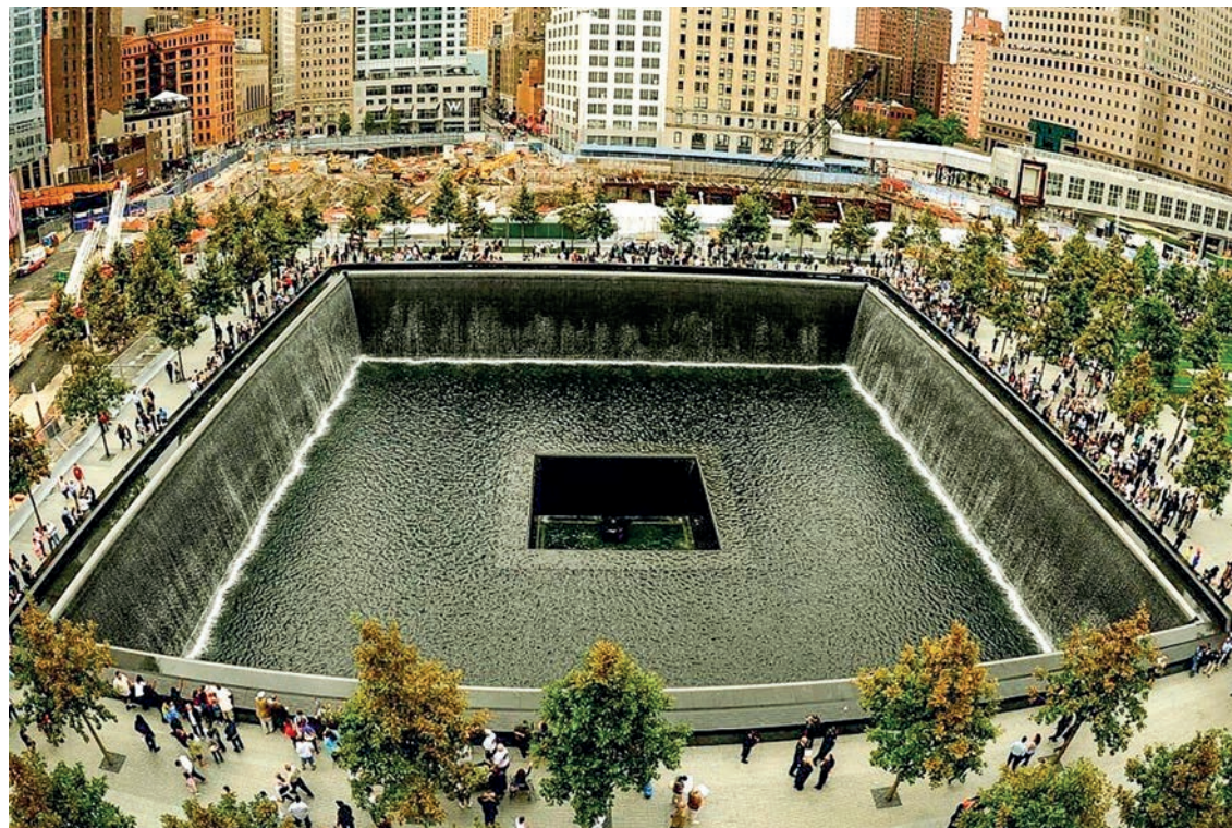
Families line up against the wall of the South Memorial pool during 1 0th anniversary ceremonies at the site of the World Trade Centre in New York.

Daniels also said he was "constitutionally restrained" from awarding the assets to the families because it would effectively mean recognizing the Taliban as the legitimate government of Afghanistan. —AFP