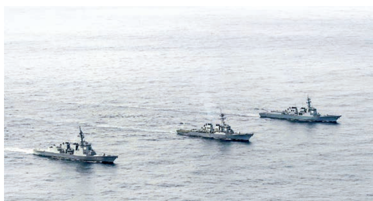
Aegis ships of (from L) Japan, the United States and South Korea engage in joint maritime drills in the Sea of Japan on 22 February 2023.

firings into the Sea of Japan in protest of joint defense drills by the United States with its East Asian allies.