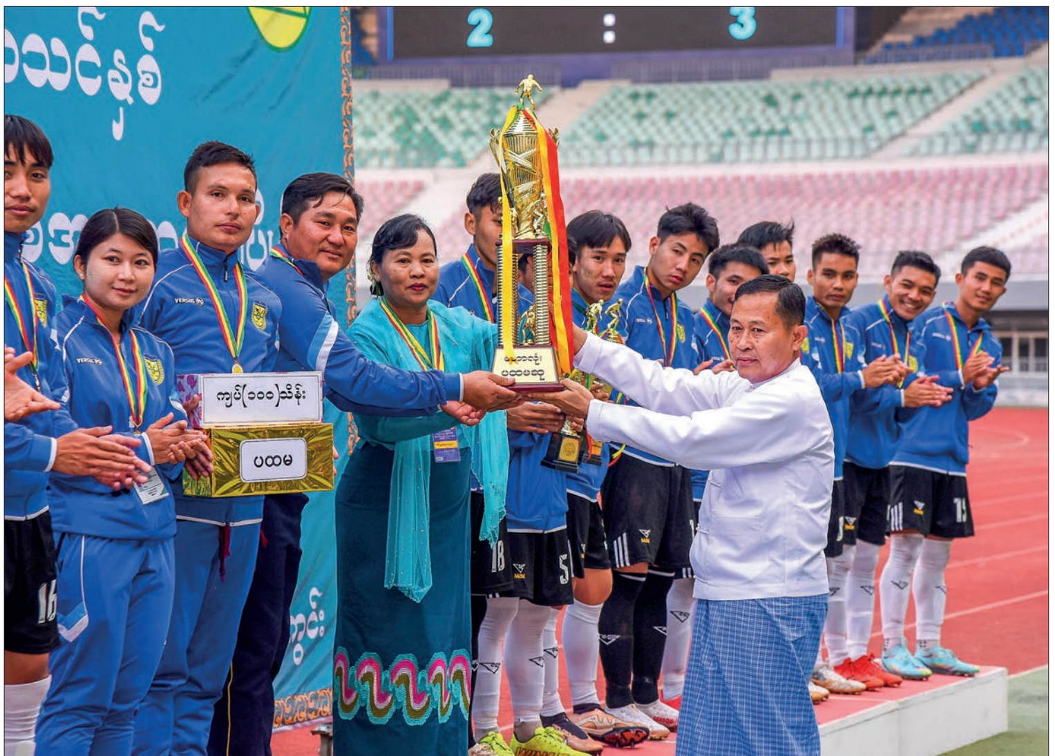
State Administration Council Vice-Chairman Deputy Prime Minister Vice-Senior General Soe Win presents the championship trophy and cash awards to the Hpa-an Education Degree College team in Nay Pyi Taw on 22 February 2023.

As it was the final match, both teams posed pressure on each other starting from the match. The player (No 7) of the Hpa-an Education Degree College team netted an opening goal by showing off his brilliant skills to his team and the Meiktila Education Degree College team equalized the result in the 45 th minute.