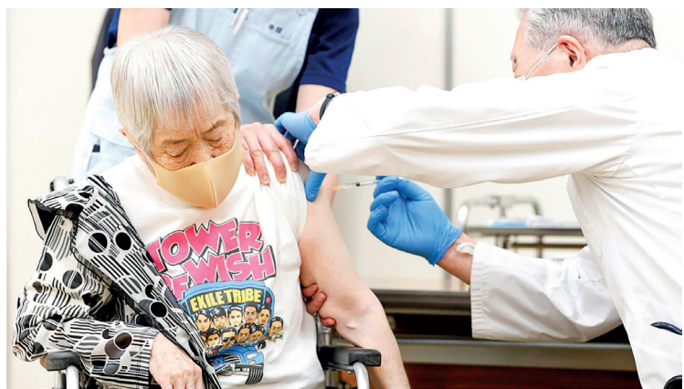
An elderly woman receives her first dose of Pfizer’s COVID-19 vaccine at a special nursing home in Itami, Hyogo prefecture, western Japan, Monday, 12 April, 2021.

JAPAN plans to launch a fresh round of COVID-19 vaccinations from May, starting with the elderly, those with underlying medical conditions and healthcare professionals, health ministry officials said Wednesday.