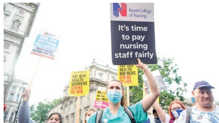
UK nurses are staging the first strikes in their union’s 106-year history after the government rejected their pay demands.

“Both sides are committed to finding a fair and reasonable settlement that recognizes the vital role that nurses and nursing play in the National Health Service and the wider economic pressures facing the United Kingdom,” it said.—AFP