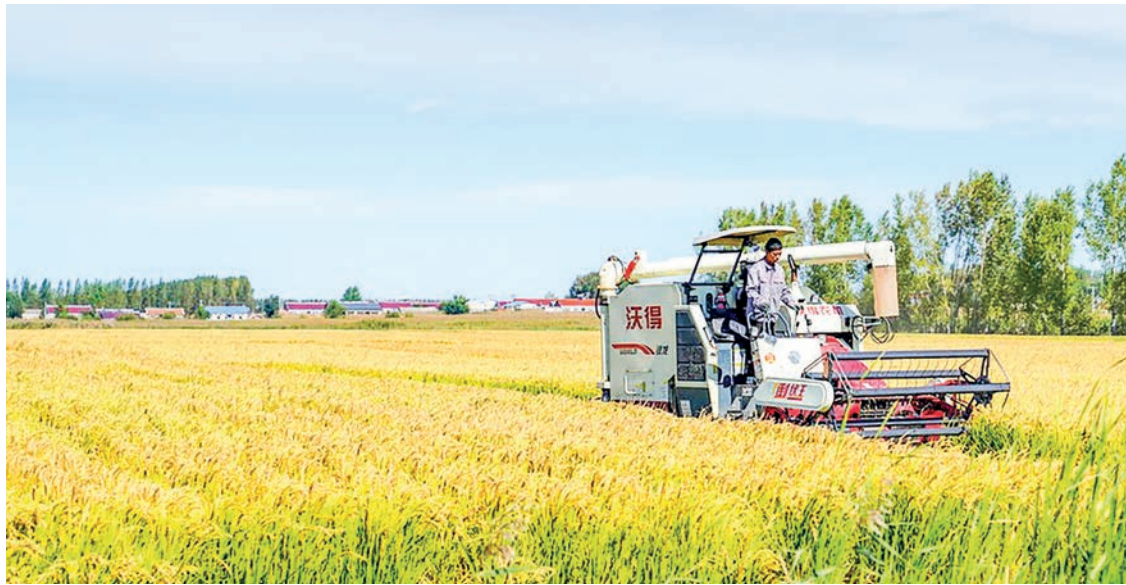
A farmer drives a piece of farming machinery to harvest rice at a family farm in Jiutai District of Changchun, northeast China's Jilin Province, 20 September 2022. Autumn harvest has recently started at the rice-growing areas across the province.

TO ensure stable production and supply, the ports in northwest China's Xinjiang Uygur Autonomous Region are handling a larger volume of imported farming supplies, as the preparations for spring farming are in full swing.