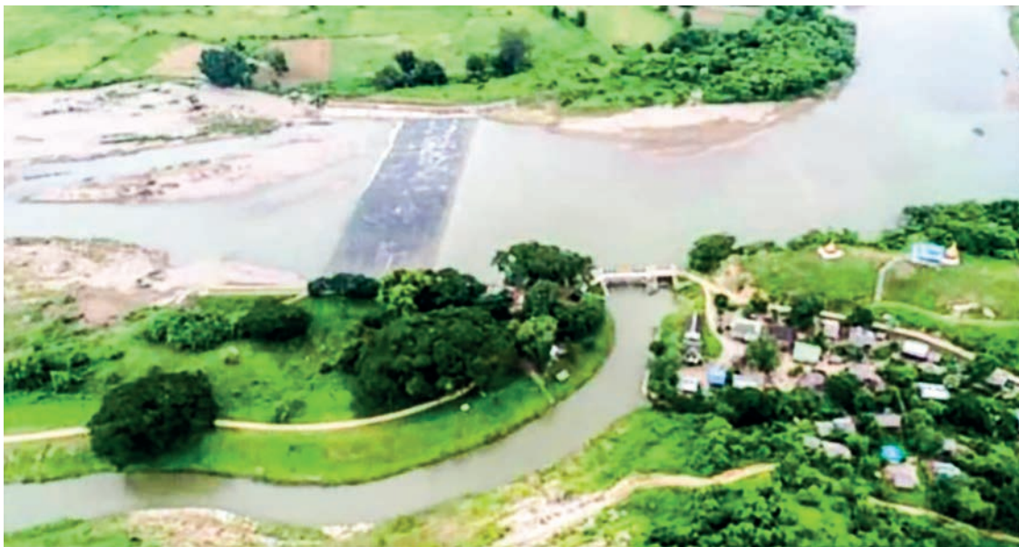
The picture shows a general view of the Mann Chaung plains.

Canal, Mashat Canal, Mahtee Canal, Saku Latkwal Canal, Padaw Canal, Paunglaung/ Theingathu Canal, Sakala Canal, Malthilayoe Canal, Pwaykyit Canal, Nalinthi Canal, Myaungnet Canal, Shapin Canal, Kanthit Canal, Mingalar Canal, Htanyone Canal, Yaypuy-