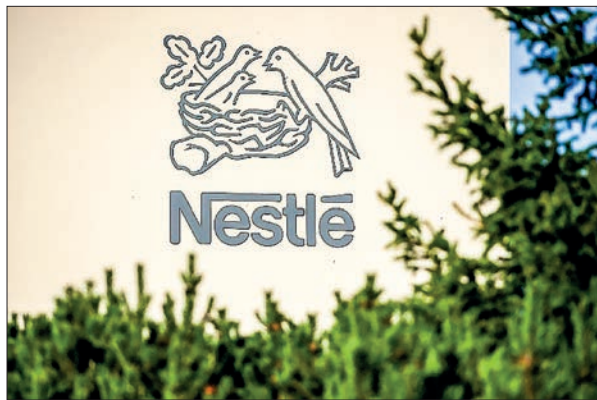
Nestle, which makes Nespresso capsules, Maggi bouillons, KitKat chocolate bars and Purina pet food, said sales rose by 8.4 per cent to 94.4 billion Swiss francs (95.5 billion euros, $102.3 billion) in 2022.

“Last year brought many challenges and tough choices for families, communities and businesses,” Nestle chief executive Mark Schneider said. “Inflation surged to unprecedented levels, cost-of-living pressures intensified and the effects of geopolitical tensions were felt around the world,” he added, referring to the fallout from Russia’s invasion of Ukraine.—AFP