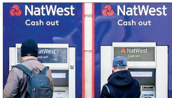
NatWest’s share price tanked despite its bumper earnings results.

BRITISH bank NatWest on Friday posted a jump in annual profits as it trimmed costs and the sector benefitted from rising interest rates. Its share price tanked almost seven per cent, however, despite NatWest announcing a big buyback of shares, with analysts blaming profit-taking after the bank’s stock value climbed strongly in the final quarter of 2022. There is also a fear that the sector could face a surge in bad loans with Britain facing a cost-