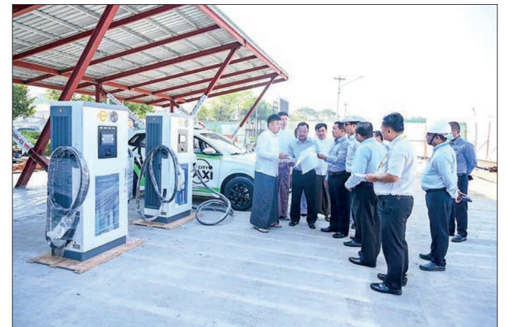
An initial testing of the solar power system is shown in the picture.

Forty BYD E2 model electric vehicles have been imported into the country to date. The test run will be carried out with 20 EV cabs at the Yangon International Airport and the Nay Pyi Taw Thabyaygon Market. — TWA/CT