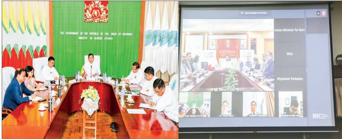
The virtual meeting between Union Border Affairs Minister Lt-Gen Tun Tun Naung and Minister of Tourism, Culture and Development of North Eastern Region of India is Shri G. Kishan Reddy in progress.

THE virtual meeting of Union Minister for Border Affairs Lt-Gen Tun Tun Naung and Minister of Tourism, Culture and Development of North Eastern Region of India Shri G. Kishan Reddy was held at the meeting room of the Ministry of Border Affairs yesterday evening.