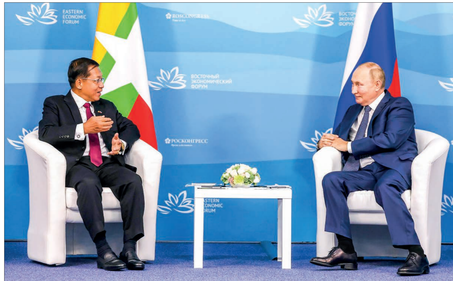
SAC Chairman Prime Minister Senior General Min Aung Hlaing holds talks with President Vladimir Vladimirovich Putin on 7 September 2022.

It is surprising, but nowadays, 250 years later, these observations sound very topical. The Burmese authorities passed