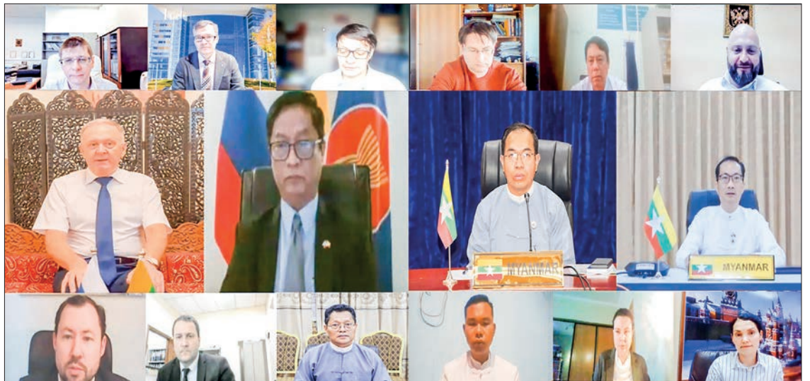
The workshop to commemorate the 75 th Anniversary of Myanmar-Russia Diplomatic Relations is held virtually yesterday.