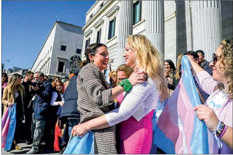
Spain's Minister for Equality Irene Montero (left) says the move is a step toward addressing a health problem that has been largely swept under the carpet.

SPAIN'S parliament approved Thursday a law granting paid medical leave to women suffering severe period pain, becoming the first European country to advance such legislation.