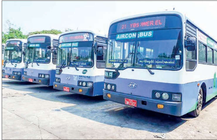
YBS buses are pictured at the city bus station.

The newly-installed embossed number plate has a good security system with the addition of township symbol numbers and it can prevent the installation of