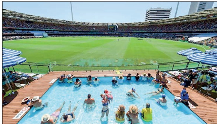
The Gabba stadium will be revamped for the 2032 Olympics.

AUSTRALIA said Friday it will spend Aus$7.0 billion (US$4.8 billion) on venues for the 2032 Brisbane Olympics, including