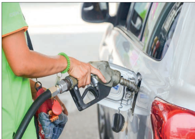
A car is seen being filled with fuel oil at the petrol station in Yangon.

Some countries levied higher tax rates and hiked oil