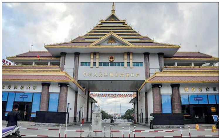
The Kyinsankyawt-Wang Ding border post.