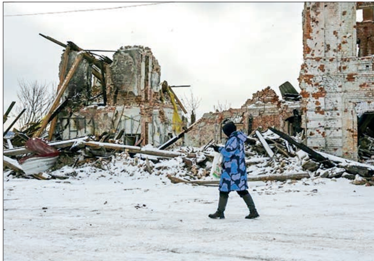
Ukraine President Volodymyr Zelensky is now ramping up pleas for Western fighter jets.

US Vice-President Kamala Harris and Secretary of State Antony Blinken, China's top dip-