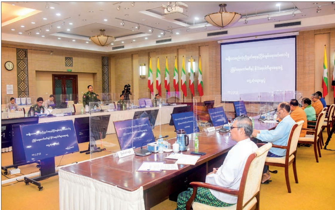
The meeting between the National Solidarity and Peacemaking Negotiation Committee and the working group of political parties is in progress yesterday.

THE meeting of the National Solidarity and Peacemaking Negotiation Committee and the working group of political parties was held in Nay Pyi Taw yesterday morning.