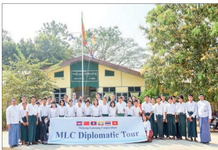
Delegates take the documentary group photo during their second-day MLC Diplomatic Tour yesterday.

ON the second day of the Mekong-Lancang Cooperation Diplomatic Tour, the delegates from the Embassies of