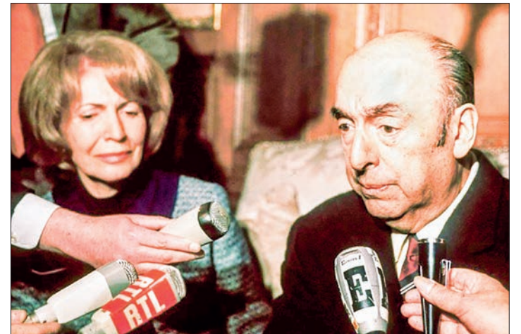
Pablo Neruda, pictured in 1971 alongside his wife Matilde Urrutia, while he was Chile's ambassador to France, was a much-loved poet and Nobel laureate.