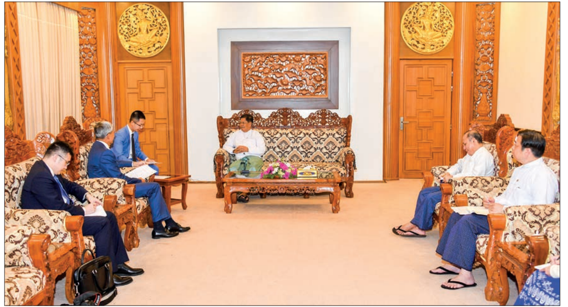
Ambassador Mr Chen Hai of China to Myanmar calls on Union Foreign Affairs Minister U Than Swe yesterday in Nay Pyi Taw.

uous provision of constructive support towards Myanmar's Peace Process, maintenance of peace and stability along the border area between Myanmar and China. They also cordially exchanged views on regional and international matters of mutual interest as well as for closer collaboration between the two countries in regional and multilateral contexts including ASEAN and the United Nations. — MNA