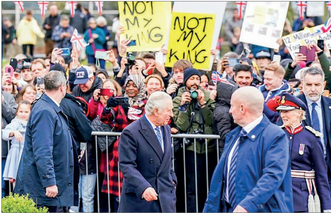
Demonstrators hold placards reading 'Not My King' as King Charles III meets well-wishers in Milton Keynes.

KING Charles III on Thursday encountered a group of anti-monarchy activists while on walkabout in the city of Milton Keynes north of London.