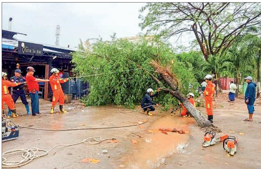
Fire brigade members are in action to clear the fallen tree in Yangon yesterday.

MEMBERS of the Fire Services Department cleared the broken trees in some townships of Yangon due to untimely rains on 17 February, it is learnt.