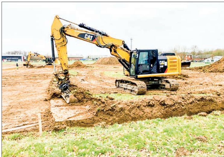
Diggers are clearing the ground for the new refugee centre.

THE main road through the northern German village of Upahl is lined with wooden placards,