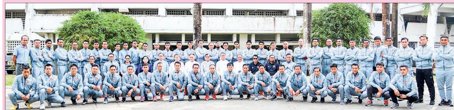
Referees and Myanmar Football Federation officials pose for a group photo at the closing ceremony of the MFF Men's Referee Workshop 2023 at Thuwunna Stadium in Yangon on 17 February 2023.

THE closing ceremony of the MFF Men's Referee Workshop for 2023, which was jointly opened by the Myanmar Football Federation and the Referee Committee, was held yesterday morning at the press conference hall in Thuwunna