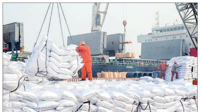
Fertilizer bags are being loaded onto the ship.

Additionally, the prices of Malarmyaing brand Cypermethrin 10 per cent insecticide 100 cc and 500 cc were K3,100 and K13,800 per bottle. —TWA/EM