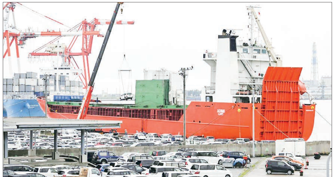
A cargo vessel loads cars at a port in Imizu, Toyama Prefecture on the Sea of Japan on 17 August 2022.

JAPAN registered its largest-ever trade deficit of 3.5 trillion yen ($26 billion) in January after energy import prices jumped and export growth slowed, with record red ink logged with major trading partner China, the