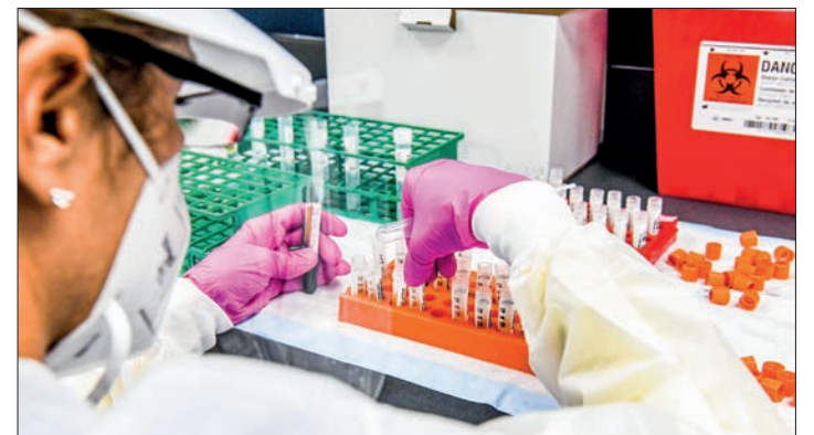
The Massachusetts-based company said that its flu shot generated an immune response against influenza A strains that was equal or superior to that of already licenced vaccines.

"We have already updated the vaccine that we believe could improve immune responses against influenza B and will seek to quickly confirm those improvements in an upcoming clinical study." —AFP