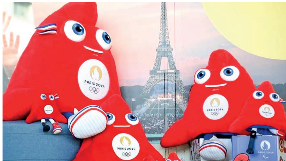
The 'Phryges' toys represent the mascot of the Paris 2024 Olympic Games.

THE president of the 2024 Paris Olympics organising committee on Friday said athletes should not "suffer" from decisions they do not control amid an escalating row over allowing Russians and Belarusians to compete.