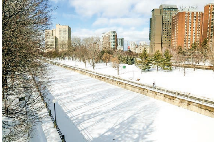
The Rideau Canal Skateway in Ottawa, Canada is the world's largest outdoor skating rink.

For the canal to freeze up, temperatures must hold steady at -10 to -20 degrees Celsius