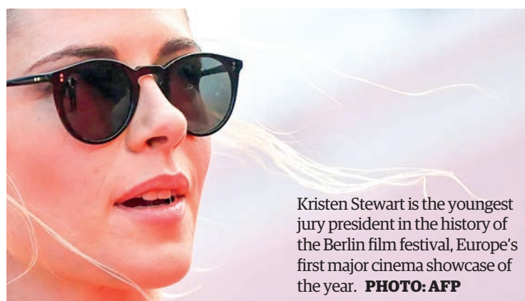
Kristen Stewart is the youngest jury president in the history of the Berlin film festival, Europe's first major cinema showcase of the year.

THE Berlinale, Europe's first major film festival of the year, opens Thursday with a comedy starring Anne Hathaway, Marisa Tomei and Peter Dinklage