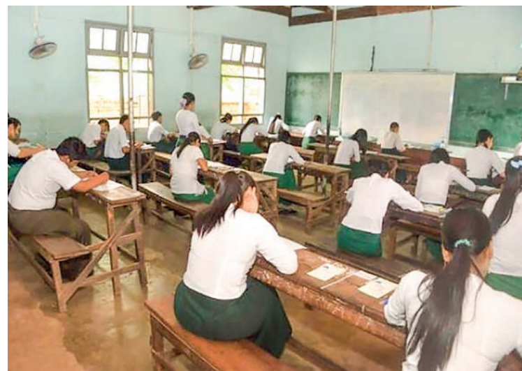
Students are seen sitting for the 2022 matriculation exam.

ID cards for the matriculation exam can be taken out from 20 February, announced the Department of Myanmar Ex-