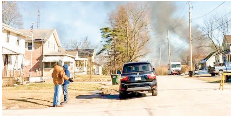
Smoke rises from a derailed cargo train in East Palestine, Ohio on 4 February 2023.

US experts have expressed grave concerns over the damage by fires and chemical contamination to people and the environment following a disastrous train derailment in the US state of Ohio.