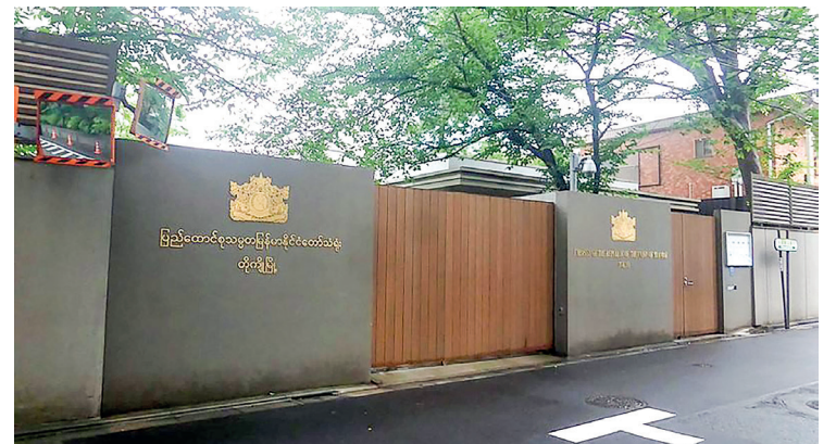
The Myanmar Embassy in Tokyo, Japan.

The Myanmar Embassy always verifies, through a labour supervision company, whether companies and factories recruiting Myanmar workers are legally established.—TWA/MKKS