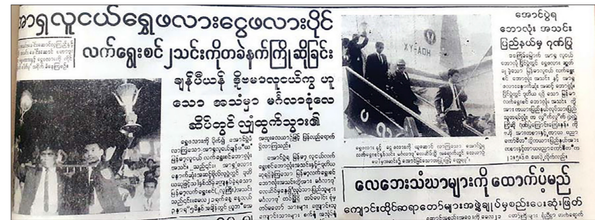
A news item welcoming the victorious Myanmar National Football Team in the Hanthawady newspaper on 22 May 1968.

The FC CSKA Moscow, one of the top football clubs in Russia, arrived in Myanmar in December 1960 to play turn-up matches. In the first match, the Central Army FC crushed the Myanmar civilian selected team 3-0, the Tatmadaw's selected football team 5-2 in the second match and the Myanmar national football team 8-0 in the third match.