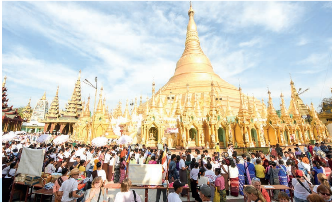
Devotees are pictured at the Shwedagon 2608 th Buddha Pujaniya Tabaung festival.

In addition, the rice-offering ceremony to invited monks including Ovadacariya Sayadaws will be held on the evening of 4 March and the successful completion of Maha Pathana recitation will be celebrated on the morning of 5 March (the full moon day of Tabaung). — TWA/MKKS