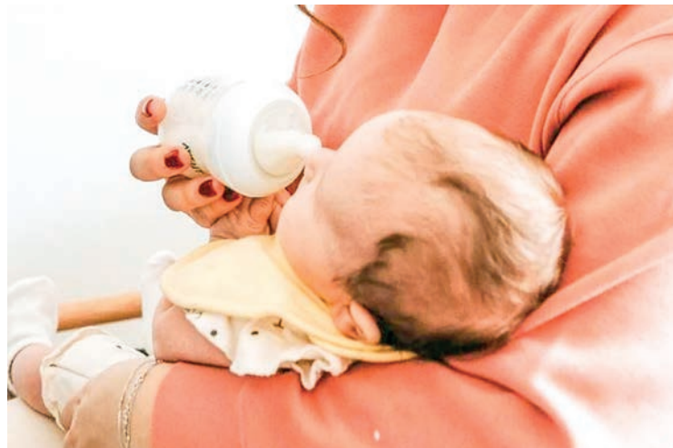
The most common claims were that formula supports brain development, strengthens immune systems and helps growth.

international team of researchers looked at the health claims made for 608 products on the websites of infant formula companies in 15 countries, including the United States, India, Britain and Nigeria. The most common claims were that formula supports brain development, strengthens immune systems and more broadly helps growth.—AFP