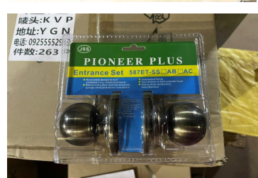
Seized illegal items in Mon State.

THE on-duty teams under the management of the Customs Department made inspections on 14 February.