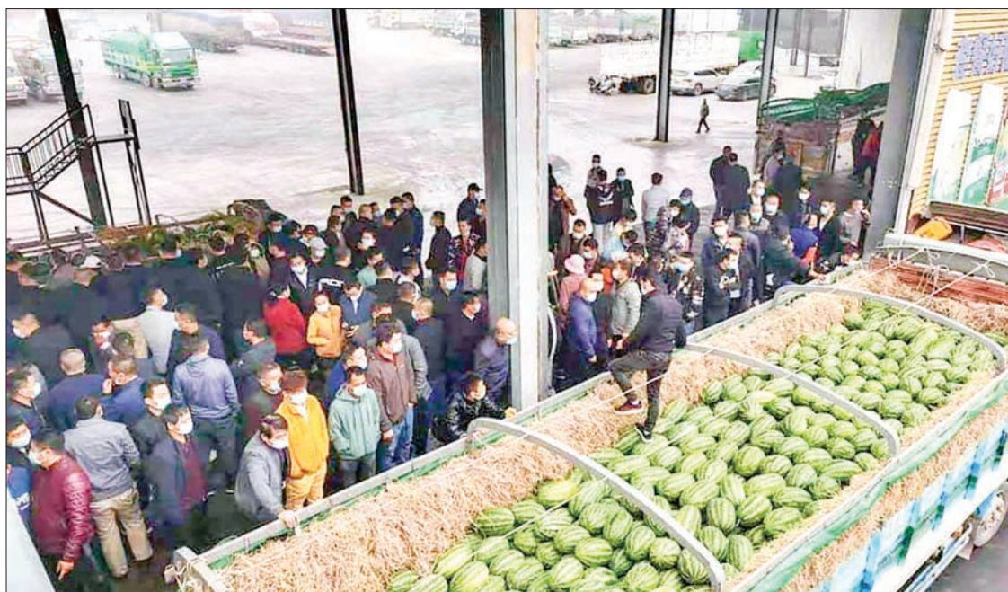
Chinese merchants are seen viewing watermelons on the Sino-Myanmar border.

On 5 February, the trade channel was eased and around 100 trucks entered China. Those trucks struck on the Myanmar