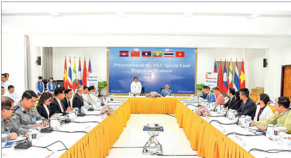
Deputy Minister for Foreign Affairs U Kyaw Myo Htut presents the Mekong-Lancang Cooperation Special Fund Projects in Myanmar yesterday.

In the evening, Deputy Minister for Foreign Affairs U Kyaw Myo Htut hosted the welcome dinner for the MLC delegations at M-Gallery Hotel. — MNA