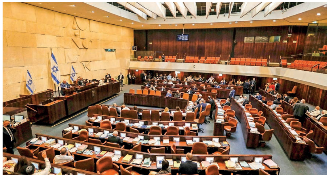
The bill targeting those who receive funds from the Palestinian Authority was passed in the Israeli parliament with 94 votes in favour and 10 against.

Israel says making payments to the families of attack-