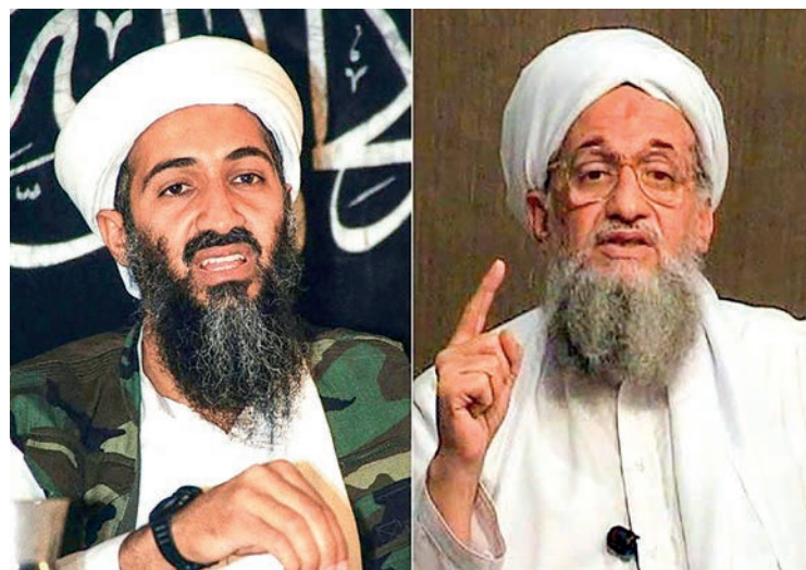
This combination of two file images created on 2 August 2022 shows al-Qaeda leader Osama Bin Laden (left) in an undated file picture obtained on 8 August 1998, and his successor Ayman al-Zawahiri in a file image from video released on 8 June 2011 by Al-Qaeda's media arm as-Sahab.

SAIF al-Adel, an Iran-based Egyptian, has become the head of Al-Qaeda following the July 2022 death of Ayman al-Zawahiri,