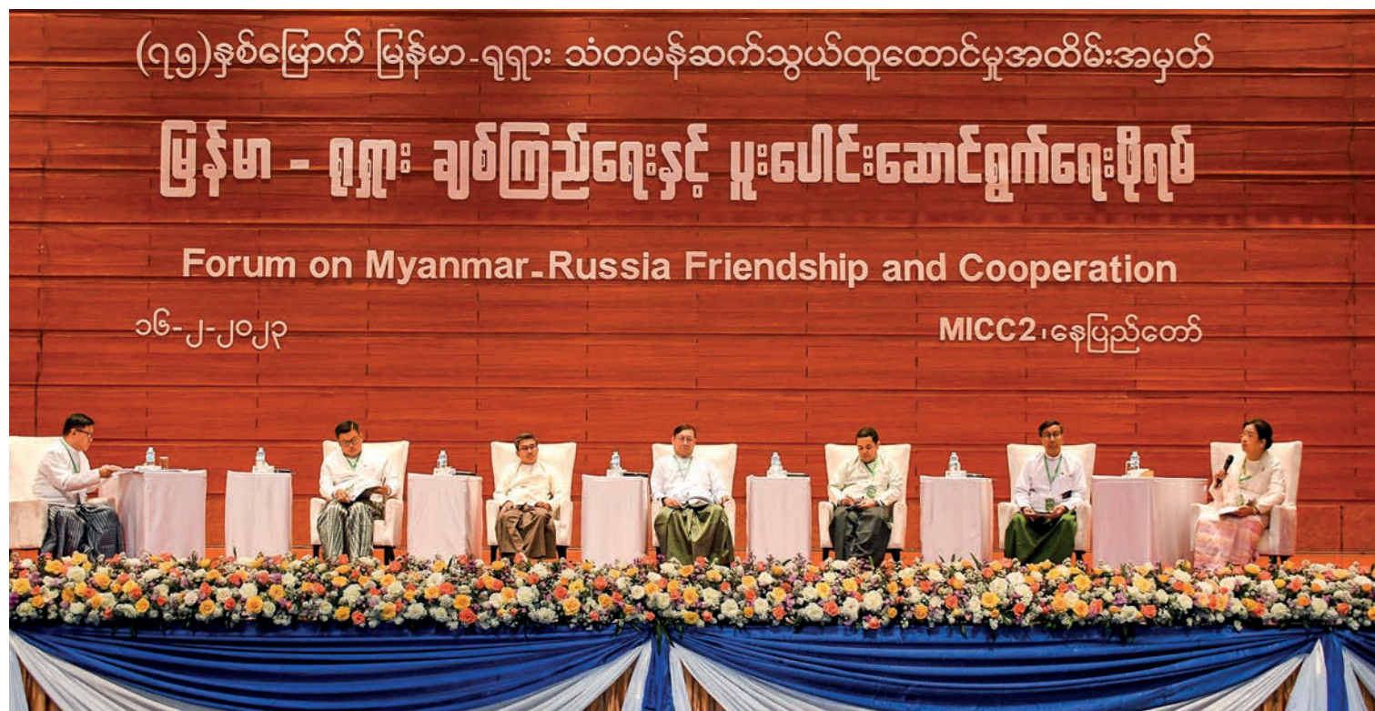
The Forum on Myanmar-Russia Friendship and Cooperation in commemorating the 75 th Anniversary of the Myanmar-Russia diplomatic ties is in progress yesterday in Nay Pyi Taw.

The Union Minister for Information gave a concluding remark and vocalists from Myawady Entertainment Troupe presented the song Nedejda. — MNA/TTA