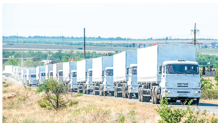
Humanitarian funding is needed to continue supporting lifesaving aid convoy deliveries to communities on the front line, "into areas of great danger and difficulty and priority needs", said Martin Griffiths, OCHA Head.

Humanitarian funding is needed to continue supporting lifesaving aid convoy deliveries to communities on the front line, "into areas of great danger and difficulty and priority needs", said Martin Griffiths, OCHA Head.—ANI