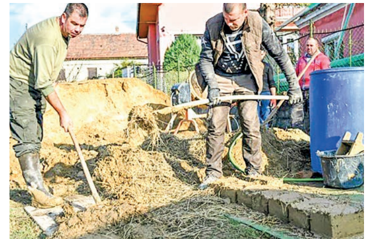
Clay's thermal properties make it ideal for Hungary's fluctuating climate of hot summers and cold winters.

In contrast to concrete, which accounts for about eight per cent of global CO2 emissions, "it eventually disintegrates naturally, leaving no artificial waste behind," he said.—AFP