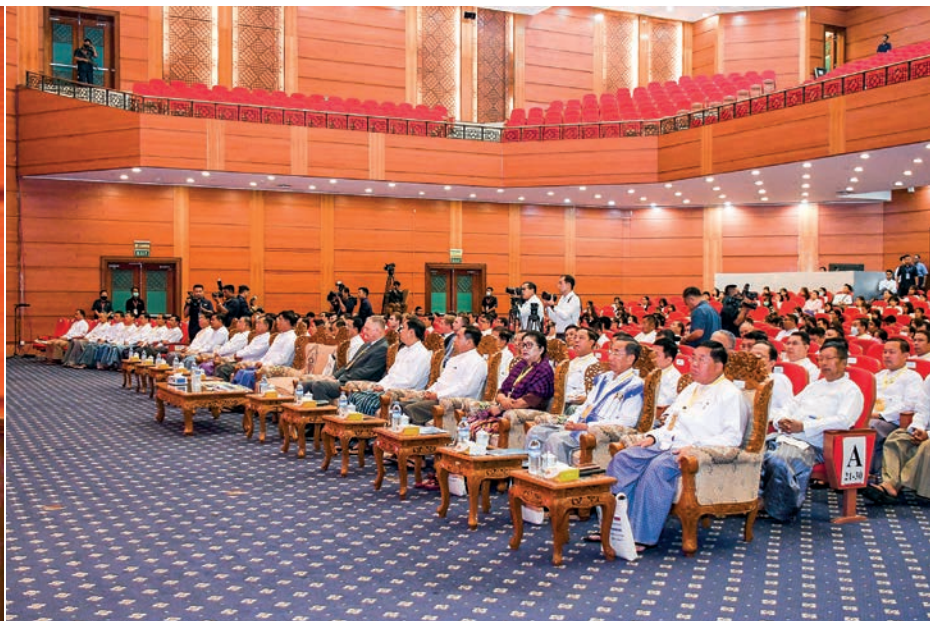
State Administration Council Chairman Prime Minister Senior General Min Aung Hlaing speaks on the occasion of the 75 th Anniversary of the establishment of the diplomatic relations between the two countries yesterday.