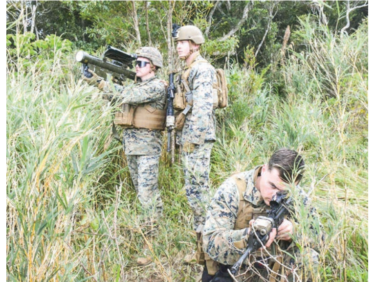
US Marine Corps personnel during training in the Northern Training Area in Okinawa Prefecture in February 2022.

On Thursday, the opening ceremony took place at the GSDF's Hijudai Maneuver Area in Oita Prefecture, at-