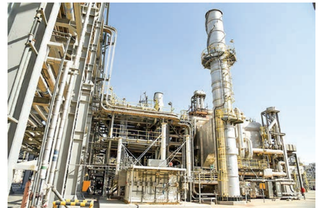
Photo taken on 28 June 2021 shows the industrial estate of Saudi oil giant Aramco in Dammam, Saudi Arabia.

restrictions, Beijing in December abruptly ended the zero-Covid policy that had battered the economy and caused widespread protests.—AFP