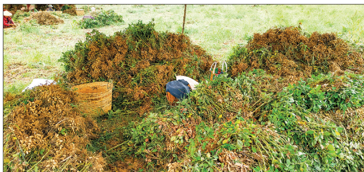
Myanmar shipped more than 18,000 kilogrammes worth US$21.096 million to foreign markets through the border trade channels as of 3 February in the current financial year 2022-2023 since April 2022.

THE prices of peanuts continued to rise at K7,900 per viss (a viss equals 1.6 kilogrammes), according to the Mandalay Wholesale Commodity Centre.