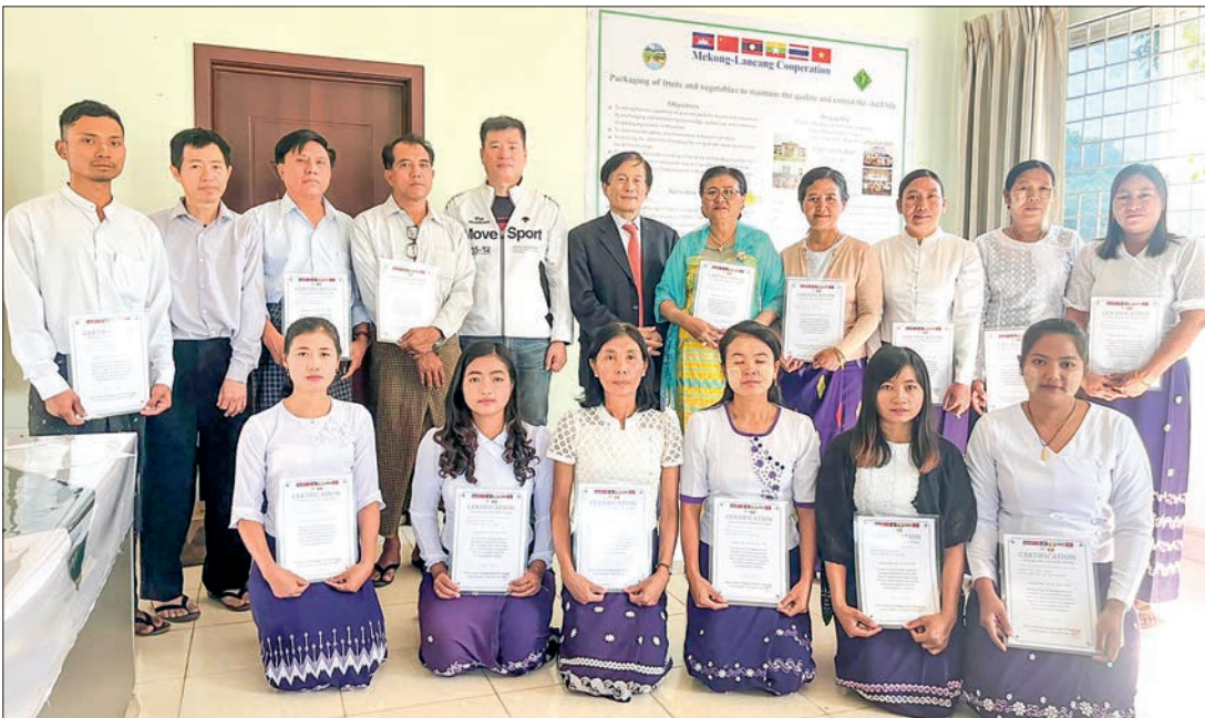
The documentary group photo at the course-concluding event.

THE international consultants gave theoretical lectures and practical training regarding packaging technology for three weeks through the Mekong-Lancang cooperation at the Post-harvest Technology Training Centre in Htonbo in