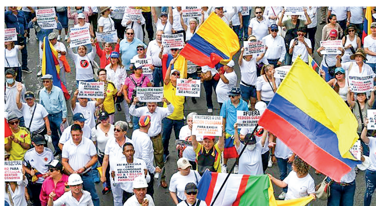
Thousands of Colombians protested Wednesday against healthcare reforms proposed by the country's first-ever leftist president Gustavo Petro, and an amnesty proposed for members of armed groups in his quest for "total peace".

But the group has not formally declared him "emir" because of sensitivity to the concerns of the Taliban authorities in Afghanistan, who haven't wanted to acknowledge that Zawahiri was killed by a US rocket in a home in Kabul last year, according to the UN report.