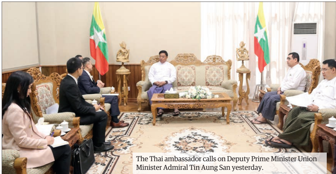
The Thai ambassador calls on Deputy Prime Minister Union Minister Admiral Tin Aung San yesterday.

(The excerpt from the speech made by Chairman of State Administration Council Prime Minister Chairman of the National Solidarity and Peacemaking Central Committee Commander-in-Chief of Defence Services Senior General Min Aung Hlaing at the 7th Anniversary of Signing the Nationwide Ceasefire Agreement (NCA) on 15 October 2022)