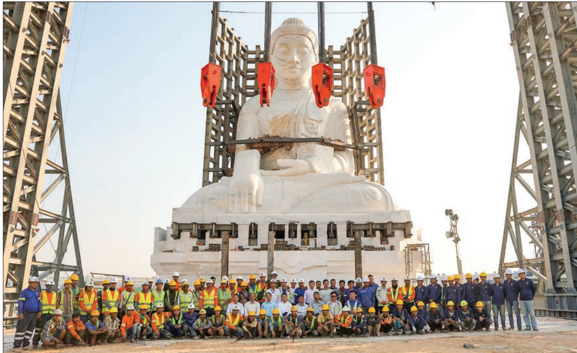
The Maravijaya Buddha Image is seen after parts 1, 2, 3 and 4 are all combined successfully.

The conveyance processes were being carried out and part 4 of the Buddha image was carried towards the Buddha image combined with parts 1, 2 and 3 using Skid Rail from 1:35 am to 7:20 am on 15 February. Then, the pieces were settled on the jewelled throne using the Hydraulic Jack successfully at 4:5pm on the same day.