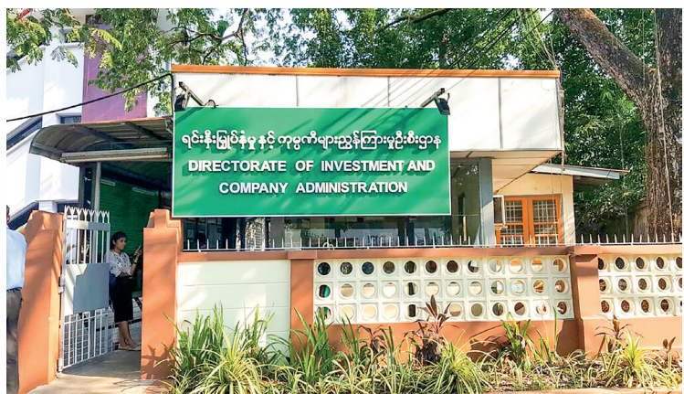
The office of the Directorate of Investment and Company Administration-DICA.

FIFTEEN Singapore-listed enterprises pumped in foreign investments of US$1.157 billion into Myanmar in the past ten months (April-Jan) of the current financial year 2022-2023, the Directorate of Investment and Company Administration's statistics showed.