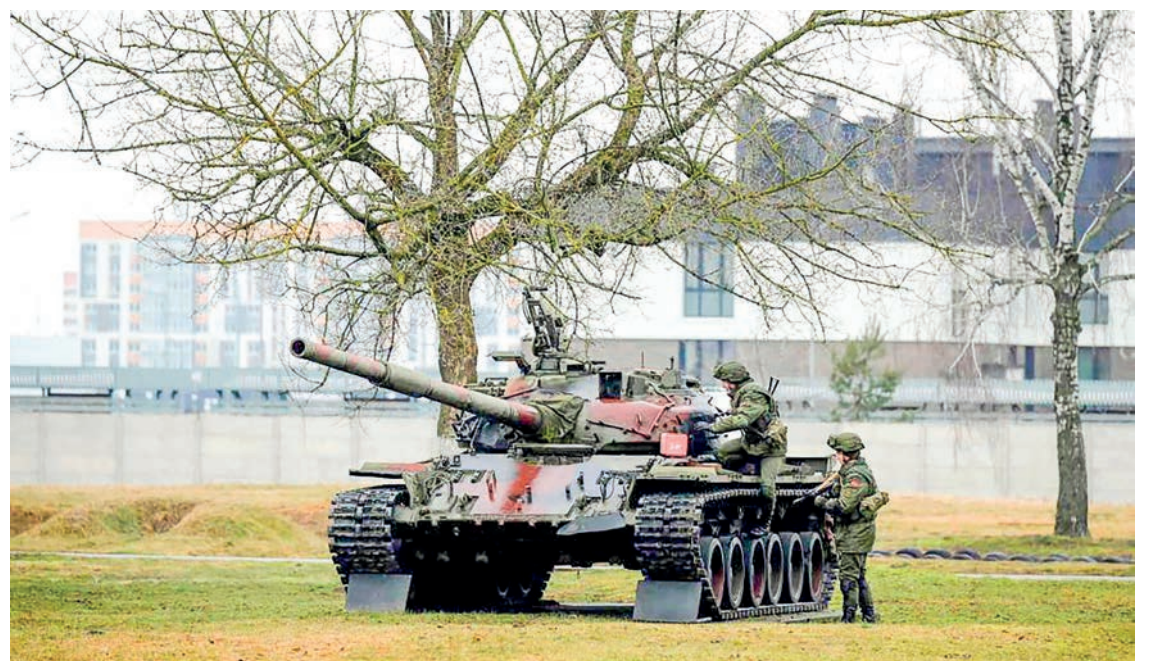
Paratroopers of the 38 th Separate Guards Air Assault Brigade - a special forces brigade of the Armed Forces of Belarus - mount a tank during training exercises at the brigade's grounds in Brest on 13 February 2023.

IN reclusive Belarus, just a few kilometres from the EU frontier, special forces in the army of Kremlin ally Alexander Lukashenko are simulating forest combat while paratroopers nearby practise jumping from aircraft.