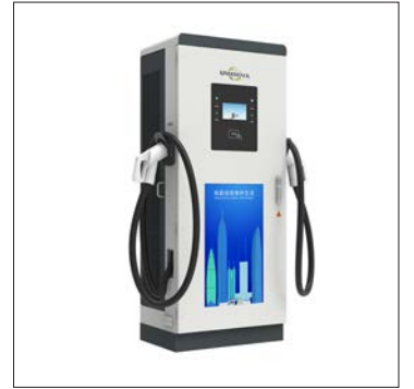
China-made 60KW EV charger.

Exports of agricultural products, forest products, livestock products, minerals, finished industrial goods and other goods rose. Similarly, import growth of capital goods (US$10.005 million), intermediate goods ($16.095 million) and consumer goods (17.538 million) were recorded last month.—TWA/EM