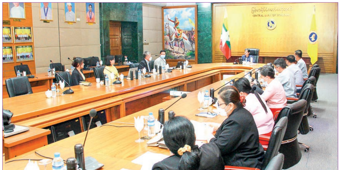
The Central Bank of Myanmar holds talks with officials of the Myanmar Credit Bureau yesterday.

Afterwards, the chairman, board members and officials of Myanmar Credit Bureau explained the progress of Myanmar