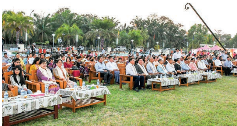
SAC Member U Maung Ko, Union Minister U Maung Maung Ohn and dignitaries watch the performance on the occasion of the 77 th Anniversary of MRTV yesterday in Nay Pyi Taw.

In his remark, the Union minister said the MRTV should make efforts for bridging communication between the government, Tatmadaw and the public. He also urged the staff to work