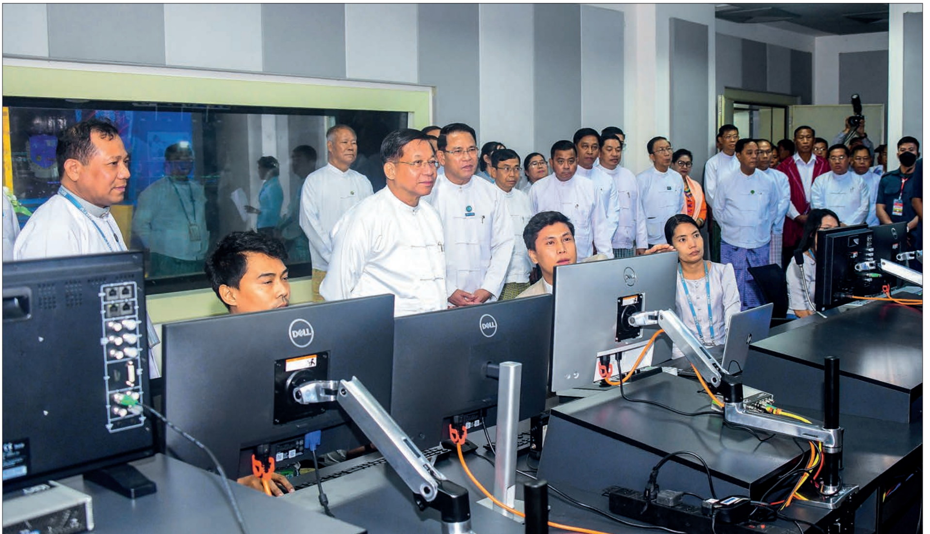
State Administration Council Chairman Prime Minister Senior General Min Aung Hlaing views round the News Channel Studio on the occasion of the 77 th Anniversary of Myanmar Radio and Television-MRTV in Nay Pyi Taw on 15 February 2023.

S TAFF must have skills to thoroughly present typical Myanmar language and Myanmar pronunciation and must be correct in stress and