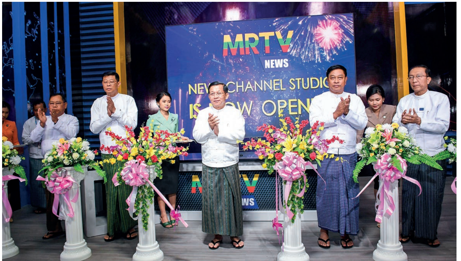
The Senior General and dignitaries inaugurate the News Channel Studio of MRTV in Nay Pyi Taw yesterday.

Currently, everybody knows some big countries wishing to influence internal traitors and expatriates with attempts to focus on their interests and their organizations turning a blind eye to public interests are still trying to cause utter devastation to the nation.