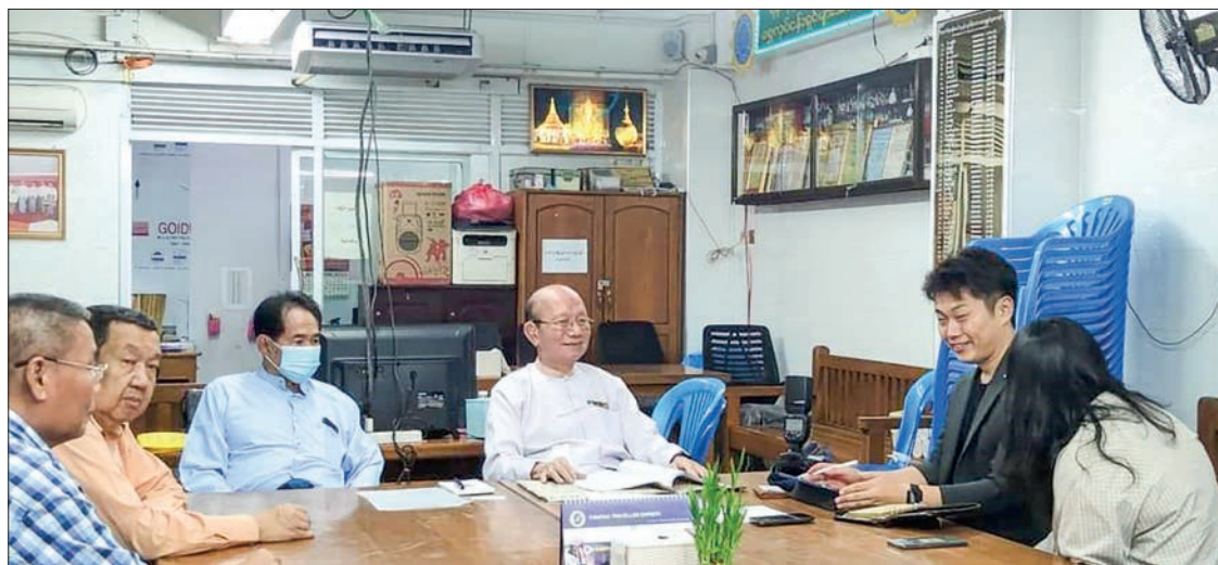
The negotiations between officials of the Yangon Region Gold Entrepreneurs Association and the Japanese company is in progress yesterday in Yangon.

"We inquired about the export procedures of gold items to Japan. We delivered our gold items to Japan before the pandemic. The gold export started in the 2018-2019 Financial Year and it abruptly stopped amid the COVID-19 negative consequences. We have the plan to resume export activity once they order them. They asked for trading licence conditions, banking operations such as Telegraph-