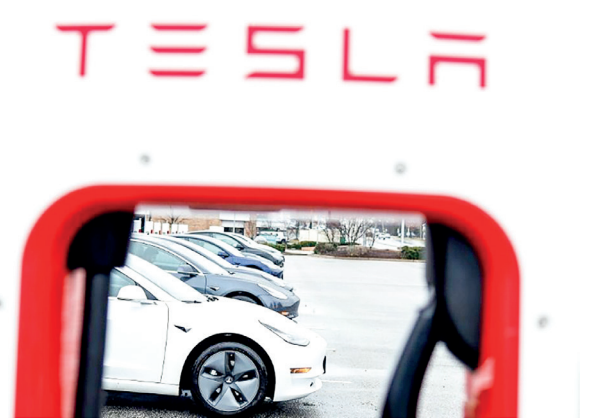
The Biden administration reached a deal to ensure that non-Tesla brand electric vehicles can fuel up at some Tesla charging stations.

The Biden administration's policy update also listed charging commitments from other leading companies, including a joint venture between Hertz and BP and initiatives by General Motors, ChargePoint and others.—AFP