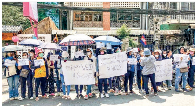
Supporters of online media outlet Voice of Democracy (VOD) hold placards in front of VOD office in Phnom Penh on 13 February 2023, after Cambodian Prime Minister said VOD would have its operating licence revoked.

CAMBODIA on Tuesday hit back at “politically driven” and “biased” concerns from Western governments over the shut-