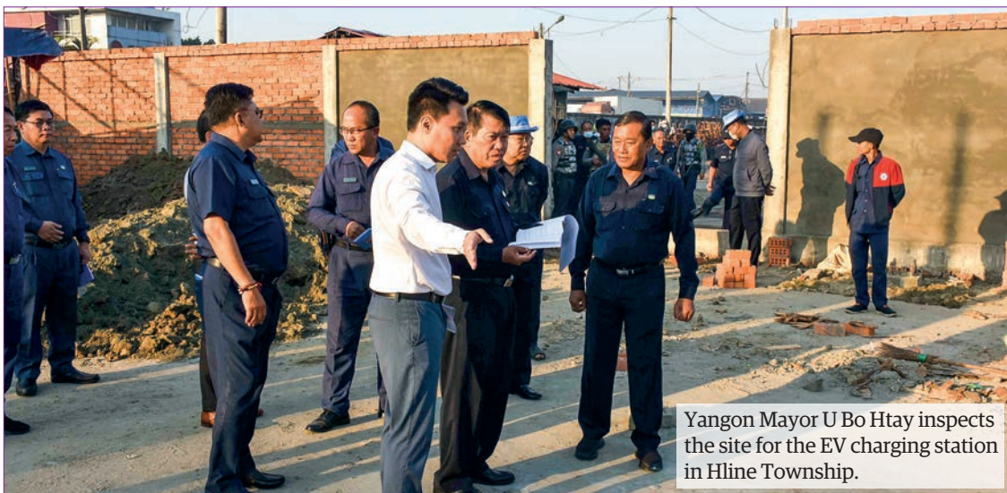
Yangon Mayor U Bo Htay inspects the site for the EV charging station in Hline Township.

for the stable development of the banking sector, as discussed in the meeting. — MNA/CT