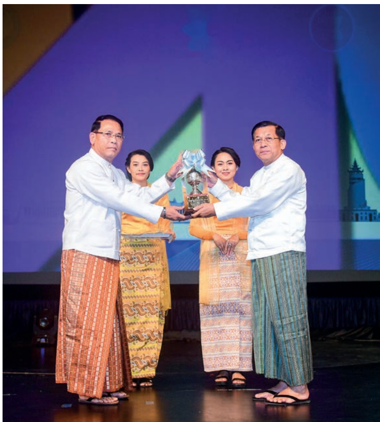
The Senior General presents cash awards to MRTV staff through Union Minister U Maung Maung Ohn.

Currently, MRTV has turned 77 years and is standing tall as a State-owned media with progress in successive eras. — MNA/TTA