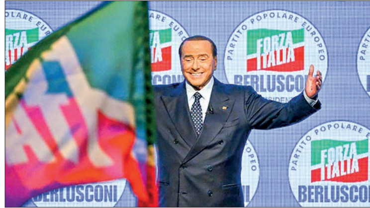
Berlusconi was Italian prime minister three times between 1994 and 2011.

forced to reiterate her new government's support for Ukraine