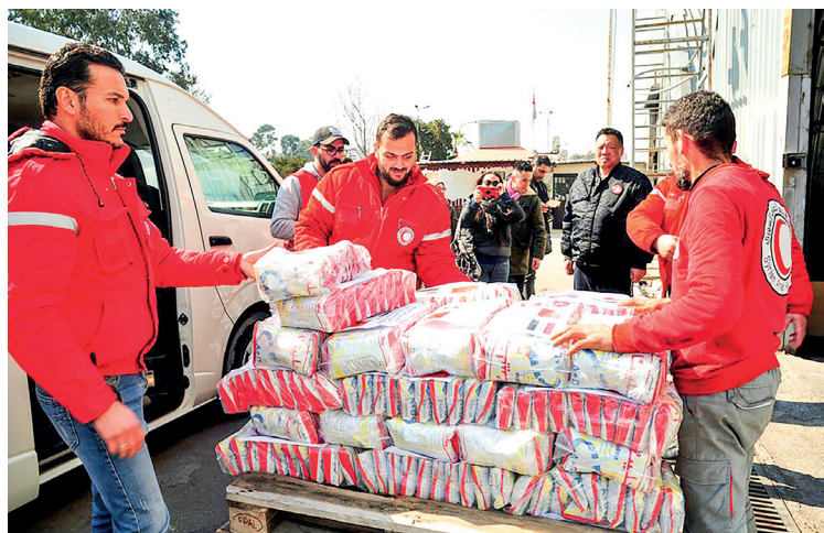
Workers with the Syrian Arab Red Crescent (SARC) receive relief supplies donated by the Chinese community in Syria, in Damascus, capital of Syria, 12 February 2023.

THE World Health Organization (WHO) has urged governments and civil society to work together to ensure cross-border delivery