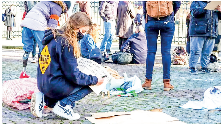
Students protested against university coronavirus policies on 20 January 2021.

It found that 20.8 per cent of 18 to 24-year-olds reported having experienced a depressive