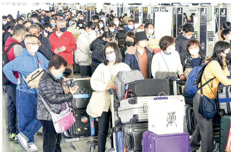
Photo taken on 4 February 2023, shows Fukuoka Airport's international terminal crowded with passengers.

While the company had been capable of handling six passenger lanes at security checkpoints