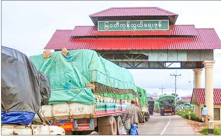
Cargo-loaded lorries are seen entering the Myawady trade zone.

THE value of trade through the Myawady border post amounted to US$151.543 million in January 2023, the Ministry of Commerce's statistics indicated. Trade via the Myawady bor-