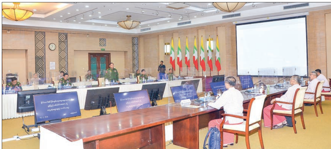
The third-day meeting between the State Peace Talks Team and the NMSP peace delegation is in progress yesterday in Nay Pyi Taw.

The meeting was attended by the State Peace Talks Team led by SAC Member Union Minister at the Government Office Chairman of the National Solidarity and Peacemaking Negotiation Committee-NSPNC Peace Talks Team Leader Lt-Gen Yar Pyae, SAC Member Lt-Gen Moe Myint Tun, NSPNC Secretary Lt-Gen Win Bo Shein and NSP-