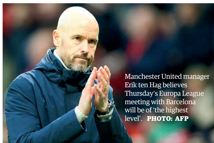
Manchester United manager Erik ten Hag believes Thursday's Europa League meeting with Barcelona will be of 'the highest level'.

He also paid tribute to Barcelona counterpart Xavi, saying he had been a fan since his playing days. — AFP