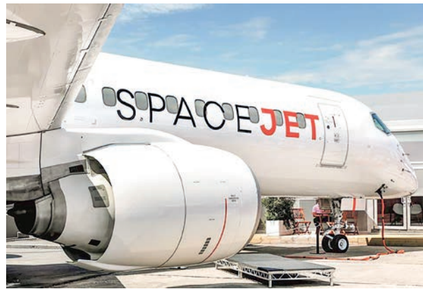
The parent of All Nippon Airways Co was the first customer for Mitsubishi's SpaceJet, Japan's first domestically manufactured passenger jet, ordering 25 aircraft when the project was officially launched in 2008.