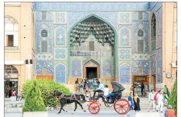
Tourists visit the Lotfollah Mosque on Naqsh-e Jahan Square in the central Iranian city of Isfahan.

Hoping for better days, tourism professionals are wooing visitors from countries like China and Russia which maintain good ties with Iran. Westerners have long been attracted to Iran’s many ancient and Islamic sites, its mountain scenery and its millennia-old