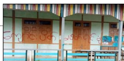
A message left on the wall of the classroom at a Basic Education Sub-Middle School in Mohnyin Township of Kachin State, threatening that the school would be blown up if it is not closed