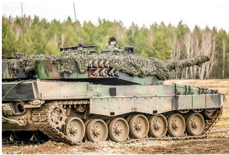
Polish and Ukrainian soldiers are seen on a Leopard 2 A4 tank during a training at the Swietoszw Military Base in Swietoszw, western Poland on 13 February 2023.

Last month, the German government decided to supply its Leopard 2 tanks to Ukraine and green-lighted requests by other countries to do so. — Xinhua