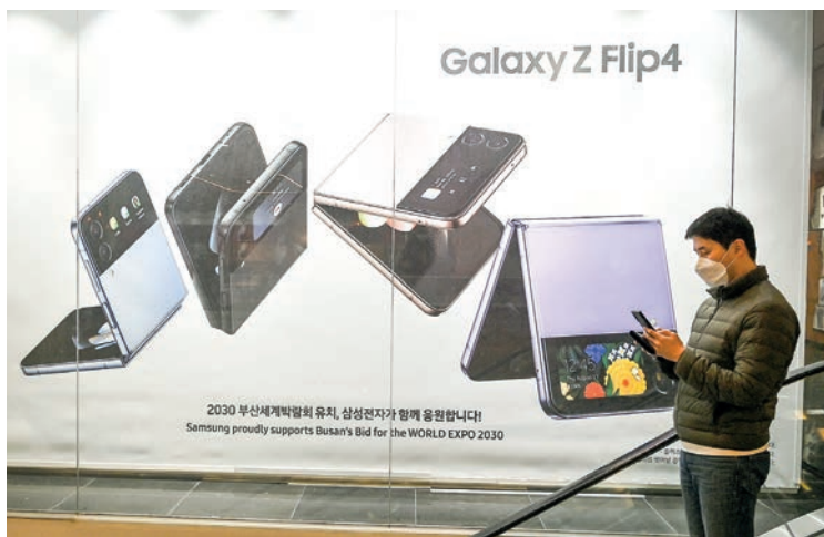
A man walks past an advertisement for the Samsung Galaxy Z Flip4 smartphone at the company's Seocho building in Seoul on 31 January 2023.

Import for ICT products shed 1.1 per cent over the year to 12.21 billion dollars in January, sending the trade surplus in the ICT industry to 0.89 billion dollars. — Xinhua