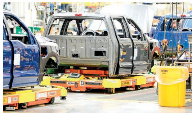
Ford Motor Company’s electric F-150 Lightning on the production line at their Rouge Electric Vehicle Centre in Dearborn, Michigan on 8 September 2022.

US auto manufacturer Ford announced Monday that it will build a new $3.5 billion battery plant in Michigan, diversifying its battery offerings with technology from a Chinese company as it boosts electric vehicle production.