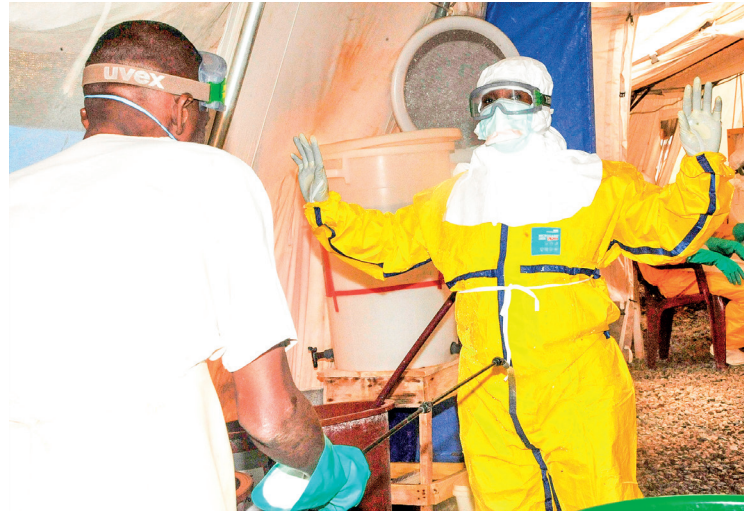
Medical staff clean their protection suits as part of the fight against the Ebola virus on 8 March 2015 at the Donka hospital in Conakry.

He said a health alert had been declared in Kie-Ntem province and in the neighbour-