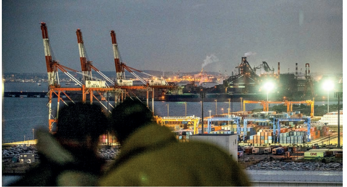
(FILES) In this file photo taken on 17 January 2023 people look at the Keihin Industrial Zone from the observation deck of Kawasaki Marien in Kawasaki. Japan's economy expanded just 0.2 per cent in the last quarter of 2022, a smaller rebound than expected despite the long-awaited reopening of the country to tourists, government data showed Tuesday.

Accelerating inflation in Japan has already begun to dent consumer sentiment with more price hikes expected in the current quarter to March. But pent-up demand for services has supported consumption as the economy has emerged from coronavirus restrictions. "We expected a rebound in October-December after an unexpected contraction in the previous quarter but growth is not robust. Still, the data is consistent with the view that the economy is recovering moderately," said Shinichiro Kobayashi, a senior economist at Mitsubishi UFJ Research and Consulting. — Kyodo