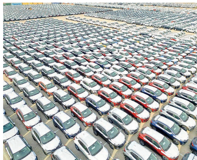
This aerial photo taken on 17 January 2023 shows export vehicles waiting for shipment at Yantai Port, east China's Shandong Province.

On top of that, global GDP could be raised by one per cent by the end of 2023 due to China's adjustment, it said.