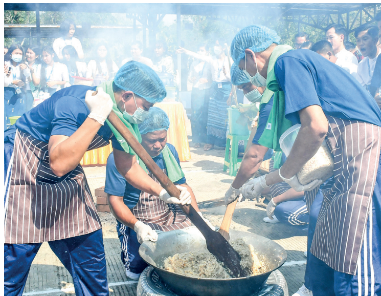
The Htamane-making competition is in progress yesterday.

office of the Ministry of Information, MRTV, the Information and Public Relations Department, the Printing and Publishing Department and the News and Periodicals Enterprise.