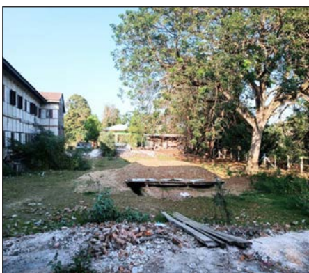
Bunkers and trenches built by KIA group and PDF terrorists as a fortified base in Basic Education High School (Moetarlay) of Katha Township