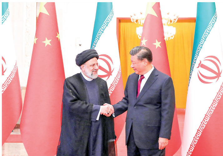
This handout picture provided by the Iranian presidency shows Chinese President Xi Jinping welcoming the Islamic Republic’s President Ebrahim Raisi (L) during his visit in Beijing on 14 February 2023.

CHINESE President Xi Jinping hailed Beijing’s “solidarity” with Iran on Tuesday, state media reported, as he hosted the Islamic Republic’s President Ebrahim Raisi at the start of a three-day visit.