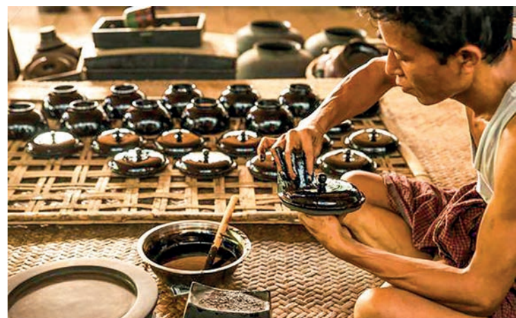
The picture shows a small-scale business.

It is reported that the registration of cottage industries can be done at the Small Scale Industries Department, No 137, Thudama Road, North Okkalapa Township, Yangon Region. — TWA/CT