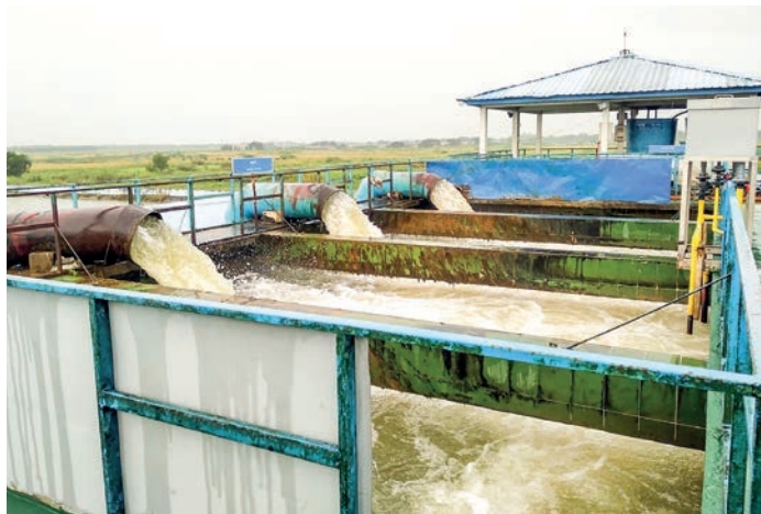
The Ngamoeyeik (Nyaunghnapin) water treatment plant.

A total of 232 million gallons of water are being distributed daily for Yangon Region, according to the Engineering Department (water and sanitation) of YCDC.