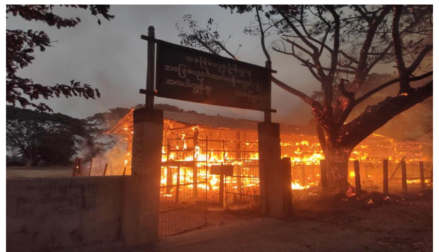
Basic Education High School (Alaekyun Village) on fire due to arson attack of KIA group and PDF terrorists