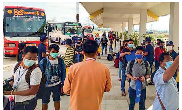
Migrant workers are seen arriving in Thailand, despatched by overseas recruitment agencies.

There are more than 300 licenced overseas recruitment agencies and these agencies despatched employees overseas starting in early 2022. Overseas recruitment agencies can apply for licences under rules and regulations, according to the Ministry of Labour. —TWA/MKKS