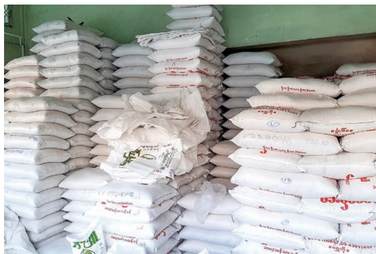
Rice bags are stacked in a warehouse.

Ayeyawady Pawsan, Shwabo Pawsan, Pawkywe and short-mature rice varieties (90 days) will be sold at a cheaper price between K35,000 and