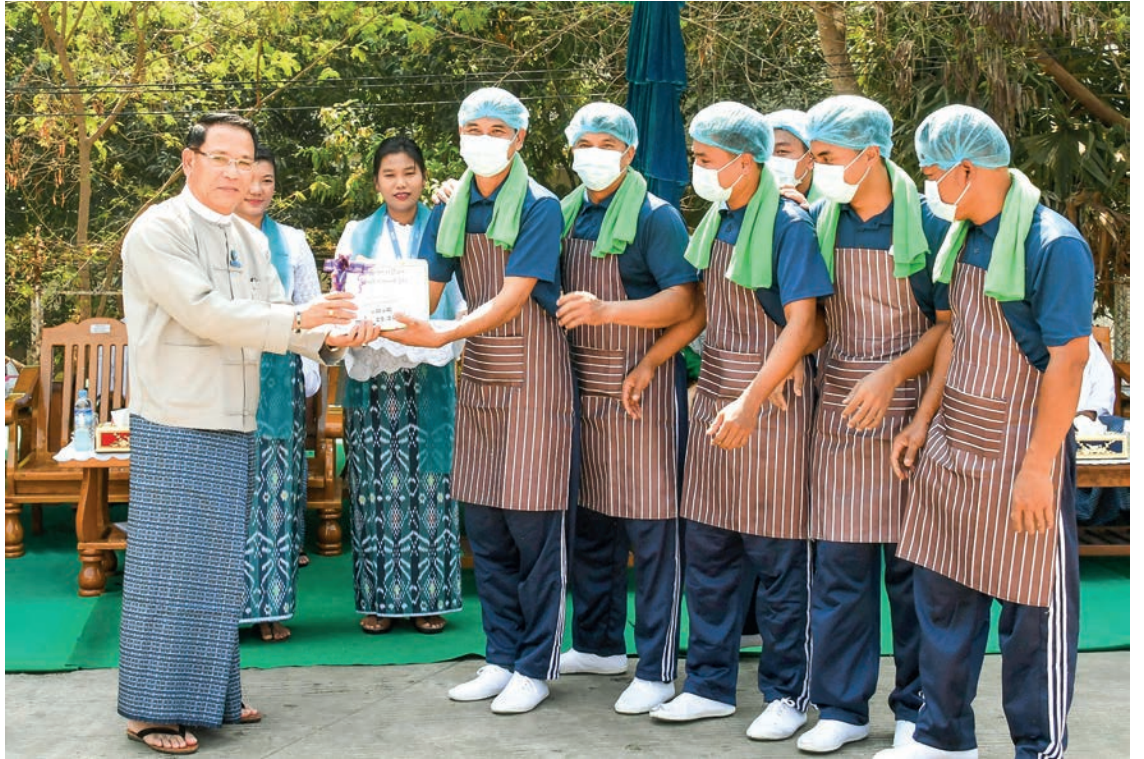
Union Minister U Maung Maung Ohn presents the first prize to the Information and Public Relations Department team.

Afterwards, the Union minister, the deputy minister and officials watched and encouraged five competition teams from the