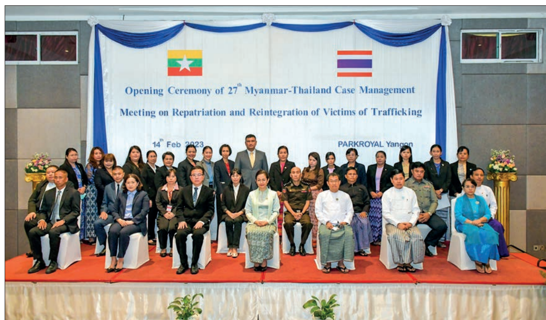
Union Minister Dr Thet Thet Khine and dignitaries take the documentary group photo at the event yesterday.

ister Dr Thet Thet Khine pointed out that 70 per cent of the victims of human trafficking are women and children, and the number of male victims in human trafficking has also increased signifi-