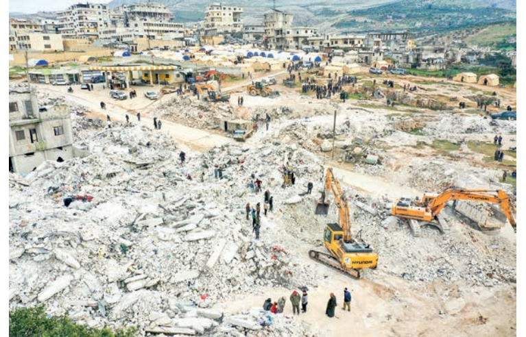
This aerial view shows rescuers searching for survivors amidst the rubble of collapsed buildings in the town of Harim in Syria's rebel-held northwestern Idlib province on the border with Türkiye, on 11 February 2023 days after a deadly earthquake that hit Türkiye and Syria.

They visited a WFP centre in Sarmada and held a 40-minute meeting with officials at the Bab al-Hawa crossing — the only transit point on the Turkish border for UN aid deliveries to rebel-held areas. —AFP