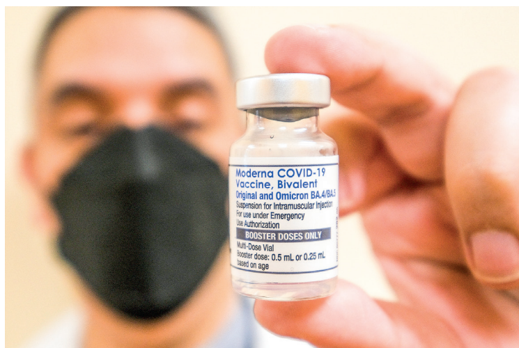
A pharmacist holds up a phial of the Moderna Covid-19 vaccine, Bivalent, at AltaMed Medical clinic in Los Angeles, California, on 6 October 2022.