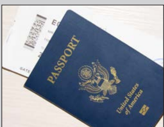
A sample of the US passport.

Myanmar has issued Tourist e-Visas and Business e-Visas electronically since 1 September 2014. —TWA/MKKS