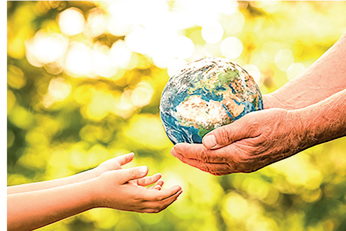
Global warming is a hot topic (no pun intended). The Earth is warming up. While that may be hard to believe in the middle of a Wisconsin winter, if it's true it could mean big changes for our planet. PHOTO-EEK

This poses many risks to human beings and all other