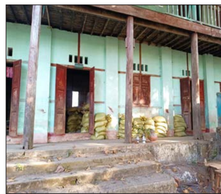
Bunkers fortified with sandbags found in the high school which was used by KIA group and PDF terrorists as a fortified camp.