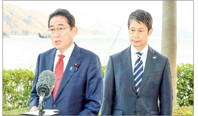
Japanese Prime Minister Fumio Kishida meets the press after the conclusion of the two-day inaugural meeting of the International Group of Eminent Persons for a World without Nuclear Weapons in Hiroshima, western Japan, on 11 December 2022 alongside Hiroshima Gov Hidehiko Yuzaki.

Akiba was the Mayor of Hiroshima from 1999 to 2011 and also serves as an advisor to the anti-nuclear organization. — Kyodo