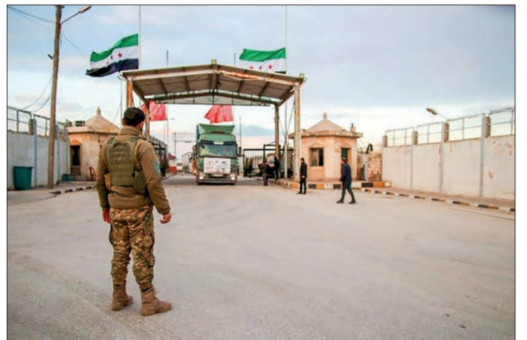
A convoy of trucks carrying humanitarian aid enters Syria through the Bab al-Salama crossing with Türkiye. PHOTO: AFP

At least 3,553 people have died in Syria, where more than a decade of civil war and Syrian-Russian aerial bombardment had already destroyed hospitals, collapsed the economy and prompted electricity, fuel and water shortages.—AFP