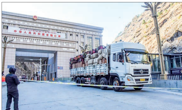
A truck loaded with goods from Nepal enters the Gyirong port in southwest China's Tibet Autonomous Region, 28 December 2022.

We cannot achieve success until we find immediate, short and long-term solutions. Though silver linings are seen in the economic situation we are not in a condition where we can be assured about it would go in the long run. The problem of monetary liquidity, lack of enough resources for investments, and some external reasons have made the