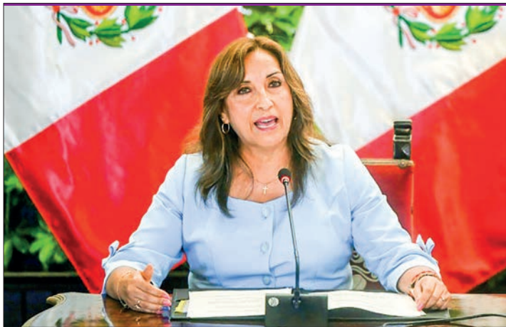
Peruvian President Dina Boluarte called on all political parties as well as social and labor organizations to join in a national dialogue to find a resolution to a months-long political crisis.

Demonstrations have at times turned violent and officials on Friday announced a new death, bringing the total number of people killed in clashes between security forces and protesters to 49.—AFP