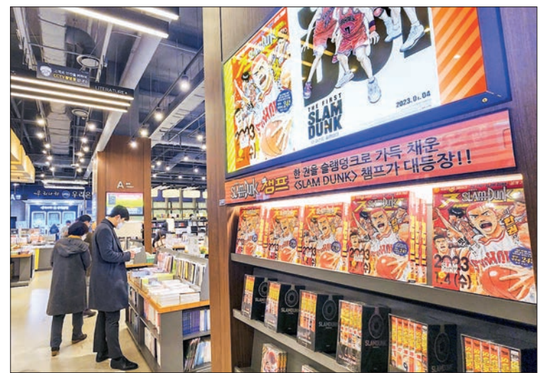
A special section for "Slam Dunk" comic books is created at a bookstore in Seoul on 23 January 2023. The manga-to-film adaptation of Takehiko Inoue's 1990s sports anime series has drawn more than one million moviegoers in South Korea in the two weeks since its release.

While these issues occupy the political classes of both countries, South Koreans have appeared to be happy to embrace Japanese culture through the film that started showing in early January.—Kyodo