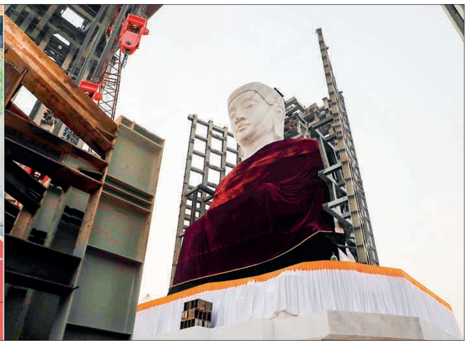
State Administration Council Chairman Prime Minister Senior General Min Aung Hlaing attends the conveyance ceremony for Part 4 of the Maravijaya Buddha Image in Nay Pyi Taw on 11 February 2023.

A ceremony to convey part 4 of the Maravijaya Buddha image onto the jewelled throne was held in the Maravijaya Buddha Image Park in Dekkhinathiri Township of Nay Pyi Taw Union Territory yesterday morning.