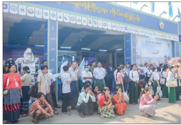
Visitors are seen at the commemorative event yesterday.

Yangon Region Chief Minister U Soe Thein, Yangon City Development Committee Chairman U Bo Htay, Economy Minister U Myo Myint Aung and