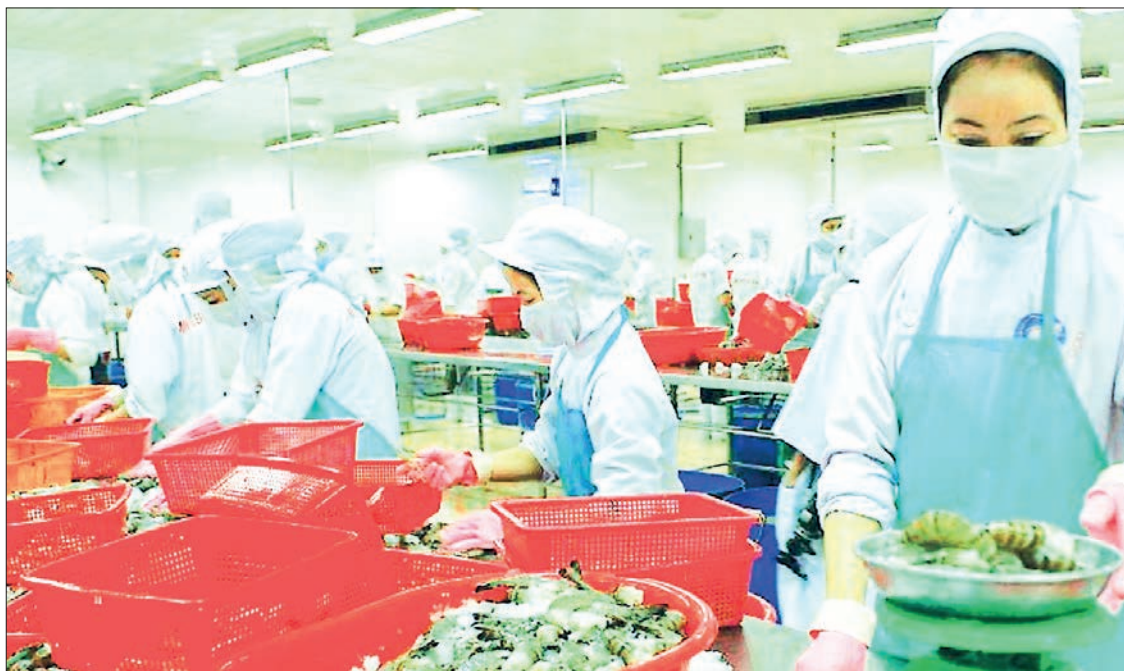
Female workers are pictured working on the processing line at one cold storage factory.

Tender proposals will be sold at 9:30 am to 3:30 pm from 8 to 14 February and re-submitted on 16 February. —TWA/KZW