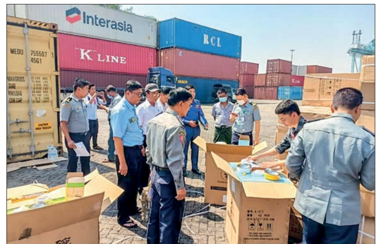
Officials confiscate illegal commodities at Asia World Port.

Similarly, officials made inspections at the Asia World Port container checkpoint and confiscated 1,680 PVC lunch boxes worth K10,080,000 that were different from the Import Declaration (ID) from a container. The action was taken under Customs procedures.