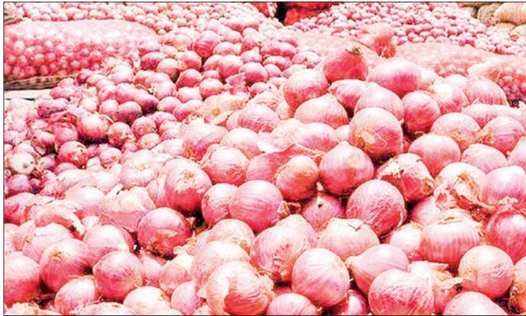
The photo shows onions flowing into the market.

THE prices of new monsoon onion indicated a significant fall of K3,000 per viss within the two months in Yangon markets, which accounts for a 75-per-cent drop.