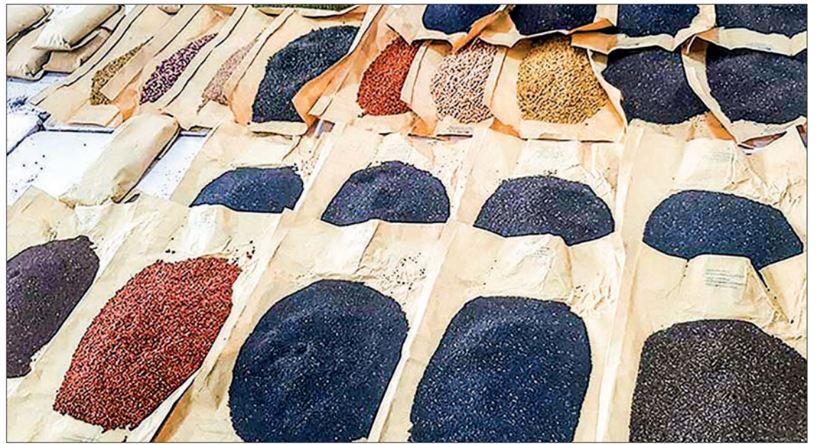
The prices of black grams and pigeon peas remain on an upward trend in the domestic market on the strong foreign demand. Myanmar yearly produces approximately 400,000 tonnes of black gram and about 50,000 tonnes of pigeon peas.

India has growing demand and consumption requirements for black grams and pigeon peas.