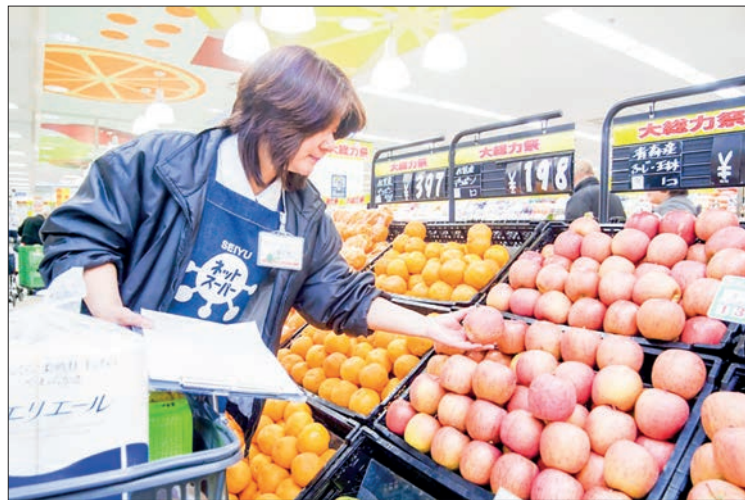
A wide range of items has experienced price hikes since last summer as rising oil prices have raised logistics costs.