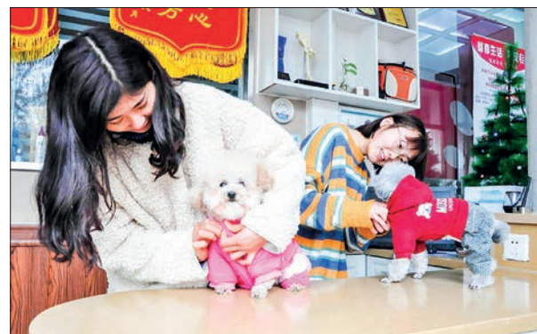
Cosmeticians at a pet hospital in Liaocheng, Shandong province, dress up pet dogs. Many pet owners want grooming services for their pets.

from the same holiday in 2022. And these services are only the tip of the iceberg when it comes to pet industry consumption in China.—Xinhua