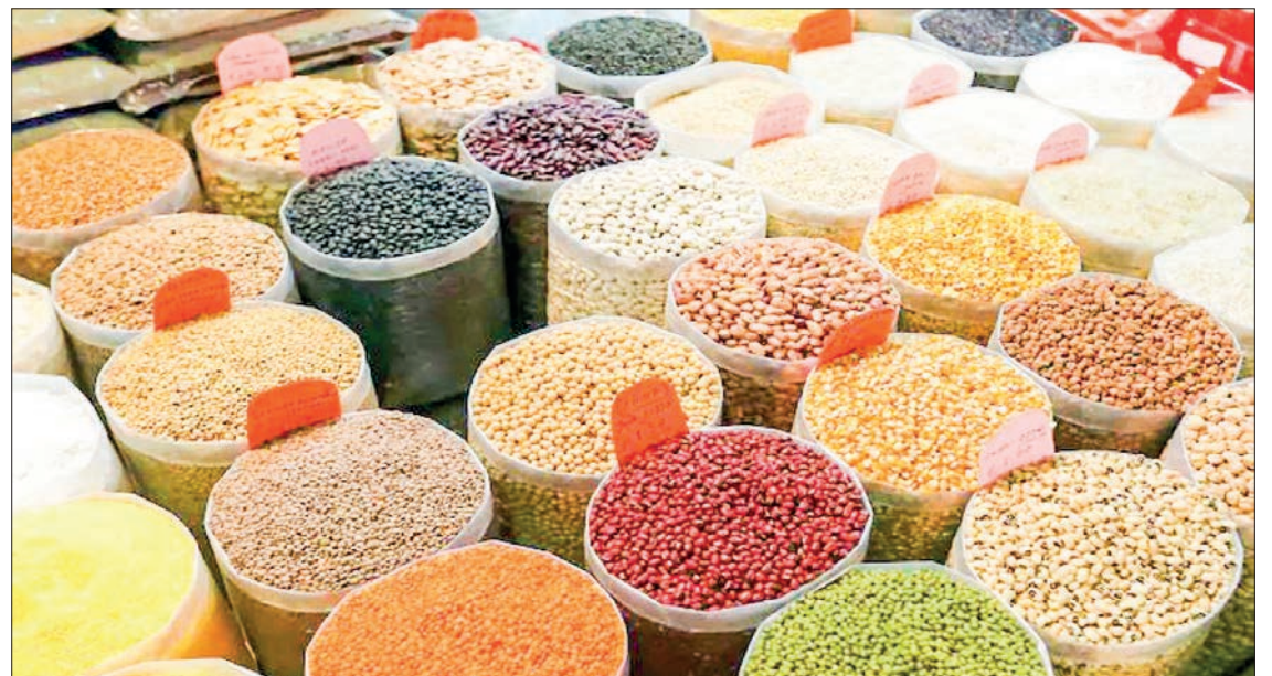
Various beans and pulses are displayed at a shop.

Myanmar grows 18 types of pulses, covering 11.45 million acres across the country. The pulses constitute 26 per cent for black gram, 25 per cent for black gram, 15 per cent for pigeon pea, eight per cent for chickpea and the remaining for other pulses. — TWA/EM