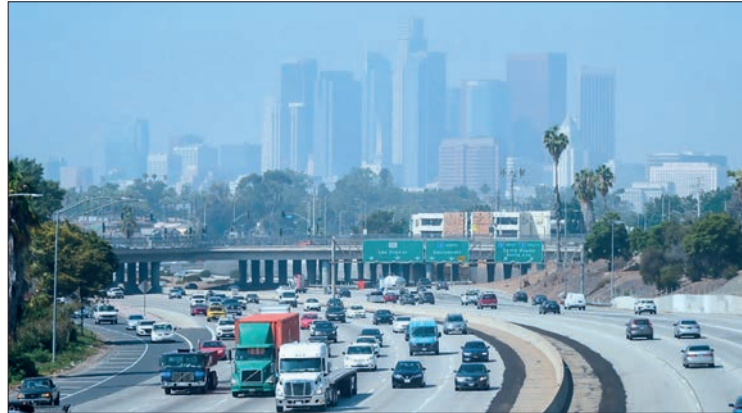
Southern California has the worst air pollution in the country, according to a new study by Environment California and CALPIRG. The report examines the interlocking roles of emissions, warmer temperature and drought.

More than 1.52 million of them were diagnosed with depression during the study period