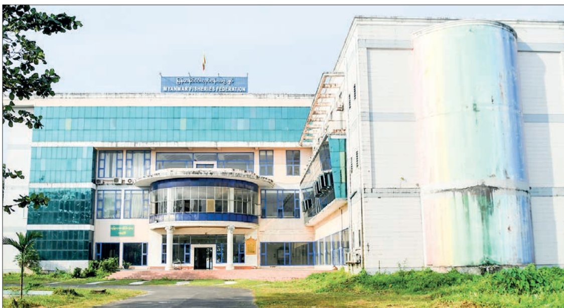
The office building of the Myanmar Fisheries Federation.

MYANMAR Fisheries Federation established in December 1998 will celebrate its Silver Ju-