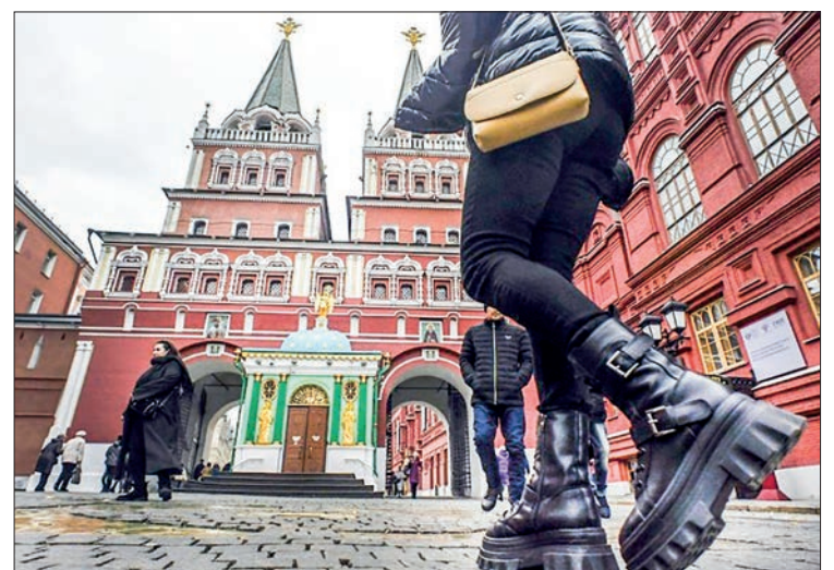
Crowds are thinner at Moscow's top sights. PHOTO: AFP/FILE

In 2022 only 842 Chinese tourists visited Russia. —AFP