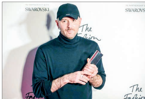
Balenciaga designer Demna has apologized for an ad campaign by the fashion label that appeared to reference child abuse.

BALENCIAGA'S creative director Demna has apologized for an ad campaign that appeared to reference