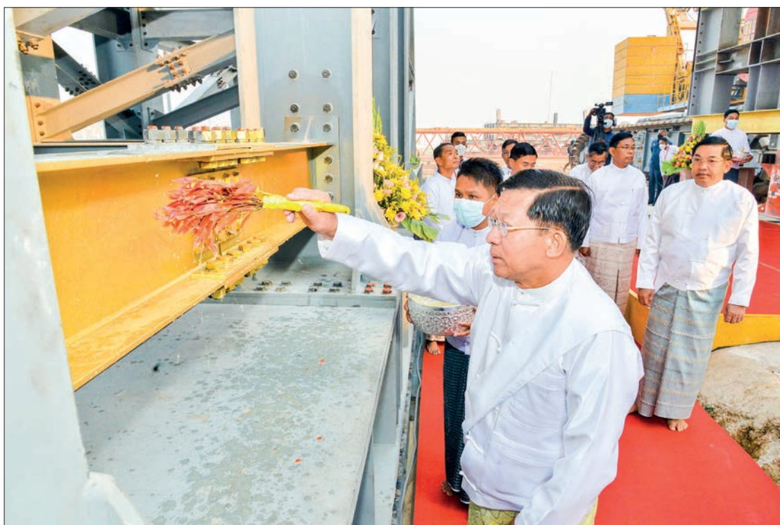
The Senior General sprinkles scented Paritta water on the steel tower crane.

Maravijaya Buddha image is being built for public obeisance with the aim of showing the flourishing of Theravada