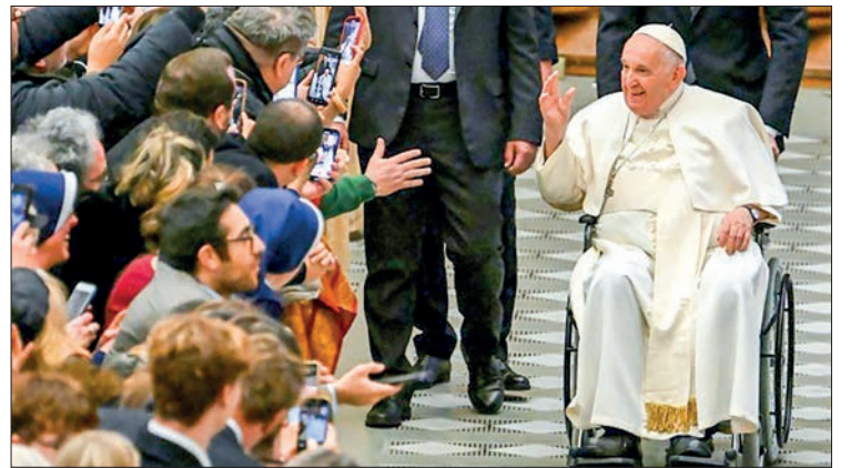
Pope Francis told reporters on his plane back from South Sudan last Sunday that his critics have "exploited" Benedict's death to further their cause.

The criticism was not new. Many in the conservative wing of the Roman Curia, which governs the Church, have long complained the Argentine pontiff is authoritarian and too focused on pastoral matters