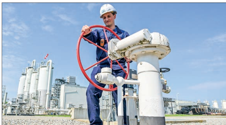
A worker at a gas hub in north-east Austria which handles mainly Russian gas.

THE International Energy Agency on Friday convoked a special meeting of energy ministers for urgent consultations on natural gas supplies.