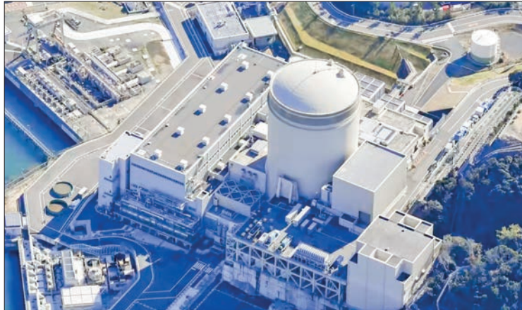
The Mihama nuclear plant's No 3 unit in Fukui prefecture, Japan intends to go "green" with extensive use of nuclear power.

In a bid to secure a stable energy supply and cut carbon emissions, the government, through the policy, envisions building next-generation nuclear plants, and upgrading