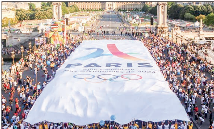
Ukraine has called for Russian athletes to be banned from the Paris Olympics.

"We see a blatant desire to destroy the unity of international sport and the international Olympic movement." Ukraine has reacted furiously to the International Olympic Committee's announcement last month that