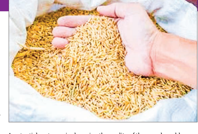
A potential customer is observing the quality of the sample paddy.

Thereafter, the prices increased again. The figures