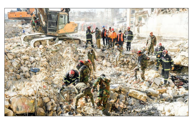
Rescue teams conduct search and rescue operations in Aleppo, Syria on 8 February.