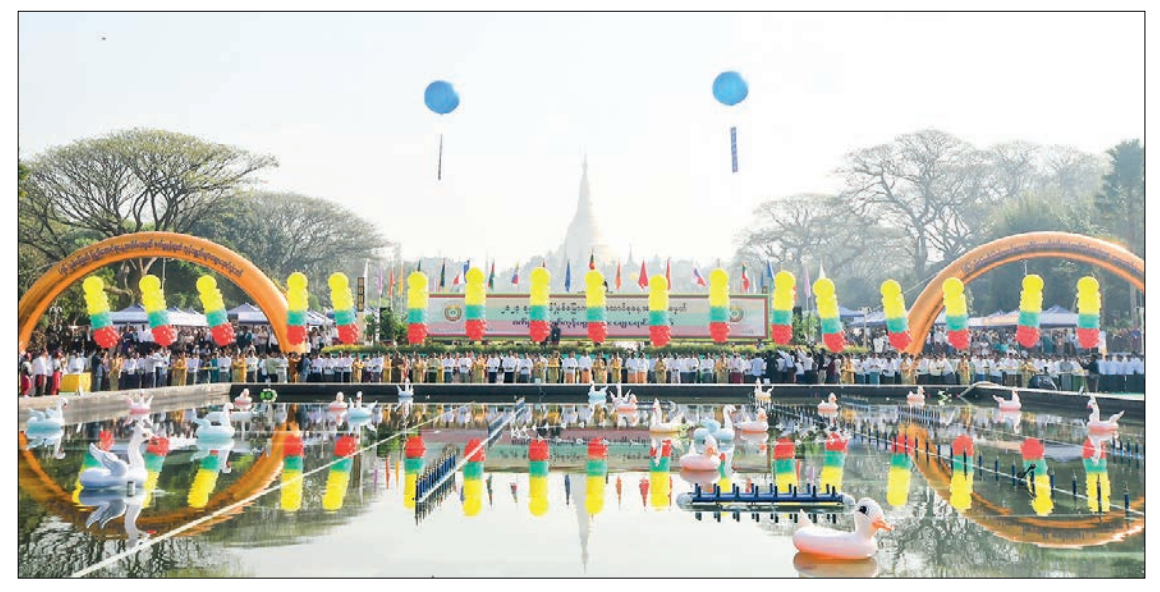
The ceremonial opening of the exhibitions of MSME products in honouring the 76^{th} Anniversary Union Day is in progress yesterday.

Chin, Mon, Bamar, Rakhine and Shan ethnics performed the song "Everlasting Faith".