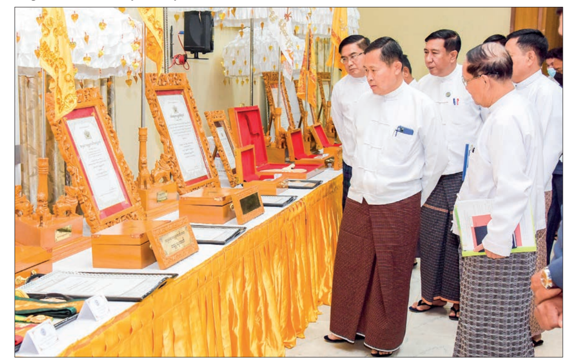
The Vice-Senior General views preparatory work for the 2023 religious title offering ceremony.