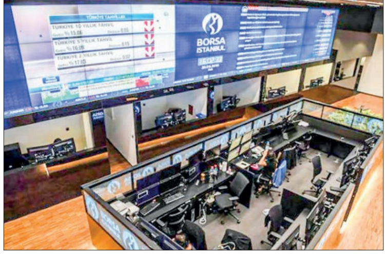
The exchange suffered sharp losses before suspending trading on Wednesday morning.

"Considering the low transaction volume that does not allow efficient price formation, all