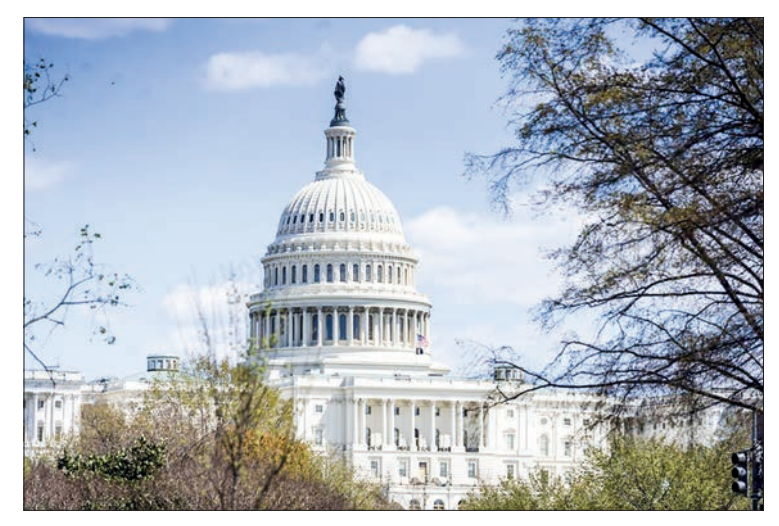
Photo taken on 2 April 2021 shows the US Capitol building in Washington DC the United States.

A group of House Democrats filed a resolution on Thursday, seeking to expel Republican lawmaker George Santos from the US Congress.