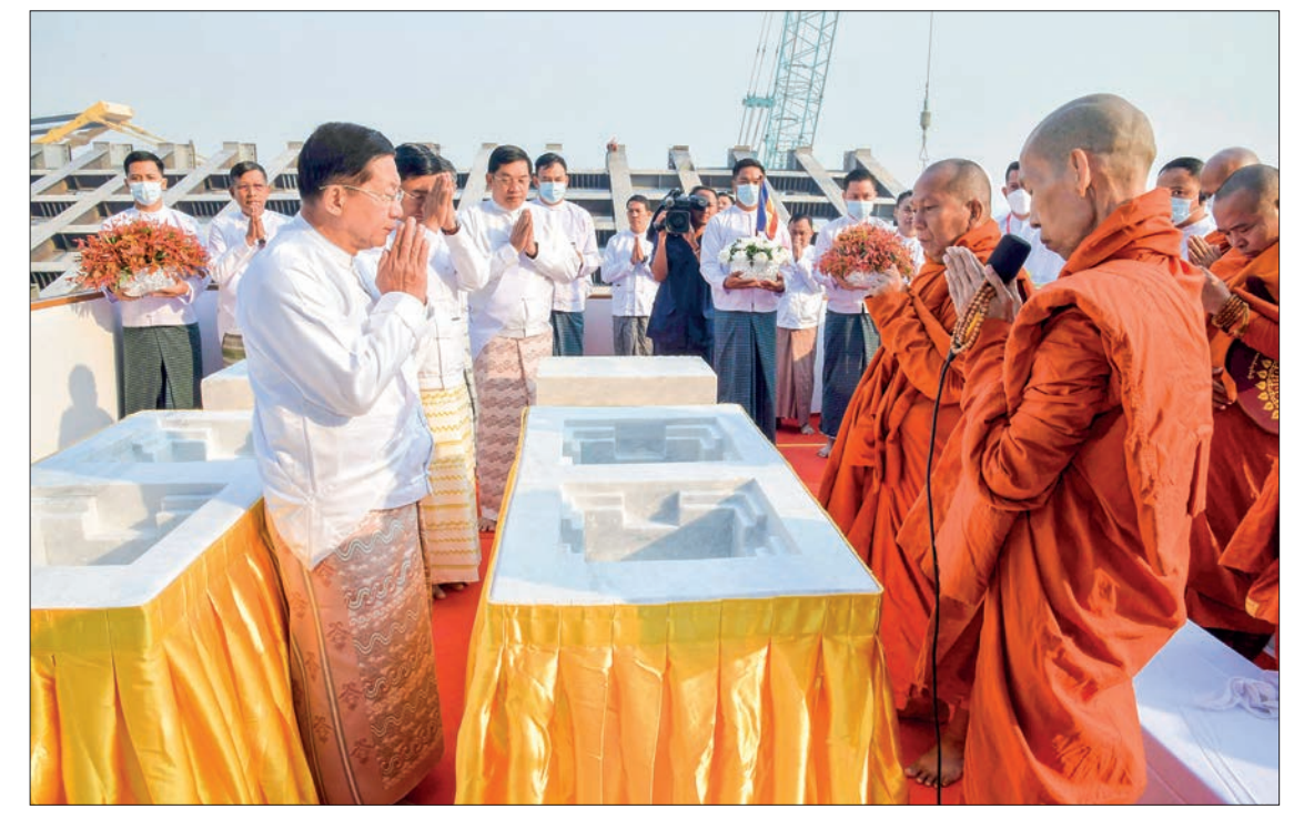
The enshrining ceremony of revered objects into the jewelled throne of the Maravijaya Buddha image is in progress yesterday in Nay Pyi Taw.

A ceremony to enshrine religious objects into the centre of the jewelled throne of the Buddha image took place on 27 January. On that day, gold wares weighing 104 ticals, 6 pe and three yway, gold wares