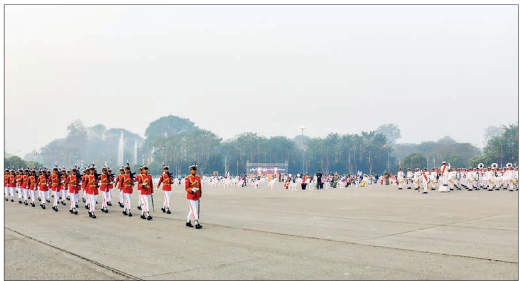
State Administration Council Vice-Chair Deputy Prime Minister Vice-Senior General Soe Win inspects preparations for the successful holding of the 76th Anniversary of Union Day vesterday.

STATE Administration Council Vice-Chairman Deputy Prime Minister Vice-Senior General Soe Win inspected preparations for the successful holding of the 76<sup>th</sup> Anniversary Union Day 2023 yesterday.