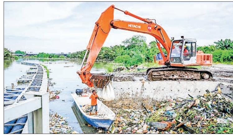
Workers clearing mounds of floating plastic waste of the Klang river, in Klang, on the outskirts of Kuala Lumpur.

Superbugs -- strains of bacteria resistant to antibiotics -- are estimated to have killed 1.27 million people in 2019, and the World Health Organization says antimicrobial resistance (AMR) is one of the top global health threats on the near-term horizon. Up to 10 million deaths could occur every year by 2050 because of AMR, the UN says.