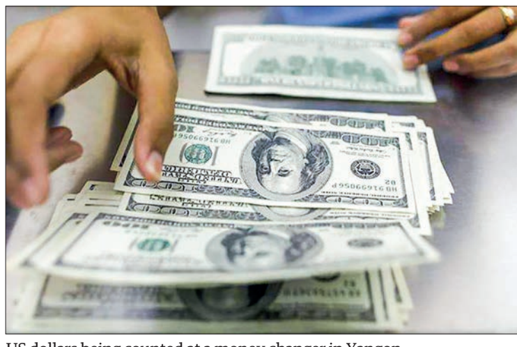
US dollars being counted at a money changer in Yangon.

There is a large price difference between the reference rate of the CBM and the unofficial market rate. However, there is no way to set the new price, as per the notification released on