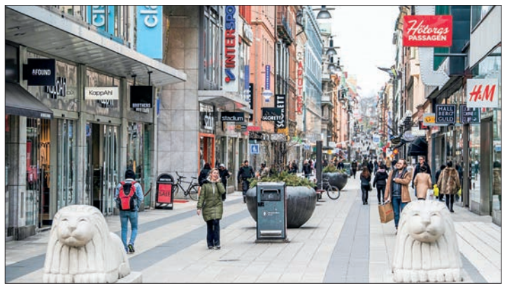
People shop in Stockholm on 24 March 2020 . PHOTO: AFP/FILE

The krona has also depreciated sharply against other main currencies.—AFP