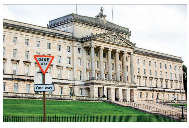
The seat of the Northern Ireland Assembly, often referred to as Stormont. Northern Ireland has been without a devolved government for almost a year because of a walk-out by the pro-UK Democratic Unionist Party.

The protocol, signed between London and Brussels as part of the UK's Brexit divorce from the European Union, governs trade in the British province, and keeps Northern Ireland in the European single market.—AFP