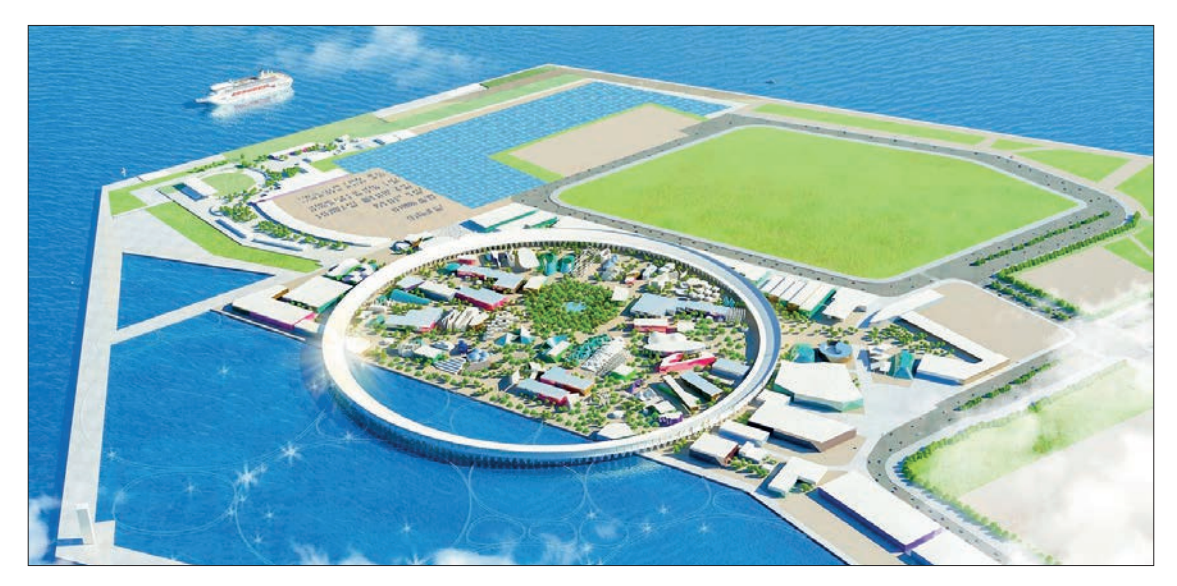
An artist's rendering shows the proposed venue for Osaka-Kansai Japan Expo 2025.

JAPAN aims to receive a record number of foreign visitors in 2025, a draft of the government's revised plan showed Thursday, with inbound tourism seeing a steady recovery since the country significantly eased border measures last October.