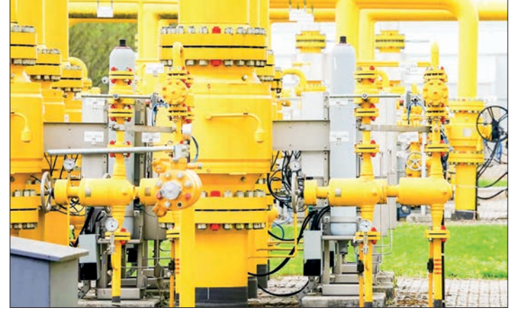
Pipes are seen at the gas transmission point in Rembelszczyzna near Warsaw, Poland

That means Poland is still buying 200,000 tonnes of oil from Russia each month.—AFP