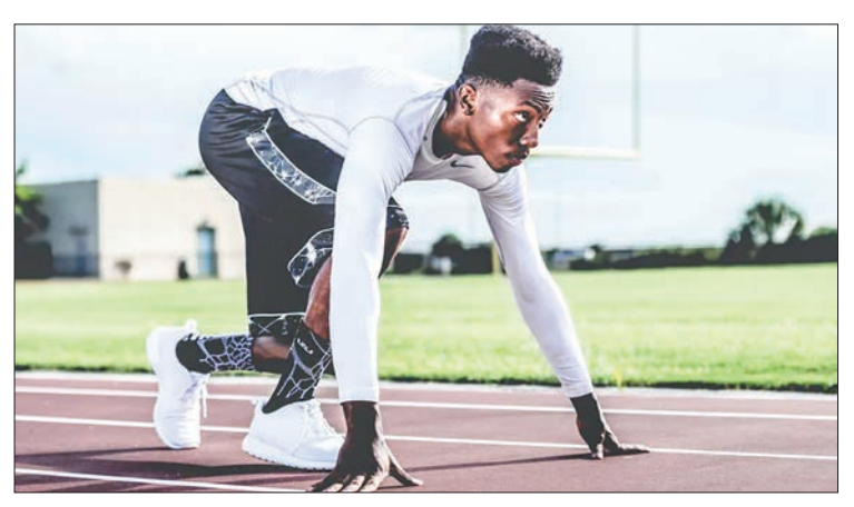
More than 400 athletes across a variety of sports, ages and levels of experience were questioned for the study by sports psychology experts from Staffordshire University and Manchester Metropolitan University.

ACCORDING to new research, 'put down' language is a major indication of poor mental health in sports. More than 400 athletes across a variety of sports,