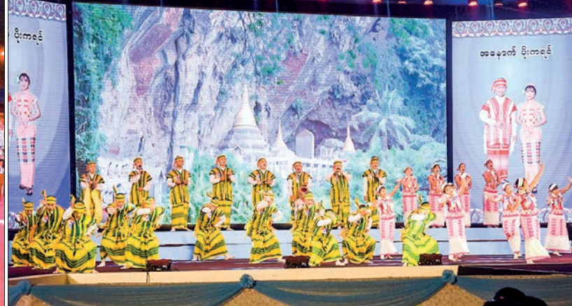
The \ Vice-Senior\ General\ and\ dignitaries\ watch\ the\ full-dressed\ rehearsal\ performance\ of\ ethnic\ cultural\ dance\ troupes.