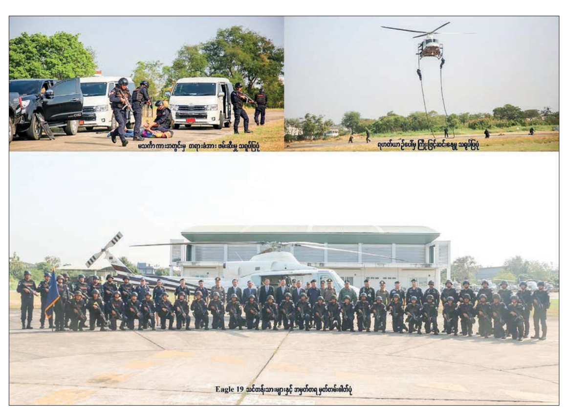
Demonstrations of the special task force Eagle 19 training (top photos). The MoHA deputy minister takes the documentary group photo together with Eagle 19 trainees.

After the ceremony, the Chief of Myanmar Police Force Maj-Gen Zin Min Htet met with Thai Legal Affairs Minister Mr Somsak Thepsutin. During the meeting, they discussed the drug cases in the region, control of illegal drugs in the golden triangle region, cooperation in seizing precursors, combatting the spread of drugs in regional and other countries, uncover of wanted suspects by two countries, plans to draft anti-drug activities at border areas, international cooperation, progresses in seizing drugs through bilateral cooperation