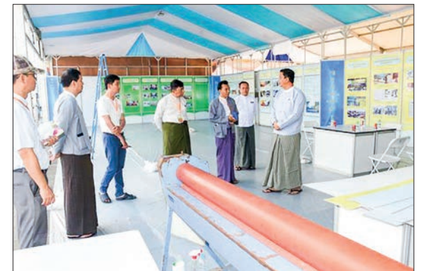
Exhibition booths are under preparation.

The Union Day Commemorative Fair will be held at People's Square from 9 am to 5 pm on 10-12 February with 25 ministries' galleries, 15 galleries of Nay Pyi Taw Council, regions and states, 15 ethnic food stalls and 356 galleries of the Yangon Industrial Zone. — TWA/MKKS