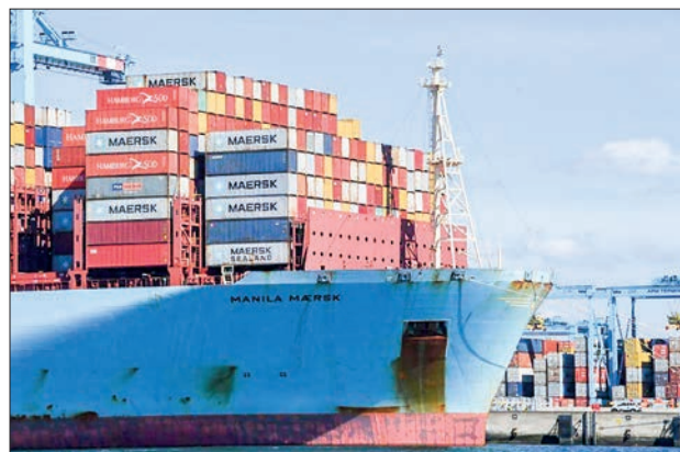
Demand for shipping plunged at the start of the pandemic, but bounced back strongly from mid-2020 until mid-2022, leading to bottlenecks on trade routes and causing massive disruption in supply chains.

GLOBAL shipping giant Maersk reported its biggest ever full-year profit in 2022, amid soaring freight prices and easing bottlenecks following the Covid pandemic.