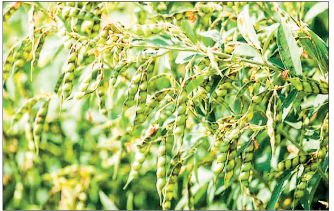
Pigeon pea crops are seen in the green lush field.

India has growing demand and consumption requirements for black grams and pigeon peas. According to a Memorandum of Understanding between Myanmar and India signed on 18 June 2022, India will import 250,000 tonnes of black gram and 100,000 tonnes of pigeon peas (tur) from Myanmar for five consecutive years from the