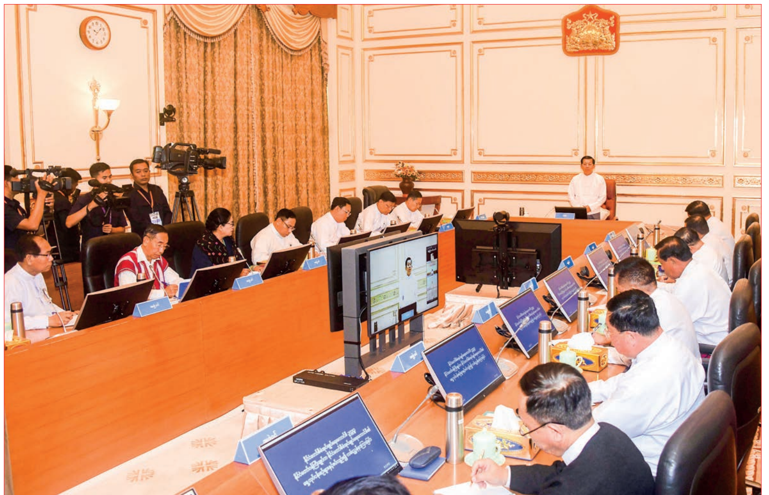
State Administration Council Chairman Prime Minister Senior General Min Aung Hlaing elaborates on the Five-Point Road Map of the State Administration Council at the guidance meeting in Nay Pyi Taw on 9 February 2023.

Regarding the first point of the road map "Priority will be given to fully realizing peace, stability and rule of law throughout the Union to safeguard the socioeconomic life of the people", the countries exercising the democratic system allow staging protests under the law. But, Tatmadaw controlled the violent events beyond the protests under the law. Terrorists intentionally committed attacks on innocent people, non-military target administration buildings, private businesses, public service personnel and religious persons. At that time, hard cores from unrest were sent to the insurgent areas and they were formed as so-called PDF terrorist groups. In so doing, some EAOs participated in such activities. The arms and ammunition seized by the Tatmadaw