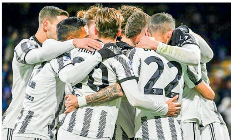
Juventus are trying to salvage something from a season beset by off-field problems.

But their season has been severely compromised by the 15-point penalty inflicted last month for what the Italian Football Federation ruled was illicit transfer activity designed to artificially boost their accounts,