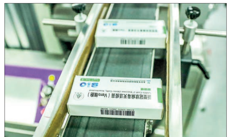
China is implementing swift and concrete measures to accelerate drug development, production and supply in order to guarantee better treatment of COVID-19 cases. COVID-19 inactivated vaccine products are packaged at a packaging plant of the Beijing Biological Products Institute Co Ltd in Beijing, capital of China, 25 December 2020.

Currently, there are more than 600 medications used to treat COVID-19 in China’s medical insurance catalog, according to the NHSA. — Xinhua