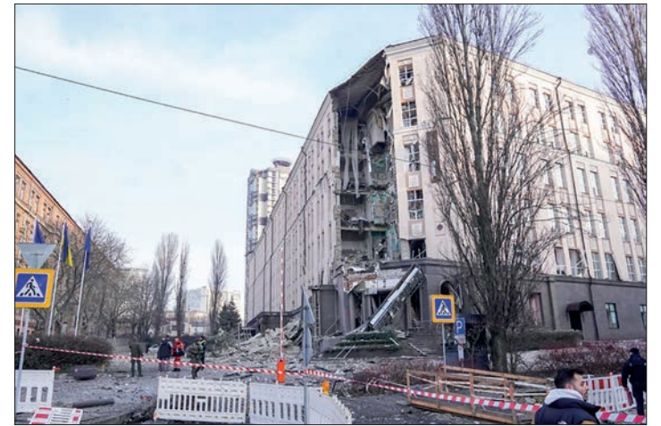
People stand by a damaged building in Kiev, Ukraine, Dec. 31, 2022.