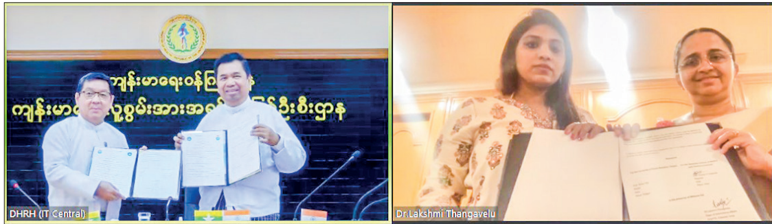
The MoU signing ceremony is in progress online.

THE signing of a five-year memorandum of understanding on cooperation in educational fields between the University of Dental Medicine (Yangon) of the Department of Human Resources for Health under the Ministry of Health and the Saveetha Institute of Medical and Technical