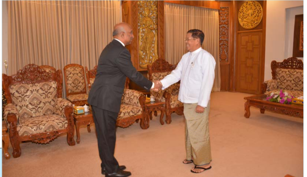
Union Minister U Than Swe greets the UNAIDS Country Director yesterday.

Also present at the meeting were senior officials of the Ministry of Foreign Affairs.—MNA