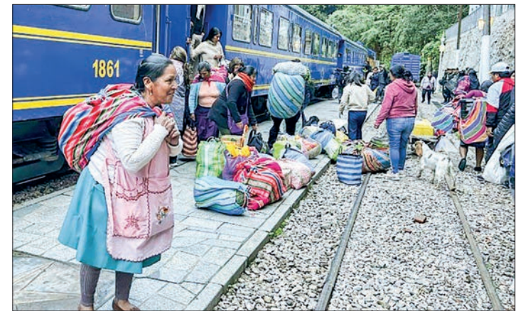
Locals loaded with bags of produce wait beside the Machu Picchu train service as it resumed following close to three weeks of suspension due to the protests in Peru. PHOTO: AFP

Protesters have blocked dozens of roads and placed rocks on the train tracks serving Machu Picchu. —AFP