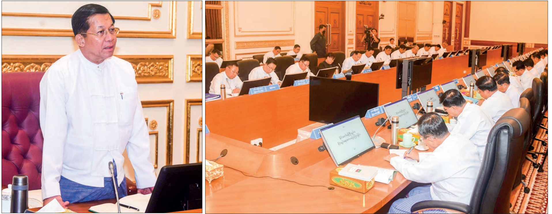
State Administration Council Chairman Prime Minister Senior General Min Aung Hlaing gives the speech at the Union government meeting 2/2023 in Nay Pyi Taw yesterday.

STATE Administration Council Chairman Prime Minister Senior General Min Aung Hlaing addressed the Union government meeting 2/2023 held at the SAC Chairman Office in Nay Pyi Taw yesterday.