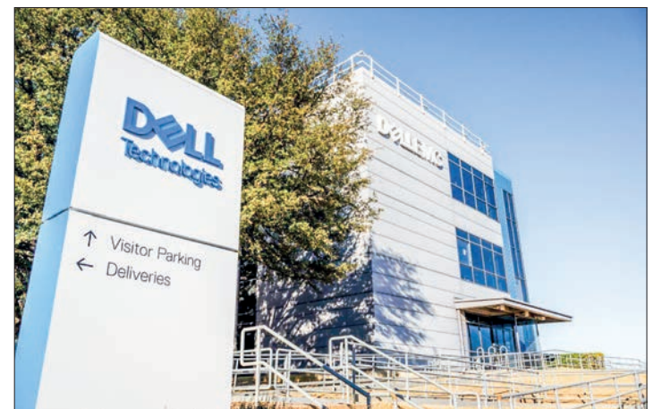
Product sales, such as of desktops, laptops and workstations, which represent the bulk of the group's business activity, fell by 10 per cent in its latest quarter. Photo shows a Dell Technologies office building in Texas.

On Monday, Clarke said the company now has to make "additional decisions to prepare for the road ahead".—AFP