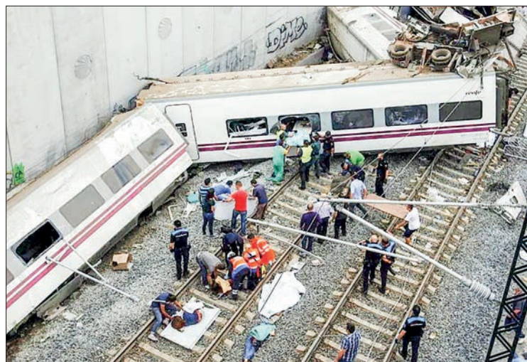
Rescuers tend to victims next to derailed cars at the site of a train accident near the city of Santiago de Compostela on 24 July 2013.