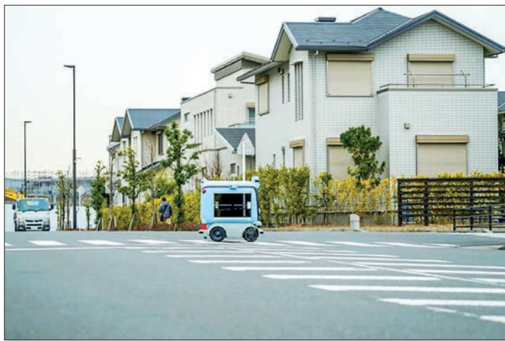
Proponents hope the machines could eventually help elderly people in depopulated rural areas get access to goods.

"EXCUSE me, coming through," a four-wheeled robot chirps as it dodges pedestrians on a street outside Tokyo, part of an experiment businesses hope will tack-