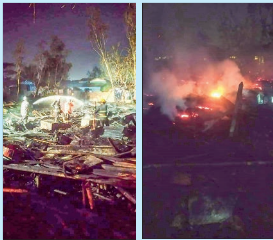
Fire brigade members extinguish the fire on Bo Teza Road, 20 th Ward, Hlinethaya Township on 9 February 2023.