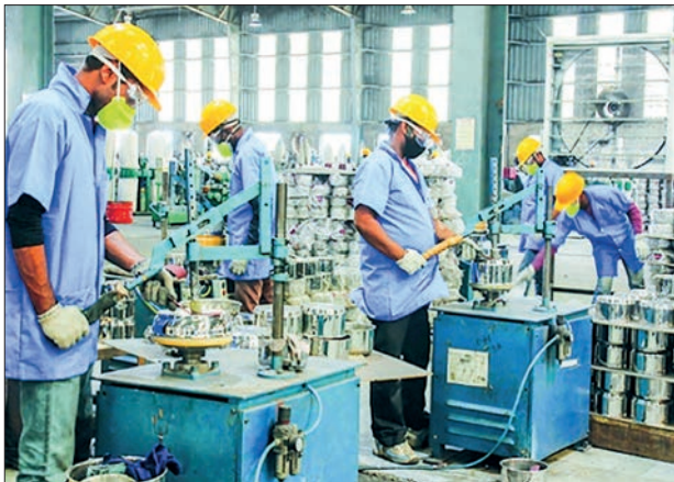
A medium-sized industry is seen under operation.

In addition, the consumption of foreign currency can be reduced if domestic needs such as consumer goods can be produced sufficiently. Similarly, efforts should be made for the country to become an exporter from being an importer by producing basic consumer goods that are needed for the country to meet domestic demand. By doing so, the country's economy will improve and commodity prices will also decrease if there is a balance of income and expenditure, he added. — TWA/CT