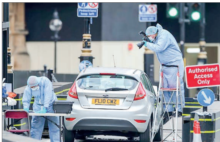
Forensic investigators work at the site after a car crashed outside the Houses of Parliament in Westminster, London, Britain, 14 August 2018.

Prevent was created as a strategy for supporting people vulnerable to being drawn into terrorism. But the hardline Braverman said its focus now "must solely be on security, not political correctness". —AFP