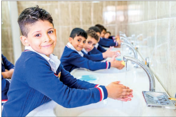
Clean drinking water and handwashing facilities are key to protecting children against the likes of Covid-19, parasites, respiratory illnesses and diarrhoea.

ONE in three children worldwide does not have access to clean drinking water while at school, impacting their health and ability to learn, the United Nations said Wednesday.