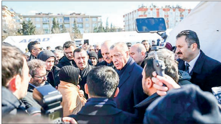
President Recep Tayyip Erdogan faces his biggest political test in May, with pressure higher on him after Monday's quake.

THE stakes could hardly be higher for Turkish President Recep Tayyip Erdogan.