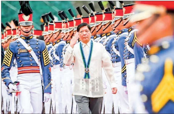
Philippine President Ferdinand Marcos Jr salutes during the 87th anniversary celebration of the Armed Forces of the Philippines in Quezon City, suburban Manila, in December 2022.

The Philippine leader's five-day trip from Wednesday is also politically important as Tokyo and Washington are seeking to deepen ties with Manila due to China's increasing military and economic clout in the region, experts said.—Kyodo