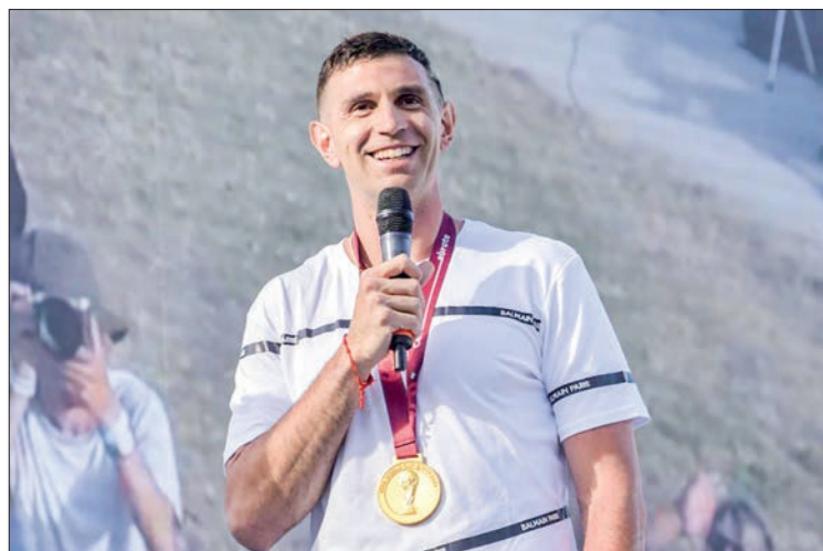
World Cup winner Emiliano Martinez, Yassine Bounou of Morocco and Belgium's Thibaut Courtois were nominated on Wednesday for the top goalkeeping prize at the FIFA Best awards.

WORLD Cup winner Emiliano Martinez, Yassine Bounou of Morocco and Belgium's Thibaut Courtois were nominated on Wednesday for the top goal-