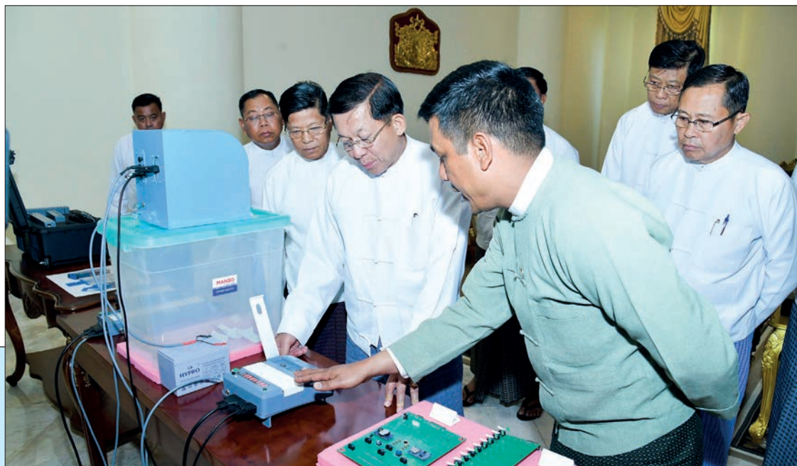
The Senior General looks into the Myanmar Electronic Voting Machine.

Then, the Senior General and party inspected the test run of the MEVM and instructed the necessary things.—MNA/KTZH