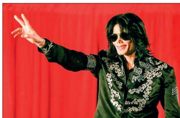
Michael Jackson, who died in 2009, is one of music's most successful acts, and his back catalogue is enormously valuable.

yet in the burgeoning music catalogue market, which has already seen some eye-popping transactions.