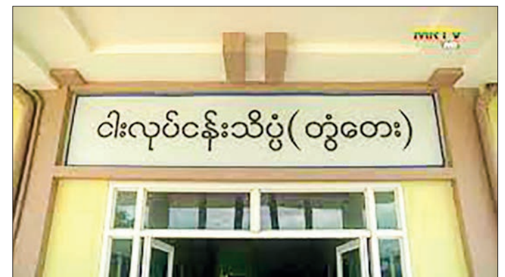
The Institute of Fisheries (Twantay).

He also elaborated that there are many places where fish farming can be carried out in the country, which has many rivers and lakes and a long sea coast, so plans are underway to open fisheries institute. Research can also be conducted to raise fish systemically and succeed in fish and shrimp farming. — TWA/KZW