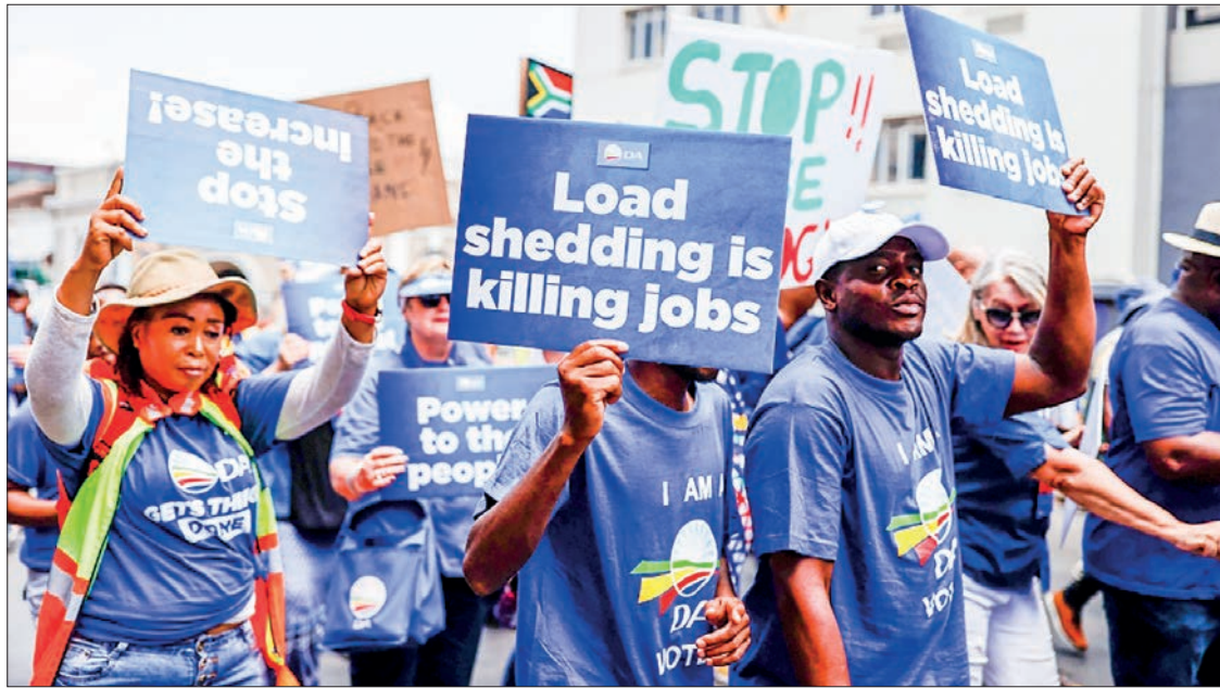
Democratic Alliance (DA) members hold placards as they march to Luthuli House, the headquarters of the ruling African National Congress (ANC), during a protest against prolonged energy crisis that has seen South Africans experience record power cuts, in Johannesburg on 25 January 2023.

A military parade staged by the presidential guard signals