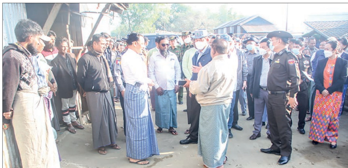
Union Minister Lt-Gen Tun Tun Naung and Union ministers are pictured inspecting one of the IDP camps in Rakhine State.

The Union ministers and party inspected the construction of houses, arrangements for water, electricity and sewage system, construction of the clinic, the earthen road and the box culvert, construction of the village community hall and schools