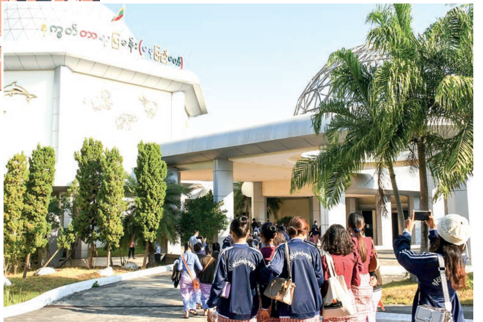
Ethnic cultural troupes from states and regions visit the Zoological Garden (above photo). The National Museum (above right). The Planetarium (below right) yesterday.

ETHNIC cultural troupes from regions and states, who will present traditional performances at the 76 th Anniversary Union Day celebrations, visited prominent sites in Nay Pyi Taw yesterday morning.