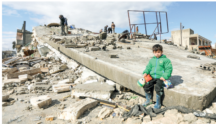
A Syrian child sits on a collapsed building in the town of Azaz on the border with Türkiye on 7 February 2023, following a deadly earthquake. The Syrian Red Crescent appealed to Western countries to lift sanctions and provide aid after a powerful earthquake has killed more than 1,600 people across the war-torn country.