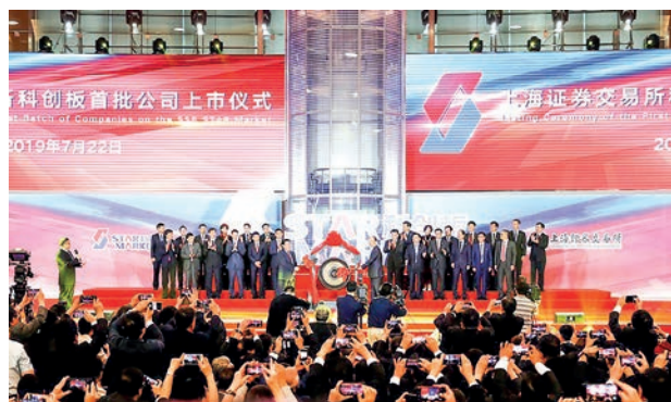
Photo taken on 22 July 2019 shows the debut ceremony of China's sci-tech innovation board (STAR market) at the Shanghai Stock Exchange in Shanghai.

The commission will crack down on illegal stock market activities, and will investigate and punish acts such as the fraudulent issuance of securities and financial fraud, it said. —Xinhua