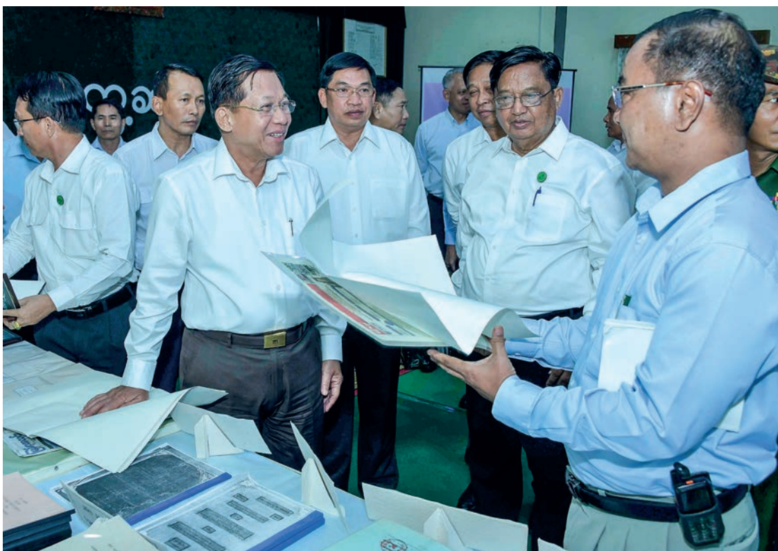
The Senior General is pictured during the inspection tour yesterday.

The Senior General presented cash awards for staff from two factories to officials and cordially greeted the staff.