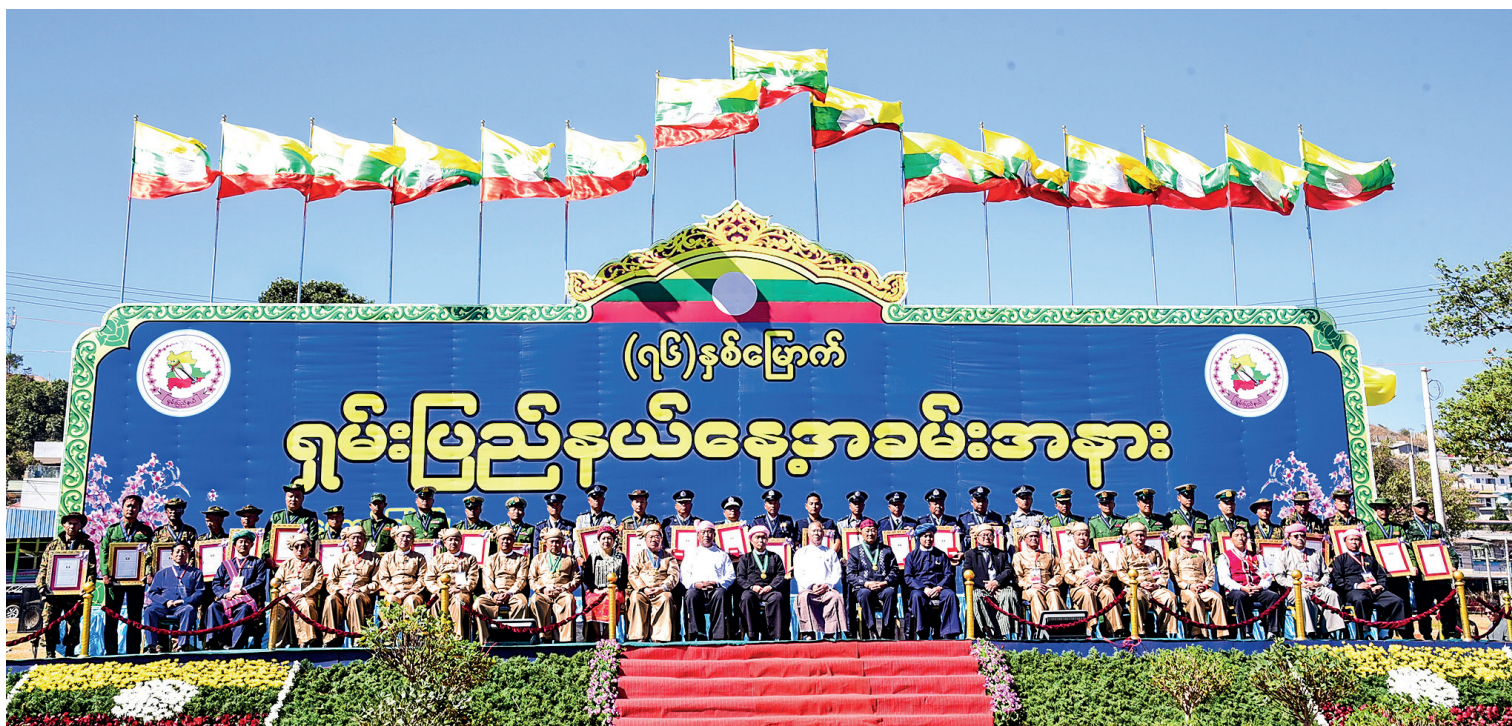
SAC members, Union ministers and dignitaries pose for the documentary group photo on the occasion of the 76 th Anniversary of Shan State Day.