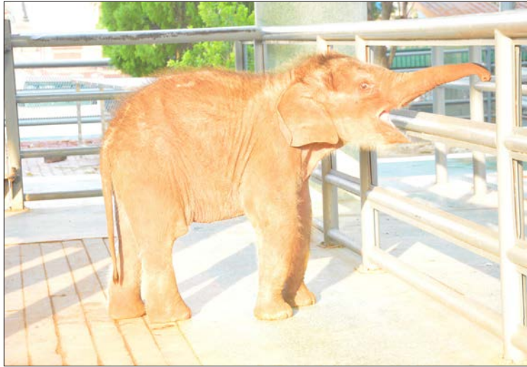
The baby White Elephant "Rattha Nandaka".