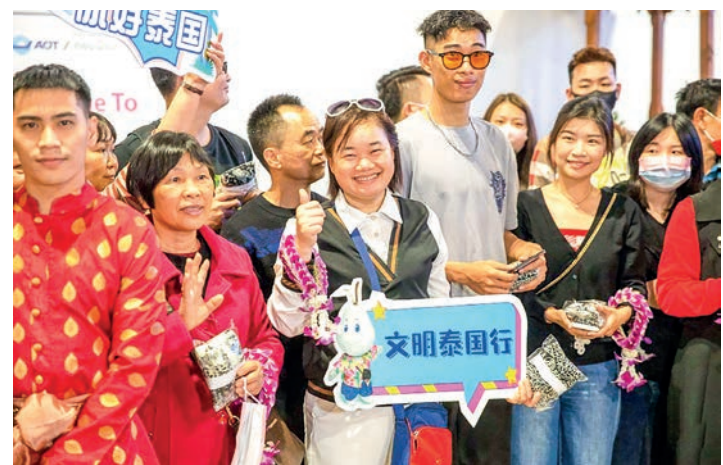
Chinese tourists arrive at Don Mueang International Airport in Bangkok, Thailand, 6 February 2023. PHOTO: XINHUA

"Thailand is honoured to be among the 20 countries chosen to once again welcome tour groups from China. We are extremely pleased to receive these first groups today, and look forward to seeing many more to come," Yuthasak Supasorn, governor of the Tourism Authority of Thailand (TAT), said at the welcoming ceremony at the airport. — Xinhua