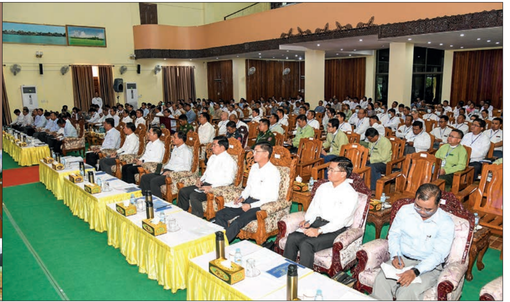
State Administration Council Chairman Prime Minister Senior General Min Aung Hlaing meets departmental personnel and MSME businesspersons in Patheingyi yesterday.

can be supplied to businesses continuously, it will help strong production. The amount of local circular money will increase and it will reflect the socioeconomic development of the people as well as the improvement of the State economy. Successfully implementing the MSME businesses will manage the import-substitute process and help export