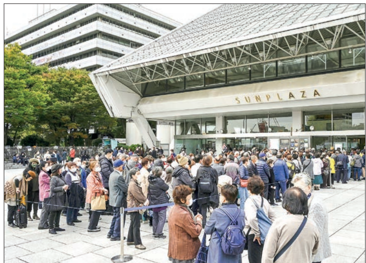
A long line forms outside a concert venue in Tokyo in October 2022.

"There will probably be some fans at the ground who will feel anxious, and we want to continue to take measures," an official of one first-division team said. Restrictions on crowd behaviour have also affected concert and theatre patrons. The government will downgrade the coronavirus's classification on 8 May, opening doors for some promoters and causing concern for others.—Kyodo