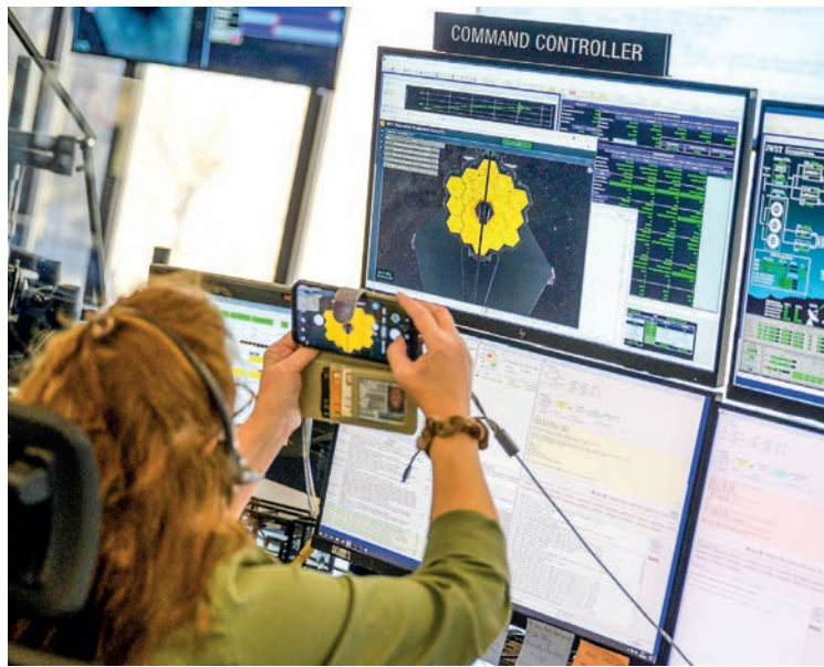
In this photo released by NASA, engineering teams at NASA's James Webb Space Telescope Mission Operations Centre at the Space Telescope Science Institute in Baltimore, Maryland, monitor progress as the observatory's second primary mirror wing rotates into position on 8 January 2022.