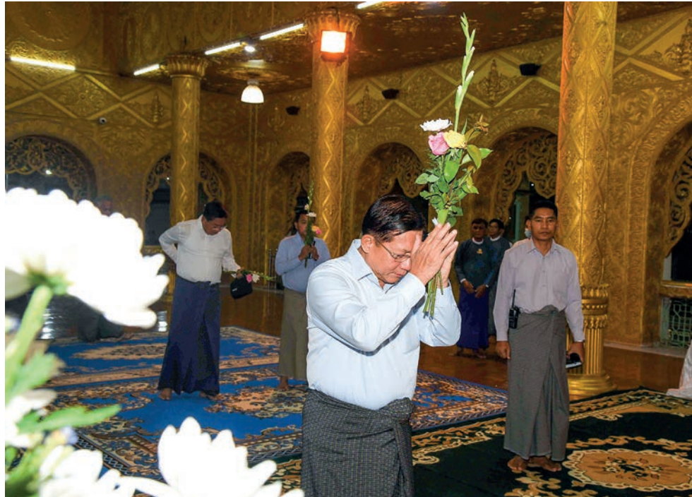
State Administration Council Chairman Prime Minister Senior General Min Aung Hlaing pays homage to the Buddha image at the Shwemokehtaw Maha Pagoda in Pathein yesterday.

Afterwards, the Senior General and party went round the pagoda by anti-clockwise