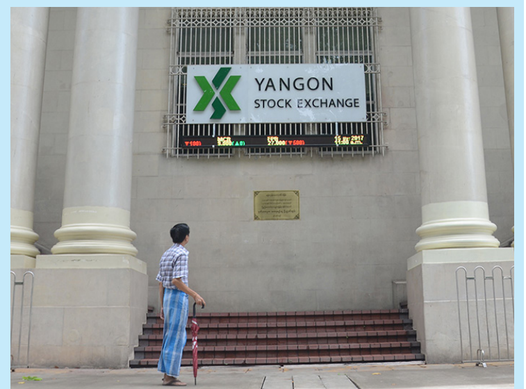
A man looks at the LED board showing the stock exchange rates at YSX in Yangon.

The YSX was launched four years ago to improve the private