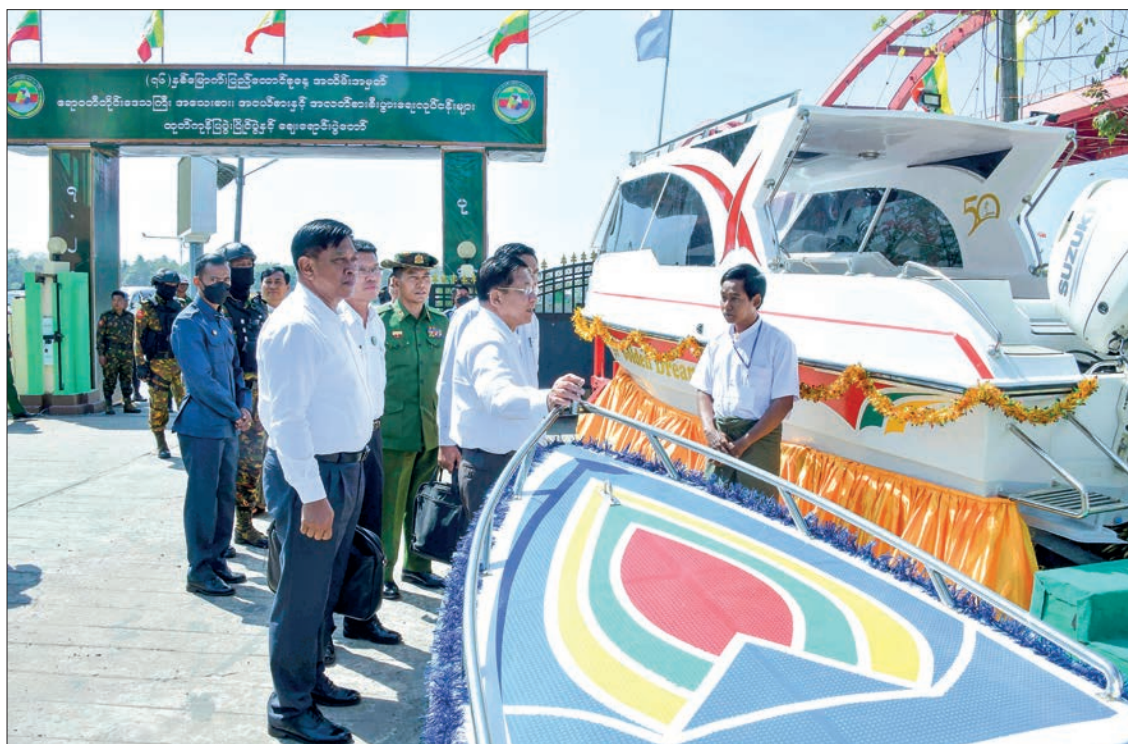
The Senior General views round the products of MSME businesses in Patheingyi.

The Senior General viewed the display of marine products, foodstuffs, personal goods, industrial products, traditional products and clothes and discussed the market potentials for these goods. — MNA/TTA