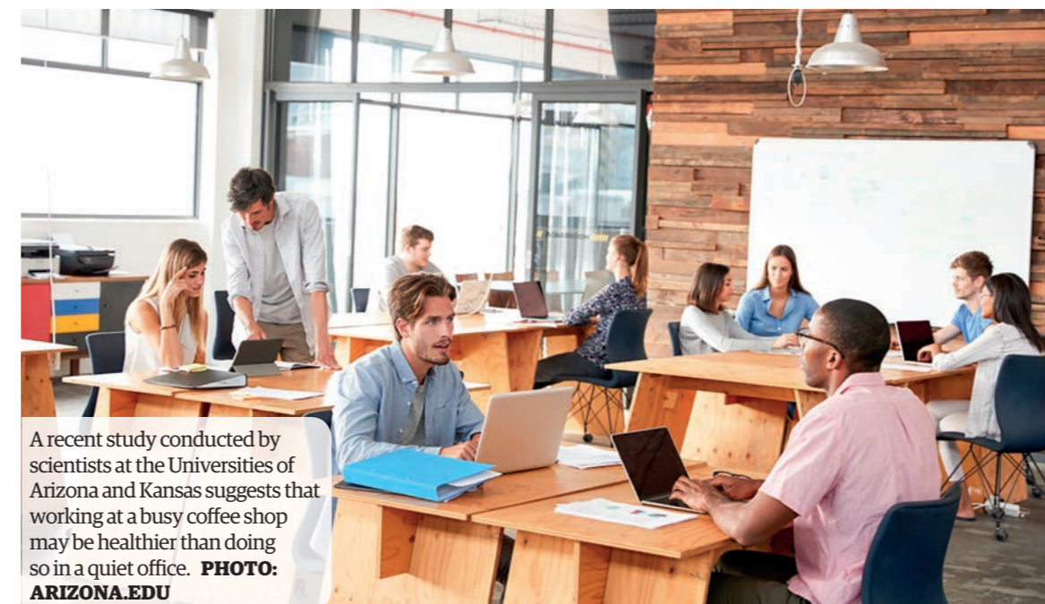
A recent study conducted by scientists at the Universities of Arizona and Kansas suggests that working at a busy coffee shop may be healthier than doing so in a quiet office.