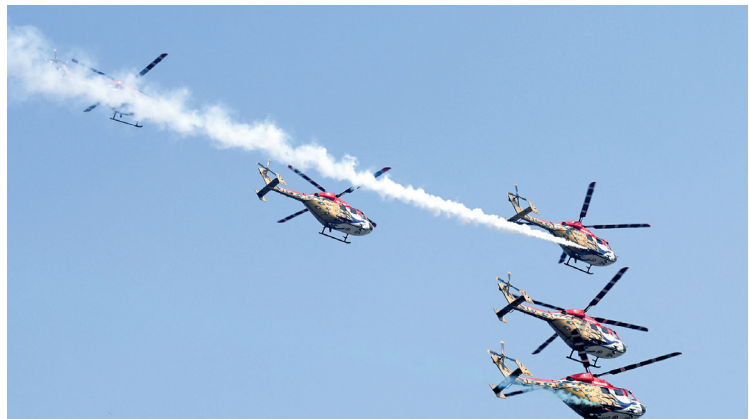
Indian Air Force (IAF) advanced light helicopters display team 'Sarang' perform during the full dress rehearsal for the upcoming Republic Day parade in New Delhi on 23 January 2023.

INDIA unveiled on Monday its largest helicopter factory, which can turn out at least 1,000 aircraft a year, as part of a defence self-reliance push to counter China's growing assertiveness.