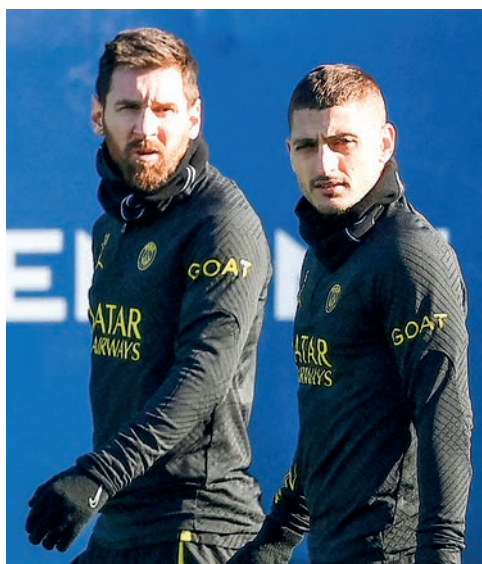
Paris Saint-Germain's Argentinian forward Lionel Messi (L) and Paris Saint-Germain's Italian midfielder Marco Verratti arrive for a training session at Saint-Germain-en-Laye, west of Paris on 7 February 2023, on the eve of French Cup football match against Olympique de Marseille.

Yet while Marseille will have a hostile crowd in their favour with 65,000 fans behind them on Wednesday, PSG's domestic superiority has been questioned in recent weeks.