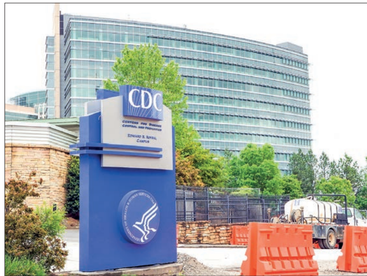
A general view of the Centres for Disease Control and Prevention Edward R Roybal campus in Atlanta, Georgia on 23 April 2020.

BLACK and Hispanic adults on dialysis experience more staph bloodstream infections than white patients receiving the treatment for kidney failure, US health officials said Monday.