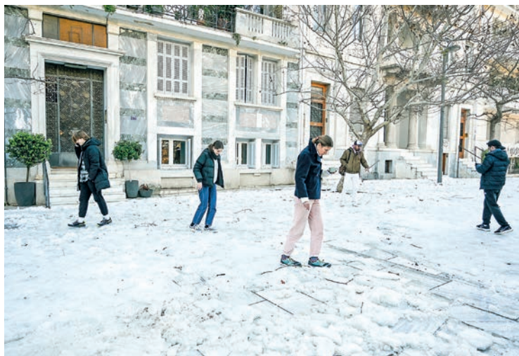
People try to walk on ice-covered walking zone in central Athens on 26 January 2022 after heavy snowfall in the Greek capital, which caused major traffic problems.

The storm, dubbed Barbara by Greek meteorologists, reached Athens on Sunday afternoon after sweeping through the north of Greece and islands in the North Aegean Sea. Authorities reopened both the roads to Athens international airport, 30 kilometres (19 miles) from the centre, and the main artery linking the city to Lamia in central Greece after they were closed for several hours early Monday