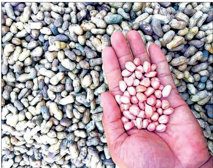
A man shows some of the white peanut in Monywa market.