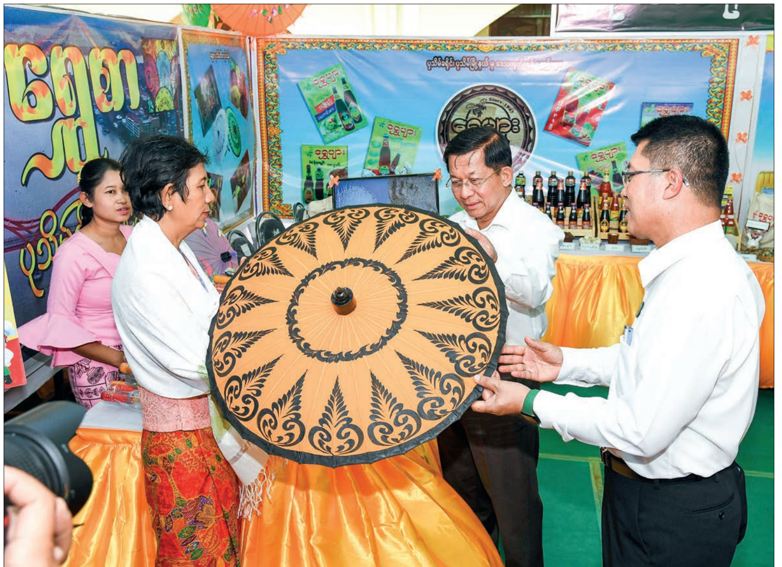
State Administration Council Chairman Prime Minister Senior General Min Aung Hlaing looks into one of the traditional products while meeting departmental officials and MSME business people in Patheingyi on 7 February 2023.

Union ministers discussed the improvement of the transport sector in the Ayeyawady Region, systematic ground inspection needed for upgrading of Patheingyi