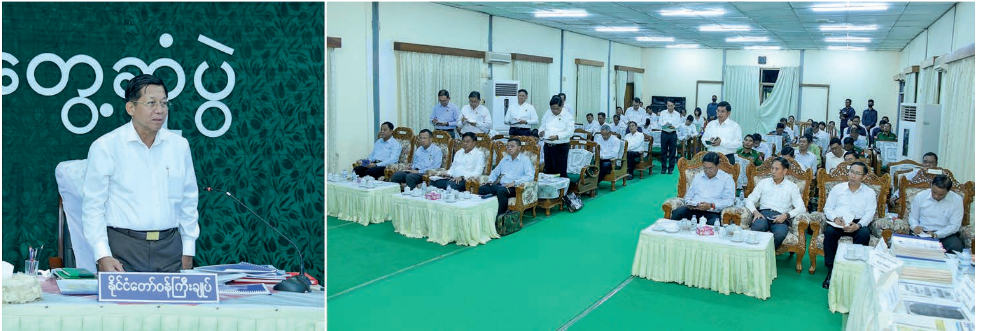
State Administration Council Chairman Prime Minister Senior General Min Aung Hlaing hears the reports on the advanced paper mill and the newsprint plant in Thaboung yesterday.

C HAIRMAN of the State Administration Council Prime Minister Senior General Min Aung Hlaing yesterday afternoon inspected the advanced paper mill (Thaboung) and the newsprint plant (Thaboung) of the Ministry