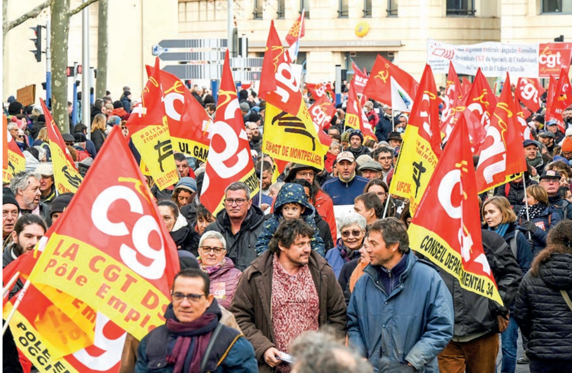
Protesters participate in a demonstration on the third day of nationwide rallies organized since the start of the year, against a deeply unpopular pensions overhaul in Montpellier, southern France on 7 February 2023.

the reform, which would see the age for a full pension raised from 62 to 64 and the mandatory num-