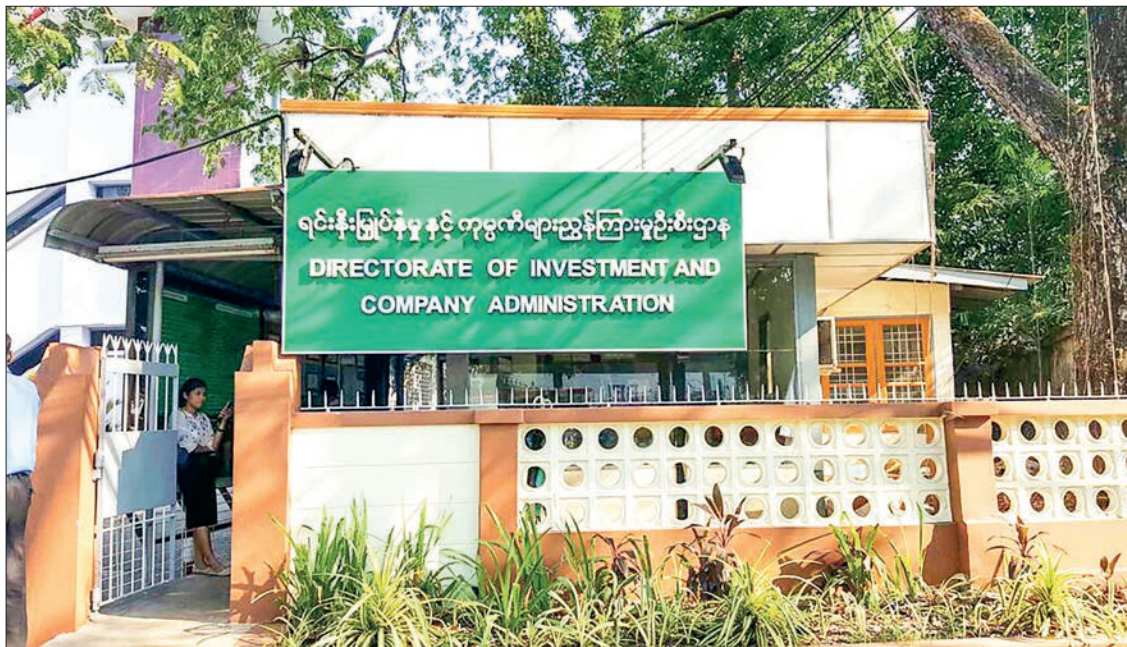
The office of the Directorate of Investment and Company Administration in Yangon.

In addition, all registered companies need to file annual returns (AR) on the MyCO