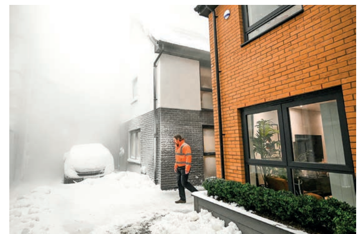
An engineer walks through a simulated snow storm between two houses built to develop future heating solutions at Energy House 2.0 at Salford University in Salford, north west England on 24 January 2023.