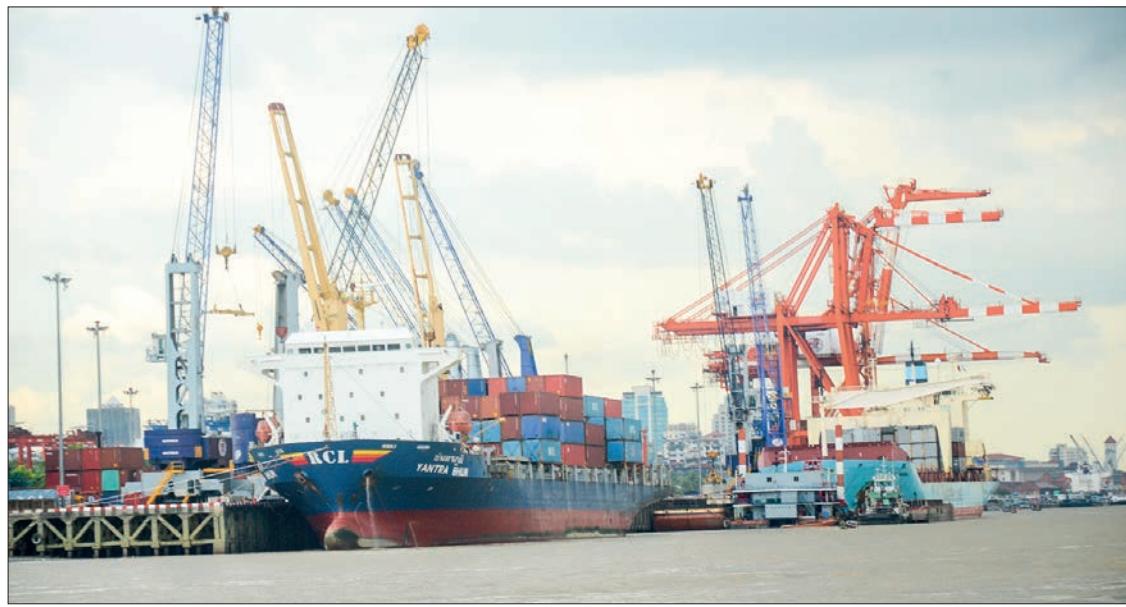
Overseas-going merchant vessels are seen berthing for loading and unloading cargoes at Yangon Port.

tal of 620 cargo ships this year, according to Myanmar Port Authority.