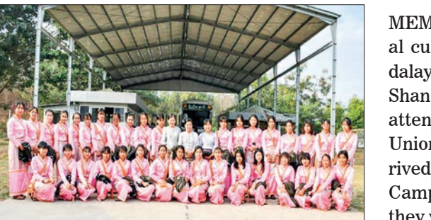
Ethnic traditional culture troupes from various states and regions are seen on their arrival in Nay Pyi Taw.

MEMBERS of ethnic traditional culture troupes from Mandalay region and Kayah, Chin, Shan and Mon states who will attend the 76 th Anniversary of Union Day celebration 2023 arrived at Nay Pyi Taw Training Camp (Sports Village) where they will stay temporarily.