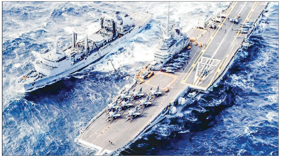
The aircraft carrier 'Sao Paulo' is seen in February 1994, when it belonged to France and was known as the 'Foch'.

group Robin des Bois meanwhile called the ship a "30,000-tonne toxic package."