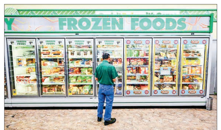
A man ponders the options at a Dollar Store in Alhambra, California.

That 2015 deal saw nations agree to limit global warming to well below two degrees Celsius since pre-industrial times, preferably 1.5C. Researchers looked at 10 societal factors that they considered to be the most important drivers of decarbonization and found that currently none are yet at a level that would lead to the dramatic emissions reductions needed by 2050.—AFP