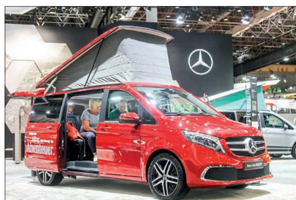
People visit the Caravan Salon 2022 in Dusseldorf, Germany, on 27 August 2022.