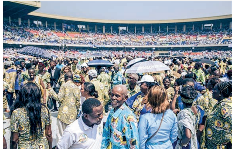
Pope Francis addressed thousands of youngsters at a packed stadium in DR Congo.

The visit has been long anticipated in a devout country of 12 million where the church is a deeply respected institution with a long history of peace-building. — AFP