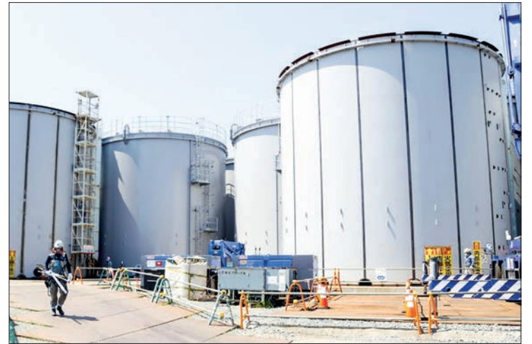
Photo taken 26 August 2020, at the crippled Fukushima Daiichi nuclear power plant in northeastern Japan, shows tanks for storing treated water from which most of the radioactive contamination has been removed.

But he stopped short of offering full support, saying that while his government has been “satisfied” with the information provided, “this is not to say that we are stopping, we continue to consult with the government of Japan” to ensure the water “meets requirements so that it is safe”. —Kyodo