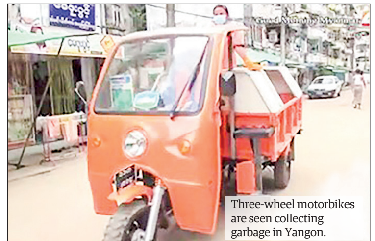
Three-wheel motorbikes are seen collecting garbage in Yangon.

The mayor called on the garbage truck drivers to drive the vehicle as per the rules of the workplace set by the department, always be aware of the traffic rules and regulations while driving, handle the hydraulic systems that are installed in the vehicle correctly and check the vehicle daily to avoid causing major damage. He also directed them to always act and work carefully to prevent occupational hazards. — TWA/CT