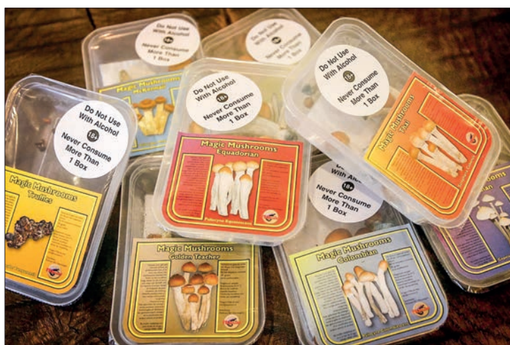
Mushrooms for sale are displayed in the smartshop Innerspace in Amsterdam 18 October 2007. PHOTO: FOR REPRESENTATIONAL PURPOSE ONLY/ AFP/FILE

Musker said the two drugs “reduce inhibitions” and could help people process difficult images and memories. —AFP