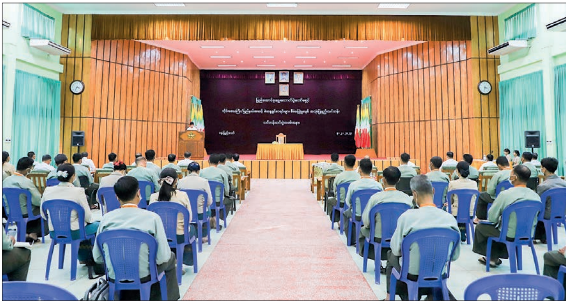
The winding up ceremony of the voter lists management software training course is in progress yesterday.

The ceremony was attended by UEC members, officials and trainees.