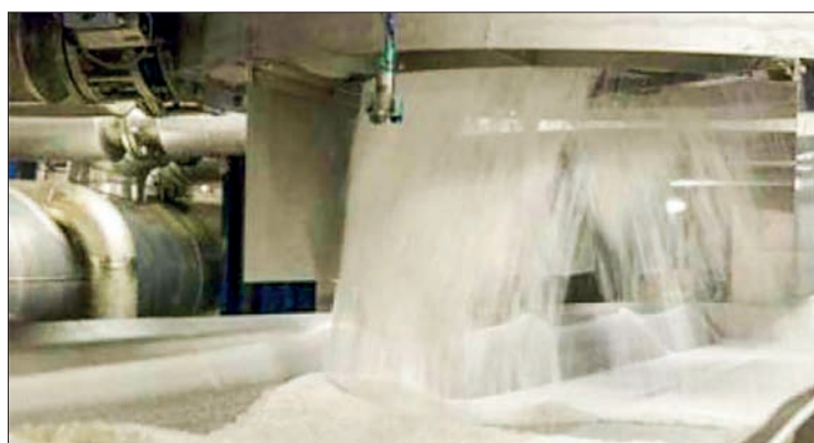
Sugar-producing process is seen at one sugar mill.

IN the local sugarcane market, starting from February 2023, companies announced that they will buy sugarcane at around K100,000 per tonne.