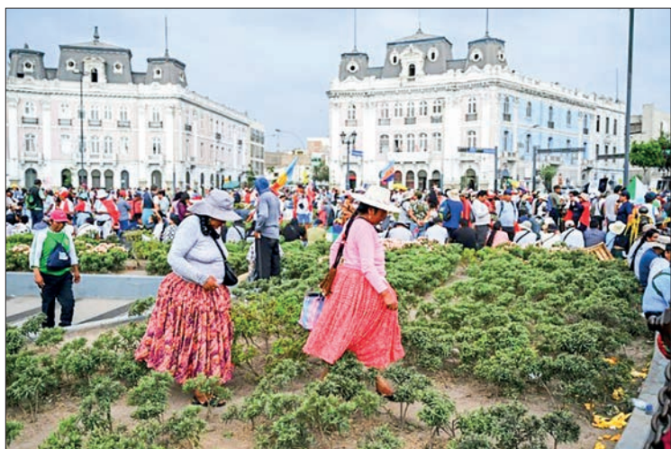
People protest against the government of Peruvian President Dina Boluarte in Lima on 2 February 2023.

PERU'S Congress on Thursday voted down another proposal to advance elections to this year, a day after a similar proposal aimed at quelling deadly nationwide unrest also failed.