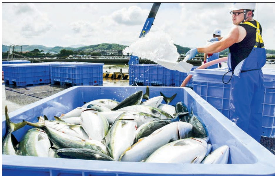
Products in all categories logged their best ever results in the reporting year, with agricultural product exports accounting for 887 billion yen, fishery products for 387.3 billion yen and forestry-related items for 63.8 billion yen.

Products in all categories logged their best ever results in the reporting year, with agricultural product exports accounting for 887 billion yen, fishery products for 387.3 billion