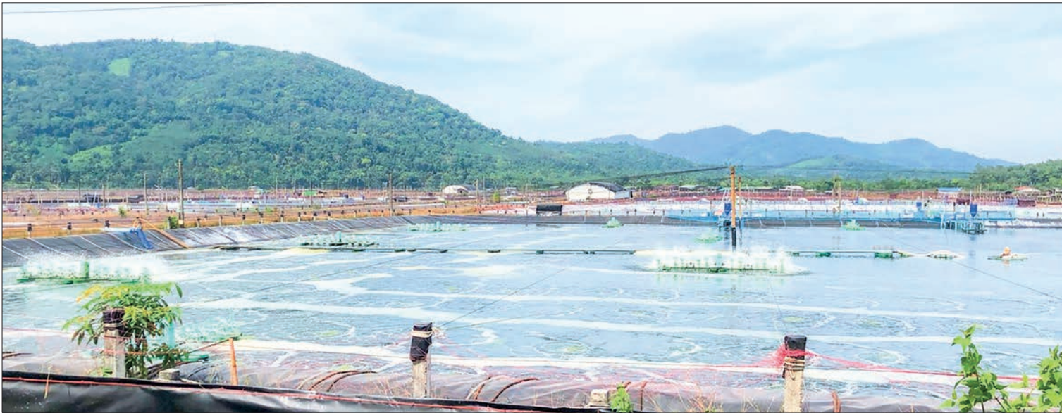
Photos show one of the fish and prawn farms and its fishery products.

T HE government is accelerating agriculture and livestock farms in the country. The agriculture and breeding industries rely on each other and there should be proportionate development in these two sectors to meet the objectives of the country.