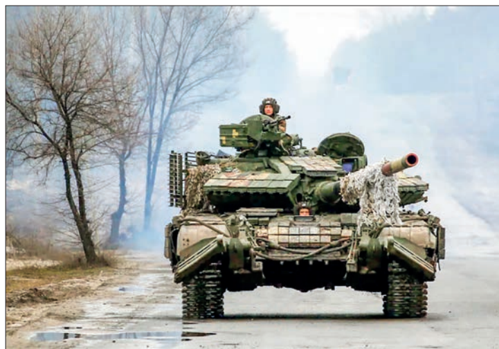
Ukrainian tanks ride towards the front line with Russian forces in the Lugansk region of Ukraine on 25 February 2022.

“We have something to respond with,” he added. “A modern war with Russia will be completely different.”—AFP