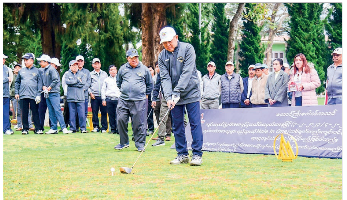
The opening ceremony of the golf tournament is in progress yesterday in Taunggyi.

A total of 101 teams from wards in Taunggyi, Ayethaya, and Shwenyaung, districts and townships in Shan State and departments took part in the Htamane competition.