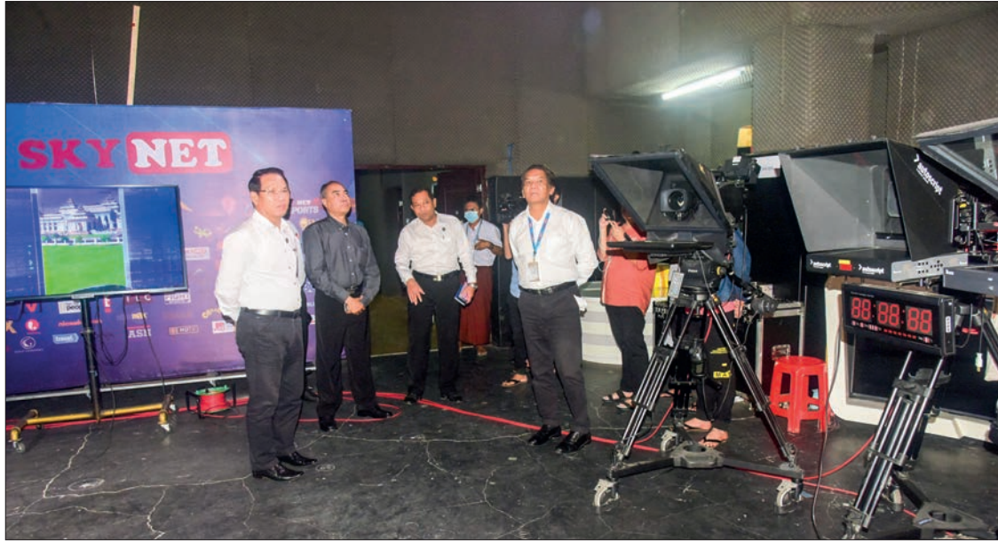
Union Minister U Maung Maung Ohn views round the Skynet headquarters in Yangon yesterday.

Shwe Thanlwin Media Company Limited in Botahtaung Township of Yangon yesterday.