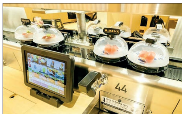
Japanese restaurant chain Kura Sushi plans to install cameras above its conveyor belts to monitor customers.

In one, viewed nearly 40 million times on Twitter, an apparently teenaged customer licks the top of a communal soy sauce bottle and the rim of a teacup he then places back on a shelf, before licking his finger and touching a piece of sushi as it goes past on the belt.—AFP