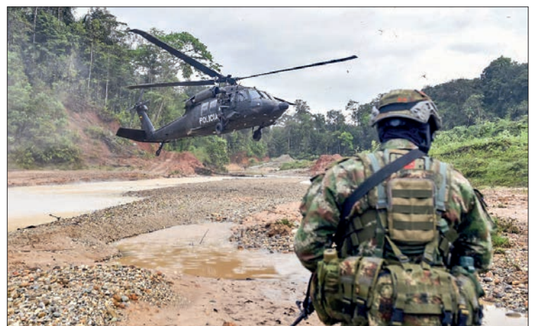
A helicopter lands at an illegal gold mining place in Triangulo de Telembi, Colombia on 25 January 2023.

ers from mining for gold, an illegal activity that helps fund the National Liberation Army (ELN) rebels and dissidents of the now-defunct Revolutionary Armed Forces of Colombia (FARC) guerrillas who made peace with the state in 2016, laying down their arms to form a communist political party. — AFP