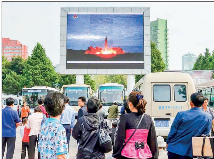
North Koreans watch on 4 October 2022 a news report showing North Korea’s Hwasong-12 intermediate-range ballistic missile launch on electronic screen at Pyongyang station in Pyongyang, North Korea.