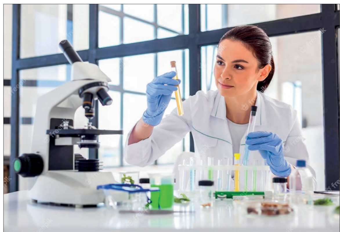
The team hopes that their results will help develop therapeutics for SSPE, as well as elucidate the evolutionary mechanisms common to viruses that have similar infection mechanisms to measles such as novel coronaviruses and herpesviruses.

A virus infects cells through a series of proteins that protrude from its surface. Usually, one protein will first facilitate the virus to attach to a cell's surface, then another surface protein will cause a reaction that lets the virus into the cell, leading to an infection. Therefore, what a virus can or cannot infect can depend heavily on the type