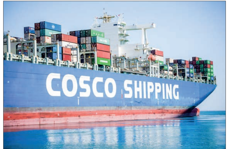
The exclusions cover 81 medical-care products, and the exemptions stem from the US battle against the Covid-19 pandemic.

Items on the list include pump bottles for hand sanitizer,