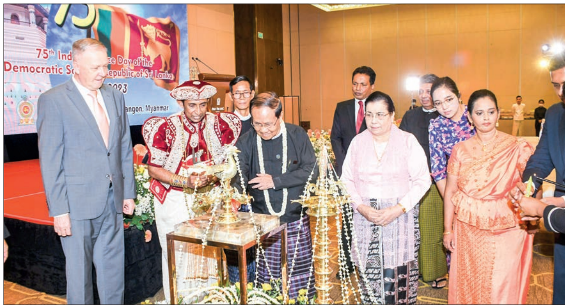
The celebration of Sri Lanka's 75 th National Day (Diamond Jubilee) is in progress in Yangon yesterday.

Ambassadors from foreign embassies in Yangon, charge d'affaires of embassies, representatives of the United Nations and invitees attended the celebration. — MNA/KZW