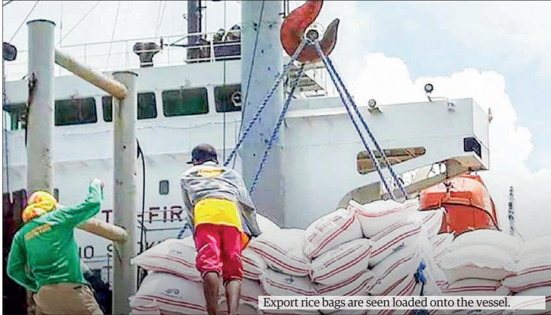
Export rice bags are seen loaded onto the vessel.

IN the second week of January 2023, 65,330 tonnes of rice and broken rice were exported to foreign countries, earning US$25.921 million, according to the Ministry of Commerce's data.