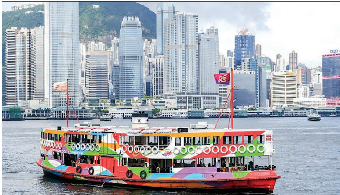
A ferry with flags marking the 25th anniversary of Hong Kong's return to the motherland sails at the Victoria Harbour in Hong Kong, south China, 22 June 2022.

HONG Kong is ready to welcome the world back, its leader said Thursday, as he pitched free flights and positive publicity to resurrect the once-vibrant global hub after three years of Covid-enforced isolation.