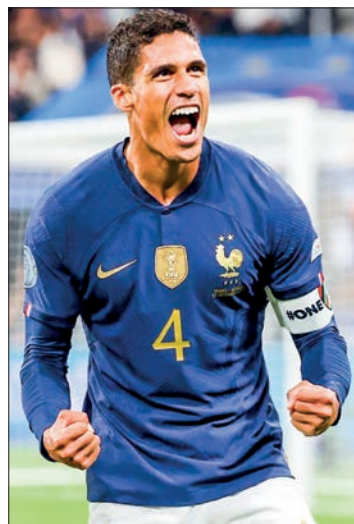
Raphael Varane of France celebrates the goal of Kylian Mbappe of France during the UEFA Nations League League A Group 1 match between France and Austria at Stade de France on 22 September 2022 in Saint-Denis near Paris, France.

FRANCE centre-back Raphael Varane, a World Cup winner in 2018 and runner-up last year, announced Thursday his retirement from international duty at the age of 29. "I've been thinking about it for several months and I decided it was the right time for me to retire from international football," Varane wrote on Instagram. The Manchester United defender made his France debut in 2013 and won 93 caps for Les Bleus. He had been in the running to take over as captain following the retirement of Hugo Lloris last month.