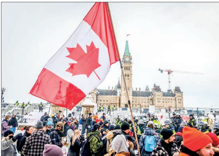
Canada approved doctor-assisted suicide for the terminally ill in 2016. This was expanded in 2021 to include adults with serious and chronic physical conditions that were not life-threatening. Demonstrators protest in front of Parliament Hill, in Ottawa, Canada on 11 December 2022.

But on Thursday Justice Minister David Lametti introduced a bill in parliament seeking a one-year extension, to 17 March 2024, for such an inclusion. —AFP