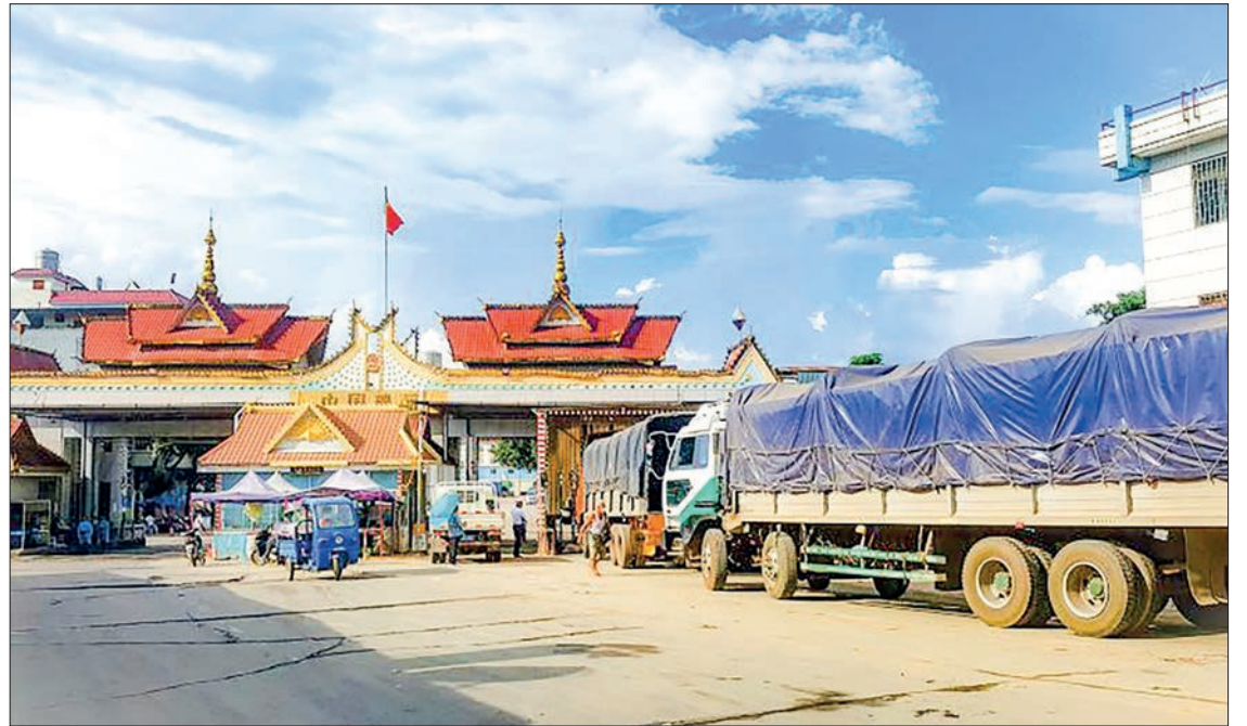
Myanmar has opened five border trade zones with China—Muse, Lweje, Kampaiti, Chinshwehaw and Kengtung. Lorries laden with export cargoes are pictured on the Sino-Myanmar border.

Similarly, Mang Weing linking to Muse border post, which is a major crossing point