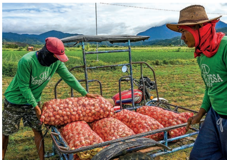
This photo taken on 17 January 2023 shows farmers loading sacks of harvested onions onto a tricycle at a farm in Bongabon, Nueva Ecija province.