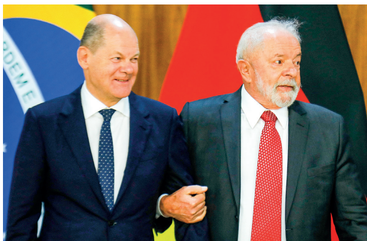
Brazilian President Luiz Inacio Lula da Silva (R) and German Chancellor Olaf Scholz (L) gesture during a press conference at the Planalto Palace in Brasilia on 30 January 2023.

GERMANY on Monday outlined more than $200 million in contributions for environmental projects in Brazil as Chancellor Olaf Scholz visited the South Ameri-