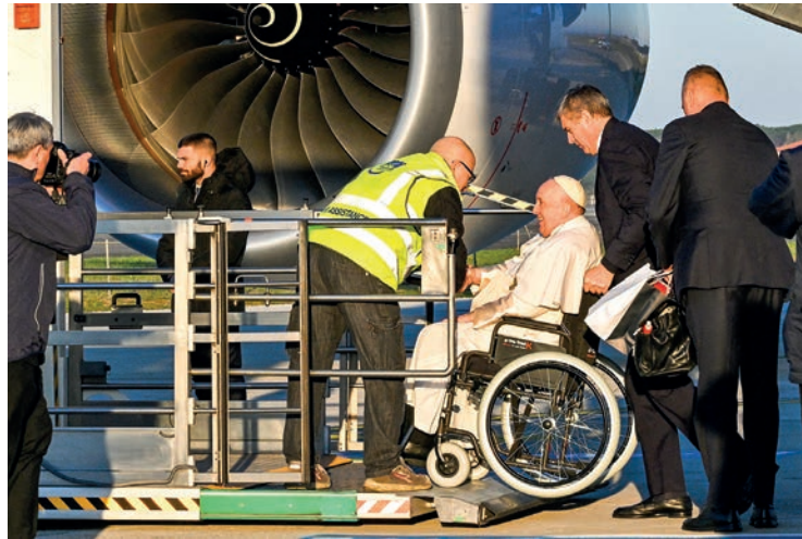
An airport assistant (L) greets Pope Francis prior to lift him on a platform to board his plane on 31 January 2023 at Rome's Fiumicino airport, heading to Democratic Republic of Congo and South Sudan.

He lamented "armed clashes and exploitation" in DR Congo, and said South Sudan, "wracked by years of war, longs