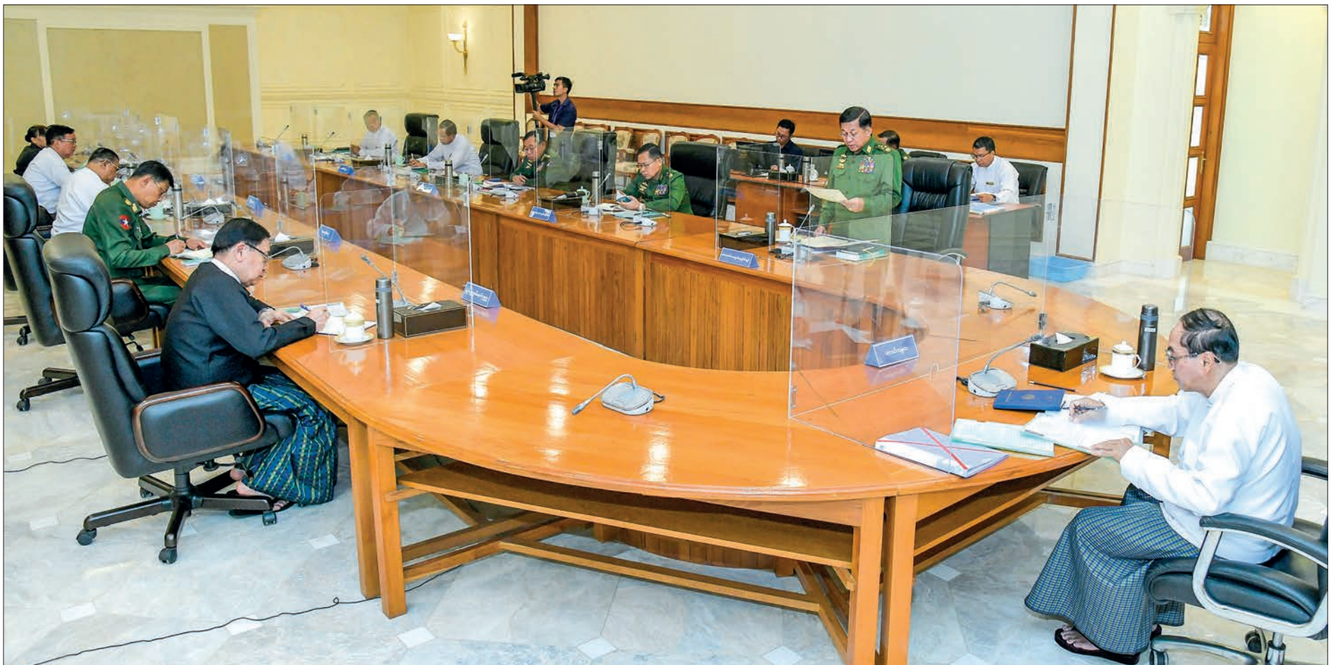
Commander-in-Chief of Defence Services Senior General Min Aung Hlaing puts forward wide-ranging clarifications to the meeting 1/2023 of the National Defence and Security Council of the Republic of the Union of Myanmar in Nay Pyi Taw on 31 January 2023.

T HE National Defence and Security Council of the Republic of the Union of Myanmar held a meeting 1/2023 at the meeting hall of the State Administration Council Chairman's Office in Nay Pyi Taw yesterday morning.