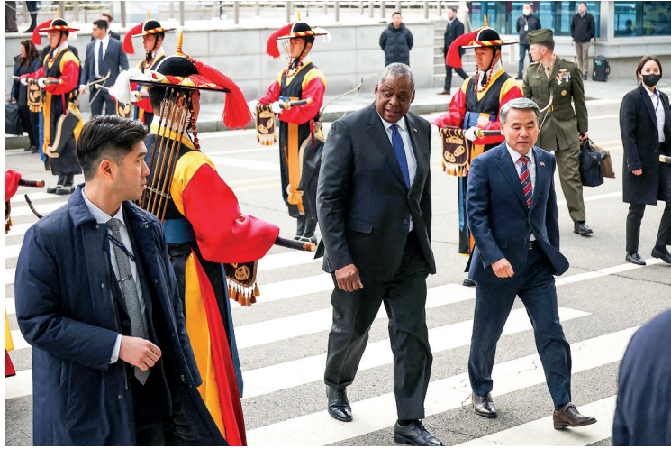
US Secretary of Defence Lloyd Austin (C) and his South Korean counterpart Lee Jong-sup (R) leave after a ceremonial welcome at the Defence Ministry in Seoul on 31 January 2023.