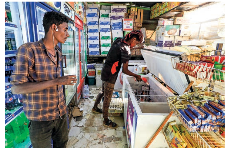
A customer chooses a food item at a grocery shop in the Sudanese capital Khartoum, on 19 January 2023. Sudan's spiralling economic crisis has forced many households to make fewer purchases amid a looming food crisis that left nearly one third of the 45-million-strong population facing acute hunger.

AS Sudan's economic crisis drags on, grocer Hassan Omar keeps busy cleaning packaged food items that have been gathering dust for months as his dwindling customer base make fewer purchases.