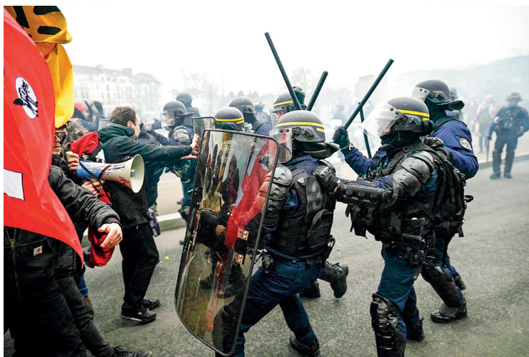
French CRS riot police brandish their batons in front of protesters as clashes erupt during a rally on a second day of nationwide strikes and protests over the government's proposed pension reform, in Nantes on 31 January 2023.

Some 11,000 police were mobilized, with 4,000 deployed in Paris where several hundred extremist troublemakers were expected, according to the interior ministry. — AFP