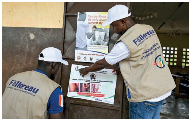
Doctors stick up posters during a leprosy screening campaign in village of Djougbossou, near Adzope, on 25 January 2023. Listed by the WHO as one of the 20 neglected tropical diseases (NTDs), leprosy is transmitted from a sick person to healthy person. The microbe multiplies very slowly, and the incubation period can last up to 5 years. The first symptoms show spots, then gradually eat away at desensitized limbs.

THE World Health Organization on Monday called for greater investment in combating neglected tropical diseases, which left more than 1.6 billion people, often in least-developed countries,