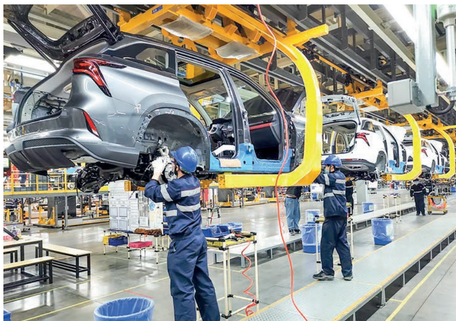
This photo taken with a mobile phone shows employees working on the production line at Hefei Changan Automobile Co, Ltd in Hefei, east China's Anhui Province, 17 February 2021.

But it is now showing signs of a rebound, with a key gauge of factory output rising this month and the International Monetary Fund (IMF) upgrading its 2023 growth forecast to 5.2 per cent. Pandemic prevention measures have "entered a new stage" that is allowing "a gradual return" to normal life, National Bureau of Statistics (NBS) statistician Zhao Qinghe said in a statement. He added that the official manufacturing