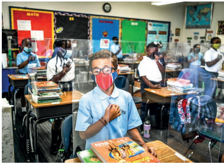
Student wear facemasks as they attend their first day in school after summer vacation at the St. Lawrence Catholic School in north of Miami, on 18 August 2021.

tagged backgrounds were disproportionately affected, as were those in poorer countries, according to the study in the journal Nature Human Behaviour .