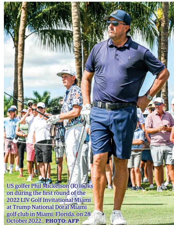
US golfer Phil Mickelson (R) looks on during the first round of the 2022 LIV Golf Invitational Miami at Trump National Doral Miami golf club in Miami, Florida, on 28 October 2022.

However in his remarks to Sports Illustrated, the veteran said he was now indifferent to playing on the circuit again. —AFP