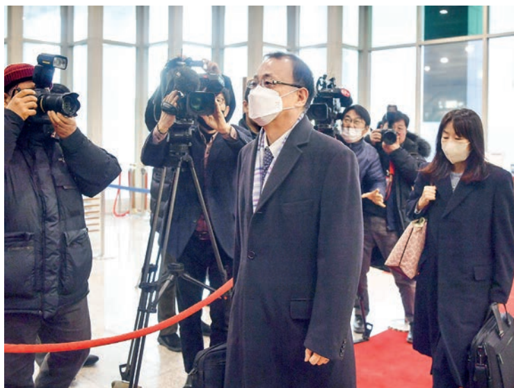
Takehiro Funakoshi, head of the Japanese Foreign Ministry's Asian and Oceanian Affairs Bureau, enters South Korea's Foreign Ministry in Seoul on 30 January 2023

In 2018, South Korea's Supreme Court ordered Japanese firms to pay compensation to South Korean plaintiffs over forced labour during wartime. The Japanese government strongly opposed the ruling, saying that all the issues stemming from the colonial era were "completely and finally settled" under a bilateral treaty signed in 1965.—Kyodo