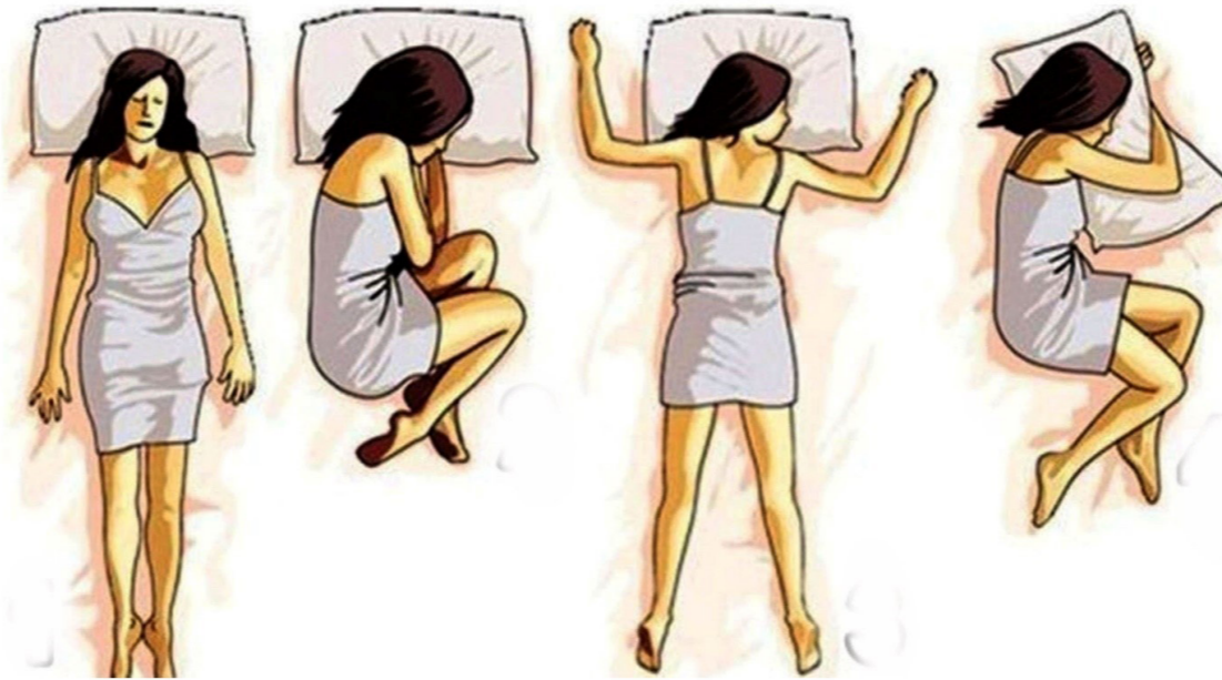
Tips and tricks (Jan 2023)

dren, we split our nights by sleeping in all positions equally, but by adulthood, a clear preference for side sleeping emerges. The flexibility of our spine decreases as we age, which may make the side sleeping position more comfortable for older adults