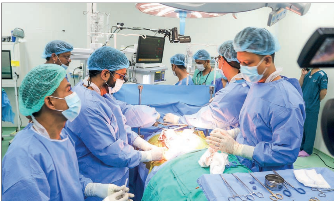
The second-day operation of the second liver transplant is underway yesterday.

The patients are now in the ICU under the care of specialists, paramedics and nurses. They are reportedly in good health. — MNA/KZW