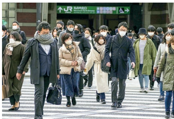
Commuters wearing face masks head to work in front of JR Tokyo Station in the centre of Tokyo on 28 December 2022, their last working day for the year, while health authorities remain on high alert over increasing COVID-19 cases.

JAPAN'S average job availability in 2022 improved for the first time in four years as economic and social activities revived with the easing of COVID-19 restrictions, government data showed Tuesday.