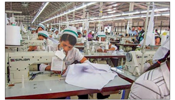
A garment factory is seen working on a CMP basis.

However, it will bring a lot of benefits for hoarders who aim for profits. A market analyst said that the fact that the price of goods rises due to demand, is actually because of the demand from wholesalers, rather than buying for consumption. — TWA/CT