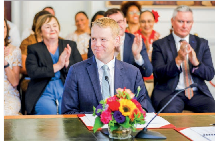
New Zealand Prime Minister Chris Hipkins is sworn in during a ceremony at Government House in Wellington on 25 January 2023.

Following the swearing in, Hipkins said he was "energized