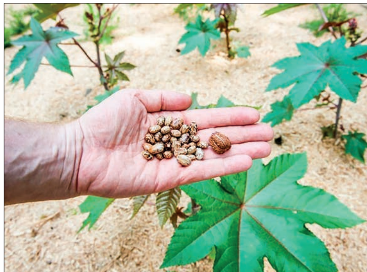
Seeds of the castor oil plant ( Ricinus communis ) which can be used to make the deadly poison ricin. PHOTO: DPA/AFP

No one was hurt by the poisonous contents of the letters. All White House mail goes through a suburban Washington processing facility, in part to screen for threats. —AFP