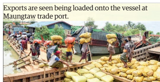
Exports are seen being loaded onto the vessel at Maungtaw trade port.

It is reported that the Maungtaw border trade post has been inviting the OSS departments, partner organizations, companies and entrepreneurs to hold a trade promotion meeting once a month, working together on trade matters.