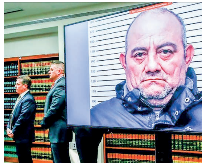
A picture of Colombian drug lord Dairo Antonio Usuga, aka Otoniel, is displayed on a screen as Eastern District of New York Attorney Breon Peace (out of frame) speaks during a press conference in New York City on 5 May 2022.

Usuga was the most wanted person in Colombia until he was arrested in October 2021 in the northwest of the country after a massive military operation. “With today’s guilty plea, the bloody reign of the most violent and significant Colombian narcotics trafficker since Pablo Escobar is over,” said Breon Peace, US Attorney for the Eastern District of New York.—AFP