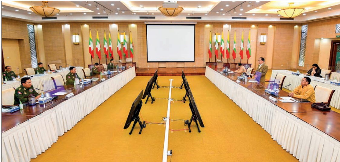
The third-day meeting of the State Peace Talks Team and the RCSS Chair-led peace delegation is in progress yesterday.

THE third-day meeting between the State Peace Talks Team and the peace delegation from the Restoration Council of Shan State (RCSS) was held yesterday morning at the National Solidarity and Peacemaking Centre in Nay Pyi Taw.