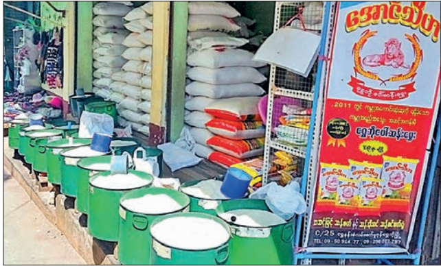
A retail rice shop is seen in the market.

LOW- and high-grade rice prices hiked up in the Yangon rice market in post-Chinese New Year, U Shwe Hla who runs a rice business in the Bayintnaung market told the GNLM.