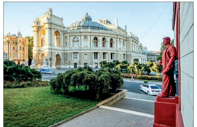
Wednesday's decision stressed 'the duty of all humanity to protect' Odessa's historic centre.

"While the war continues, this inscription embodies our collective determination to ensure that this city, which has always