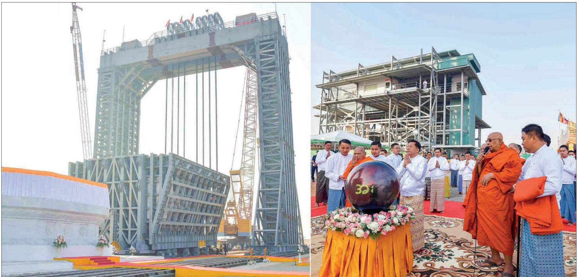
The gala ceremony to convey the Maravijaya Buddha Image onto the jewelled throne is reverently graced and attended by Bhamo Sayadaw Dr Bhaddanta Kumara Bhivamsa, Sitagu Sayadaw Dr Bhaddanta Nyanissara, SAC Chair PM Senior General Min Aung Hlaing and dignitaries yesterday in Nay Pyi Taw.

A gala ceremony to convey the Maravijaya Buddha image being carved for public obeisance in Buddha Park onto a jewelled throne took place in the precinct of Buddha Park in Dekkhinathiri Township of Nay Pyi Taw Union Territory yesterday morning.