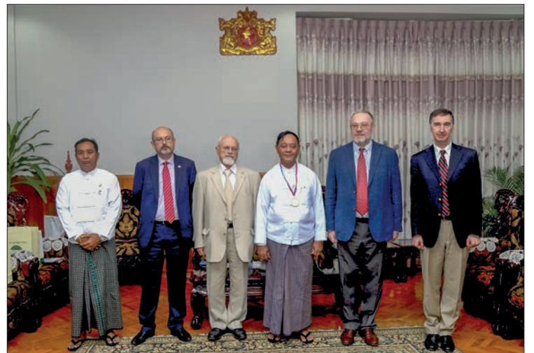
The documentary group photo of the meeting.

The people are urged to receive vaccination of Covid-19 without fail as full-time vaccination of Covid-19 and receiving booster shots can effectively mitigate infection of the virus, severe suffering from the disease and increasing of death rate based on the disease.