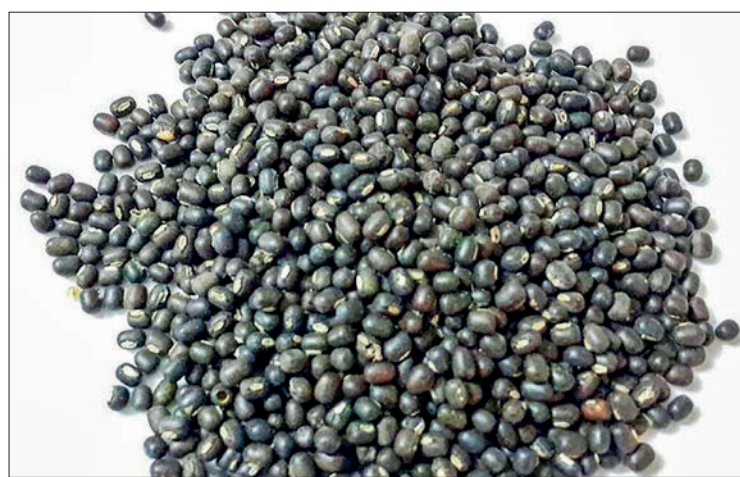
The price of black gram bounced back to above K1.7 million per tonne on 26 January after the market was stagnant at K1.657 million per tonne between 18 and 23 January 2023.

black gram, green gram and pigeon peas. Of them, black gram and pigeon peas are mainly sent to India while green grams are shipped to China and Europe.