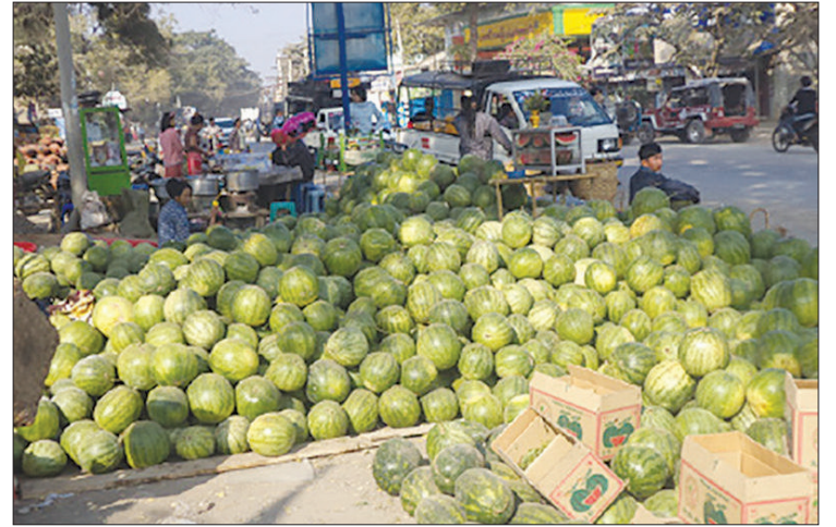
At present, Myanmar daily delivers rice, broken rice, rubber, various beans and pulses, fishery products, chilli pepper and other food commodities to China through Kyinsankyawt.

On 8 July 2021, the two-remaining cross-border posts Kyinsankyawt and Panseng were suspended. As a result of this, the border trade between Myanmar and China was completely halted.