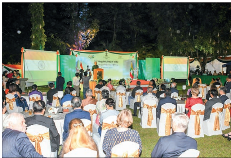
The 74 th National Day of the Republic of India is in progress in Yangon yesterday.

THE reception ceremony to commemorate the 74 th National Day of the Republic of India was held at the Indian ambassador's residence on Diplomatic Road, Dagon Township, Yangon Region, yesterday evening.