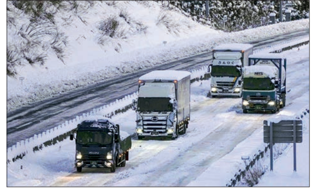
Trucks are seen moving on Shin-Meishin Expressway in Mie Prefecture on 26 January 2023.

The snow reached to just below the knees, he said, adding that he and the drivers of trucks in front and behind his car spent time chatting to encourage each other. —Kyodo