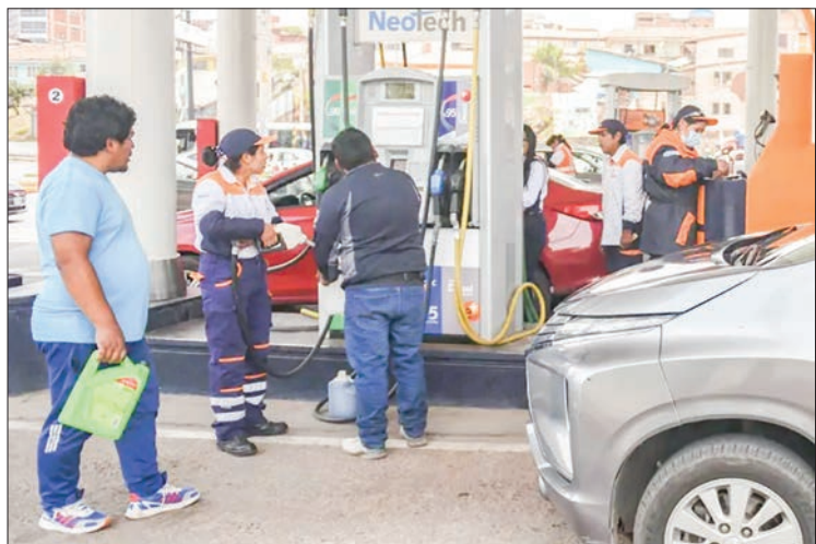
Man fills a bottle with fuel at a gas station, after shortages due to the ongoing protests against the government of Peruvian President Dina Boluarte in Arequipa, Peru on 25 January 2023.

SHORTAGES in Peru of basic products, including increasingly expensive fuel and food, mount further Wednesday, as the president remained defiant in the face of relentless protests.