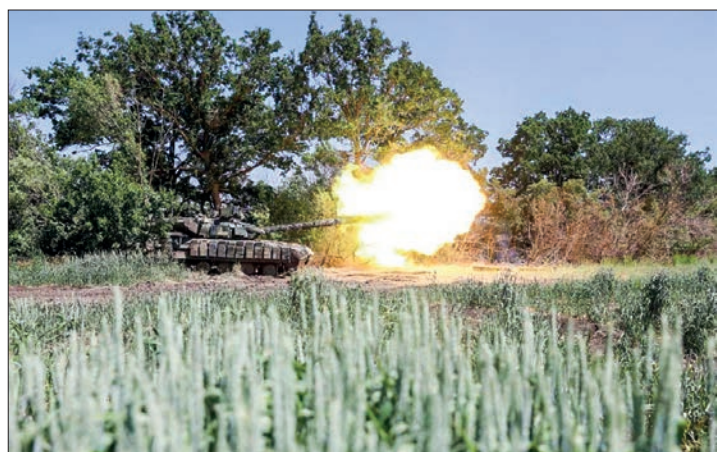
Ukrainian tankers fire at frontline positions near the town Soledar, Donetsk region on 10 June 2022.

Compared to the rest of the industrial Donetsk region — whose capture Russia has made its military priority — Soledar has seen some of "the worst fighting" over recent days, Igor said.—AFP