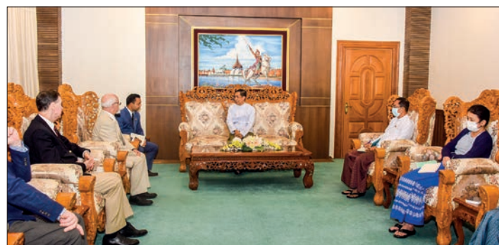
Union Minister U Ko Ko Hlaing receives the Senior Vice-President of the Russia-Myanmar Association for Friendship and Cooperation yesterday.

Also present at the meeting were senior officials from the Ministry of International Cooperation and representatives from the Russia-Myanmar Association for Friendship and Cooperation.