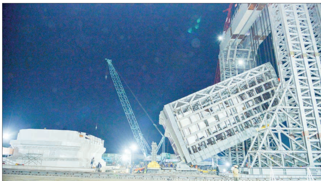
Conveying the Maravijaya Buddha Image onto the jewelled throne is seen at midnight on 26 January 2023.