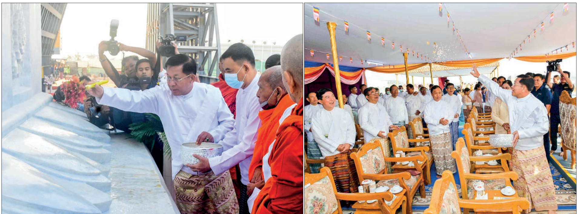
The Senior General and Sayadaws sprinkle scented water on the jewelled throne at the event.