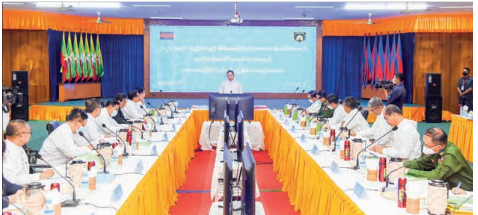
State Administration Council Vice-Chairman Deputy Prime Minister Vice-Senior General Soe Win addresses the first coordination meeting of the Central Census Commission in Nay Pyi Taw on 20 January 2023.

Additional data uses include allocation of national resources; budget; the review of administrative boundaries; the positioning of social infrastructures such as schools, health facilities and roads; and research. The census is also