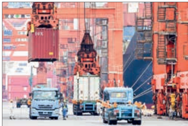
Containers are loaded onto trucks from an international freighter at Tokyo port.

The value of imports jumped 39.2 per cent to a record 118.16 trillion yen, led by crude oil, coal and liquefied natural gas, while exports grew 18.2 per cent to 98.19 trillion yen, also