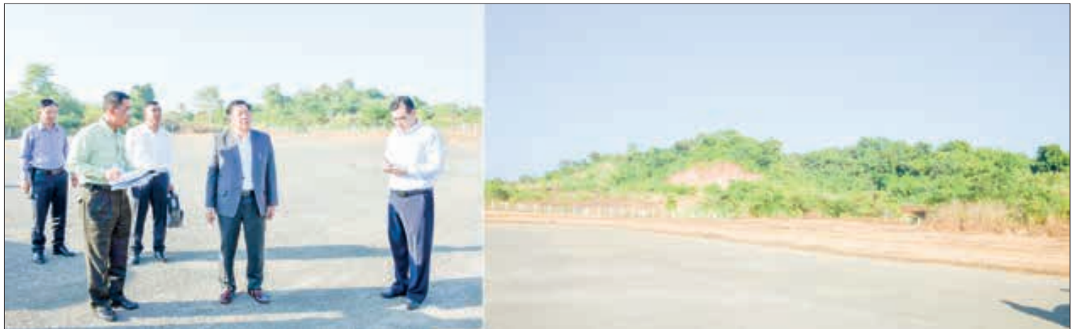
The Senior General inspects the expansion of the runway at Thandwe Airport.

The Senior General discussed that those from the tourism industry and aviation services need to coordinate the running of flights. The government pledged to upgrade the Ngapali airport to be an inter-