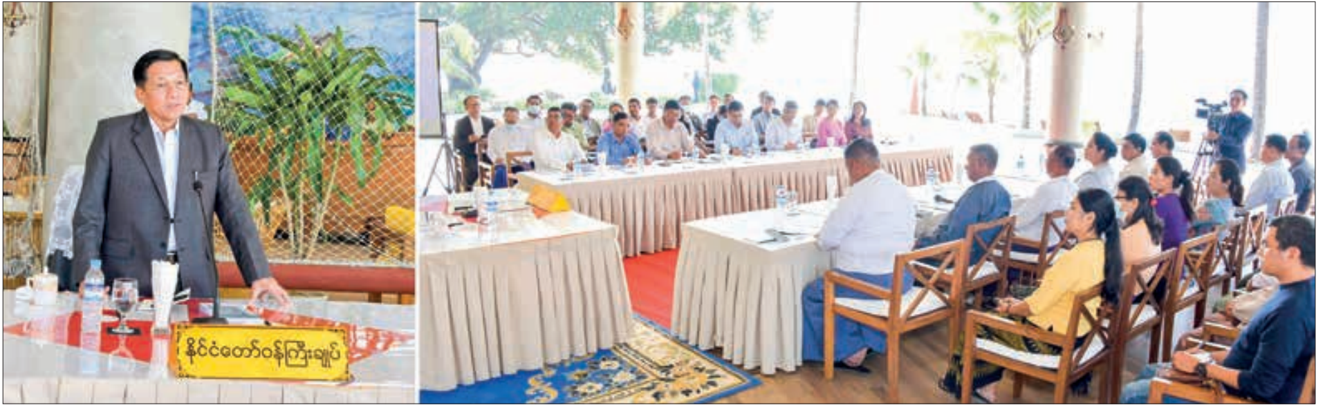
State Administration Council Chairman Prime Minister Senior General Min Aung Hlaing meets business people of the hotels and tourism sector in Thandwe, Rakhine State yesterday.

THE government will adopt necessary policy and provide assistance to all as much as possible, said Chairman of the State Administration Council Prime Minister Senior General Min Aung Hlaing at a meeting with hotels and tourism entrepreneurs at Pristine Mermaid Resort in Thandwe of Rakhine State yesterday afternoon.