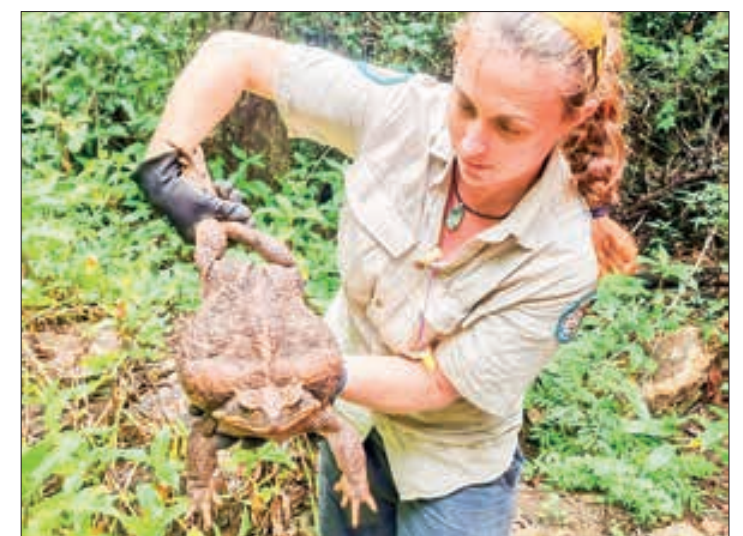
A park ranger holds a cane toad weighing 2.7 kilogrammes discovered in Conway National Park in Australia’s state of Queensland.

Describing it as a “monster”, the department said it could end up in the Queensland Museum.—AFP