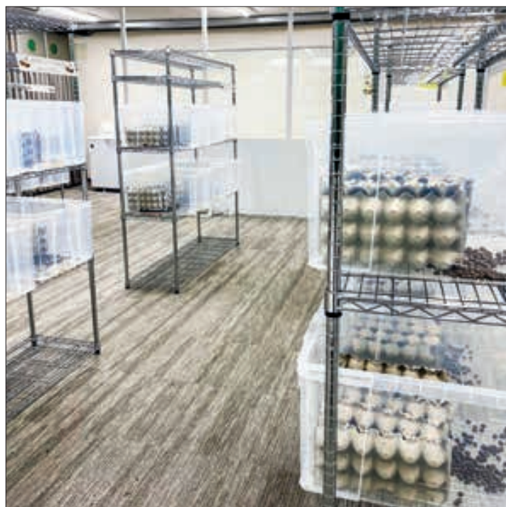
Photo taken in Chofu, western Tokyo, in January 2023 shows a cricket breeding facility set up by Nippon Telegraph and Telephone East Corp in collaboration with Gryllus Inc.

The project will utilize technologies aimed at reducing the need for manual operations, such as sensors that will optimize temperature and humidity to provide suitable conditions for the crickets to grow and AI screens that will monitor their health and check for abnormalities.—Kyodo