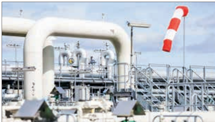
Russia has drastically reduced gas supplies to Europe in recent months.

The Ukraine conflict highlighted Europe's dependence on