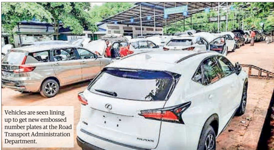
Vehicles are seen lining up to get new embossed number plates at the Road Transport Administration Department.

RTAD added that new licence plates with descriptions representing different townships and car brands have been installed on all kinds of vehicles starting on 1 July 2021. — TWA/KZW