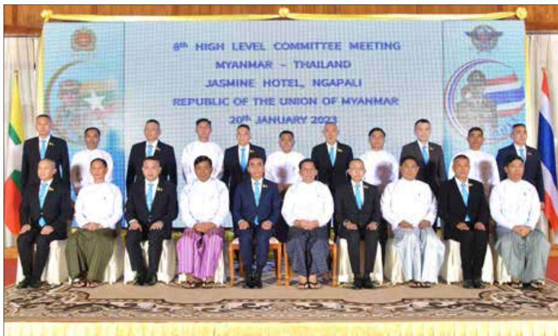
The Senior General and the Thai General take the documentary group photo at the meeting.

The Thai General, Joint Chairman of the meeting, delivered an opening speech. He expressed thanks to the Myanmar Tatmadaw for its warm welcome to himself and his delegation. Although joint meetings could not be held in the