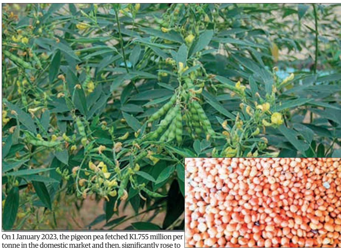
On 1 January 2023, the pigeon pea fetched K1.755 million per tonne in the domestic market and then, significantly rose to K1.81 million per tonne on 19 January 2023.