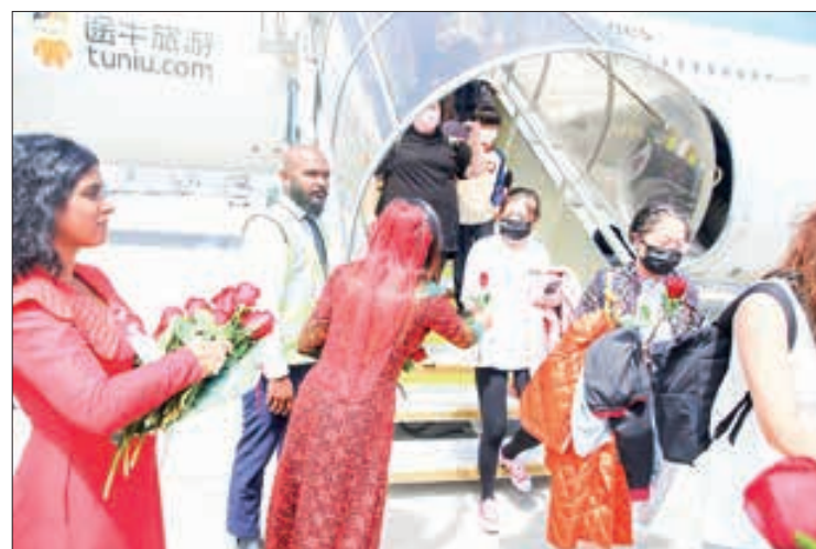
Arriving Chinese tourists are welcomed at the Velana International Airport in the Maldives on 18 January 2023.

Maldives, the return of Chinese tourists will help economic recovery of the Maldives following the pandemic, and is also conducive to promoting cultural and people-to-people exchanges and enhancing bilateral ties, Wang said at the welcoming ceremony. Wang said the Chinese embassy welcomes Chinese tourists to the Maldives, hoping that they will come happily, have fun and return safely. Mausoom told Xinhua at the ceremony that the