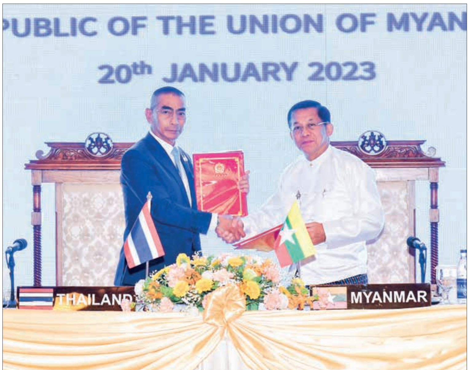
State Administration Council Chairman Commander-in-Chief of Defence Services Senior General Min Aung Hlaing and Chief of the Defence Forces of the Royal Thai Armed Forces General Chalermphon Srisawasdi sign and exchange the approval for agreements of the meeting in Thandwe of Rakhine State on 20 January 2023.