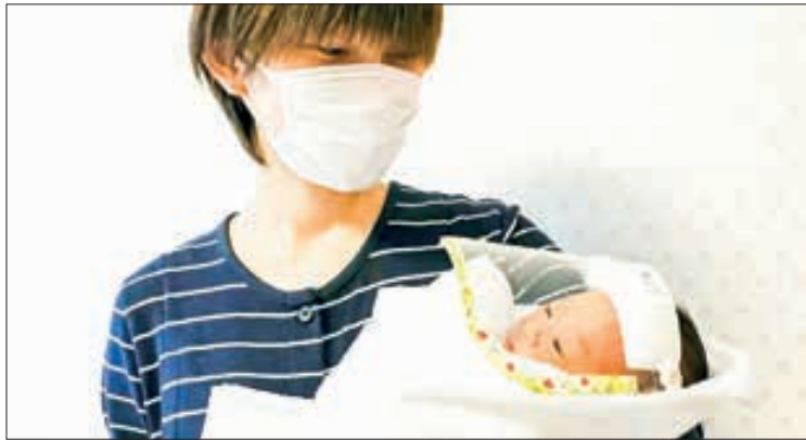
Annual births in Japan are likely to have fallen below 800,000 for the first time last year. A newborn baby in Tokyo wearing a face shield.