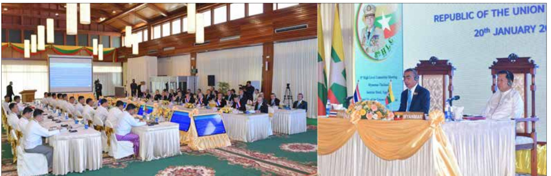
The Eighth High-Level Committee Meeting between Myanmar and Thai armed forces is in progress in Thandwe, Rakhine State yesterday.