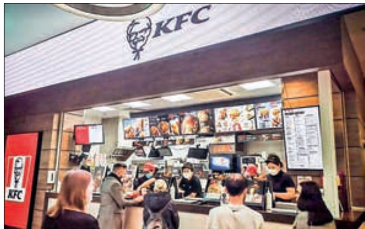
Customers stand in front of a US Kentucky Fried Chicken (KFC) fast food kiosk in Evroreisky (European) shopping mall in Moscow on 7 March 2022.

The study, which was published last month by the online Social Science Research Network (SSRN) — a publisher of "pre-print" studies not subjected to scientific peer-review — showed that only less than 10 per cent of EU and G7 companies with Russian subsidiaries had divested them.—AFP