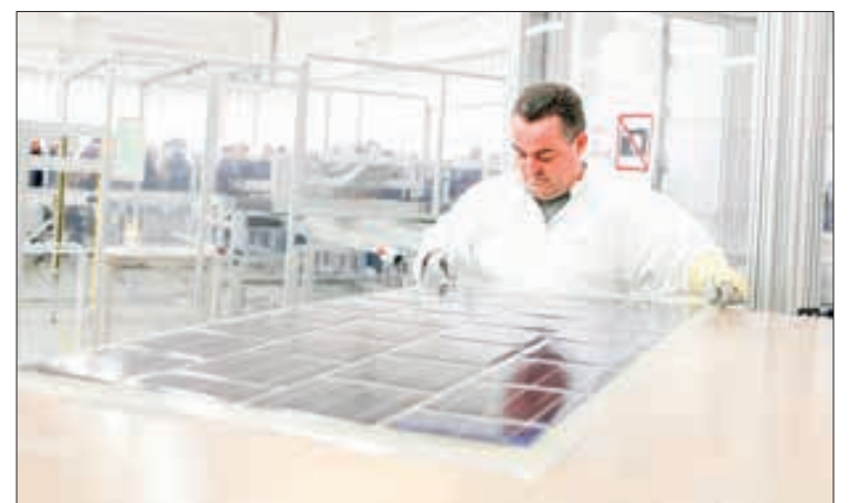
Several critical raw materials such as indium are needed to produce photovoltaic panels. The EU will need more critical raw materials such as lithium and cobalt to manufacture batteries and electric engines.

Singling out areas "as varied as batteries, hydrogen, semiconductors and raw materials", Von der Leyen said the time had come "to take these efforts to the next level to increase Europe's strategic autonomy".