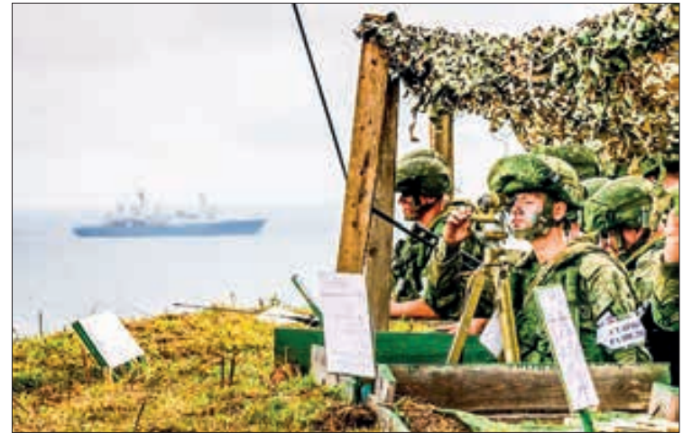
Russian soldiers on a military drill. More than 350 South African army personnel will take part in drills alongside their Russian and Chinese counterparts next month.

The first was held in November 2019 off Cape Town.