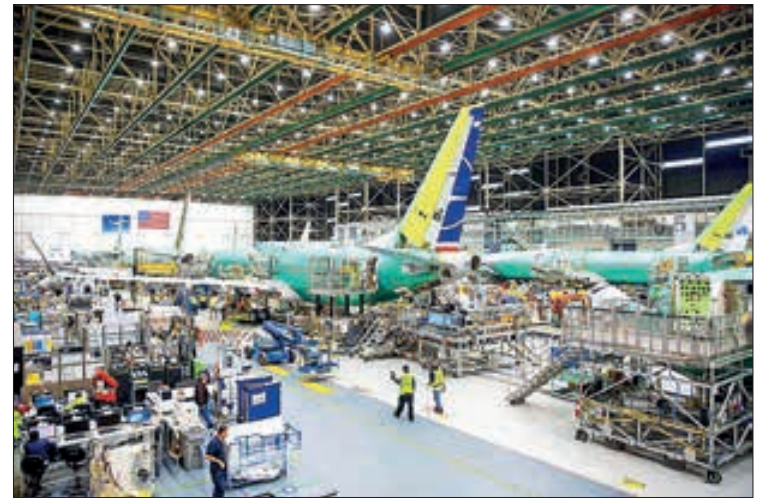
Employees work on Boeing 737 MAX aircraft at the Boeing Renton Factory in Renton, Washington, on 27 March 2019.

The agency plans to complete SFD testing by the late 2020s so the technologies and design can be applied to the next generation of single-aisle aircraft.—AFP