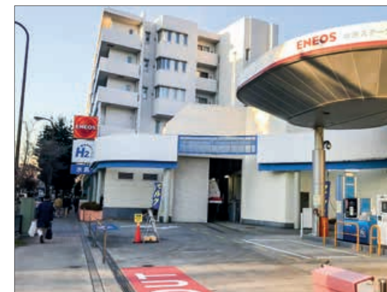
Few customers are seen at the H2 station in Tokyo so far.

Phase 3: Establishment of a total CO2-free hydrogen supply system (to be realized around 2040).