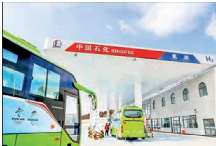
Hydrogen-fuelled vehicles used during the Beijing 2022 Winter Olympics await refuelling at stations in Beijing’s Yanqing district in January.

In 2021, the railway and waterway freight volume accounted for 24.56 per cent of the total in China, an increase of 3.85 percentage points over 2012,