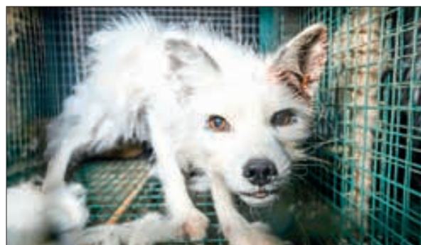
The footage reveals the conditions in which the foxes live, trapped inside small, wire mesh cages.

"Fur farming should have been banned in Finland by now and I think it is shameful that this has not yet been done", Left Alliance MP Mai Kivela told AFP. —AFP