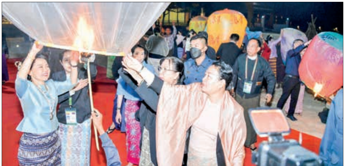
The wife of the Senior General and the wife of the Thai General are pictured releasing the hot air balloon at the dinner.

Before and during the dinner, vocalists and artistes from the Myawady entertainment troupe under the Directorate of Public Relations and Psychological Warfare the Fine Arts Department and the Myanmar Radio and Television together