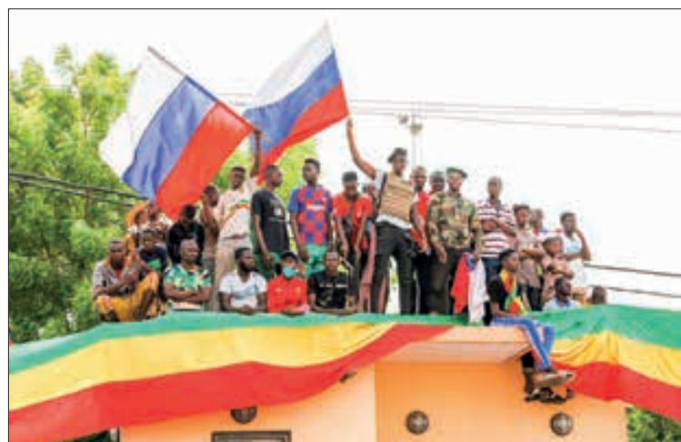
Mali has turned away from colonial power France, in favour of Russia.