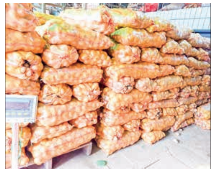
The picture shows a pile of potato bags entering the Bayintnaung wholesale hub.

The market observers shared their opinions that efforts need to expand potato and garlic acreages as there is strong market competition with Chinese potatoes and garlic. — TWA/EMM