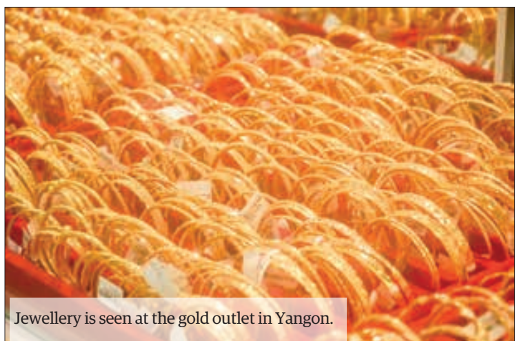
Jewellery is seen at the gold outlet in Yangon.

With an aim at reducing gold prices, the YGEA and Mandalay Region Gold Entrepreneurs Association sold gold bullion supplied by the executive members and the members as well. — NN/EMM