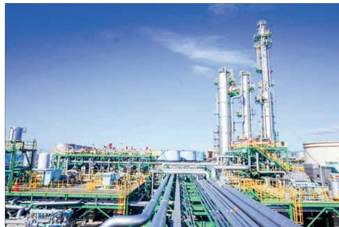
CCS (carbon dioxide capture and storage) demonstration experiment started in Tomakomai City, Hokkaido in 2012 agency for Natural Resources and Energy

The extracted hydrogen must be stored underground until it is transported to the user. There are not many suitable places on earth where carbon dioxide capture and storage (CCS) is possible, and it must be a stratum with an appropriate storage tank and cap and no faults. Currently, there are nearly 40 in North America, Northern Europe, East Asia, and Australia (please see the map).