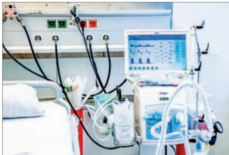
Without reliable electricity in all healthcare facilities, Universal Health Coverage cannot be reached, the report notes, according to a WHO press statement.

Access to electricity is critical for quality healthcare provision, from delivering babies to managing emergencies like heart attacks, or offering lifesaving immunization.