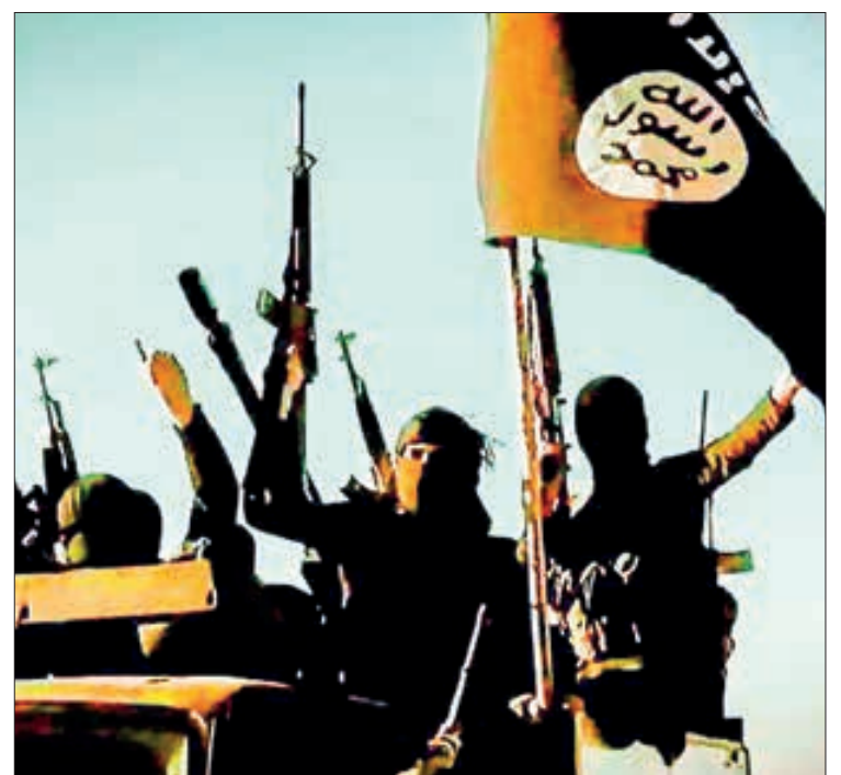
The surge of violence in Iraq spares no one and no place.