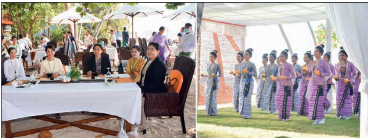
The delegation led by wife of the Chief of the Defence Forces of the Royal Thai Armed Forces enjoy Rakhine's traditional dance and songs at the Amazing Ngapali Resort yesterday.

The wife of the Thai General and party yesterday morning offered oil lights, flowers, water and fruits to Shweandaw Pagoda and donated cash to the all-round renovation of the pagoda through members of the pagoda board of trustees. They then paid homage to Shwenandaw