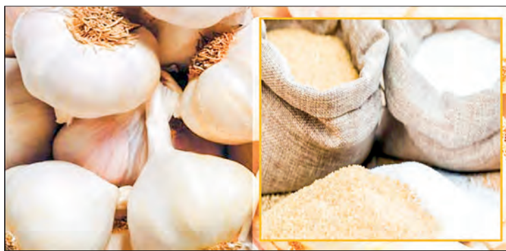
Pictures show Kyukok garlic, brown sugar and white sugar on sale in the market.

The domestic sugar market relies on a small number of sugar mills and the storage of new sugar has increased among hoarders. The reason for the increasing sugar price at the time of the mill running is the low number of sugar mills and the exportation of sugar to external markets. — TWA/CT