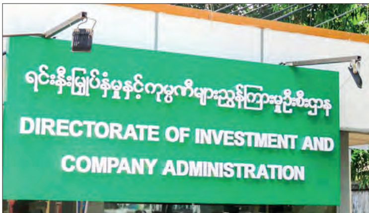
The Directorate of Investment and Company Administration.

NOMINAL directors and shareholders will not be allowed, according to the notification released by the Directorate of Investment and Company Administration (DICA) dated 17 January 2023.