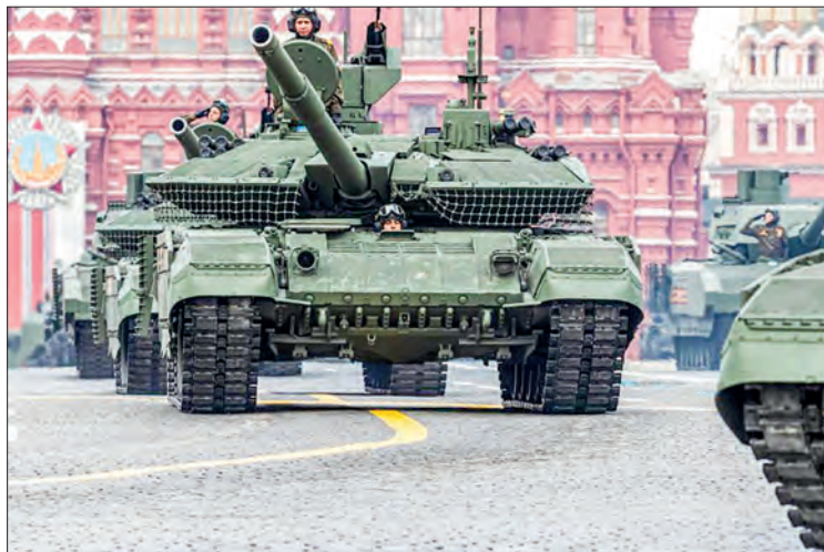
T-90M tanks are seen during the Victory Day military parade to mark the 77th anniversary of the victory in the Great Patriotic War on Red Square in Moscow, Russia, 9 May 2022.

RUSSIAN President Vladimir Putin said Wednesday he had "no doubt" Moscow would emerge victorious in Ukraine, despite military setbacks in the nearly year-long offensive.