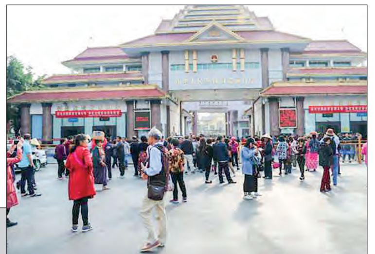
Myanmar returnees are pictured on the Sino-Myanmar border.

Although Myanmar people who returned from China are being accepted, those who are going to China from Myanmar are not allowed to enter it at present. — TWA/MKKS