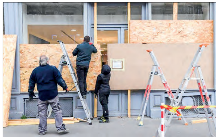
Workers board up the windows of an insurance branch located on the route of a demonstration, on the eve of nationwide strikes and protests against a pension reform plan.

Many parents will have to look after their children as 70 per cent of primary school teachers