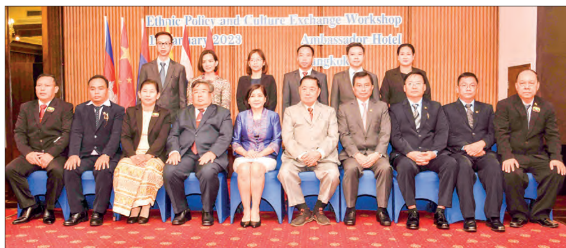
Union Minister U Saw Tun Aung Myint poses for the documentary group photo at the event in Bangkok yesterday.