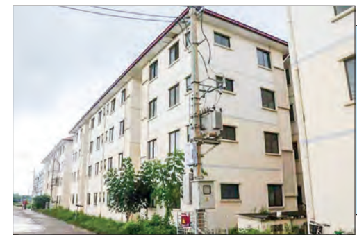
Apartment units of Aung Myint Mo housing in Dagon Myothit (South) Township.

MORE than 200 apartment units of Aung Myint Mo and Thilawa low-cost housing complexes developed in the Yangon Region will be sold, according to the Ministry of Construction.