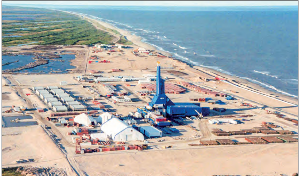
The Sakhalin-1 oil and gas development project is located off the coast of Sakhalin Island in the Russian Far East. It comprises three offshore fields namely Chayvo, Odoptu, and Arkutun-Dagi.

But imports of Russian liquefied natural gas (LNG) were up more than four per cent in 2022. Sakhalin-1 produces oil, while Sakhalin-2 produces both crude and LNG, and experts say access to Russian gas is what Japan is most concerned about protecting. Last year, 9.5 per cent of Japan's total LNG imports came from Russia, up from 8.8 per cent in 2021 — most of it from Sakhalin-2.—AFP