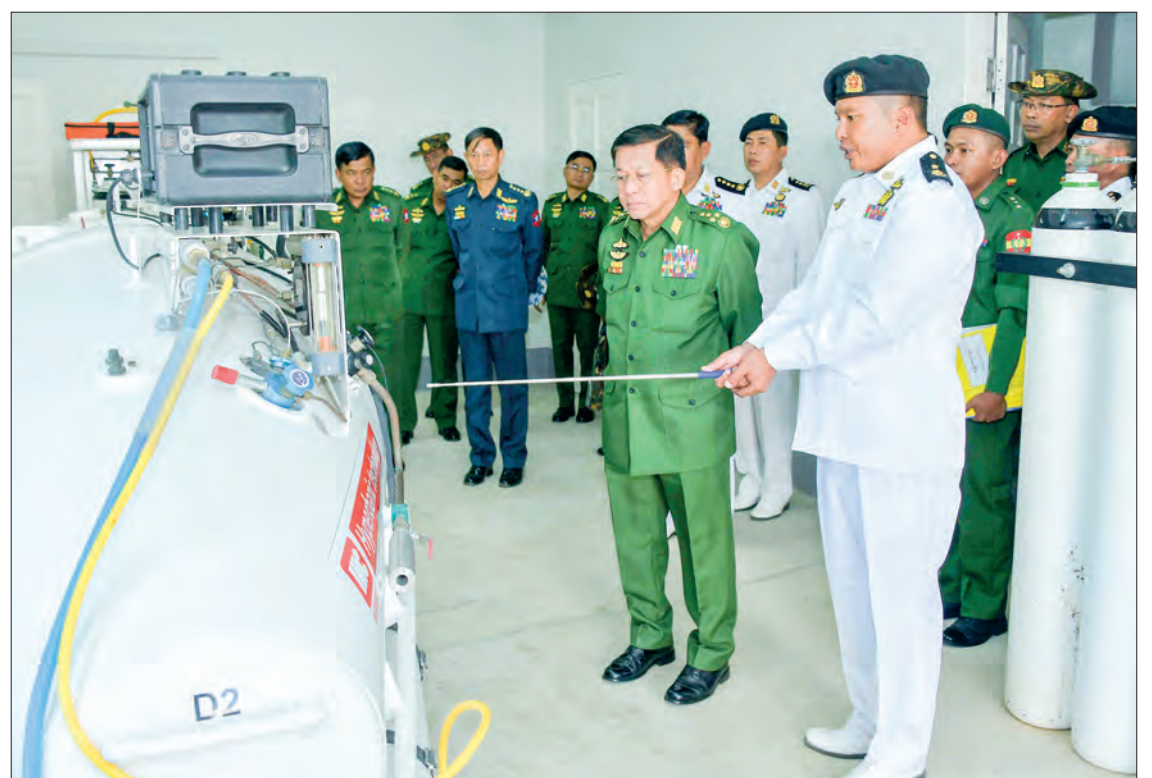
The Senior General views the 10-Man Hyperbaric Medical Treatment Chamber.

In the training pool of the depot, the Senior General and party viewed the training session of members of the Tatmadaw (Navy) in the 10-metre tower jumping, the 50-metre-long swimming in tying hands and legs after jumping from five metres high position, freestyle swimming underwater, and off and on the training of oxygen cylinder. They then viewed round various items of equipment and arms used in training, salvage and security measures of the Tatmadaw (Navy), life security on