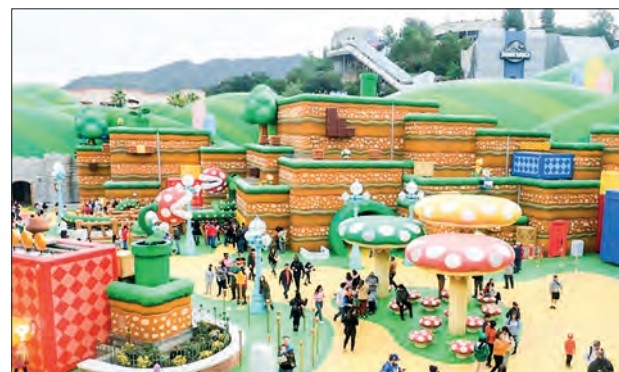
Guests explore Super Nintendo World at Universal Studios in Los Angeles during a preview on 13 January 2023.

But with the video game industry now eclipsing movies in size, and theme parks using increasingly interactive technology to immerse guests, bosses of the two companies have joined