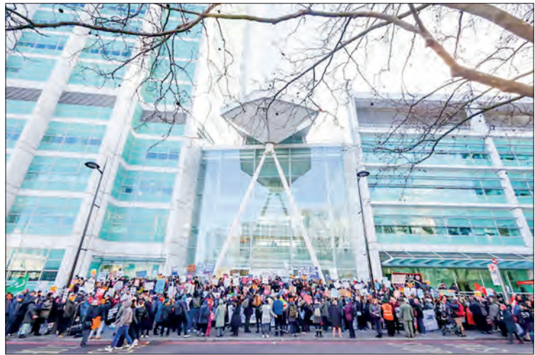
Thousands of nurses in Britain walked out Wednesday in a new protest over pay, with no end in sight to a wave of strikes that has piled pressure on the UK's overburdened public health system. People take part in a protest march organized by Doctors Association UK.

NURSES across England began two days of strikes over pay on Wednesday, threatening fresh disruption for patients in the creaking state-run health service, as new figures showed inflation still surging.