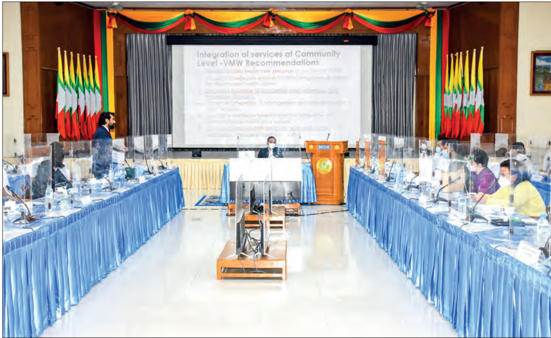
The Malaria GFATM Country Dialogue (Myanmar) workshop is in progress in Nay Pyi Taw yesterday.

THE Malaria GFATM Country Dialogue (Myanmar) Workshop for RAI4E funding proposal for malaria prevention and control