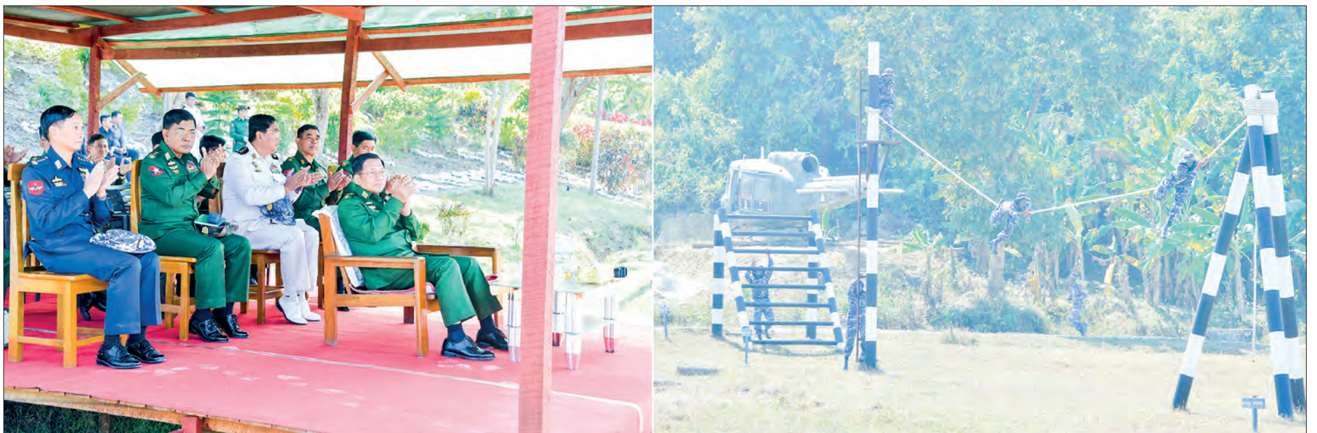
State Administration Council Chairman Commander-in-Chief of Defence Services Senior General Min Aung Hlaing watches the training session of the Naval Central Diving and Salvage Depot in Rakhine State yesterday.