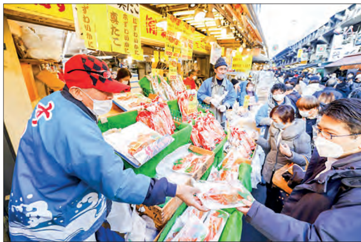
People shop on the Ameyoko street in Tokyo's Ueno area on 30 December 2022 ahead of New Year's Day.

The Bank of Japan is guiding the benchmark yield to around