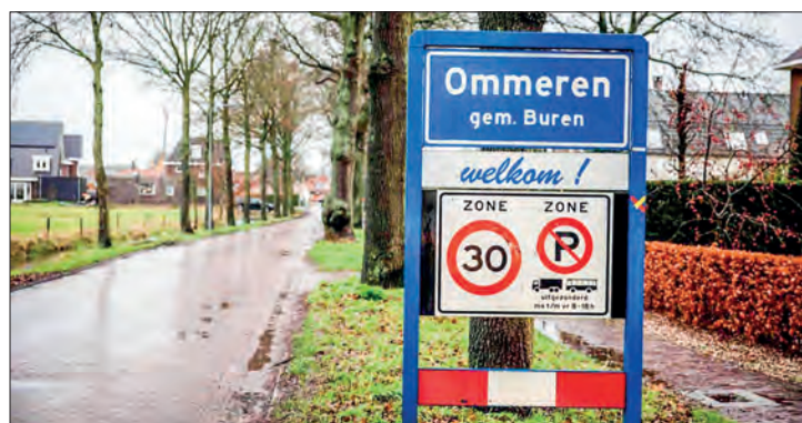
A road sign at the entrance of Ommeren, Netherlands on 14 January 2022. An old map, believed to mark the spot where German soldiers hid the treasure worth millions of euros during World War II has been made public by the Dutch National archives.

A few steps from his home there are muddy holes from the excavations, along a tree-lined path and a shallow ditch consistent with the drawings on the map. So many people armed with metal detectors have flocked to the quiet village in recent days that the local municipality brought in a ban, and police began to move on treasure hunters as soon as they arrived.—AFP