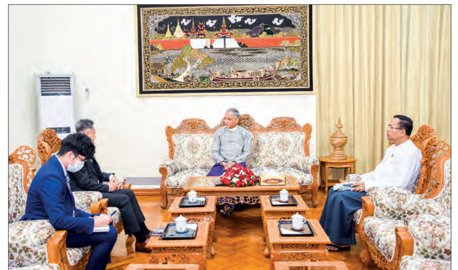
Union Minister U Aung Naing Oo receives the Thai ambassador-led delegation in Nay Pyi Taw yesterday.

UNION Minister for Commerce U Aung Naing Oo received Thai Ambassador Mr Mongkol Visitstump and the delegation at the ministry yesterday.