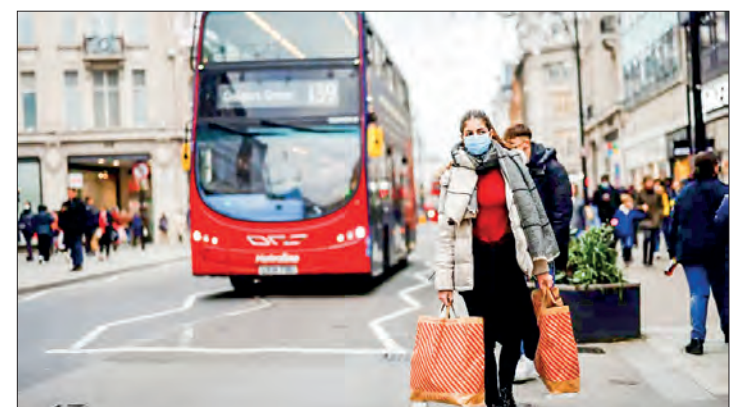
Consumer inflation reached 11.1 per cent in October, the highest level since 1980. Shoppers walking along Oxford Street in London on 21 December 2021. PHOTO: TOLGA AKMEN /AFP

While some striking workers have managed to agree new pay deals, tens of thousands of workers across the private and public sectors continue to stage walkouts.—AFP