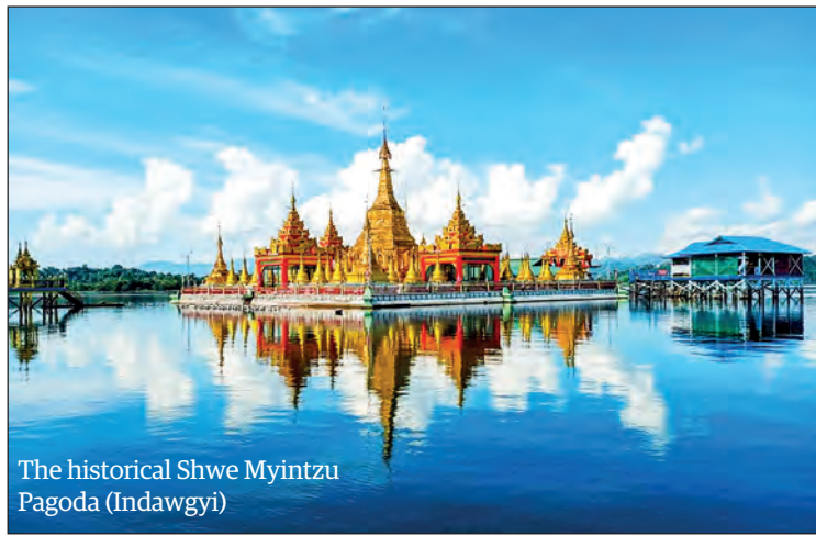
The historical Shwe Myintzu Pagoda (Indawgyi)