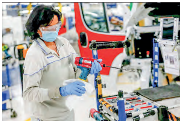
An employee resuming work at the SEVEL (European Light Vehicle Company) car factory in Atessa, south of Pescara, Italy.

But the auto association, known by its French abbreviation ACEA, said sales had picked up in most countries during the final months of the year, with December registrations up 12.8 per cent overall from the year earlier.—AFP