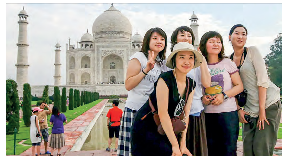
Tourists pose at the Taj Mahal. The Taj Mahal is an Islamic ivory-white marble mausoleum on the right bank of the river Yamuna in the Indian city of Agra. The Taj Mahal attracts from seven to eight million visitors annually, with more than 0.8 million from overseas.