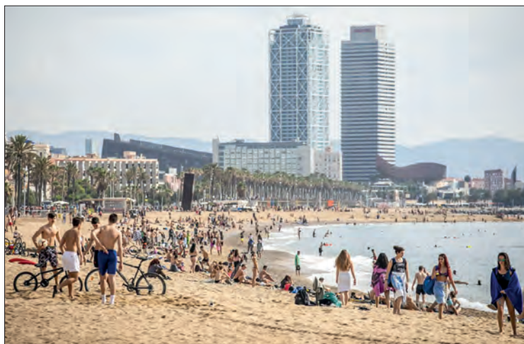
People enjoy a morning out at La Barceloneta Beach in Barcelona on 24 May, as the country slowly loosens a strict coronavirus lockdown. This is by far the most popular beach in Barcelona, and with it being the city's main stretch of coastline.

Although the figures showed the tourism sector accounted for 12.2 per cent of the Spanish economy last year, it remained slightly lower than the 12.6 per cent registered in 2019. "In contrast to the many predictions to the contrary, which were proved