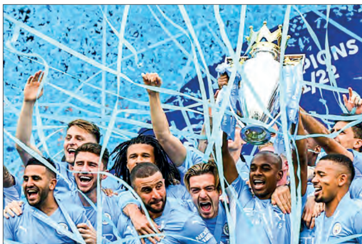
Manchester City topped Deloitte's Football Money League for revenue in the 2021/22 season.

A 13 per cent rise in City's revenue to 731 million euros saw