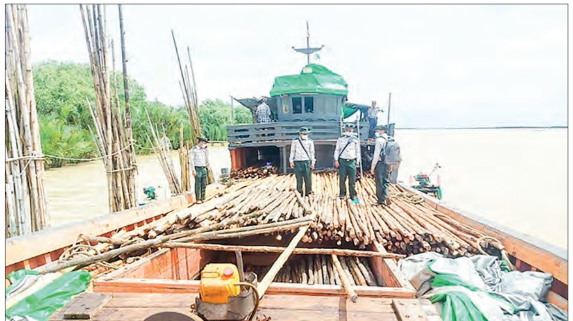
The picture shows the seizure of 4,150 illegal of mangrove logs (approximated value of K830,000) in Pyapon Township, Ayeyawady Region.

All kinds of timber, food products, mobile phone handsets, marine industry equipment, crude oil, chemicals, motorcars, motorcycles, fabric rolls, fish farm equipment, heavy machinery spare parts, household electrical appliances, gaming heavy machinery, marble slabs, fuel oil and consumer goods are being arrested almost every day. — TWA/CT