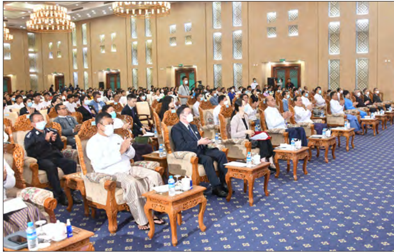
Union Minister U Ko Ko and dignitaries view the performance at the event in Nay Pyi Taw yesterday.

First, Union Minister U Ko Ko said the main objectives of MLC are promoting social and economic development in the Mekong sub-region, narrowing the development gap, supporting ASEAN Community building, implementing the 2030 Agenda for Sustainable Development of UN and promoting South-South Cooperation among the developing