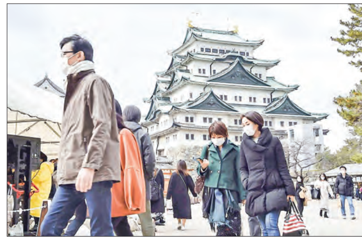
Foreign visitors wearing face masks visit Nagoya Castle in central Japan.

THE number of foreign visitors to Japan in 2022 sharply recovered and grew 15-fold from the previous year to 3.83 million after the easing of border controls imposed to counter the coronavirus pandemic, government data showed Wednesday.