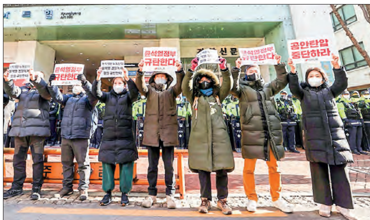
Labour group members hold placards reading "We condemn the Yoon Suk-yeol government" in front of the headquarters of the Korean Confederation of Trade Unions (KCTU) in Seoul on 18 January 2023, as South Korea's spy agency and police raid the country's main labour union group over alleged pro-Pyongyang activities.

Officials from the National Intelligence Service and the police raided the office of the Korean Confederation of Trade Unions in central Seoul, saying some of its members were suspected of having "ties with North Korea", the spy agency said.—AFP