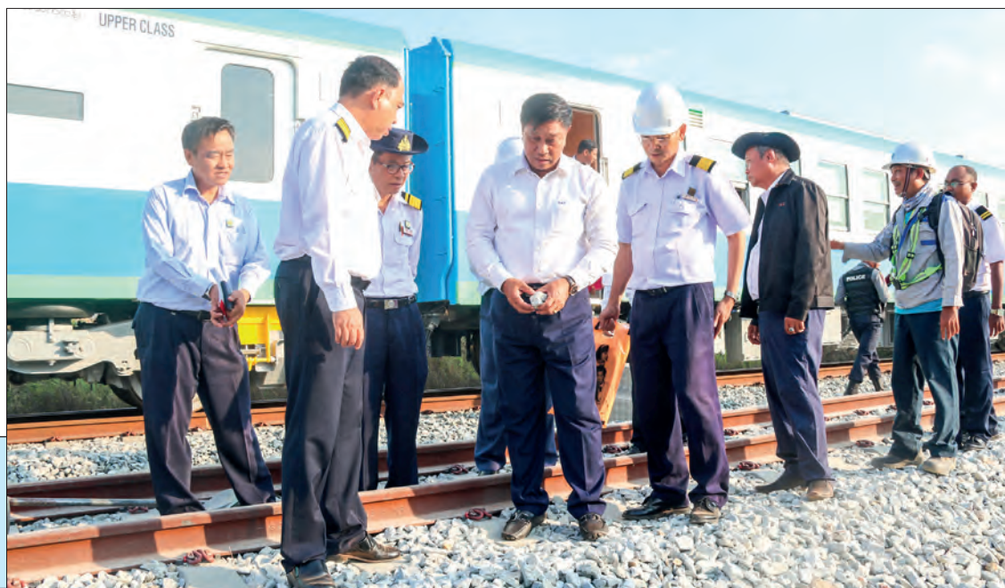
Union Minister Admiral Tin Aung San inspects the railway upgrading work yesterday.

The Union minister and party also inspected the construction of the platform at Pyuntaza station. Then, they inspected the completion of construction of the railway within 30 miles long section between Pyuntaza and Phayagyi and the construction site of bridge No 116-B. — MNA/KZW