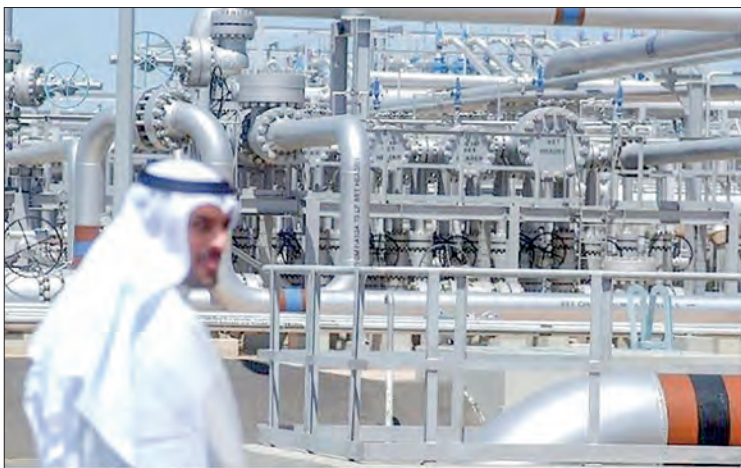
Saudi Arabia's economy remains hugely dependent on oil exports, despite attempts at diversification. PHOTO: AFP

Saudi Arabia is hoping to build on momentum from the high-profile visit by Chinese President Xi Jinping to Riyadh last month, where deals worth billions of dollars were signed in areas including energy and infrastructure.—AFP