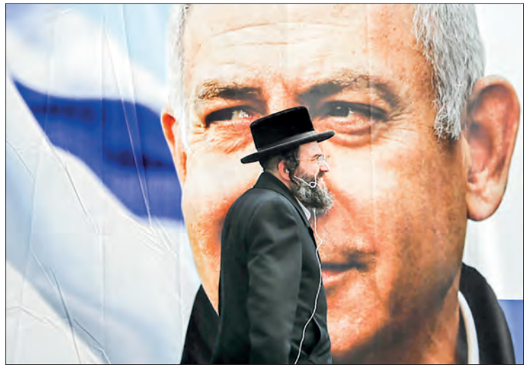
Benjamin Netanyahu returned to power as prime minister last month at the head of a coalition with extreme-right and ultra-Orthodox Jewish parties following Israel's 1 November election.

ISRAEL'S top court ruled Wednesday that a senior member of premier Benjamin Netanyahu's newly formed government cannot serve as minister due to a recent tax evasion conviction.