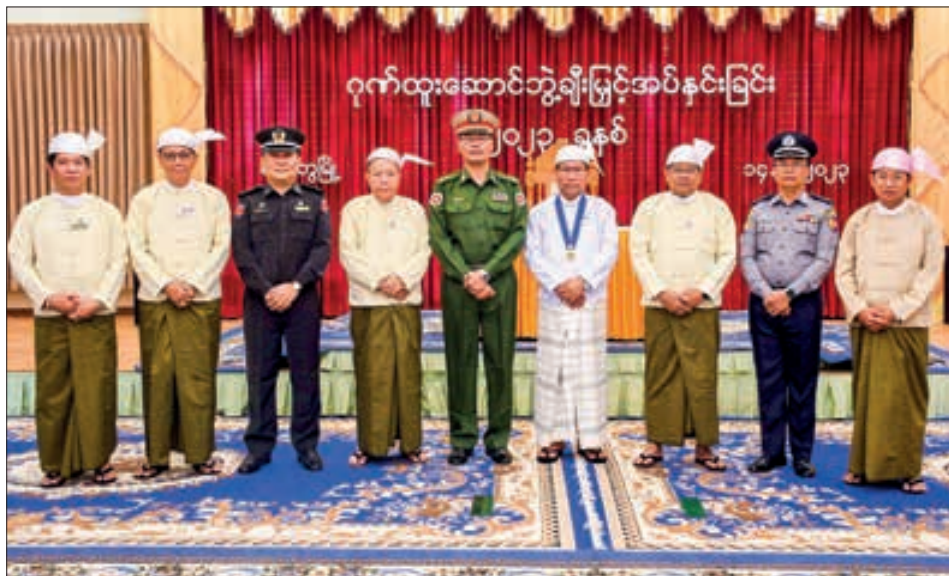
The documentary group photo of the honorary titles presentation ceremony in Sittway.