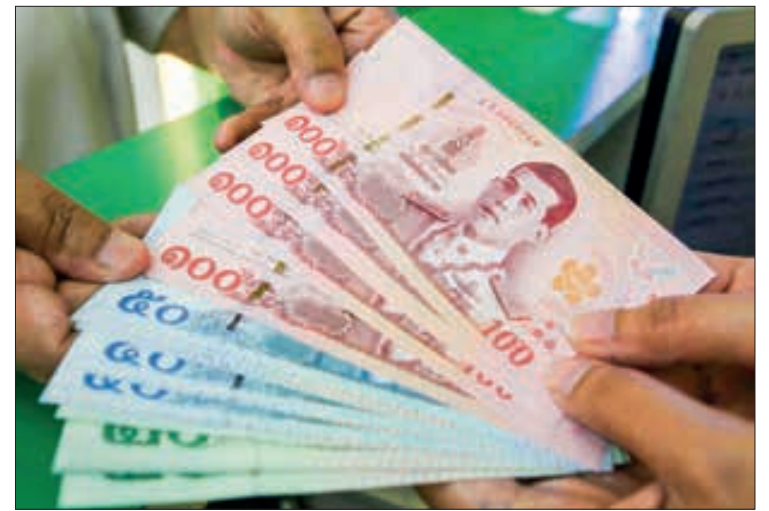
Thai Baht notes.

For foreign currency accounts (Thai Baht), CB Bank and AYA Bank are making a partnership with the Bangkok Bank Public Co Ltd (Yangon branch). Meanwhile, Yoma Bank and MAB Bank are joining hands with Siam Commercial Bank Myanmar Limited, while the UAB Bank is connected to Krung Thai Bank Public Com-