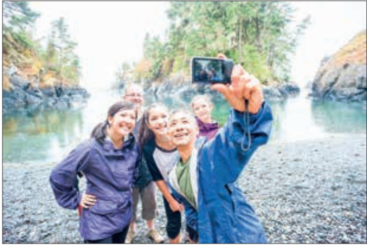
The frequency and variety of places visited are important factors, with those who travel more than 15 miles away from home more likely to report overall good health.

THE frequency and variety of places visited are important factors, with those who travel more than 15 miles away from home more likely to report overall good health. Those who travel to more places are more likely to see friends and family. This increase in social participation is then linked to better health.