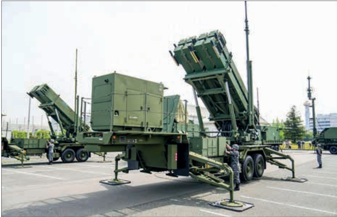
The Japan Air Self-Defence Force conducts a drill to deploy Patriot Advanced Capability-3 surface-to-air missile interceptors on an artificial island in Osaka, western Japan, on 19 May 2022, in the wake of North Korea's repeated missile launches.

JAPANESE Prime Minister Fumio Kishida pledged Friday alongside US President Joe Biden to modernize his country's military, warning that Russia's invasion of Ukraine had opened a dangerous new era and could embolden China.