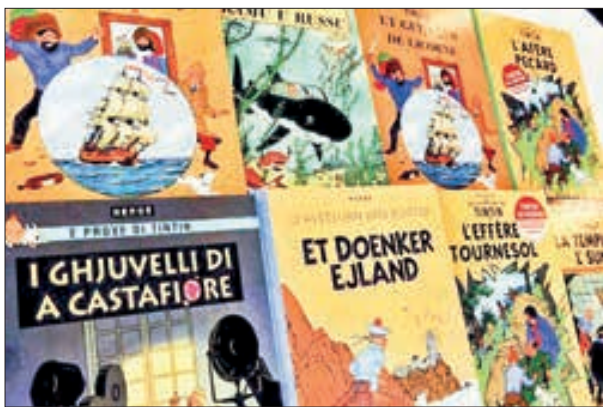
Several covers of the comic series “Tintin” are seen translated in different languages in Brussels, Belgium, on 24 January 2014.

KNOWN around the world for his blond quiff and daring adventures, Belgian