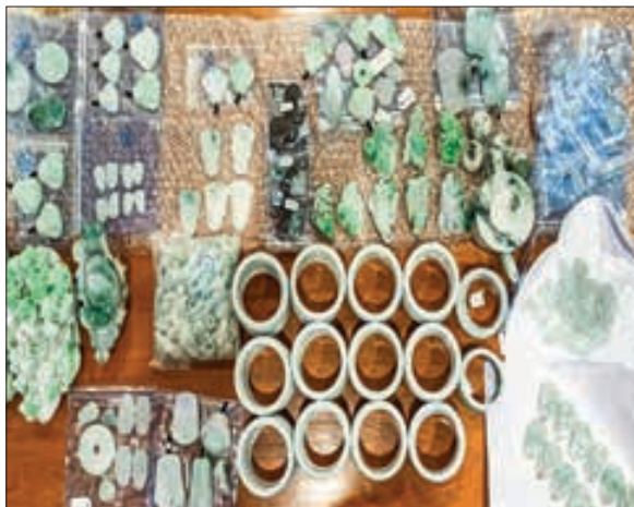
Confiscated illegal commodities at Yangon International Airport.