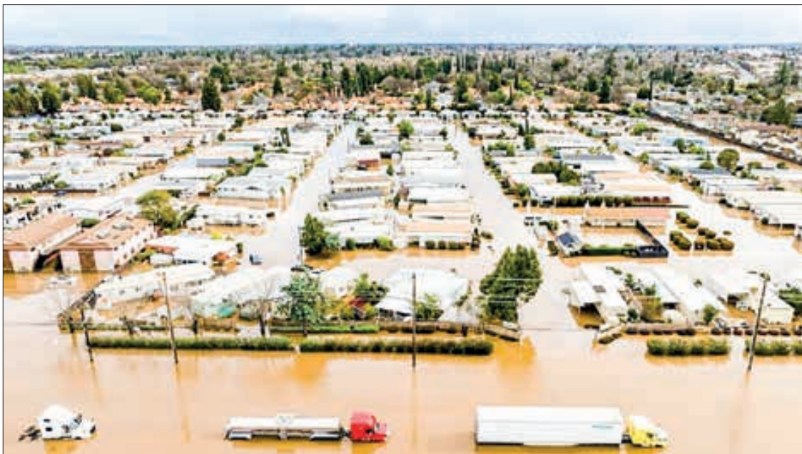
Parts of the town of Merced in northern California were flooded by heavy rains.

Peter Gleick, co-founder of the Pacific Institute in Oakland, a research organization that specializes in water issues, says it's difficult to quantify exactly how much water has fallen from the sky.—AFP