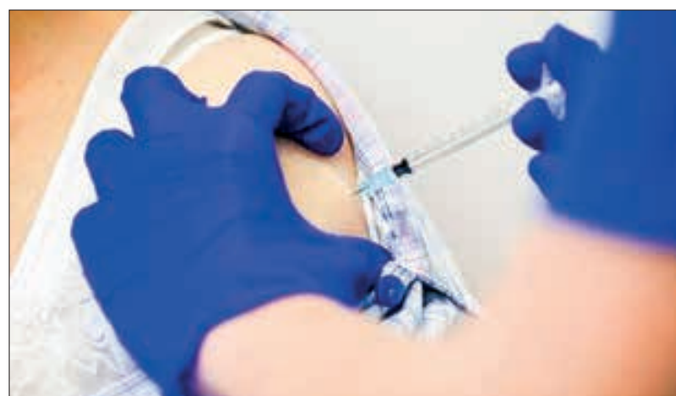
A preliminary study using the US Veterans Affairs database did not indicate an increased risk of ischemic stroke following the updated vaccine, according to the CDC.

The Vaccine Adverse Event Reporting System managed by CDC and FDA has not seen an increase in reporting of ischemic strokes following the vaccine. —Xinhua