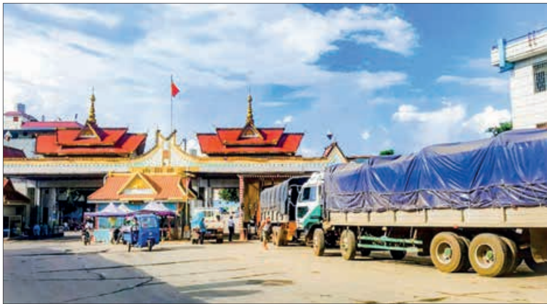
Lorries laden with export cargoes are seen on the Sino-Myanmar border.

Myanmar has opened five border trade posts with China — Muse, Lweje, Kampaiti, Chinshwehaw and Kengtung. The majority of the trade is carried out through Muse, Ministry of Commerce's data indicated. — NN/EMM