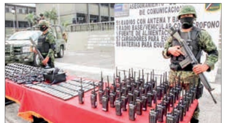
Mexican soldiers stand guard behind communication radios seized from alleged drug cartel members in Veracruz, Mexico, 23 November 2011.

A once-powerful Mexican government minister who oversaw his country's war on drug trafficking goes on trial in New York on Tuesday, himself charged with facilitating the smuggling of narcotics.