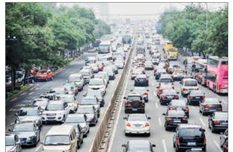
Transport is also the major source of noise in cities.

The plan pledged to enhance control of the sources of noise, as well as noises from industrial firms, construction sites, transport, and social activities.—Xinhua