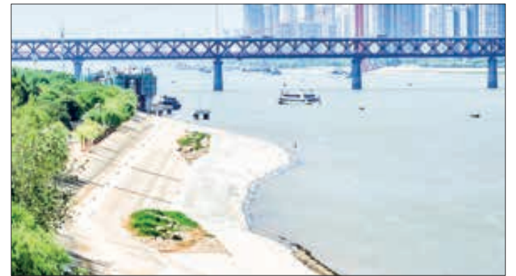
A large area of a beach along the Yangtze River is seen from above in Wuhan, Central China’s Hubei Province on 15 August 2022. On that day, the water level in many parts of the Yangtze River was the lowest for the period since hydrological records began in 1865.

Preparations for the conference are well underway, including on the concept papers that will inform the interactive dialogues, Li said.—Xinhua