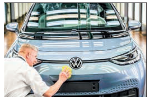
An employee checks the surface of an “ID 3” electric car of German carmaker Volkswagen, at the “Glassy Manufaktur” (Glaeserne Manufaktur) production site in Dresden, Germany, 8 June 2021.

The German Association of the Automotive Industry (VDA) said last week that the lack of intermediate products, high energy and raw material prices and the uncertainties due to the Russia-Ukraine conflict “dampened the market and production considerably” last year. —Xinhua