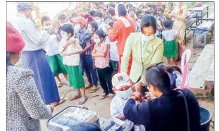
Students from Madaya Township in Mandalay Region are seen lining up to get jabbed against COVID-19 on 14 January 2023.

Similarly, on that day healthcare officials gave the vaccines to 289 students from seven districts in Mandalay Region.—MNA