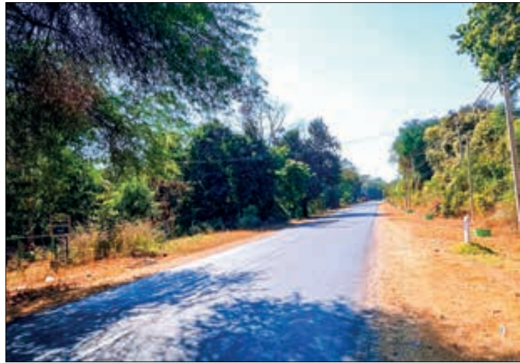
General view of one section on the Minbu-An-Sittway Road.

The death toll from COVID-19 in the country remained unchanged to 19,490 on 14-1-2023 with no new death reported from the pandemic.—MNA