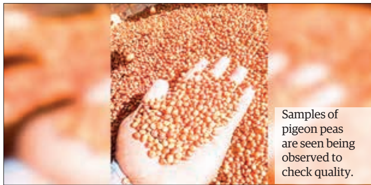
Samples of pigeon peas are seen being observed to check quality.

The price of tur fetched 7,400 rupees per quintal (0.1 tonne) this month, which jumped from 6,100 rupees. The price of pigeon peas in India in early 2023 rose by over 1,000 rupees against that of the year-ago period.