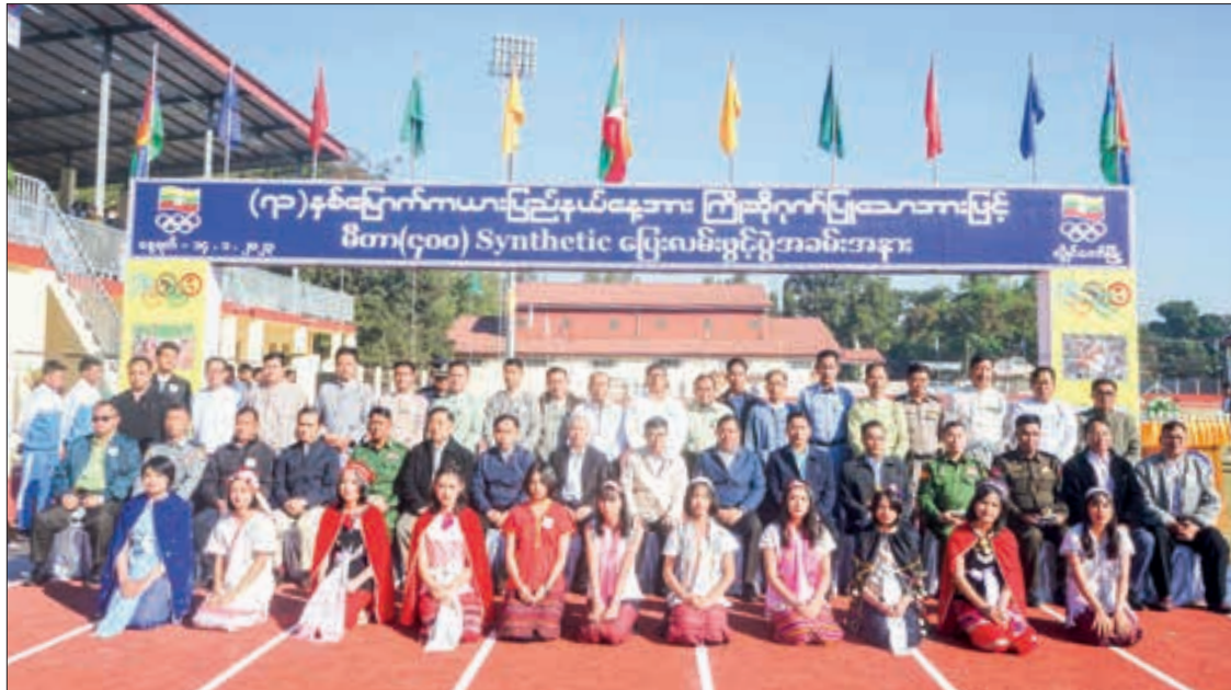
SAC members, Union ministers and attendees take the documentary group photo at the event.

state levels, officials are working to enable young players to compete in ASEAN competitions and international competitions, the chief minister said.