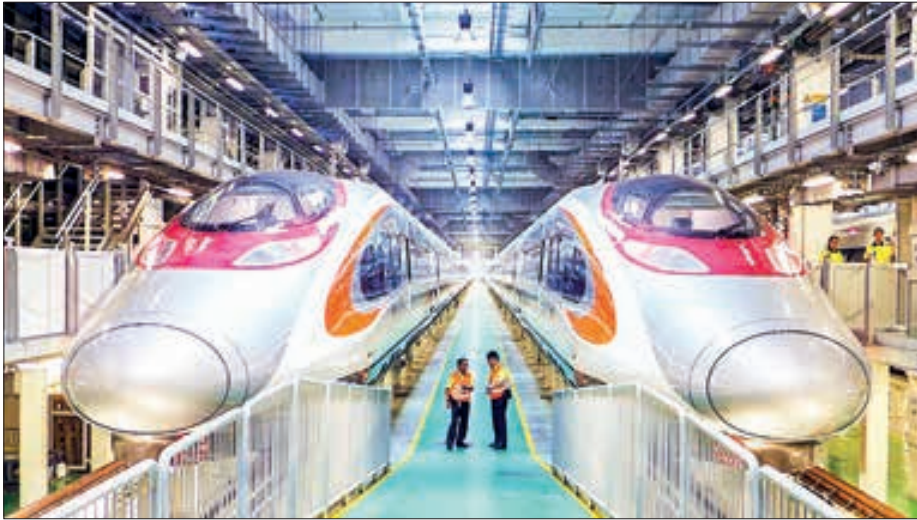
After nearly three years of service suspension, the Hong Kong section of the Guangzhou-Shenzhen-Hong Kong Express Rail Link will restart operation on 15 January.

Passengers can purchase tickets online through train ticket book-