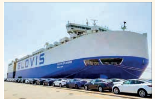
A ship is loaded with electric cars produced by US automaker Tesla's Shanghai Gigafactory, before leaving for Slovenia from a port in east China's Shanghai, 11 May 2022.