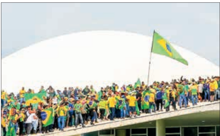
Supporters of Brazilian former President Jair Bolsonaro invade the National Congress in Brasilia on 8 January.

The Bolsonaro video was posted online two days after the violent storming of the presidency, Congress and Supreme Court and later deleted.—AFP