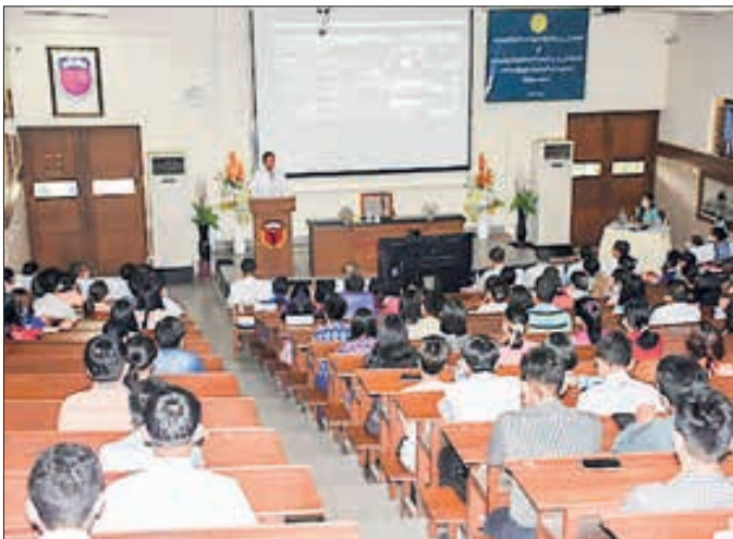
The fresher welcome event was held in the University of Medicine 1 Yangon on 18 May 2022.