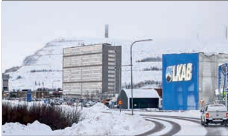
The LKAB facility in Kiruna, Sweden. The company said on 12 January that it found Europe's biggest known deposit of rare earth elements there.

While the find is believed to be the biggest in Europe, it remains small on a global scale, representing less than one per