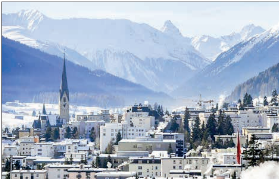
Hundreds of political leaders, CEOs and investors will swarm the Swiss village of Davos next week for the World Economic Forum.

THE world's political and business elites will gather for the annual Davos summit next week to promote "cooperation in a fragmented world", with war in Ukraine, the climate crisis and global trade tensions high on the agenda.