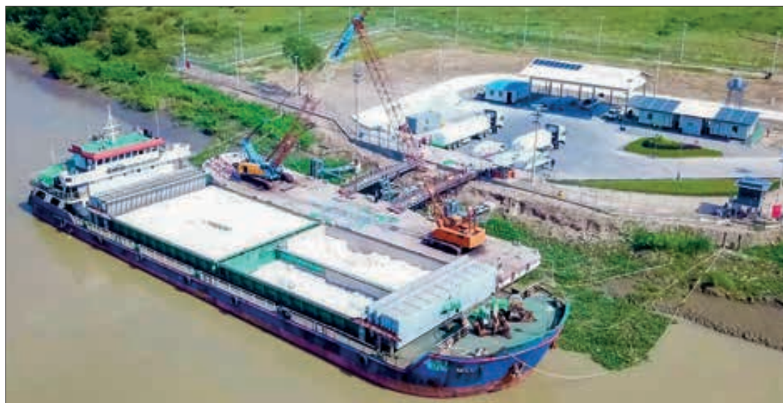
Rice bags are loaded onto the MCL-7 vessel at Pathein Port.

“For 30,000 tonnes of rice export from Pathein port, the final ship left. The export will continue after another G-to-G pact. The current direct export can make