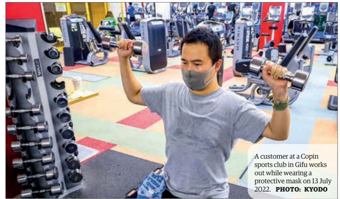
A customer at a Copin sports club in Gifu works out while wearing a protective mask on 13 July 2022.

While the requirement to wear masks was removed in all 50 states at one time, residents in some parts of the United States have again been asked to put on masks due to a "triple-demic" where the coronavirus, influenza and respiratory syncytial virus are circulating simultaneously. —Kyodo