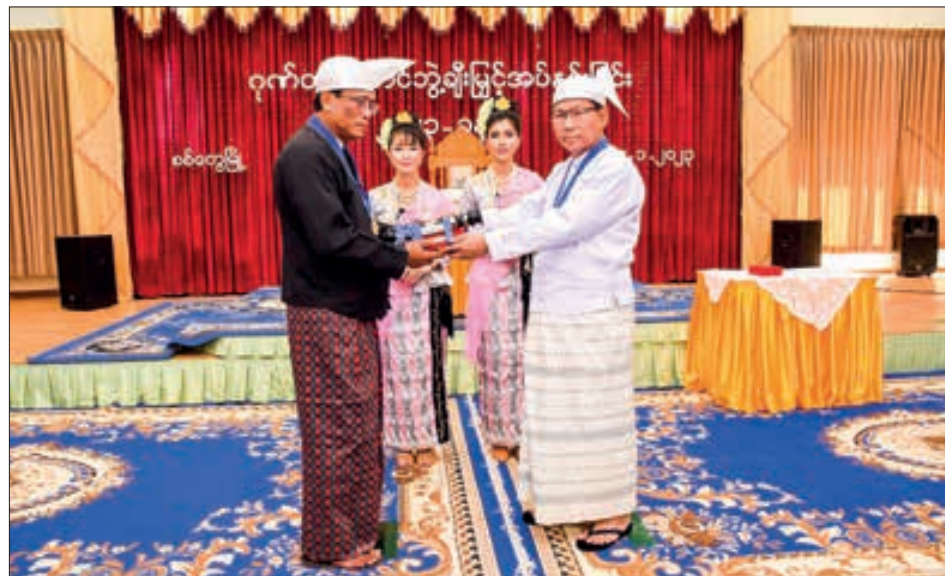
The honorary title is presented in Rakhine State.