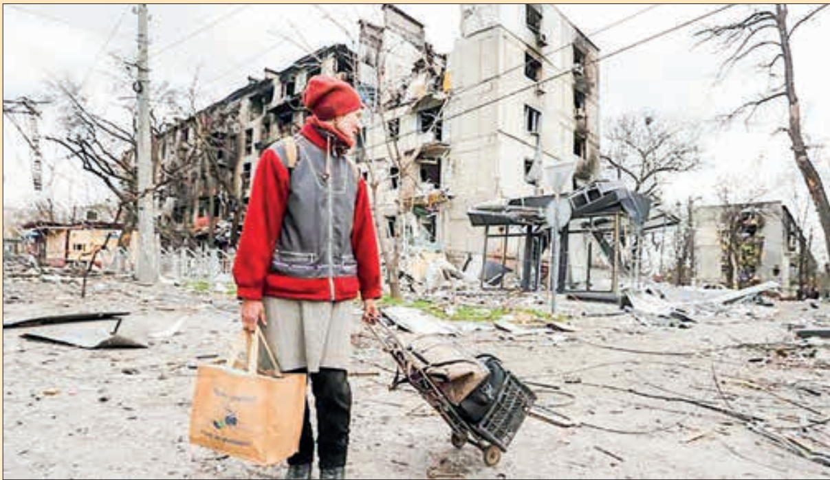
A resident walks near damaged buildings in Mariupol on 18 April 2022.

A lingering COVID-19 pandemic, incessant climate disasters, rising geopolitical tensions, a sluggish economic recovery, soaring energy prices – a wild tangle of woes and challenges in 2022 has pushed the world to another crossroads, whose future remains within the command of each and every one of us.