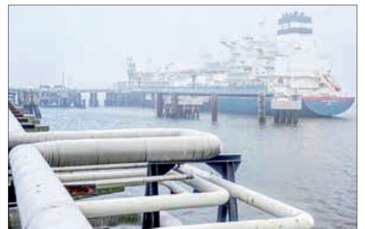
The surge in energy prices that followed Russia's invasion of Ukraine has pushed Germany to the brink of a recession.

It was also higher than the 1.4 per cent expansion forecast by the government last October. Analysts and the government have been predicting that Europe's largest economy will fall into recession this year, but the GDP figures -- and a string of recent indicators -- suggest it may dodge a severe downturn.—AFP