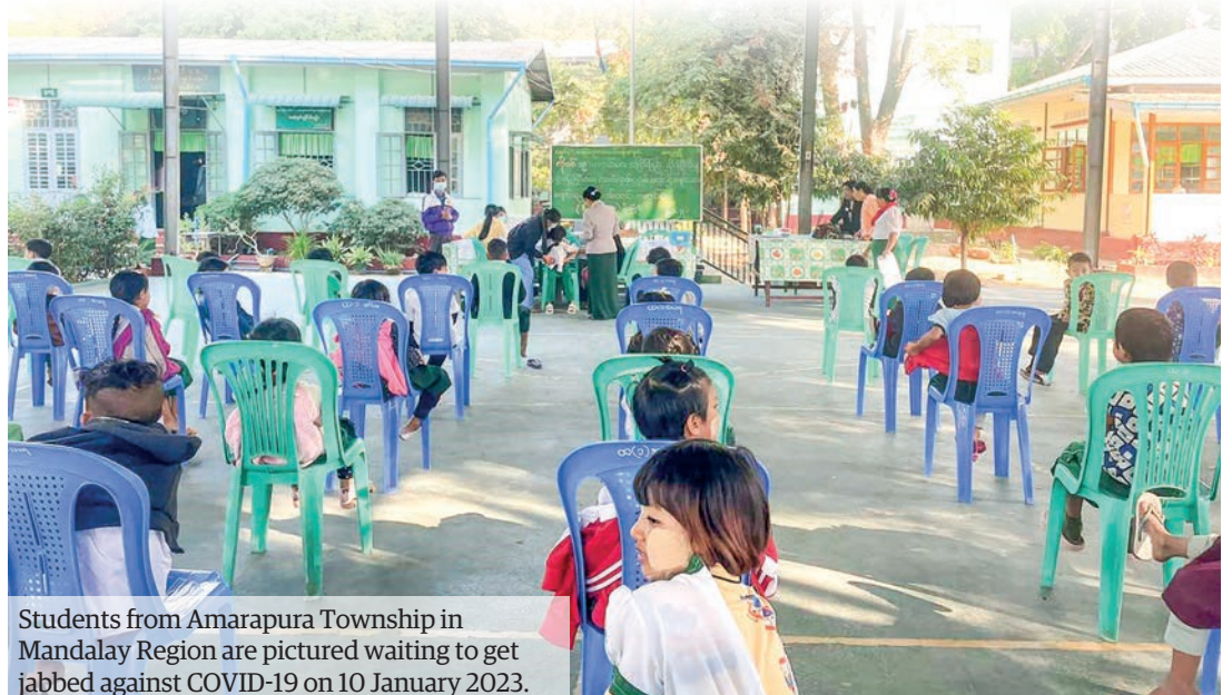
Students from Amarapura Township in Mandalay Region are pictured waiting to get jabbed against COVID-19 on 10 January 2023.

vaccines to 20,413 people from twenty-six townships in Ayeyawady Region, 521 people from seven districts in Mandalay Region, and 125 people from Taungoo Township in Bago Region, respectively.—MNA