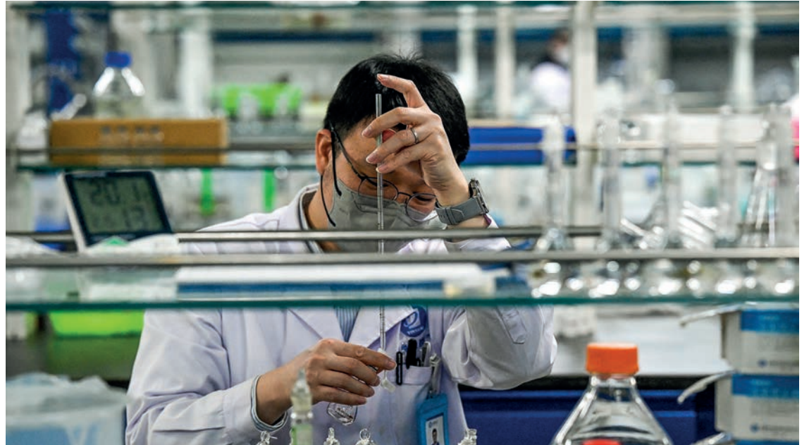
A researcher conducts medical tests at a workshop of Youcare Pharmaceutical Group in Beijing during a media tour organized by the State Council Information Office (SCIO) on 10 January 2023. PHOTO: AFP

A group of European Union experts last week “strongly encouraged” the bloc’s 27 member states to demand Covid tests from people on flights from China and conduct random tests on arrivals.— AFP