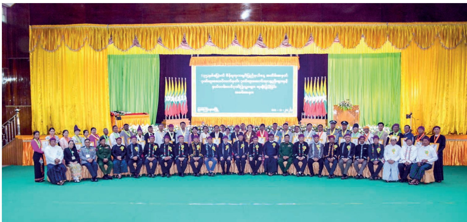
SAC members, Union ministers, dignitaries and attendees pose for the documentary group photo at the event.

Myanmar regained independence on 4 January 1948 and the first session of the Kachin State Council Congress was held in Sitapu Manaw Ground on 10 January. The congress was attended by Myanmar's first president Sao Shwe Thaik who inaugurated the Manaw Pandal together with Prime Minister U Nu and that day was designated as Kachin State Day marking the formation of the Kachin State government. Since then, the commemoration of Kachin State Day has been held every year and it reaches 75 years or diamond jubilee this year.