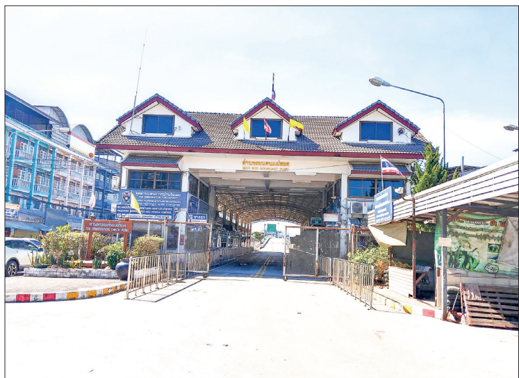
The Myawady-Maesot Friendship Bridge I is seen yet to open.

MYAWADY-MAESOT Friendship Bridge I is scheduled to be reopened on 12 January 2023, traders from the border area said.