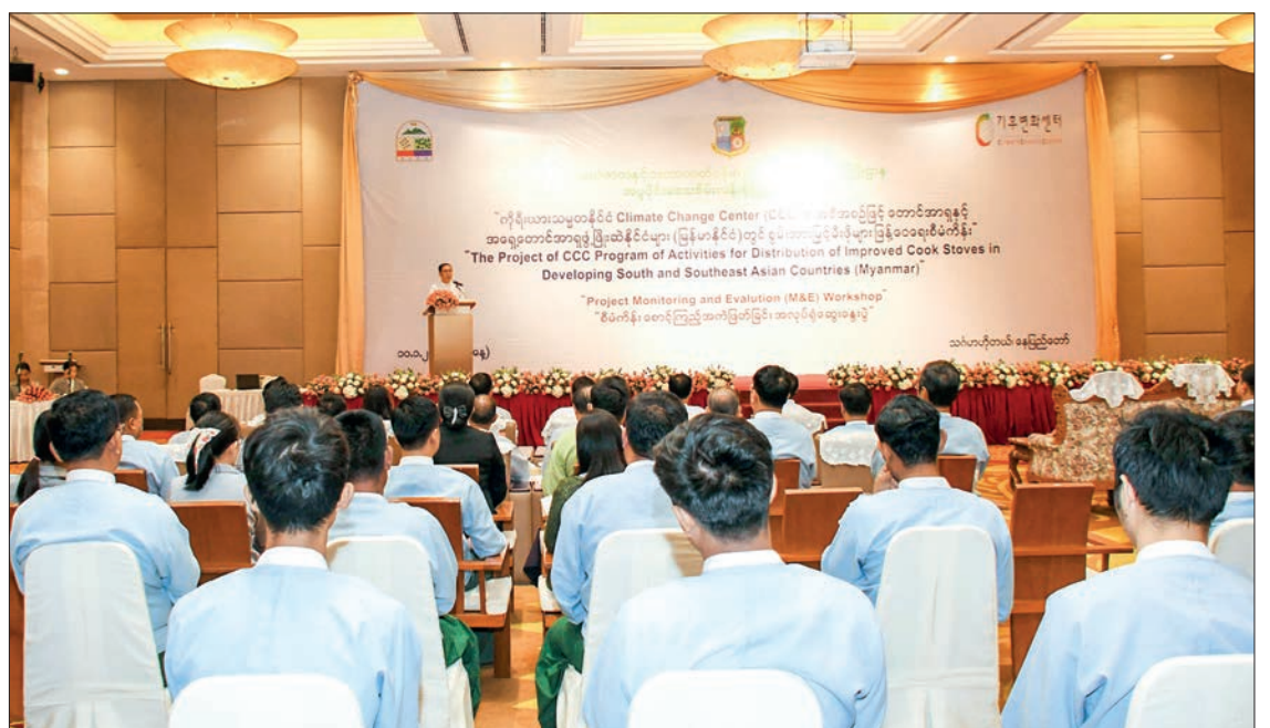
The monitoring and evaluation workshop for improved cook stoves distribution project in developing countries in South Asia and Southeast Asia is in progress yesterday in Nay Pyi Taw.

Afterwards, officials explained the status of the project and read the research papers related to the use of improved cook stoves, and the attendees