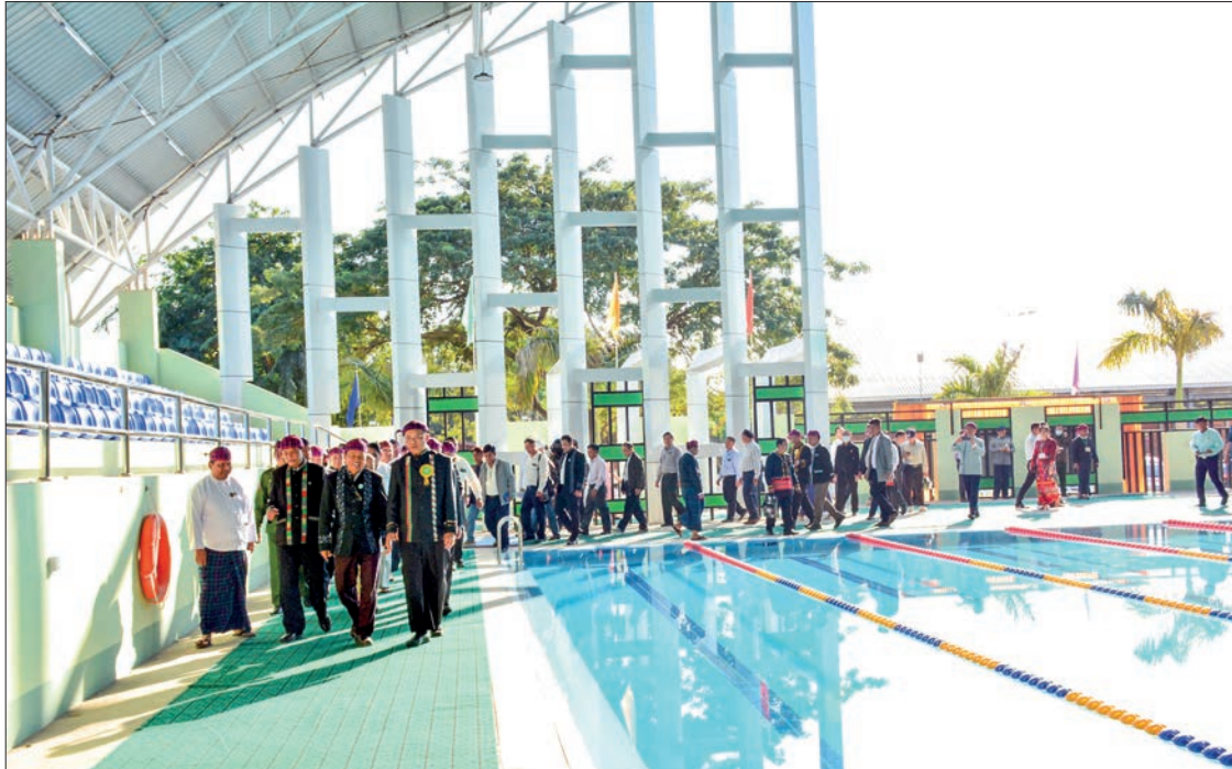
SAC members, Union ministers and officials view round the Nyeinchanthaya swimming pool in Myitkyina yesterday.

STATE Administration Council members and Union ministers opened the Nyeinchanthaya swimming pool, which was constructed in commemorating the 75 th Anniversary (Diamond Jubilee) Kachin State Day, in Myitkyina.