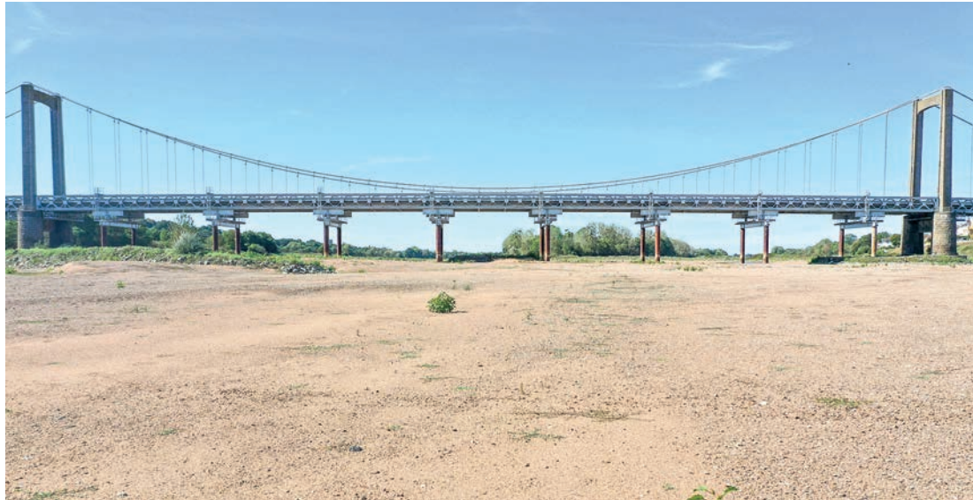
This picture taken in Loireauxence, western France on 20 September 2022 shows a bridge over the dried out Loire River bed. This summer was France's second-hottest on record with average temperatures 2.3C above the norm, a slew of large-scale wildfires which ravaged much of the southwest and widespread drought as well as several severe storms.

France, Britain, Spain and Italy set new average temper-