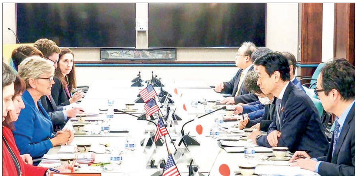
Japanese industry minister Yasutoshi Nishimura (2 nd from front R) and US Energy Secretary Jennifer Granholm (3 rd from front L) hold talks in Washington on 9 January 2023.

US authorities have given final regulatory approval for more than doubling its current natural gas export capacity.—Kyodo