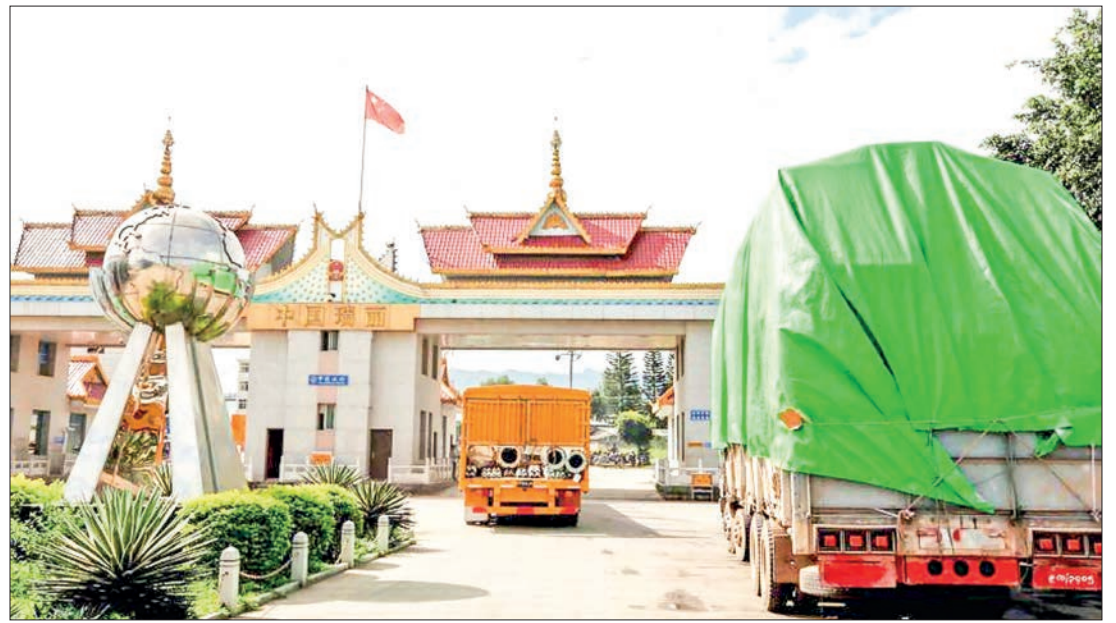
Lorries laden with cargoes are seen at the China's Ruili border crossing.

The prices of various pulses stood at over K1,645,000 per tonne of black gram (Fair Average Quality/RC), K1,845,000 per tonne of black gram (Special Quality/RC), K1,770,000 per tonne of pigeon pea (red gram) RC, K4,300-K4,500 per viss of chickpea and K2,800-K2,920 per viss of green gram (Kayan Shwe Wah variety) in Yangon markets.—TWA/EMM