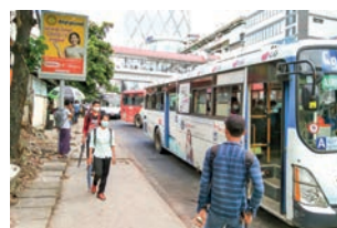
YBS buses are pictured at the Yangon city centre.

ACTION has been taken against 580 YBS buses that failed to follow traffic rules and they will be disallowed