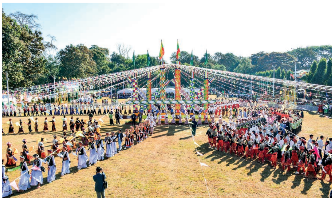
The 75 th Anniversary (Diamond Jubilee) Kachin State Day event is in progress yesterday.

Then, the Honorary Certificate/Award-Giving Ceremony in Commemoration of the 75 th Anniversary of Kachin State Day was held at the City Hall of Myitkyina.