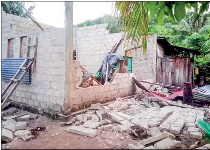
This handout picture taken and released on 10 January 2023 by BNPB (National Disaster Management Agency) shows a damaged house after a 7.6-magnitude earthquake hit deep under the ocean off Indonesia and East Timor, in the Tanimbar islands in Maluku.

Indonesia's Meteorology, Climatology and Geophysics Agency (BMKG) said the tremor was felt on the eastern islands of Timor, the Maluku archipelago and Papua. It reported some aftershocks at a magnitude of 5.5.