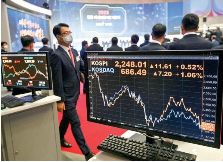
A man walks past a computer screen showing South Korea's benchmark stock index during a ceremony celebrating the New Year's opening of the South Korea stock market at the Korea Exchange in Seoul on 2 January 2023.

ASIAN and European markets were mixed Tuesday as growing optimism over China's economic reopening was offset by warnings that US interest rates will continue to rise and stay elevated for some time.