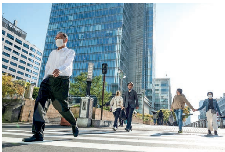
People cross a street in downtown Tokyo on 18 November 2022.

Outlays on furniture and household goods such as futon bedding dropped 5.2 per cent from a year earlier.