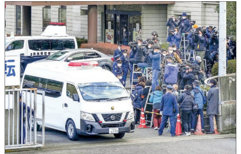
A police vehicle carrying Tetsuya Yamagami, the man accused of fatally shooting former Japanese Prime Minister Shinzo Abe last year, arrives at Nara Nishi Police Station in Nara, western Japan, on 10 January 2023. He was moved there from Osaka Detention House in Osaka as his psychiatric evaluation period ended the same day.

The Nara District Public Prosecutors Office previously requested the suspect's evaluation period be extended twice. The Nara District Court allowed it to continue until 10 January after his defence filed an appeal on both occasions. On Tuesday,