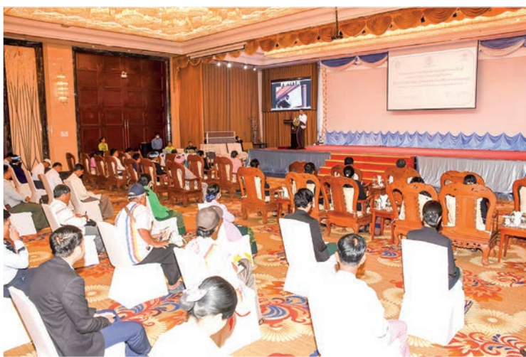
The workshop on Myanmar's agriproducts access to the Japanese market is in progress.

A workshop on Myanmar's agriproducts access to the Japanese market was held yesterday in Nay Pyi Taw.