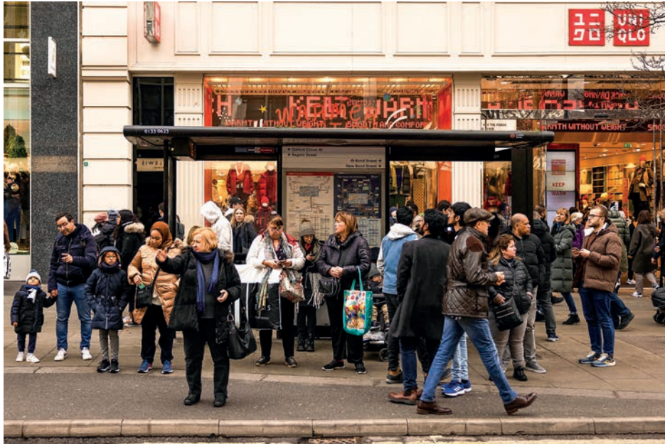
Shoppers, carrying bags, wait for the bus in central London, during the bank holiday sales, on 27 December 2022.

BRITISH retailers won a boost from higher prices over the key Christmas trading period but the volume of goods sold slumped as sky-high inflation hits broader buying, data revealed Tuesday. Revenue jumped almost seven per cent in December from a year earlier largely thanks to surging food prices, according to a survey by the British Retail Consortium (BRC) and financial firm KPMG.