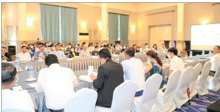
Union Minister Dr Htay Aung attends the Myanmar-China Tourism Promotion meeting in Yangon yesterday.

THE Ministry of Hotels and Tourism organized the third Hybrid Seminar on Enhancing the Understanding of Service Providers for Japanese Travellers at Kalaw Hilltop Villa Hotel in Kalaw Township yesterday. The seminar is part of the implementation of the