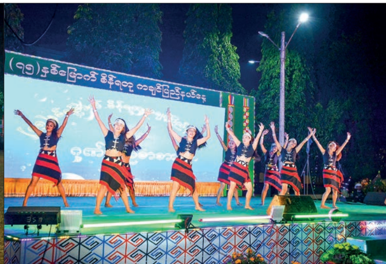
Ethnic traditional dance troupes entertain at the dinner to honour the 75 th Anniversary (Diamond Jubilee) Kachin State Day yesterday.

nic traditional dance troupes attended the dinner.