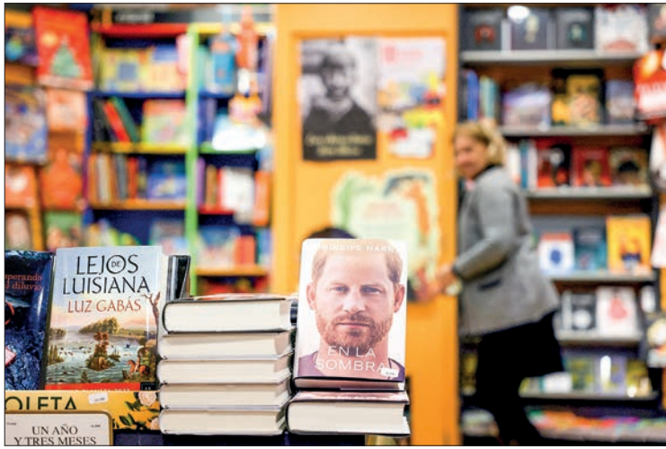
Copies of "En la sombra" (In the shadow), Spanish version of the book "Spare", an autobiography by Britain's Prince Harry, are displayed in a bookstore in Madrid on 10 January 2023.

AFTER months of anticipation and a blanket publicity blitz, Prince Harry's autobiography "Spare" went on sale Tuesday as royal insiders hit back at his scorching revelations.