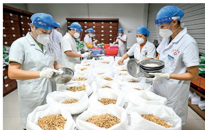
Pharmacists prepare Chinese herbal medicine at the Traditional Chinese Medicine Hospital of Sanya City in Sanya, south China’s Hainan province, 20 August 2022.

It clarifies the COVID-19 symptoms of child patients at different stages of infection, and gives corresponding TCM