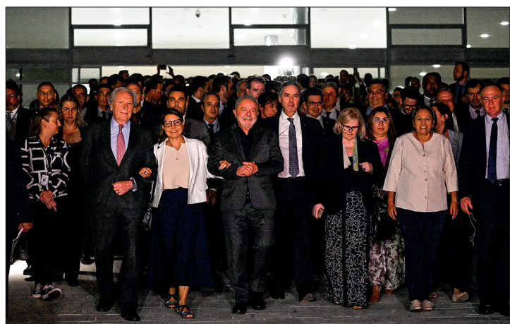
Brazil's President Luiz Inacio Lula da Silva (C), Governors, and Supreme Court judges walk from Planalto Palace to the Supreme Court building in Brasilia on 9 January 2023, a day after supporters of Brazil's far-right ex-president Jair Bolsonaro invaded the Congress, presidential palace, and Supreme Court.

Lula, the 77-year-old veteran leftist who previously led Brazil from 2003 to 2010, met with the leaders of both houses of Congress and the chief justice of the Supreme Court, and joined them in condemning what many called the South American country's version of the US Capitol riots in Washington two years ago.—AFP