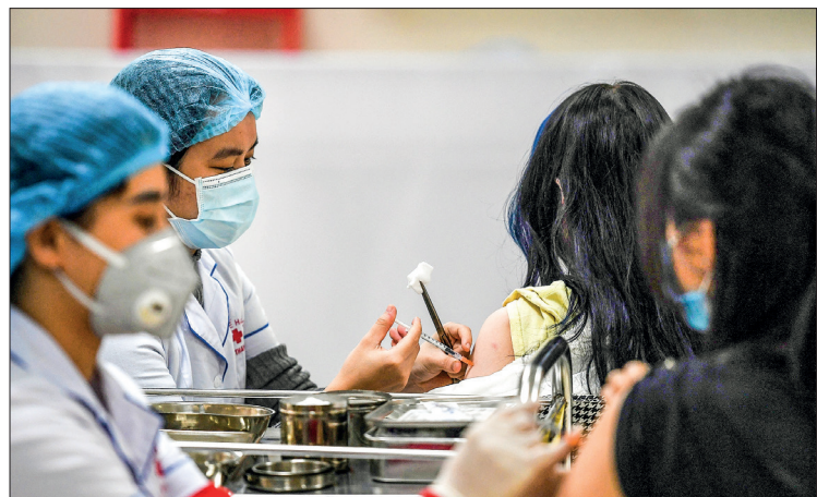
Medical staff administer doses of the Pfizer/BioNTech Covid-19 coronavirus vaccine to youths between the age of 12 and 17 in Hanoi on 23 November 2021.

tion and control in the country as the Lunar New Year is approaching with several festivals expect-