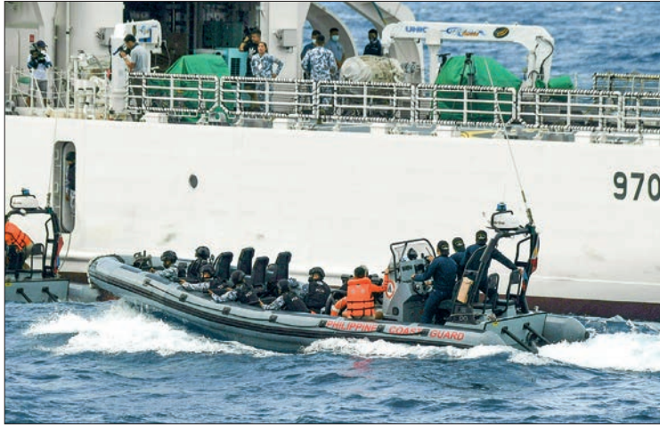
Members of the Maritime Security and Enforcement Command of the Philippine Coast Guard take part in an anti-piracy drill off Bataan on 3 September 2022.

WORLDWIDE acts of piracy fell to their lowest level last year since statistics were first estab-