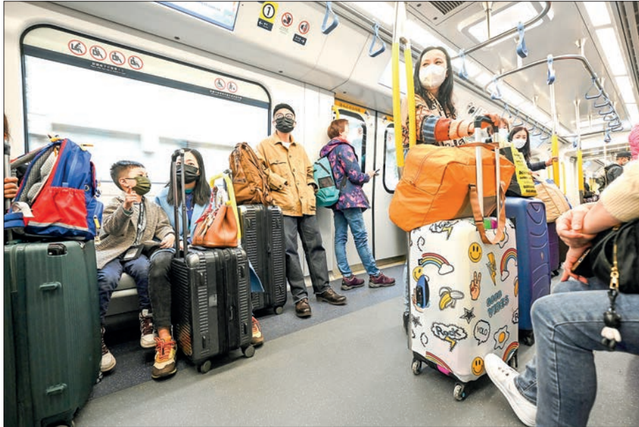
Passengers travel to the Lok Ma Chau checkpoint at the Shenzhen border crossing with mainland China in Hong Kong on 8 January 2023.

The readings, while suggesting the world's top economy was showing signs of weakness, were seized on by traders hopeful that the Fed will begin