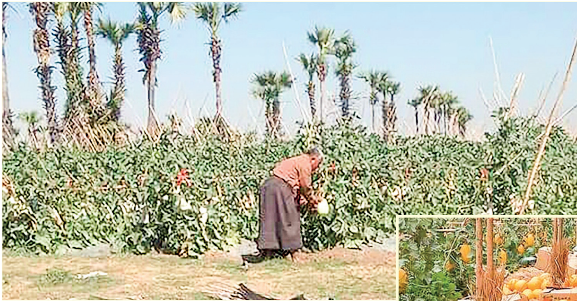
The prevailing prices stand at 3,500-4,400 Yuan per tonne for 855 watermelons, 3,800-4,800 Yuan for Taiwan watermelons and 5,000-6,000 Yuan for muskmelon depending on quality.