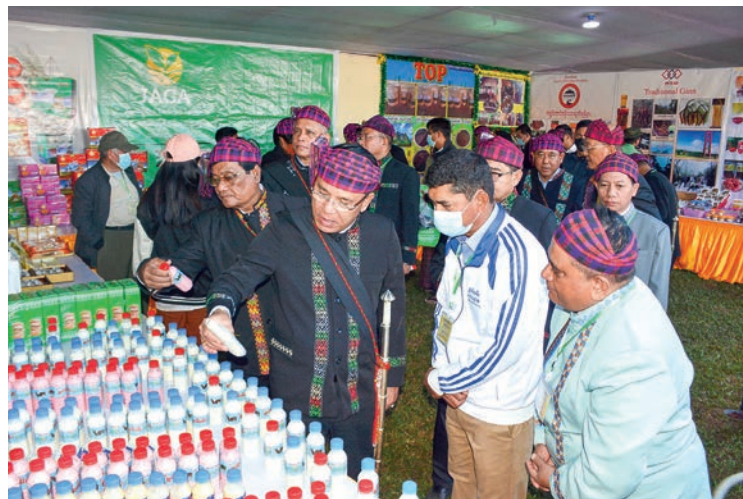
SAC members, Union ministers and officials view the exhibits at the event.