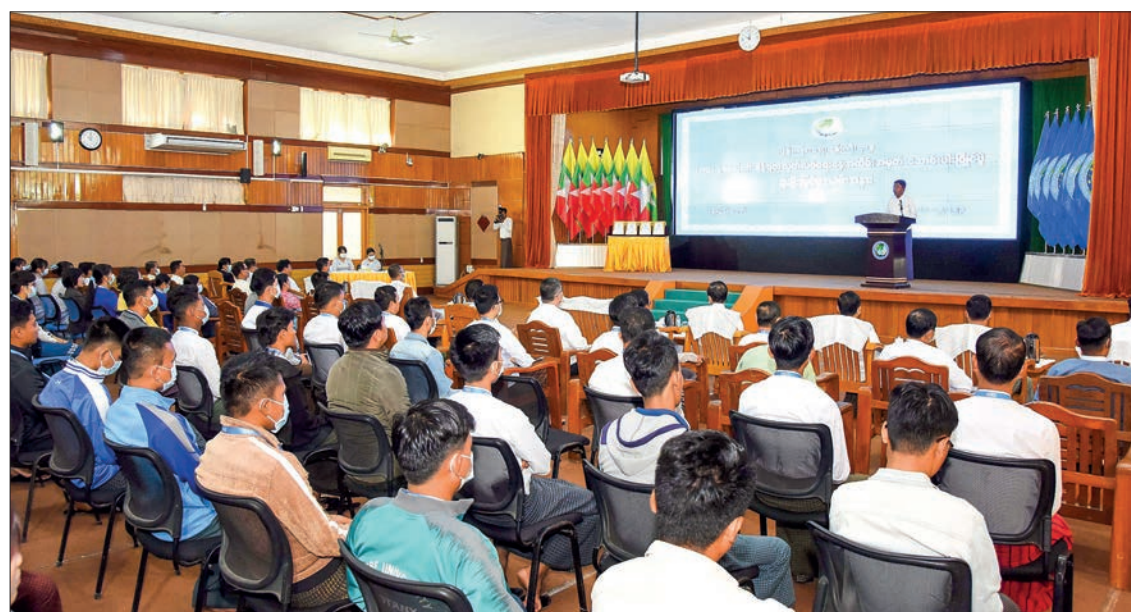
The award presentation event for the article competition in marking Diamond Jubilee Independence Day is in progress.