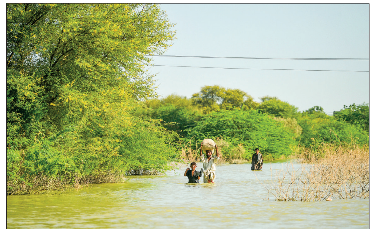
In this picture taken on 27 September 2022, internally displaced flood-affected people waded through a flooded area in Dadu district of Sindh province.

showed that as of Thursday, more than 1,700 people in the country had been killed in the