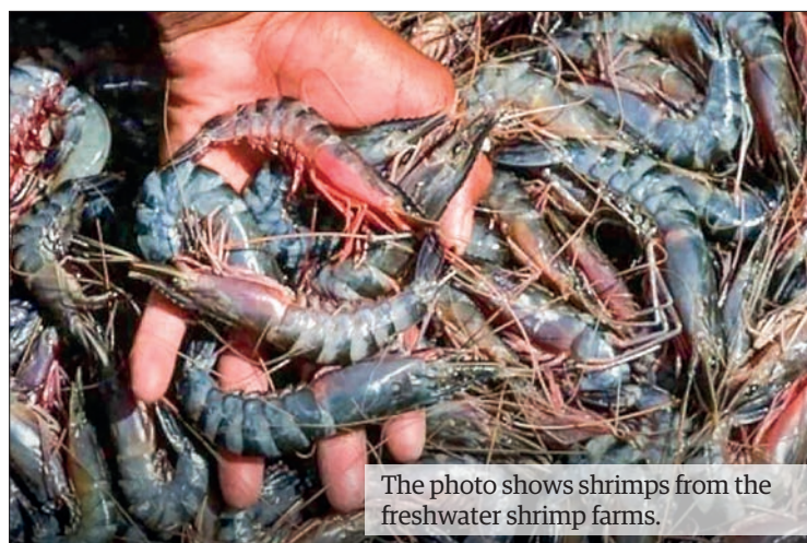
The photo shows shrimps from the freshwater shrimp farms.

Myanmar's fisheries products are yearly shipped to 45 countries. At present, live animals in the livestock sector are mainly exported to neighbouring countries via cross-border trade. To implement the commercial shrimp farming businesses, the shrimp larvae are imported from neighbouring countries. Therefore, the Ministry of Agriculture, Livestock and Irrigation elaborated on the need for a pub-