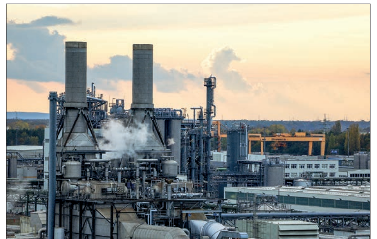
A general view taken on 1 November 2022 shows the BASF chemical industry company in Schwarzheide, eastern Germany.

"Business sentiment has brightened recently, and in the coming months, easing material bottlenecks could provide further support for the industrial