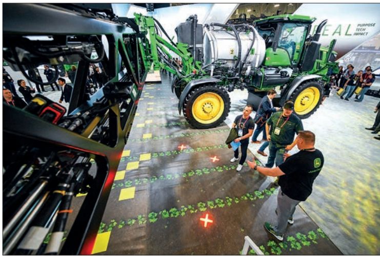
The Deer & Co John Deere See & Spray technology is shown in a display beneath a spraying arm connected to a John Deere 412R self-propelled sprayer at the company's booth during the Consumer Electronics Show (CES) in Las Vegas, Nevada on 5 January 2023.