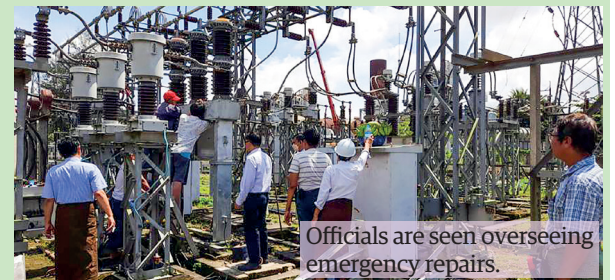
Officials are seen overseeing emergency repairs.

The natural gas pipeline of Yadana offshore was totally shut down at 3 am on 9 January and it caused less power supply into the