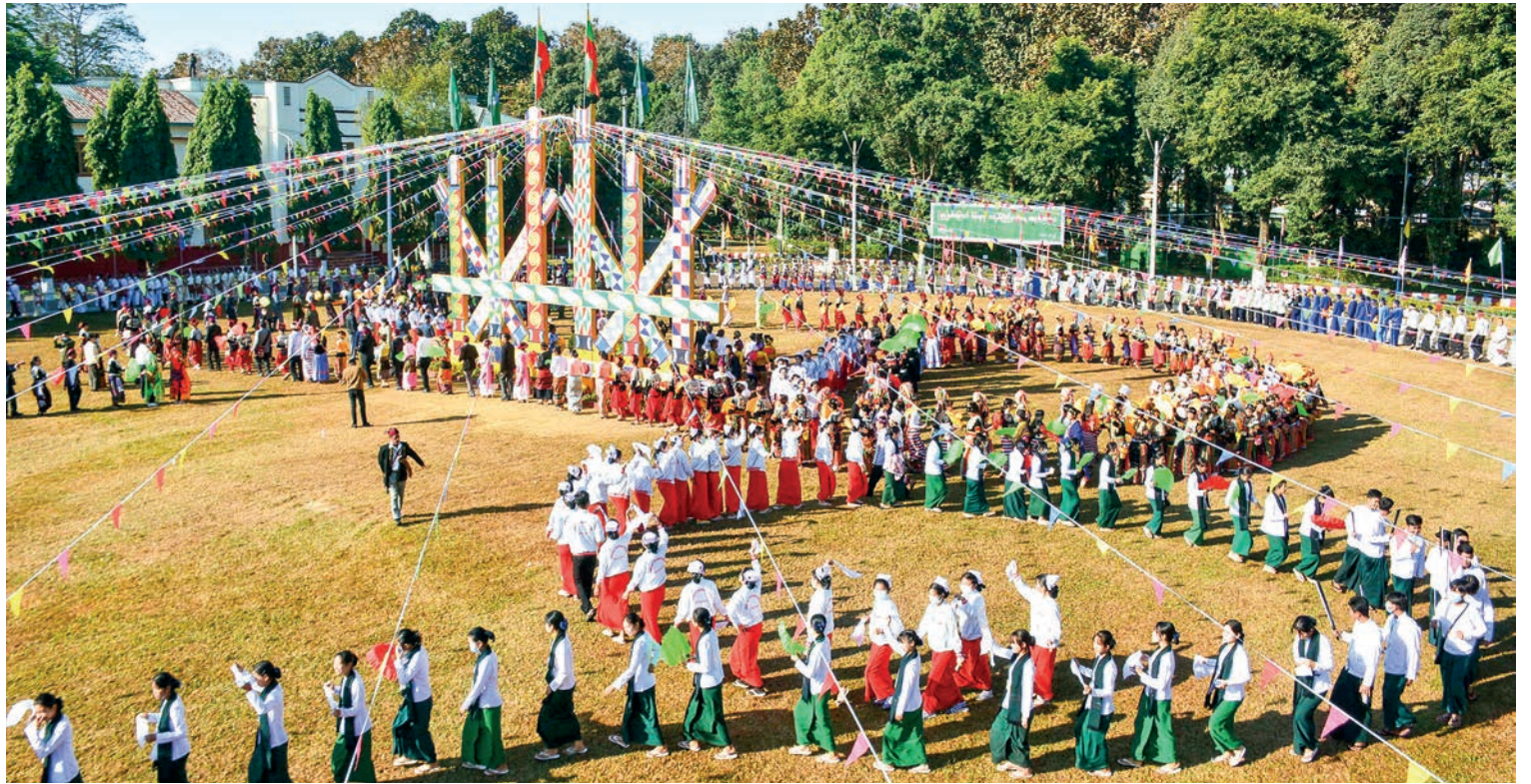
The inauguration ceremony of the Diamond Jubilee Kachin State Day is in progress in Kachin State yesterday (above and below).