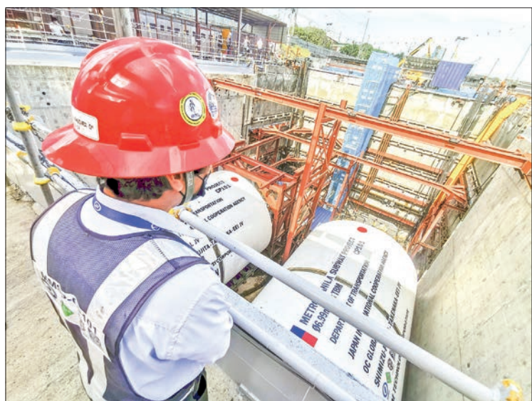
A worker looks down on a subway tunnel excavator in Manila on 9 January 2023.

CONSTRUCTION of the first-ever subway in the Philippines undertaken with Japanese aid began on Monday, in a move to pave the way for easing road congestion in overcrowded Manila.