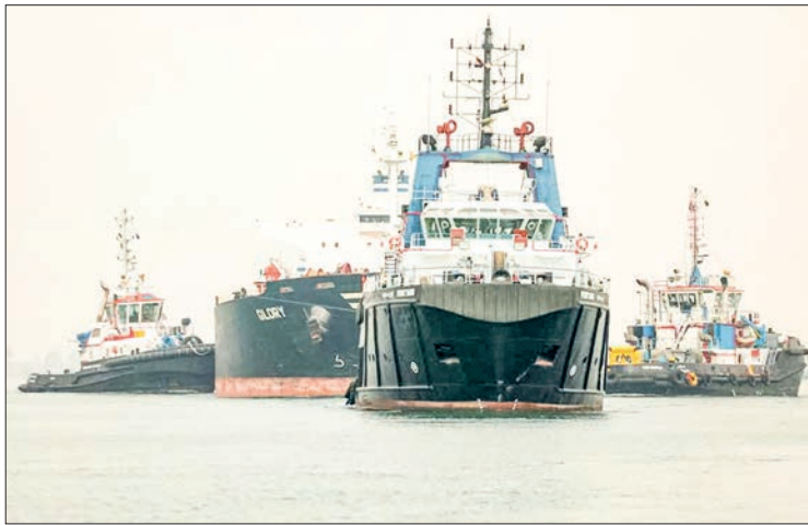
A handout picture released by the Suez Canal Authority on 9 January 2023 shows tugboats pulling the Marshall Islands-flagged bulk carrier M/V Glory in the Suez Canal near al-Qantarah between Port Said and Ismailia.

SUEZ Canal maritime traffic was "normal" Monday after a cargo vessel carrying Ukrainian grain ran aground but was then refloated and towed away, said the Egyptian authority running the vital waterway.