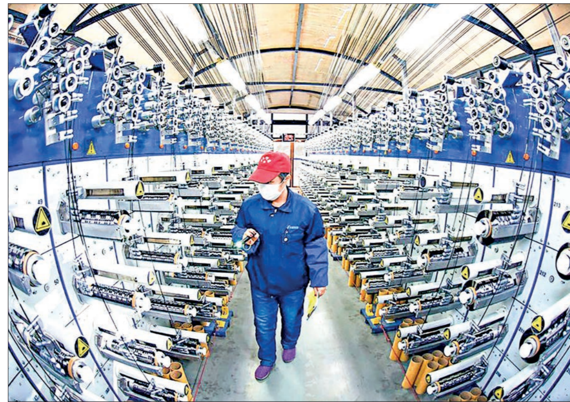
The carbon fibre production line of a factory in the Economic and Technological Development Zone of Lianyungang, Jiangsu Province.