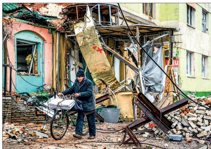
A local resident pushes his bicycle past "hedgehog" tank traps and rubble, down a street in Bakhmut, Donetsk region, on 6 January 2023, amid the Russian invasion of Ukraine.

The village lies northeast of Bakhmut, a wine-making