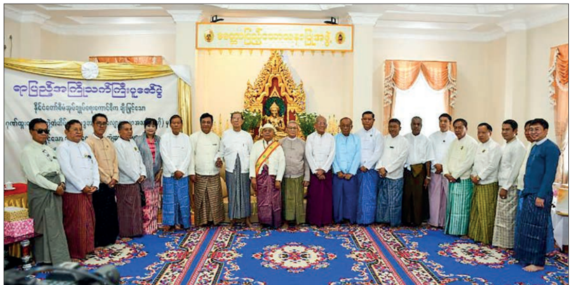
The event to honour the literati who received honorary titles is in progress yesterday in Bahan Township.

A ceremony to honour those who received honorary titles awarded by the State Administration Council and religious titles awarded by Young Men's Buddhist Association (Central) was held in Gyatawya street, Bahan Township yesterday.