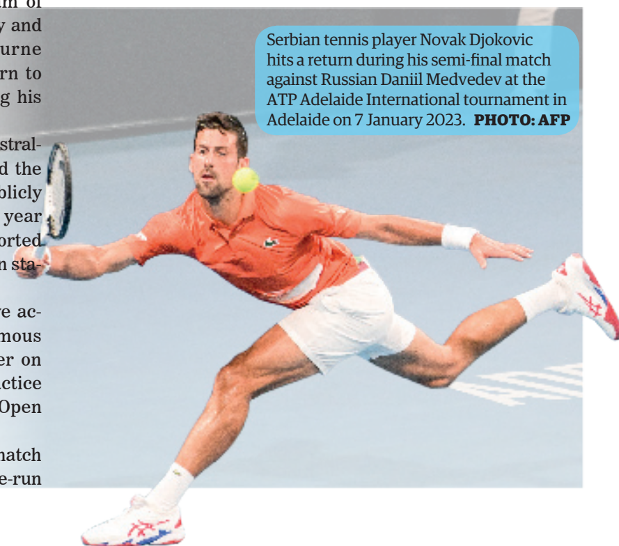
Serbian tennis player Novak Djokovic hits a return during his semi-final match against Russian Daniil Medvedev at the ATP Adelaide International tournament in Adelaide on 7 January 2023.

Djokovic saved match point on Sunday before defeating Sebastian Korda to win the Adelaide International and reinforce his status as a heavy title favourite for Melbourne.—AFP