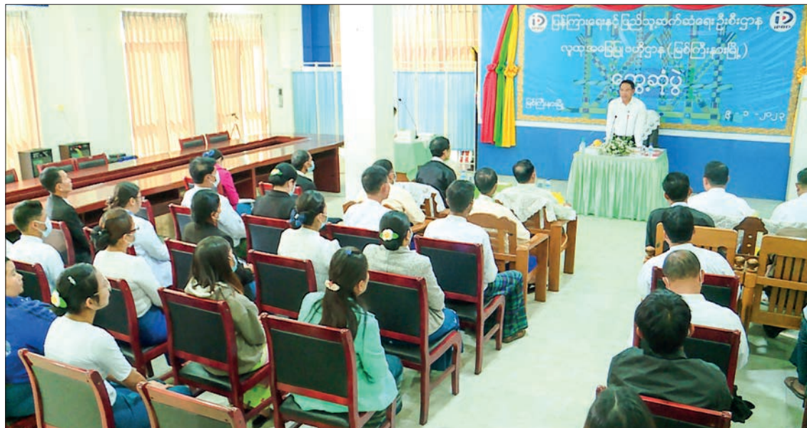
Union Minister U Maung Maung Ohn holds a meeting with the departmental staff of the ministry yesterday in Kachin State.

Afterwards, the Union minister provided cash assistance to the staff. The Union minister and party also visited the Sub-Printing House (Myitkyina) and provided cash awards to the staff.