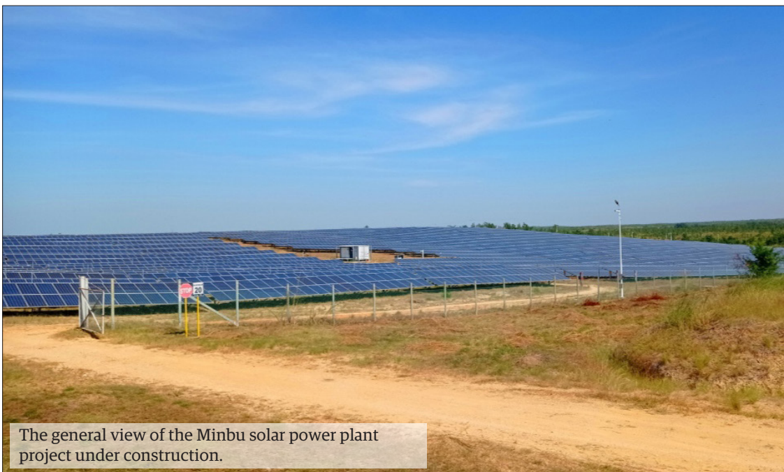
The general view of the Minbu solar power plant project under construction.

ABOUT 97 per cent of the groundwork for the second phase (40 MW) of the solar power project near Zeeaing village in Minbu district, Mgway Region, was completed, according to the in charge of the project.