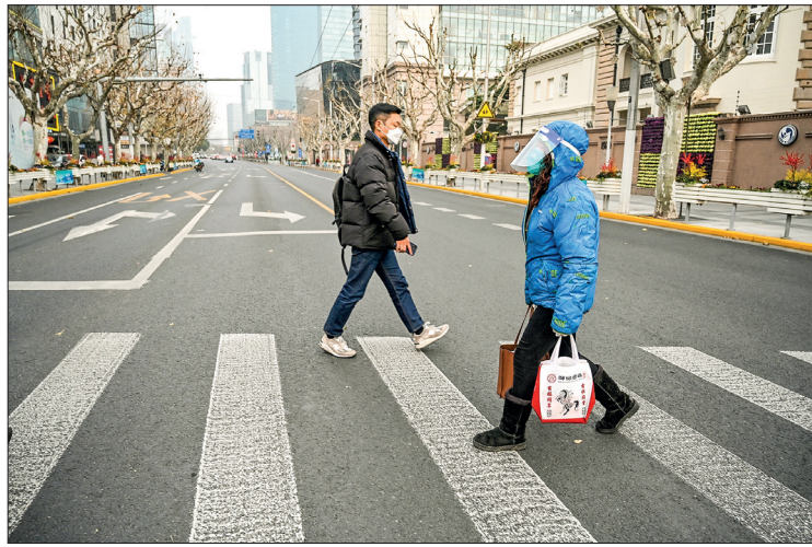
A woman wearing a face shield and mask amid the Covid-19 pandemic walks on a street in the Jing'an district in Shanghai on 9 January 2023.

ed to soar as the country celebrates Lunar New Year later this month, with millions expected to travel from big cities to visit vulnerable older relatives in the countryside.