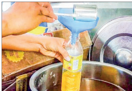
Edible oil is pouring into a bottle for a consumer at a shop.

The domestic consumption of edible oil is estimated at 1 million tonnes per year. The local cooking oil production is just about 400,000 tonnes. To meet the oil sufficiency in the domestic market, about 700,000 tonnes of cooking oil are yearly imported through Malaysia and Indonesia. — NN/EMM