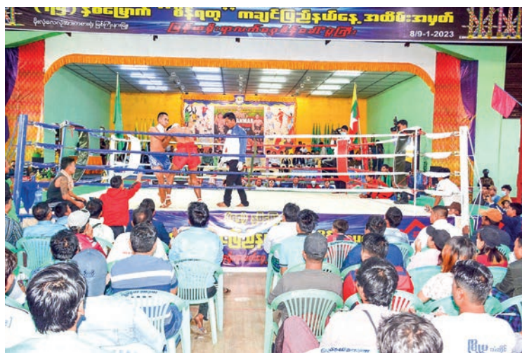
The traditional boxing challenge is in action.