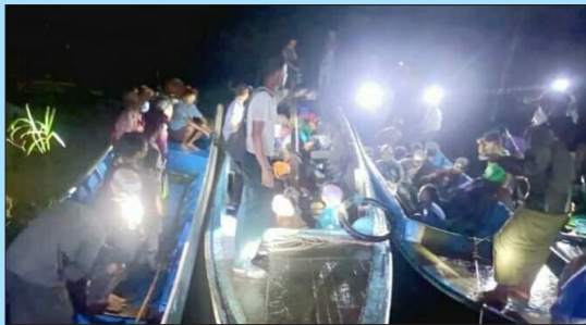
Bengalis are pictured being arrested in Bogale Township.

On 8 January, all the children were sent from the Pyapon prison to the Hngat-Aw-San Youth Training School in Kawhmu township of Yangon region.—TWA/MKKS