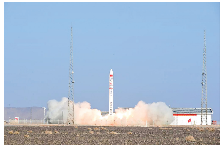
A CERES-1 Y5 carrier rocket is launched from the Jiuquan Satellite Launch Center in northwest China, 9 January 2023. The commercial rocket blasted off at 1:04 pm (Beijing Time) from the launch site, sending five satellites into the planned orbit.

The launch was the fifth flight mission of the CERES-1 rocket series.—Xinhua