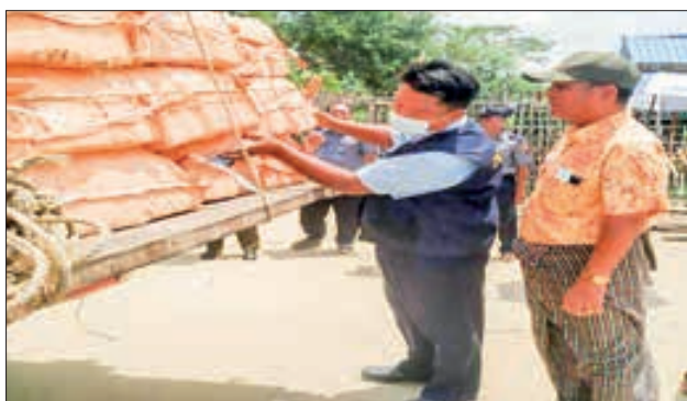
Officials inspect inbound and outbound cargo vehicles for carrying illegal goods at Pantawpyin Outpost in Alethankyaw of Maungtaw on 17 May 2022.

Mann Shwesettaw Pagoda Festival will be held from 25 January to 17 April (1 st Myanmar New Year).—TWA/MKKS