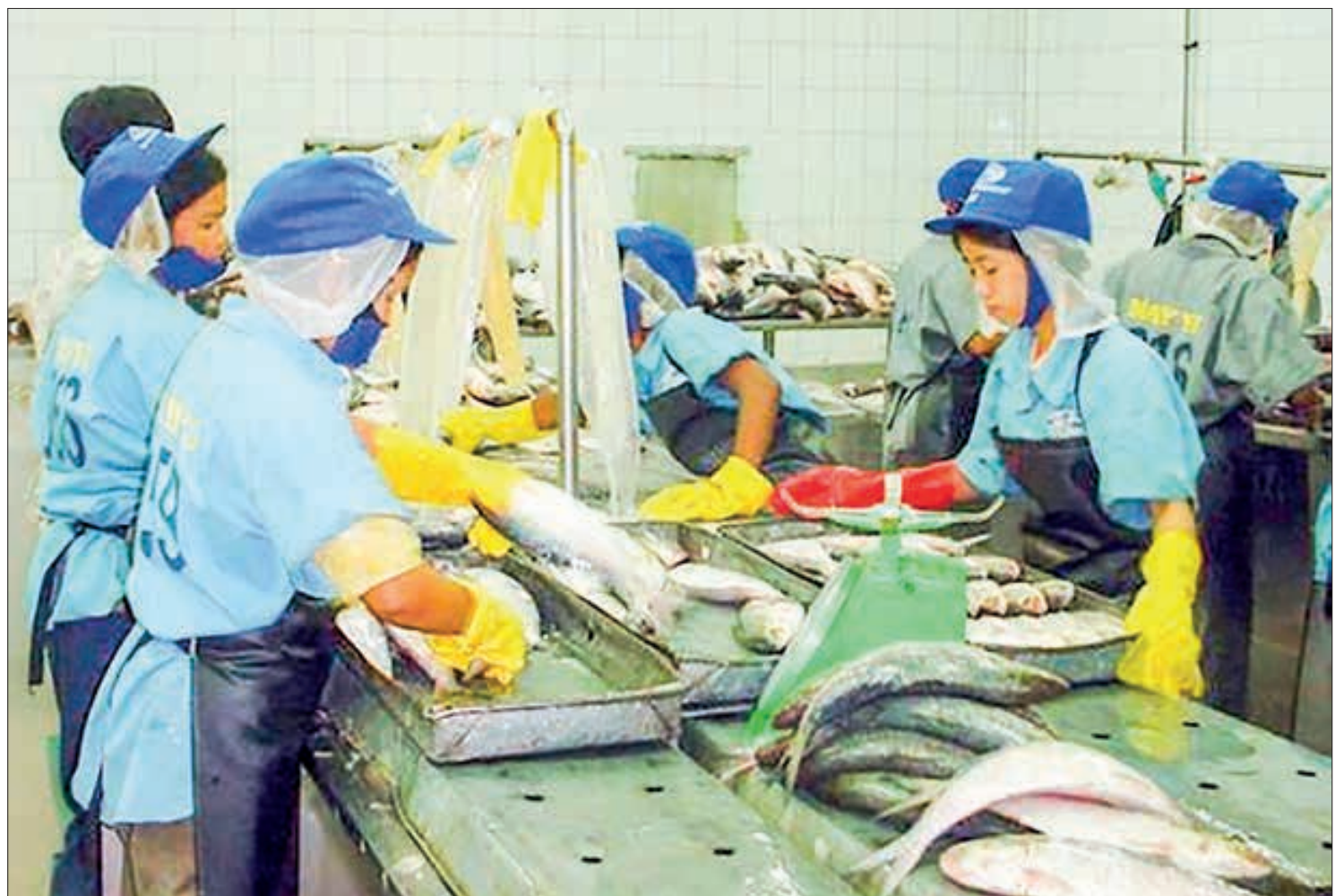
Skilled workers at fish processing to store fish in cold storage.

ACCORDING to the office of the Yangon Region government, 53 invested businesses entering Yangon Region created more than 35,000 job opportunities for local people.