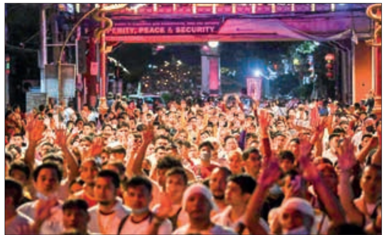
Roman Catholic devotees carrying miniature statues of the Black Nazarene and candles, walk along a street dubbed “walk of faith” as they celebrate the annual feast of the Black Nazarene in Manila on 8 January 2023.

The original wooden statue was brought to the Philippines in the early 1600s when the nation was a Spanish colony. —AFP