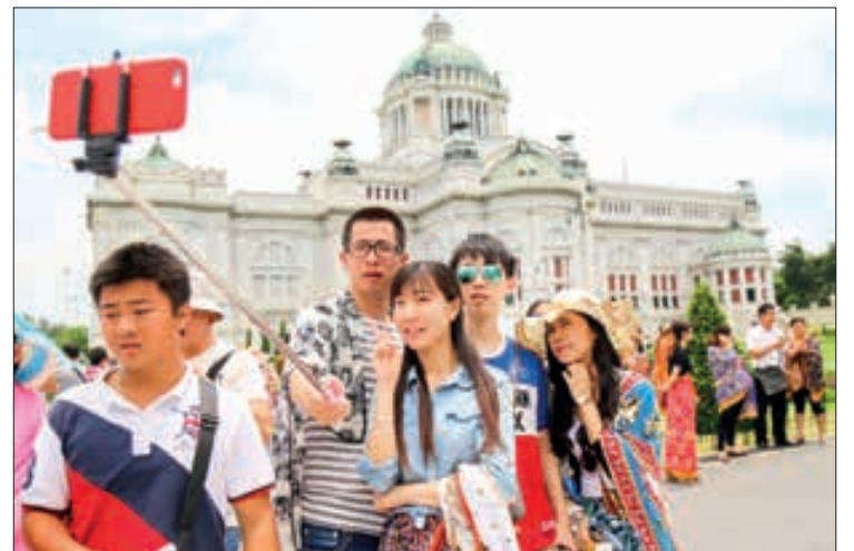
The Thai government expects about 300,000 Chinese tourists to visit Thailand in the first three months of this year.

In addition to tourism, increased economic activities with China are bound to promote trade and investment between the two countries, she said.—Xinhua