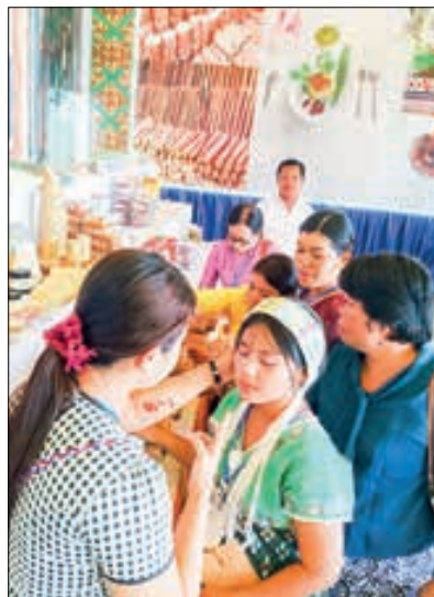
Booth of Sagaing Region.