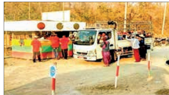
A pilgrimage vehicle paid toll gate fee during pagoda festival of Mann Shwesettaw last year.

A total of 30 buses will be operated during the Buddha Pujaniya festival of Mann Shwesettaw Pagoda to facilitate transportation of pilgrims, according to Minbu District Private Bus Lines Supervisory Committee.