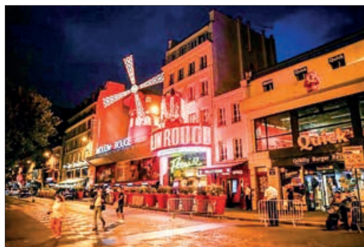
The Moulin Rouge first opened in 1889.

“These aren’t aquatic snakes. What they’re being