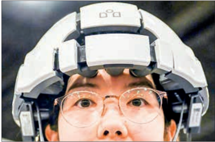
The iSyncWave headset performs brain scans and is touted as being able to diagnose cognitive disorders.

AT the annual CES tech show in Las Vegas, hundreds of start-ups presented products aimed at improving health, education and work, increasing productivity and helping to save the planet.