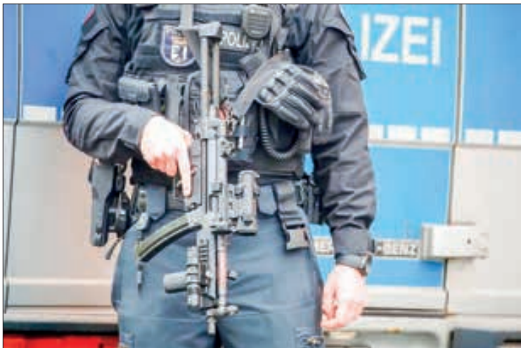
A police officer in Berlin, Germany on 30 April 2020. PHOTO: REPRESENTATIVE IMAGE/ODD ANDERSEN/AFP/FILE

The main suspect will be presented in the coming days to an investigating judge ahead of possible pre-trial detention, they said.—AFP