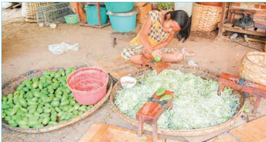
Mango juliennes are being produced to make them as pickled mango products.

Imported mangoes from Thailand are not as good as local mangoes, but since they can survive the whole year, they have an advantage in the market, explained the pickled mango makers.—Ko Kyemon/CT