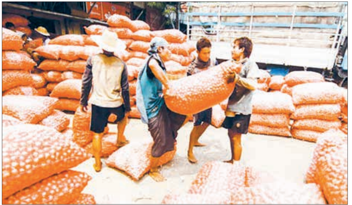
Bags of onions are being unloaded truck at a depot in the Bayintnaung Market.

naung Market before. Nowadays, brokerage house owners evaluate their opening price by monitoring the market price in other regions as well.—TWA/CT