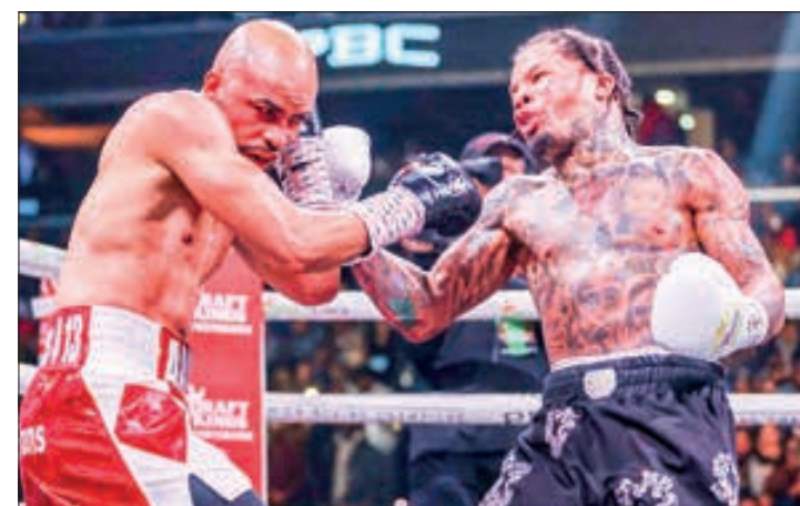
Gervonta Davis punches Hector Luis Garcia in their WBA World Lightweight Championship bout at Capital One Arena on 7 January 2023 in Washington, DC.

champion. Unbeaten Haney also holds the WBC, IBF and WBO belts, which he defended with a dominant victory over Australian George Kambosos in Melbourne in October. Saturday's bout at the Capital One arena in Washington saw Dominican Garcia push Davis in the early going. But Davis began to assert himself in the middle rounds.—AFP