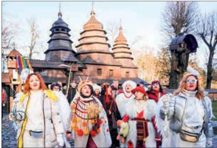
People dressed in traditional costumes singing Christmas carols. Members of the Christmas den carol take part in the Orthodox celebration of Christmas.

The Russian defence ministry insisted its forces were observing the unilateral ceasefire, which ended at 11:00 pm in Kyiv (2100 GMT). But they also said they had repelled attacks in eastern Ukraine and killed dozens of Ukrainian soldiers Friday.