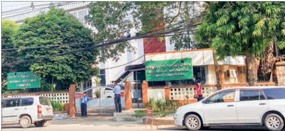
The Directorate of Investment and Company Administration manages flow of foreign investment and Myanmar citizen investment into Myanmar.

Singapore is the top source of FDI this FY, with 14 Singapore-listed enterprises pumping FDI of US$1.154 billion into Myanmar. Hong Kong SAR stands as the second largest investor this FY with an estimated capital of over $165 million drawn from