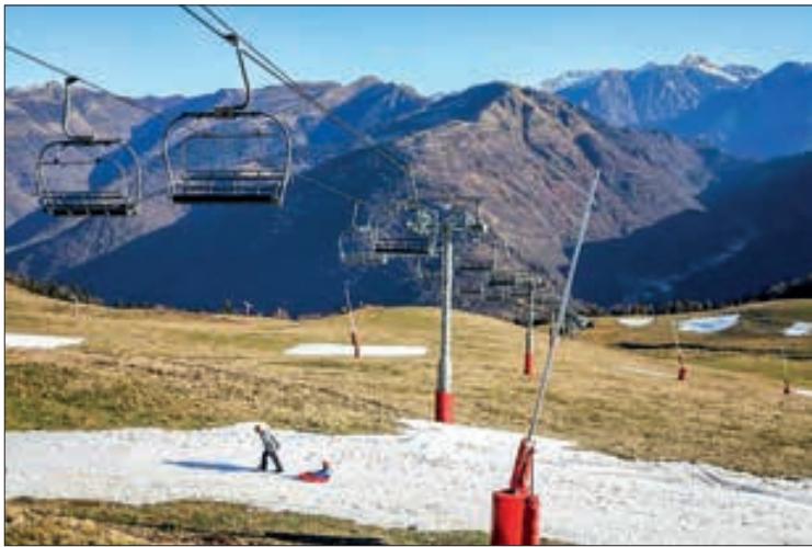
Near-bare slopes at the Luchon-Superbagnères ski resort in southwestern France on 5 January 2023.

FRANCE experienced its hottest average temperature and lowest levels of rainfall on re-