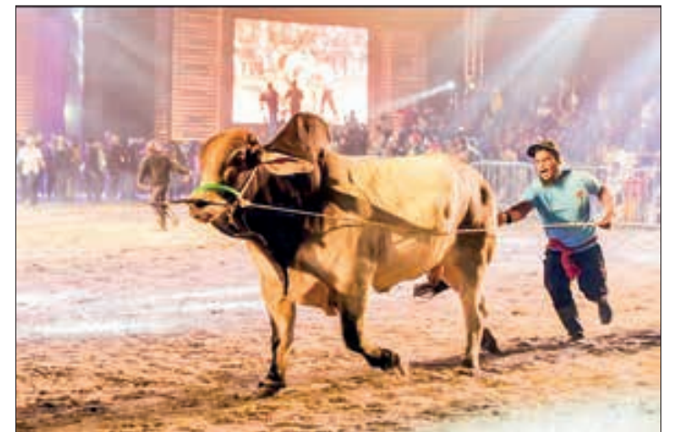
Farmers present a bull at "Dhaka Cattle Expo 2023" in Bangladeshi capital Dhaka on 6 January 2023.

The organizers said the exhibition aimed at enhancing the knowledge of farms and farmers, and skills by adopting modern techniques for value addition, which in turn will contribute to the country's national GDP or gross domestic product.—Xinhua