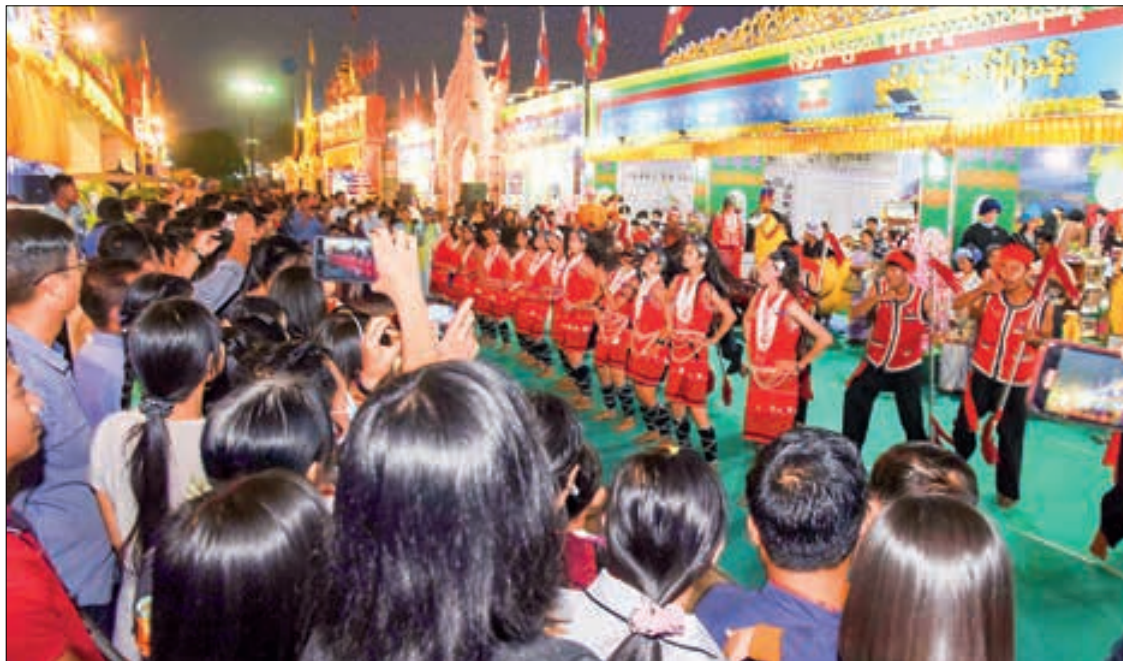
Visitors enjoy traditional dance of ethnic cultural troupes at commemorative booths, traditional foodstuff booths and decorated floats in Nay Pyi Taw on 8 January.

Visitors enjoyed songs and music presented by relevant ethnic cultural troupes and martial arts presentation in front of the decorated floats representing regions and states.