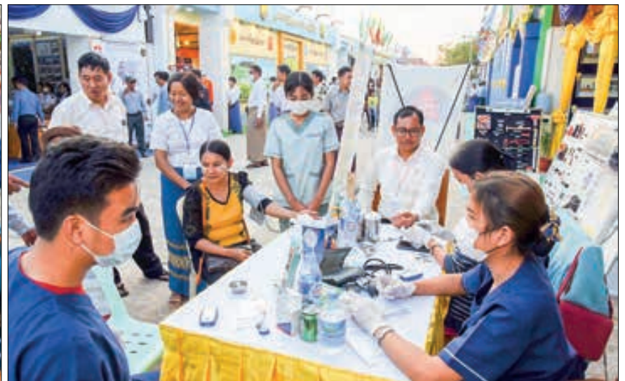
Medical team provide healthcare to visitors.