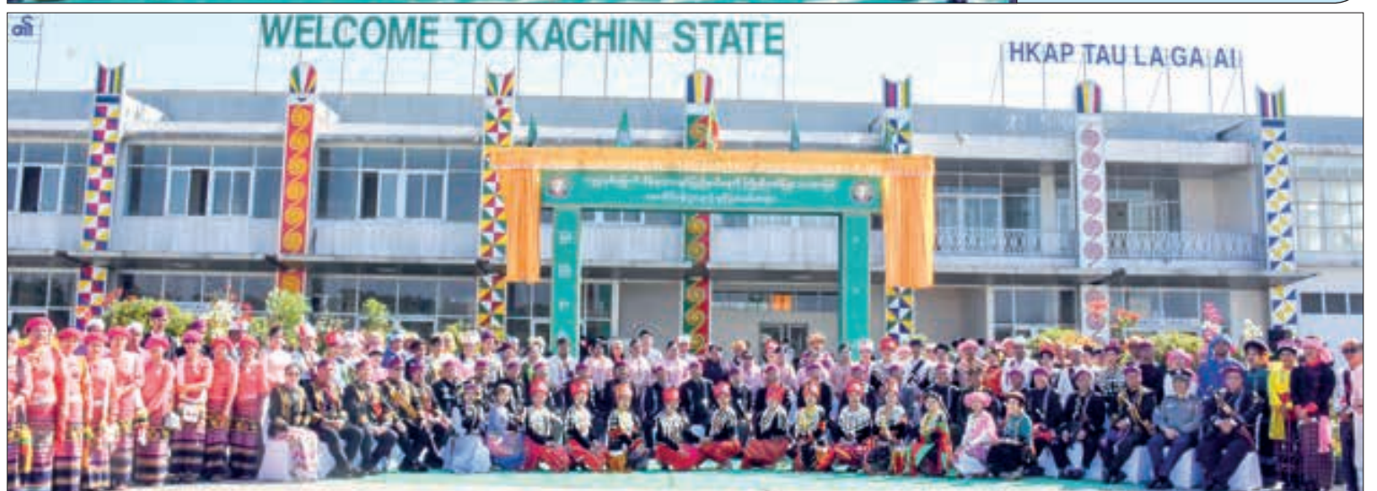
SAC members, Union ministers and officials pose for documentary photo together with ethnic national people at opening of airport park on 8 January.

The opening of Airport Park in progress in Myitkyina on 8 January.