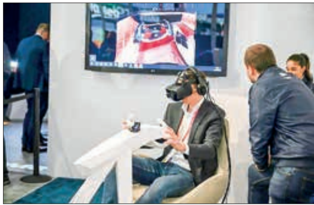
French company Valeo demonstrates the use of a virtual reality headset at the 2023 CES technology show in Las Vegas, Nevada.

One gadget on display in Las Vegas is an in-car television system, developed by French parts maker Valeo, that needs no remote. To change the channel, drivers or passengers wearing a headset make a simple swipe in