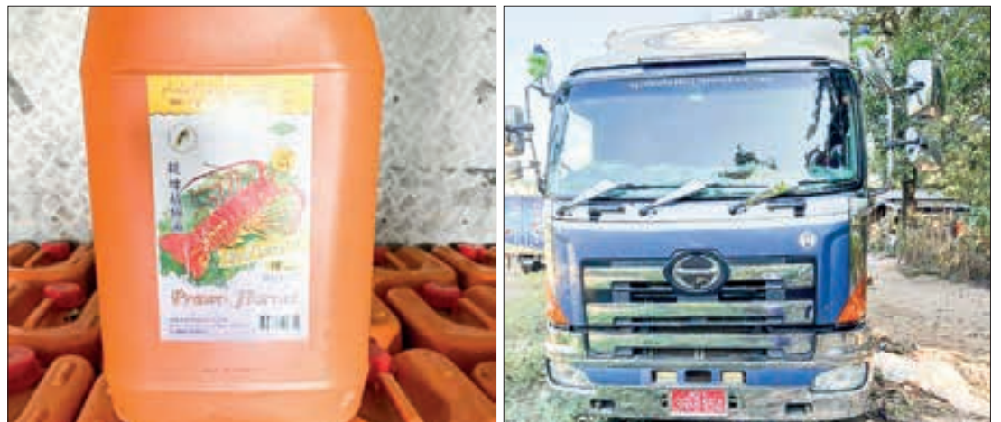
Container of RBD Palm Olein labelling Prawn Hornet seized in Bago Region with truck on 6 January.

THE on-duty teams under the supervision of the Customs Department conducted inspections on 6 January.