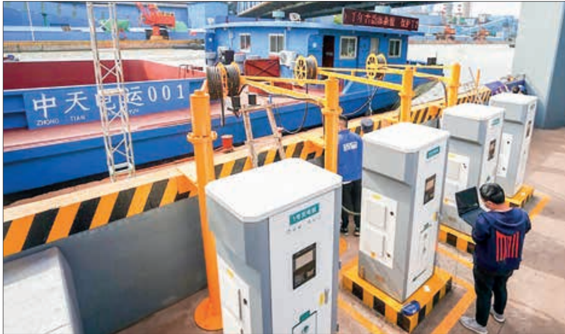
A worker prepares charging piles for the electric cargo ship "Zhongtiandianyun 001" in Changzhou, east China's Jiangsu Province, 7 May 2020.

As a major measure to better protect the Yangtze River's ecosystems and promote eco-friendly shipping, more and more transportation ships are encouraged to use shore electricity while at the dock. Over the years, more than 10,000 transportation vessels