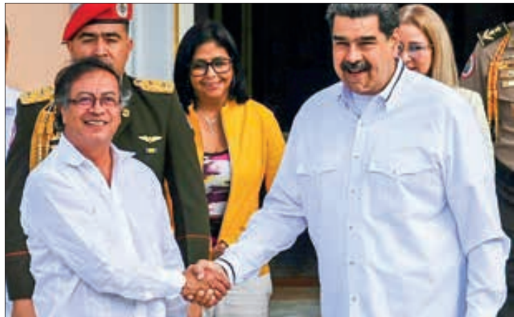
Venezuelan President Nicolas Maduro (R) and his Colombian counterpart Gustavo Petro (L) met in Caracas on 7 January 2023.

COLOMBIA’S President Gustavo Petro made a surprise trip to meet his Venezuelan counterpart Nicolas Maduro on Saturday — their second face-to-face after the thawing of a years-long diplomatic freeze.