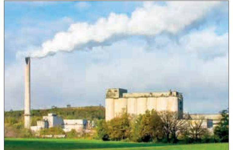
Industrial smokestacks directly emit particle pollution, but they also emit sulfur dioxide and nitrogen oxides, which react in the atmosphere to form fine particle pollution.

“This proposal will help ensure that all communities, especially the most vulnerable among us, are protected from exposure to harmful pollution.”—AFP