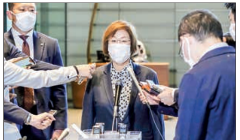
Japanese Education, Culture, Sports, Science and Technology Minister Keiko Nagaoka speaks to reporters following a meeting with Prime Minister Fumio Kishida, in Tokyo, Japan, on 17 October 2022. Kishida instructed Nagaoka to launch an investigation into the Unification Church, a religious group that has come under the spotlight in Japan for its links with the ruling party and the huge donations it has encouraged followers to make.

Following his arrest, Yamagami told investigators that he held a grudge against the Unification Church over donations made by his mother