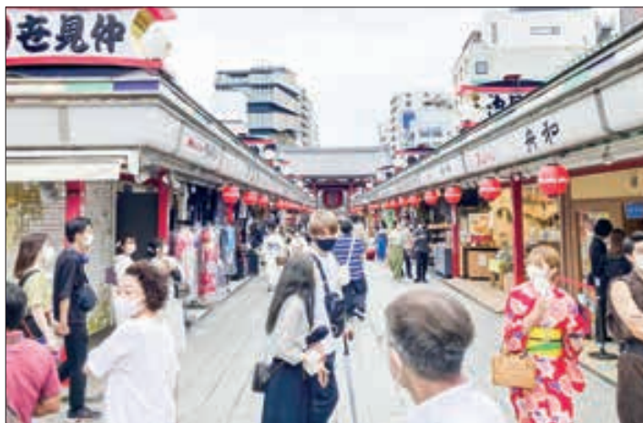
People wearing protective face masks are seen at Asakusa district in Tokyo, Japan on 25 March 2022.

After the number since Japan confirmed its first domestic case of COVID-19 in January 2020 eclipsed the 20,000 mark last February, 10,000 deaths were reported every three months until December, according to the Kyodo