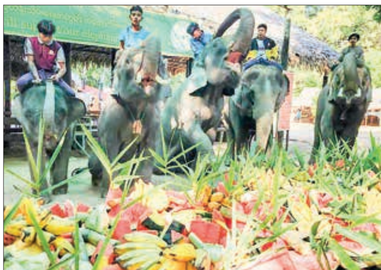
Elephants from Palin Kanthayar elephant camp are fed with buffets feedstuff.

OFFICIALS from the Palin Kanthayar Elephant Camp on the bank of the Ayeyawady River near NyaungU Township, Mandalay Region, said that elephant lovers from all over Myanmar have been contacting them online to give feed feedstuff buffets to the elephants during the Covid-19 pandemic.