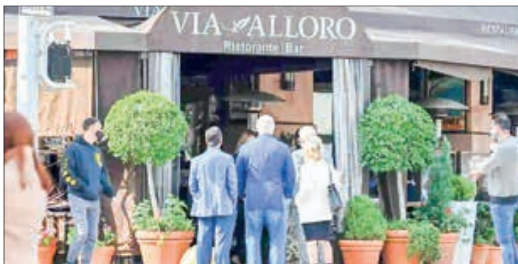
US services sector contracted for the first time in more than two years in December, survey data showed on Friday, as business activity slumped.

The ISM services index "ended a 30-month period of