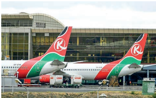
Kenya Airways was hit by a pilots' strike in November.

"The extension of suspension seeks to enable the company (to) complete its operational and corporate restructuring process," the Nairobi Securities Exchange said in a statement.—AFP