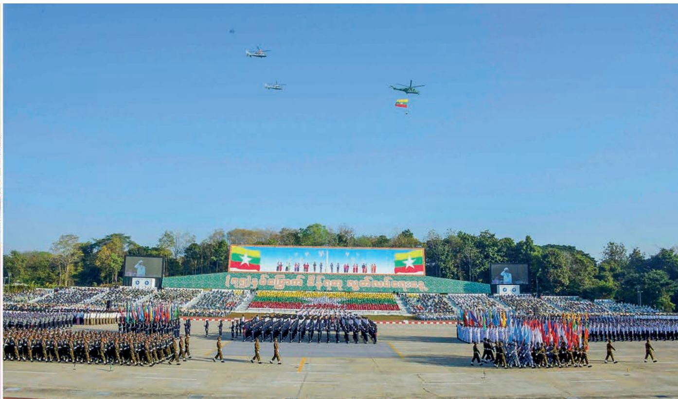
State Administration Council Chairman Prime Minister Senior General Thadoe Maha Thray Sithu Thadoe Thiri Thudhamma Min Aung Hlaing returns the salute of the parade troops at the Nay Pyi Taw grand military review square on 4 January 2023.