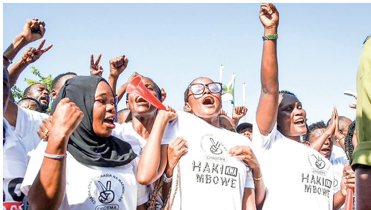
On this 18 February 2022 photo, supporters reacts as Tanzania’s main opposition Chadema party chairman Freeman Mbowe (not in picture) who was arrested on 21 July 2021.

TANZANIA’S president on Tuesday lifted a ban on opposition rallies imposed in 2016 by her strongman predecessor, in an overture to political rivals seeking the restoration of democratic traditions.