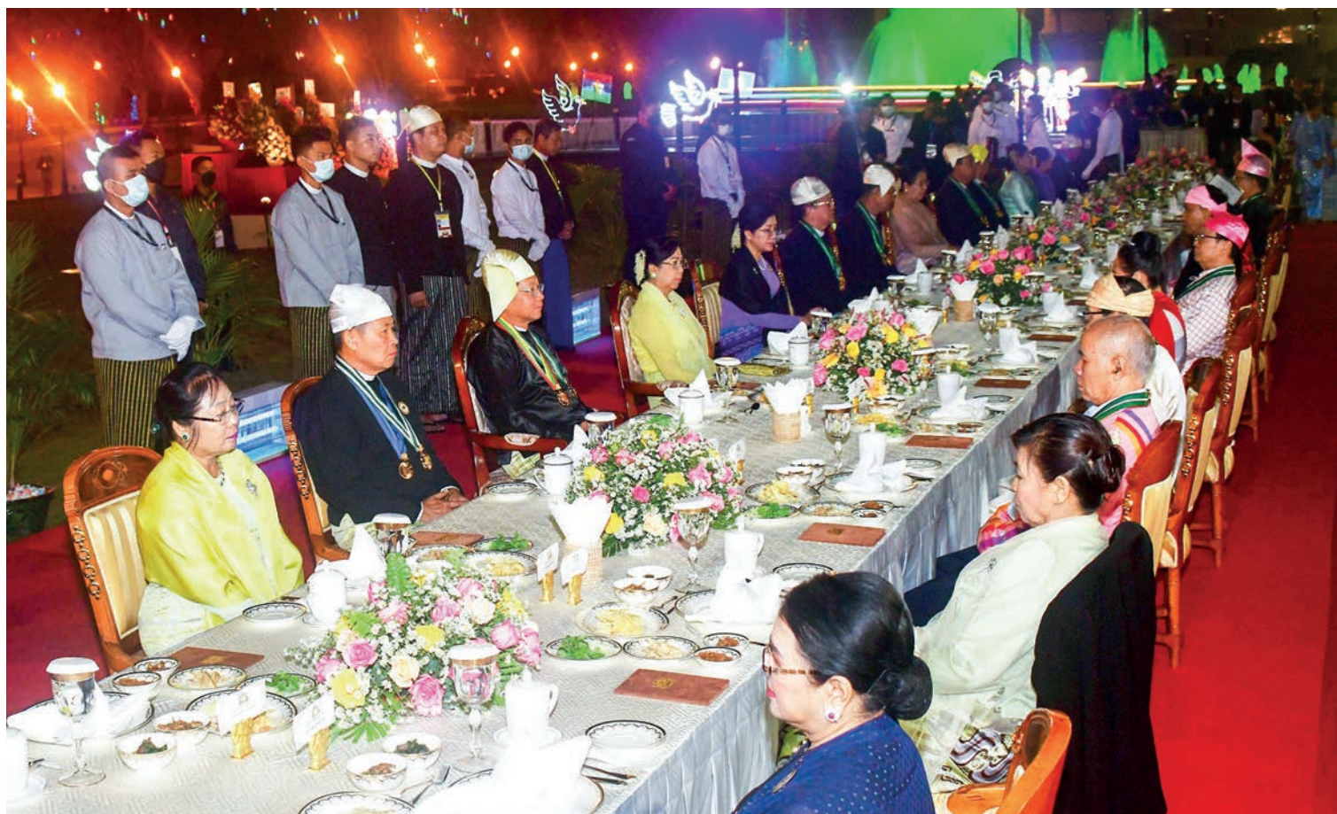
The Senior General and dignitaries attend the honorary dinner yesterday.

The dinner was attended by the Senior General and wife, the Vice-Senior General and wife, the SAC Secretary, the SAC Joint Secretary, council members and their wives, Vice-President (Retd) Thray Sithu Dr Sai Mauk Kham and his wife, Vice-President (Retd) Thray Sithu U Nyan Tun and wife, families of heads of state who had served State duties in successive eras, senior military officers, Union ministers, officials, ambassadors and charges d'affaires of foreign embassies, honorary consuls, representatives from NCA signatory ethnic armed organizations and NCA non-signatories and guests. — MNA/TTA