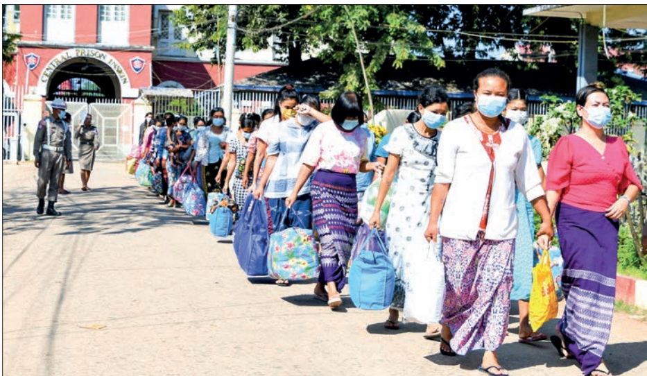
A total of 1,400 males and females including foreigners from Insein Gaol.

A total of 7,012 males and females are pardoned and released from their respective prisons, jails and camps as well as prison sentences are remitted under the SAC Order Nos 1 and 2.