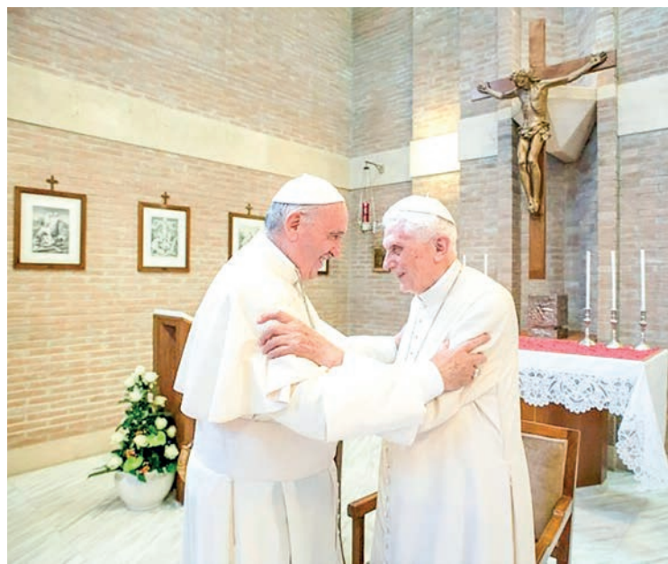
Despite the complications posed by the presence of a living ex-pope at the Vatican, Francis succeeded in carrying out reforms.

His contribution to a book in January 2020 on celibacy was viewed as a bid to boost the cause of the Church's ultra-conservative wing.—AFP