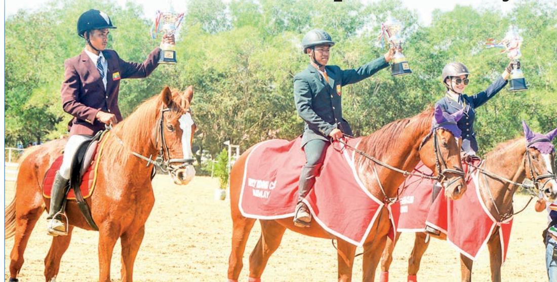
Winners of the Equestrian competition hold their trophies as a celebration of their victories.

and committee members presented individual medals, cash awards and trophies to the winner of Myanmar traditional