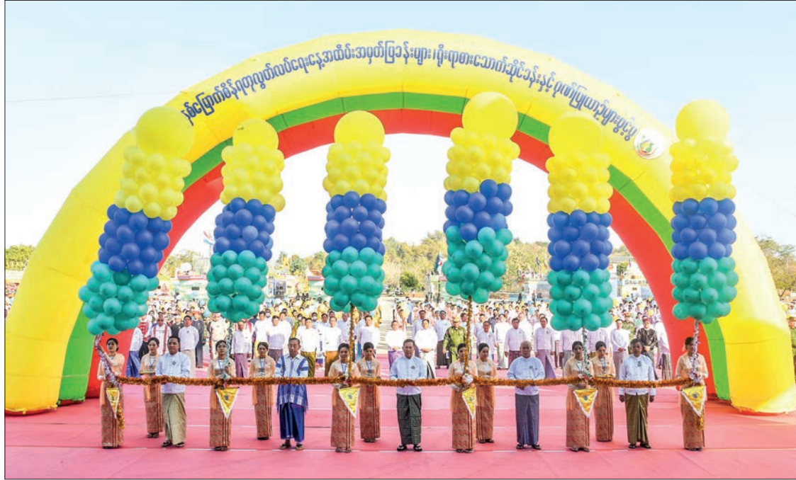
The Vice-Senior General and dignitaries unveil the exhibitions, traditional food booths and decorated floats at Tabaung Ground in Nay Pyi Taw yesterday.