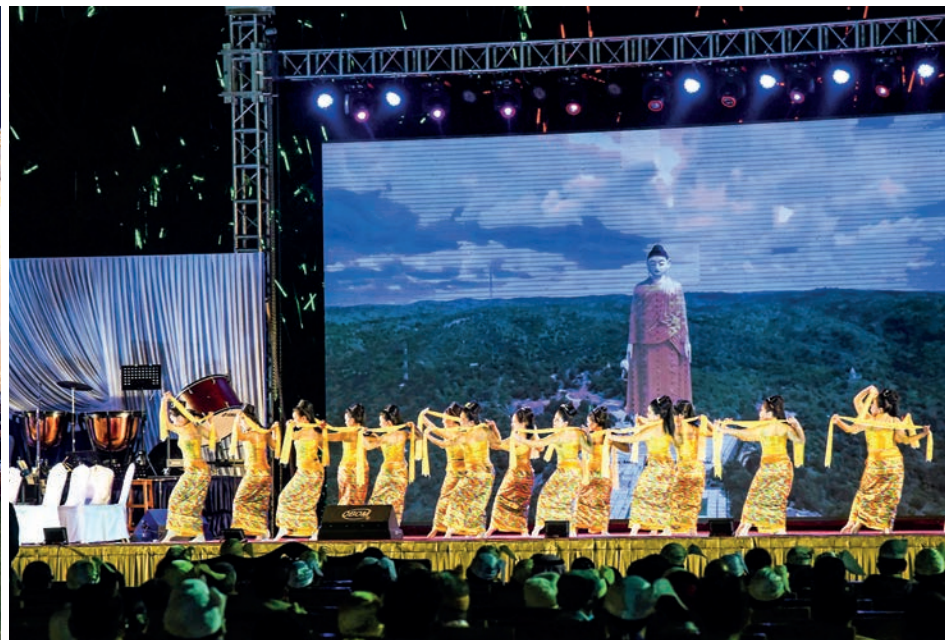
The Senior General and dignitaries watch the song and dance entertainment at the honorary dinner in Nay Pyi Taw yesterday.