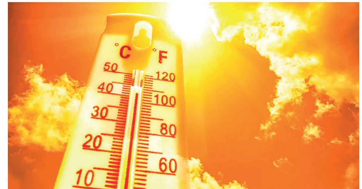
A rising number of studies indicate that the climate may have an effect on how Covid-19 spreads.