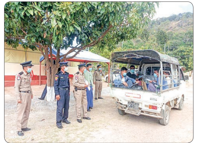
From Taunggyi Prison.