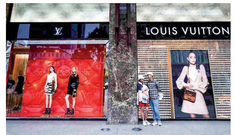
Conspicuous by its absence from the list is the LVMH luxury conglomerate, the parent company of brands including fashion house Louis Vuitton and champagne producer Moët.

In late 2021, the company paid a fine of 10 million euros ($10.5 million at current exchange rates) fine to settle claims it hired Squarcini to spy on private citizens.—AFP