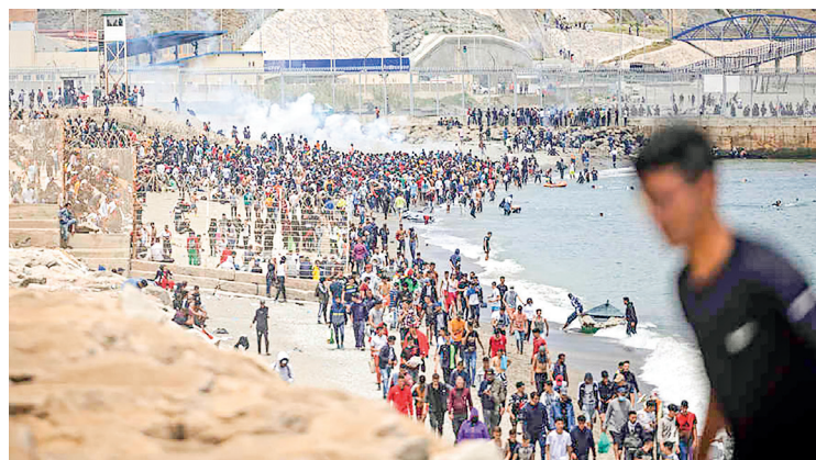
Spanish police try to disperse migrants at a border between Morocco and the Spanish enclave of Ceuta. PHOTO: AFP

The Atlantic route from West Africa to the Canary Islands had been increasingly used by migrant smugglers since the end of 2019 after safer routes to Europe in the Mediterranean were closed.—AFP