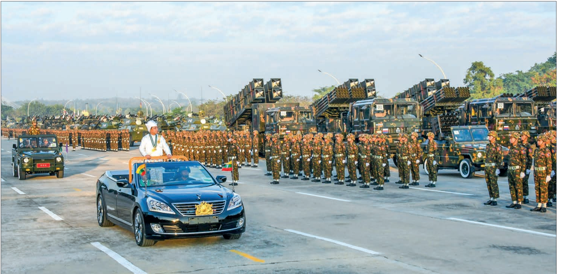
State Administration Council Chairman Prime Minister Senior General Thadoe Maha Thray Sithu Thadoe Thiri Thudhamma Min Aung Hlaing inspects the parade battalions, decorated floats and mechanized companies of the Tatmadaw and the Ministry of Home Affairs in a motorcade at the Nay Pyi Taw grand military review square on 4 January 2023.