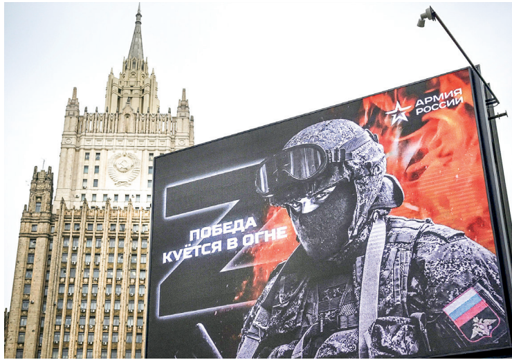
A billboard emblazoned with the letter Z (the tactical insignia of Russian troops attacking Ukraine) and reading “Victory is being Forged in Fire” is pictured in central Moscow on 13 Oct.

Putin ordered the defence ministry to render assistance to Russian filmmakers who will produce documentaries dedicat-