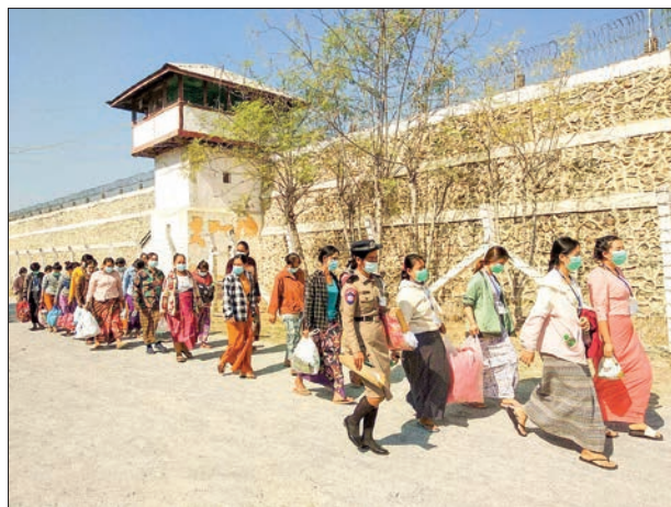
From Mandalay Prison.