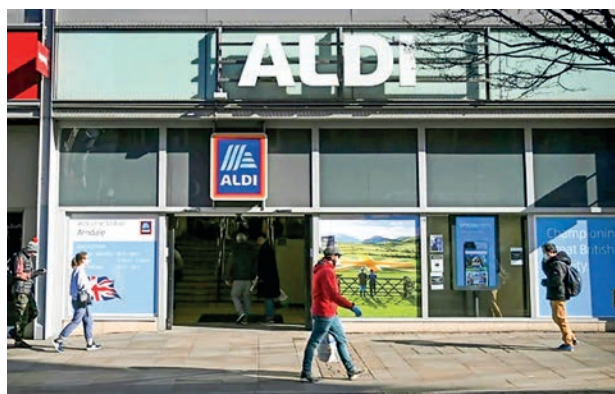
German discount supermarket chain Aldi enjoyed record UK sales during the Christmas trading period, it announced Tuesday, as the country struggles with soaring prices.

GERMAN discount supermarket chain Aldi enjoyed record UK sales during the Christmas trading period, it announced Tuesday, as the country struggles with soaring prices.