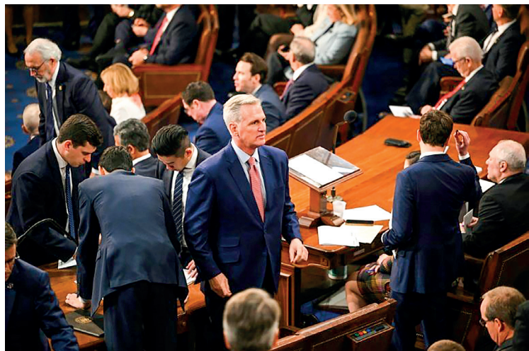
Republican Kevin McCarthy needed to keep his party's moderates united behind him while getting opponents on the right on his side.

THE US House of Representatives adjourned on Tuesday evening after its members failed to elect a speaker for the lower chamber. US Congressman Kevin McCarthy, a Republican from California, failed to secure enough votes in three ballots earlier in the day after a group