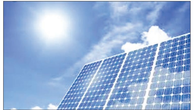
A solar panel.

By the aeration process, bacteria and micro-organisms in the leachate can be reduced and water pollution can be prevented