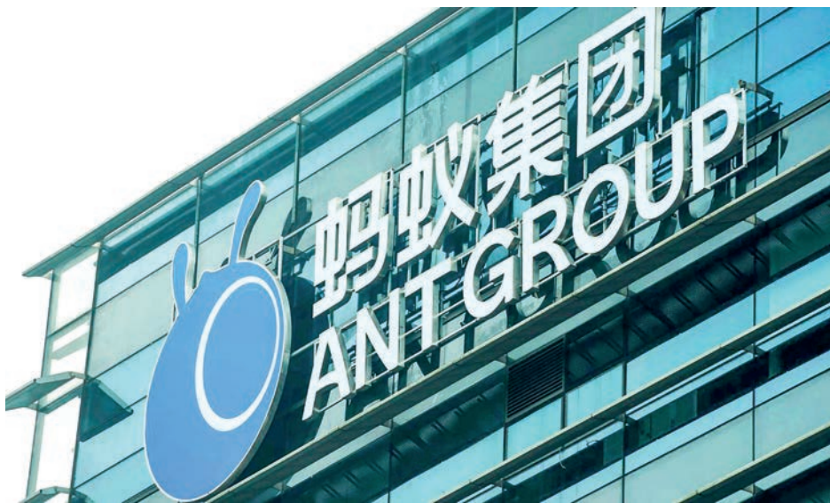
After the deal goes through, Ant — in which ecommerce titan Alibaba has a stake — will have contributed a total of 9.25 billion yuan and control half of its shares.

A unit owned by the eastern city of Hangzhou will become the sec-