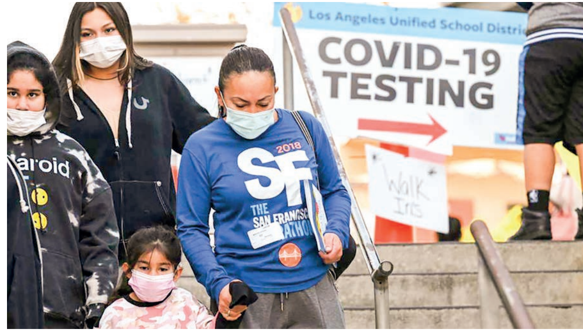
A family leaves a Covid-19 testing and vaccination site at a public school in Los Angeles, California, 5 January 2022.

"A lot of the benefits of vaccines to reduce infectiousness were from people who had re-