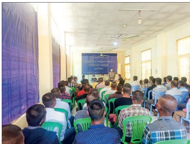
From Nay Pyi Taw Council Area.